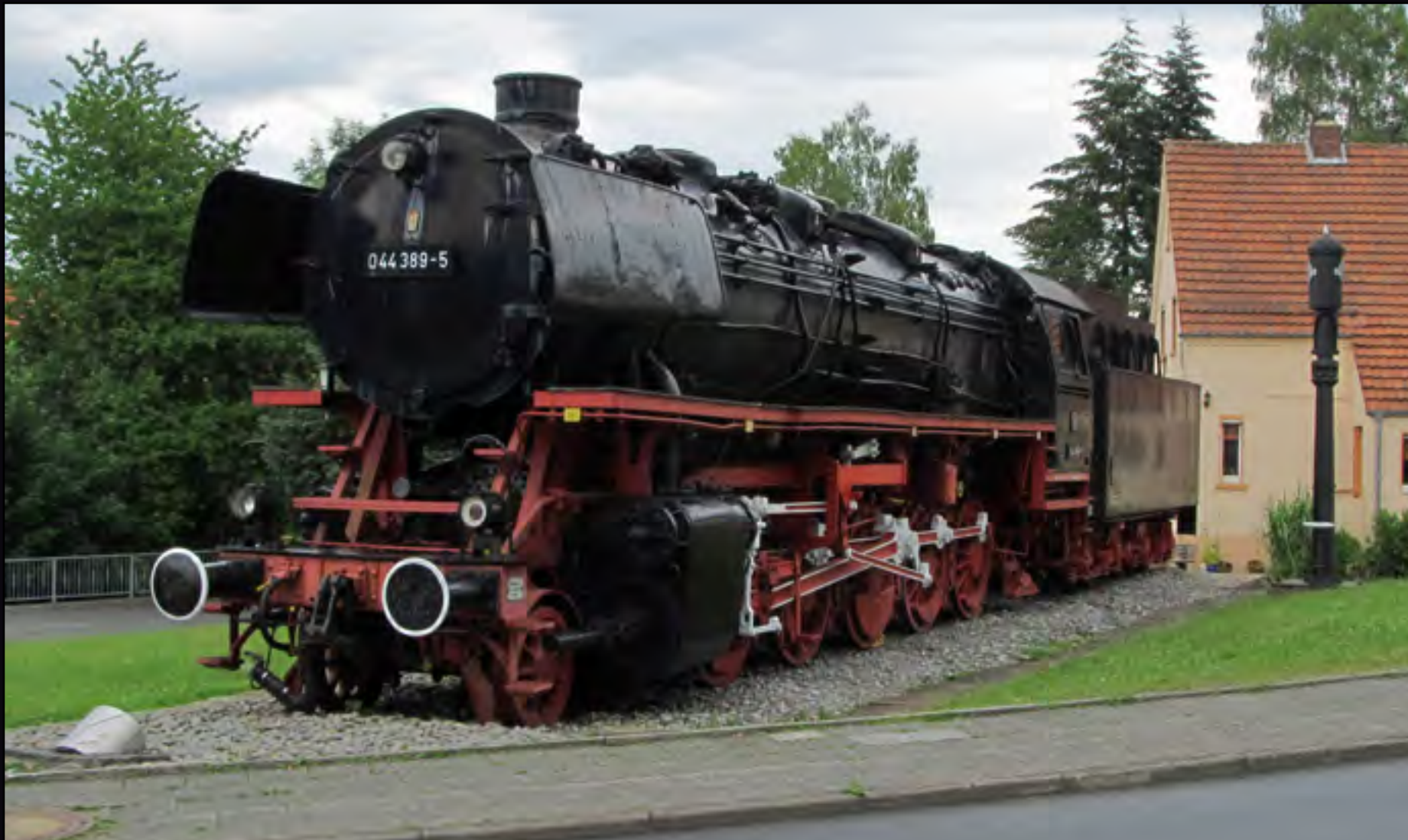
DR 044.389-5 is seen plinthed at Altenbeken on June 15th.