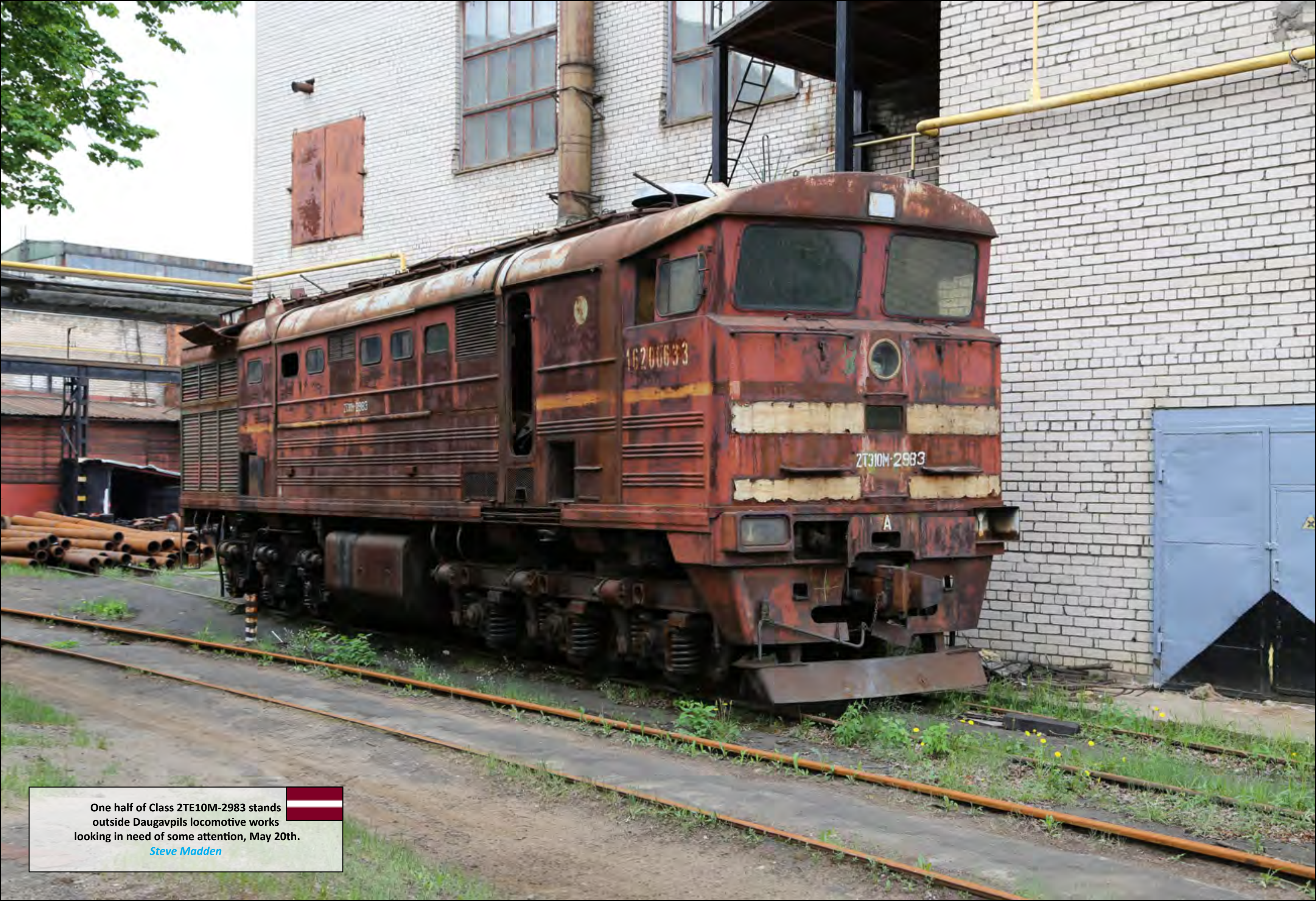
One half of Class 2TE10M-2983 stands outside Daugavpils locomotive works looking in need of some attention, May 20th.