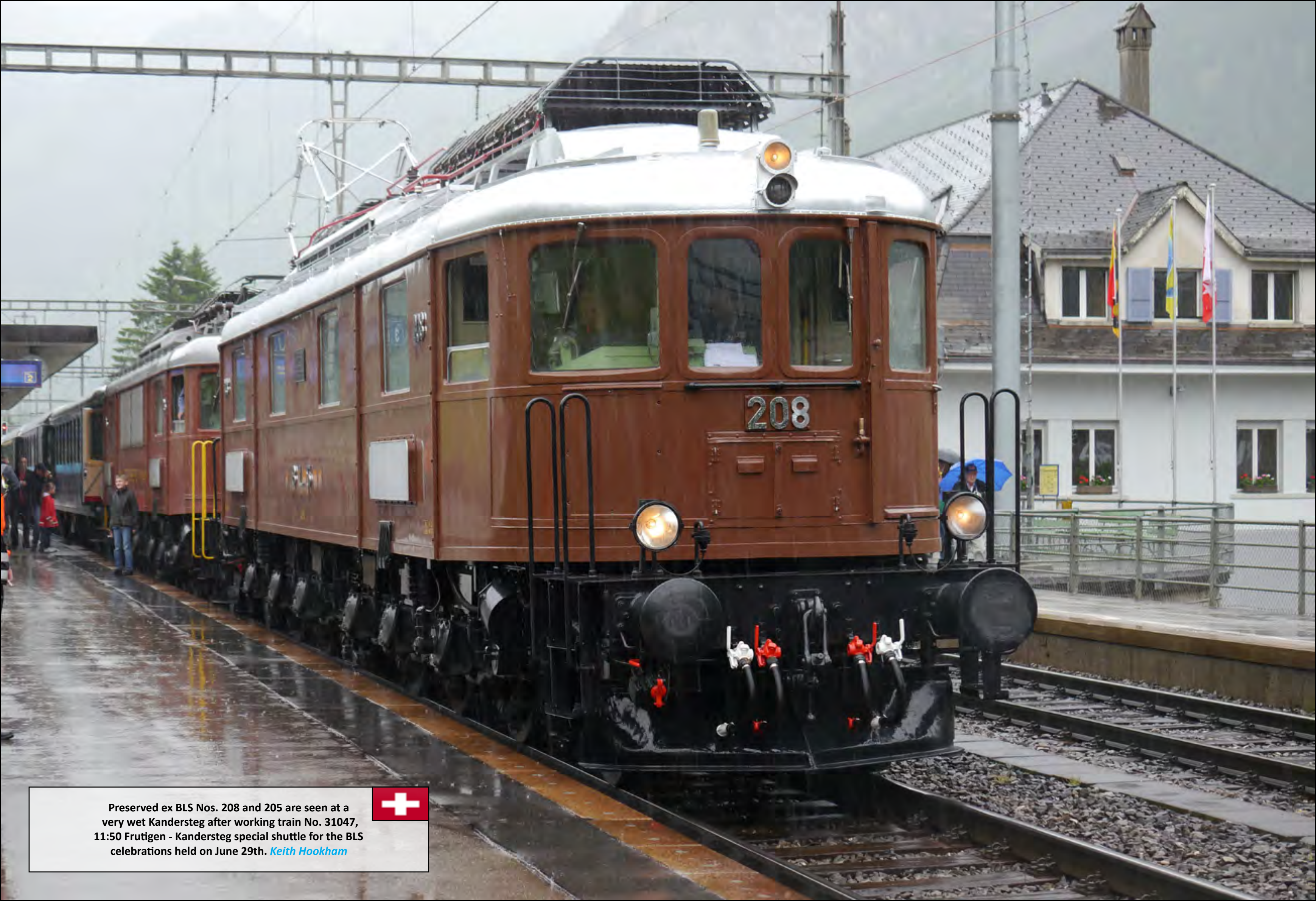
Preserved ex BLS Nos. 208 and 205 are seen at a very wet Kandersteg after working train No. 31047, 11:50 Frutigen - Kandersteg special shuttle for the BLS celebrations held on June 29th. Keith Hookham