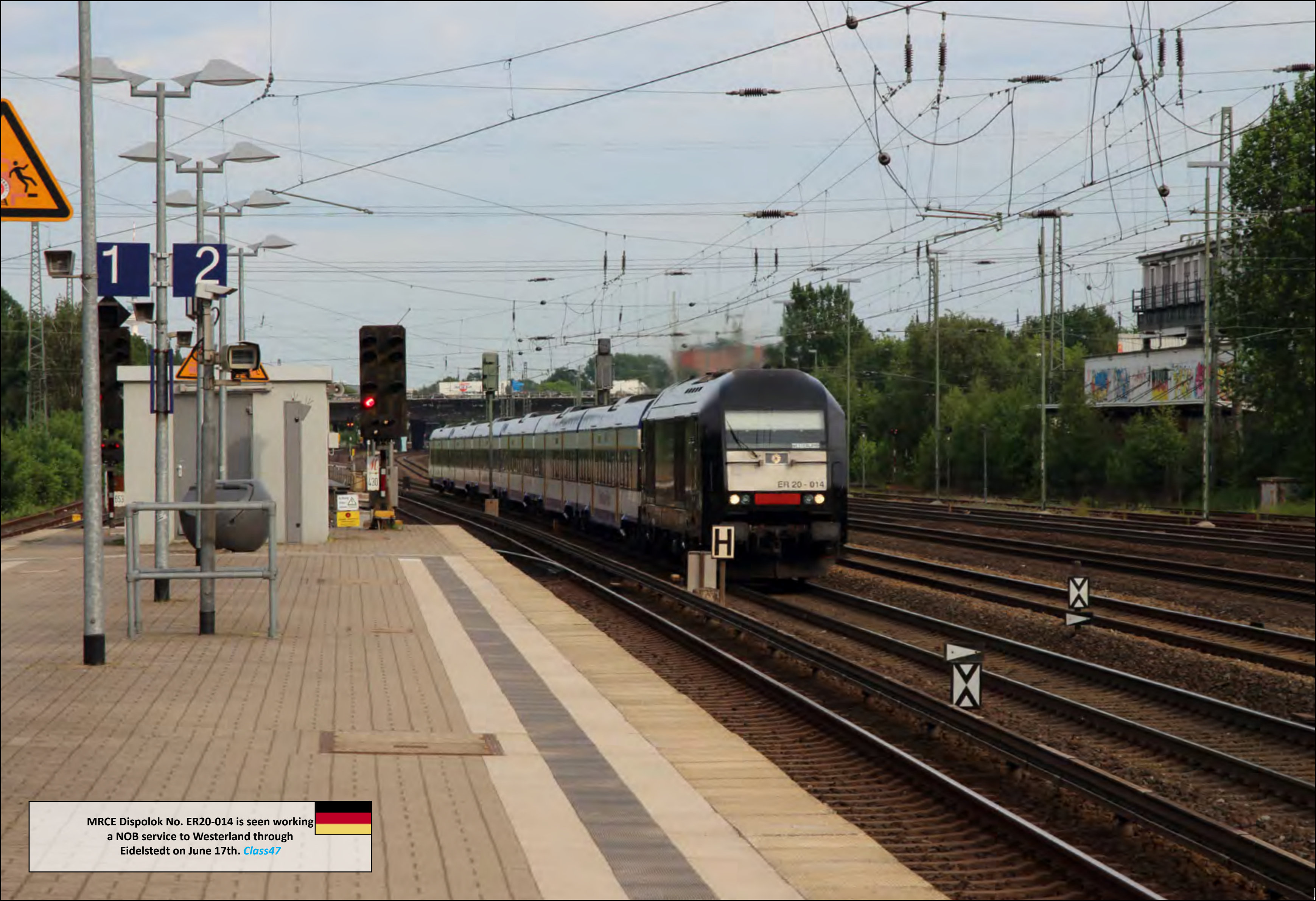
MRCE Dispolok No. ER20-014 is seen working a NOB service to Westerland through Eidelstedt on June 17th. Class47