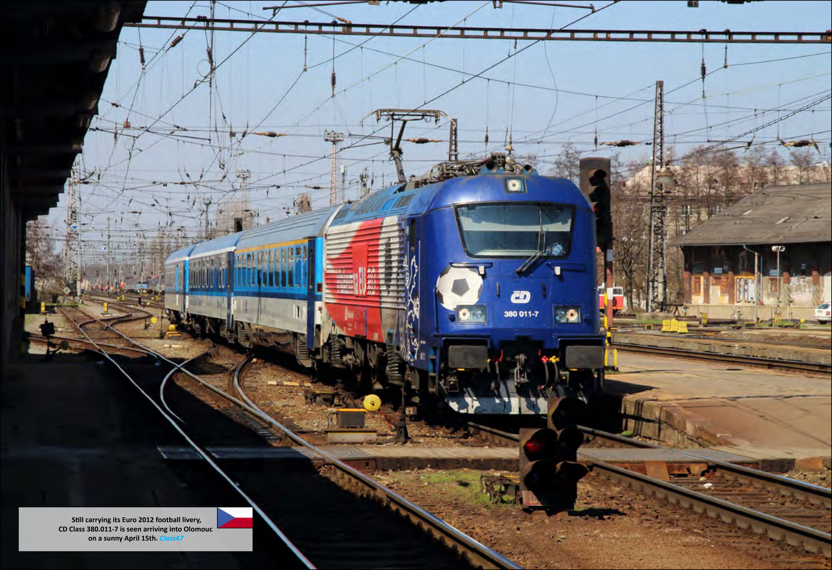
Still carrying its Euro 2012 football livery, CD Class 380.011-7 is seen arriving into Olomouc on a sunny April 15th.