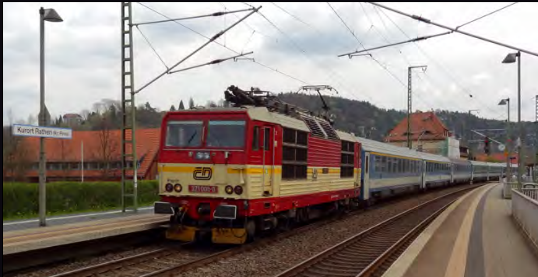
Ceske Drahy's Class 371.005 passes Kurort Rathen with EC174 Budapest to Hamburg. Steamsounds