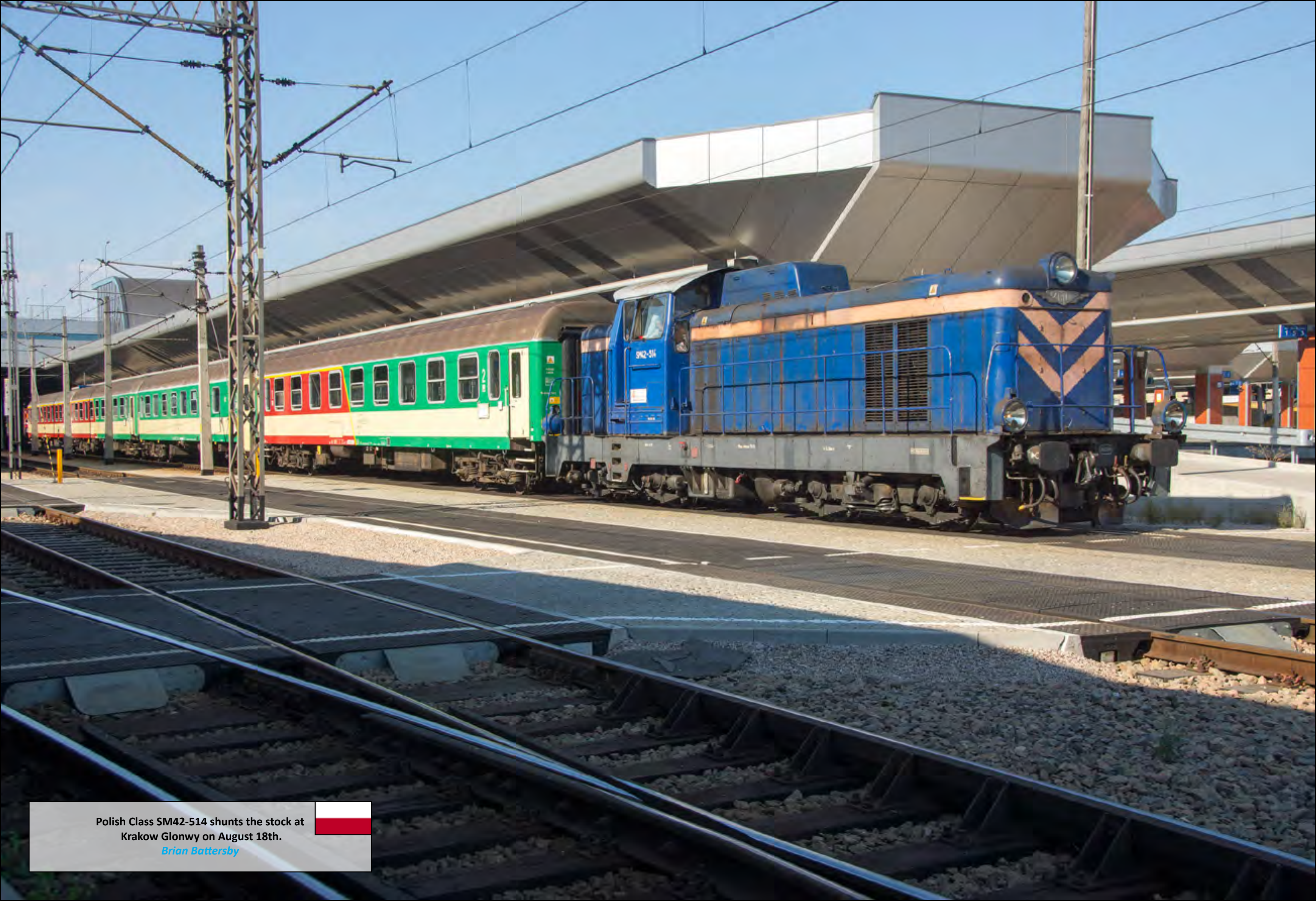
Polish Class SM42-514 shunts the stock at Krakow Glonwy on August 18th.