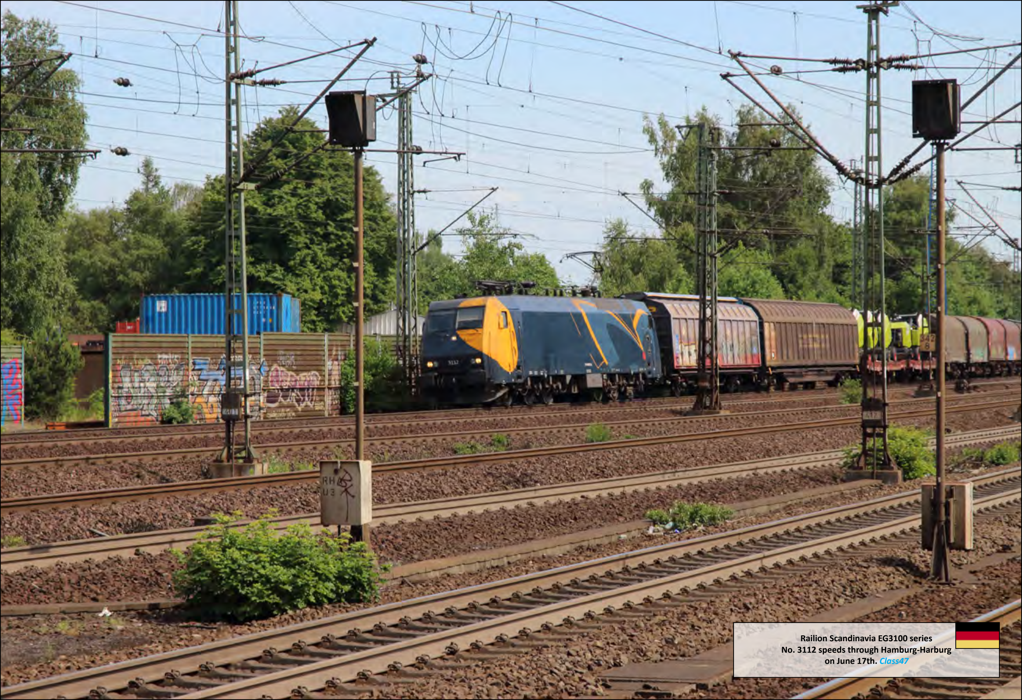
Railion Scandinavia EG3100 series No. 3112 speeds through Hamburg-Harburg on June 17th. Class47