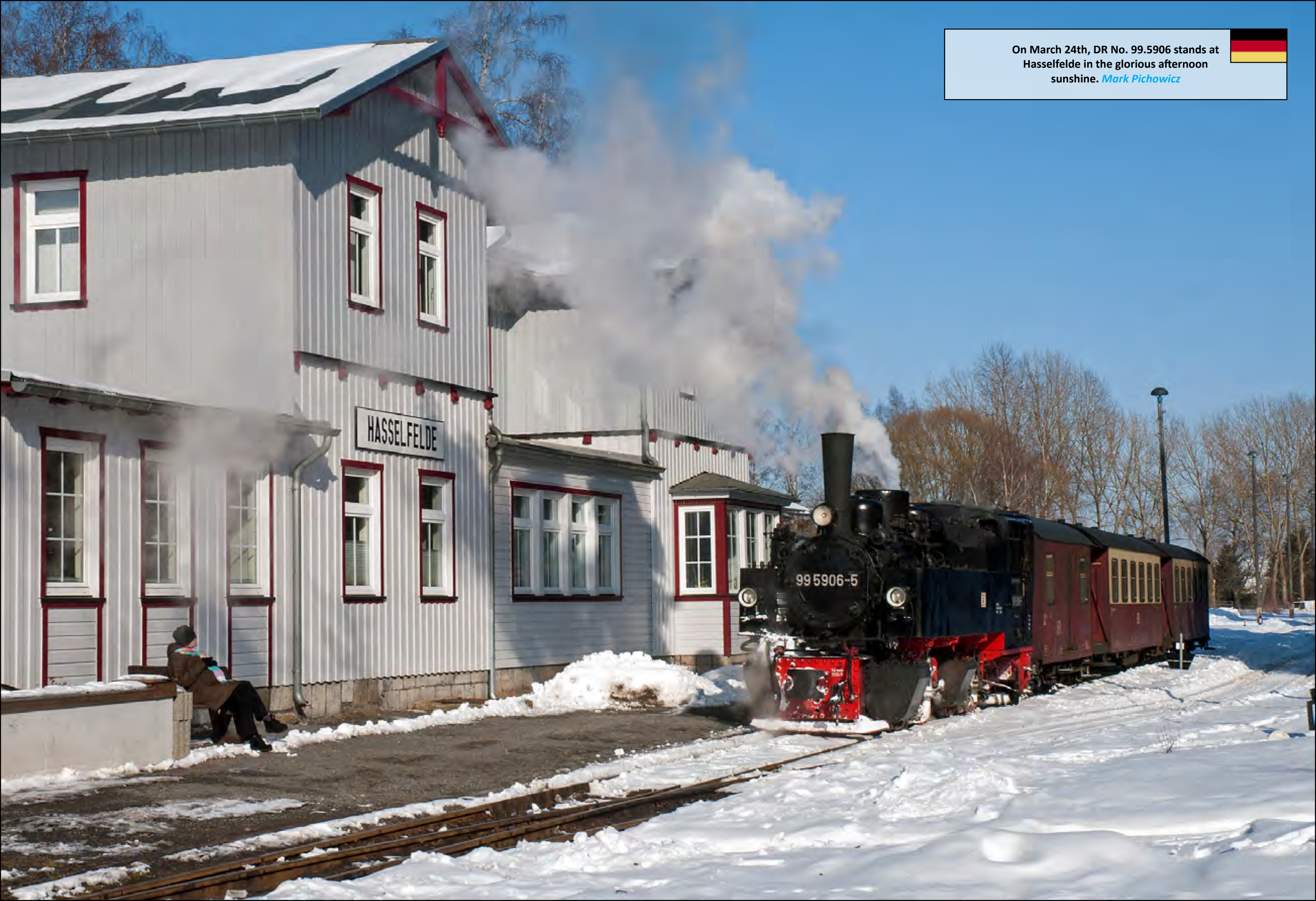
On March 24th, DR No. 99.5906 stands at Hasselfelde in the glorious afternoon sunshine.