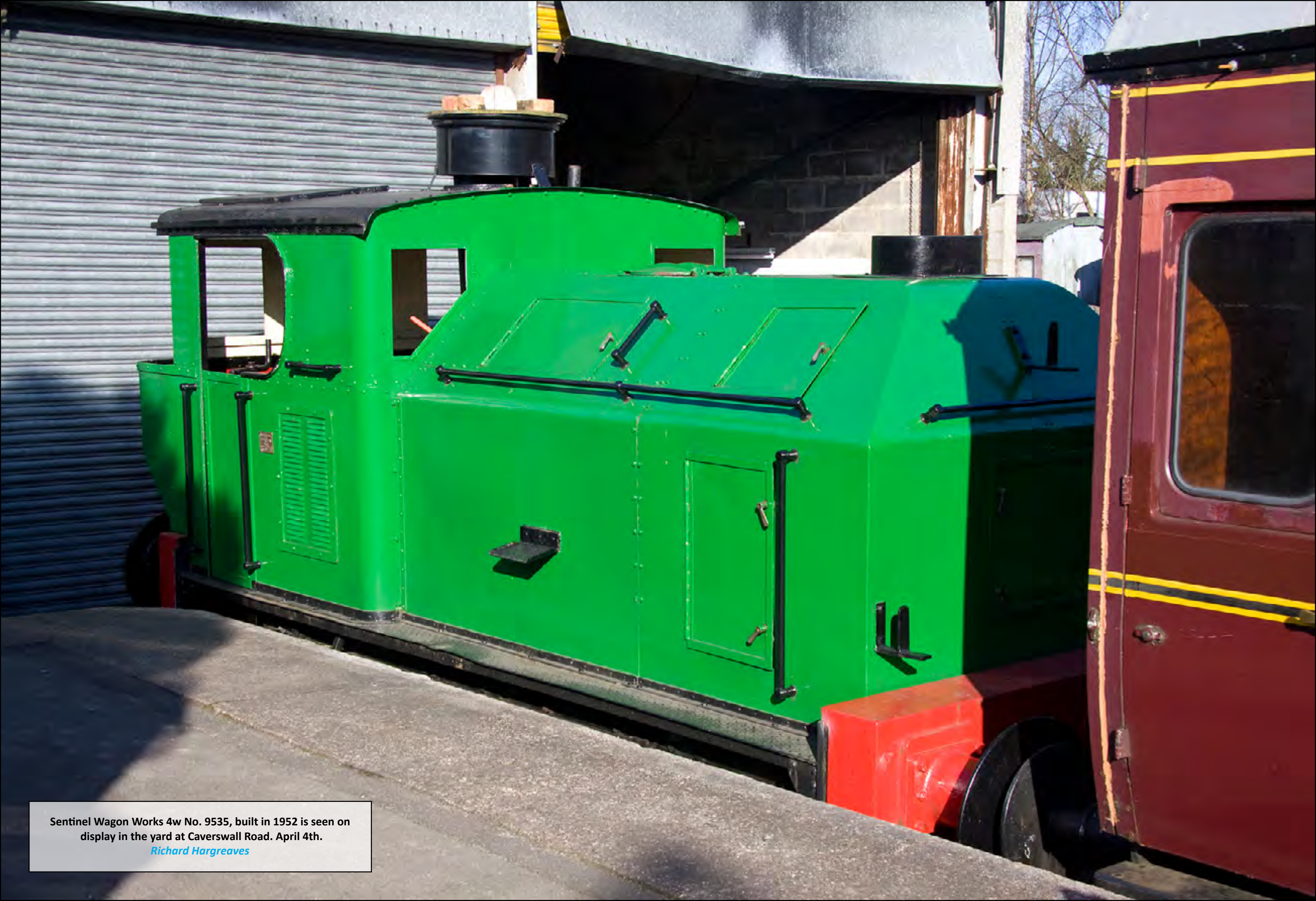
Sentinel Wagon Works 4w No. 9535, built in 1952 is seen on display in the yard at Caverswall Road. April 4th.