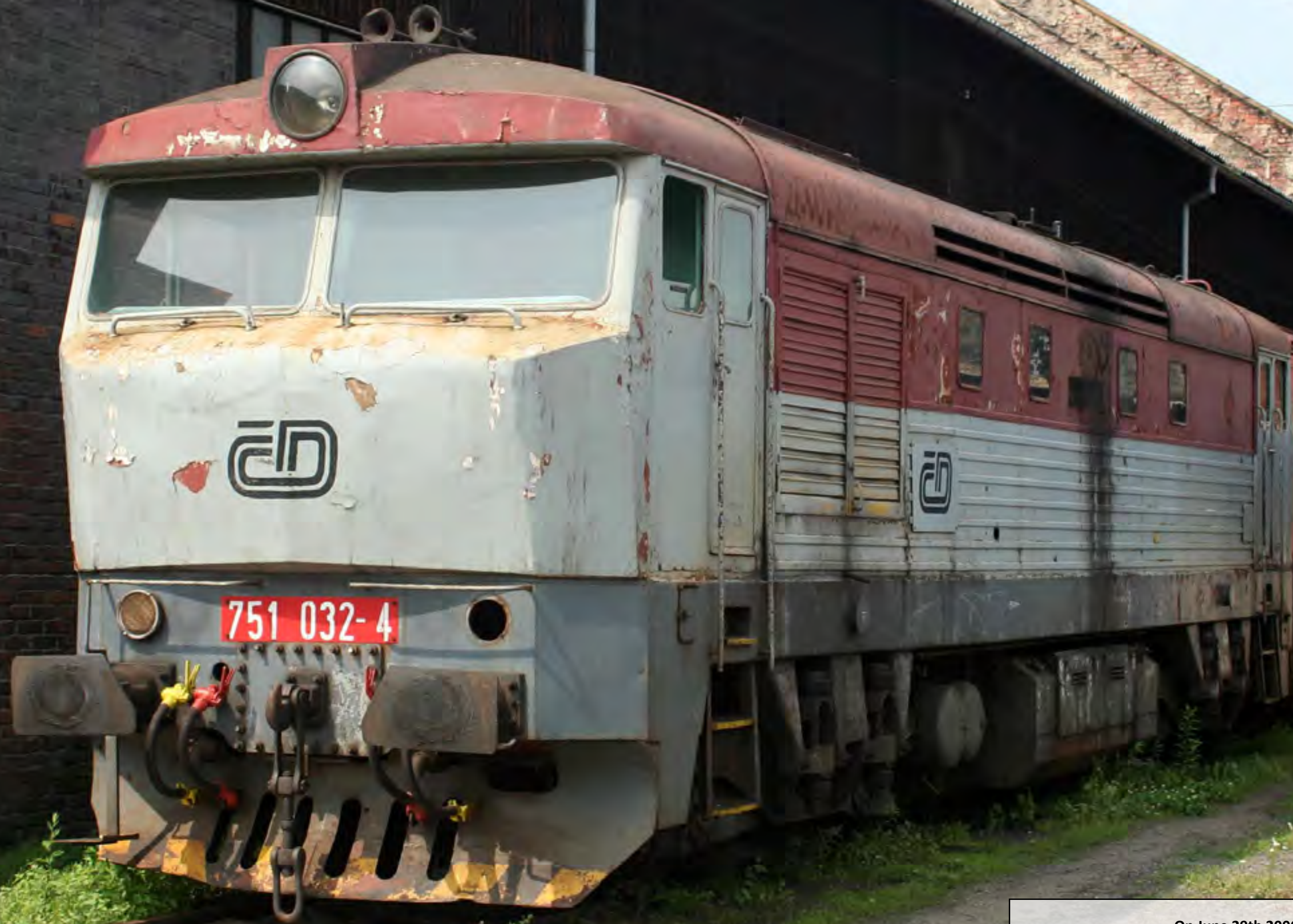
On June 29th 2006, withdrawn CD Class 751.032-4 is seen on Kralupy nad Vltavou depot.