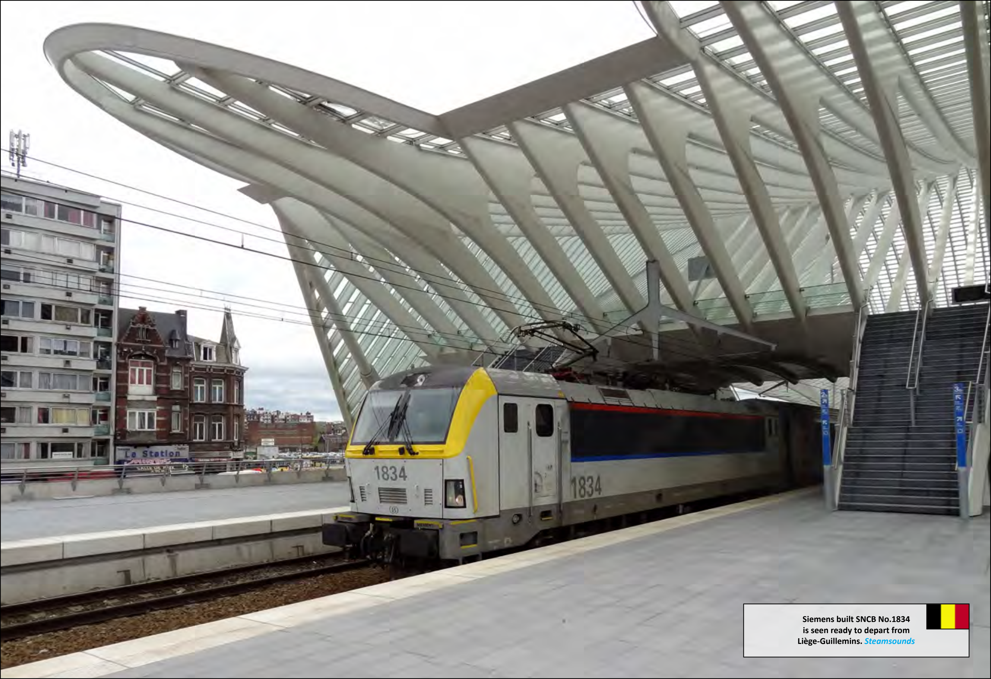
Siemens built SNCB No.1834 is seen ready to depart from Liège-Guillemins. Steamsounds