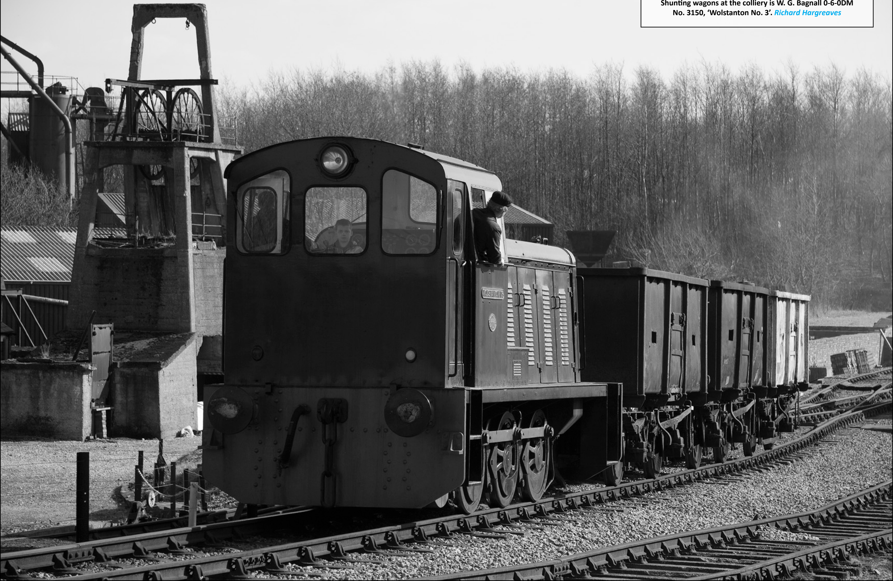
Shunting wagons at the colliery is W. G. Bagnall 0-6-0DM No. 3150, 'Wolstanton No. 3'.