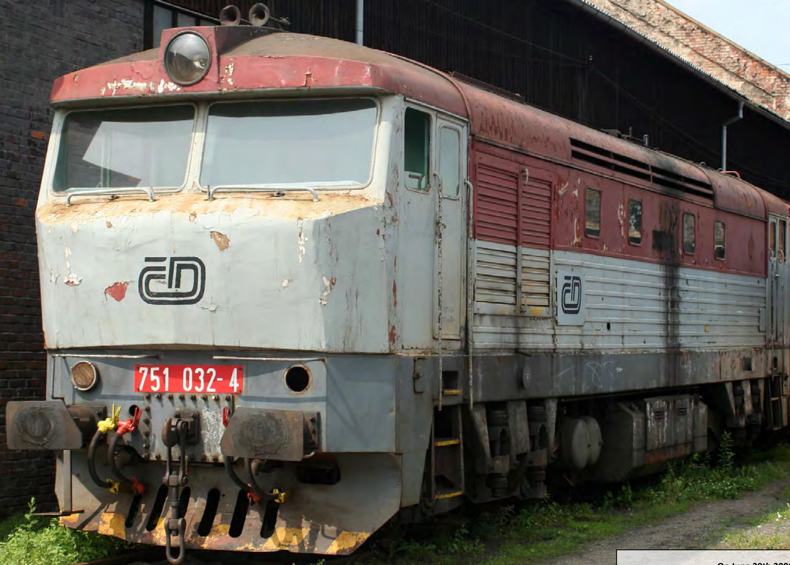
On June 29th 2006, withdrawn CD Class 751.032-4 is seen on Kralupy nad Vltavou depot.