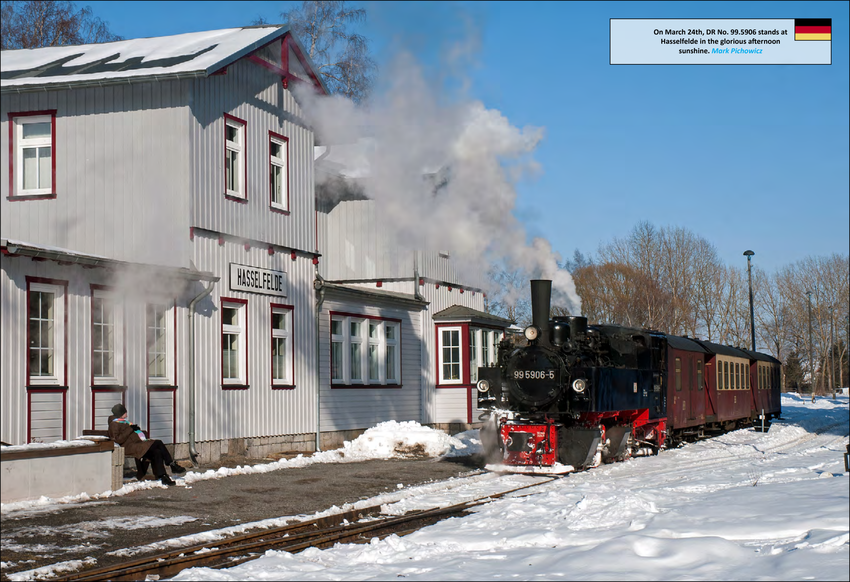
On March 24th, DR No. 99.5906 stands at Hasselfelde in the glorious afternoon sunshine.