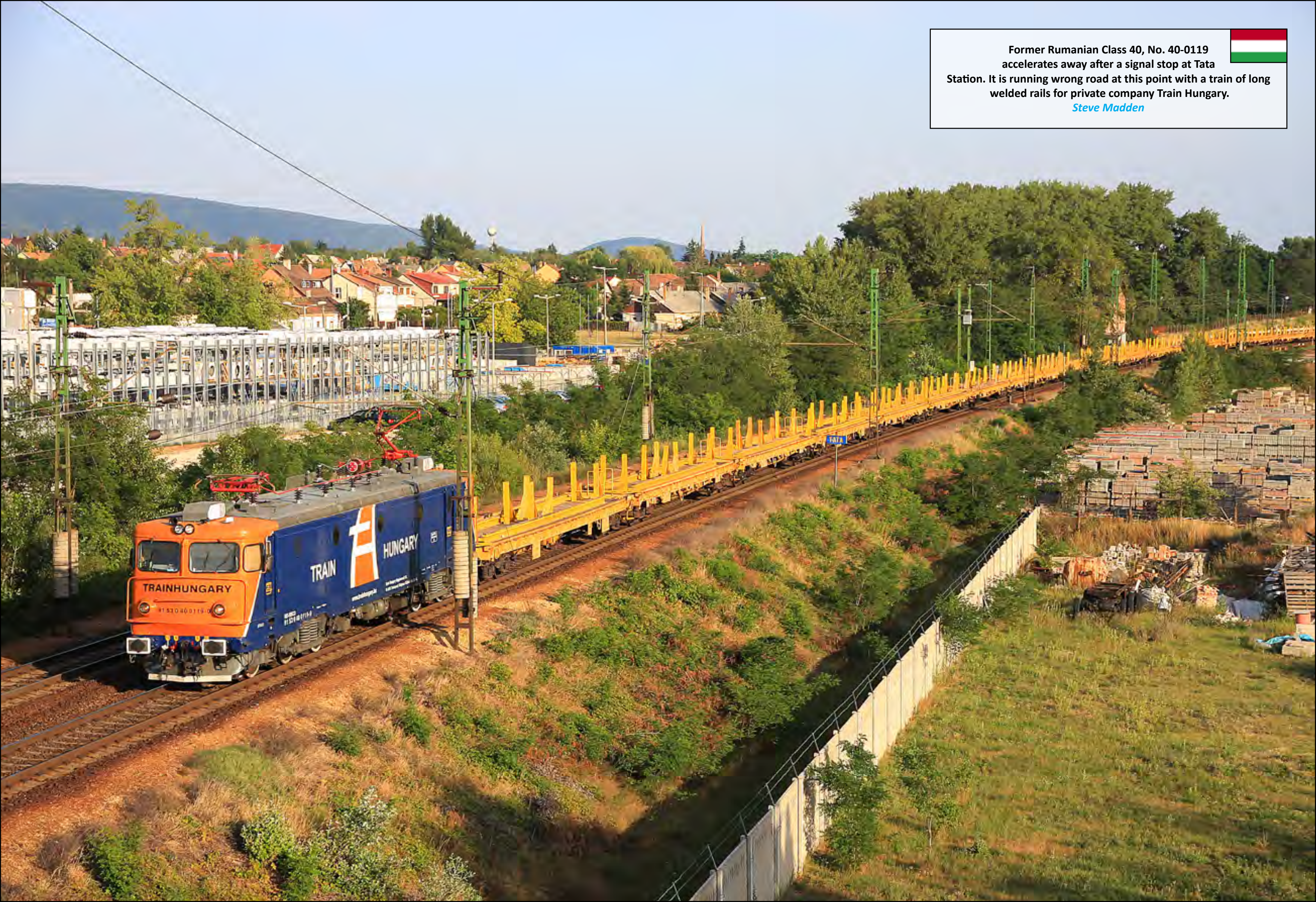
Former Rumanian Class 40, No. 40-0119 accelerates away after a signal stop at Tata Station. It is running wrong road at this point with a train of long welded rails for private company Train Hungary.