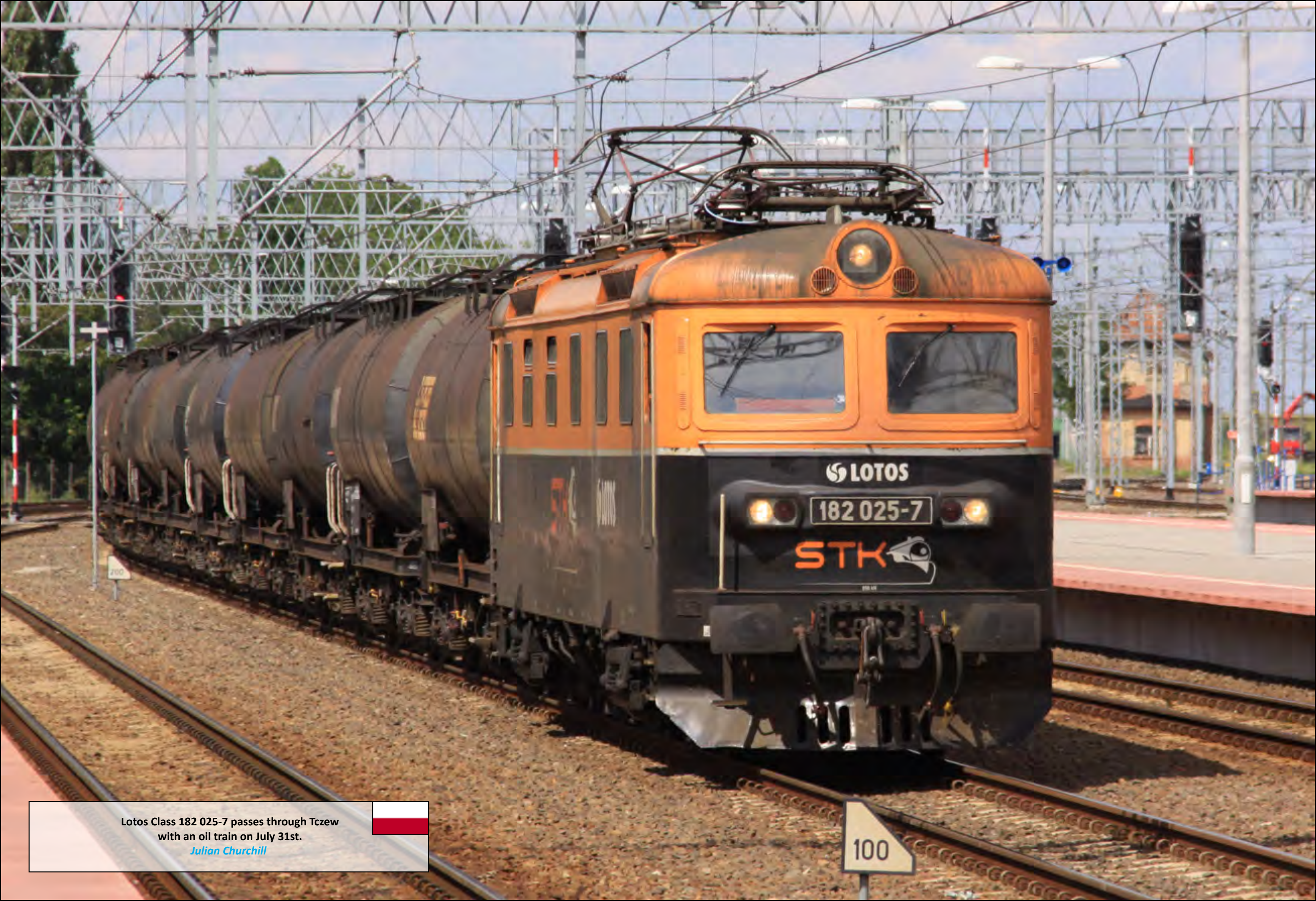
Lotos Class 182 025-7 passes through Tczew with an oil train on July 31st.