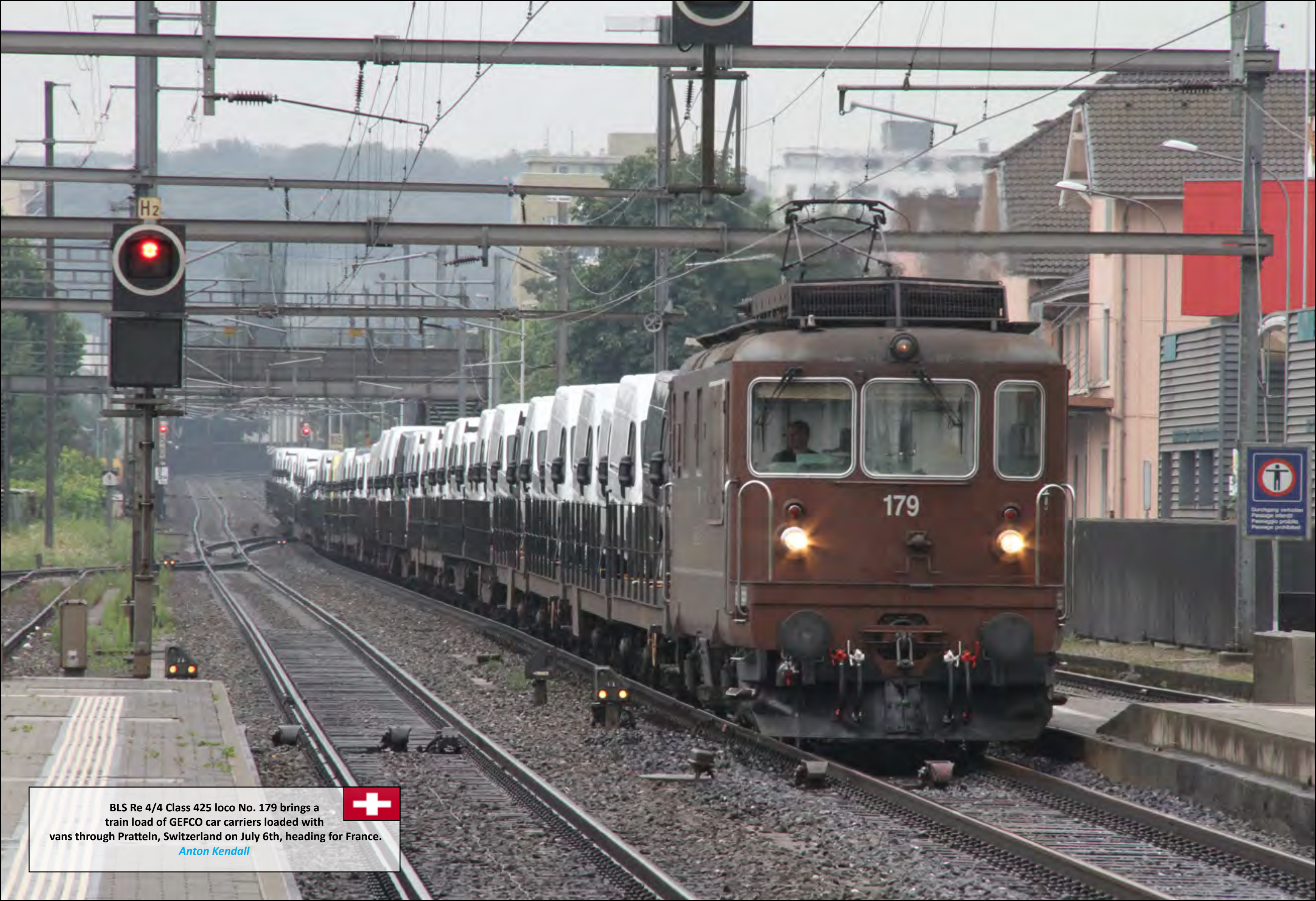
BLS Re 4/4 Class 425 loco No. 179 brings a train load of GEFCO car carriers loaded with vans through Pratteln, Switzerland on July 6th, heading for France.