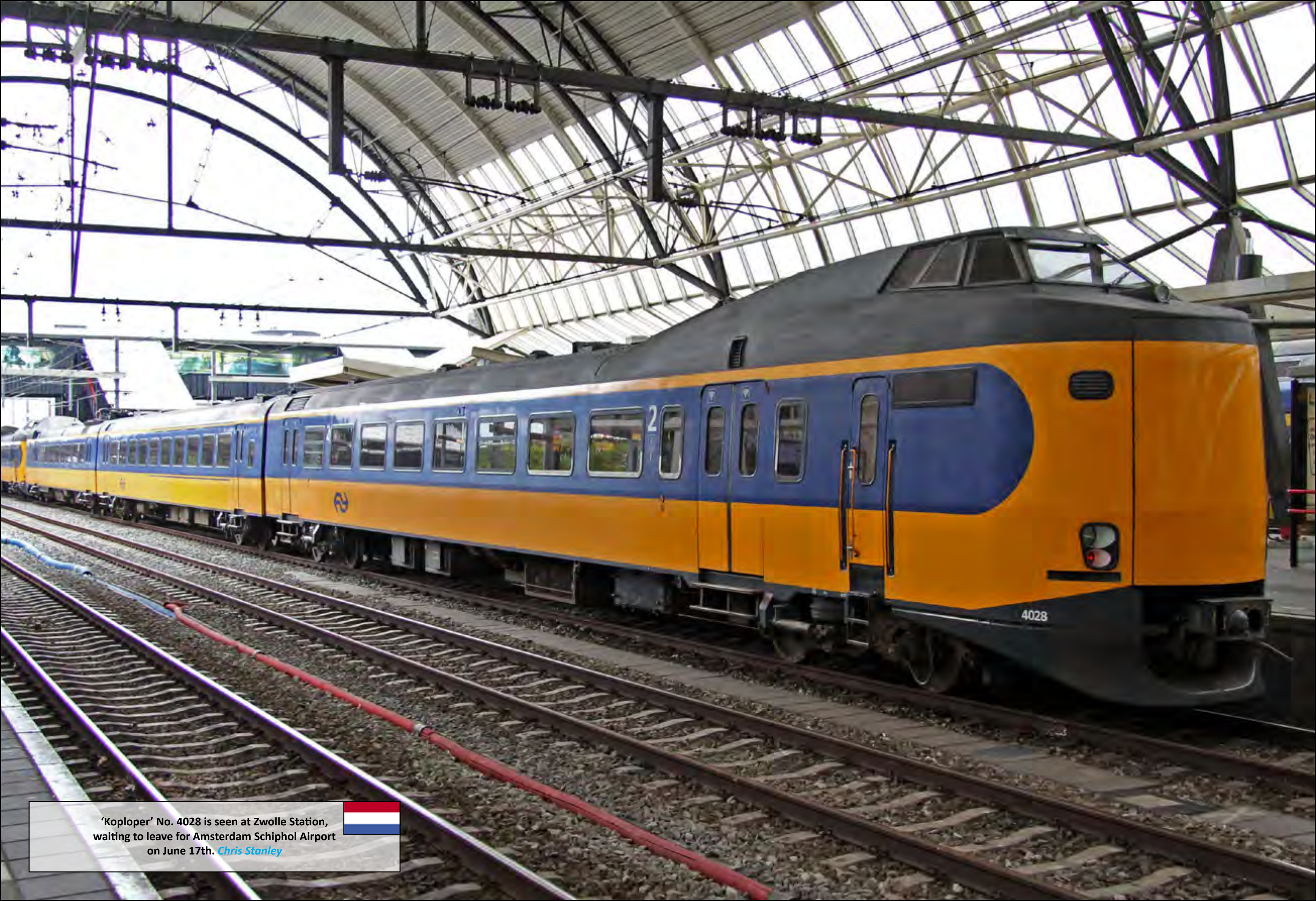
'Koploper' No. 4028 is seen at Zwolle Station, waiting to leave for Amsterdam Schiphol Airport on June 17th. Chris Stanley