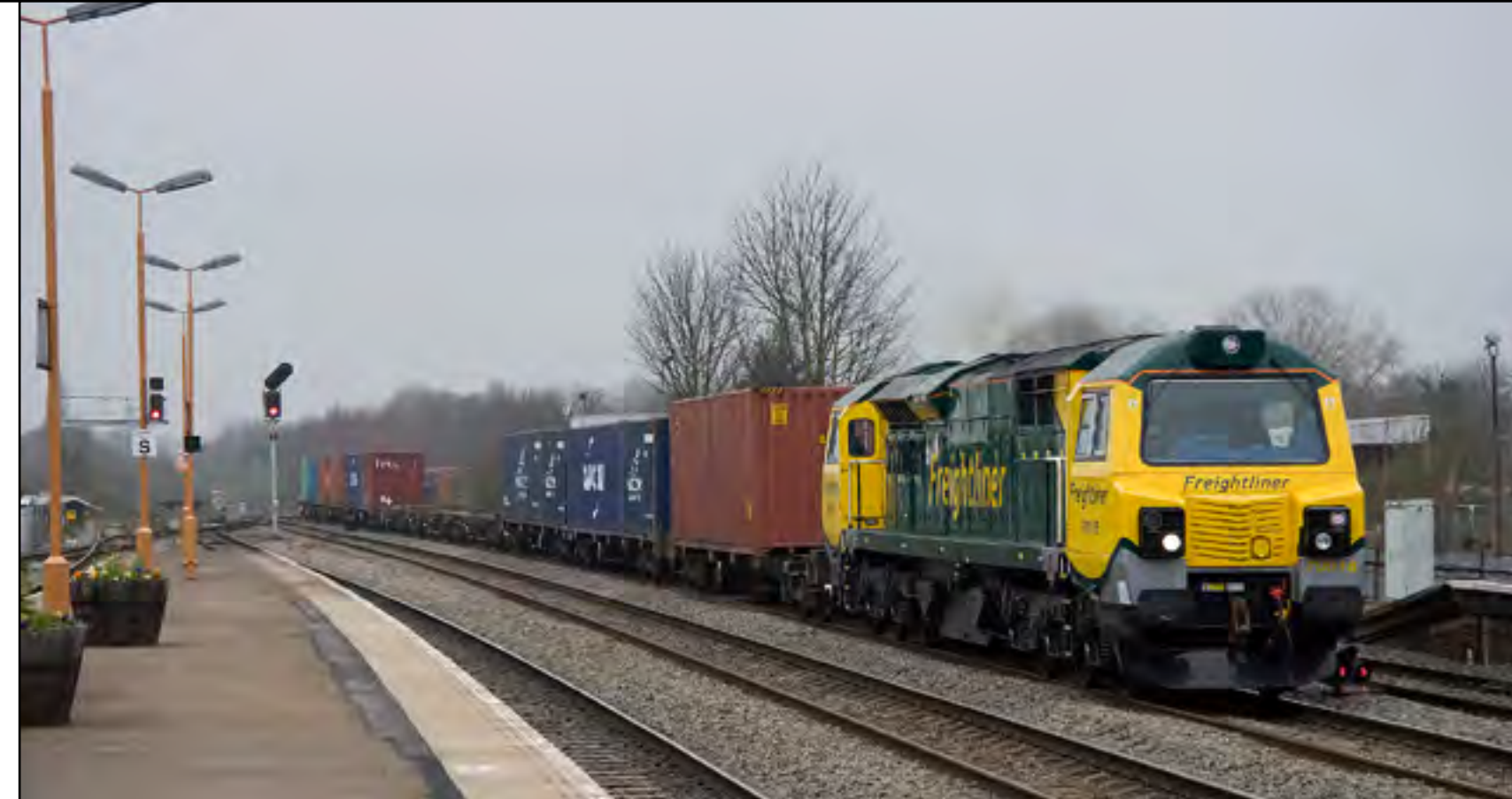
Above: Class 70 018 heads south through Leamington Spa on March 13th. Just a couple of weeks later this loco would suffer a serious fire near Basingstoke.