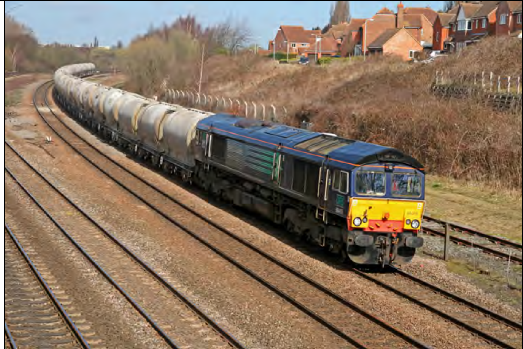
Top Right: Another ex DRS loco that is currently working for Freightliner is Class 66 419, seen here seen on a cement train at Headlands Bridge, Kettering.