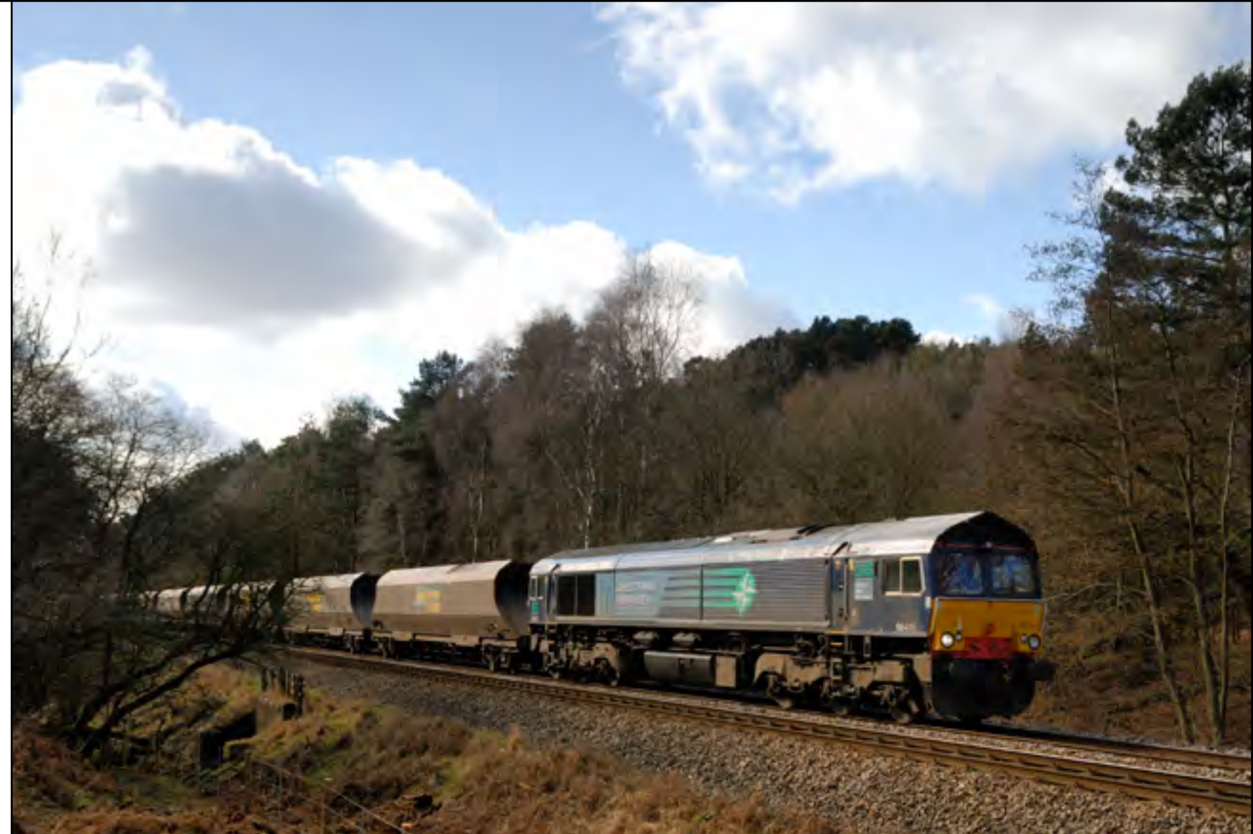
Top Right: Still in its DRS livery but now in use by Freightliner, Class 66 415 takes the 6M55 Portbury Coal Terminal - Rugeley Power Station laden coal train through Furnace Coppice, Staffordshire on March 5th. Gary S. Smith