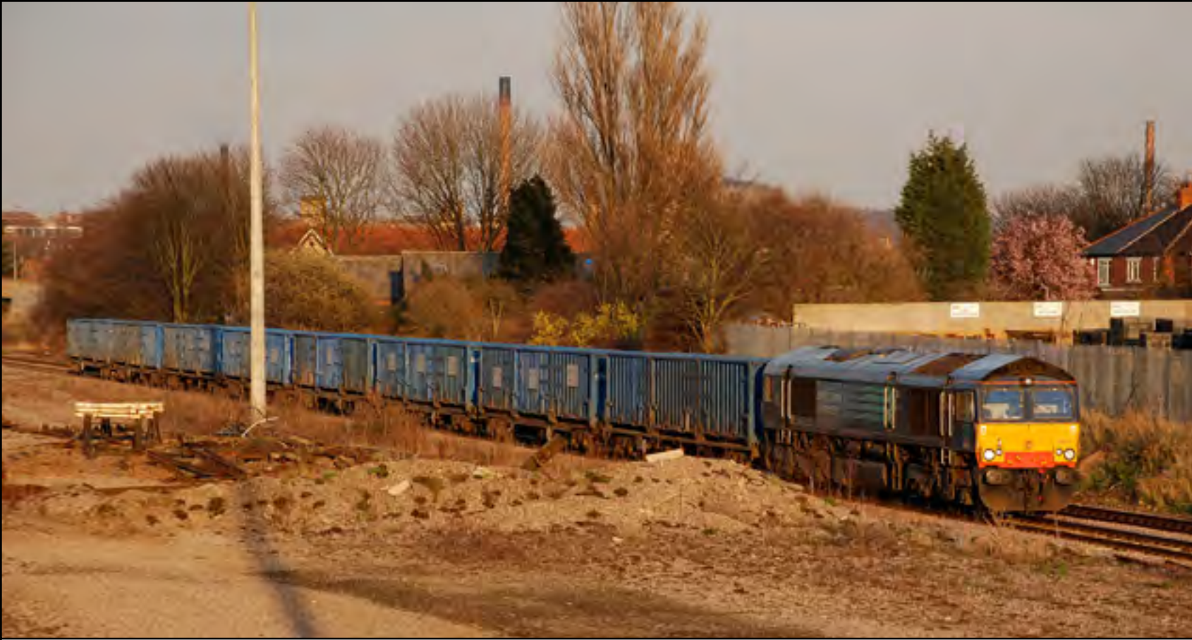
Above: On March 19th, former DRS Class 66 415 found itself on 6M06 Roxby- Bredbury. It is seen soaking up the last of the sun on the outward line before sailing off into the sunset at Scunthorpe West Jct.