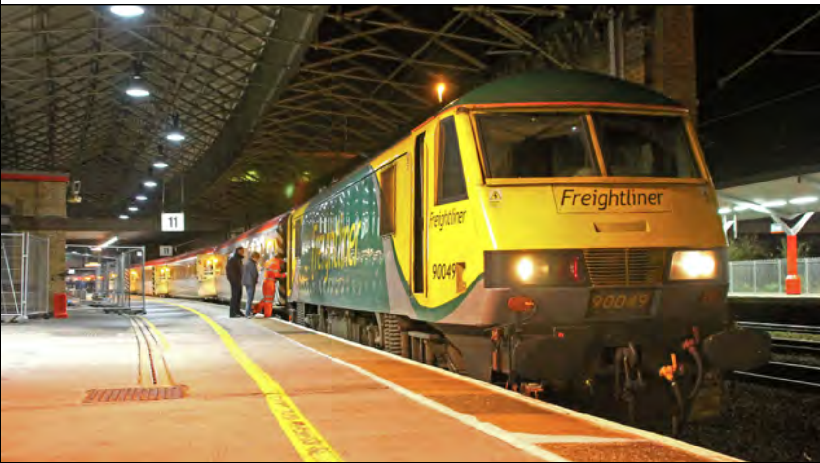
Below: Freightliner Class 90 049 is seen at Crewe with the FO 1K39 London Euston - Crewe on March 9th. Dave Harris