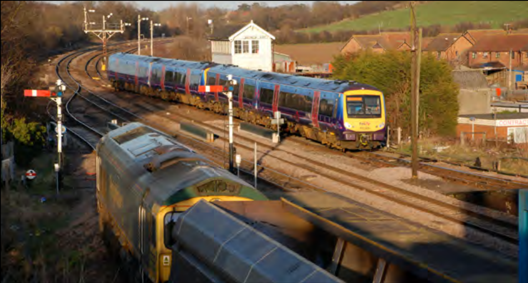
Above: On March 3rd, a Cleethorpes - Manchester TPE, formed of Class 170 306 and 170 304, crosses over onto the Down Slow as 66 604 awaits the road to Immingham on the Up Slow at Barnetby. Steve Thompson