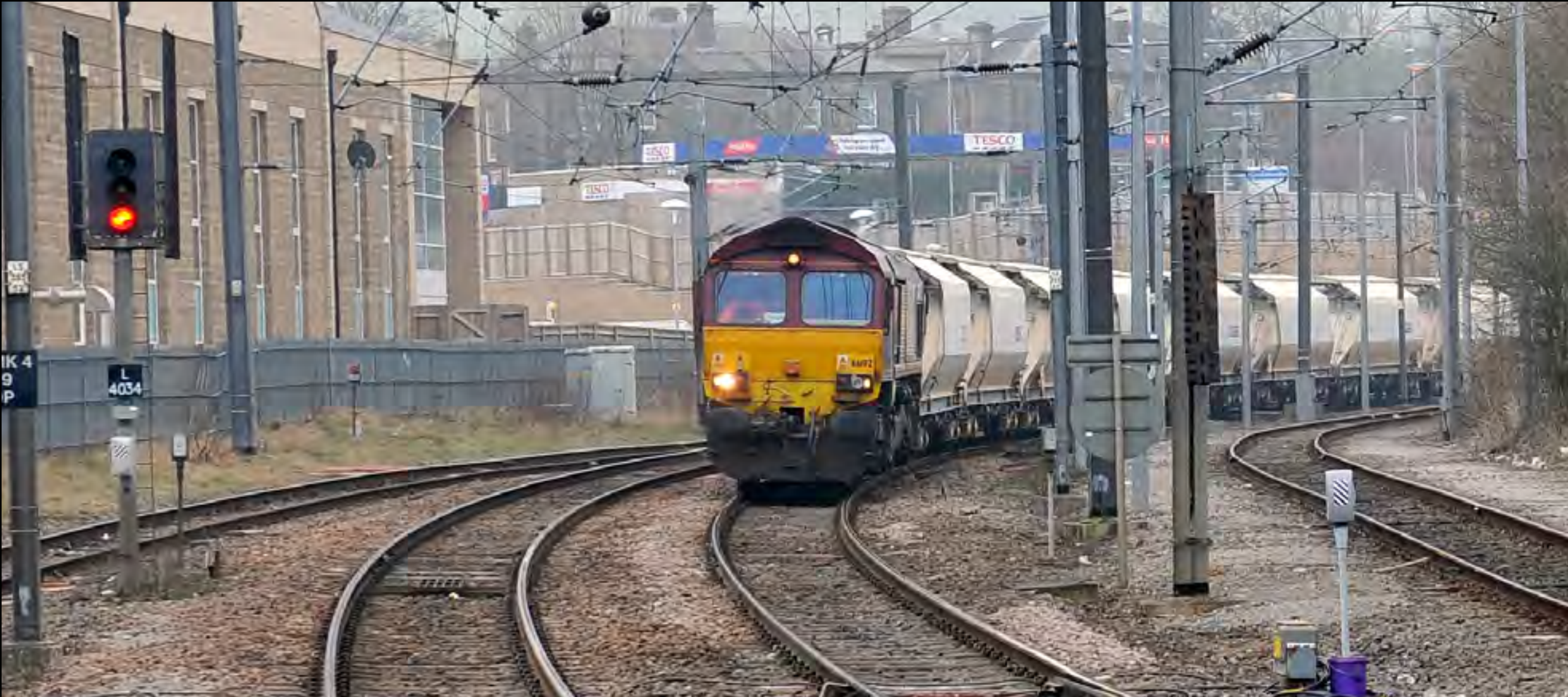
Left: Class 66 192 wends its way into Skipton for a crew change with 6D72 Hull to Rylstone on March 15th.