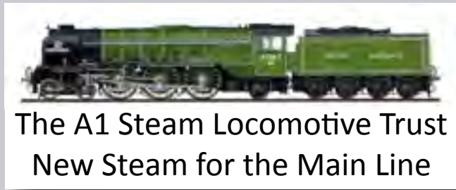
The A1 Steam Locomotive Trust New Steam for the Main Line