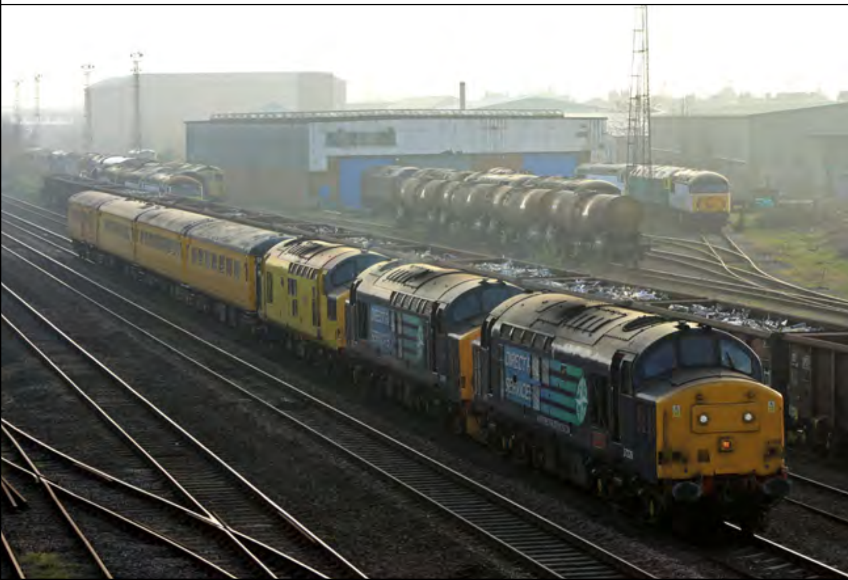
Below: On March 12th, 1Q06 Derby RTC - Exeter test train with DBSO No. 9708 leading and Class 31 285 on rear, passes Burton-on-Trent. Stuart Hillis