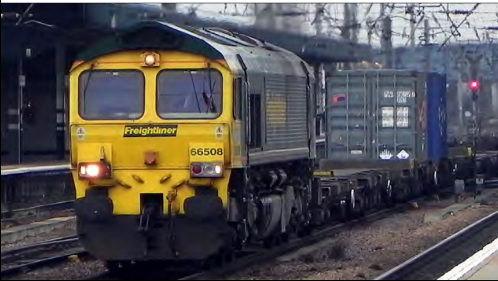
Below: Class 66508 heads the 4L87 Leeds to Felixstowe through Doncaster on February 29th.