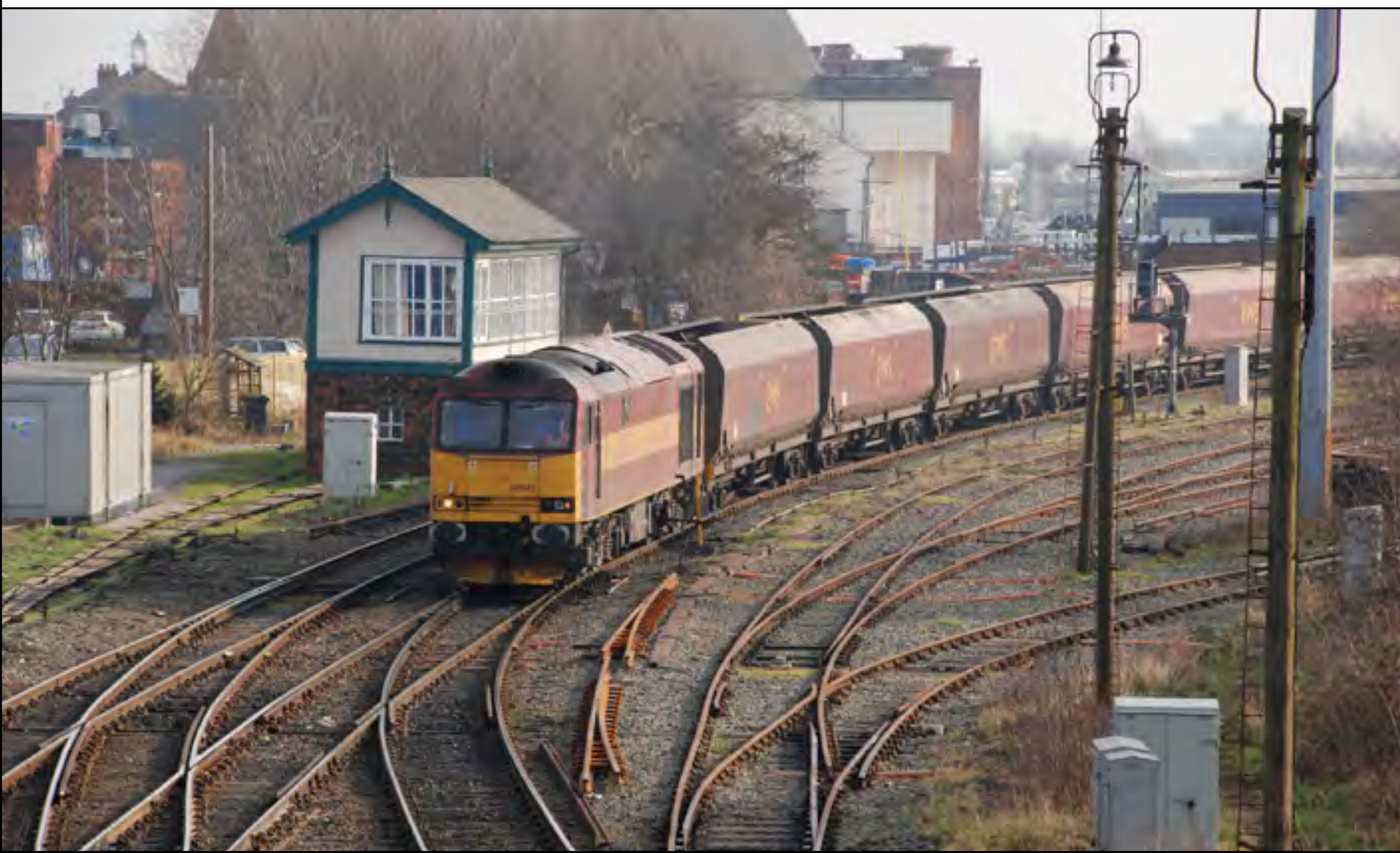
Below: Class 60 079 heads towards Santon FOT with an empty ore working, March 5th.