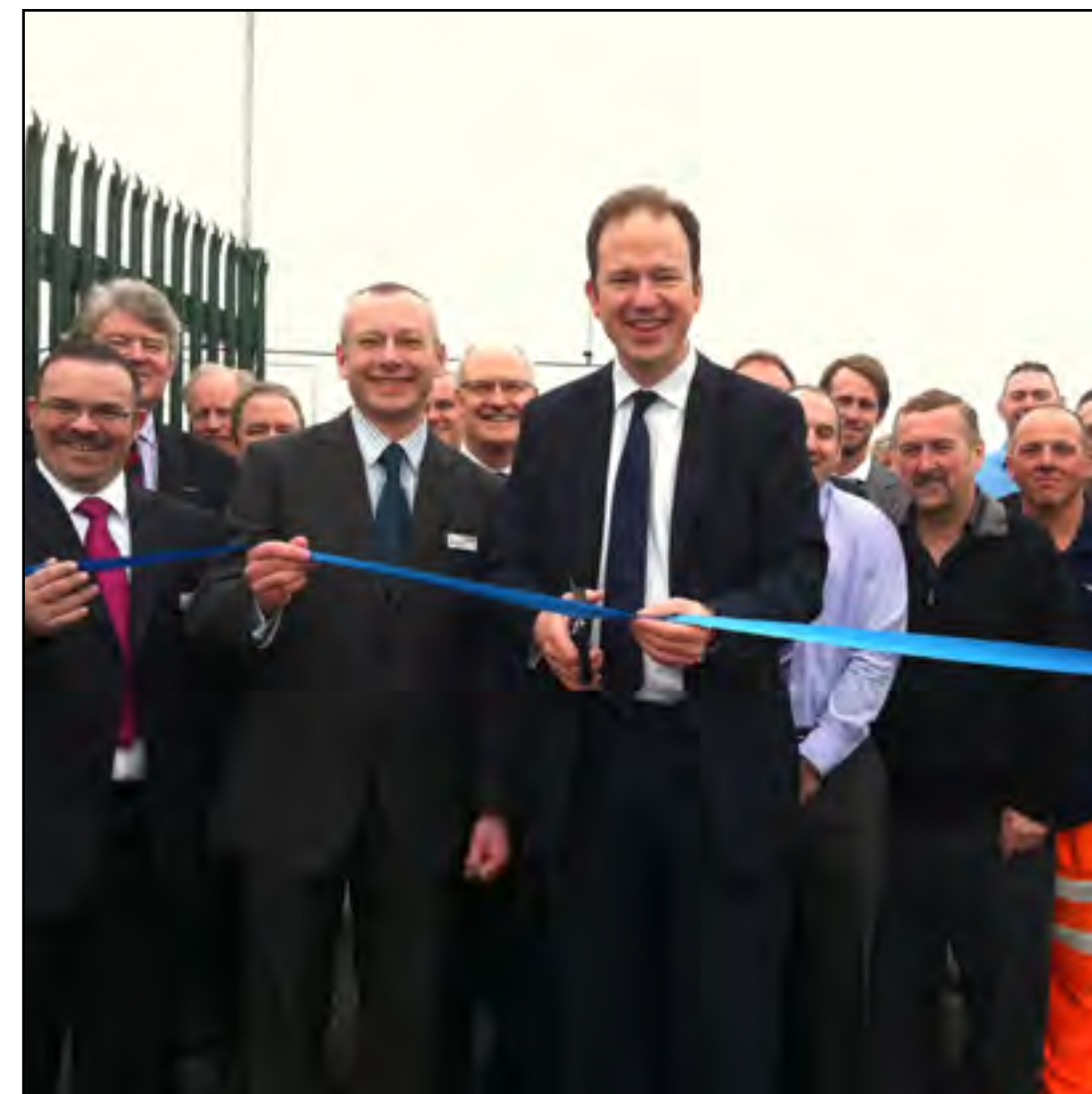
Photo: MP Jesse Norman (right) opens NR depot at Hereford

"By strengthening our presence in Herefordshire, we are demonstrating our commitment and can be more responsive and better placed to explore untapped rail opportunities. This will enable us to safeguard the future of the railways in this area and offer alternative transport solutions to congested roads."