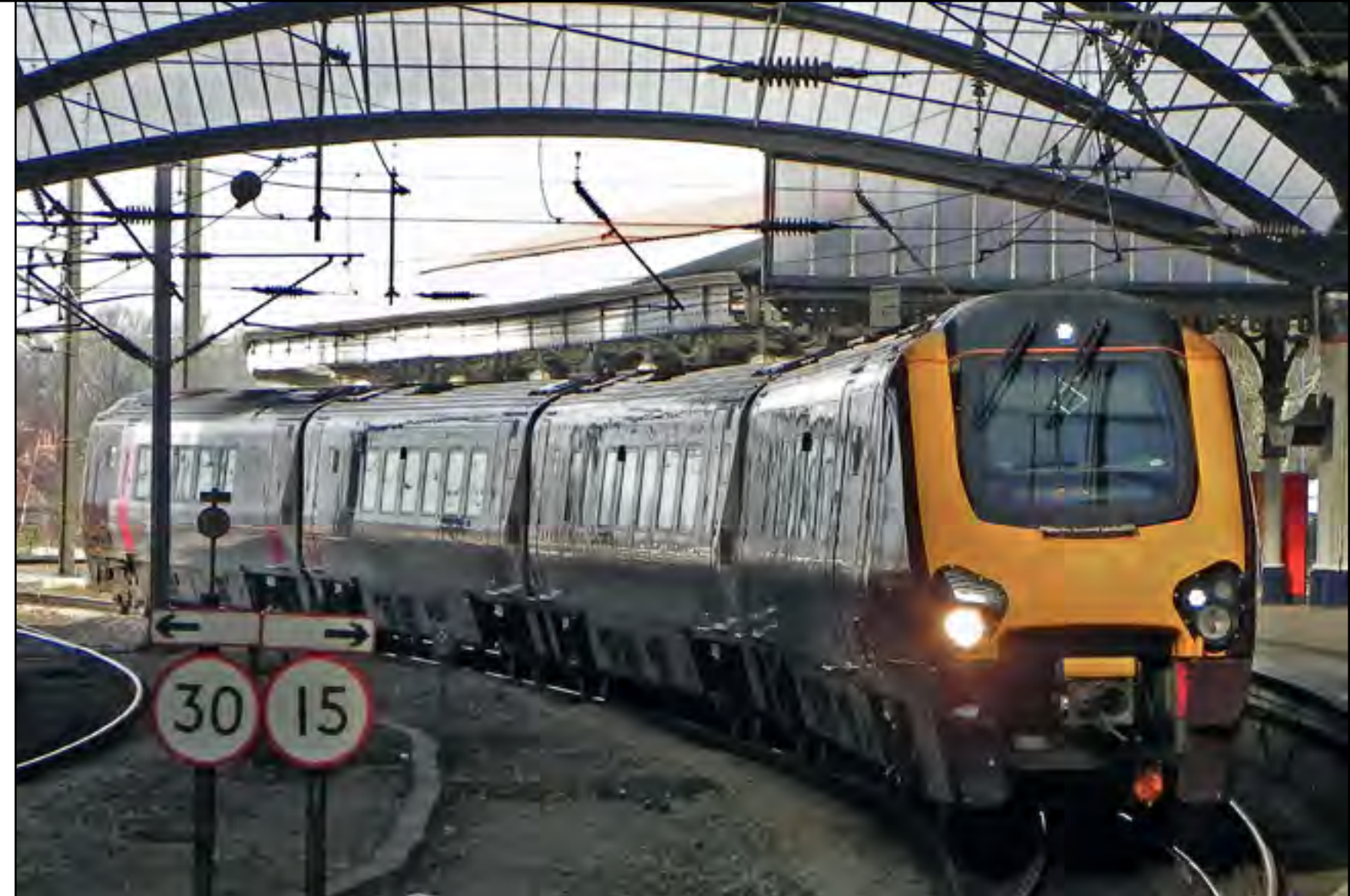
Top Right: CrossCountry Class 220 023 arrives into York on March 3rd with the 13:34 1V89 Newcastle to Reading service.