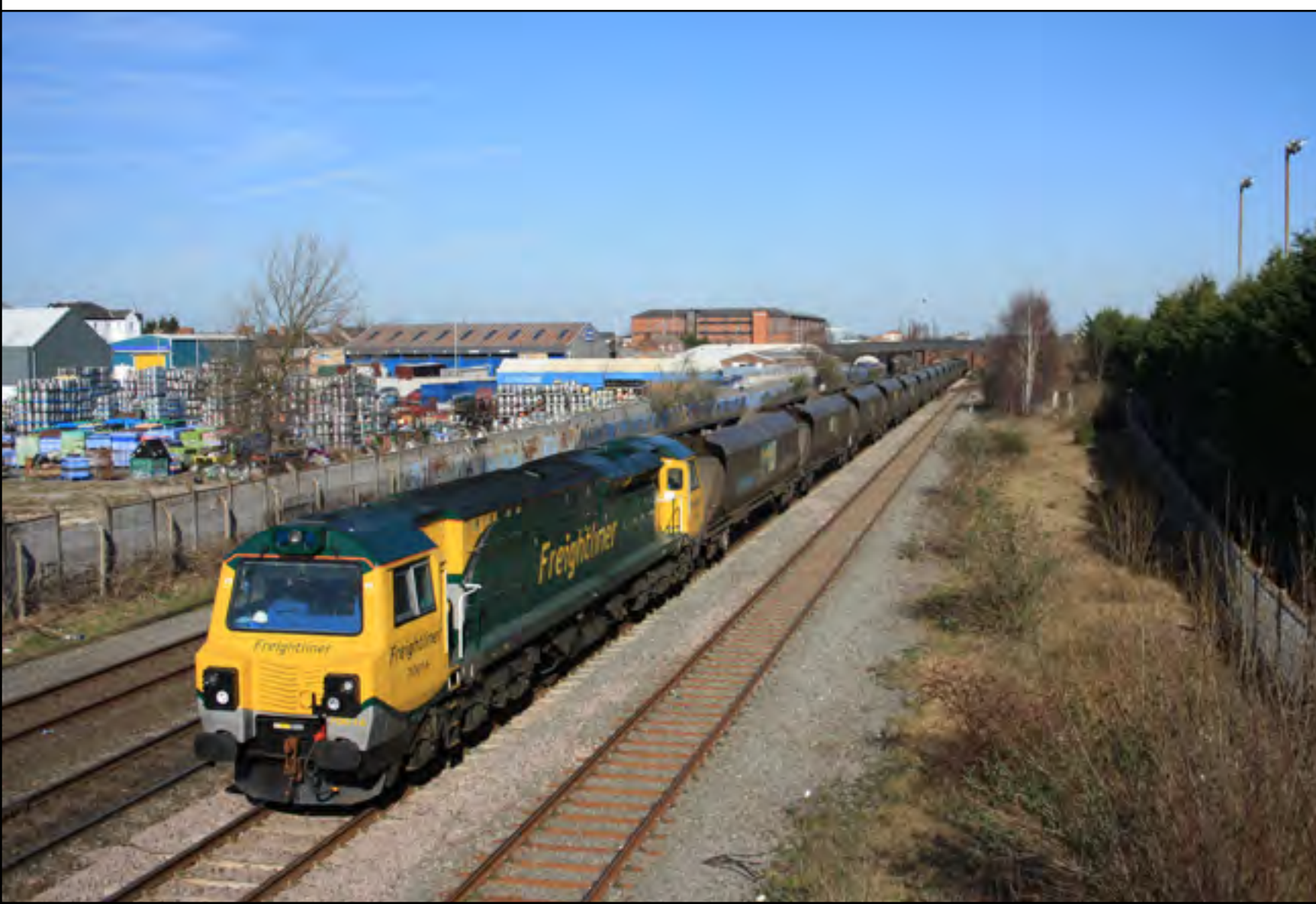
Below: Freightliner's Class 70 013, emerging from beneath Warrington Bank Quay Station with an empty MGR working from Fiddlers Ferry power station, March 2nd.