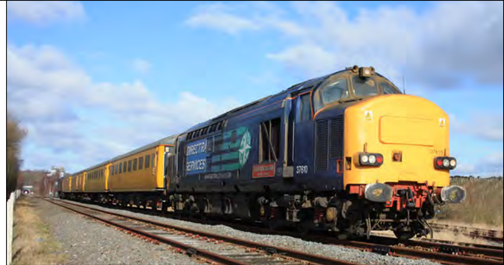
Above: Class 37 610 "T.S.(Ted)Cassady" and with 37 606 on the rear of 1Q13 test train Derby RTC - Knighton Jct. nears Moira West box on the Burton - Coalville branch, March 5th.