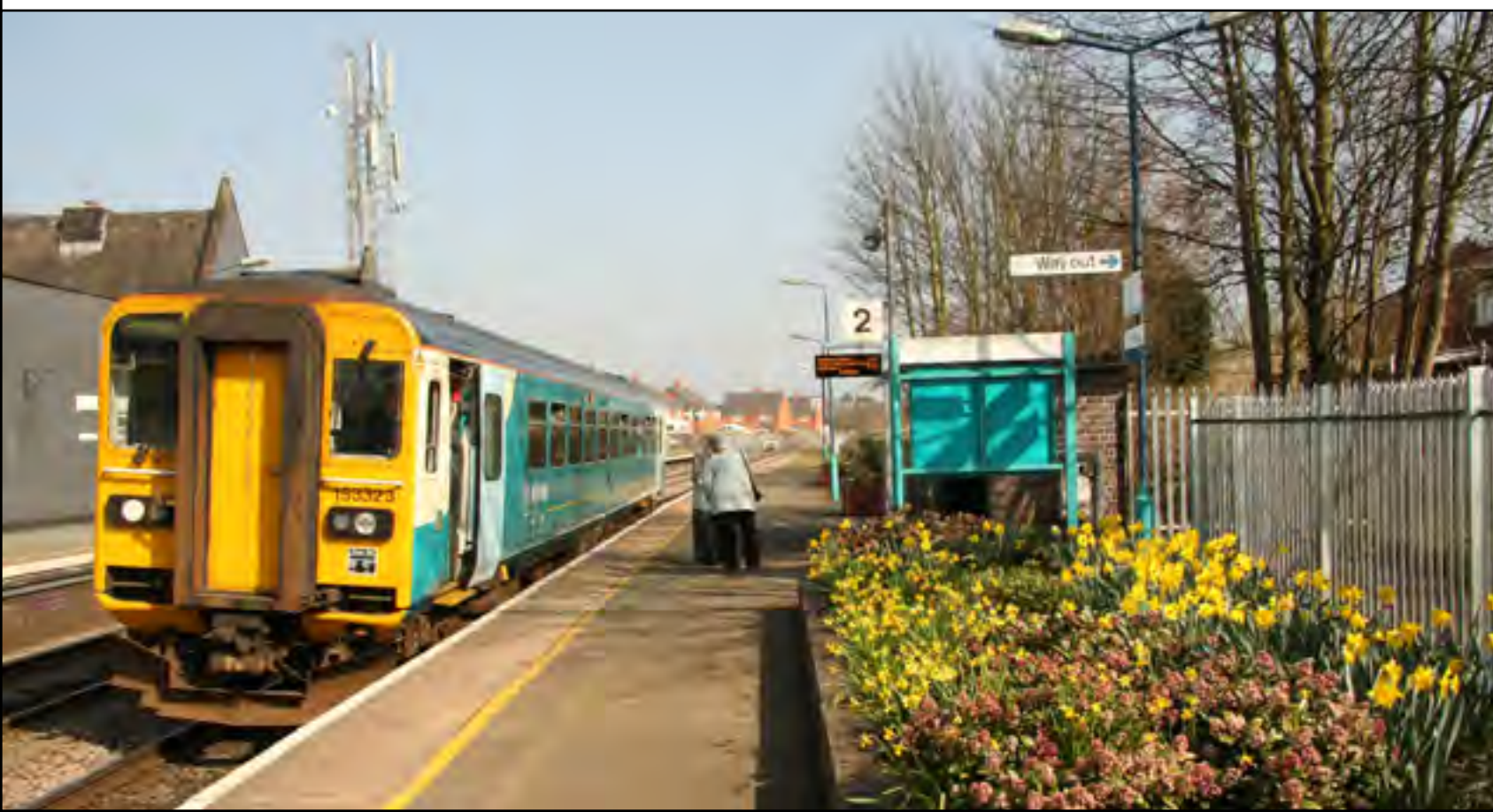
Below: On March 24th, Class 153 323 pauses at Nantwich with the late running 13.20 departure from Crewe to Shrewsbury. Derek Elston