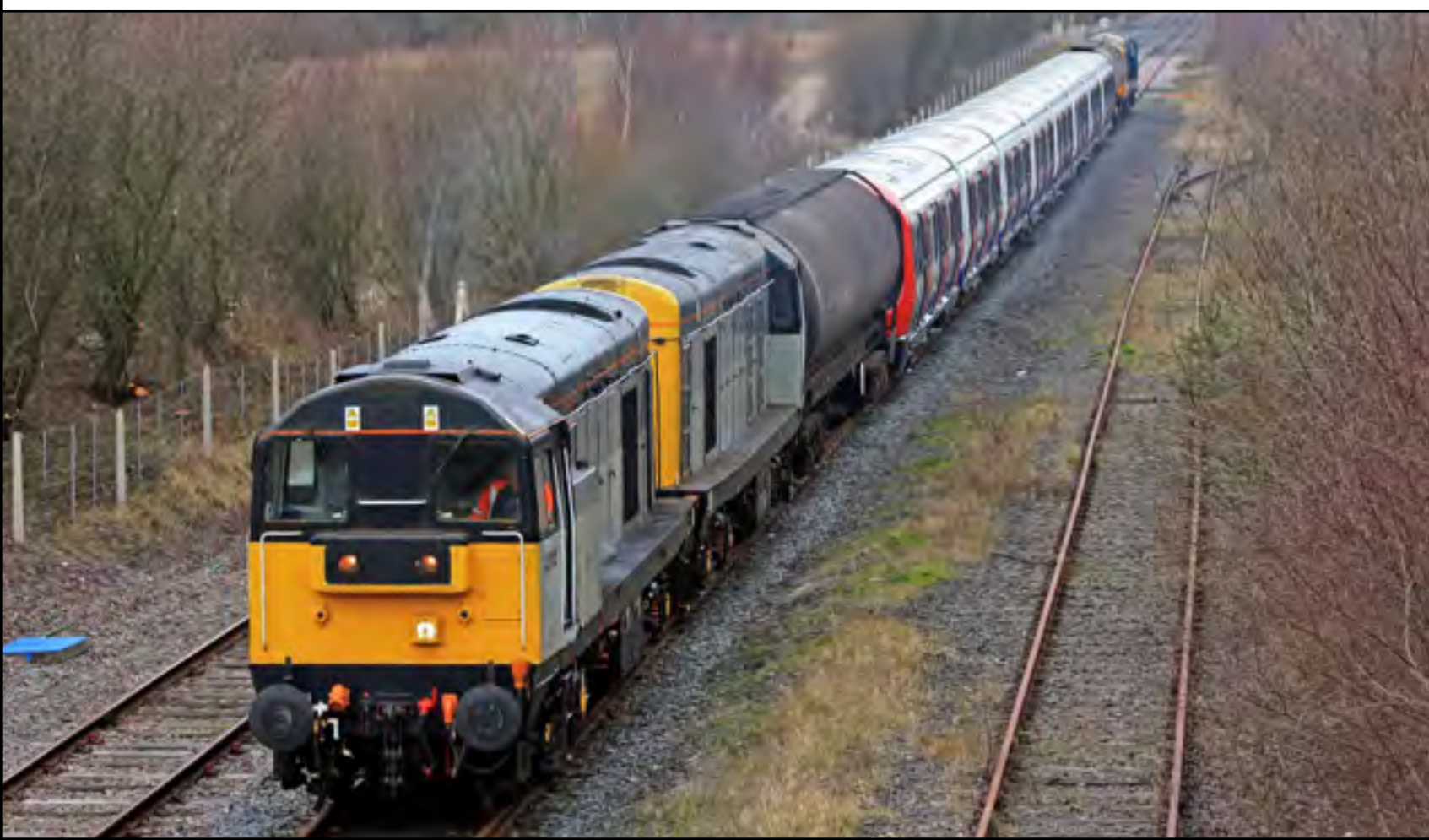
Below: On March 9th, the 7X23 Derby Litchurch Lane - Old Dalby with Class 20905 and 20 901 leading new S class tube stock and barrier wagons, with 20 227 and 20 142 on the rear, is seen nearing Moira West signal box. Stuart Hillis