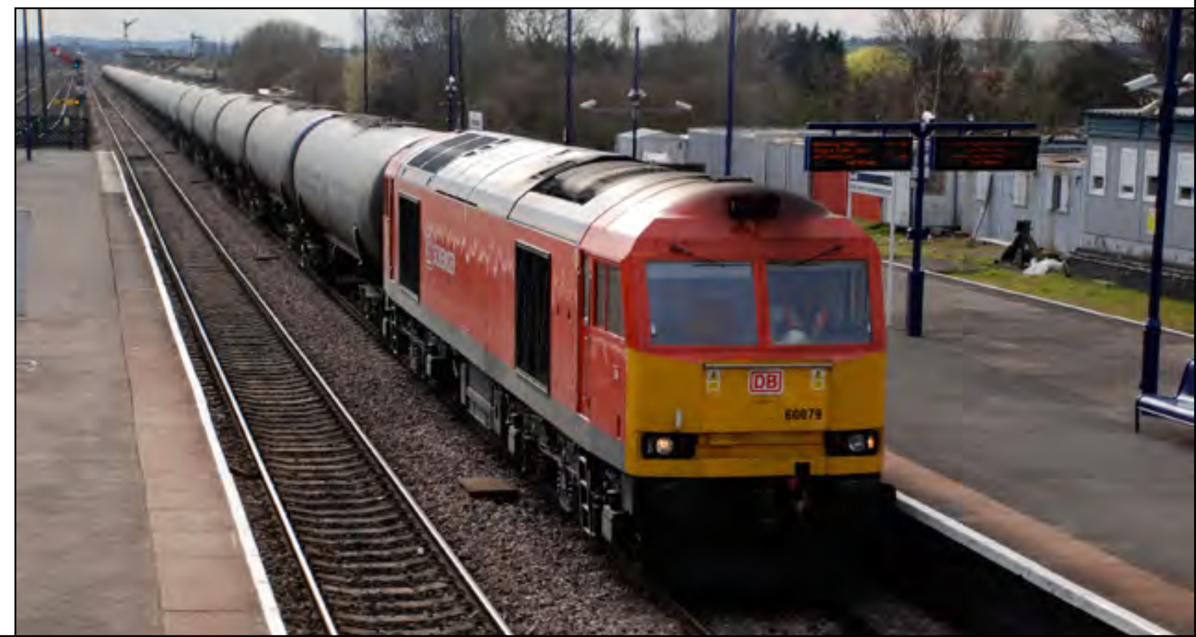
Below: Class 60 079 passes through Barnetby with the 6E54 Kingsbury - Humber Oil Refinery discharged tank cars.