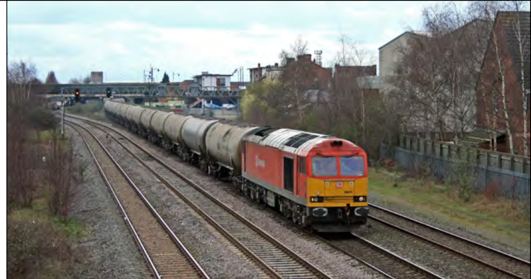
Above: Class 60 011 is seen working the 6E41 Westerleigh - Lindsey empty tanks through a very dull Burton-on-Trent, March 17th. Stuart Hillis