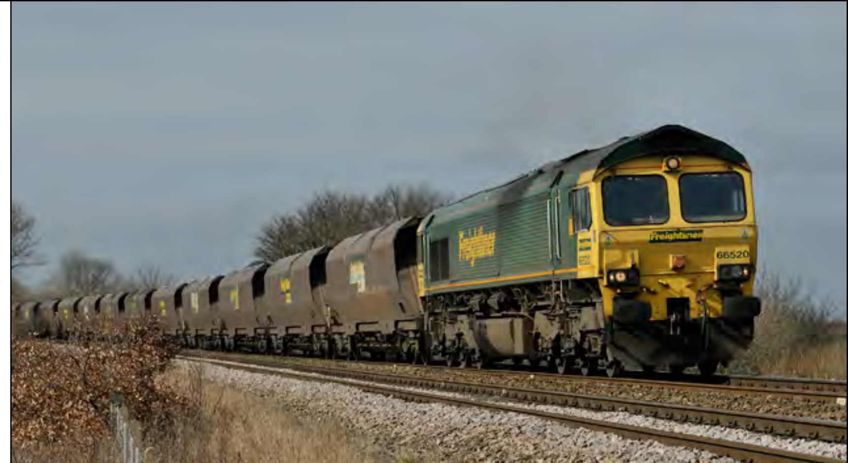
Above: Freightliner's Class 66 520 heads an MGR through Wombridge Crossing on March 8th.