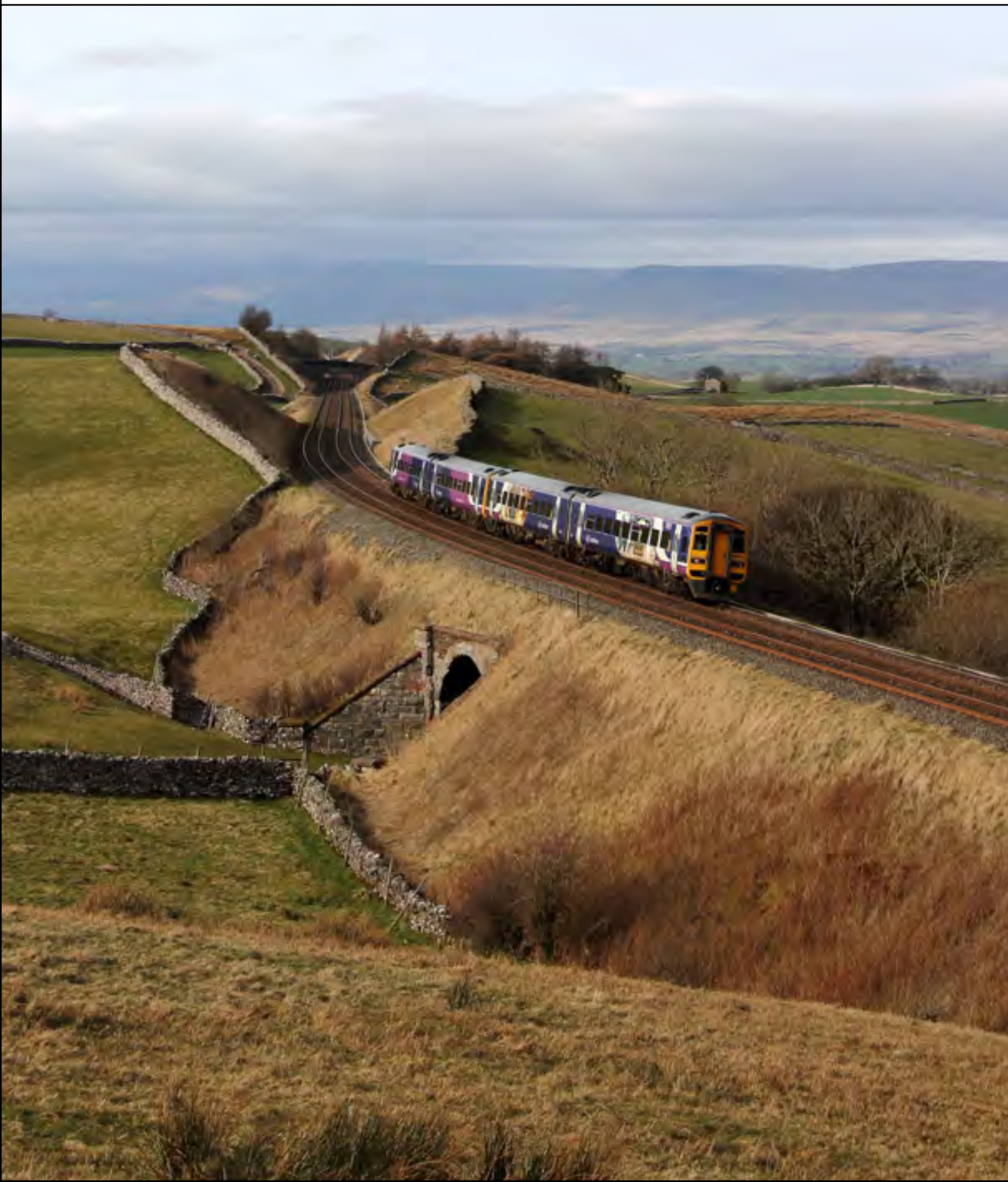
Below: On March 10th, Northern Rail's Class 158 786 returns from Carlisle past Birkett Common with a service to Leeds.