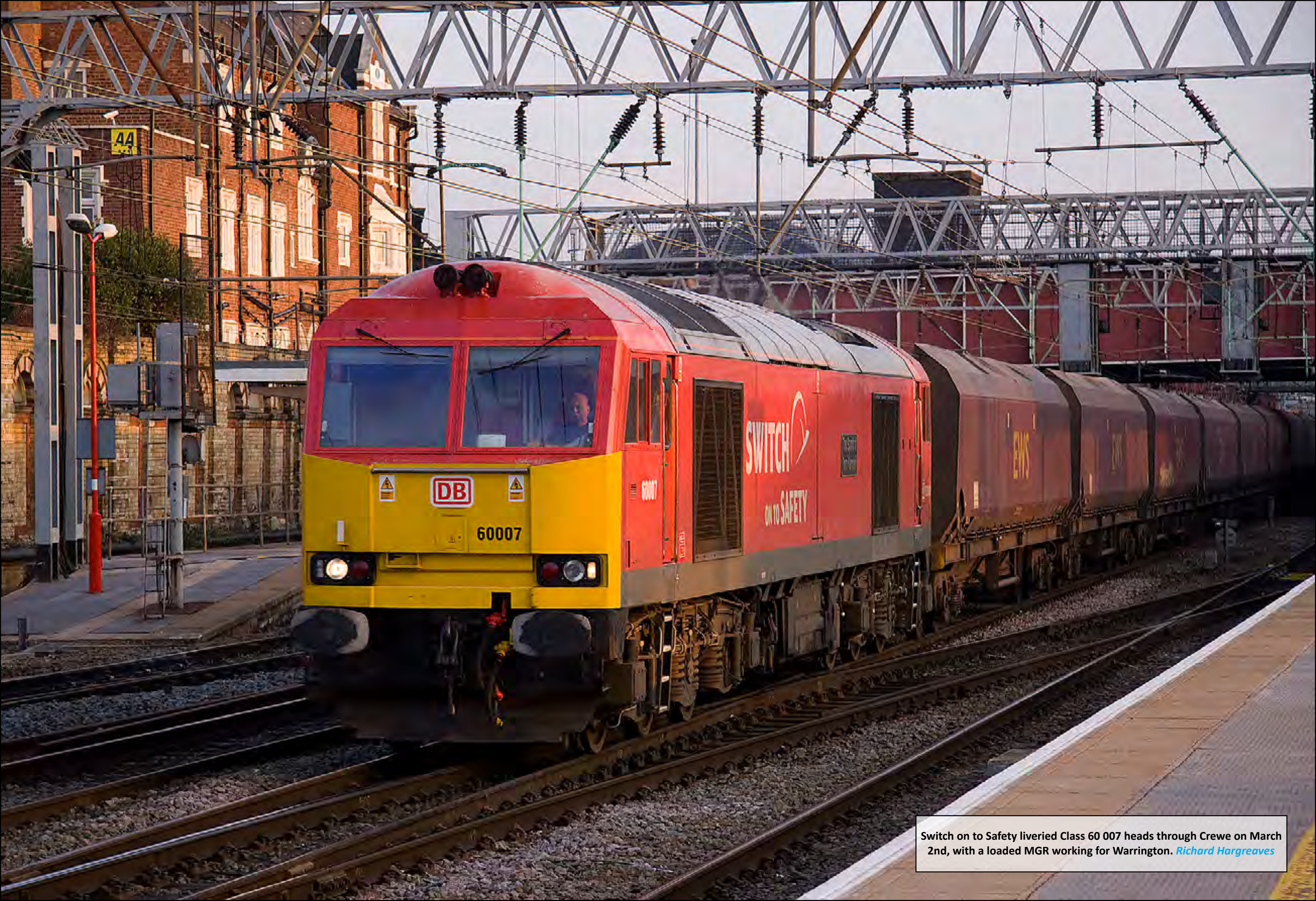
Switch on to Safety liveried Class 60 007 heads through Crewe on March 2nd, with a loaded MGR working for Warrington.