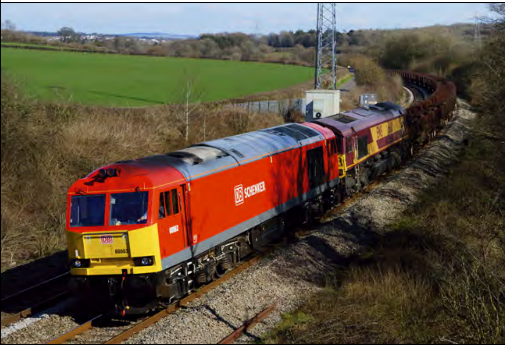
Bottom Left: Class 60 063 and a dead Class 66 011 are pictured passing Llangewydd on March 18th with the 6B05 Llanwern - Margam.