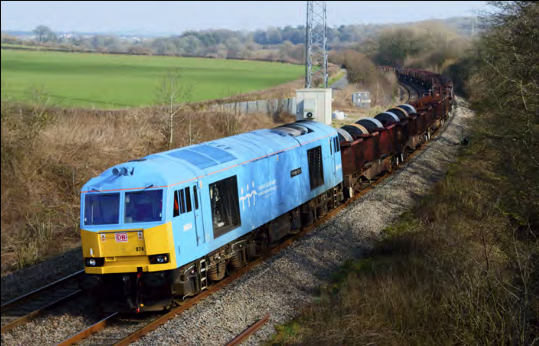
Top Left: On March 11th, Class 60 074 passes Llangewydd with the 6H26 Llanwern - Margam running some 169 minutes early.