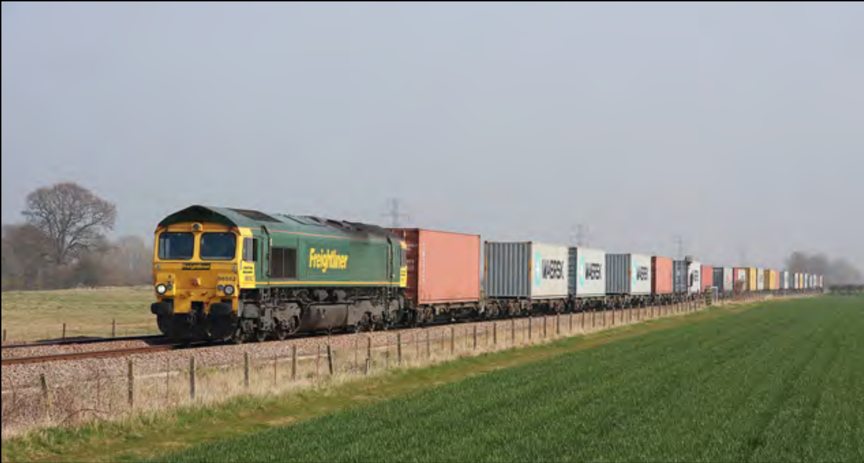
Above: Class 66 562 works the diverted liner 4M87 09.20 Felixstowe - Basford Hall through Uffington on March 24th.