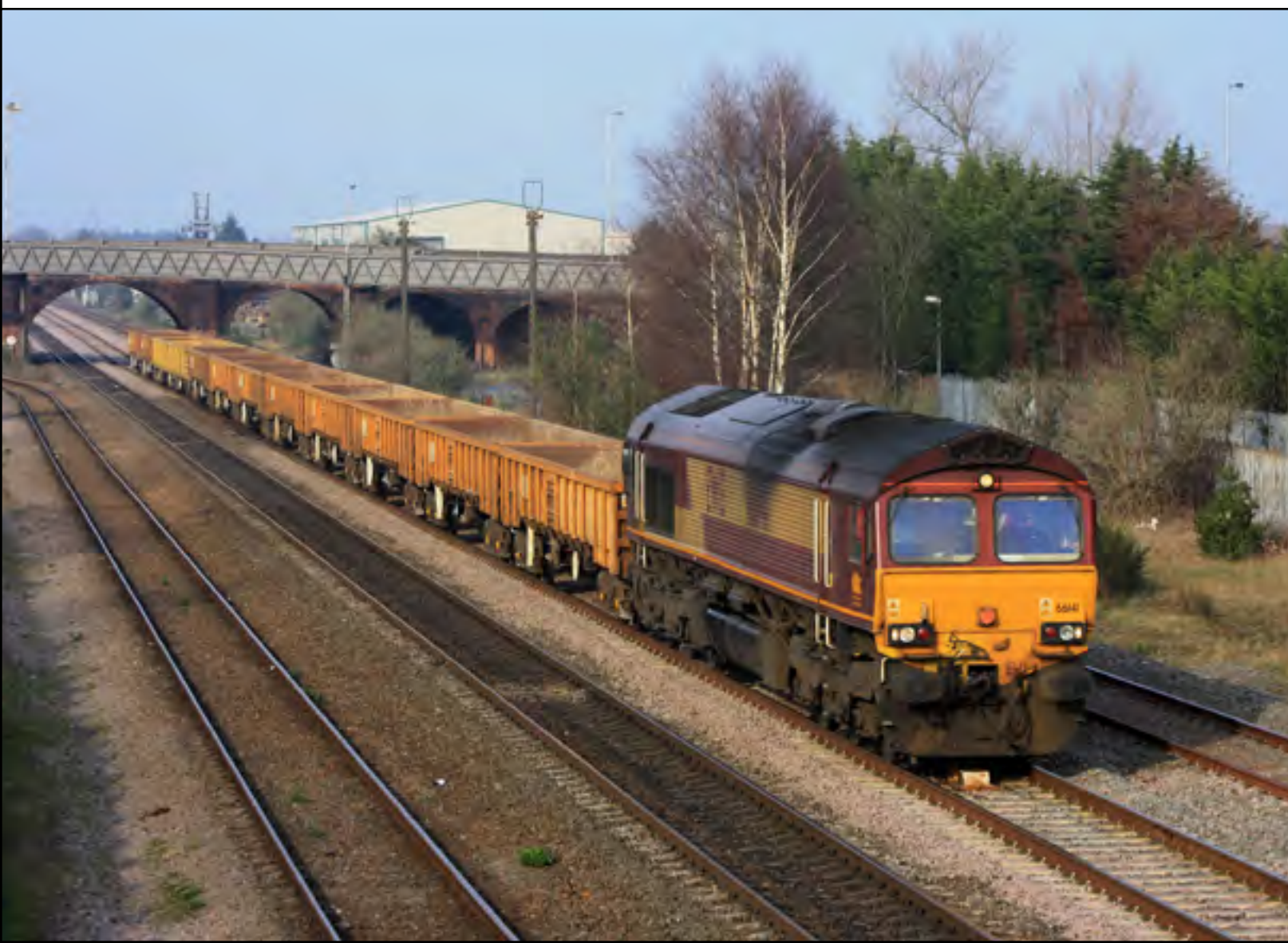
Bottom Right: Another rather smoky Class 66 that we've had a photo of this month, Class 66 137 heads a Hull bound engineering train through Doncaster on March 10th.