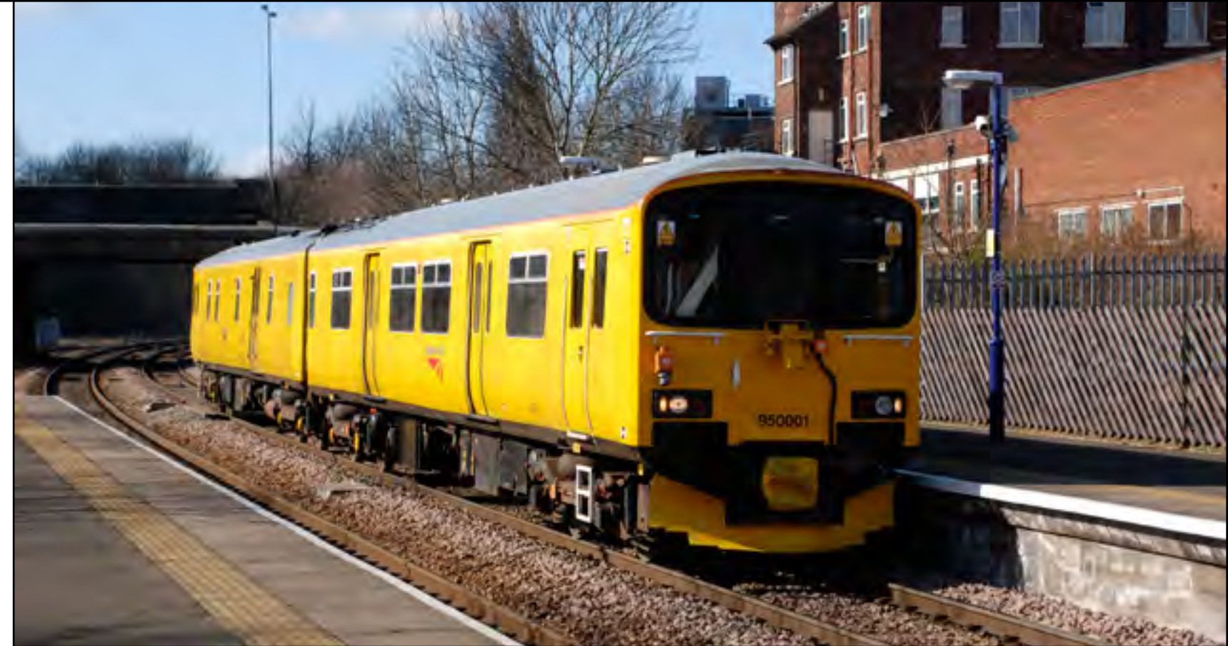
Above: On March 7th, the Network Rail Class 150 worked 2Q08 Derby to Barnetby, Roxby etc, pictured here on it's second "leg" out of Doncaster, heading for Santon Foreign Ore Jct. and Roxby.