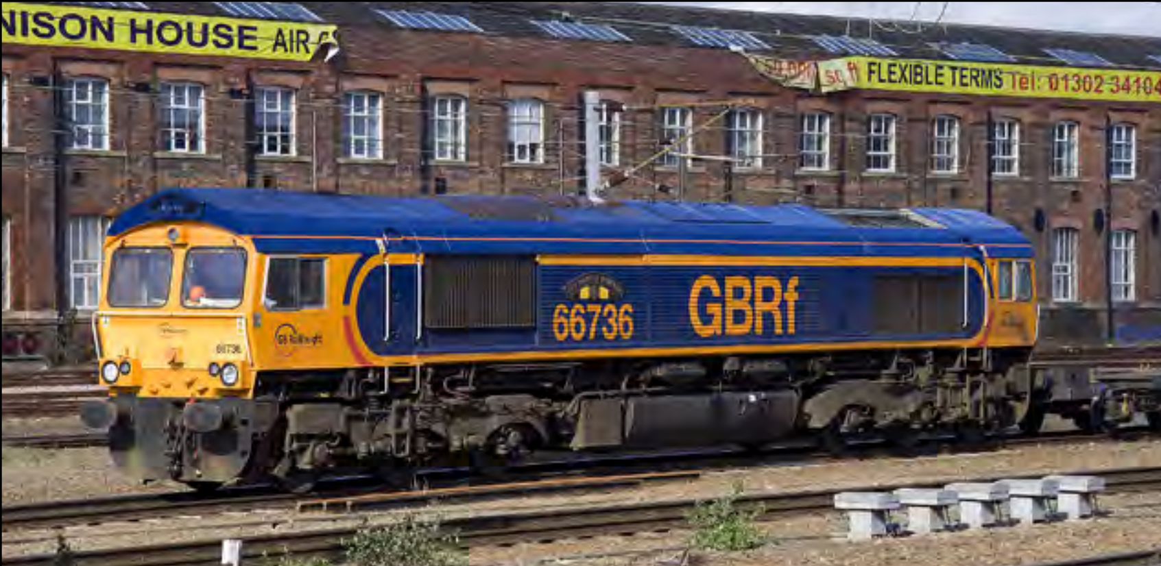
Above: Class 66 736 "Wolverhampton Wanderers" heads through Doncaster on March 10th with a couple of empty flats from Selby.