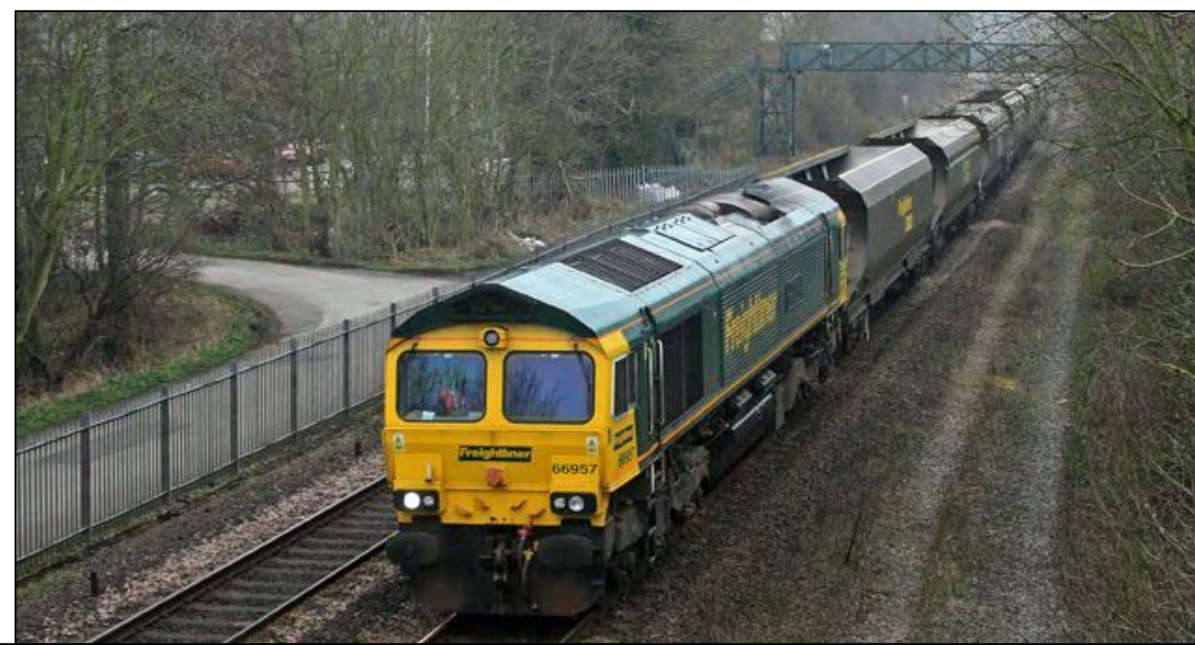
Below: Class 66 957 works a short train of coal hoppers on 4Z03 Derby Etches Park - Hunslet through Little Eaton on March 15th. Stuart Hillis