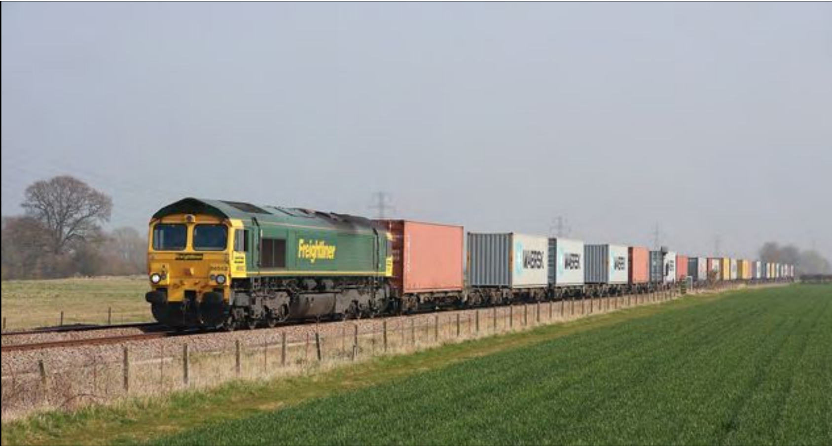
Above: Class 66 562 works the diverted liner 4M87 09.20 Felixstowe - Basford Hall through Uffington on March 24th.