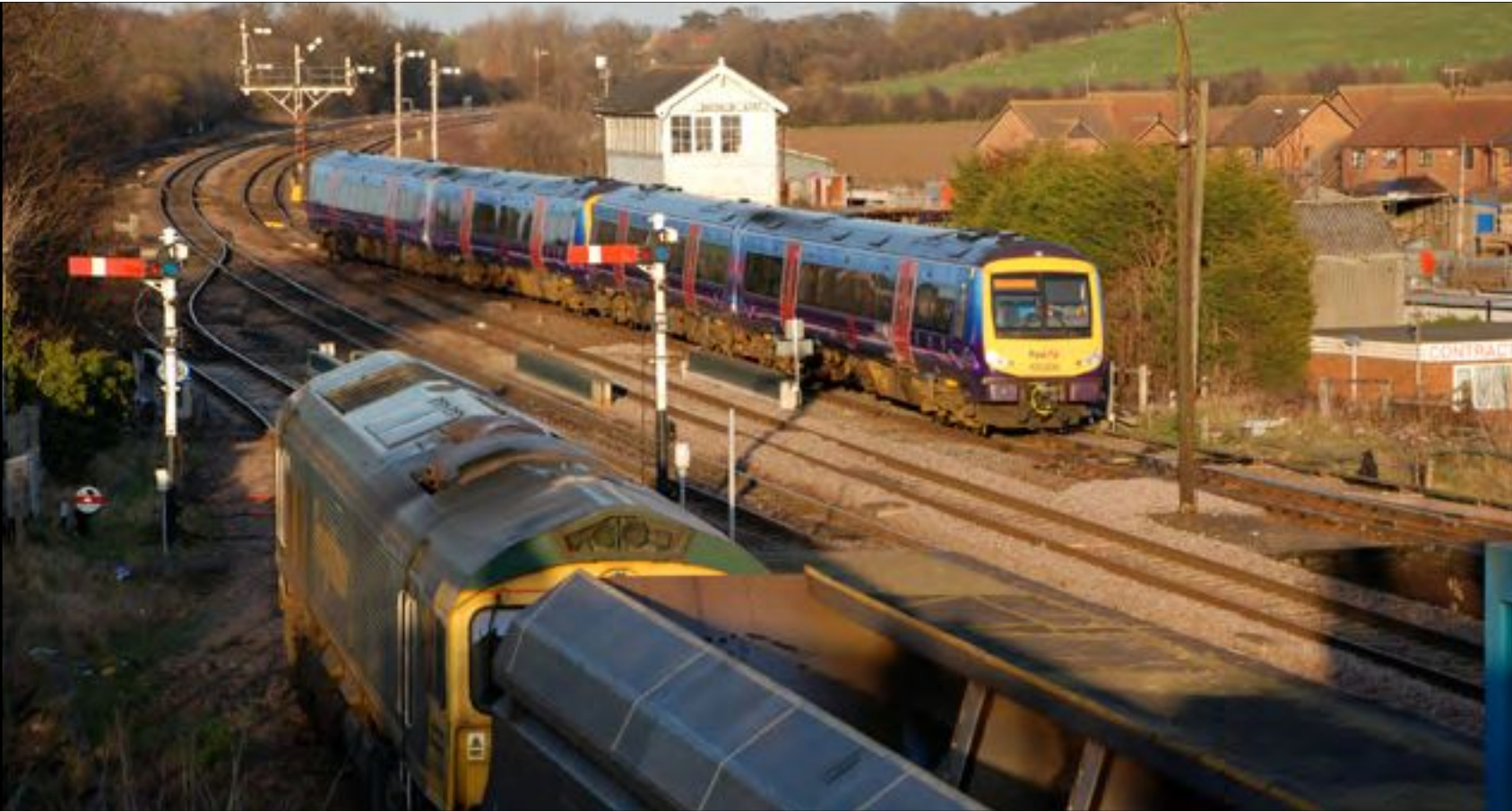
Above: On March 3rd, a Cleethorpes - Manchester TPE, formed of Class 170 306 and 170 304, crosses over onto the Down Slow as 66 604 awaits the road to Immingham on the Up Slow at Barnetby. Steve Thompson