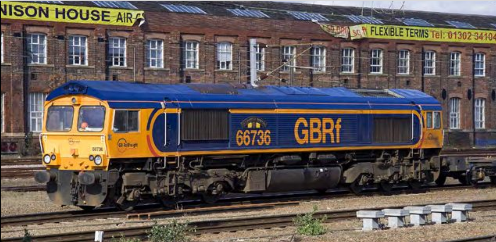
Above: Class 66 736 “Wolverhampton Wanderers” heads through Doncaster on March 10th with a couple of empty flats from Selby.