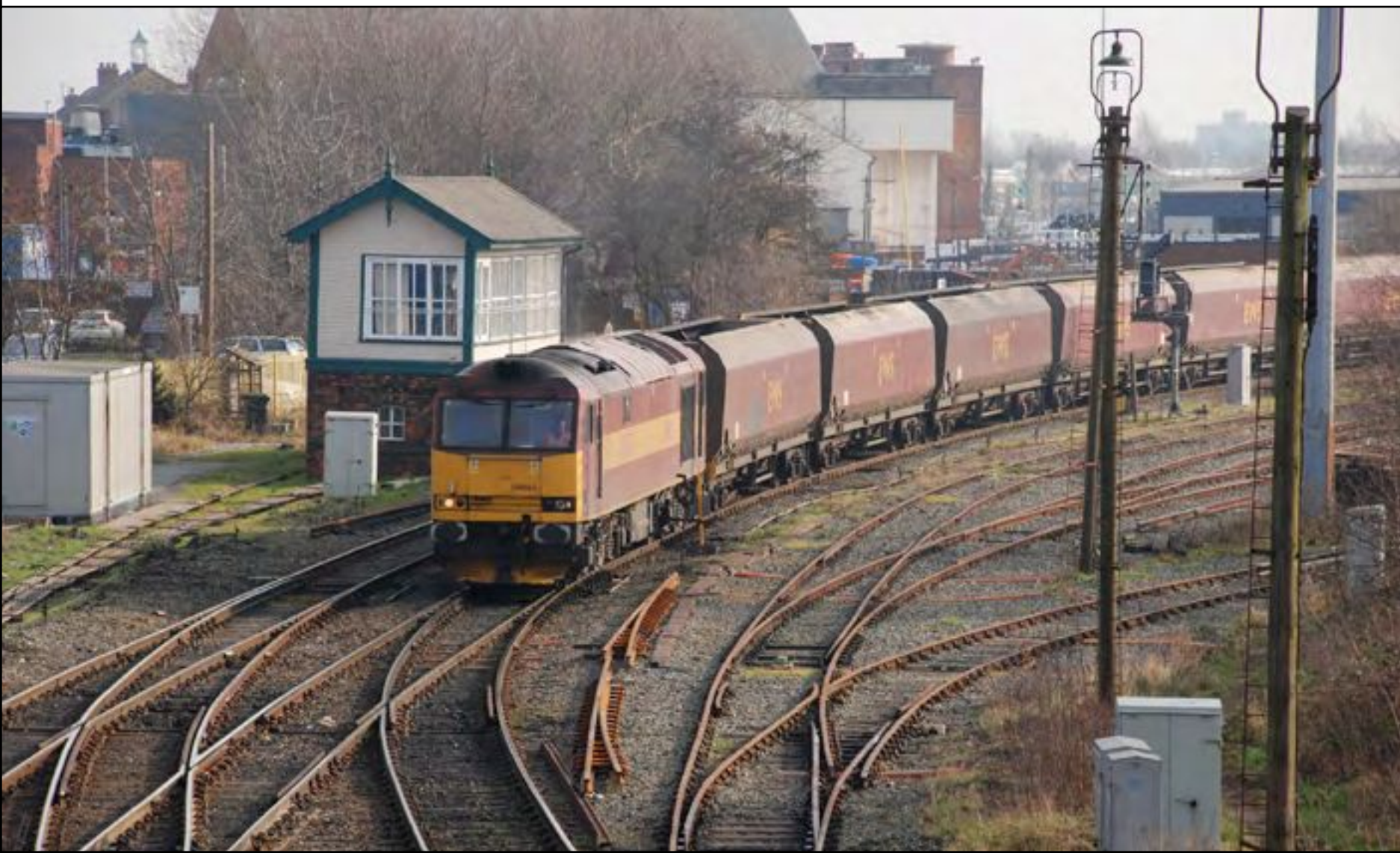
Below: Class 60 079 heads towards Santon FOT with an empty ore working, March 5th.