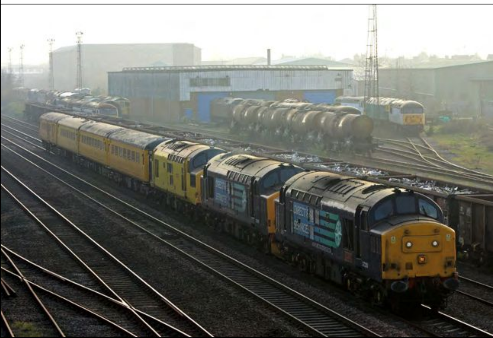
Below: On March 12th, 1Q06 Derby RTC - Exeter test train with DBSO No. 9708 leading and Class 31 285 on rear, passes Burton-on-Trent. Stuart Hillis