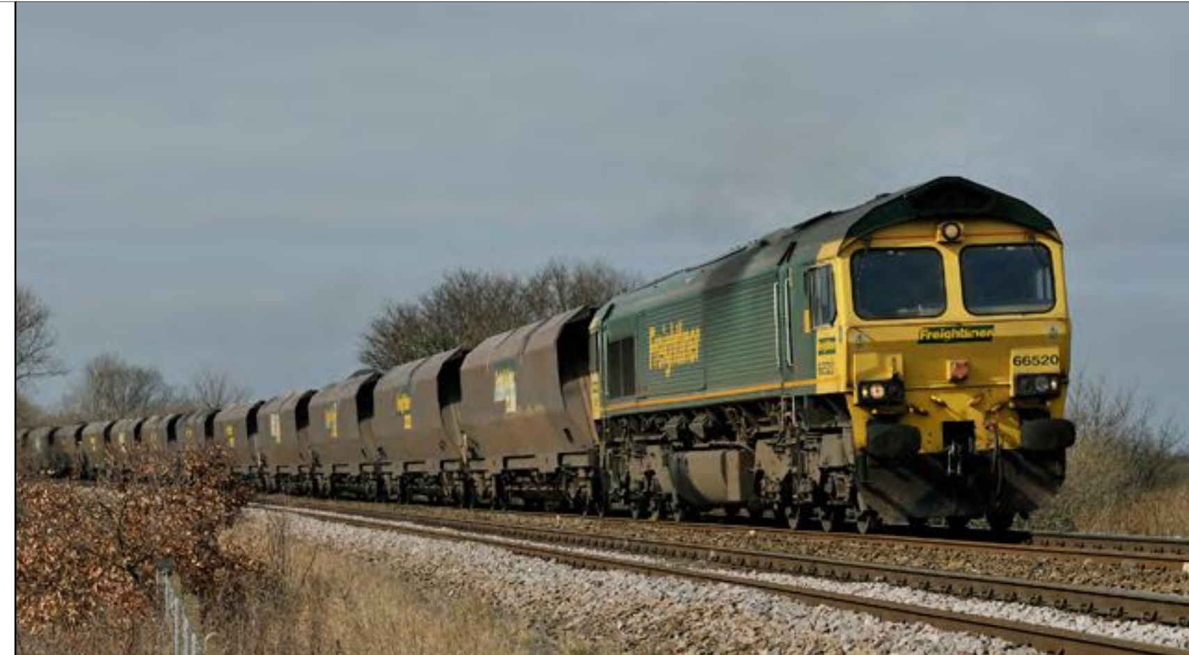
Above: Freightliner's Class 66 520 heads an MGR through Wombridge Crossing on March 8th.