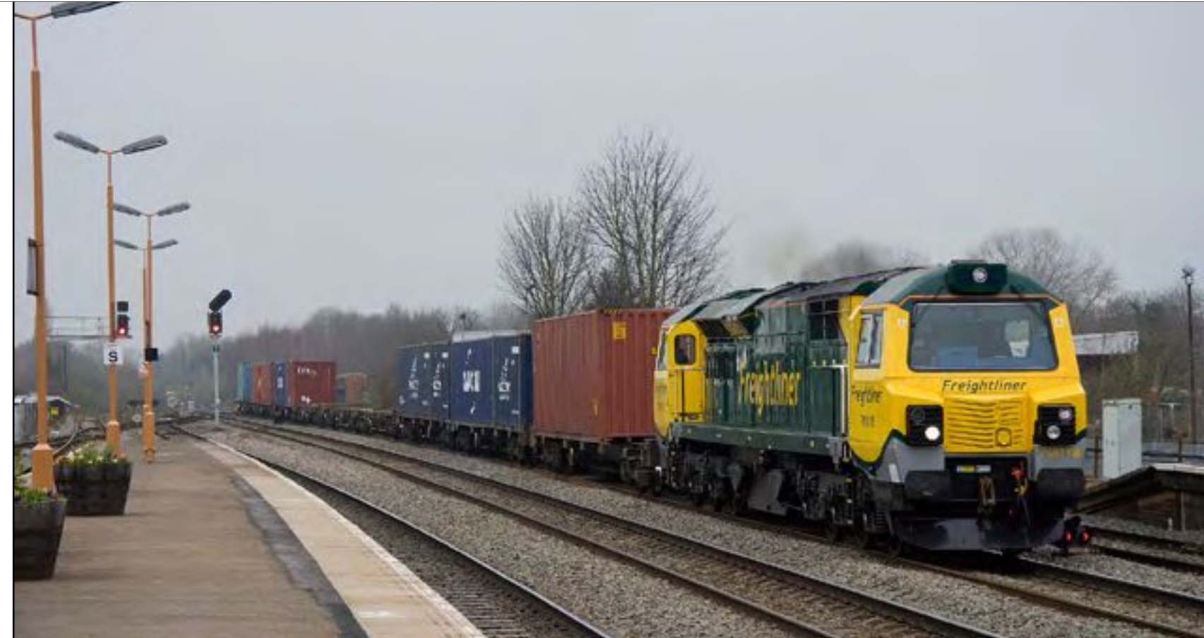
Above: Class 70 018 heads south through Leamington Spa on March 13th. Just a couple of weeks later this loco would suffer a serious fire near Basingstoke.