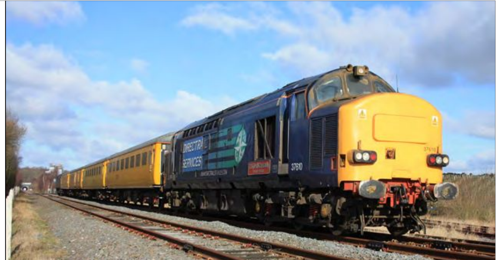
Above: Class 37 610 “T.S.(Ted)Cassady” and with 37 606 on the rear of 1Q13 test train Derby RTC - Knighton Jct. nears Moira West box on the Burton - Coalville branch, March 5th.