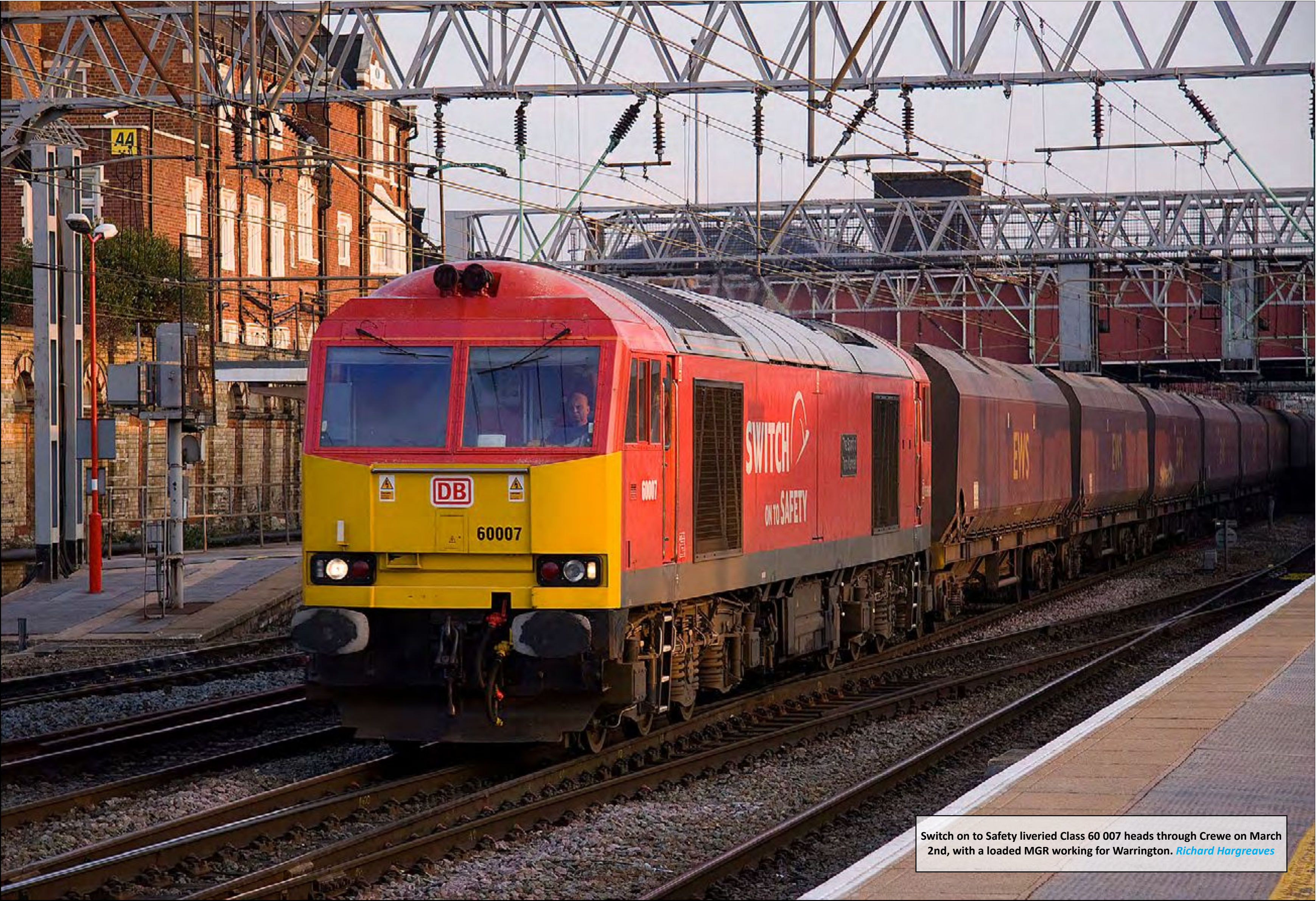
Switch on to Safety liveried Class 60 007 heads through Crewe on March 2nd, with a loaded MGR working for Warrington.