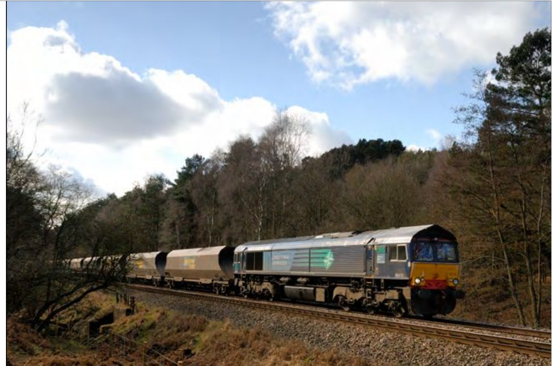
Top Right: Still in its DRS livery but now in use by Freightliner, Class 66 415 takes the 6M55 Portbury Coal Terminal - Rugeley Power Station laden coal train through Furnace Coppice, Staffordshire on March 5th. Gary S. Smith