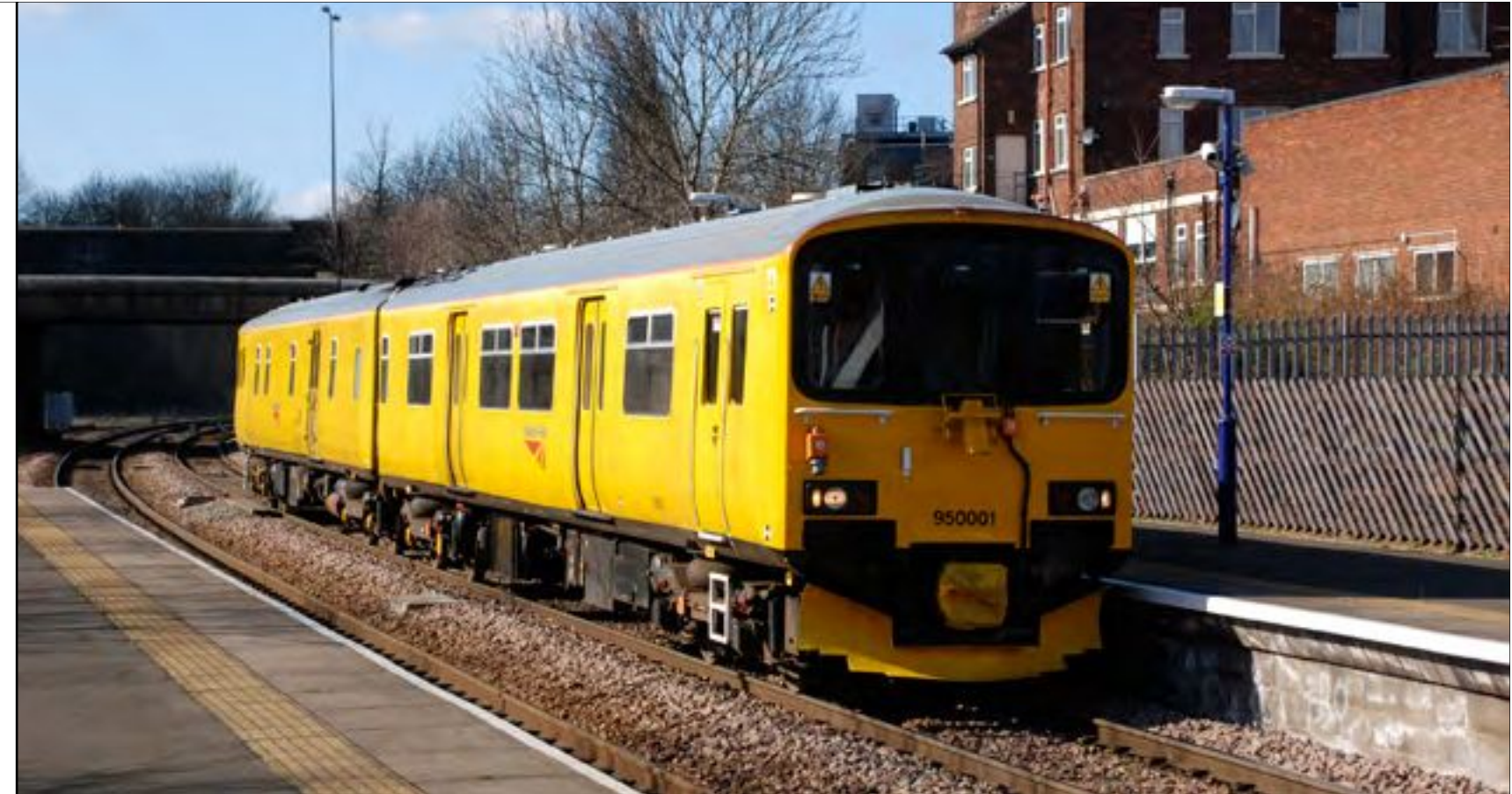
Above: On March 7th, the Network Rail Class 150 worked 2Q08 Derby to Barnetby, Roxby etc, pictured here on it's second "leg" out of Doncaster, heading for Santon Foreign Ore Jct. and Roxby.