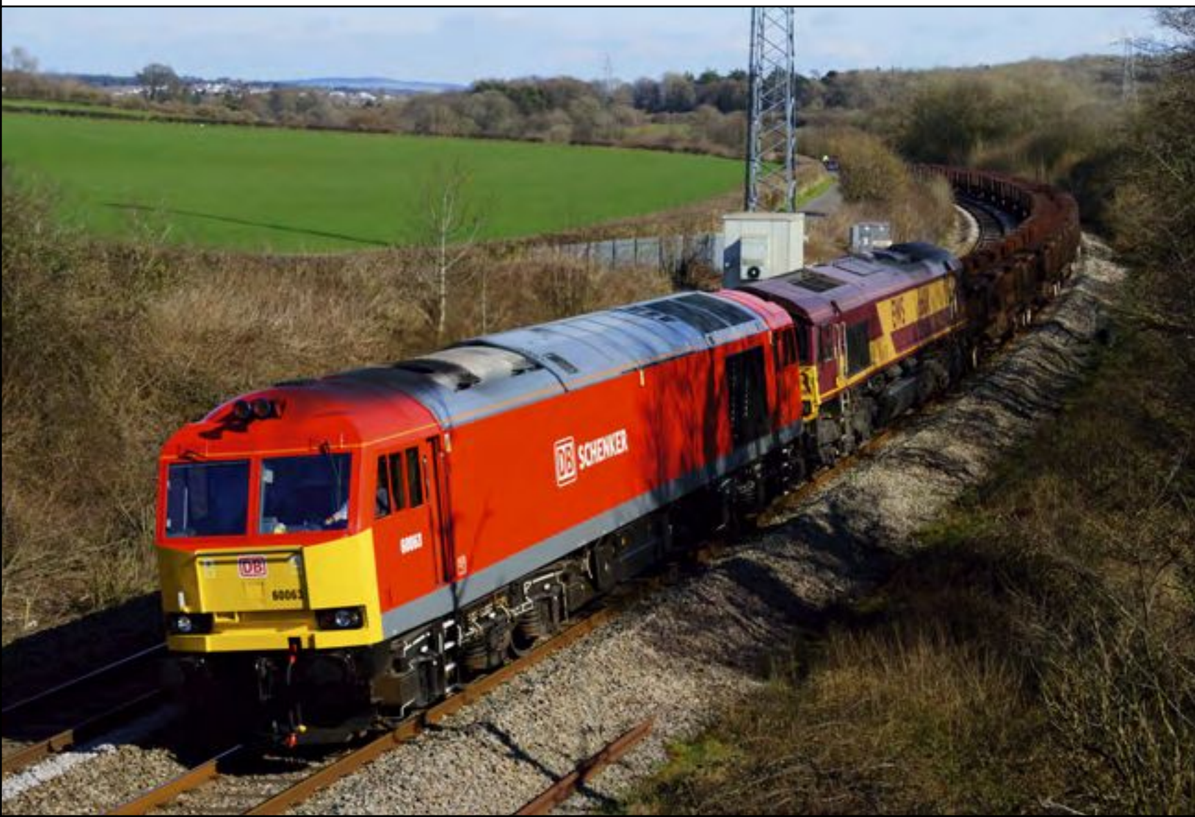
Bottom Left: Class 60 063 and a dead Class 66 011 are pictured passing Llangewydd on March 18th with the 6B05 Llanwern - Margam.