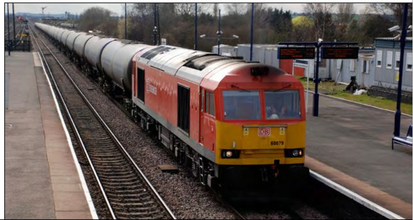
Below: Class 60 079 passes through Barnetby with the 6E54 Kingsbury - Humber Oil Refinery discharged tank cars.