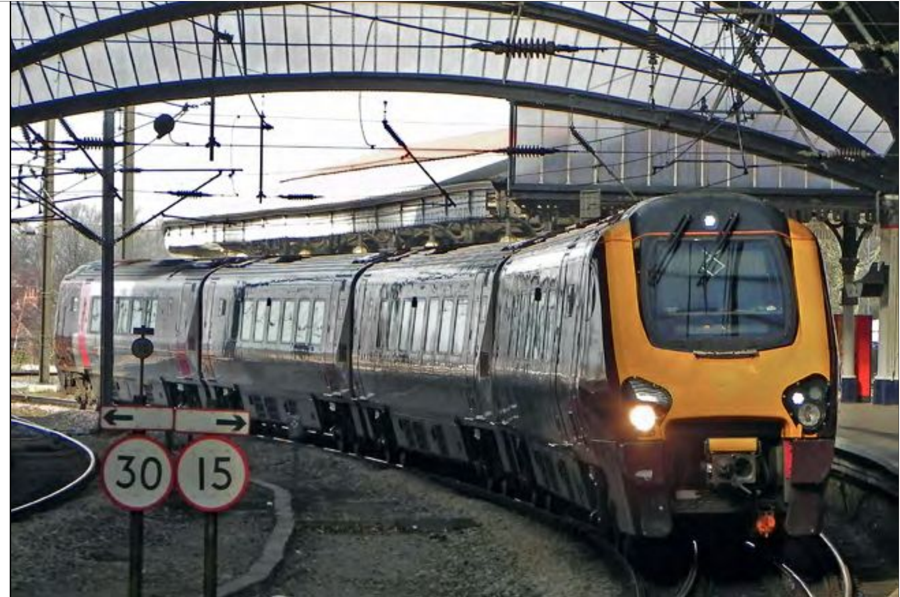
Top Right: CrossCountry Class 220 023 arrives into York on March 3rd with the 13:34 1V89 Newcastle to Reading service.