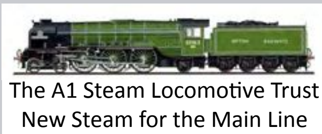
The A1 Steam Locomotive Trust New Steam for the Main Line