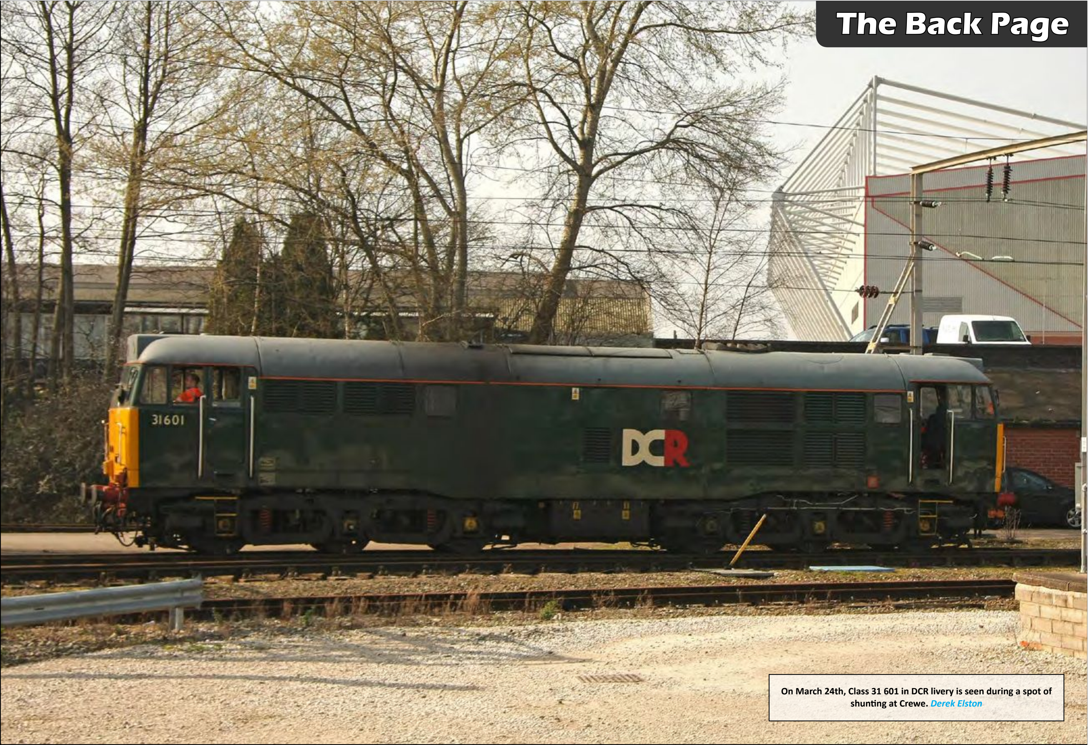
On March 24th, Class 31 601 in DCR livery is seen during a spot of shunting at Crewe. Derek Elston