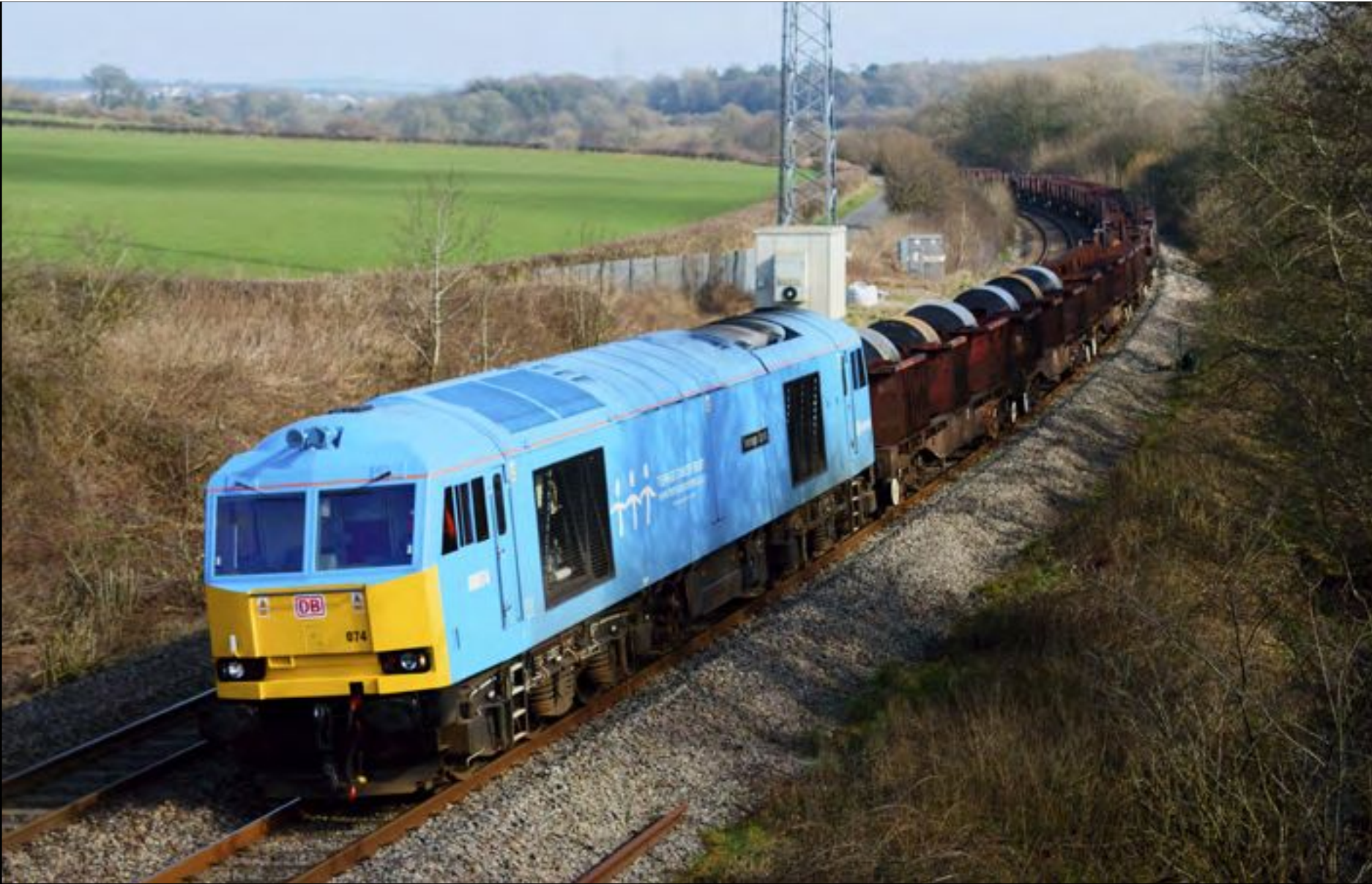
Top Left: On March 11th, Class 60 074 passes Llangewydd with the 6H26 Llanwern - Margam running some 169 minutes early.