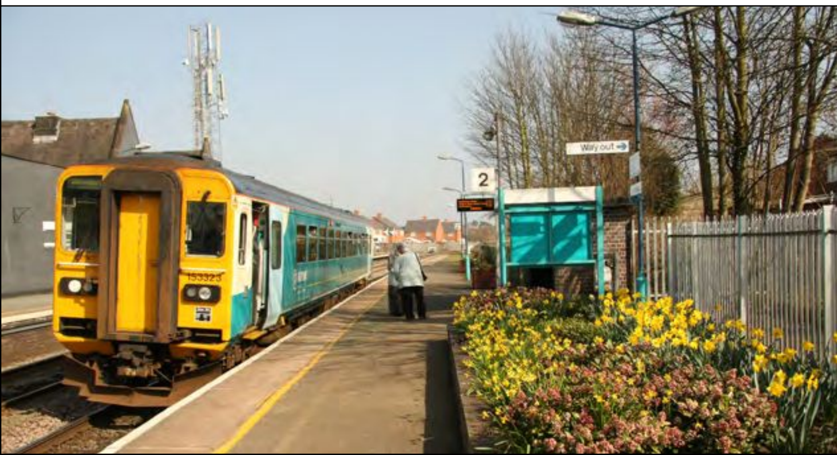
Below: On March 24th, Class 153 323 pauses at Nantwich with the late running 13.20 departure from Crewe to Shrewsbury. Derek Elston