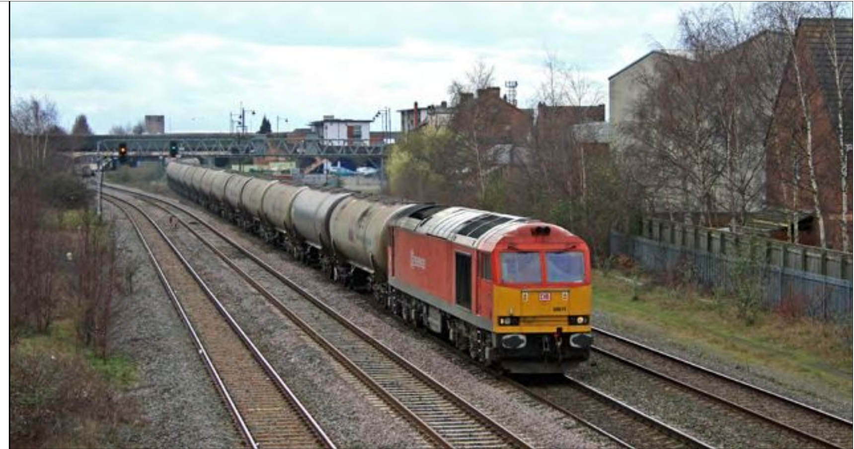
Above: Class 60 011 is seen working the 6E41 Westerleigh - Lindsey empty tanks through a very dull Burton-on-Trent, March 17th. Stuart Hillis