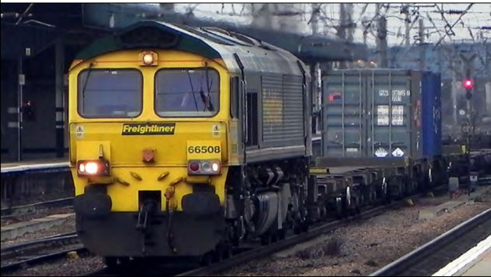
Below: Class 66508 heads the 4L87 Leeds to Felixstowe through Doncaster on February 29th.