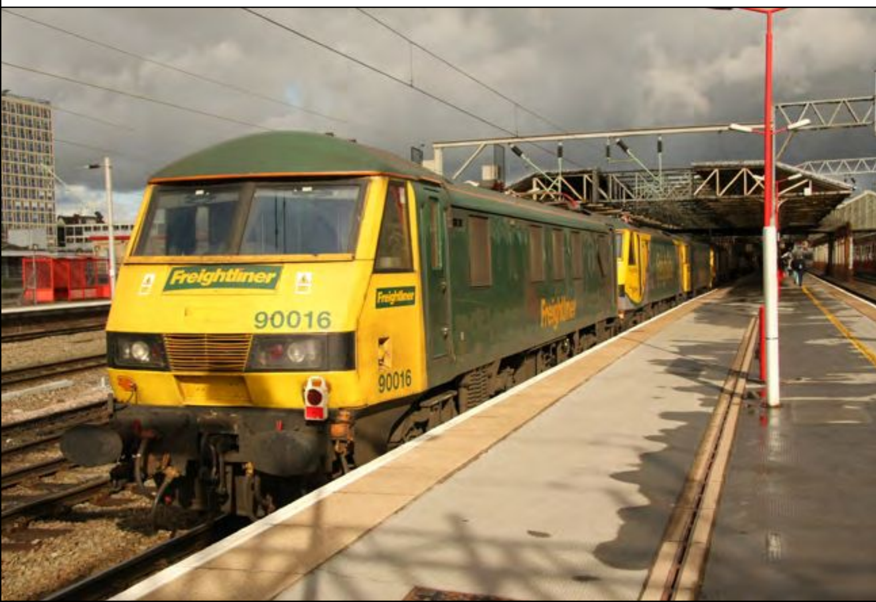
Bottom Left: Class 90 016, 90 049, 86 614 and 66 517 arrive into Crewe's Platform 7 working a light engine move from Basford Hall to the LNWR depot, March 17th. Derek Elston