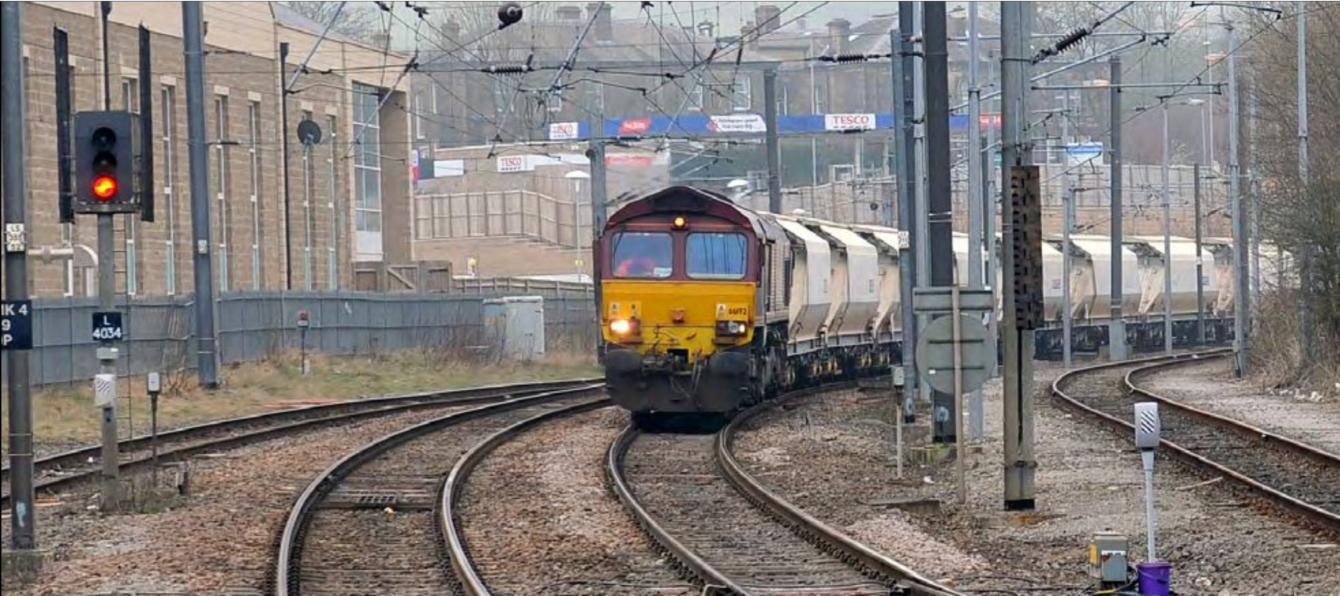
Left: Class 66 192 wends its way into Skipton for a crew change with 6D72 Hull to Rylstone on March 15th.