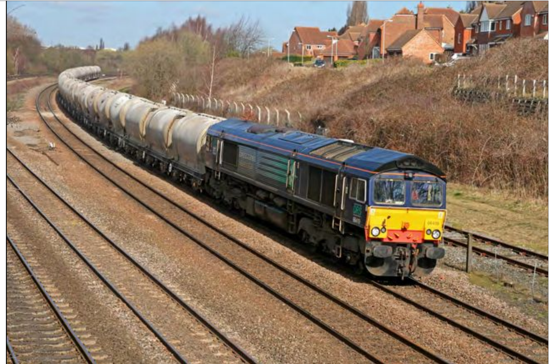
Top Right: Another ex DRS loco that is currently working for Freightliner is Class 66 419, seen here seen on a cement train at Headlands Bridge, Kettering.