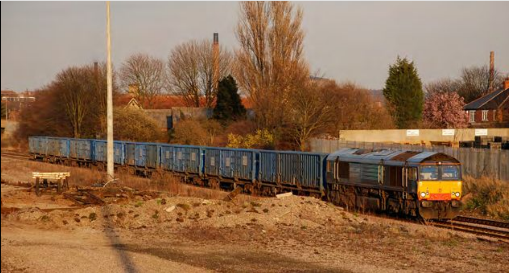
Above: On March 19th, former DRS Class 66 415 found itself on 6M06 Roxby- Bredbury. It is seen soaking up the last of the sun on the outward line before sailing off into the sunset at Scunthorpe West Jct.