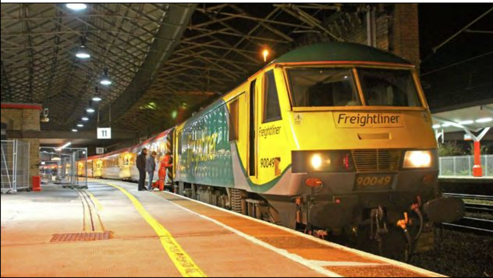
Below: Freightliner Class 90 049 is seen at Crewe with the FO 1K39 London Euston - Crewe on March 9th. Dave Harris