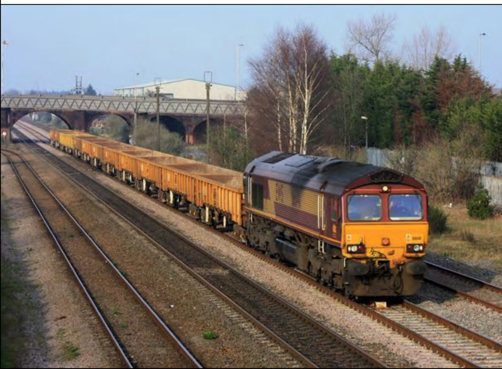
Bottom Right: Another rather smoky Class 66 that we've had a photo of this month, Class 66 137 heads a Hull bound engineering train through Doncaster on March 10th.