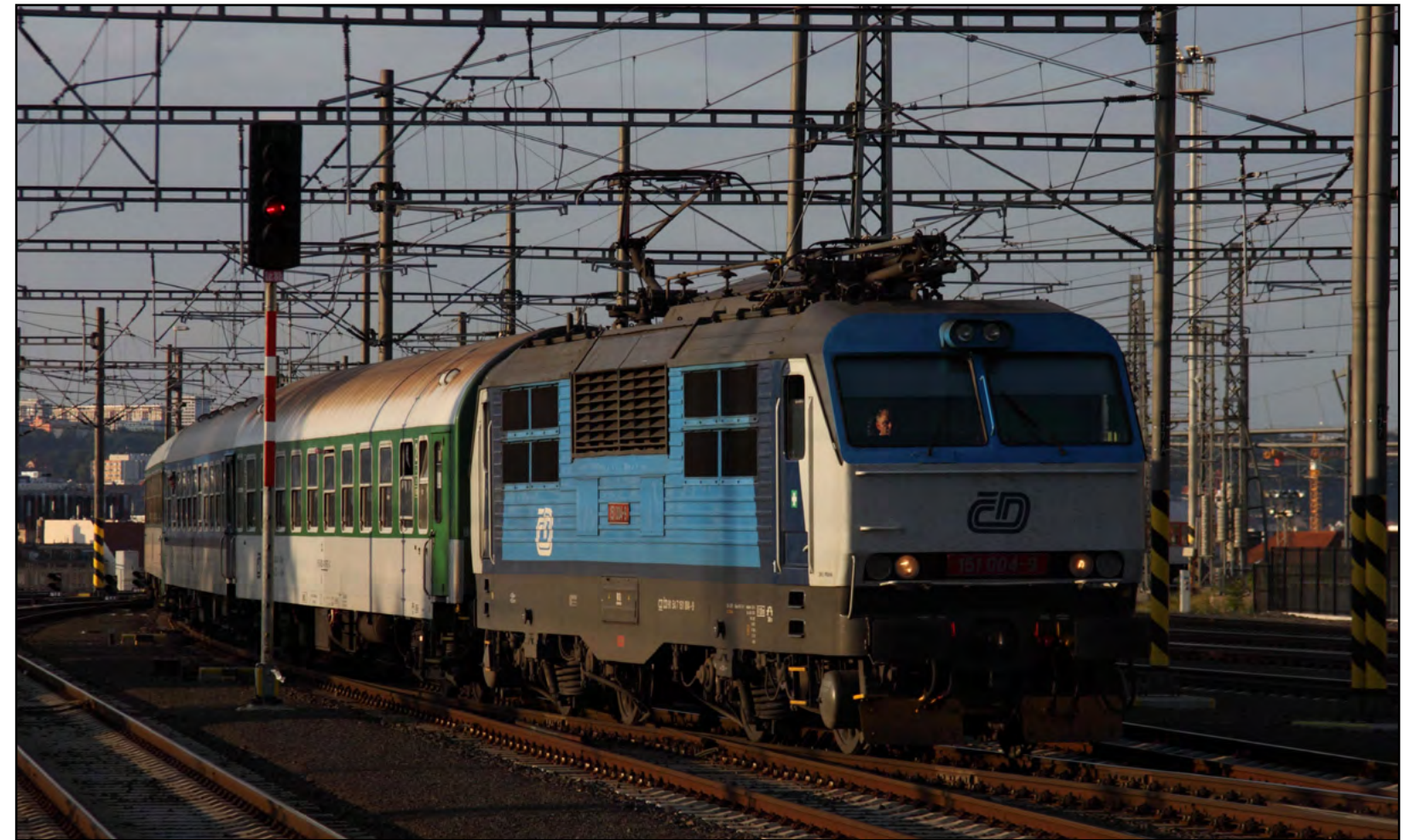
Above: CD Class 151.004-9 arrives into Praha Hlavni Nadrazi on June 26th with a service from Ceska Trebova. Below: DB Class 181.220 is seen upon arrival at Trier on August 11th.