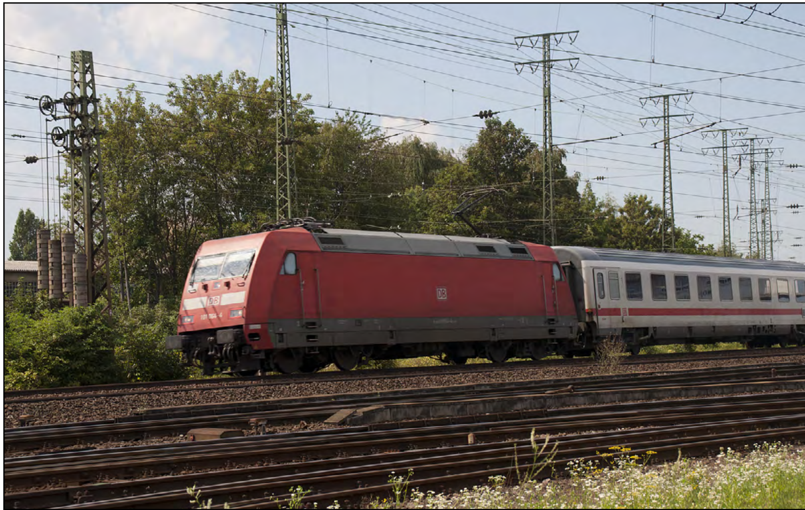
Above: DB Class 101.064-4 is seen heading into Koblenz Hbf. on August 18th. Below: Also at Koblenz Hbf. on August 18th, a pair of DB Regio Class 143's are seen top and tailing a 3 coach service, with Class 143.009-9 leading.