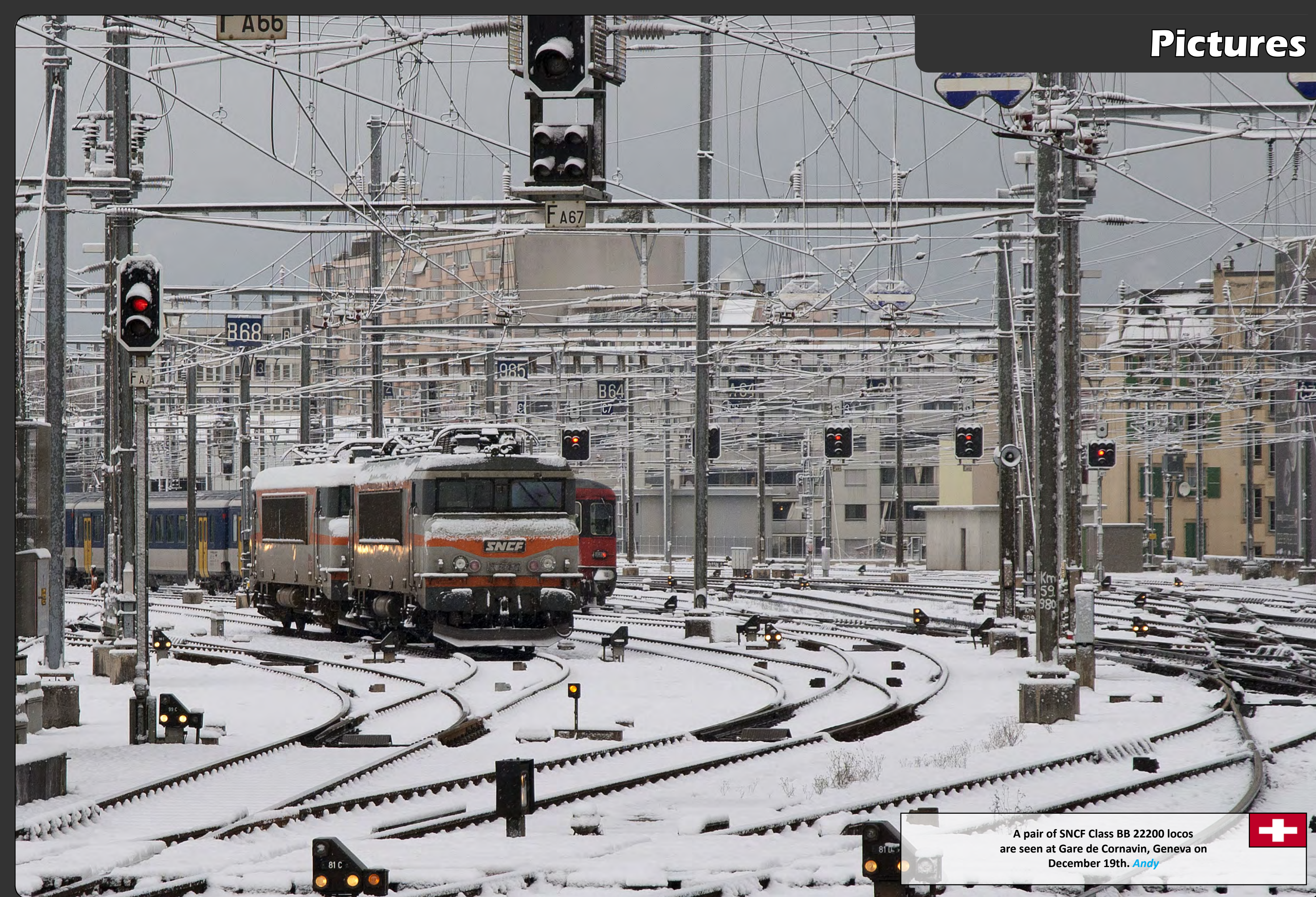
A pair of SNCF Class BB 22200 locos are seen at Gare de Cornavin, Geneva on December 19th. Andy