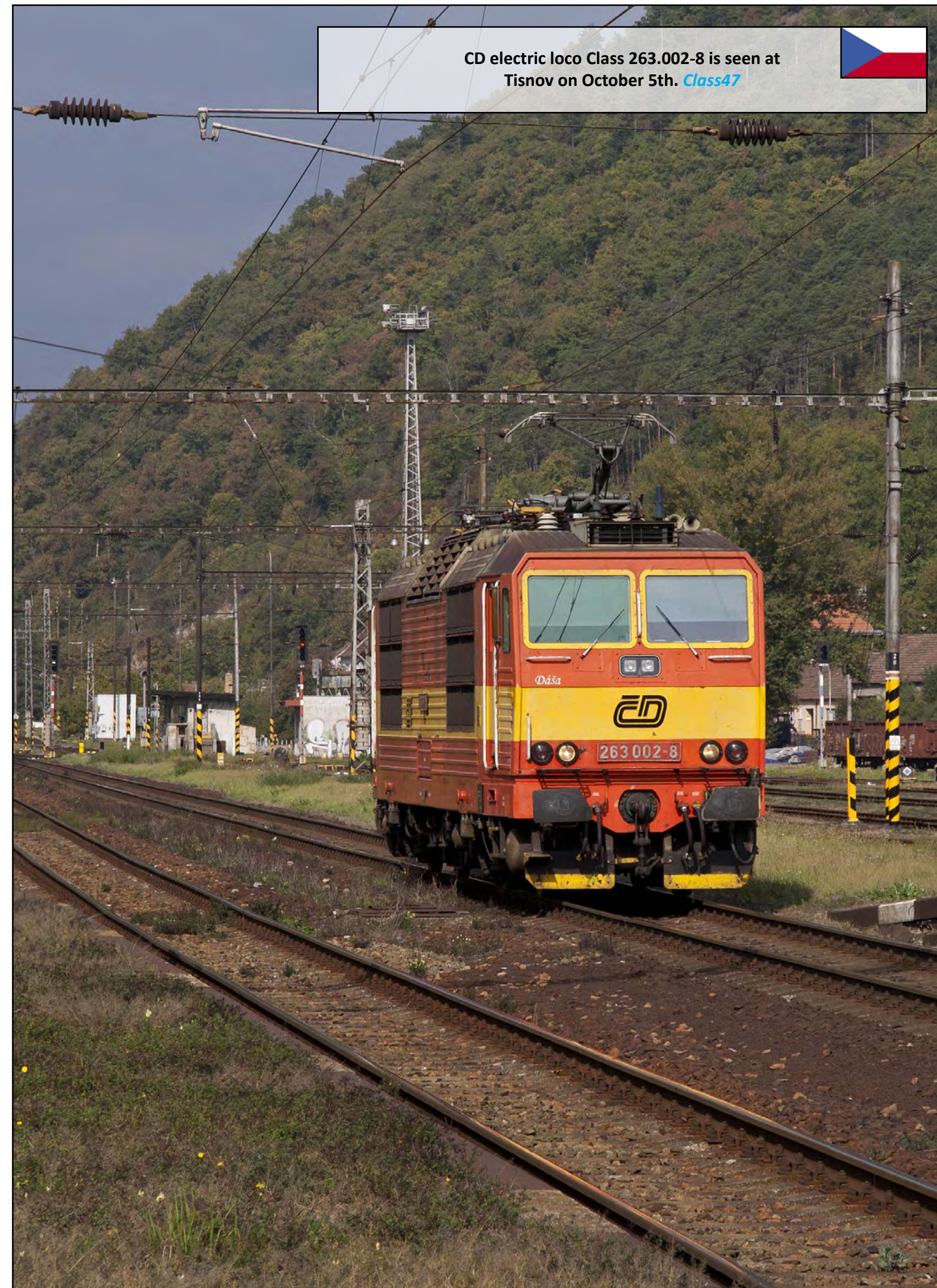
CD electric loco Class 263.002-8 is seen at Tisnov on October 5th.