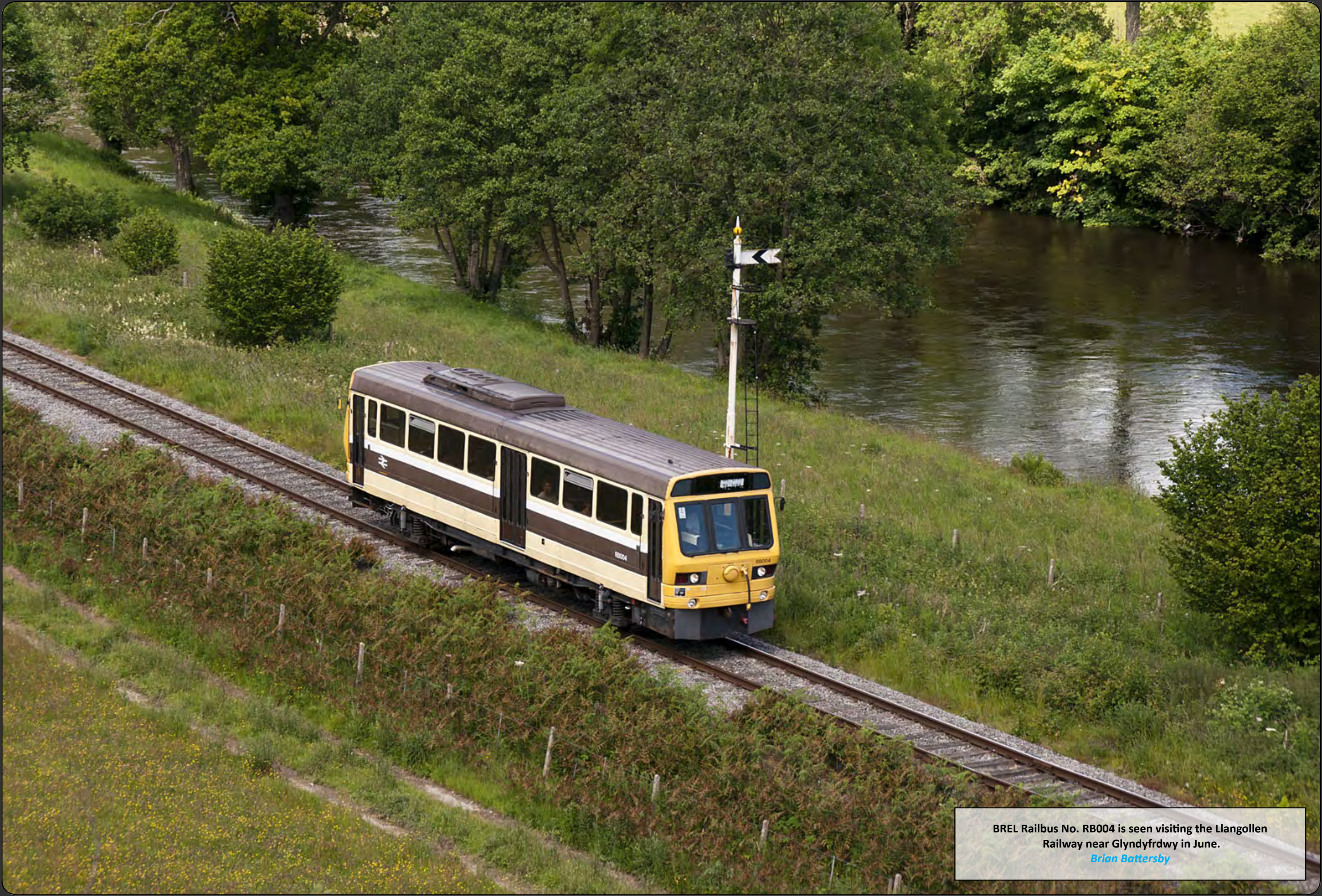
BREL Railbus No. RB004 is seen visiting the Llangollen Railway near Glyndyfrdwy in June. Brian Battersby