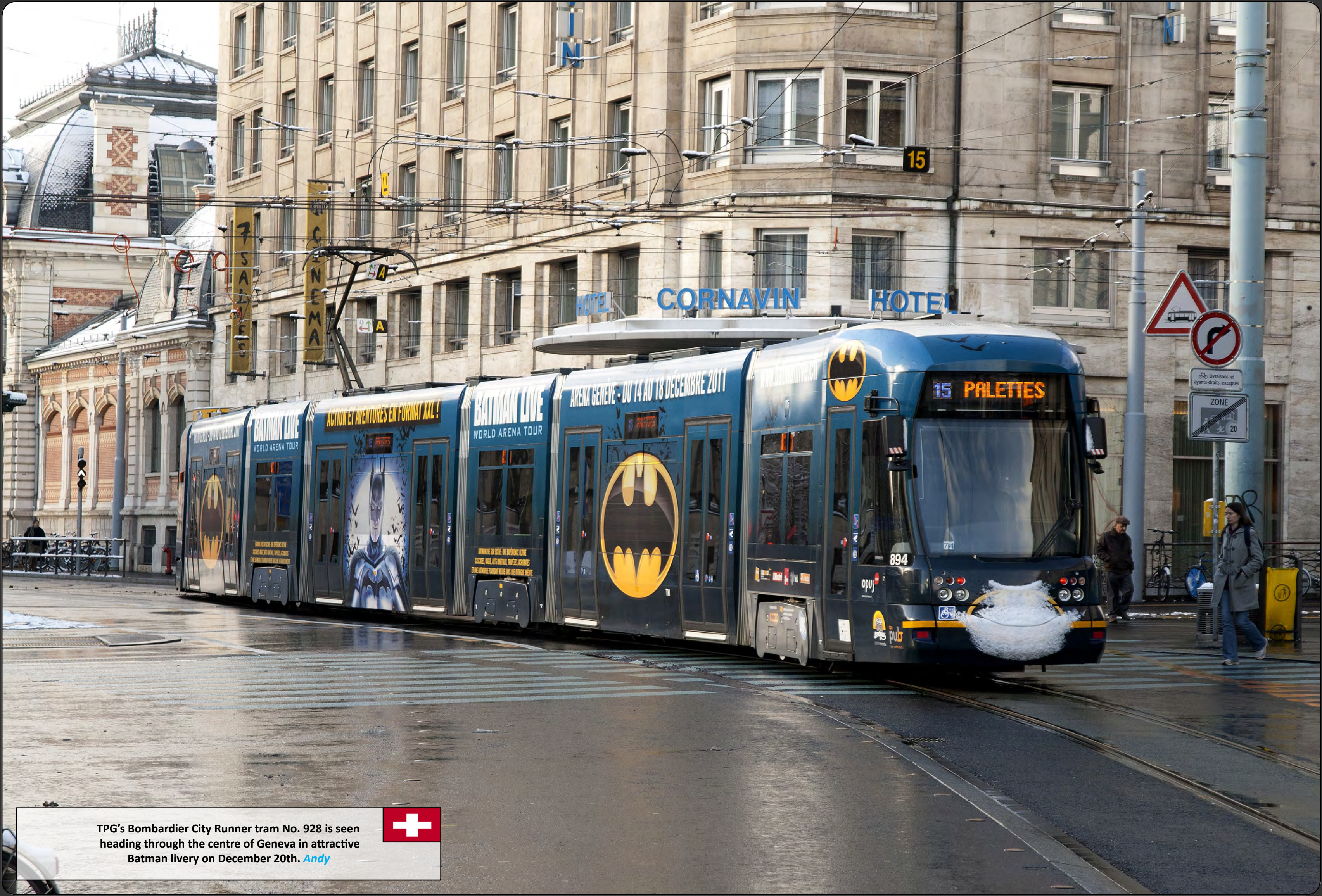
TPG's Bombardier City Runner tram No. 928 is seen heading through the centre of Geneva in attractive Batman livery on December 20th.