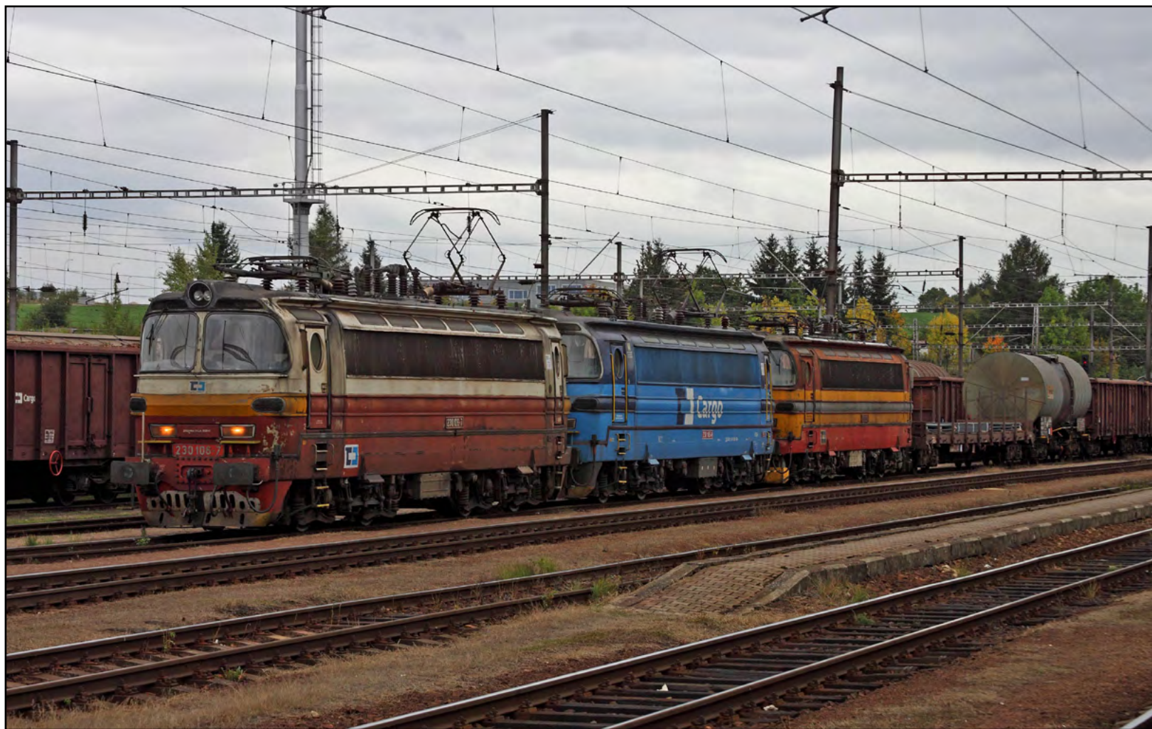
Above: CD Cargo Class 230.106, 230.105 and 230.003 are seen heading through Jihlava on October 4th heading for Havlíčkův Brod. Below: ACTS Nederland Class 66 No. 653-2 (Ex 6618) is seen at Wittlich on August 15th.