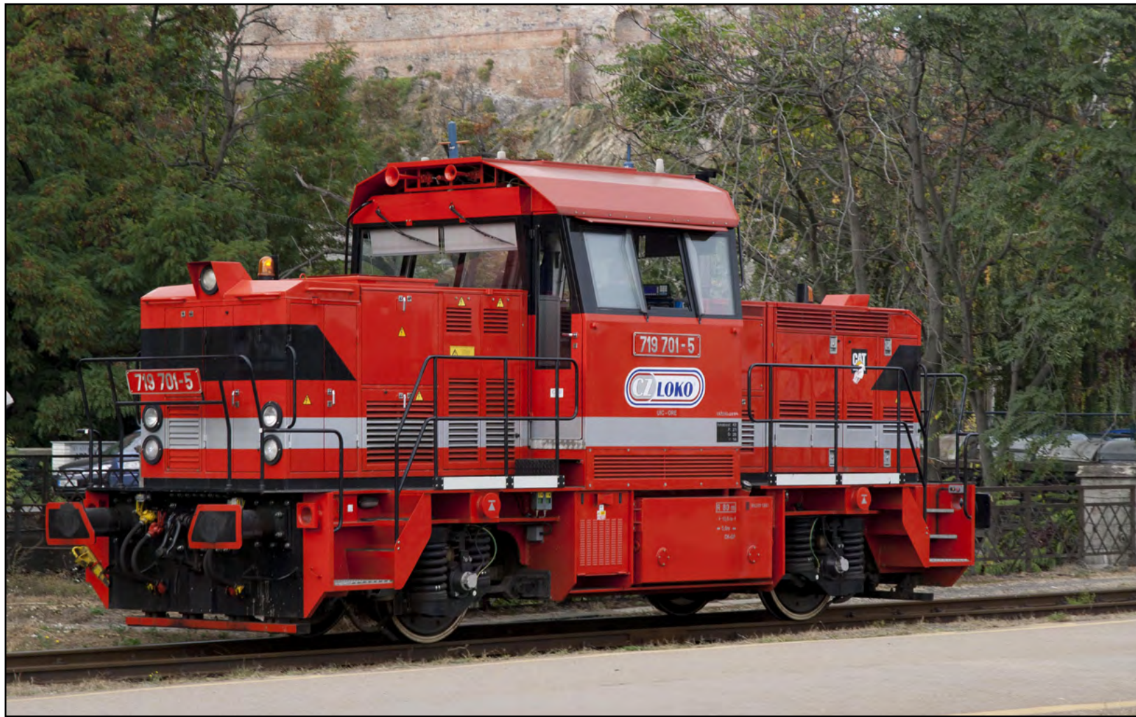
Above: On October 5th, CZ Loko Class 719.701-5 is seen in immaculate condition at Brno. Below: DB Class 101.016-4 is seen stabled at Koblenz on August 15th carrying rather faded Unicef 60 years livery.