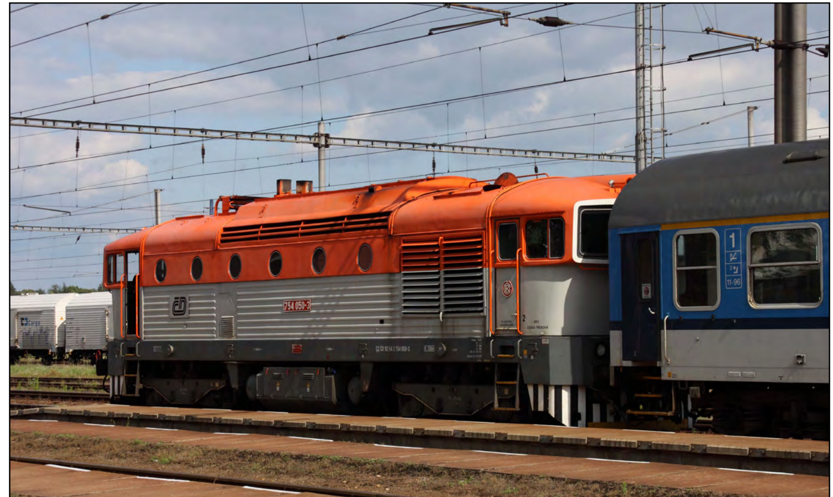
Above: CD Class 754.050-3 is seen at Jaromer with a Hradec Kralove service. Below: HGK (Häfen und Güterverkehr Köln) Class 66 No. DE671 is seen at Koblenz On August 15th.