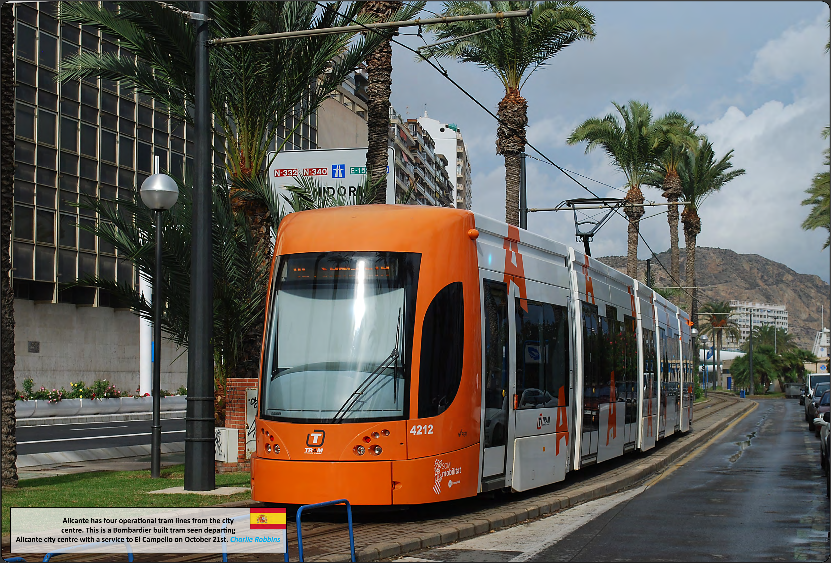
Alicante has four operational tram lines from the city centre. This is a Bombardier built tram seen departing Alicante city centre with a service to El Campello on October 21st.