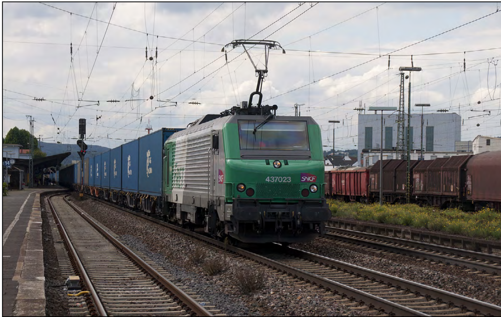
Above: Alstom Prima EL3U/4, No. 437023 operated by SNCF Fret is seen at Neuwied with a container train on August 15th. Brian Battersby Below: A DB working to Koblenz Hbf. is seen at Urmitz Rheinbrücke. Brian Battersby