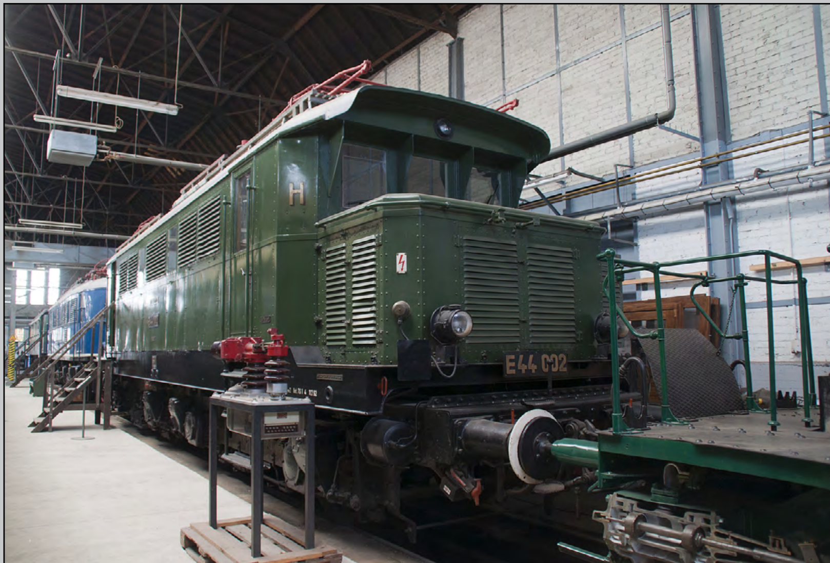
Top Left: Locomotives of the Series E41 were designed to carry light freight and passenger trains. Bottom Left: Deutsche Reichsbahn procured Series E44 locomotives as a universal locomotive for passenger and freight. Top Right: Class 181s were bought by the German Federal Railways for cross-border traffic with Luxembourg and France. Bottom Right: The Class 217 (until 1968 known as Class V162) were bought between 1965 and 1968 and still used today.