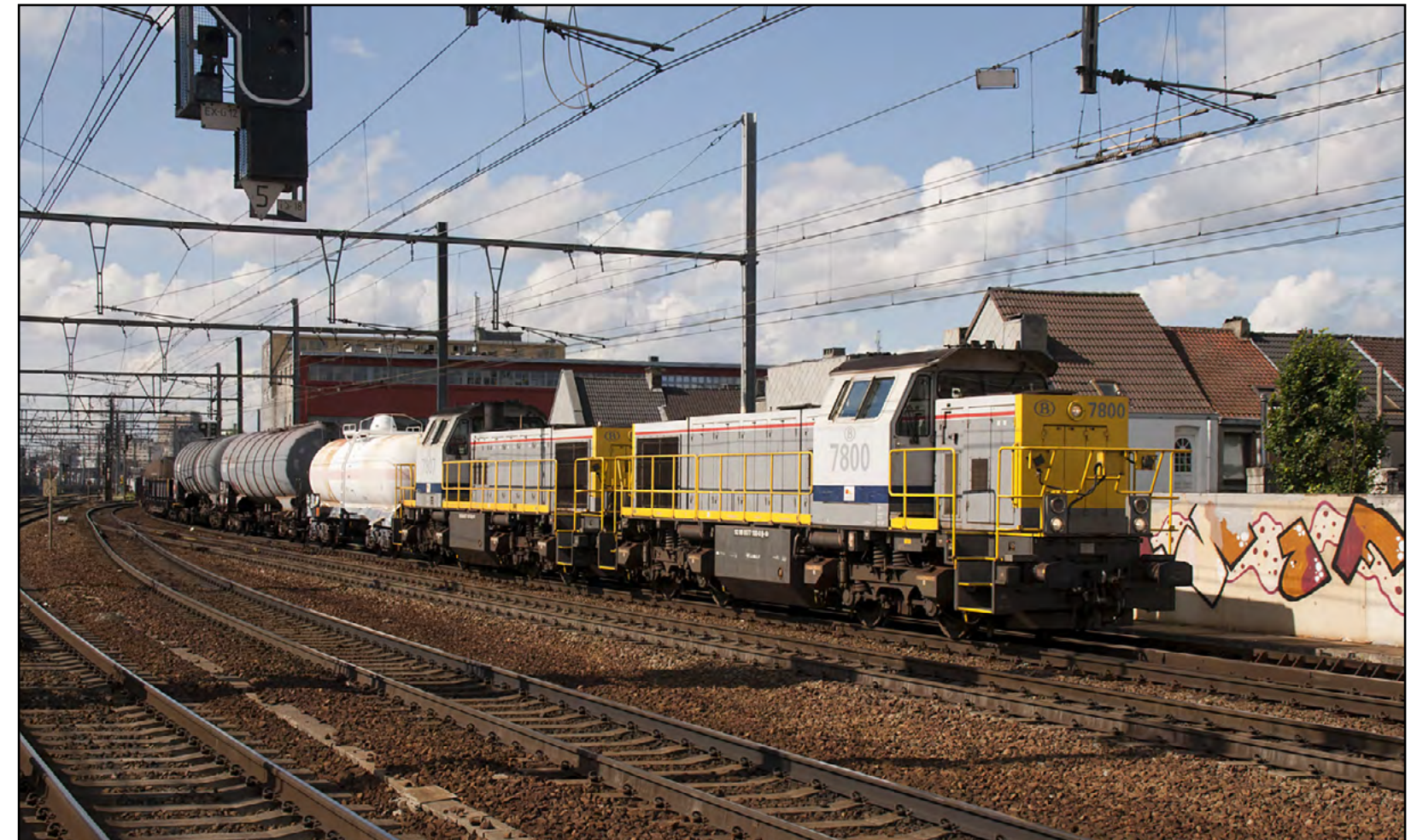
Above: Vossloh HLD77 series shunters, Nos 7800 and 7807 head through Antwerp Berchem on August 8th. Below: On August 15th, DB Class 143.958-7 is seen departing Neuwied with a service to Monchengladbach Hbf.