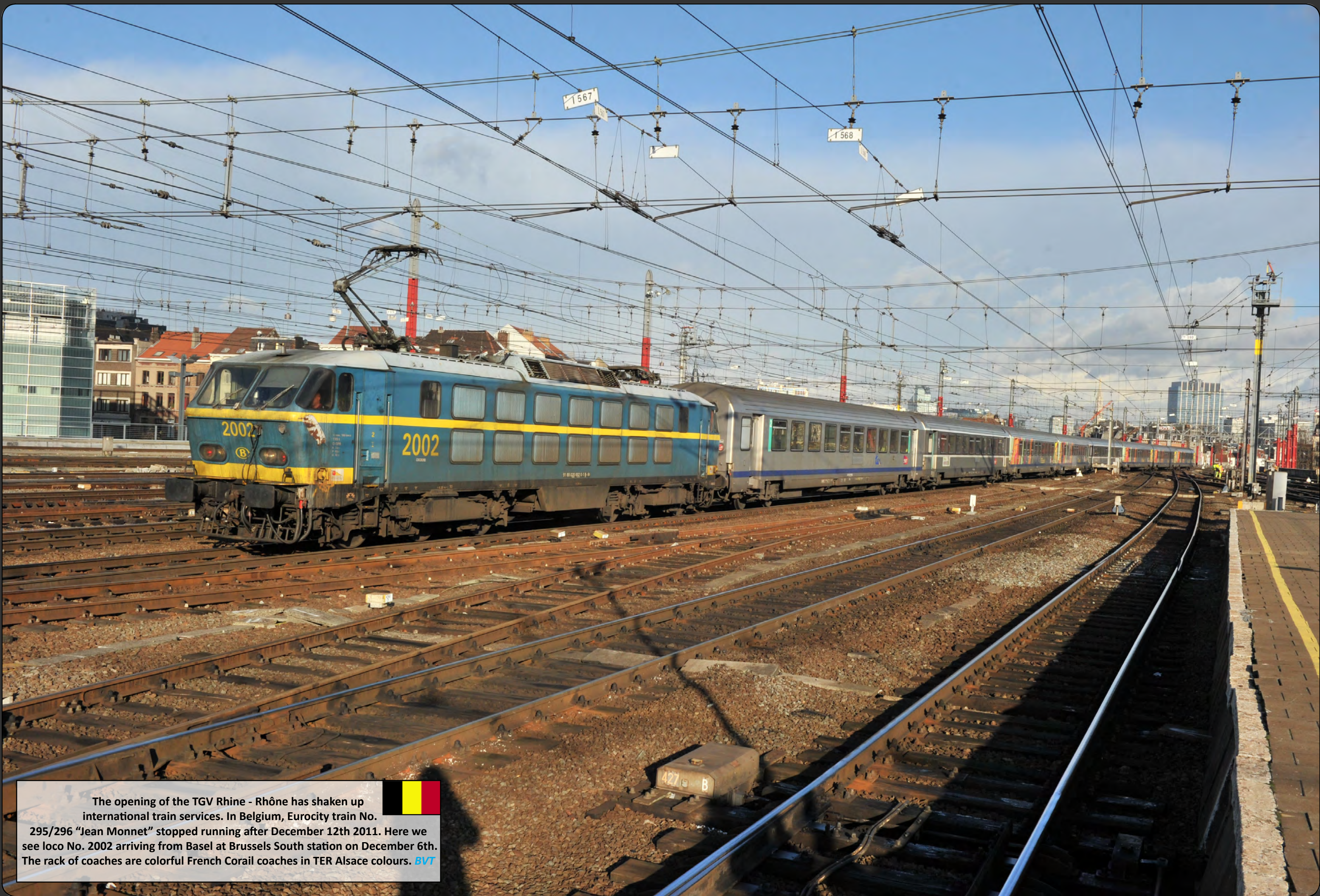
The opening of the TGV Rhine - Rhône has shaken up international train services. In Belgium, Eurocity train No. 295/296 "Jean Monnet" stopped running after December 12th 2011. Here we see loco No. 2002 arriving from Basel at Brussels South station on December 6th. The rack of coaches are colorful French Corail coaches in TER Alsace colours. BVT