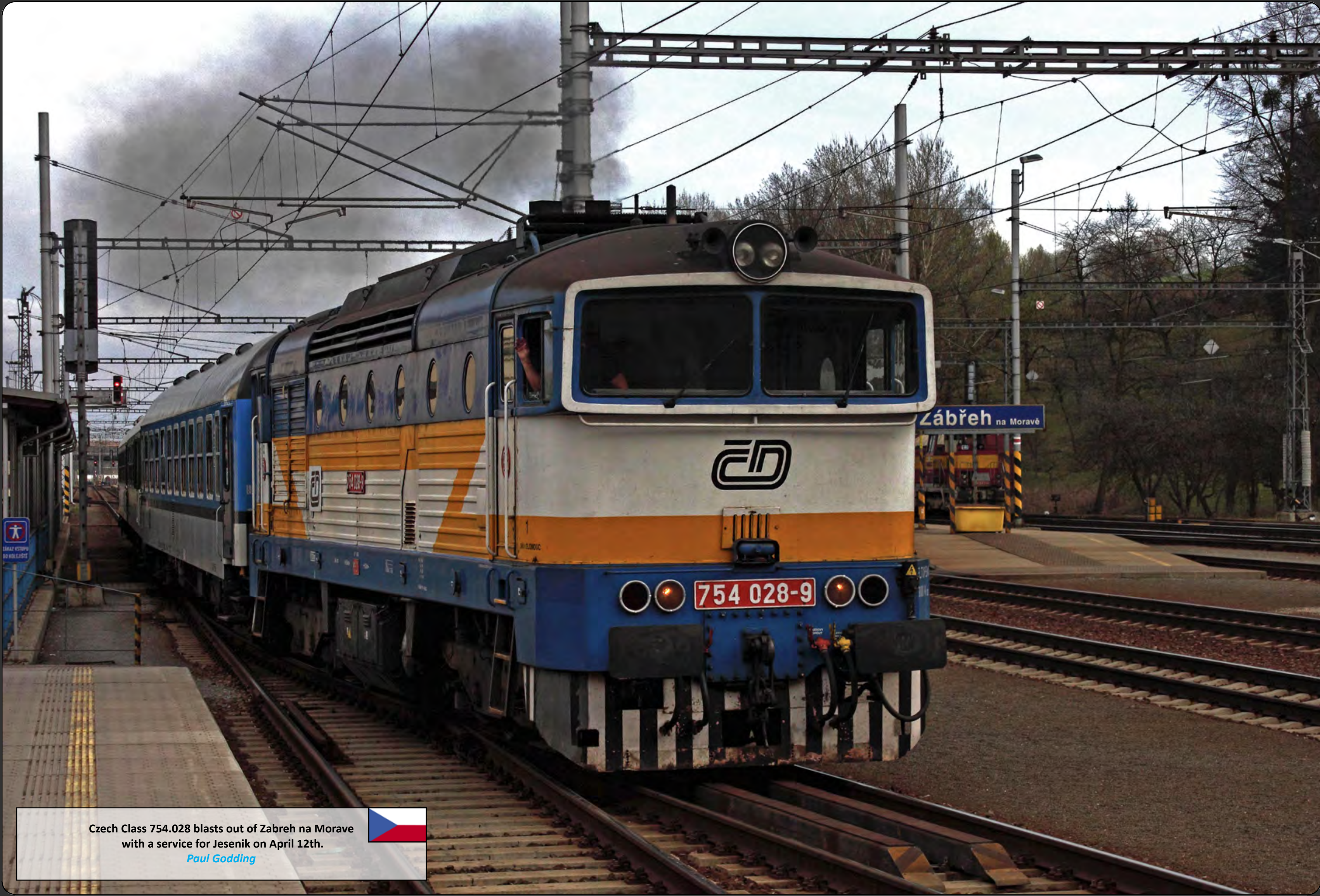
Czech Class 754.028 blasts out of Zábřeh na Moravě with a service for Jeseník on April 12th.