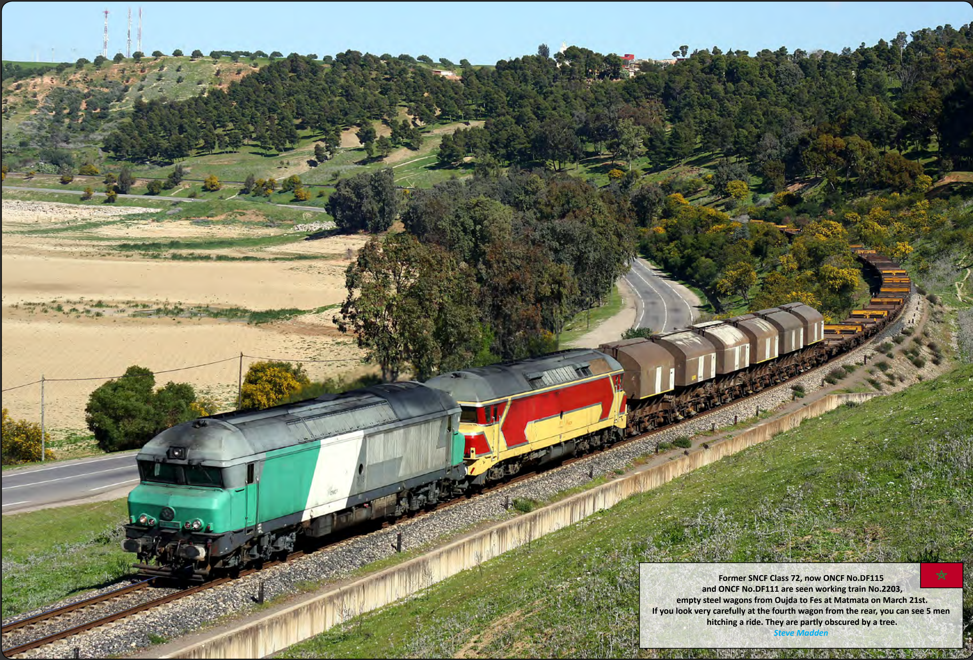
Former SNCF Class 72, now ONCF No.DF115 and ONCF No.DF111 are seen working train No.2203, empty steel wagons from Oujda to Fes at Matmata on March 21st. If you look very carefully at the fourth wagon from the rear, you can see 5 men hitching a ride. They are partly obscured by a tree. Steve Madden