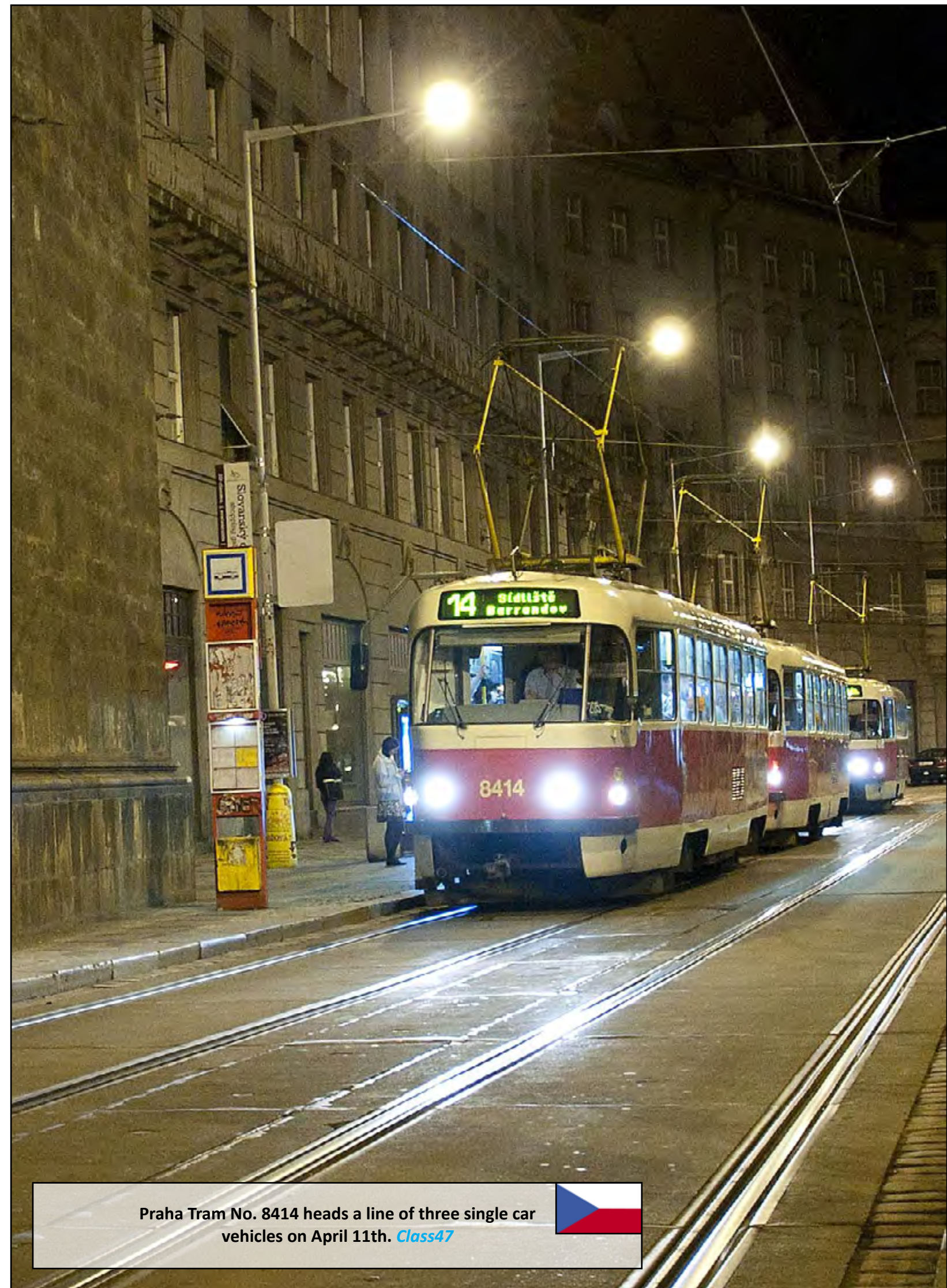
Praha Tram No. 8414 heads a line of three single car vehicles on April 11th. Class47