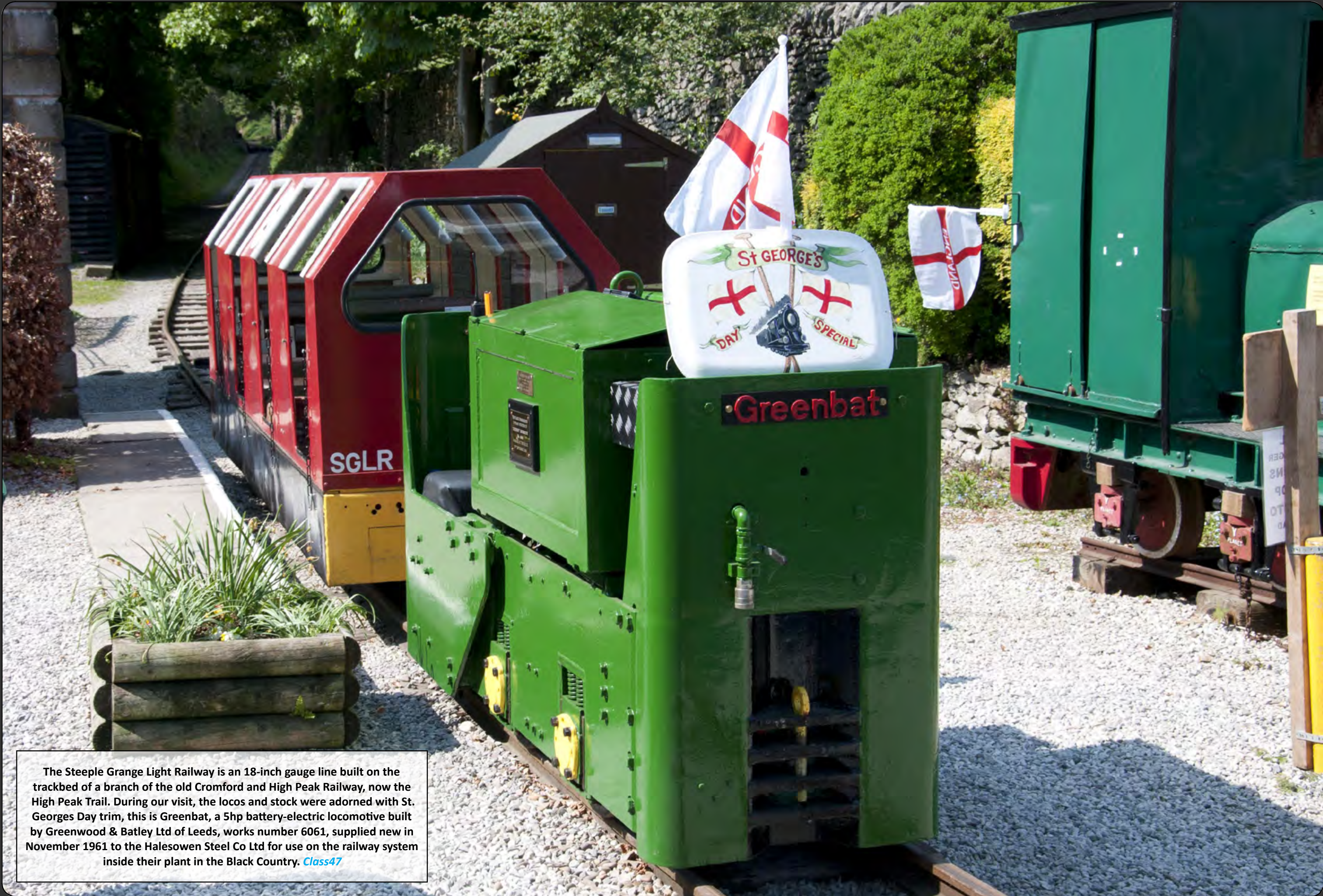
The Steeple Grange Light Railway is an 18-inch gauge line built on the trackbed of a branch of the old Cromford and High Peak Railway, now the High Peak Trail. During our visit, the locos and stock were adorned with St. Georges Day trim, this is Greenbat, a 5hp battery-electric locomotive built by Greenwood & Batley Ltd of Leeds, works number 6061, supplied new in November 1961 to the Halesowen Steel Co Ltd for use on the railway system inside their plant in the Black Country. Class47