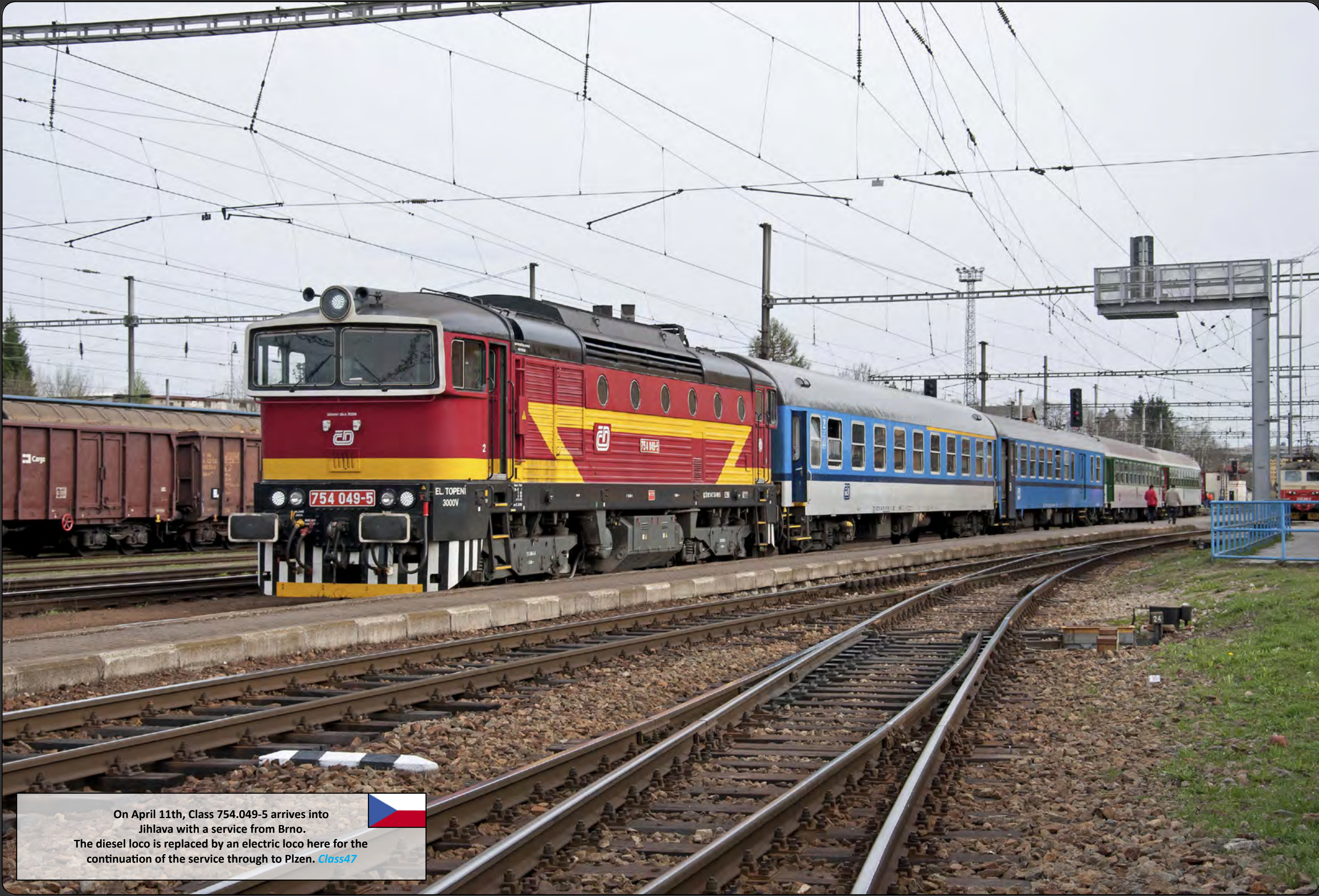
On April 11th, Class 754.049-5 arrives into Jihlava with a service from Brno. The diesel loco is replaced by an electric loco here for the continuation of the service through to Plzen.