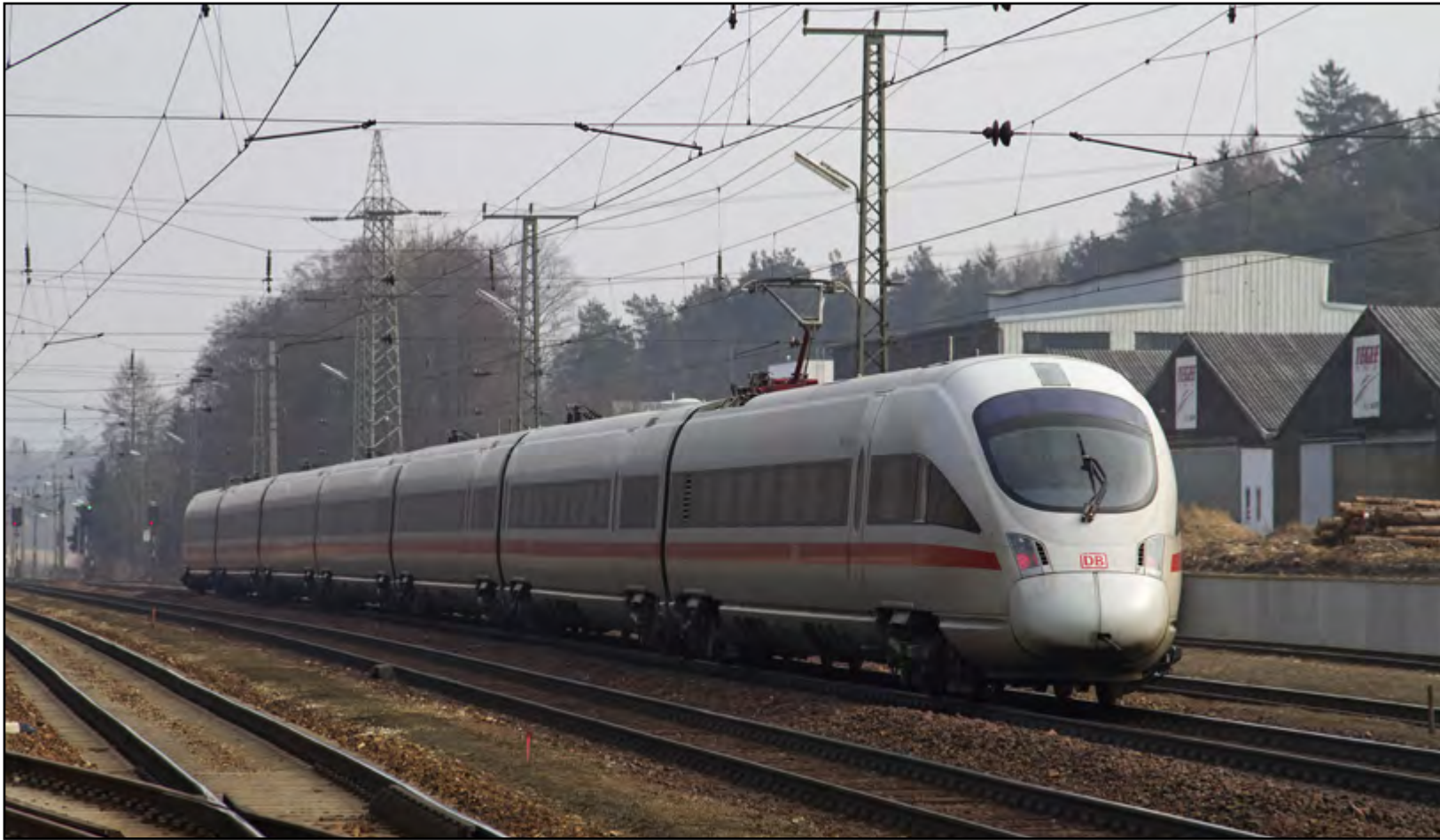
Above: A Class 411 ICE-T unit operated jointly by OBB and DB speeds through Rekawinkel on February 22nd heading for Wien. Below: Elderly OBB Class 1020 "Crocodile" No. 1020.022-8 is seen on the depot at Amstetten on February 22nd.