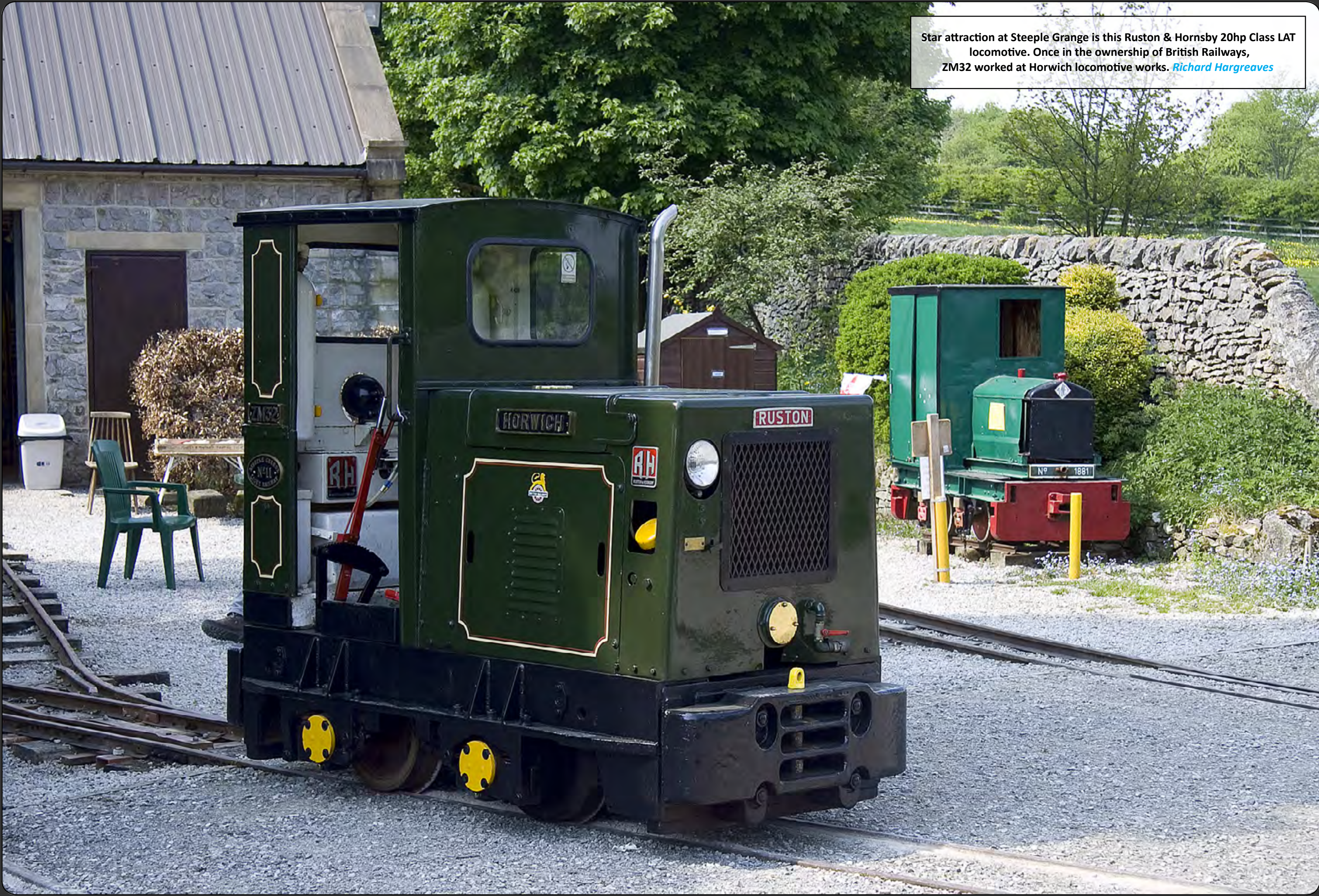
Star attraction at Steeple Grange is this Ruston & Hornsby 20hp Class LAT locomotive. Once in the ownership of British Railways, ZM32 worked at Horwich locomotive works.