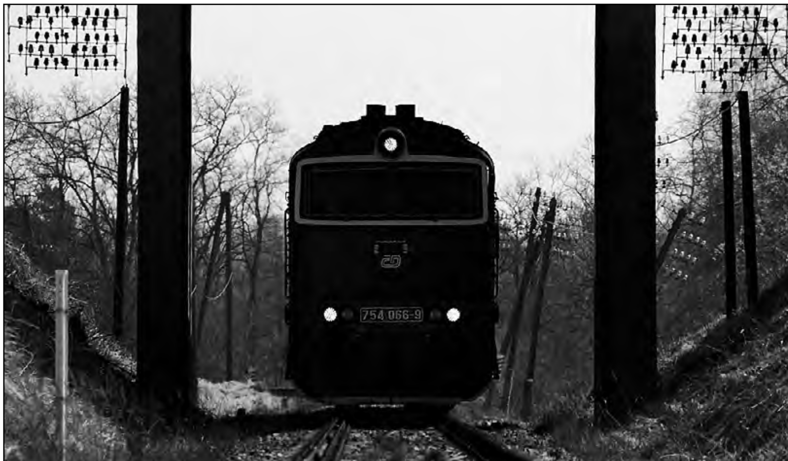
Above: Czech Class 754.066-9 heads through Náměšť nad Oslavou, on April 3rd.