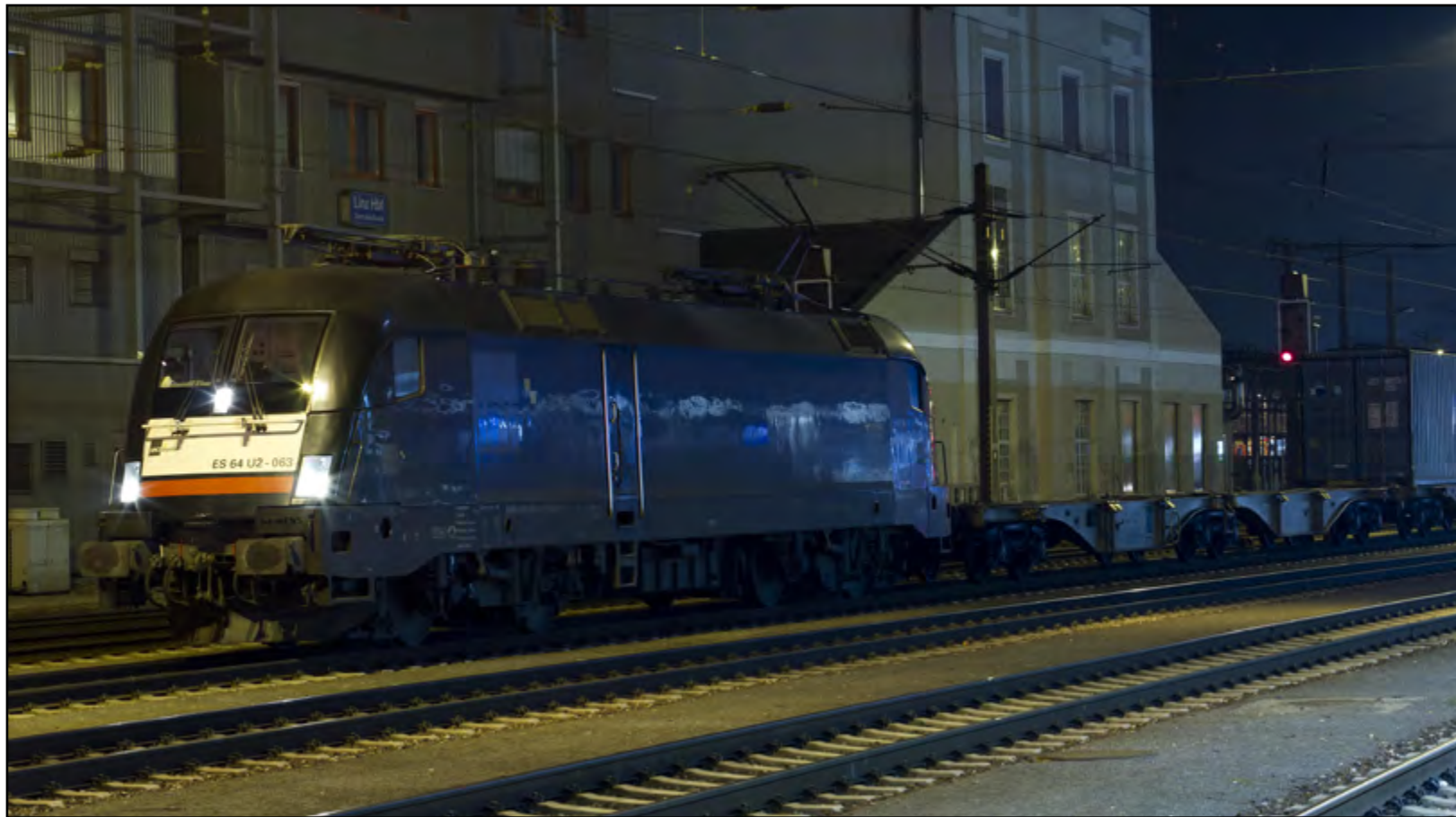
Above: MRCE Dispolok No. ES 64 U2-063 pauses at Linz Hbf with a container train from Wels heading for Wien on February 23rd. Below: The same location as above but in daylight as CargoServ No. ES64 U2-080 passes through Linz Hbf on February 23rd.