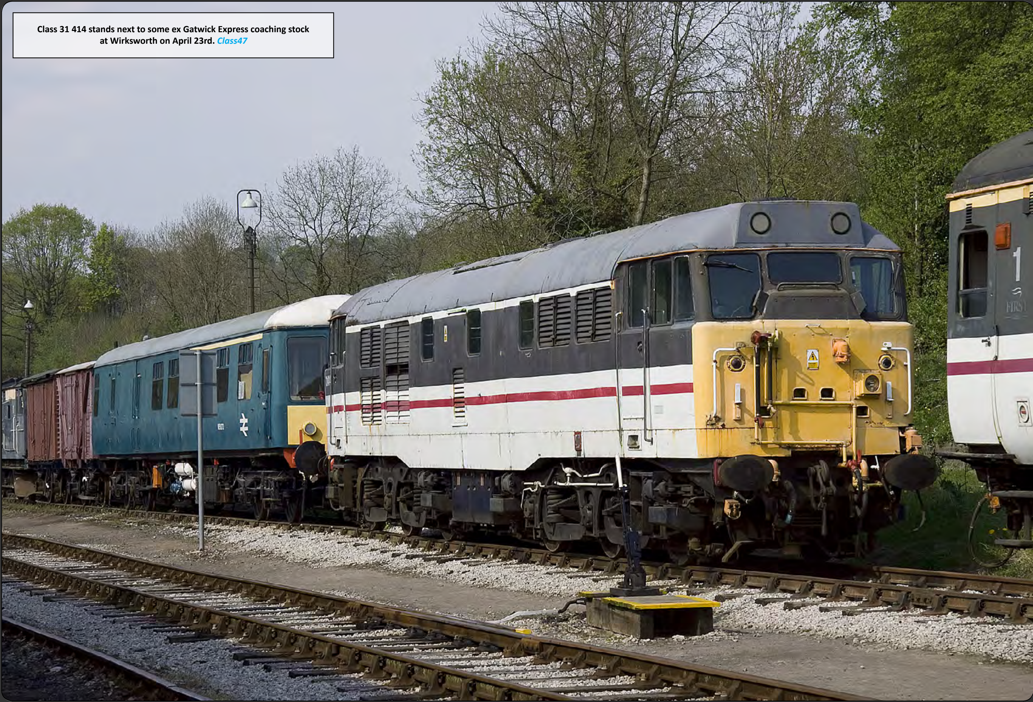
Class 31 414 stands next to some ex Gatwick Express coaching stock at Wirsworth on April 23rd. Class47