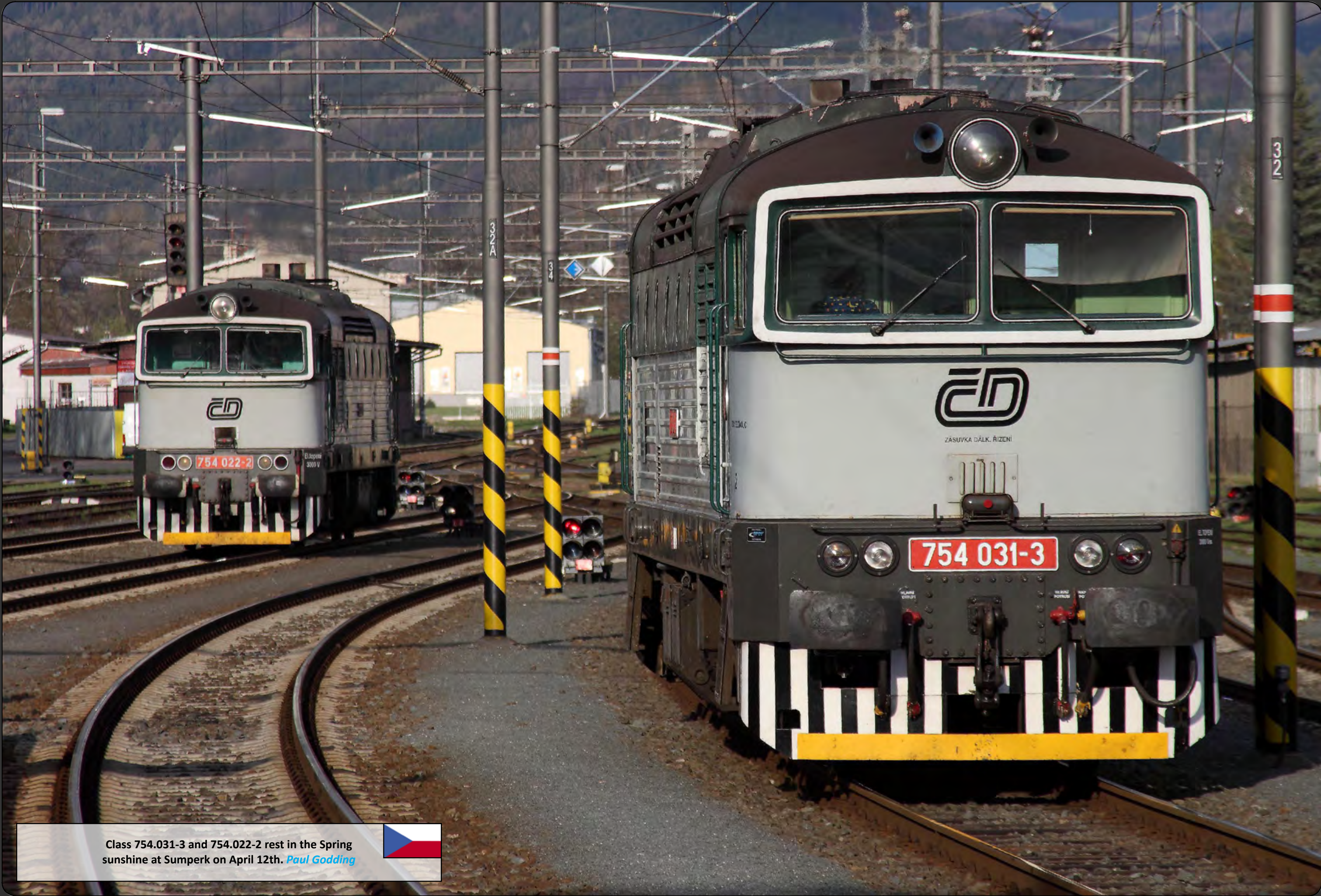
Class 754.031-3 and 754.022-2 rest in the Spring sunshine at Sumperk on April 12th.