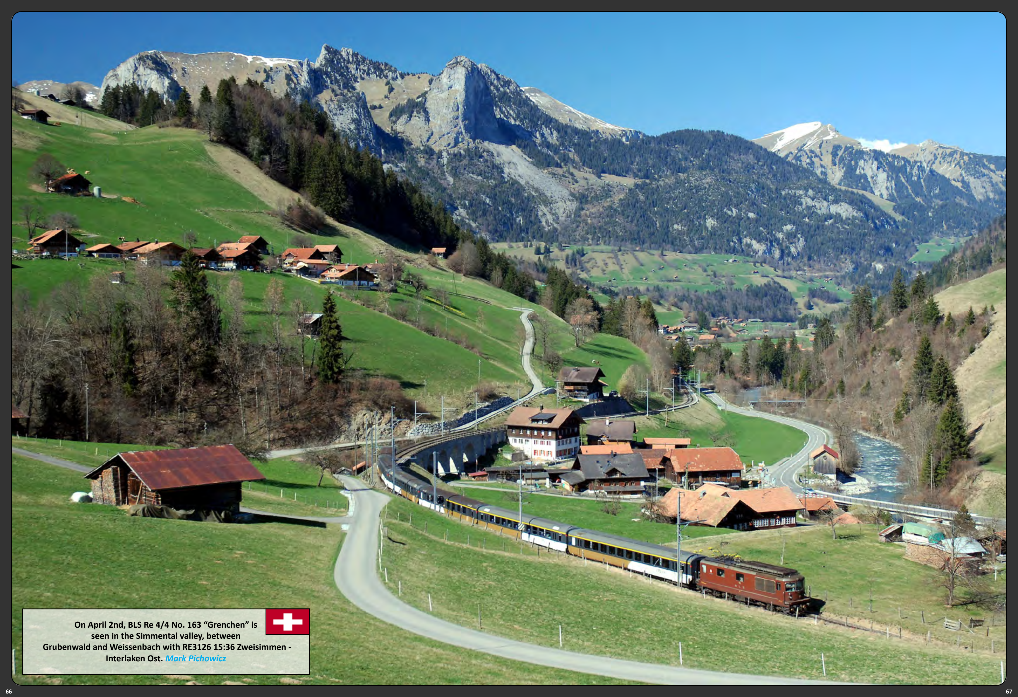
On April 2nd, BLS Re 4/4 No. 163 "Grenchen" is seen in the Simmental valley, between Grubenwald and Weissenbach with RE3126 15:36 Zweisimmen - Interlaken Ost. Mark Pichowicz