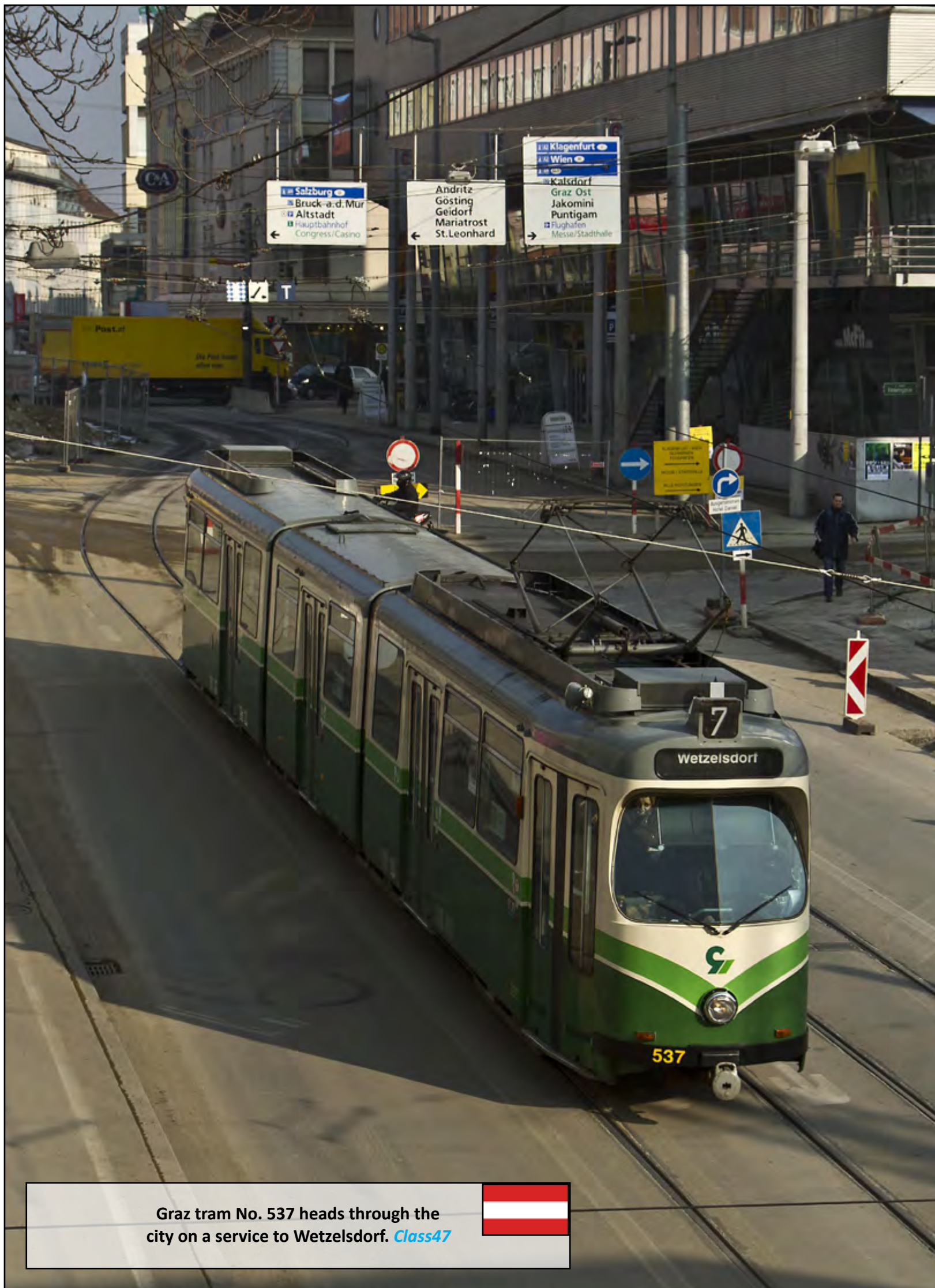
Graz tram No. 537 heads through the city on a service to Wetzelsdorf. Class47