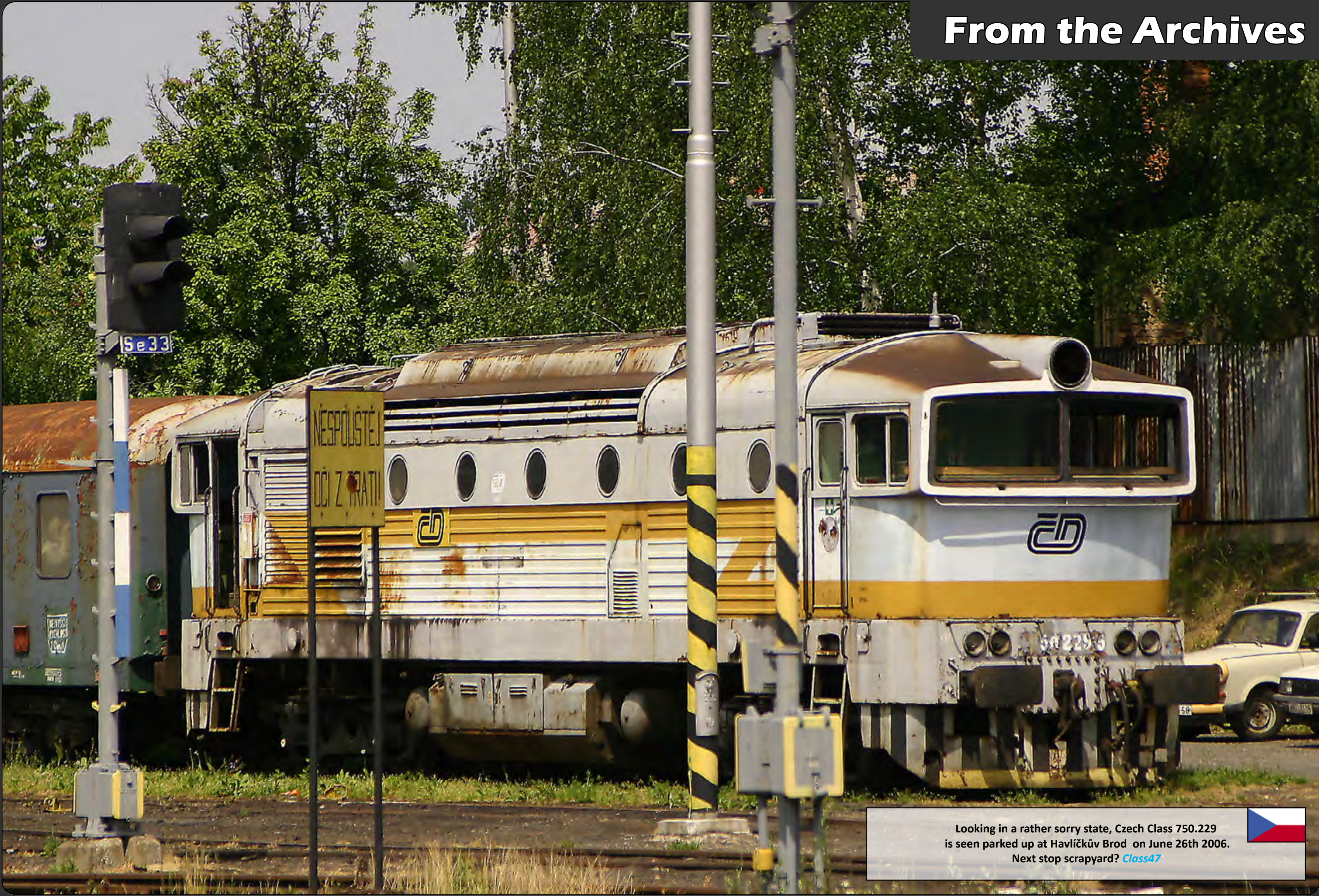
Looking in a rather sorry state, Czech Class 750.229 is seen parked up at Havlíčkův Brod on June 26th 2006. Next stop scrapyards? Class47