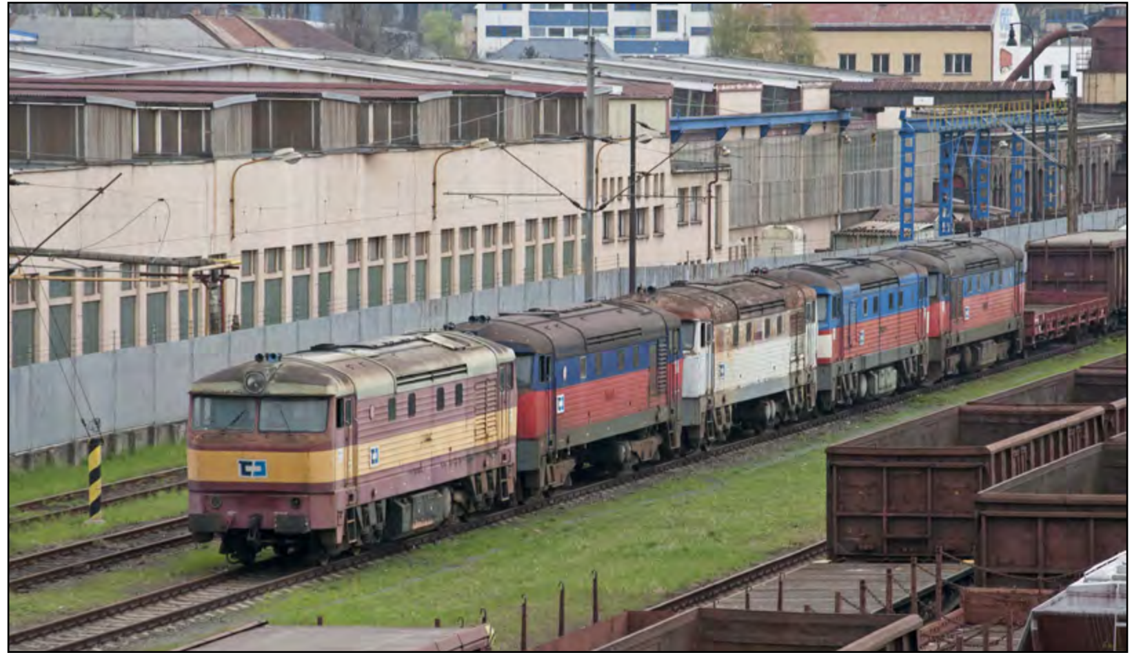
Above: A line of Class 751 "Grumpies" are seen on Ostrava depot on April 12th. A one way trip to the scrap yard for these veterans. Below: Tisnov on April 11th sees Class 242.238-4 working the local Brno service.