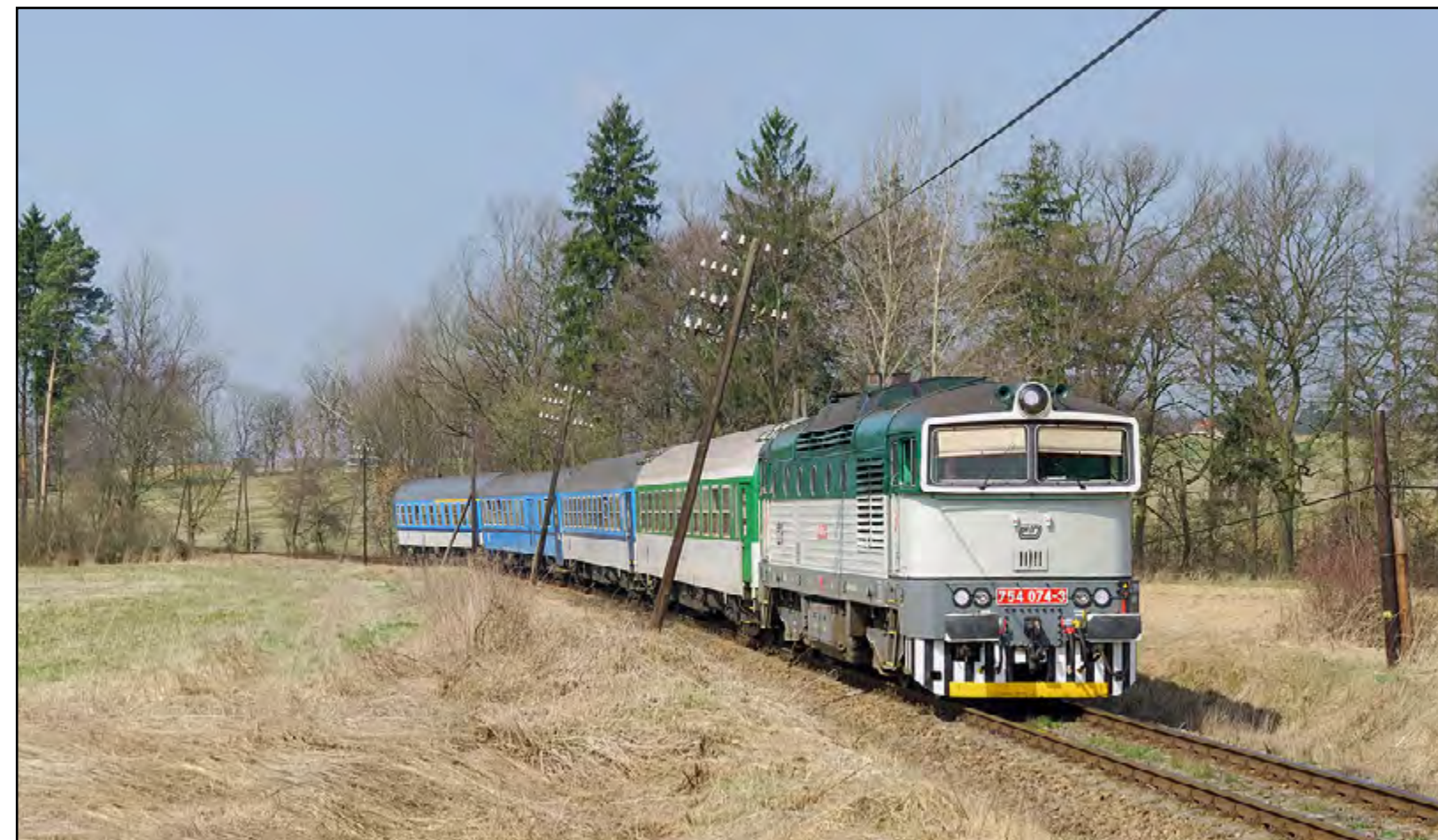
Above: Czech Class 754.074-3 works the R667 "Petr Vok" Plzen - Brno service through Náměšť nad Oslavou on April 3rd.