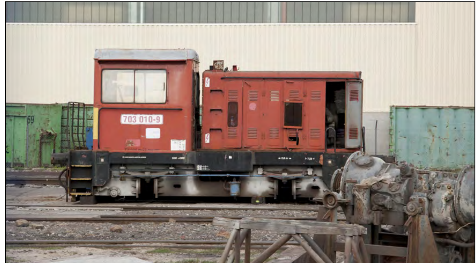
Above: Has anyone seen my wheels? A grounded Class 703 is seen at the CZ Loko depot in Jihlava on April 11th. Class47 Below: Heading up a track train in the yard at Jihlava on April 11th is Class 742.043-3.