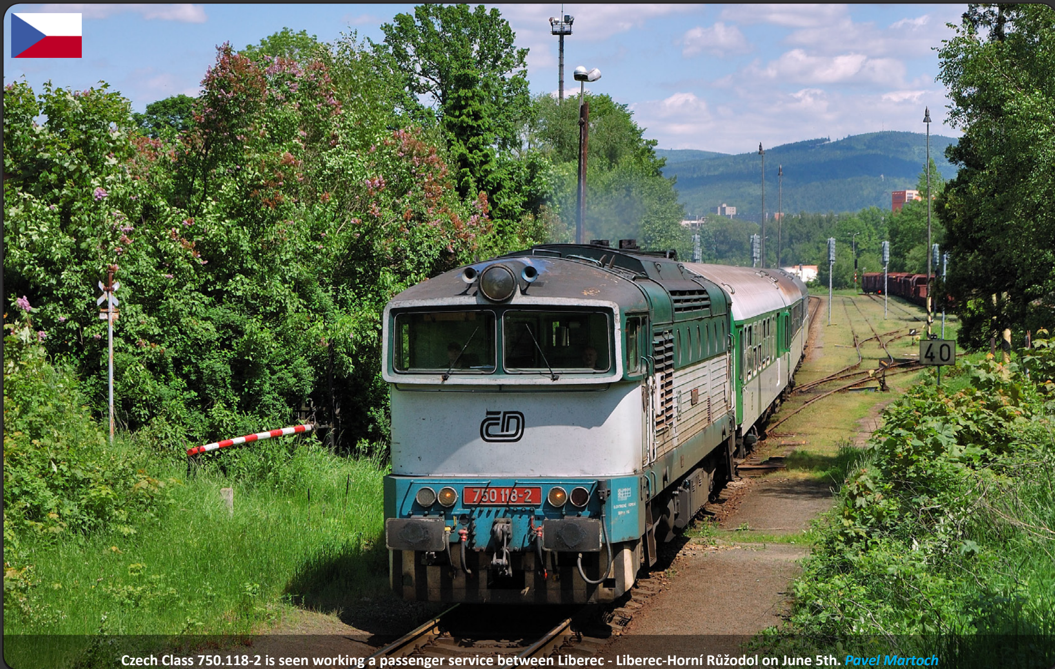
Czech Class 750.118-2 is seen working a passenger service between Liberec - Liberec-Horní Růžodol on June 5th.