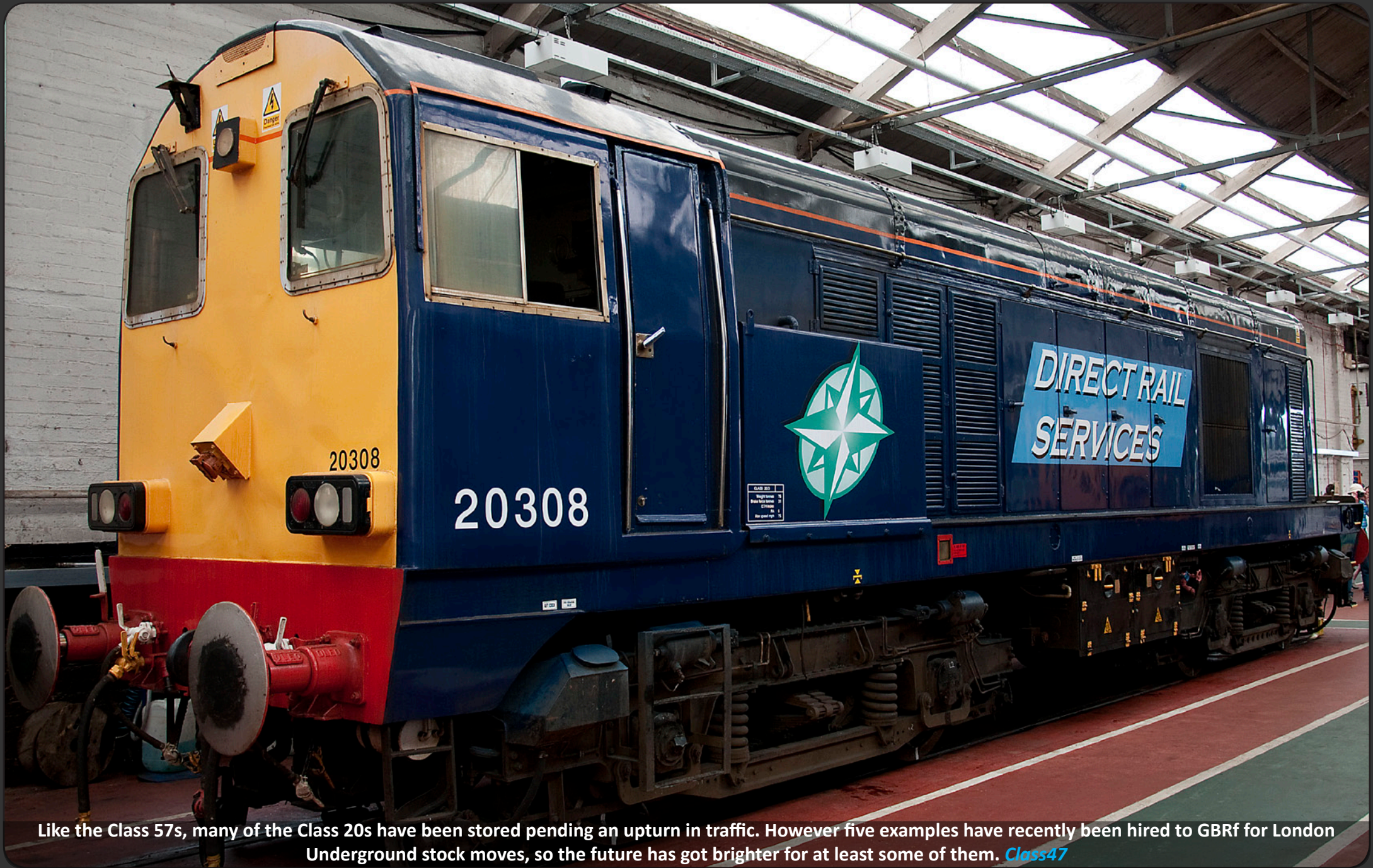
Like the Class 57s, many of the Class 20s have been stored pending an upturn in traffic. However five examples have recently been hired to GBRf for London Underground stock moves, so the future has got brighter for at least some of them. Class47