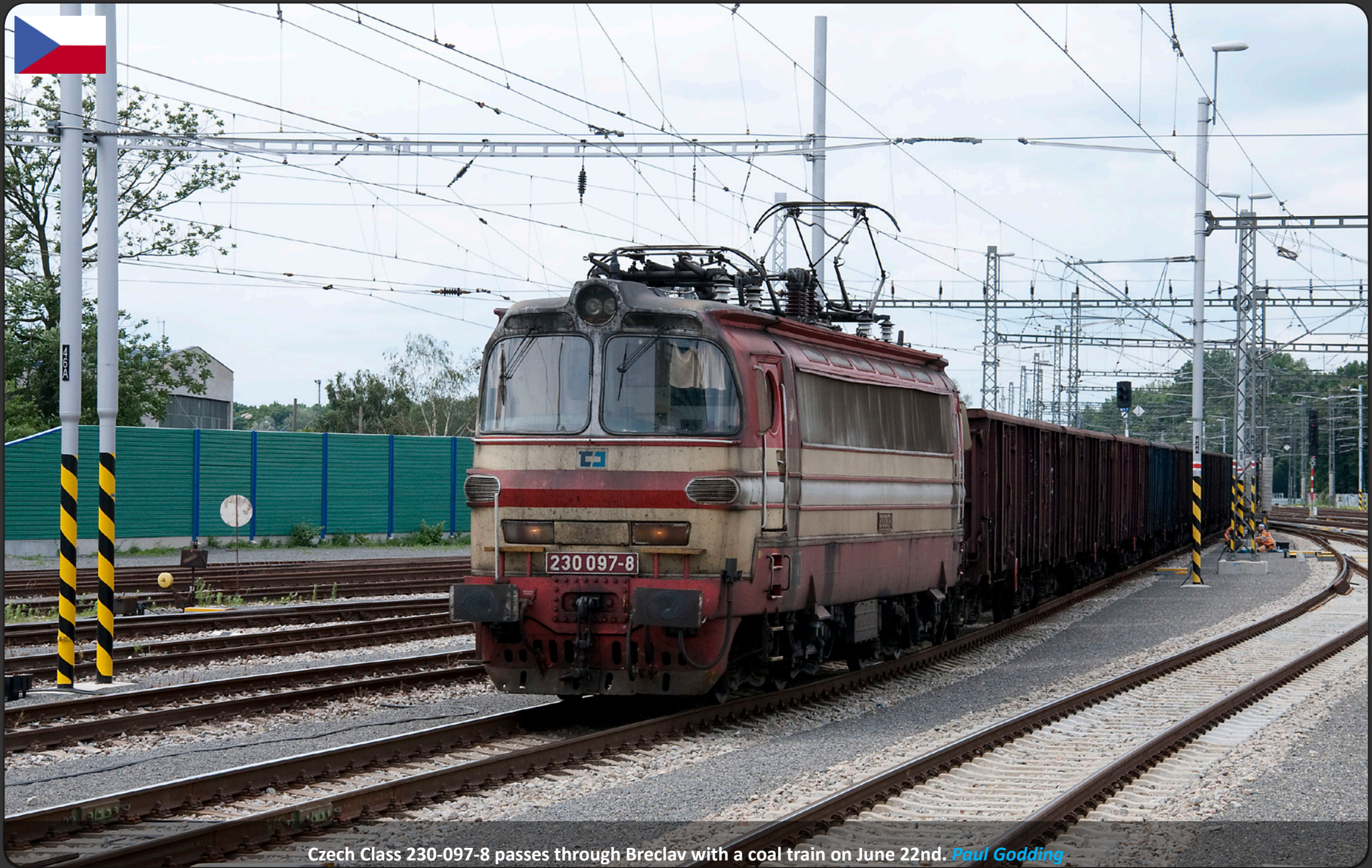
Czech Class 230-097-8 passes through Breclav with a coal train on June 22nd.