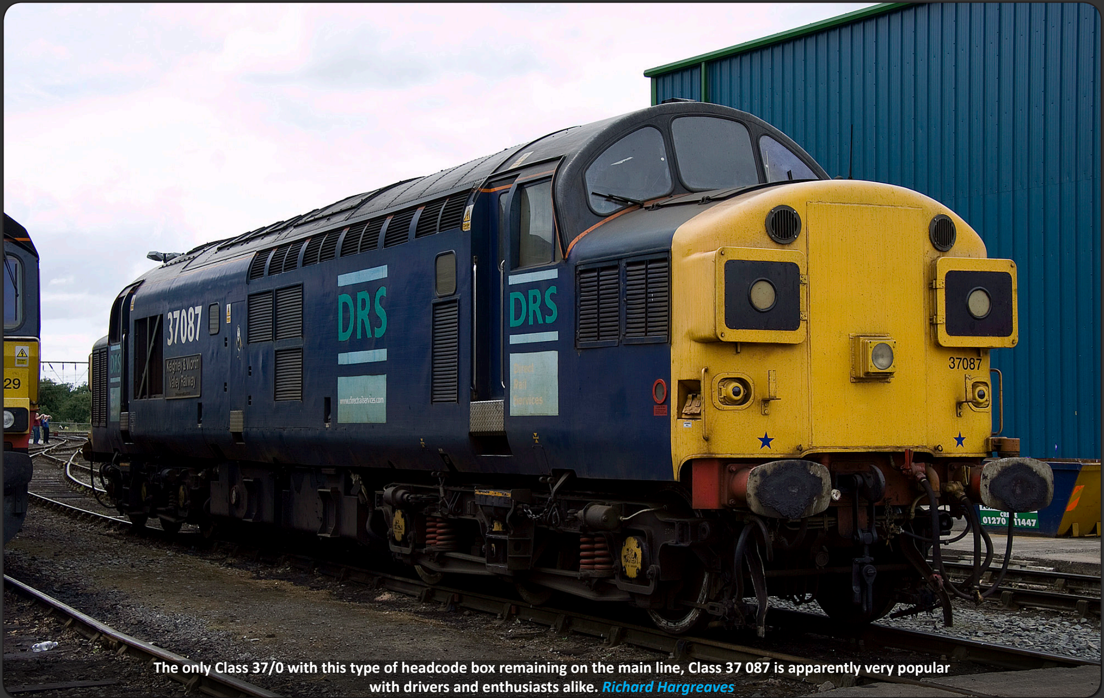
The only Class 37/0 with this type of headcode box remaining on the main line, Class 37 087 is apparently very popular with drivers and enthusiasts alike. Richard Hargreaves