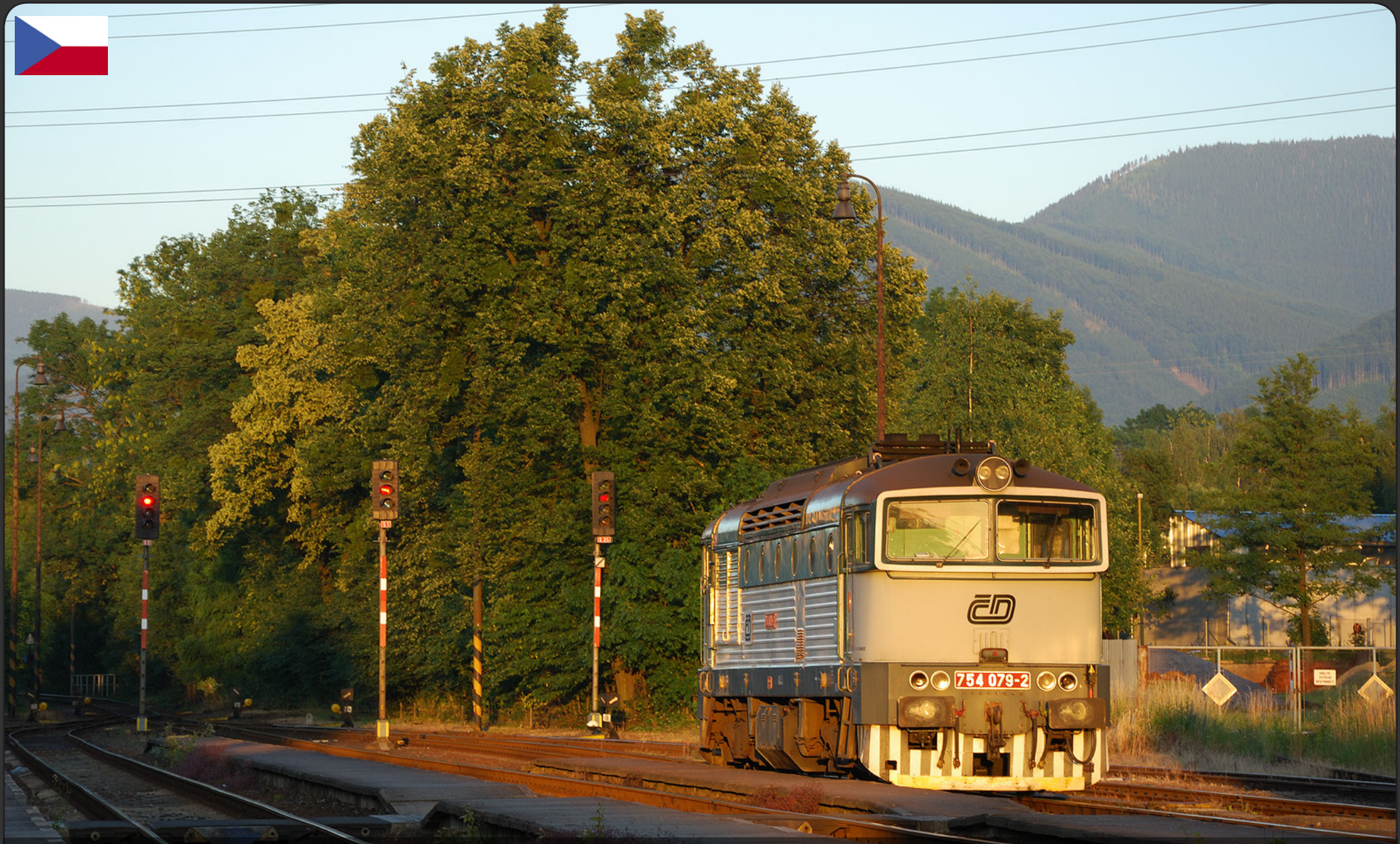
Czech Class 754.079-2, is seen at Frenštát pod Radhoštěm, the loco is now off-duty, and is being prepared to spend the night in the station.