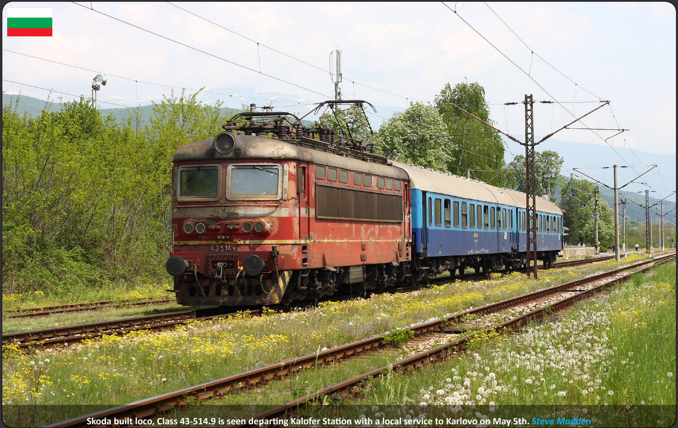
Skoda built loco, Class 43-514.9 is seen departing Kalofer Station with a local service to Karlovo on May 5th.