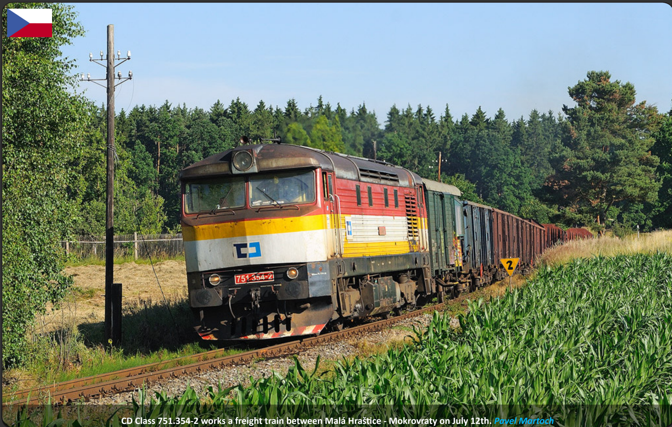
CD Class 751.354-2 works a freight train between Malá Hraštica - Mokrovraty on July 12th.