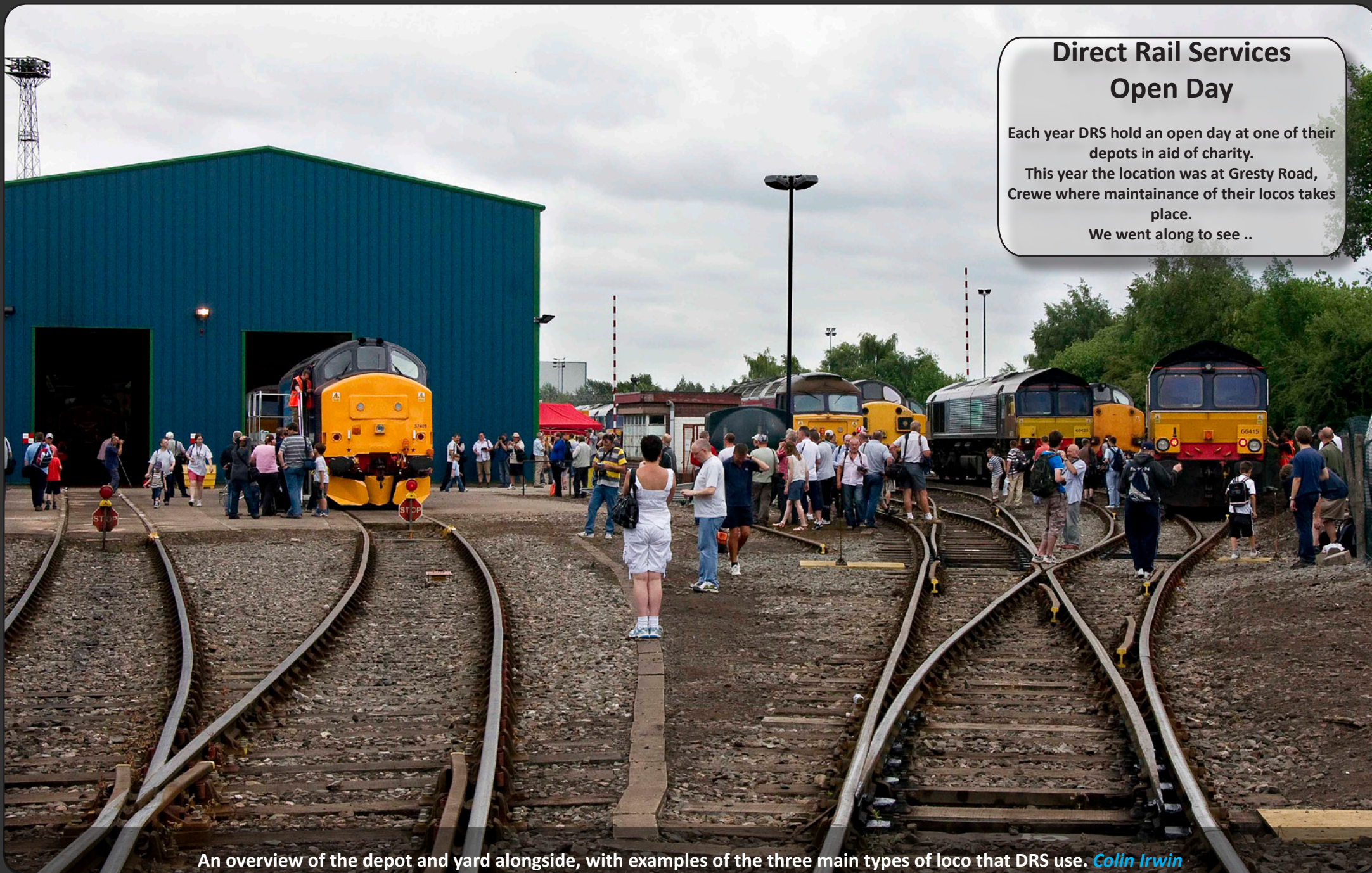
An overview of the depot and yard alongside, with examples of the three main types of loco that DRS use. Colin Irwin