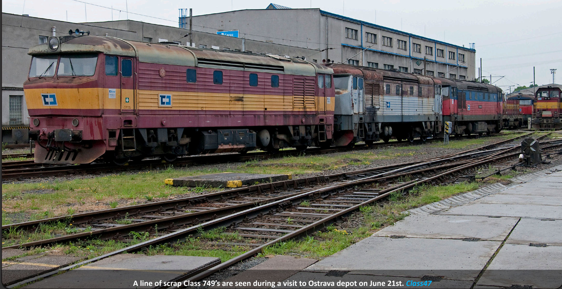
A line of scrap Class 749's are seen during a visit to Ostrava depot on June 21st. Class47