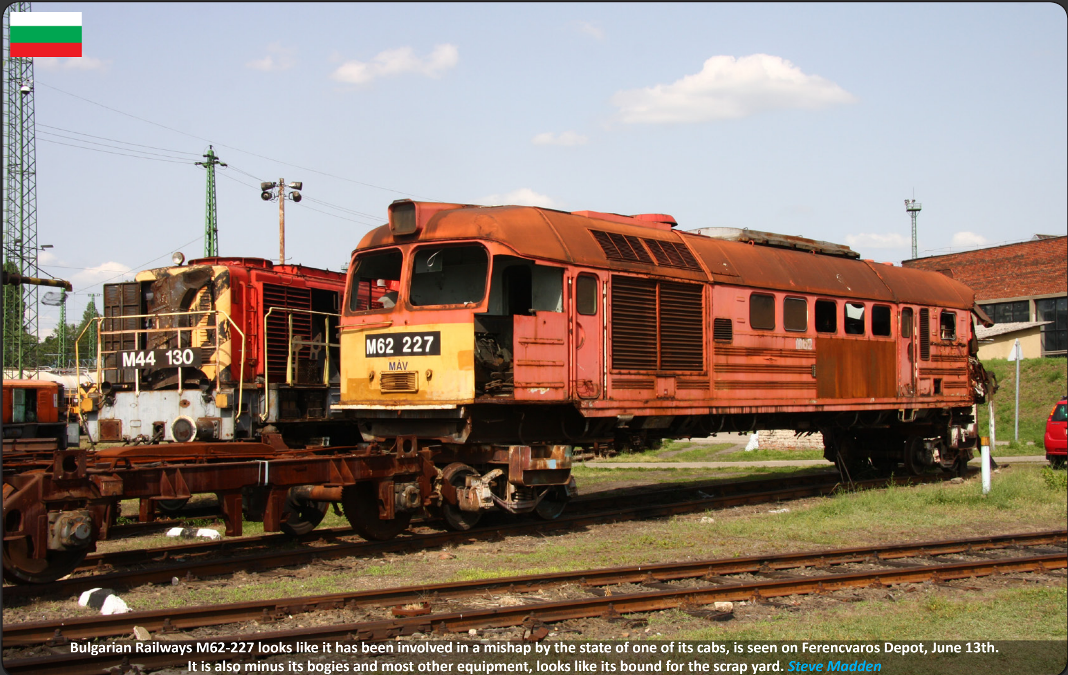
Bulgarian Railways M62-227 looks like it has been involved in a mishap by the state of one of its cabs, is seen on Ferencvaros Depot, June 13th. It is also minus its bogies and most other equipment, looks like its bound for the scrap yard.