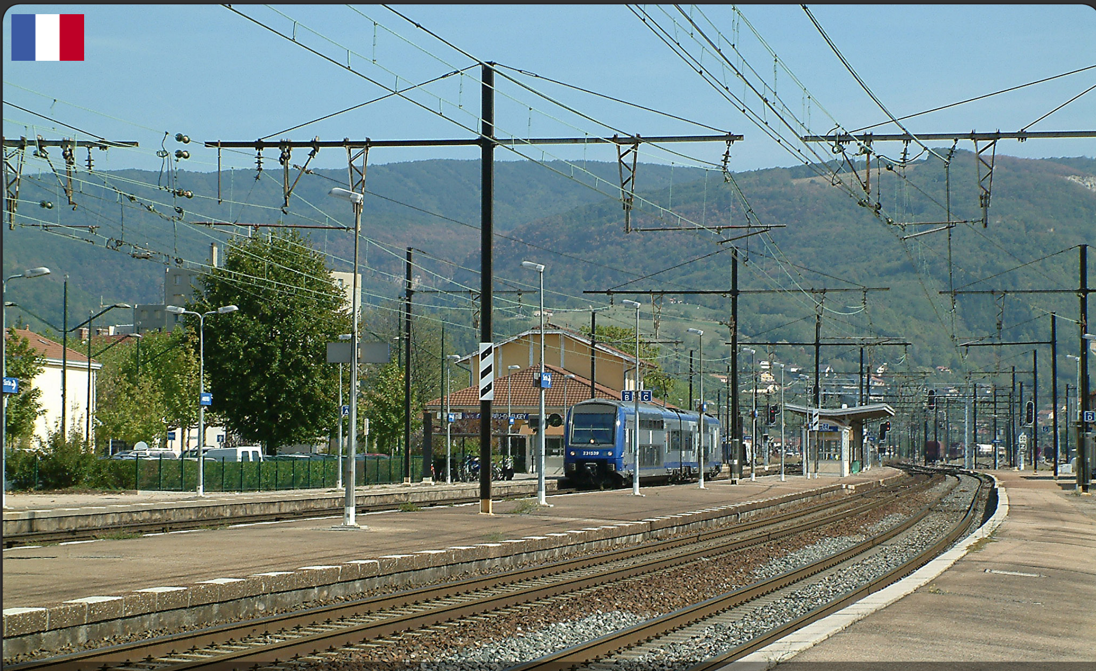
A view of the delightful station at Ambérieu-en-Bugey, near Lyon in France, with a Class 23-5xx series TER DMU waiting to depart with a local service. Class47