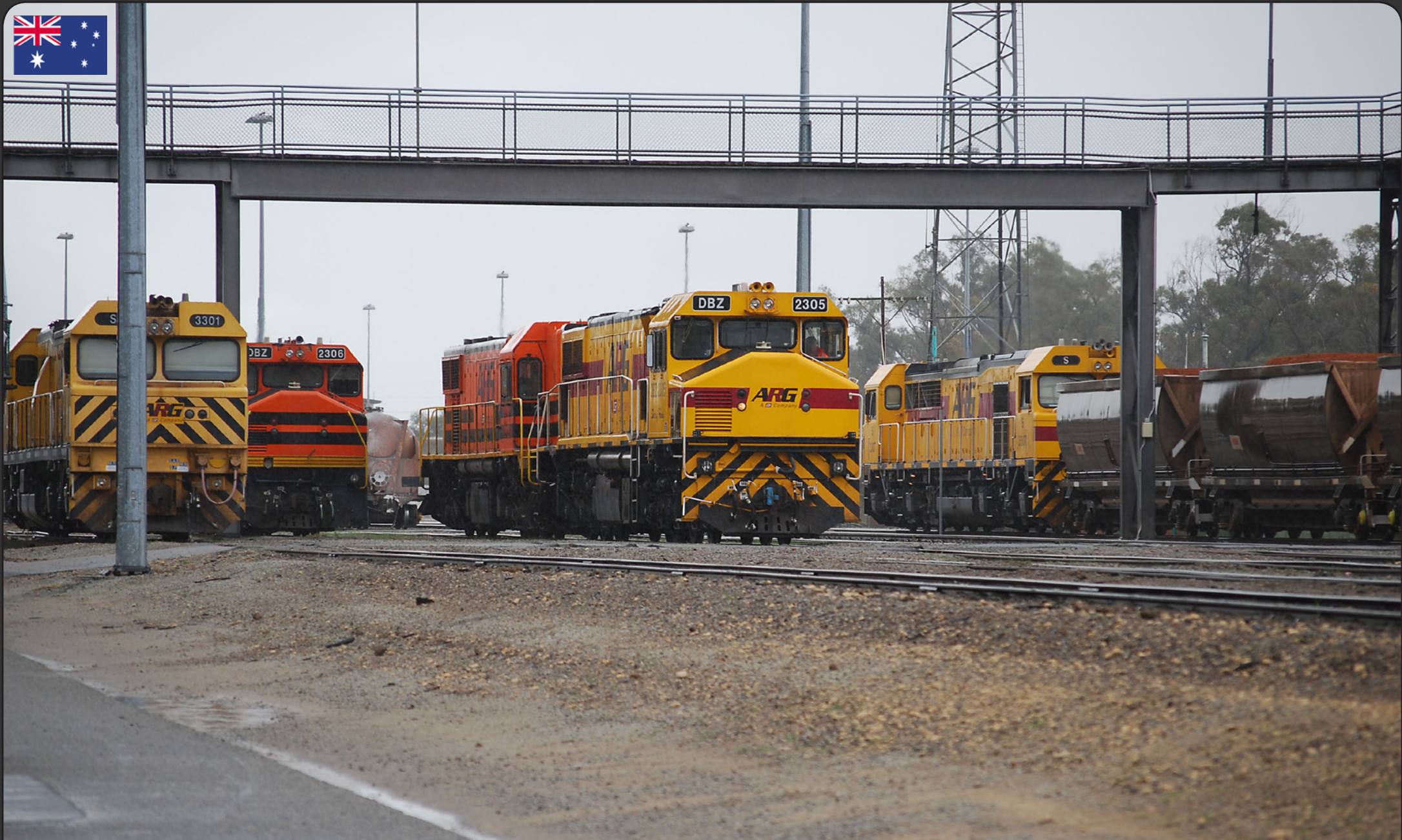
On a wet and windy May 22nd at Kwinana yard several of ARG's narrow gauge locomotives are seen preparing their trains for afternoon departures to either the South West of Western Australia, or to the north with Bauxite to the refinery or coal to the power station. Colin Gildersleve