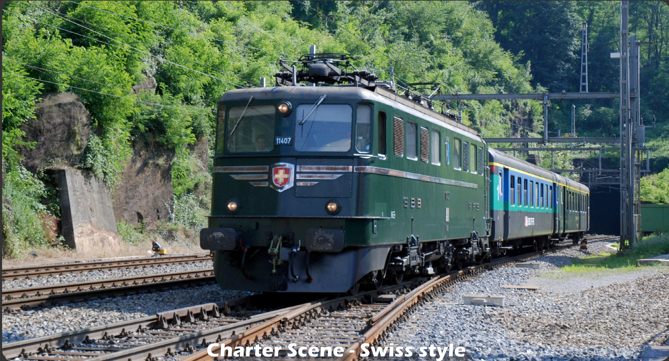
Charter Scene - Swiss style