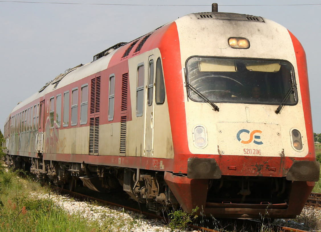
Greek DMU Class 520, Nos. 520-206 and 520-108 departing Svilengrad (Bulgaria) with the 10:55 to Dikea (Greece). This is one train you don't want to miss because it is the only train of the day between Bulgaria and Greece. Steve Madden