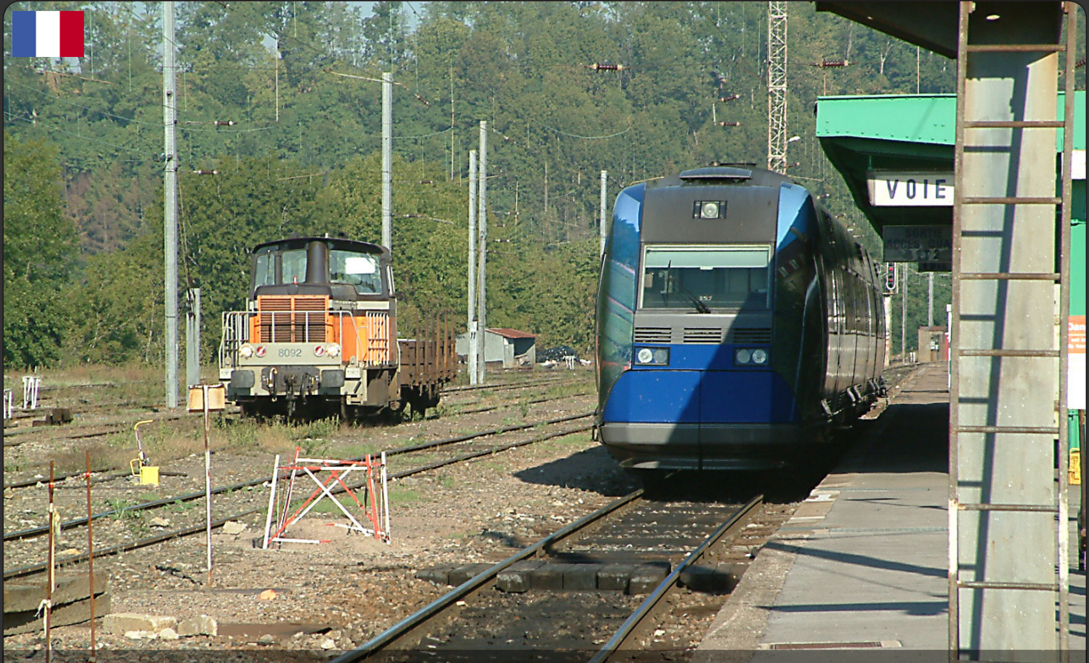
An X72500 series TER DMU waits in the platform at Culmont-Challindrey, whilst SNCF Class Y 8092 shunter carries out its duties on September 18th 2003. Class47