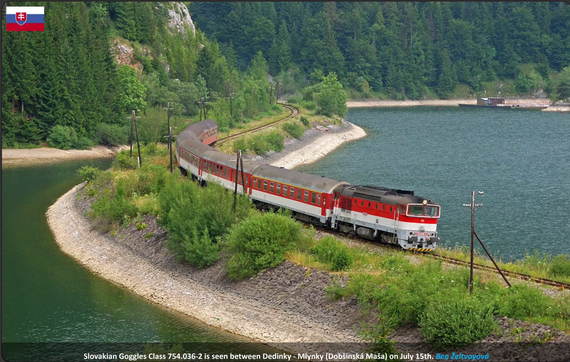
Slovakian Goggles Class 754.036-2 is seen between Dedinky - Mlynky (Dobšinská Maša) on July 15th.