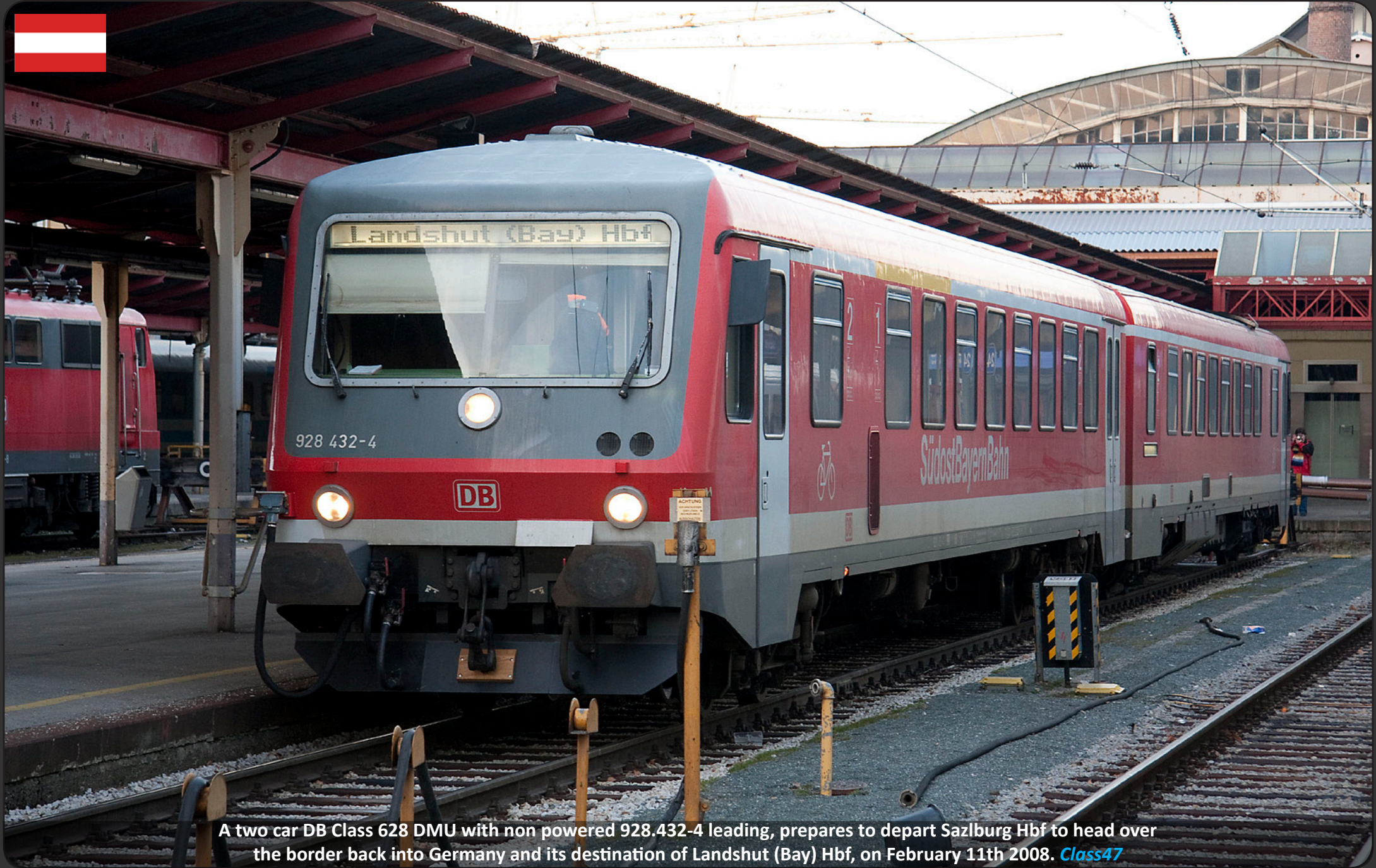
A two car DB Class 628 DMU with non powered 928.432-4 leading, prepares to depart Sazlburg Hbf to head over the border back into Germany and its destination of Landshut (Bay) Hbf, on February 11th 2008.