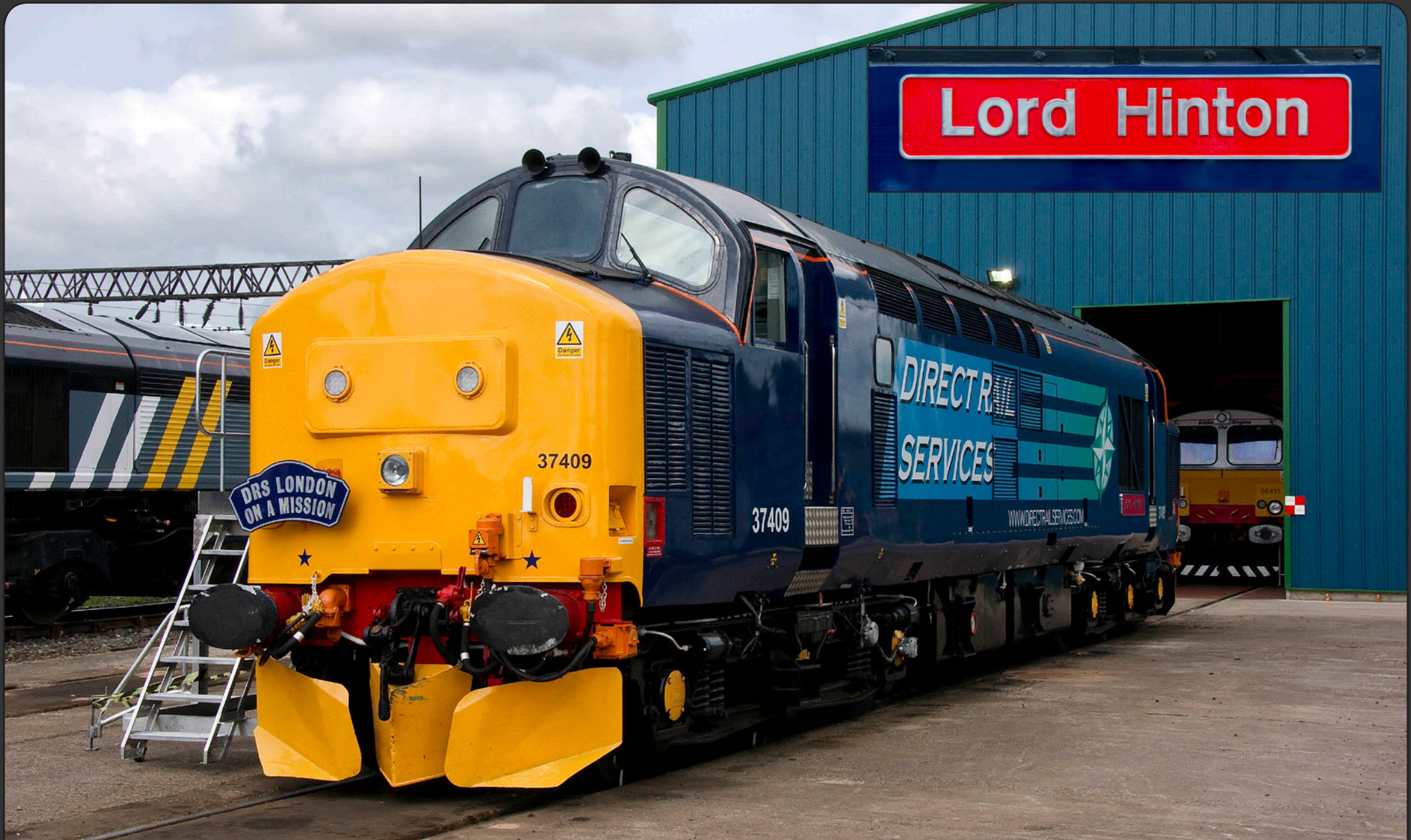
An open day wouldn't be complete without a loco naming ceremony, and here we see Class 37 409 shortly after being named "Lord Hinton." This loco has only recently returned to traffic after a very long overhaul. Colin Irwin