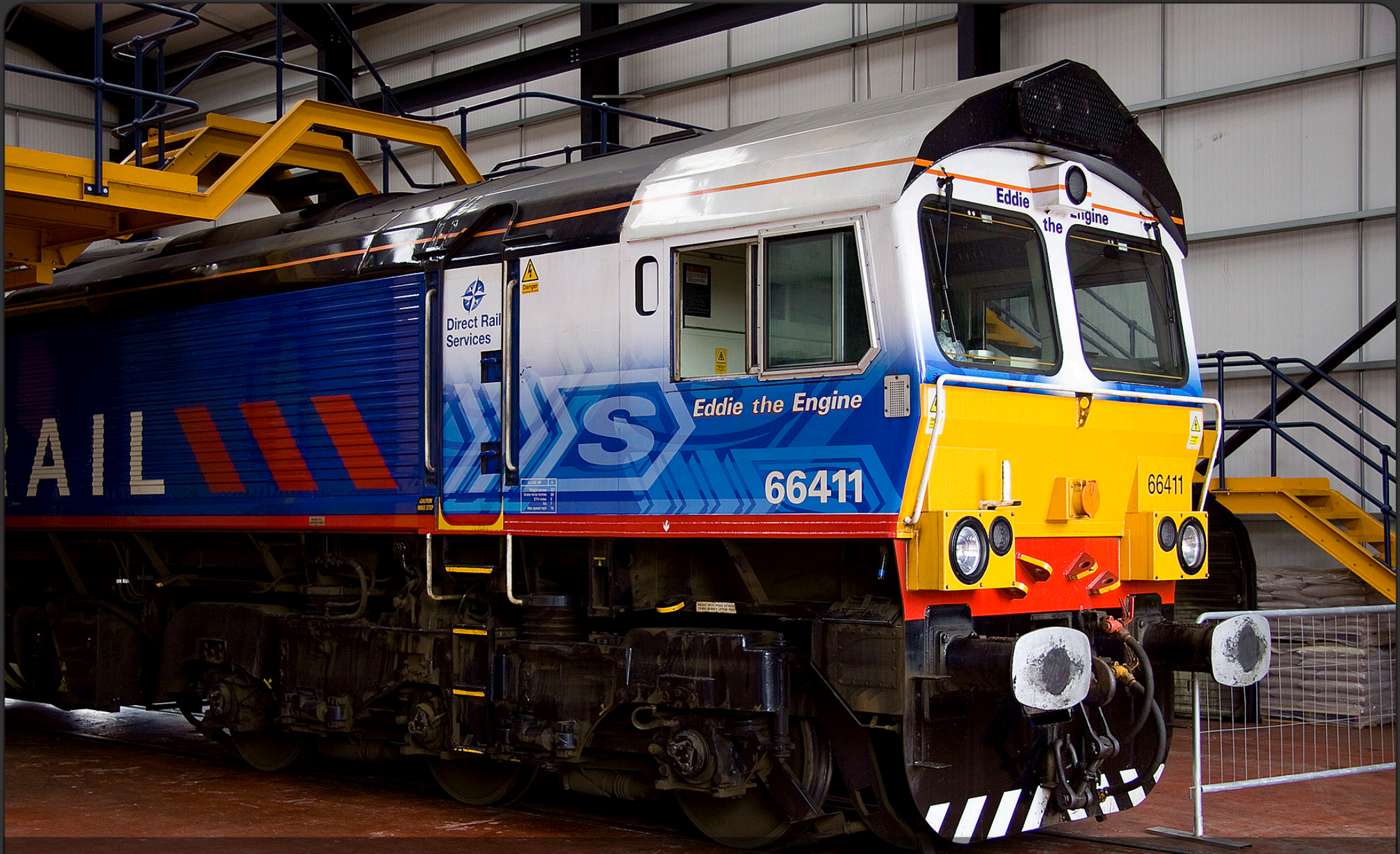
One of the more colourful DRS locos is "Eddie the Engine" Class 66 411, seen here with engine cowling removed for viewing (next page).