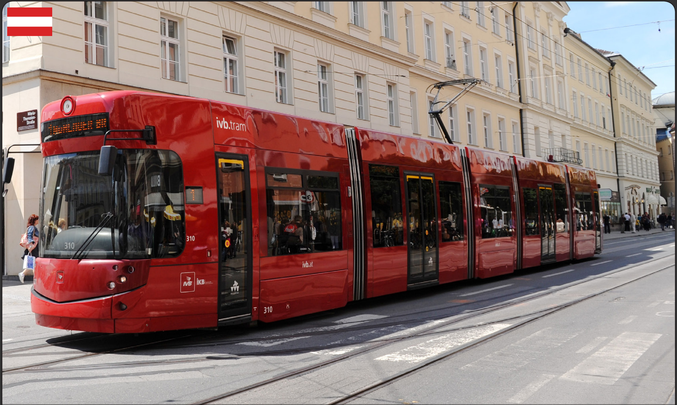
Bombardier trams in Innsbruck are magnificent examples of modern transportation. This example, No. 310, was taken in early July. David Hollowood