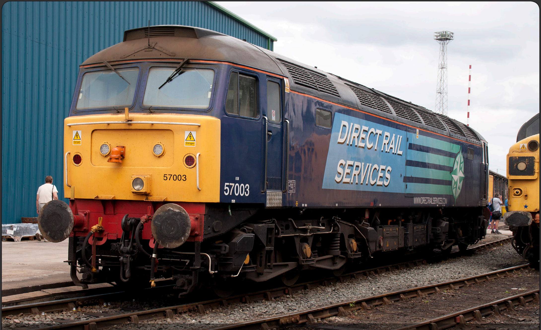
Class 57 003 stands outside the depot. DRS have a number of these locos, some undergoing overhaul and some stored surplus. Brian Battersby