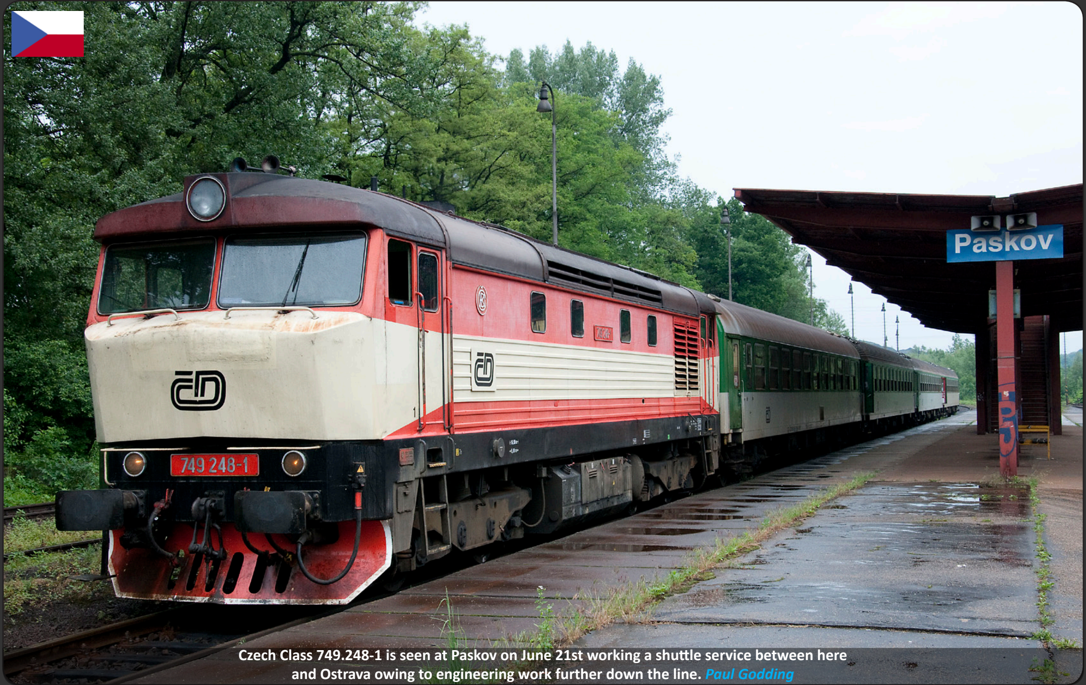
Czech Class 749.248-1 is seen at Paskov on June 21st working a shuttle service between here and Ostrava owing to engineering work further down the line.