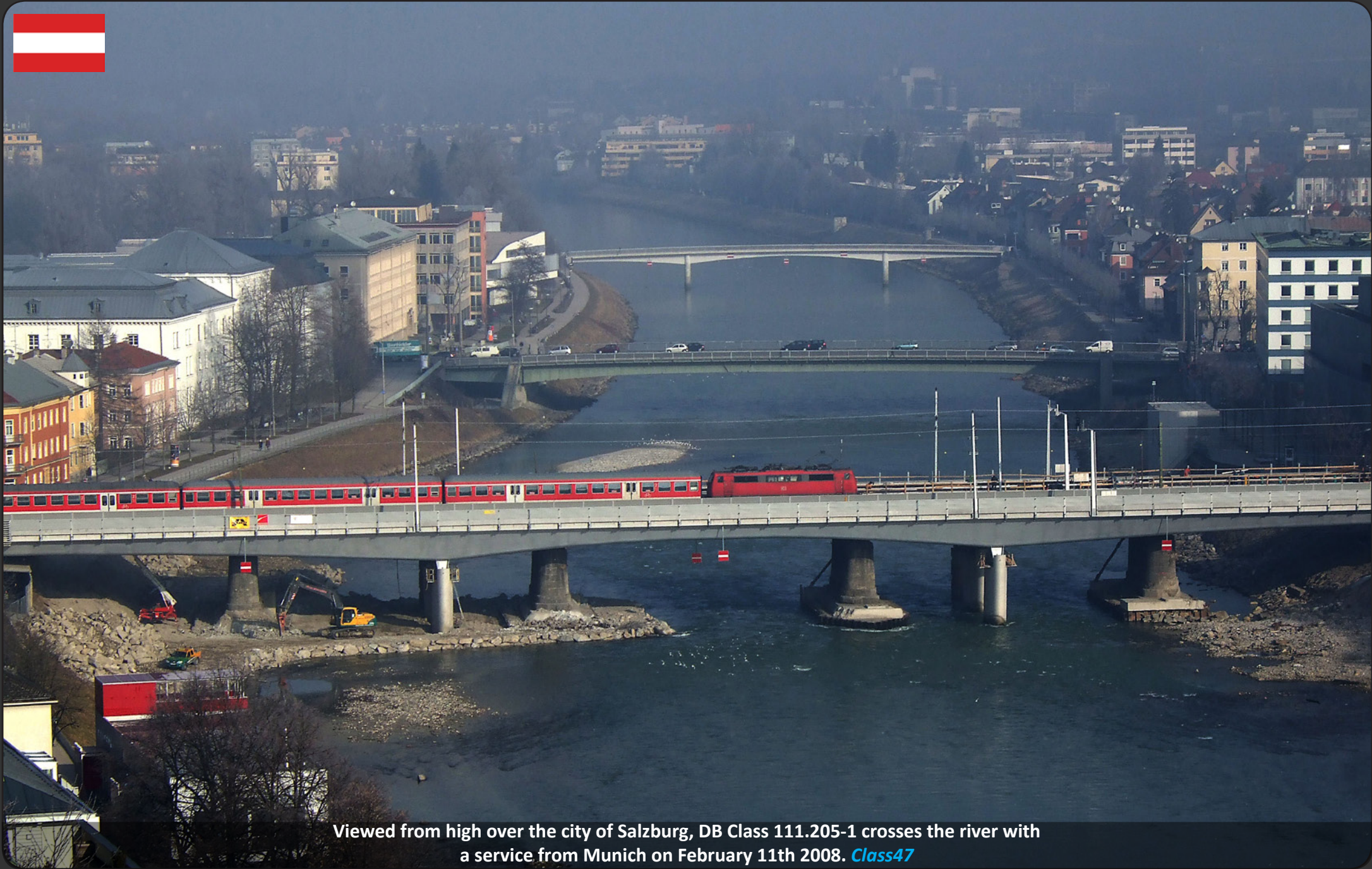
Viewed from high over the city of Salzburg, DB Class 111.205-1 crosses the river with a service from Munich on February 11th 2008.