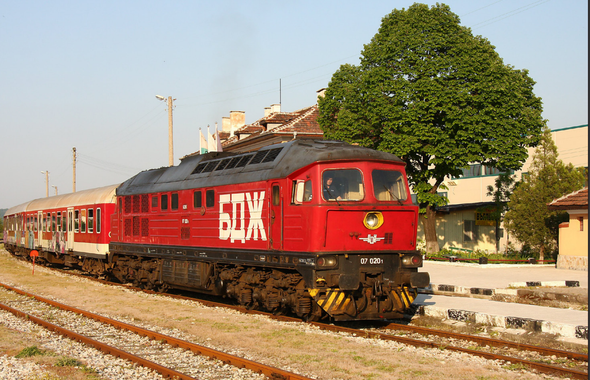
Bulgarian Railways Class 07-020.1 is seen arriving at its destination of Pesteria with the only loco hauled service of the day on this line, the rest are DMU's. It has worked the train throughout from Plovdiv. Steve Madden