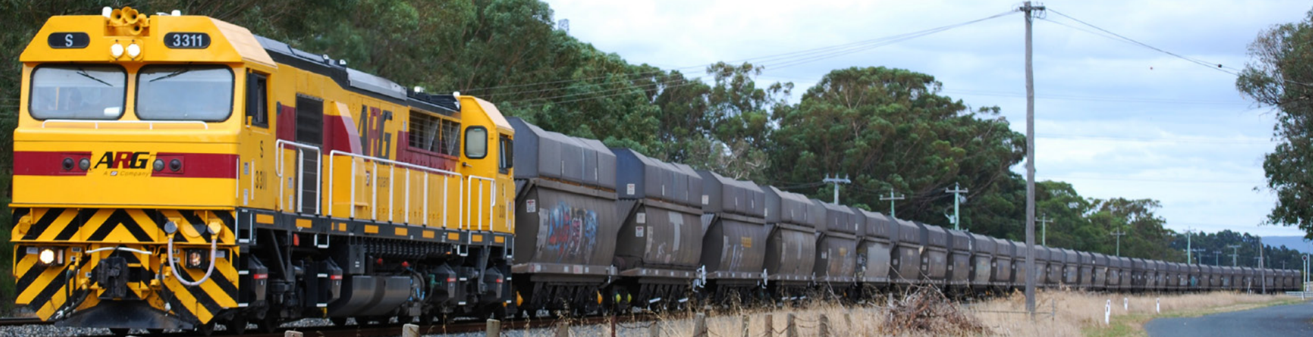
Australian Railroad Group's S3311 heads to the refinery at Kwinana with loaded Bauxite but first it pauses in the loop at Wellard for southbound workings to pass, on March 27th. Colin Gildersleve