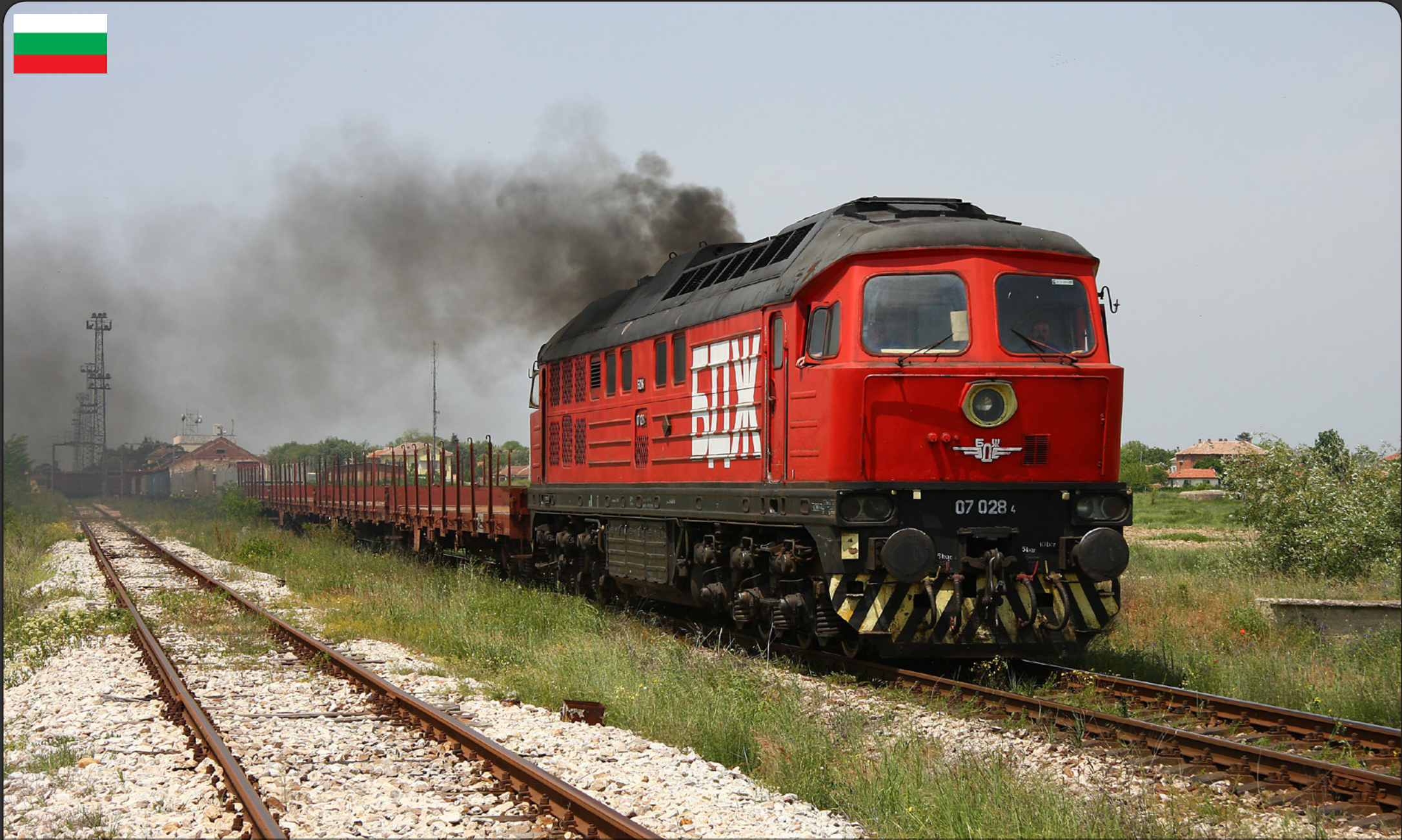
Bulgarian Class 70-038.4 powers out of Svilengrad with a long mixed freight train from Dimitrovgrad to Svilengrad, 07-070 is on the rear. Steve Madden