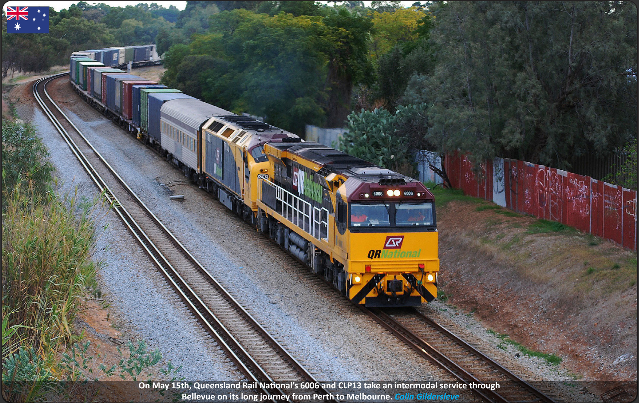
On May 15th, Queensland Rail National's 6006 and CLP13 take an intermodal service through Bellevue on its long journey from Perth to Melbourne.