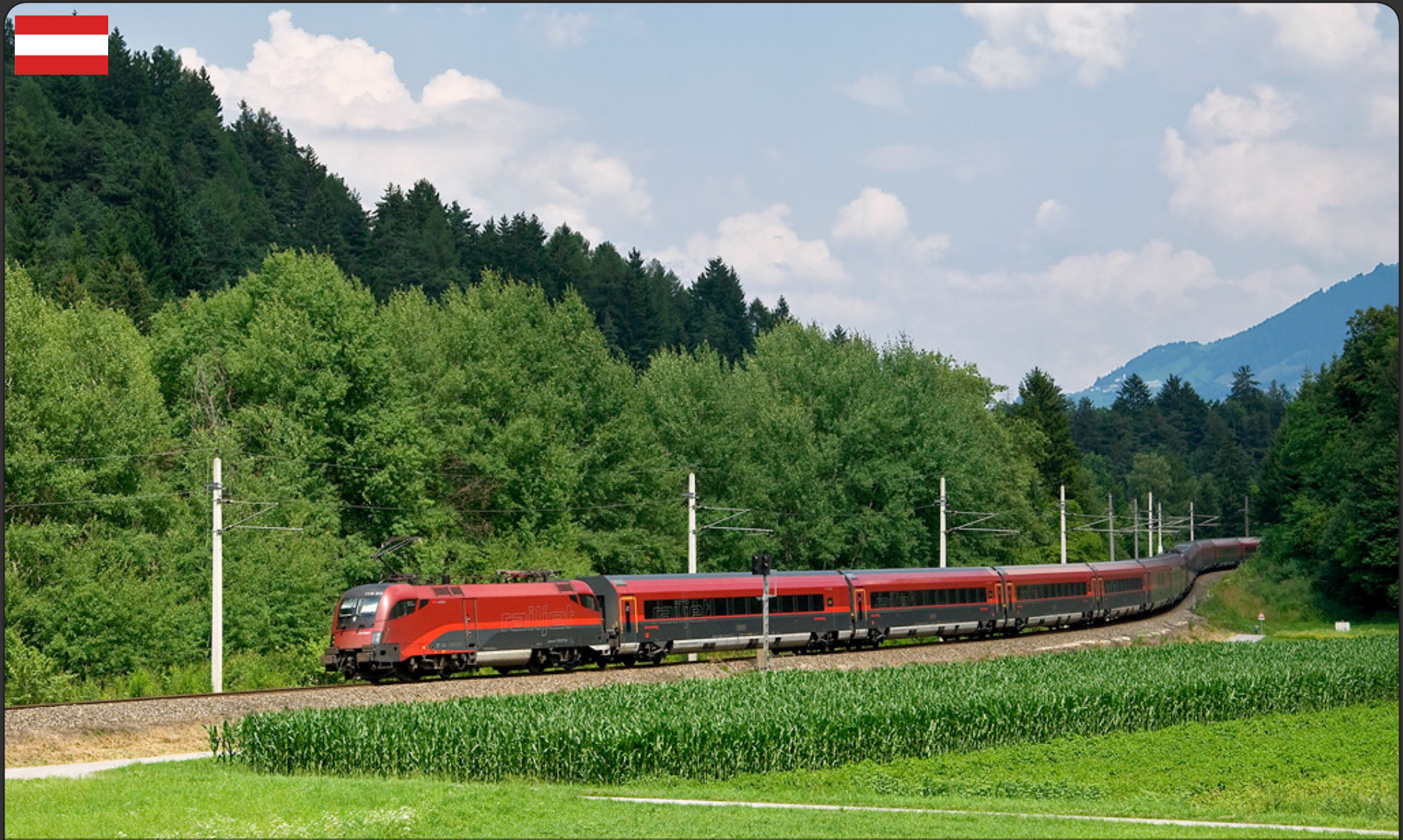
An OBB Railjet service is seen working Roppen - Imst - Pitztal headed by Class 116.217 on July 22nd.