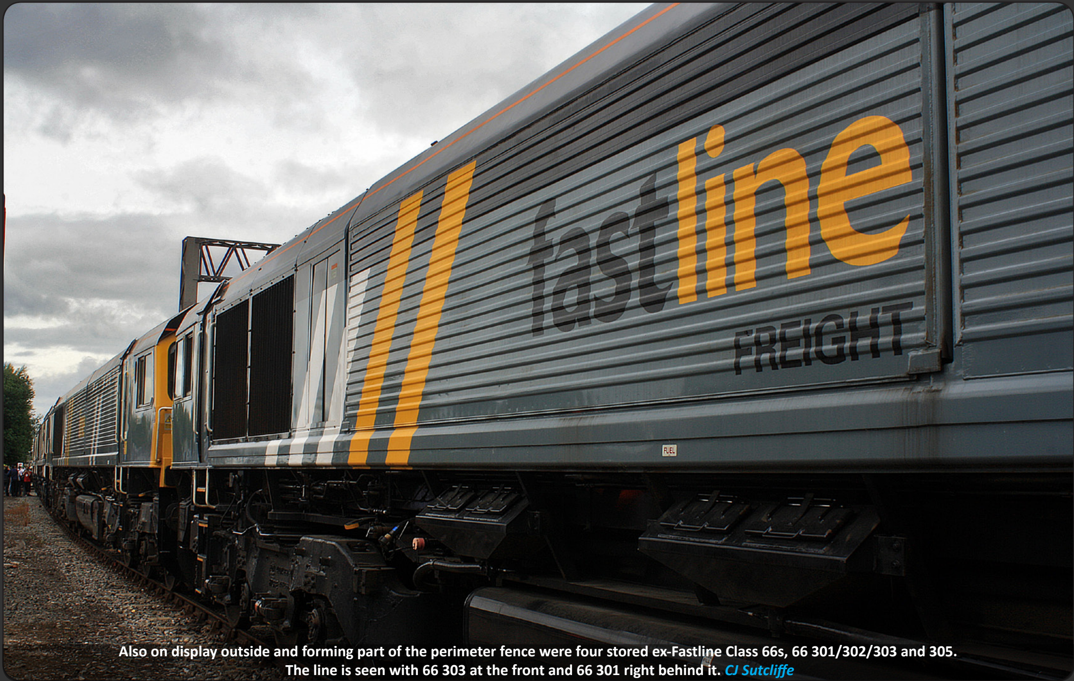
Also on display outside and forming part of the perimeter fence were four stored ex-Fastline Class 66s, 66 301/302/303 and 305. The line is seen with 66 303 at the front and 66 301 right behind it. CJ Sutcliffe