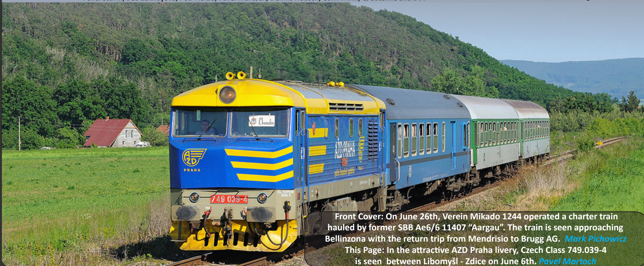
Front Cover: On June 26th, Verein Mikado 1244 operated a charter train hauled by former SBB Ae6/6 11407 "Aargau". The train is seen approaching Bellinzona with the return trip from Mendrisio to Brugg AG. This Page: In the attractive AZD Praha livery, Czech Class 749.039-4 is seen between Libomyšl - Zdice on June 6th.