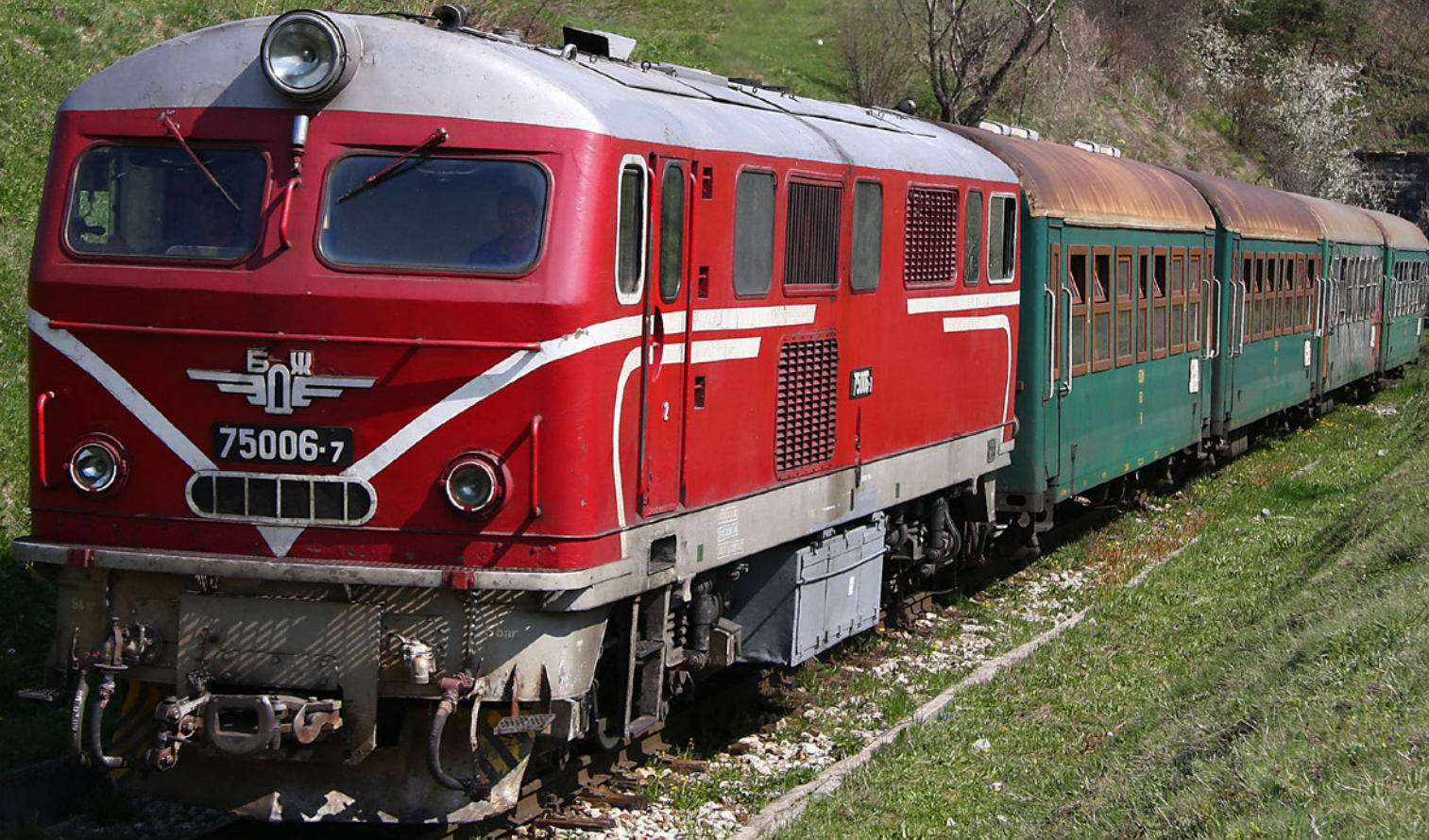
Bulgarian Narrow Gauge Class 75-006.7 is seen working the 13:15 Septemvri to Dobrinishte on May 2nd. It has just come out of a tunnel on the approach to Avramovo Station.