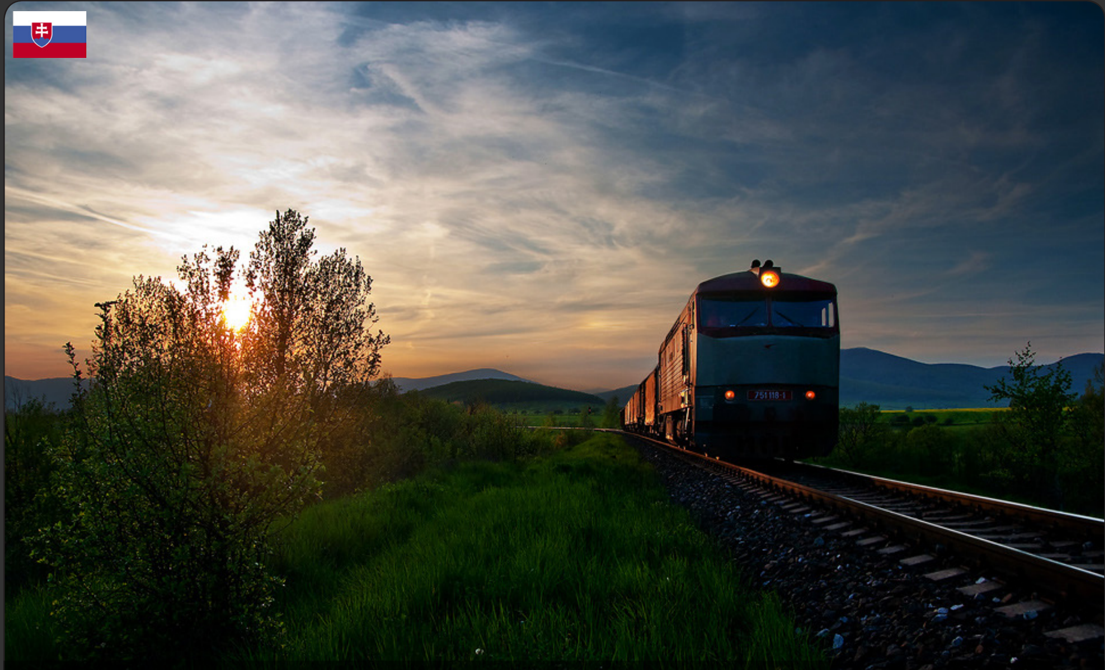
Slovakian Class 751.118-1 is seen between Lipovník - Jablonov nad Turňou on the evening of April 30th.