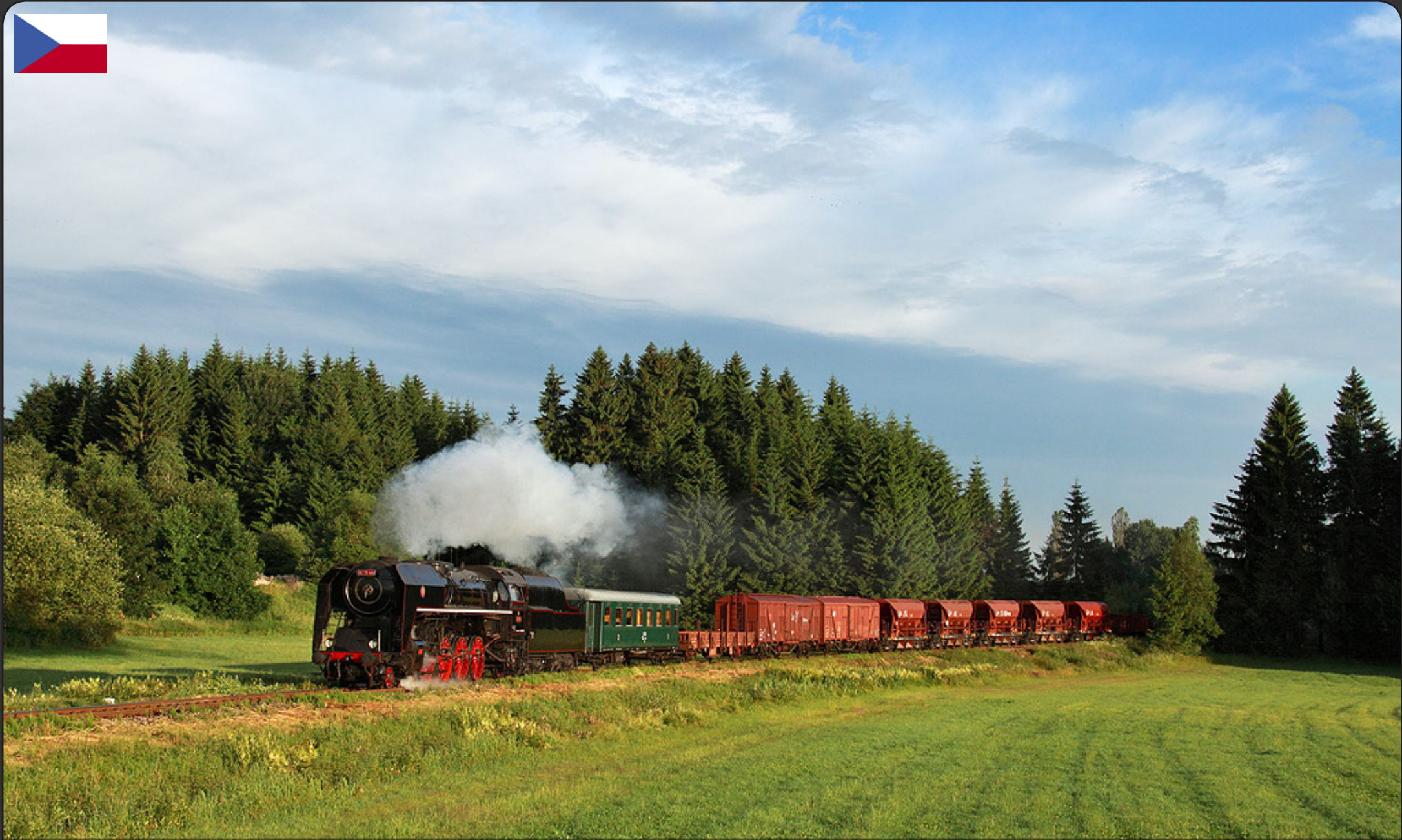
Preserved Czech steam loco No. 475.196 is seen between Žďár nad Sázavou - Veselíčko with a freight train on July 5th. Petr Holub