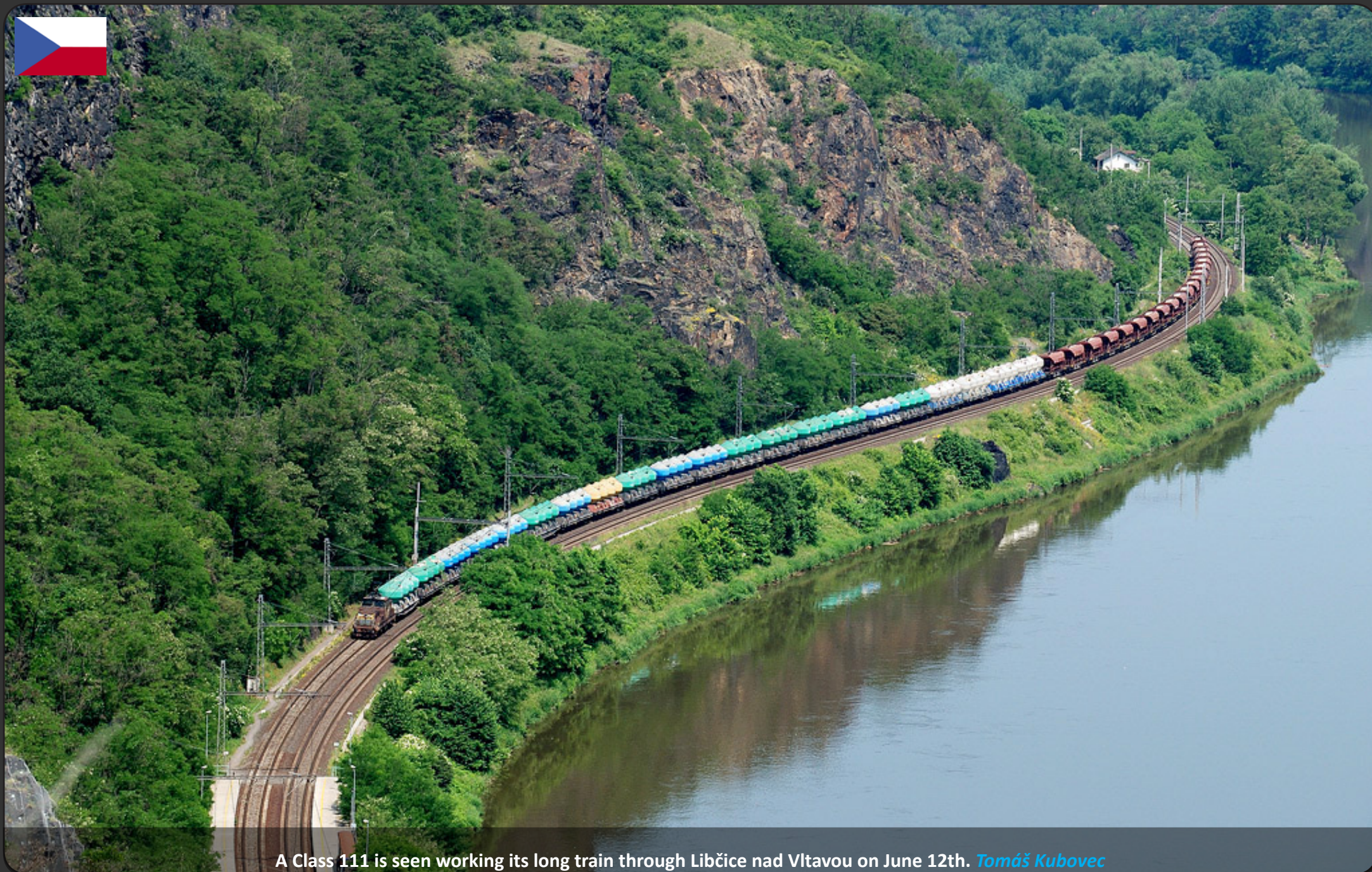
A Class 111 is seen working its long train through Libčice nad Vltavou on June 12th. Tomáš Kubovec