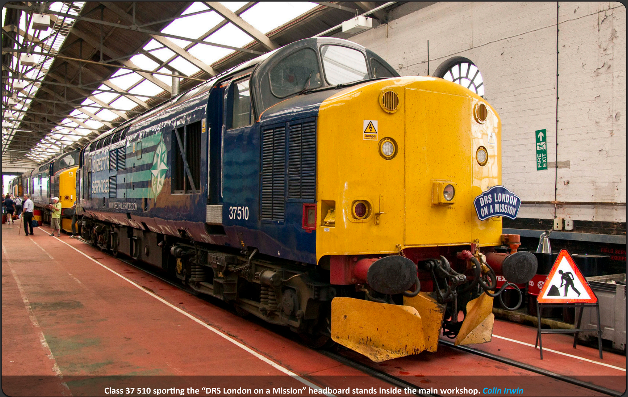
Class 37 510 sporting the “DRS London on a Mission” headboard stands inside the main workshop. Colin Irwin