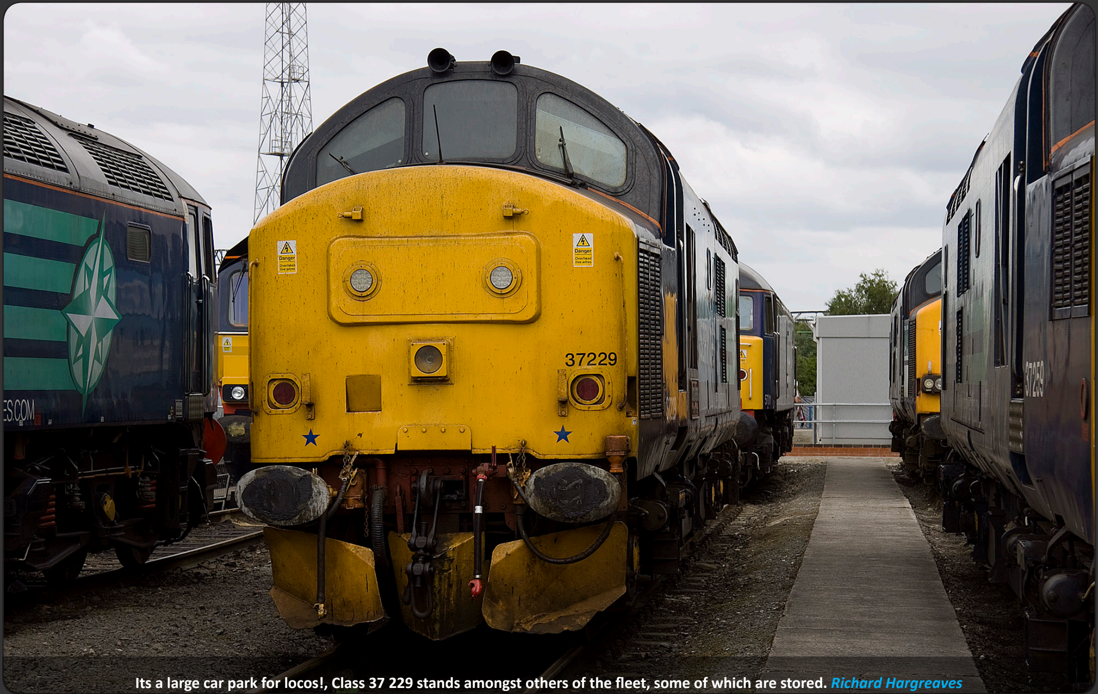
Its a large car park for locos!, Class 37 229 stands amongst others of the fleet, some of which are stored. Richard Hargreaves