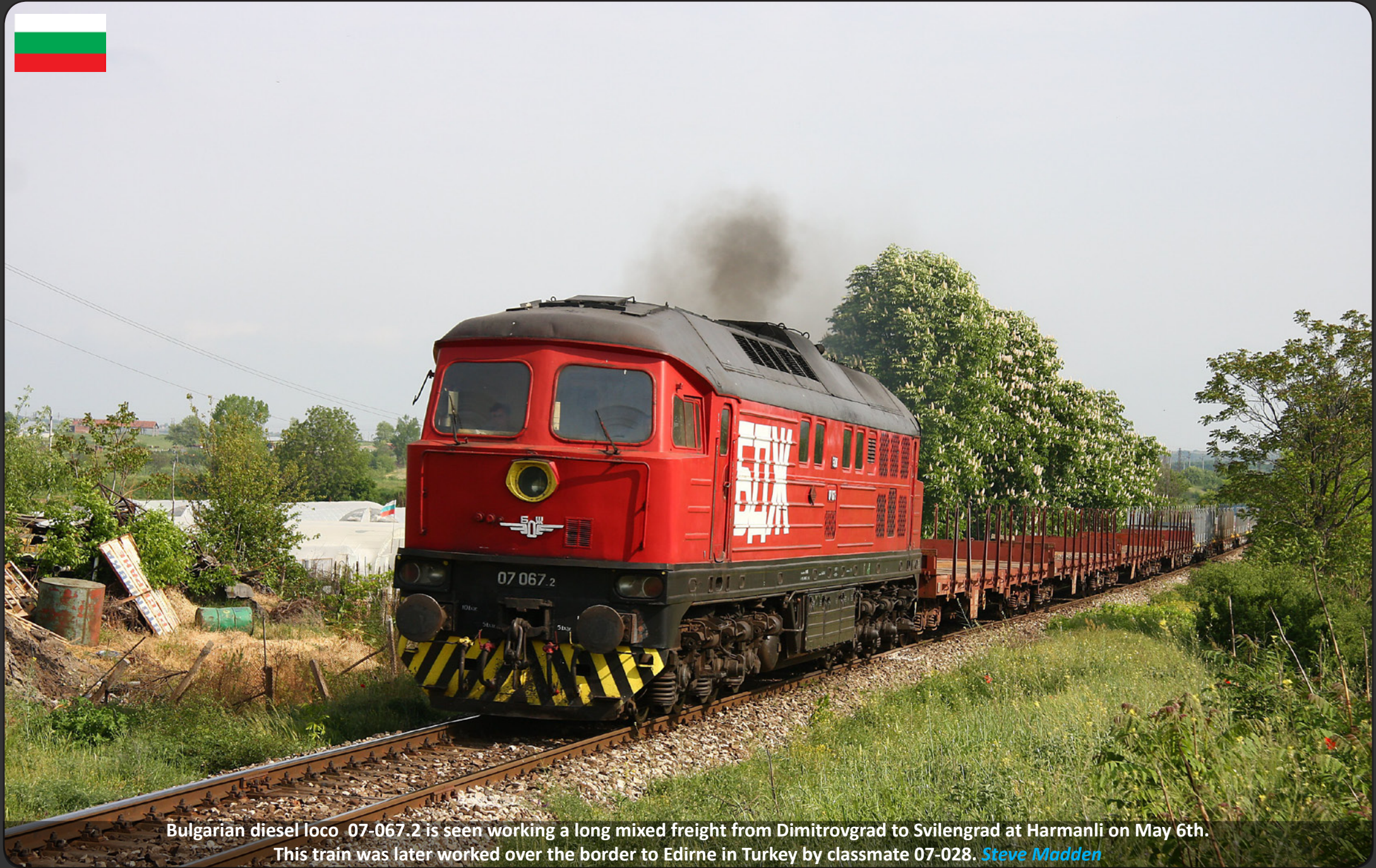
Bulgarian diesel loco 07-067.2 is seen working a long mixed freight from Dimitrovgrad to Svilengrad at Harmanli on May 6th. This train was later worked over the border to Edirne in Turkey by classmate 07-028.