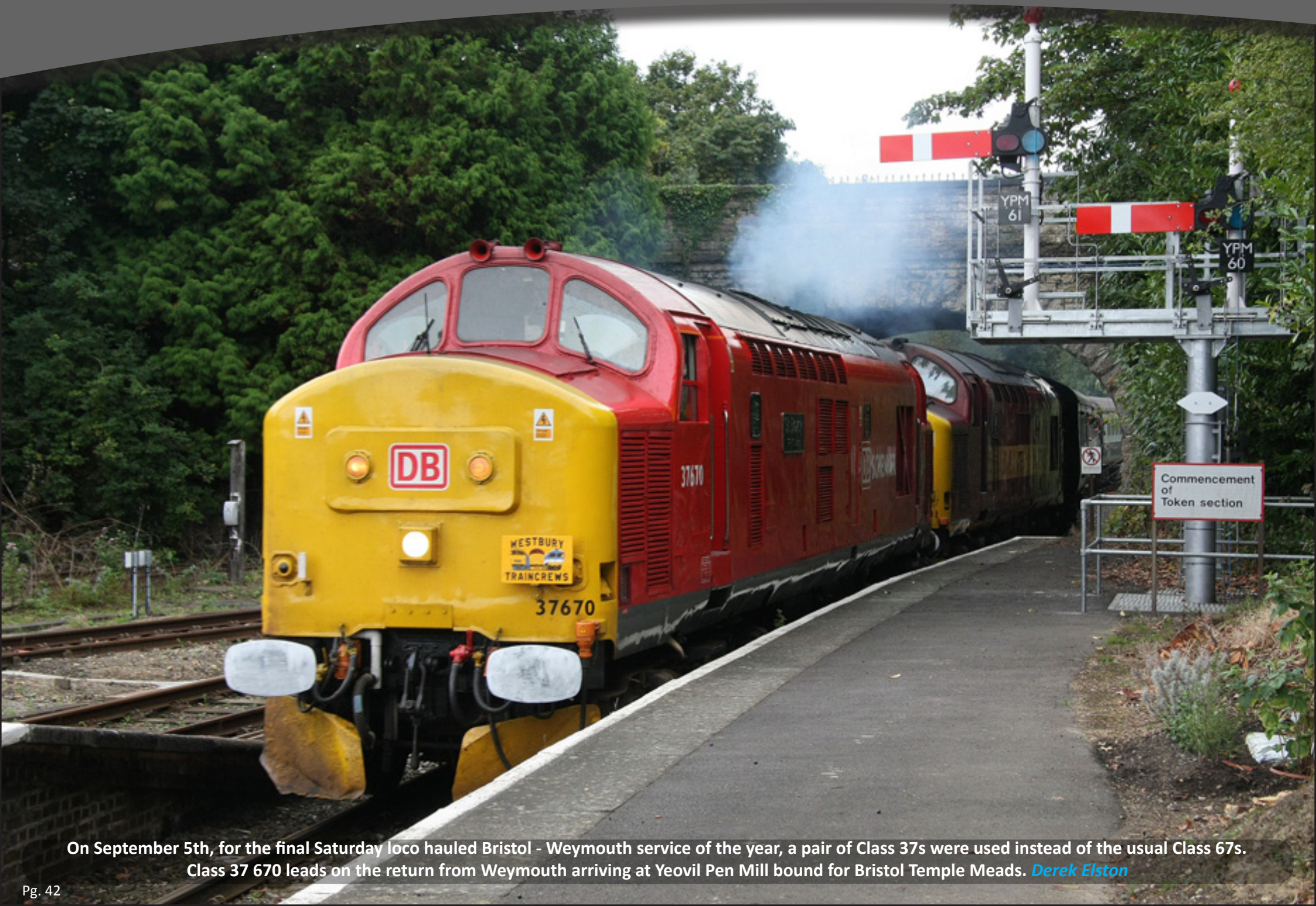
On September 5th, for the final Saturday loco hauled Bristol - Weymouth service of the year, a pair of Class 37s were used instead of the usual Class 67s. Class 37 670 leads on the return from Weymouth arriving at Yeovil Pen Mill bound for Bristol Temple Meads.