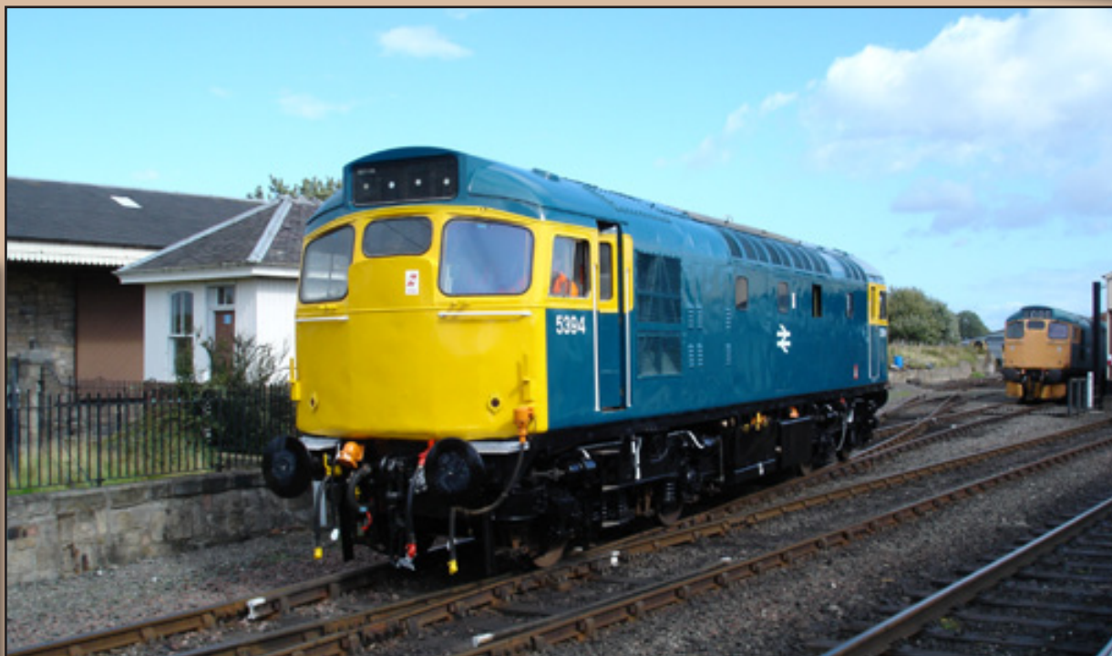
Top Right: D5394 looks superb as it emerges from out of the depot. Donald Croall