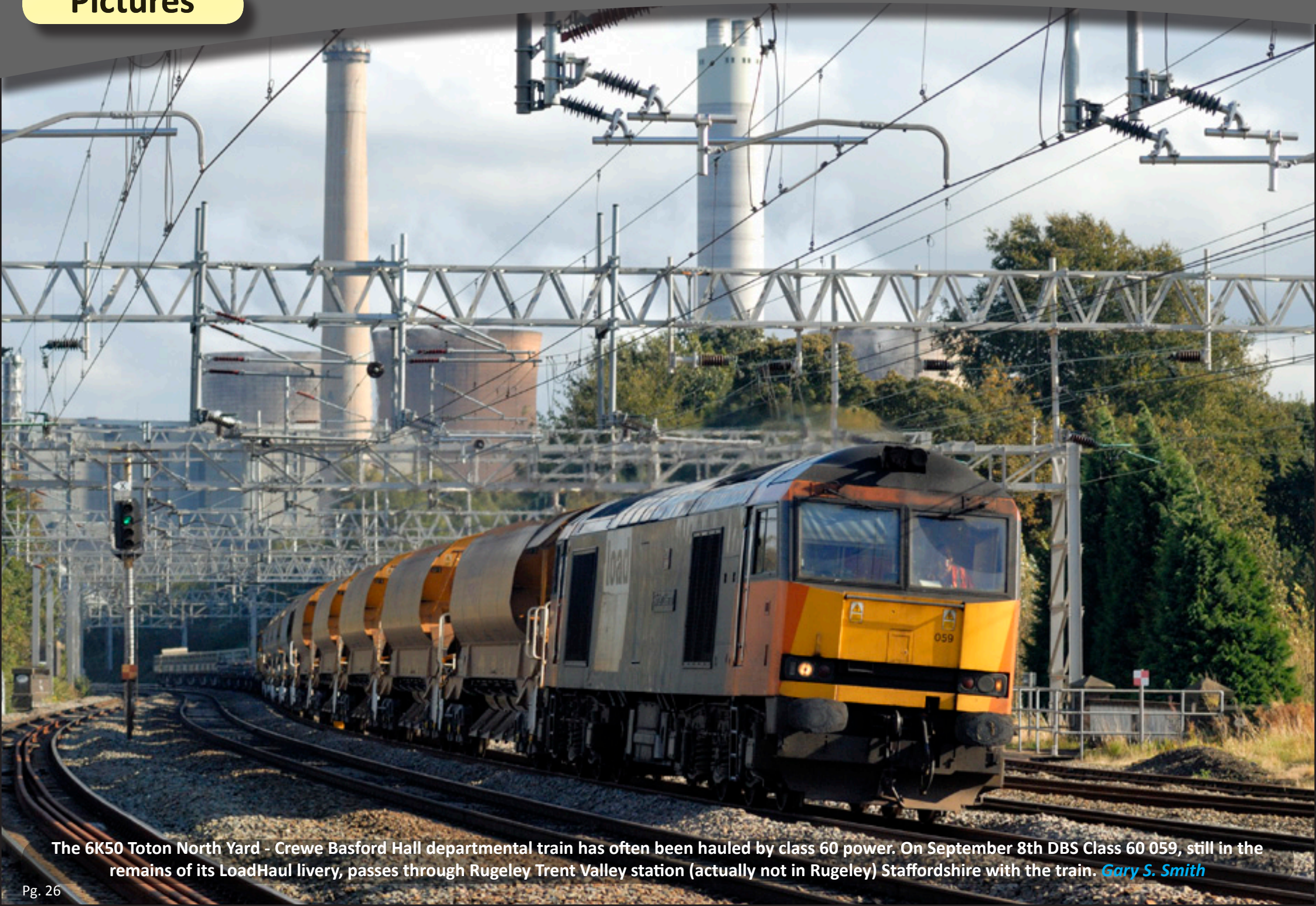
The 6K50 Toton North Yard - Crewe Basford Hall departmental train has often been hauled by class 60 power. On September 8th DBS Class 60 059, still in the remains of its LoadHaul livery, passes through Rugeley Trent Valley station (actually not in Rugeley) Staffordshire with the train. Gary S. Smith