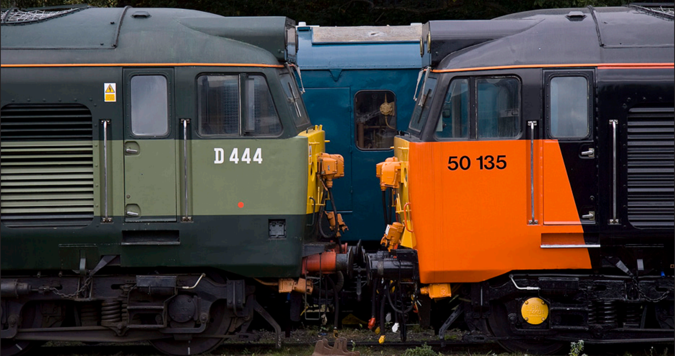
Two Class 50's both carrying unique liveries that were never carried in their BR days. Could this be the future for preserved locos, painting them in liveries not normally carried, it certainly seems like it could be.