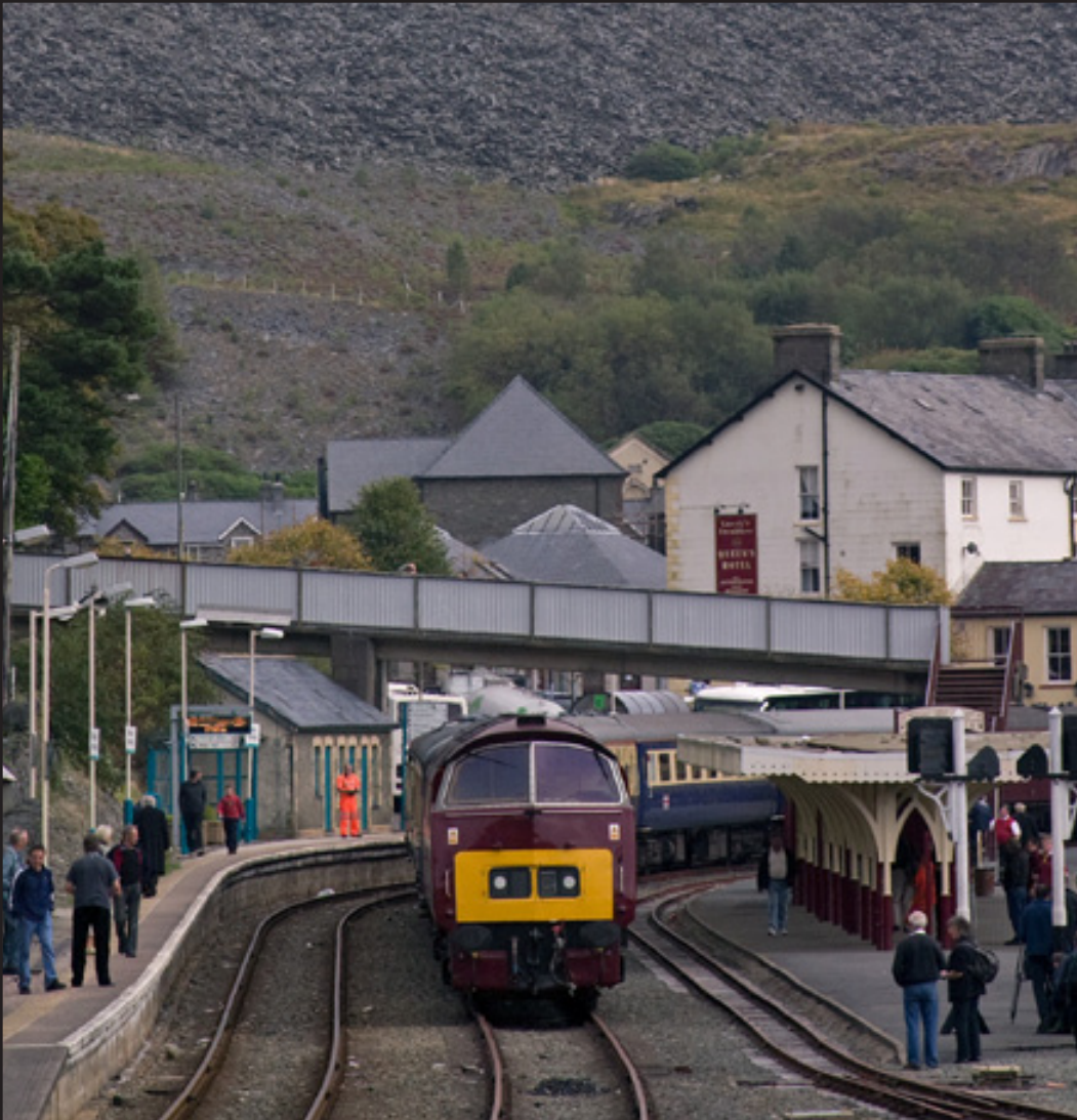
Above: "Wizzo" D1015 is seen after arriving at Blaenau Ffestiniog with 1Z52 Didcot - Blaenau Ffestiniog charter on September 19th.