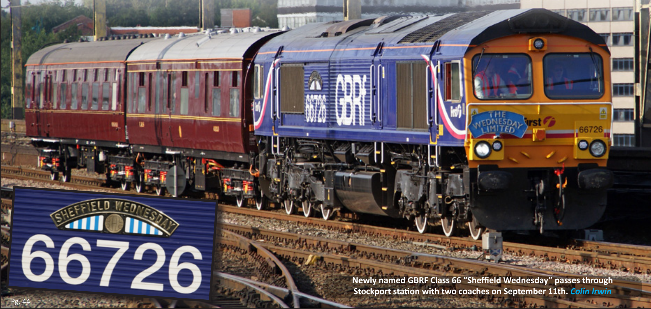
Newly named GBRf Class 66 "Sheffield Wednesday" passes through Stockport station with two coaches on September 11th.