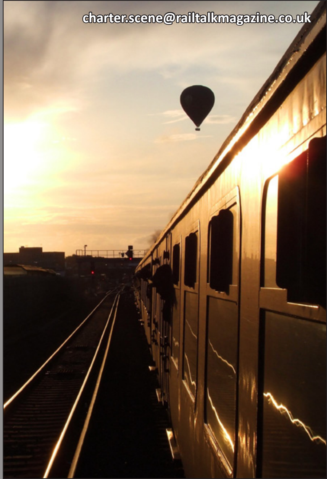
Right: Shepherd Neame’s “The Spitfire” Railtour on September 6th is pictured just outside Tonbridge, in the setting sun. Craig Stretten