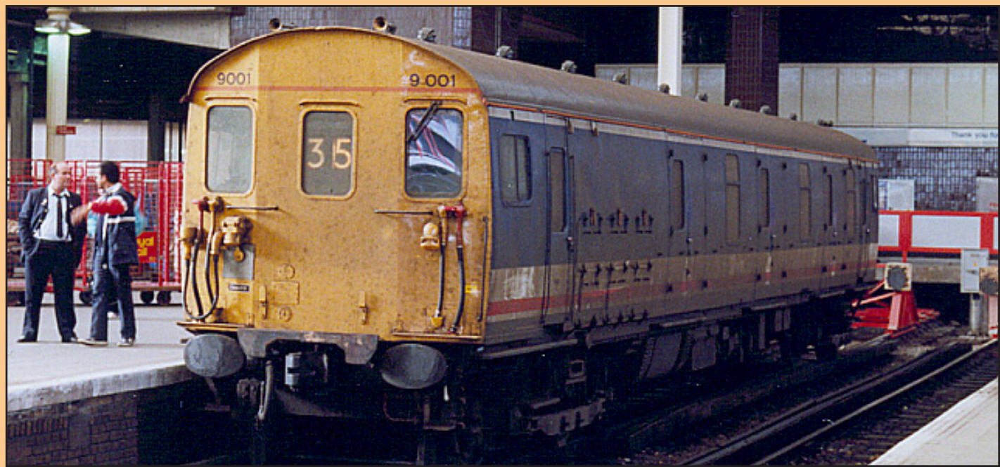
Right: Hard to believe that it is 20 years since this photo was taken, and that Network South East livery was around back in 1989. MLV (Motor Luggage Van) 9001 is pictured at London Bridge on October 28th of that year.