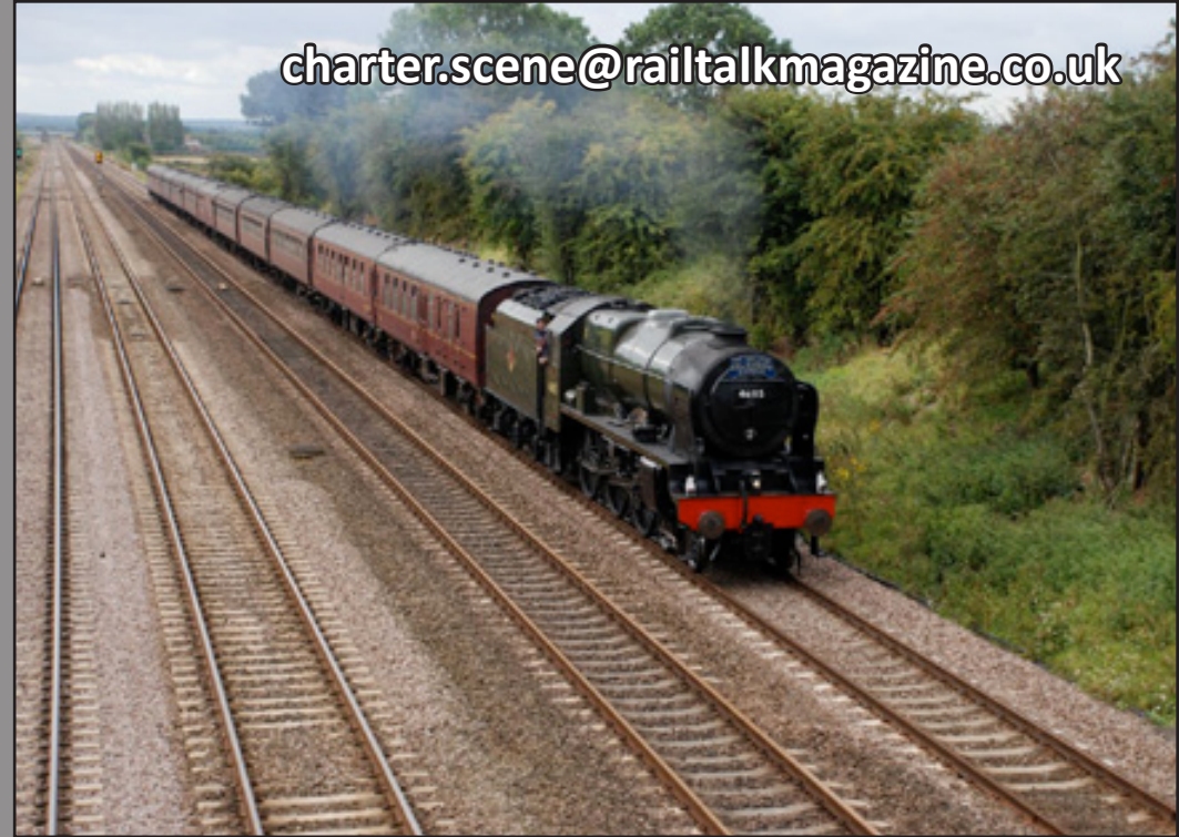
Top Right: On September 6th, saw 46115 "Scots Guardsman", running as 46168 "The Girl Guide" as part of the centenary celebrations of that movement with the train conveying Guides from Merseyside to York. In the event, the loco wasn't renumbered so the deception wasn't immediately apparent. This photo show the outward journey, 1Z68 Liverpool - York, passing Brumber Hill Farm Bridge.