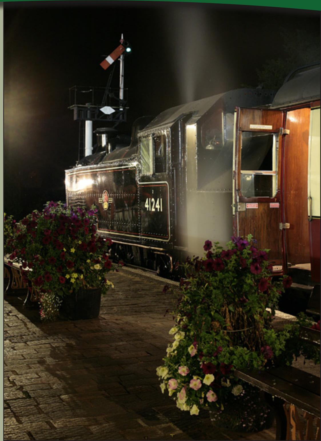
Right: Visiting from the Keighley and Worth Valley Railway was Ivatt tank No. 41241, seen here with an overnight service at Bewdley.