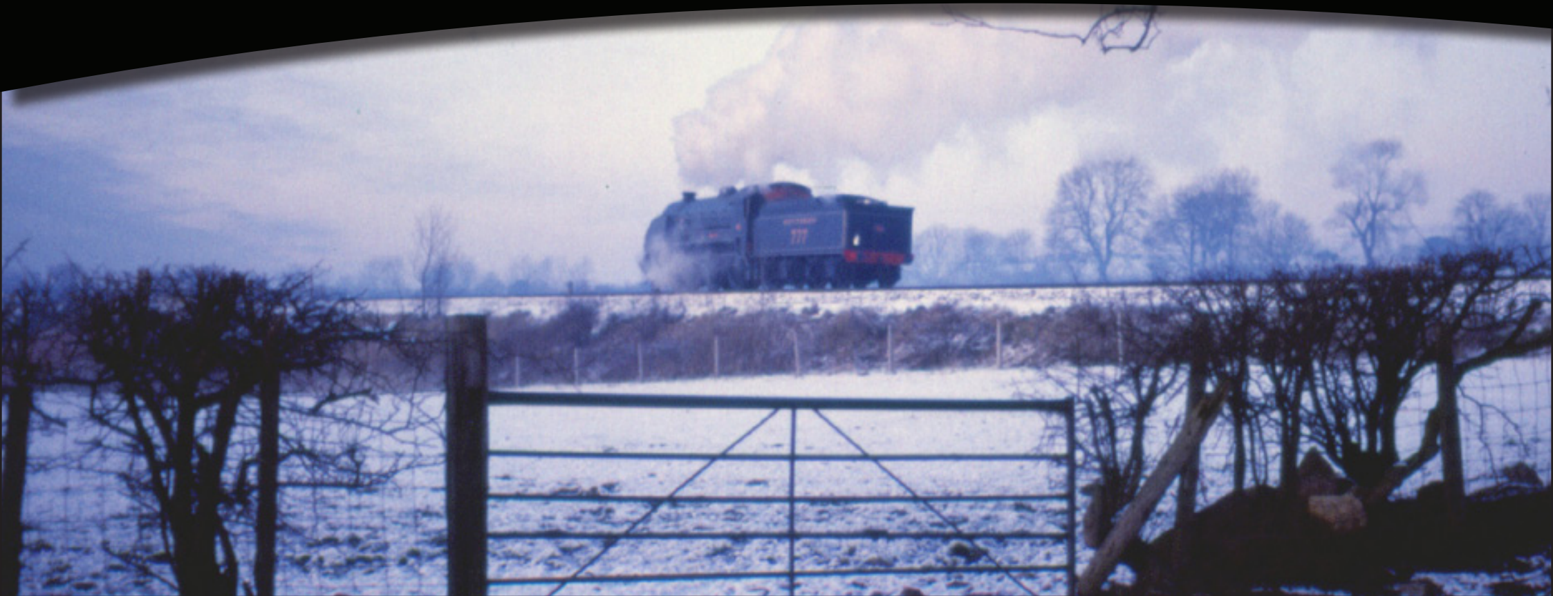
Above: A Wintery Scene near Appleby on 27th December 1984, as preserved 777 "Sir Lamiel" leaves light engine for Carlisle. The loco had brought a "SLOA" Santa steam hauled excursion from Leeds and it returned with a Class 40. 777 having been serviced in Carlisle over-night, then went south the following day to pick up another excursion at Appleby.