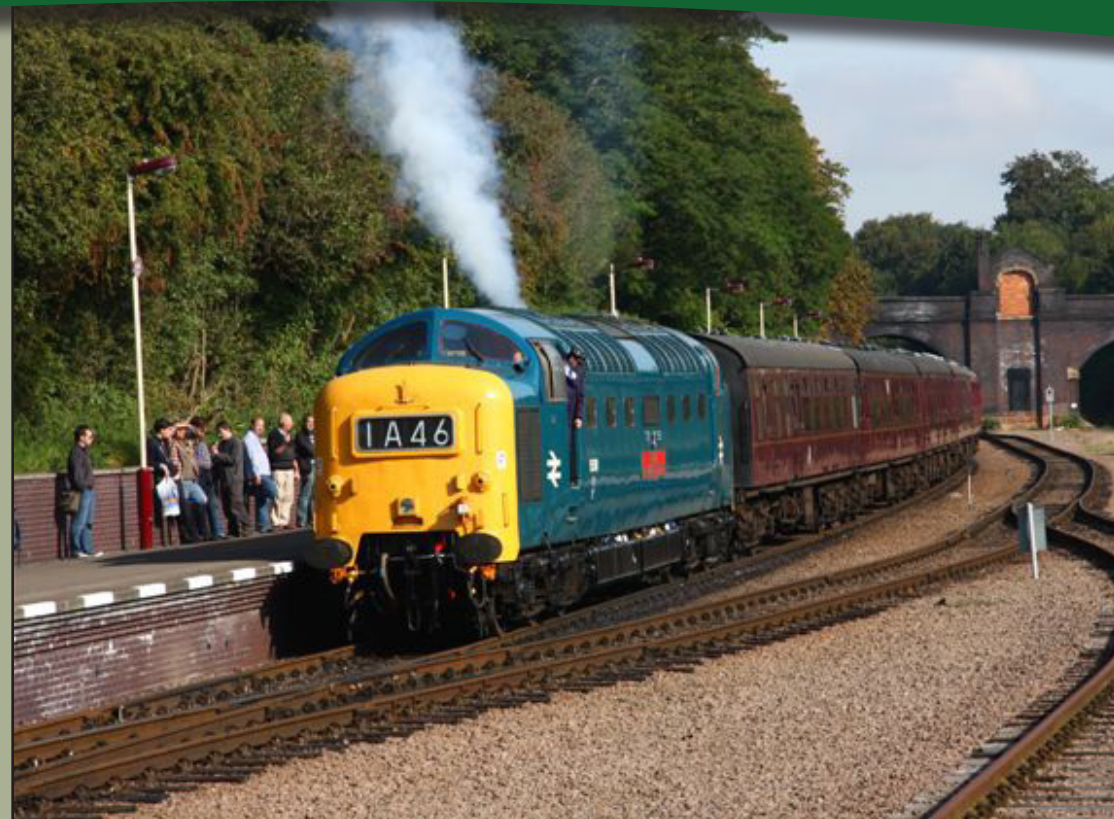
Top Right: Class 55 019 "Royal Highland Fusilier" prepares to run round its train at Leicester North after working 2A06 09.40 Loughborough Central - Leicester North on September 11th. Steve Madden