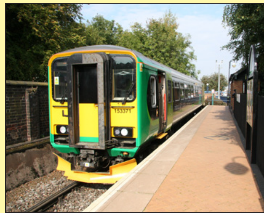
Bottom Right: Deputising for non available PPM, on September 19th, Class 153 371 stands at Stourbridge Town forming the 11.00 to Stourbridge Junction, a 2 minute journey time. Derek Elston