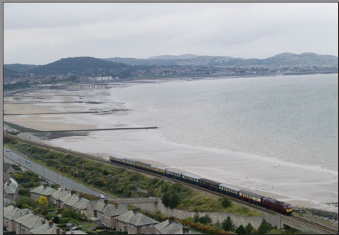
Bottom Right: D1015 "Western Champion" rolls along the coast through Colwyn Bay with Pathfinder Railtour's 1Z53 Blaenau Ffestiniog - Didcot, the return "The Western Slater" tour, 19th September. Dave Dawson