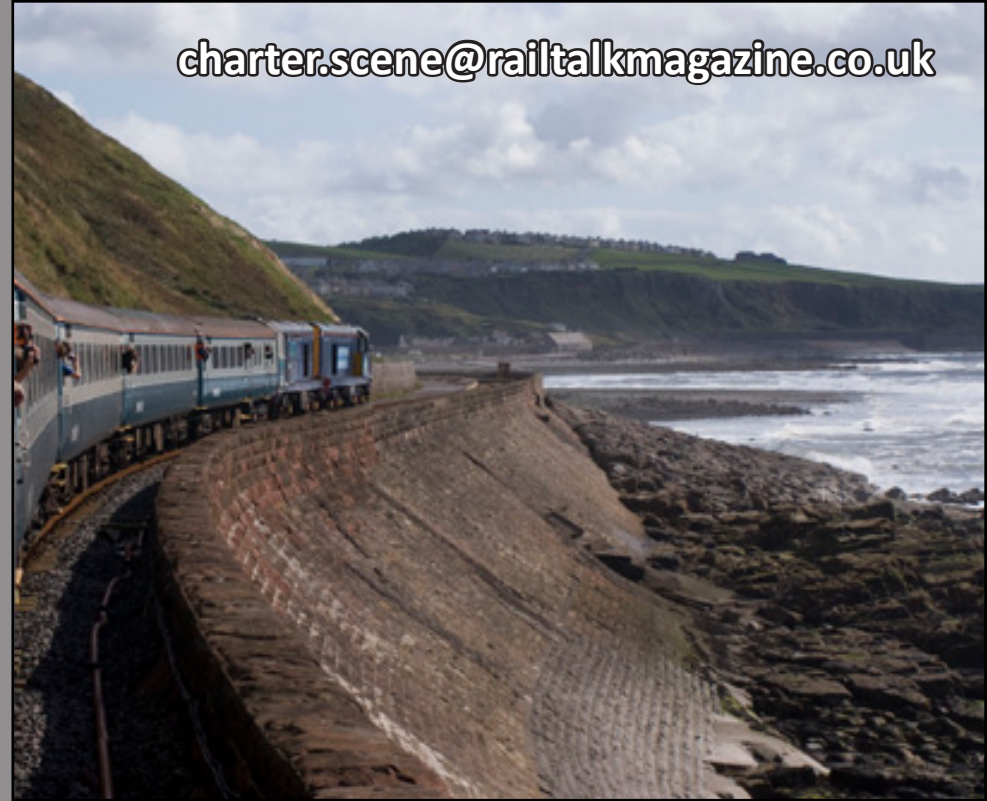
Top Left: Class 20 306 and 20 301 approach Leyland working 1240 Huddersfield - Carlisle Retro Railtours charter on August 29th.