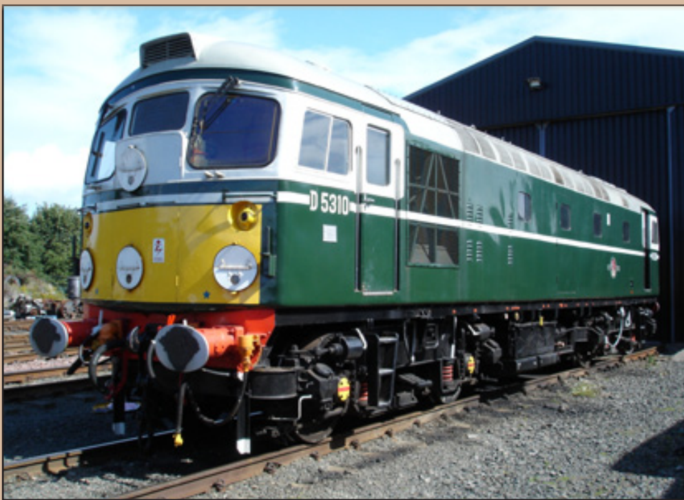
Left: Class 26 010 (D5310) is seen sitting outside the M.M.P.D. shed in the yard at Bo'ness.