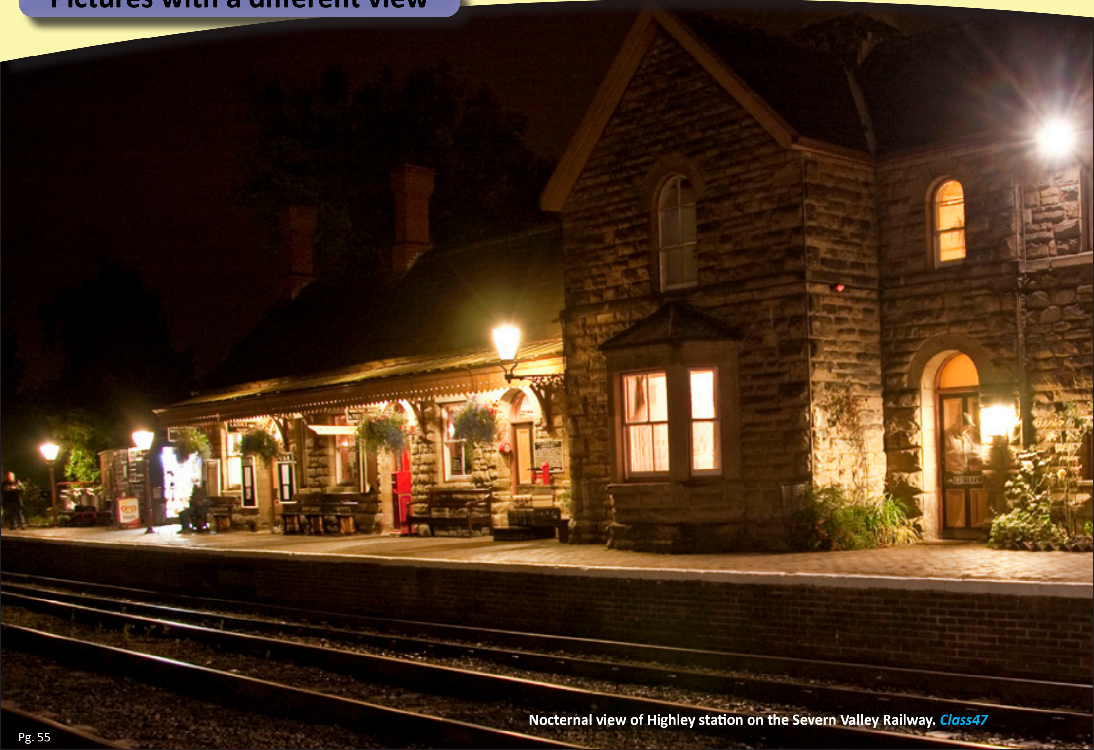
Nocturnal view of Highley station on the Severn Valley Railway. Class47