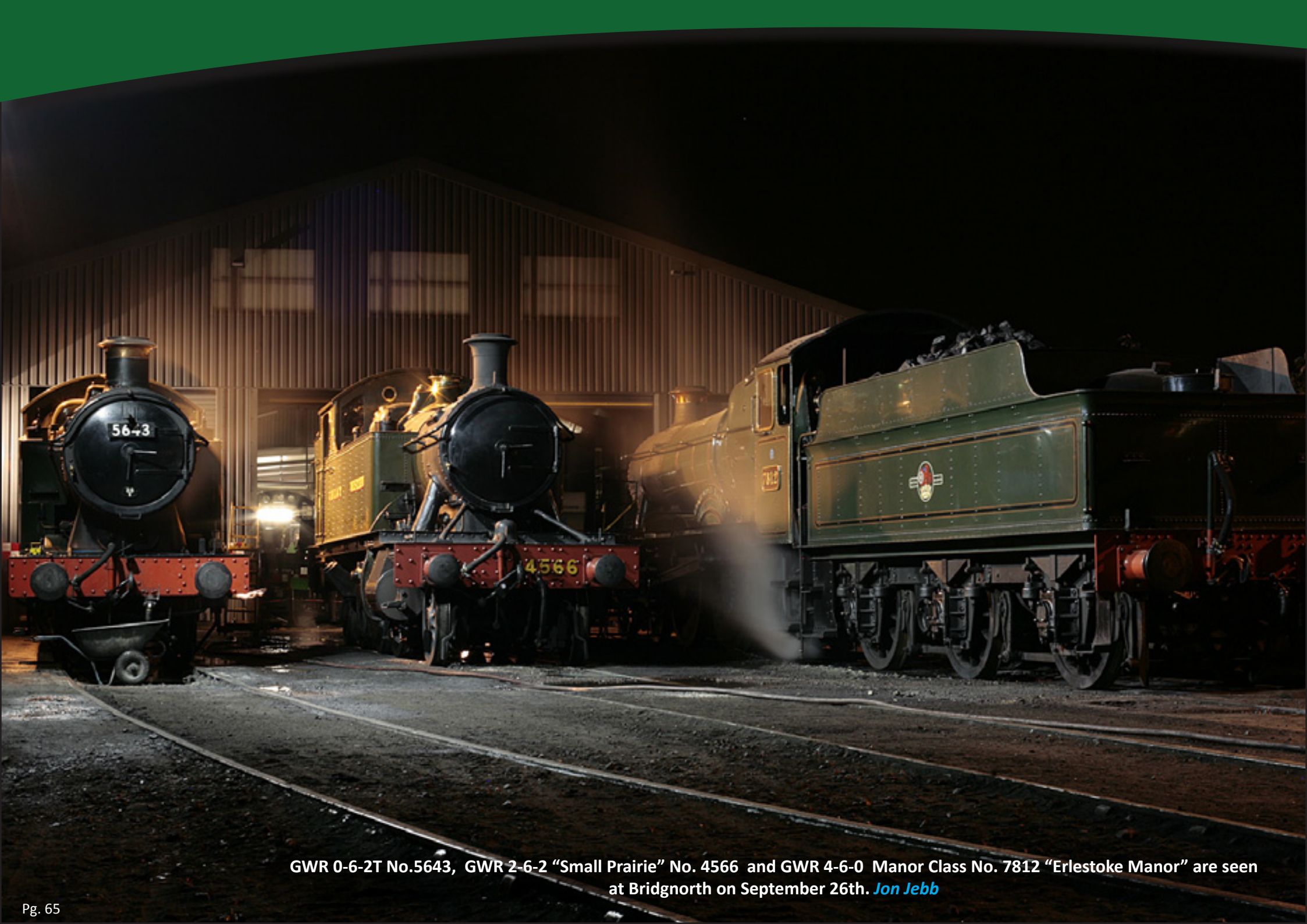
GWR 0-6-2T No.5643, GWR 2-6-2 "Small Prairie" No. 4566 and GWR 4-6-0 Manor Class No. 7812 "Erlestoke Manor" are seen at Bridgnorth on September 26th.