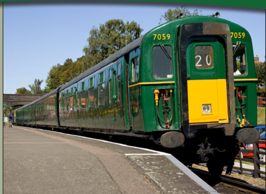
Top Right: Looking superb both inside and out, the lines 4-BIG unit 7059 stands at Quorn on September 12th.