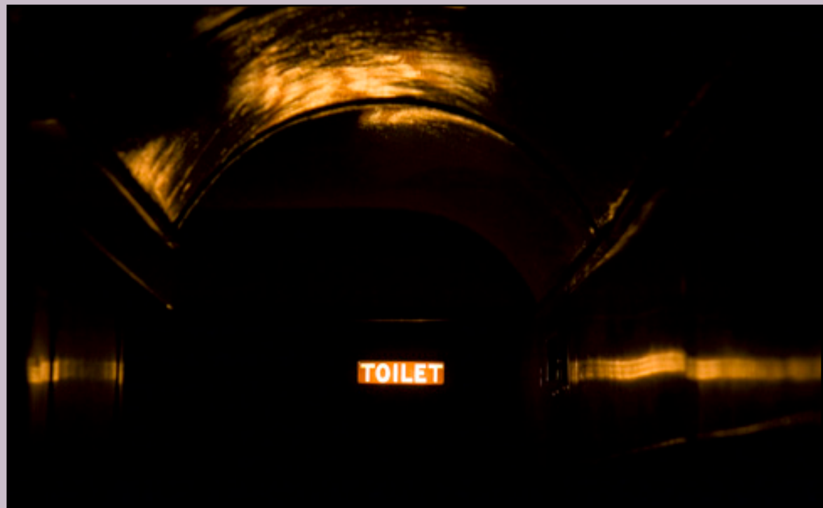
Bottom Right: The inside of a Third Class carriage from the Severn Valley Railway, where the only lighting was this Toilet sign.