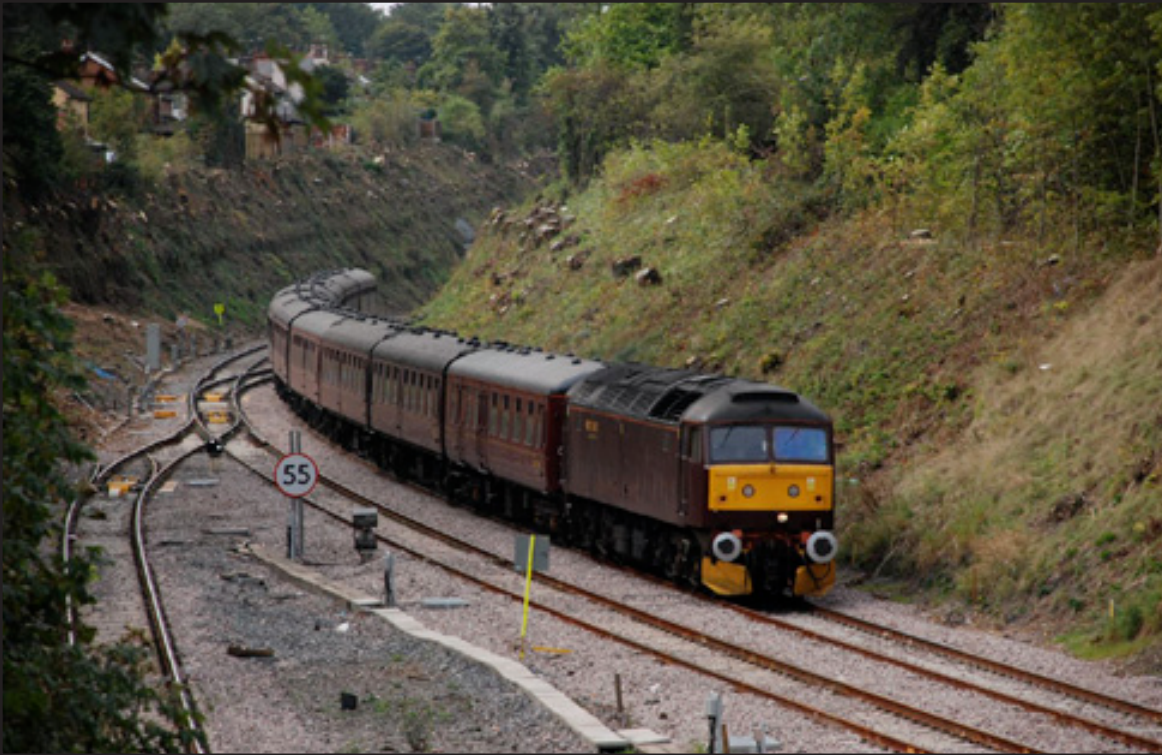
Top Left: Class 47 760 threads it's way through the recently deforested cutting west of Scunthorpe Station with an ECS heading for Barnetby.