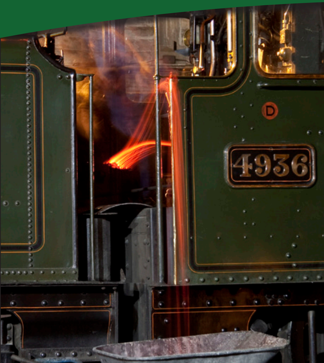
Above: At the end of the day, the ashes from No. 4936 are cleaned out ready for the next days duties. Class47