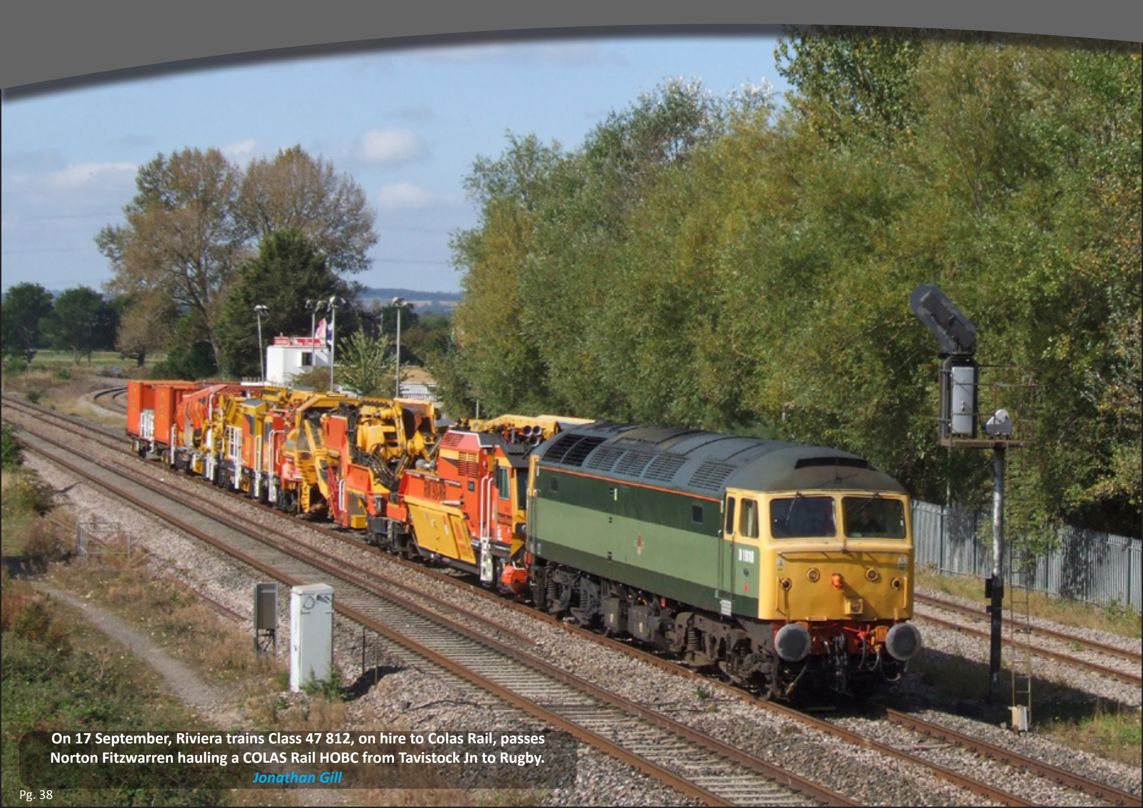
On 17 September, Riviera trains Class 47 812, on hire to Colas Rail, passes Norton Fitzwarren hauling a COLAS Rail HOBC from Tavistock Jn to Rugby.