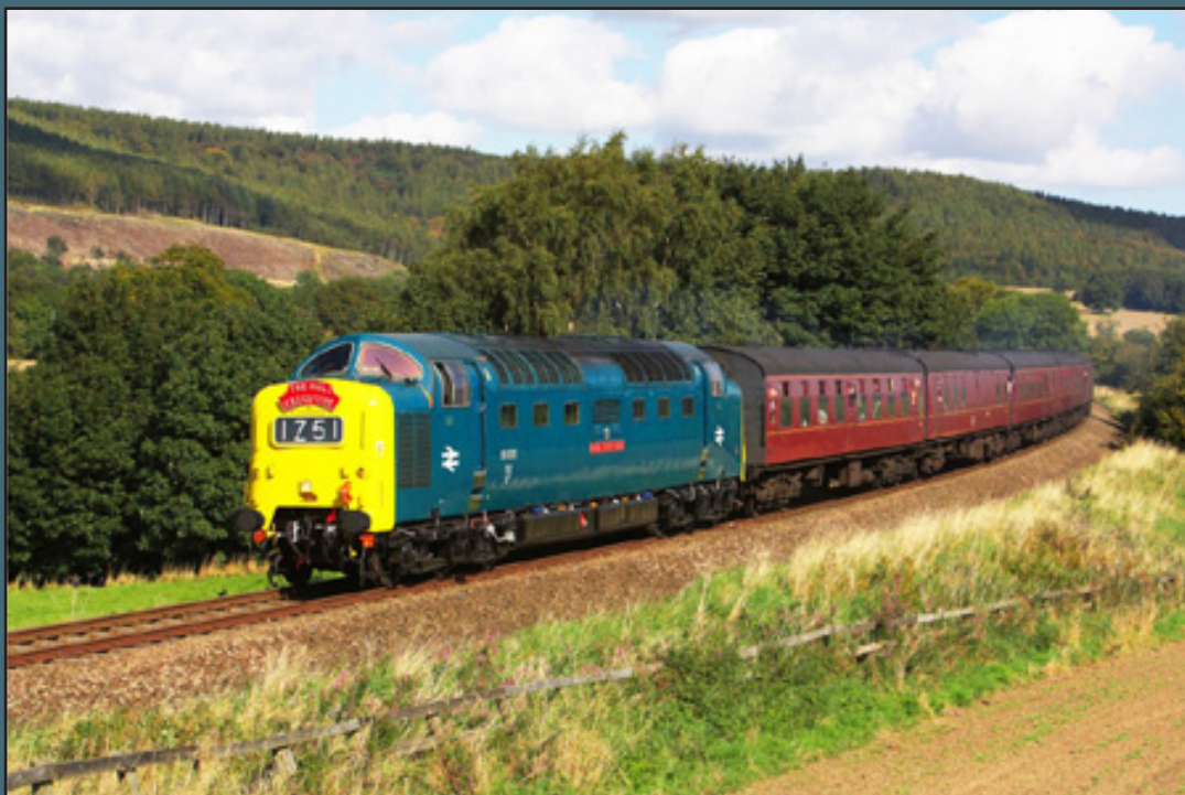
Photo: On Sunday 20th September whilst working the North Yorkshire Moors Railway Whitby - Battersby Mainline section, the only mainline Deltic passenger action at all since August 30th 2008! 22 is seen passing Dundale.