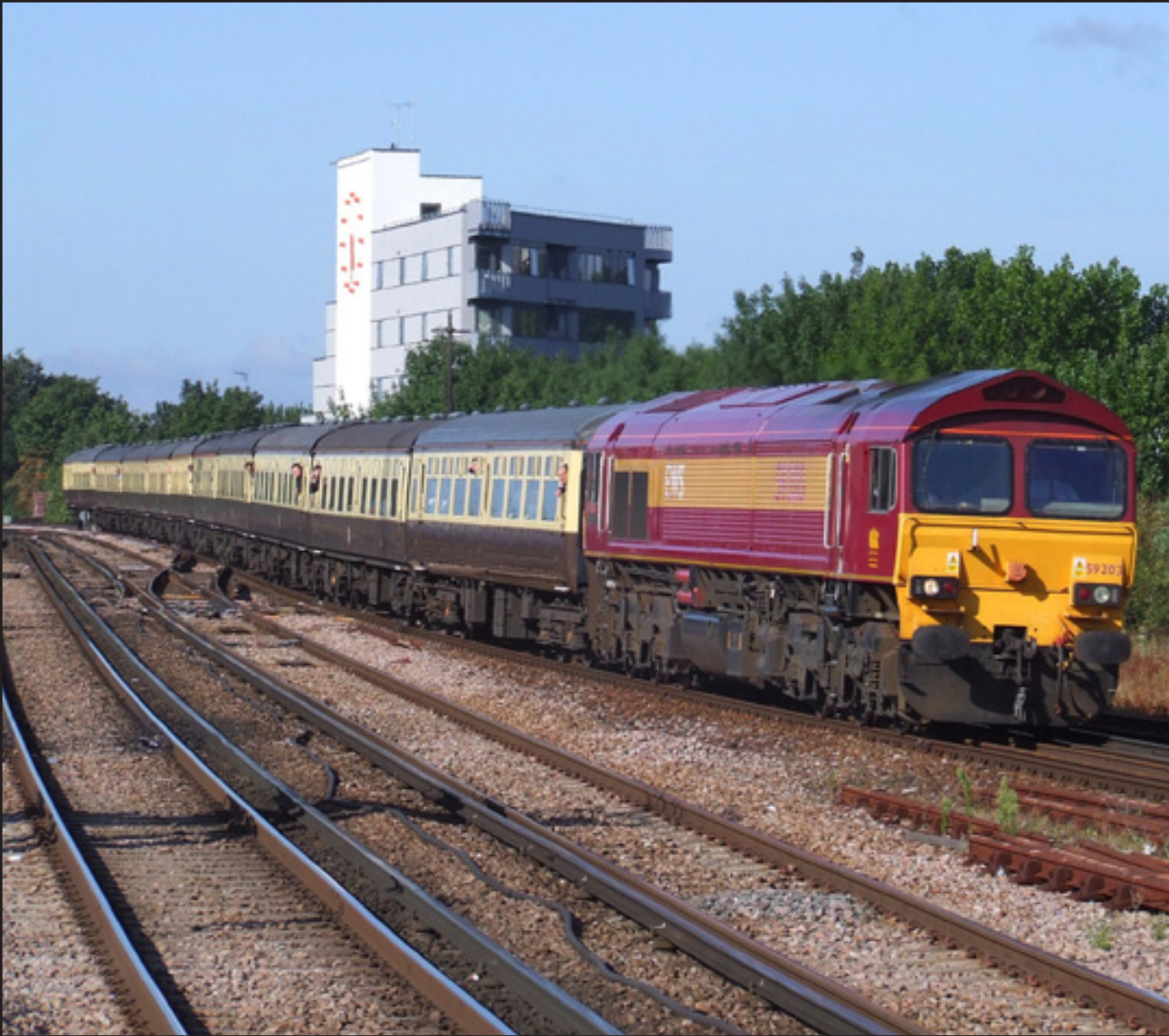
Above: Class 59 203 arrives at Clapham Junction, working UK Railtours' "The Harwich Hook" Railtour, which visited Dollands Moor yard, Wembley yard, Temple Mills Loop, Ipswich and Harwich International, September 5th.