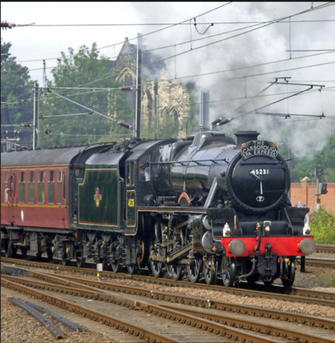
Above: 45231 arrives at York with the ECS for “The Scarborough Spa Express” on August 18th.