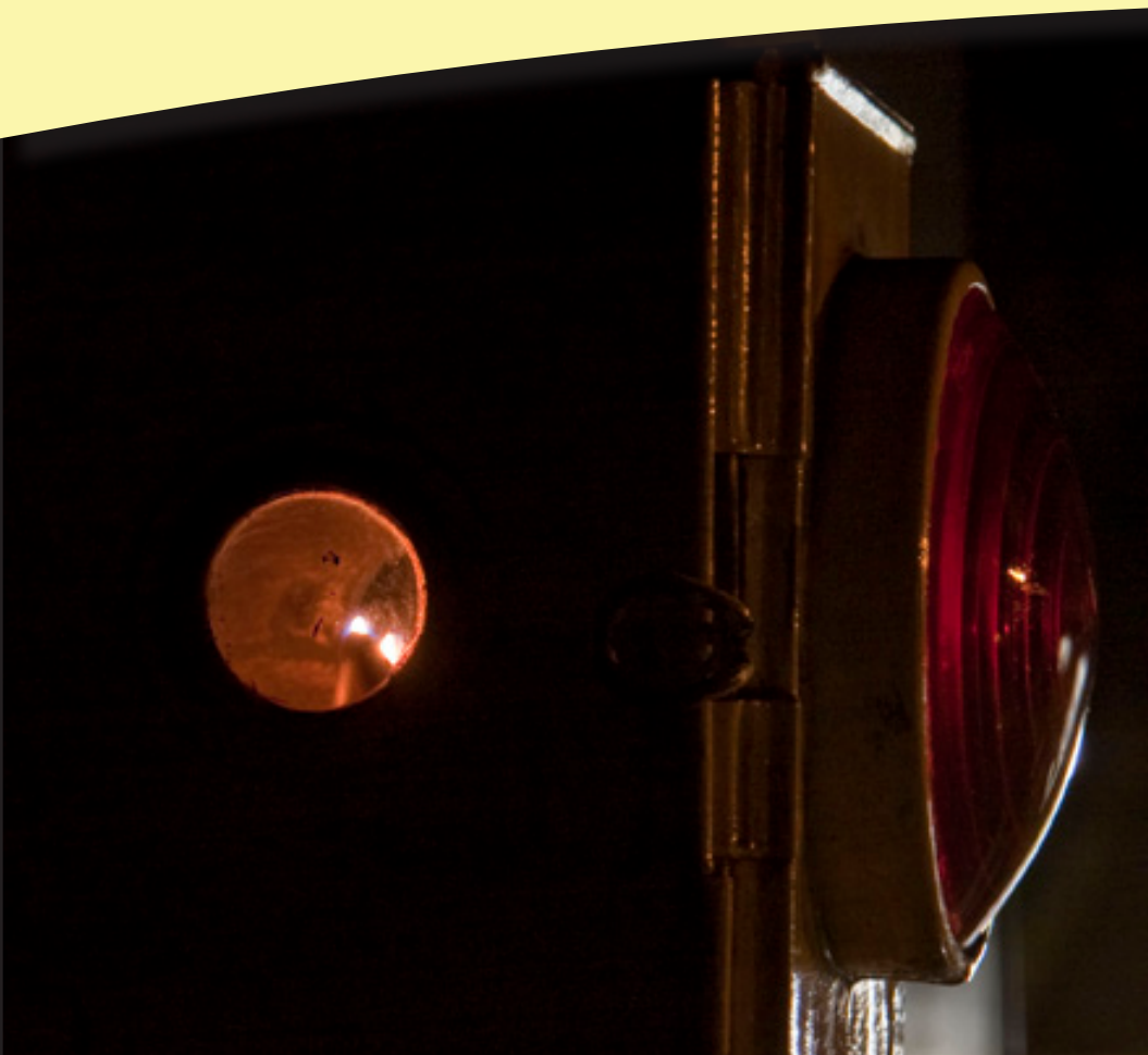
Above: A traditional oil filled Tail Lamp flickers at the rear of this service.. Class47