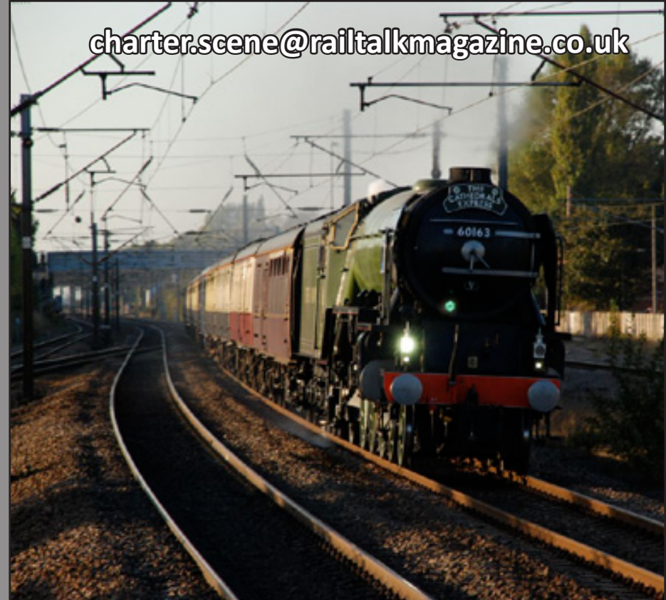
Top Right: 60163 "Tornado" works the return charter from York to Kings Cross through Retford on September 26th.