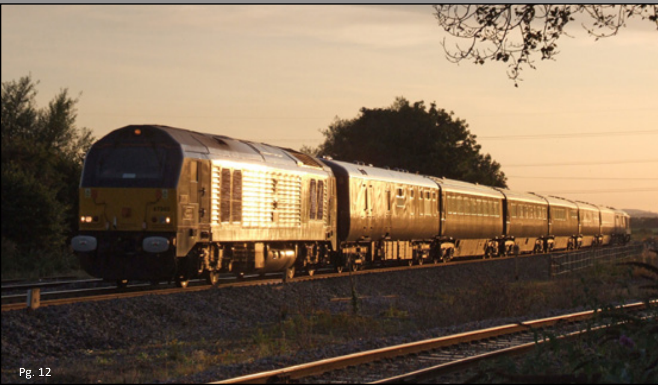
Top Left: Class 67 027 pauses at Doncaster on September 5th whilst working 1Z67 York - Stratford on Avon "Northern Belle." Class47