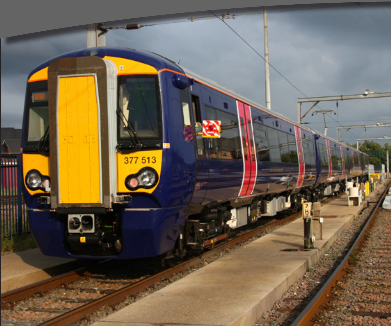
Above: August 24th at Bedford Carriage Sidings and Class 377 513 has just been delivered to FCC after its test runs were completed at Selhurst Depot. It had not run in passenger service at this point.