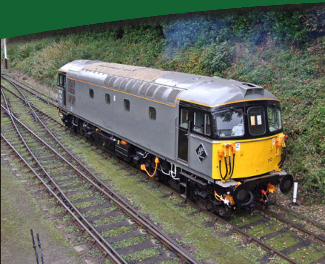
Top Left: Recently repainted in departmental grey livery, Class 33 110 is pictured working at the Bodmin and Wenford gala on September 26th.