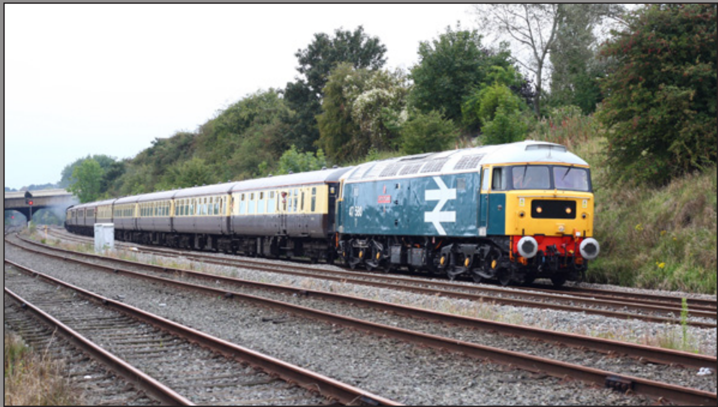
Right: Class 47 580 "County of Essex" accelerates away from Corby Station with Vintage Trains Charter 1Z22 Corby - Melton Mowbray on August 31st.