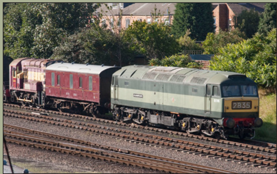
Bottom Right: Class 47 D1705 "Sparrowhawk" is pictured with one of the lines newest arrivals, Class 08 694 still wearing EWS livery.