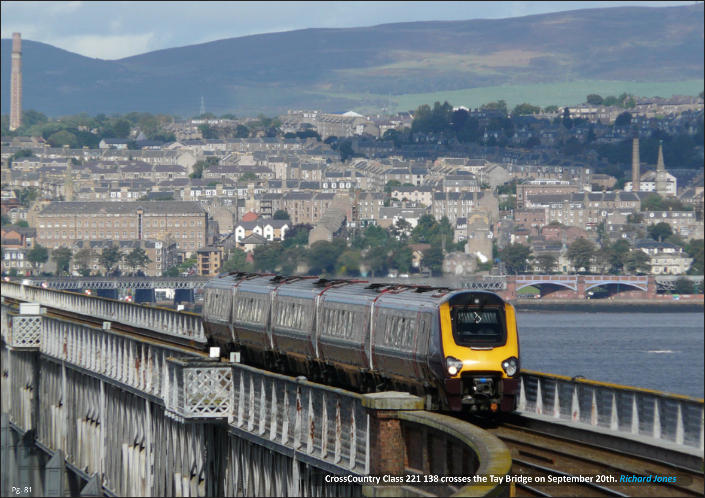
CrossCountry Class 221 138 crosses the Tay Bridge on September 20th.