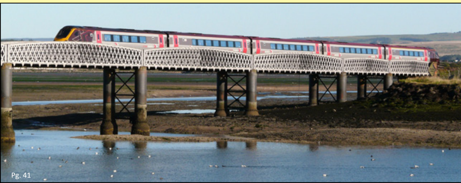
Left: CrossCountry Class 221 138 crosses Montrose Basin on September 20th.