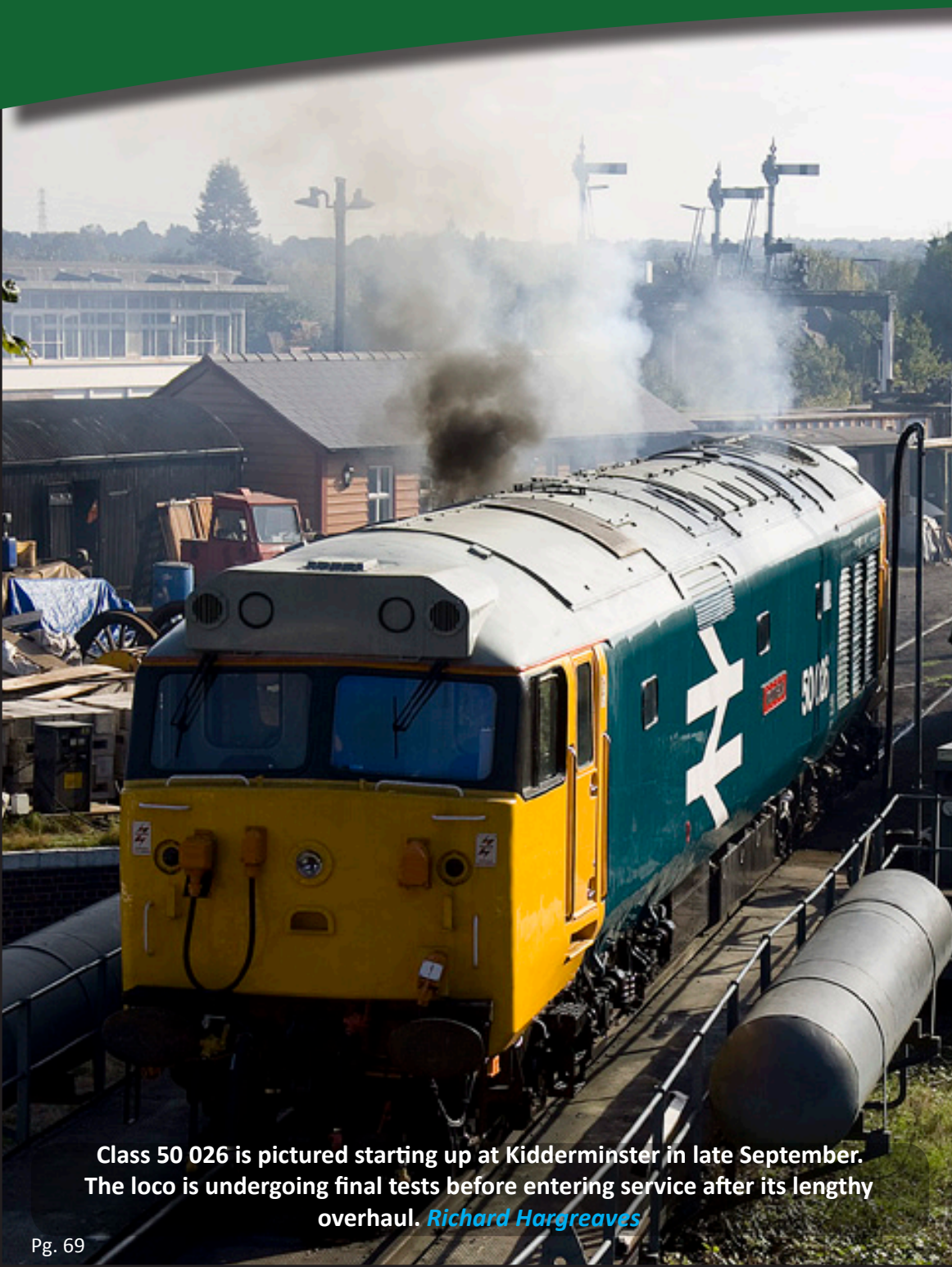
Class 50 026 is pictured starting up at Kidderminster in late September. The loco is undergoing final tests before entering service after its lengthy overhaul. Richard Hargreaves