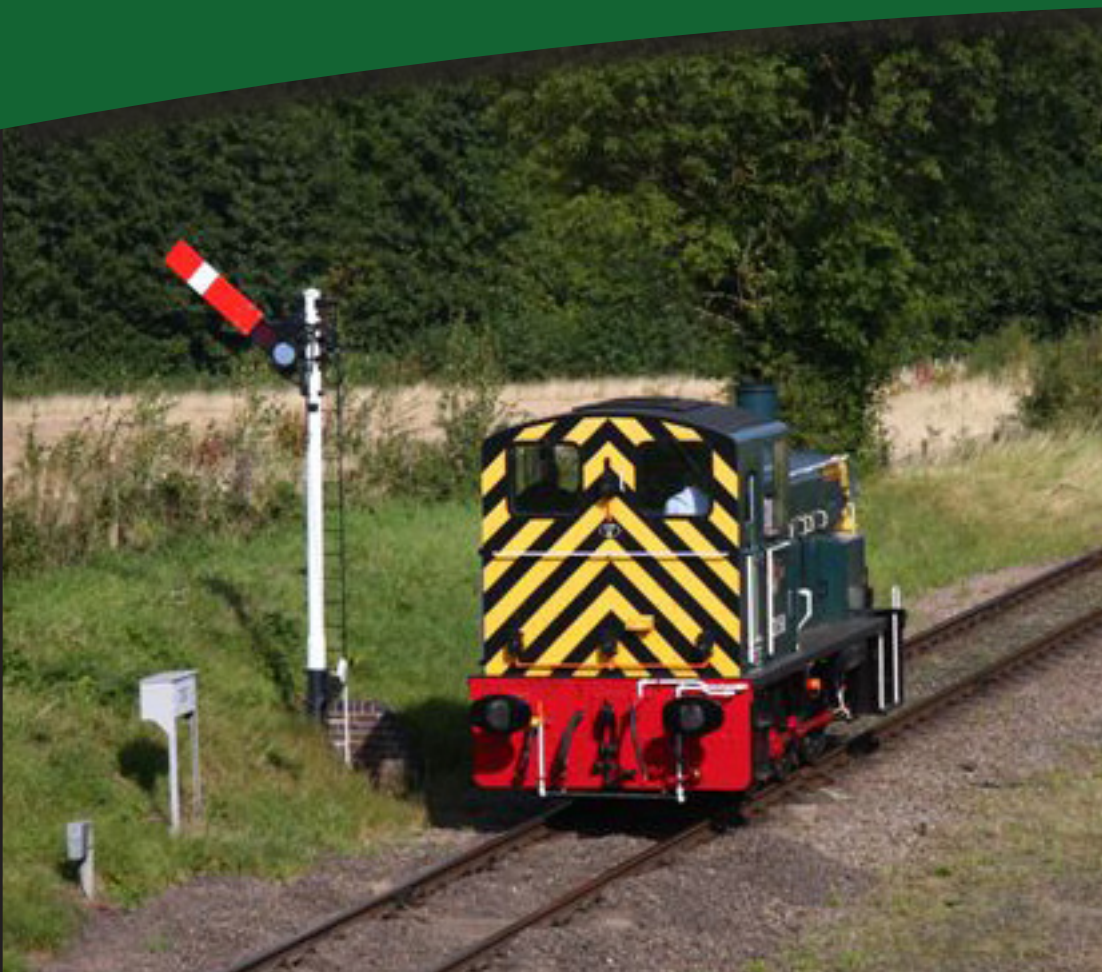
Above: Some more from the Great Central including a rare outing for Class 03 D2158 seen here running light engine to Loughborough Shed on September 11th.