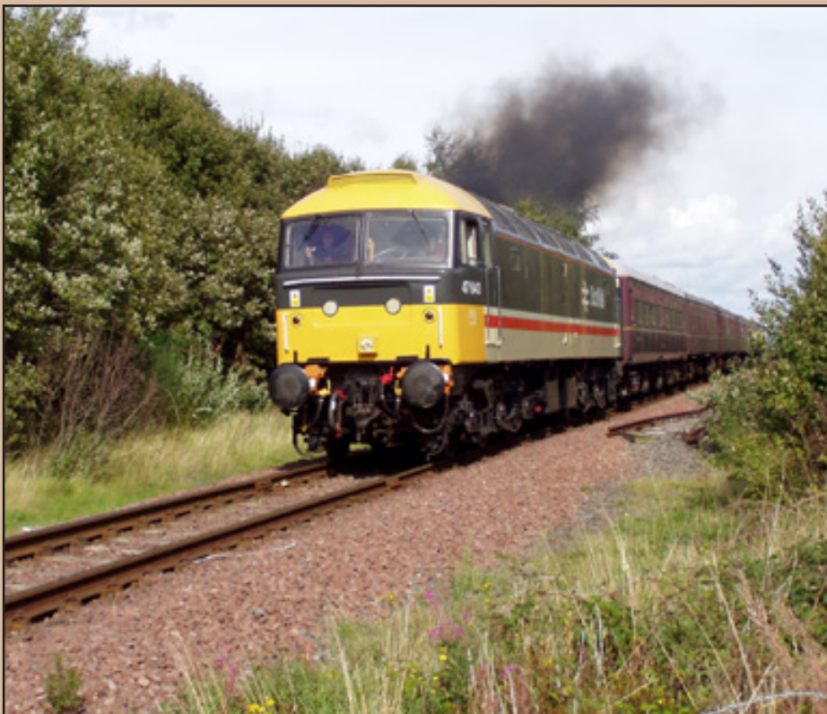
Above: Class 47 643 clags away fro Bo'ness. Jon Drummond