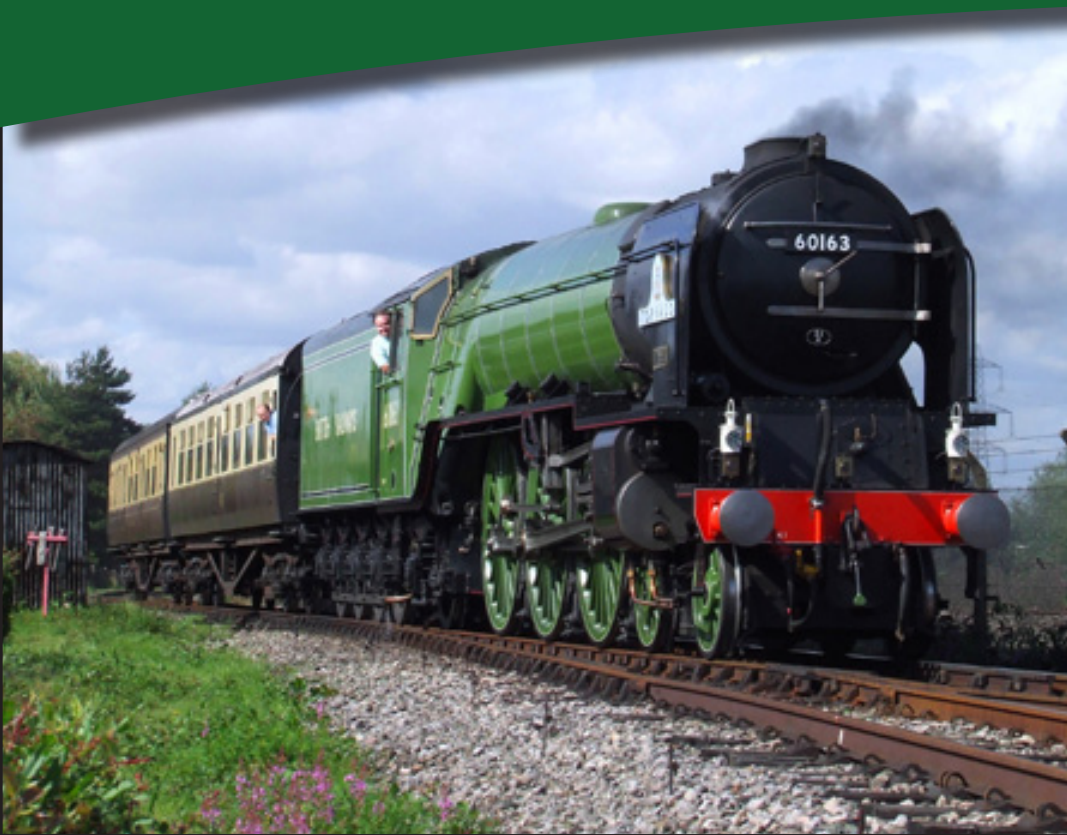
Top Left: A1 class No. 60163 Tornado hauls two GWR coaches on one of the demonstration lines at the Didcot Railway Centre, on August 29th.