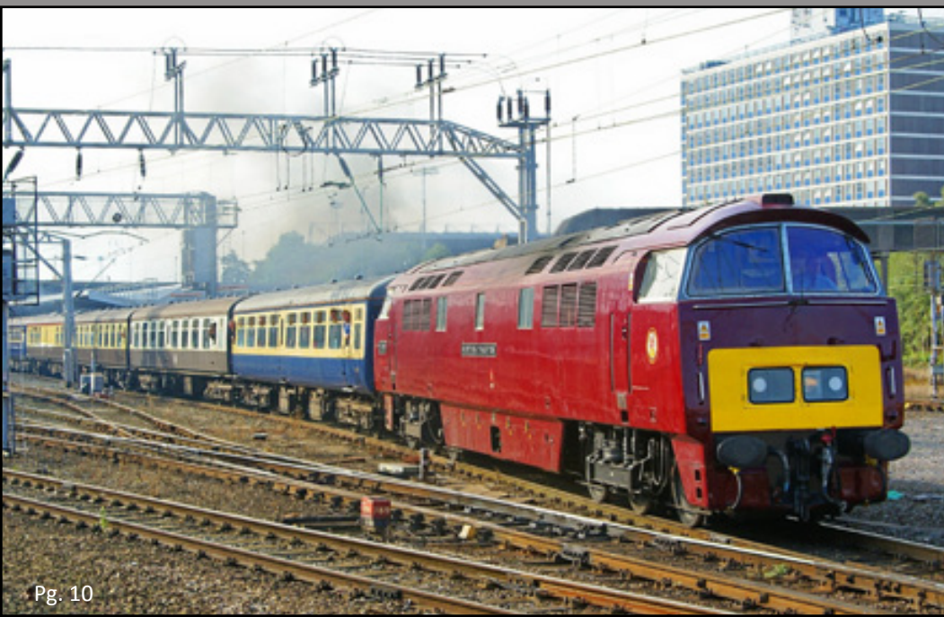
Bottom Left: DTG's Class 52 No D1015 "Western Champion" is seen here departing Crewe with Pathfinder Tours "Western Slater" tour on September 19th. Dave Harris