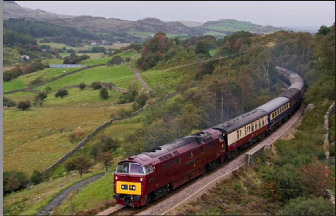
Top Right: A shot of the tour earlier in the day as D1015 is seen passing through Blaenau Dolwydd with 1Z52 Didcot - Blaenau Ffestiniog, September 19th. Carl Grocott