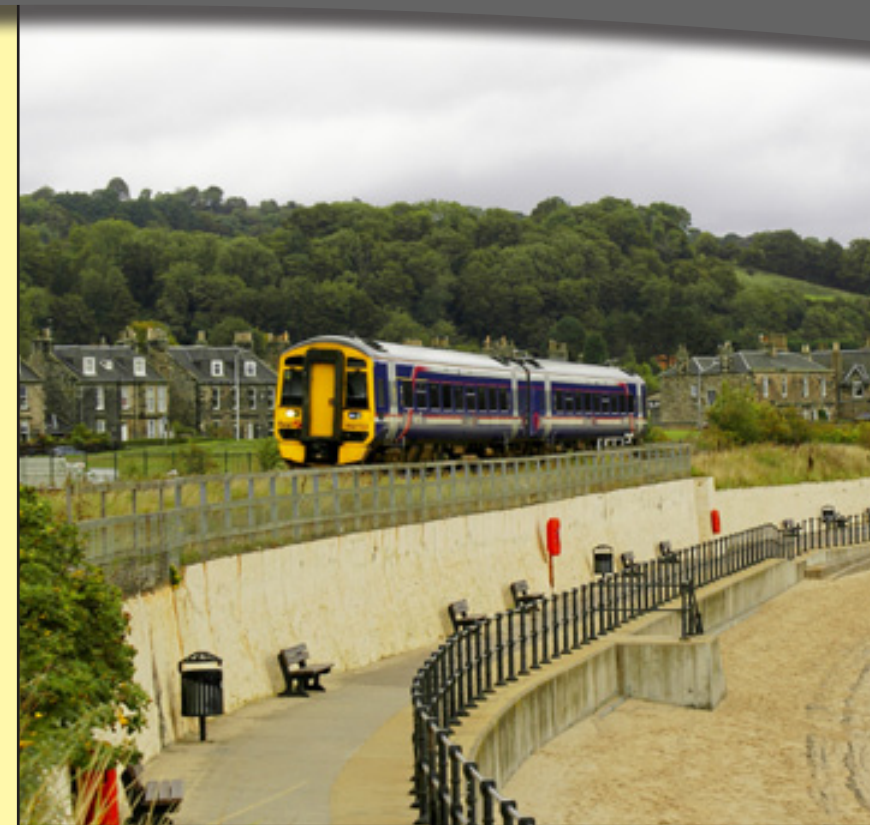
Top Right: A ScotRail Class 158 skirts the sea wall at Burntisland with a service for Edinburgh on September 25th.