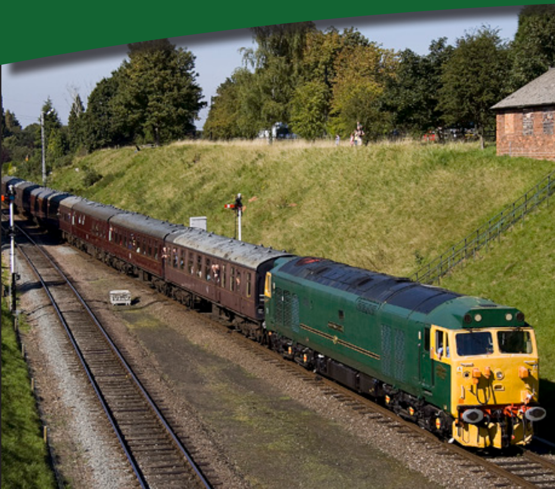
Above: One of the visitors to the Great Central for the Diesel Gala was Class 50 007 "Sir Edward Elgar" its unique lined green livery still looking good.