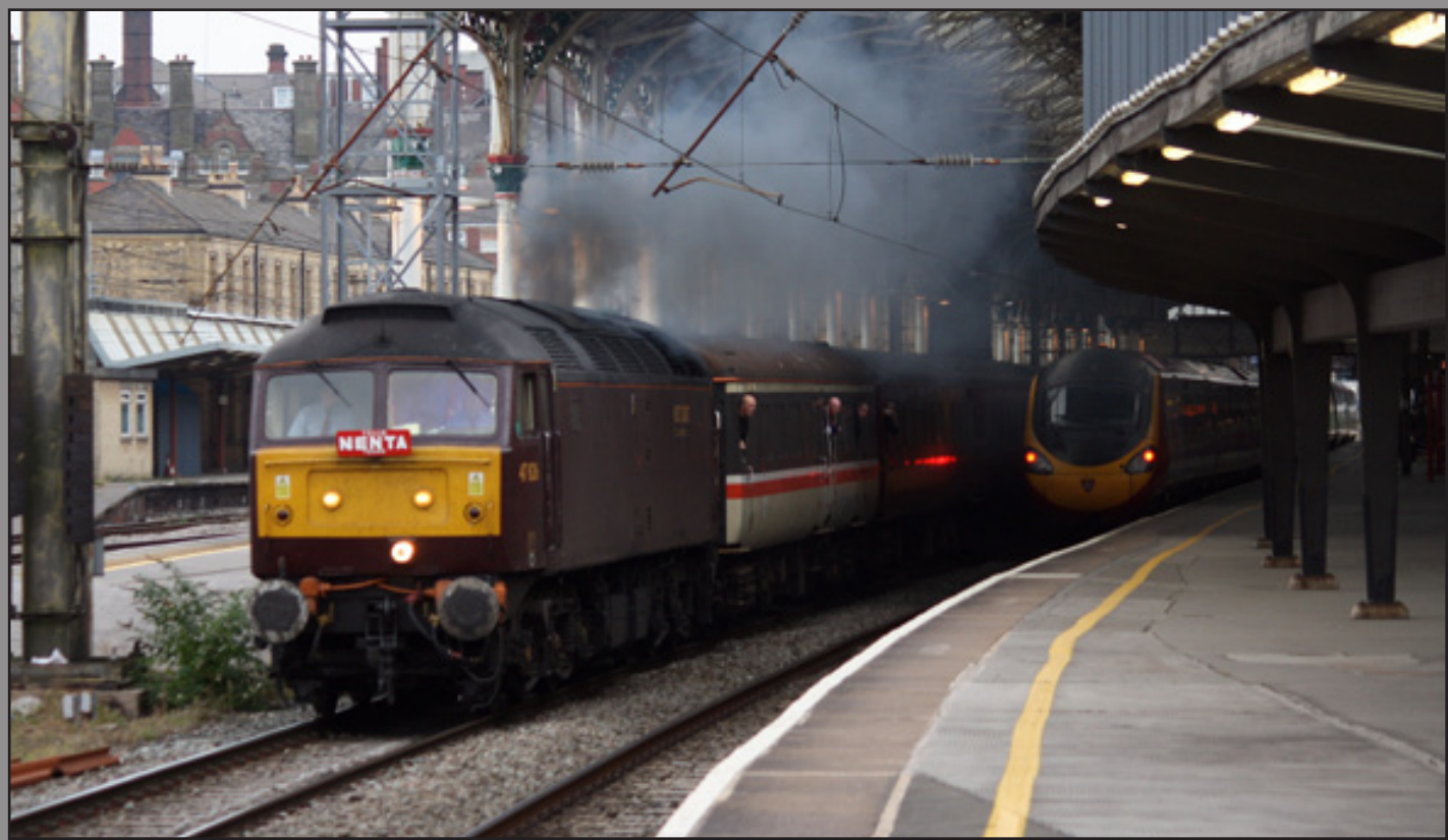
Right: The driver of Class 47 826 slowly fettles up the throttle on the loco prolonging the huge amounts of clag that resulted. Class 47 826 heads up 1248 Carlisle to Norwich Nenta Charter tour top and tailed by Class 47 locomotives through Preston on September 19th. Class 47 787 "Windsor Castle" was on the rear. Christopher Sutcliffe