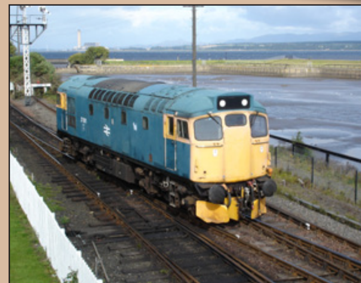
Above: BR Bo-Bo Class 27 001 is seen shunting at Bo'ness Donald Croall

Funding is still coming into the 'kitty' at Bo'ness in order for work to start taking place on giving two abandoned Class 37s no.s 403 and 413 a complete overhaul and restore the locomotives back to 'main line' life once again. Both of these locomotives arrived at Boness together in November 2008, 403 coming from Toton T.M.D. and 413 coming from Motherwell T.M.D. Only when enough funding has been made to restore both locomotives work will start immediately by the very skilled and voluntary work force.