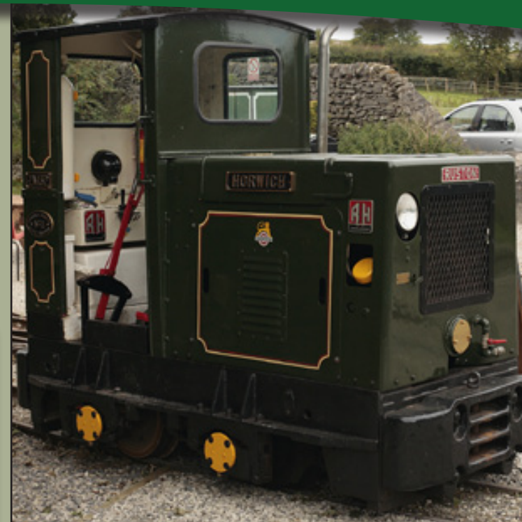
Above: This little Ruston loco, ZM32 is pictured at the Steeple Grange Light Railway.