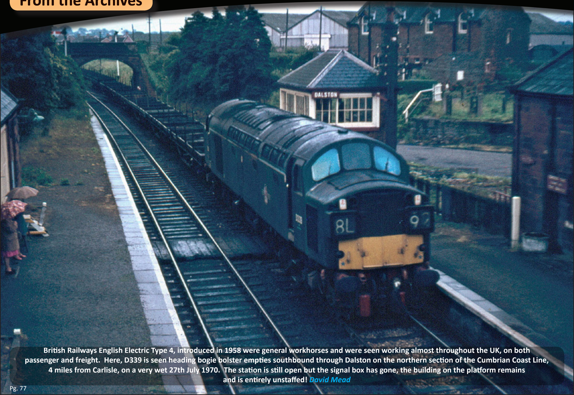
British Railways English Electric Type 4, introduced in 1958 were general workhorses and were seen working almost throughout the UK, on both passenger and freight. Here, D339 is seen heading bogie bolster empties southbound through Dalston on the northern section of the Cumbrian Coast Line, 4 miles from Carlisle, on a very wet 27th July 1970. The station is still open but the signal box has gone, the building on the platform remains and is entirely unstaffed! David Mead