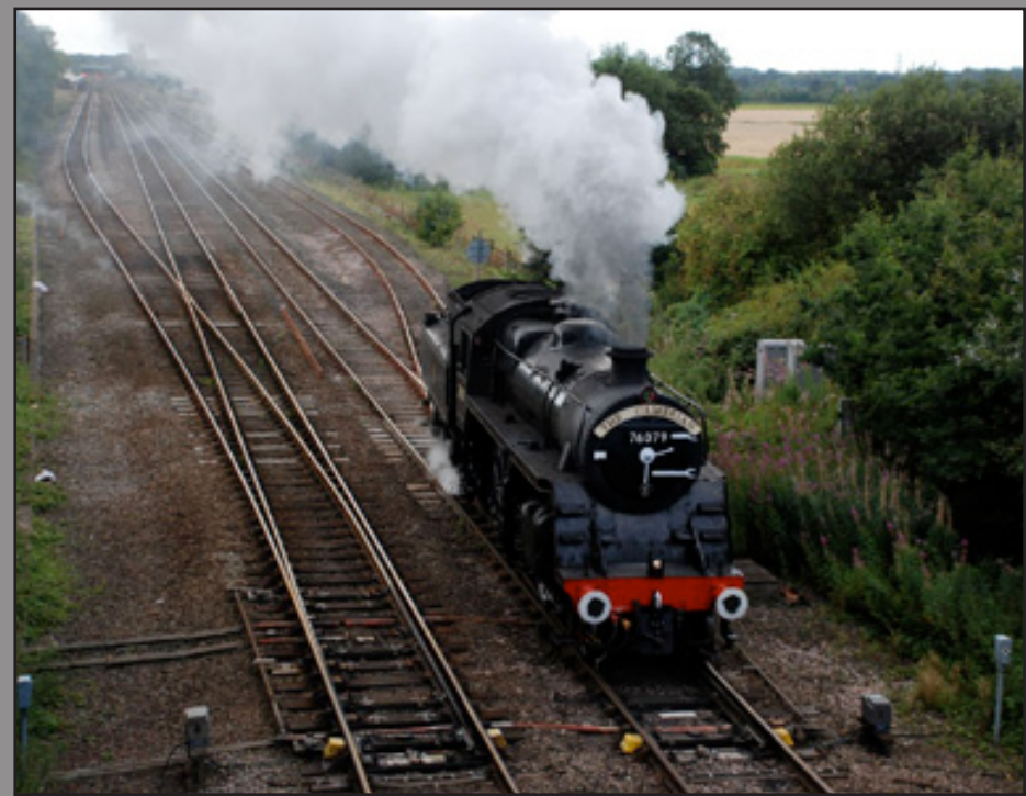
Bottom Right: Seen departing Milford Jct on September 29th is BR 2-6-0 No. 76079, which, as 0279, was being transferred from the East Lancs to Grosmont, NYMR.