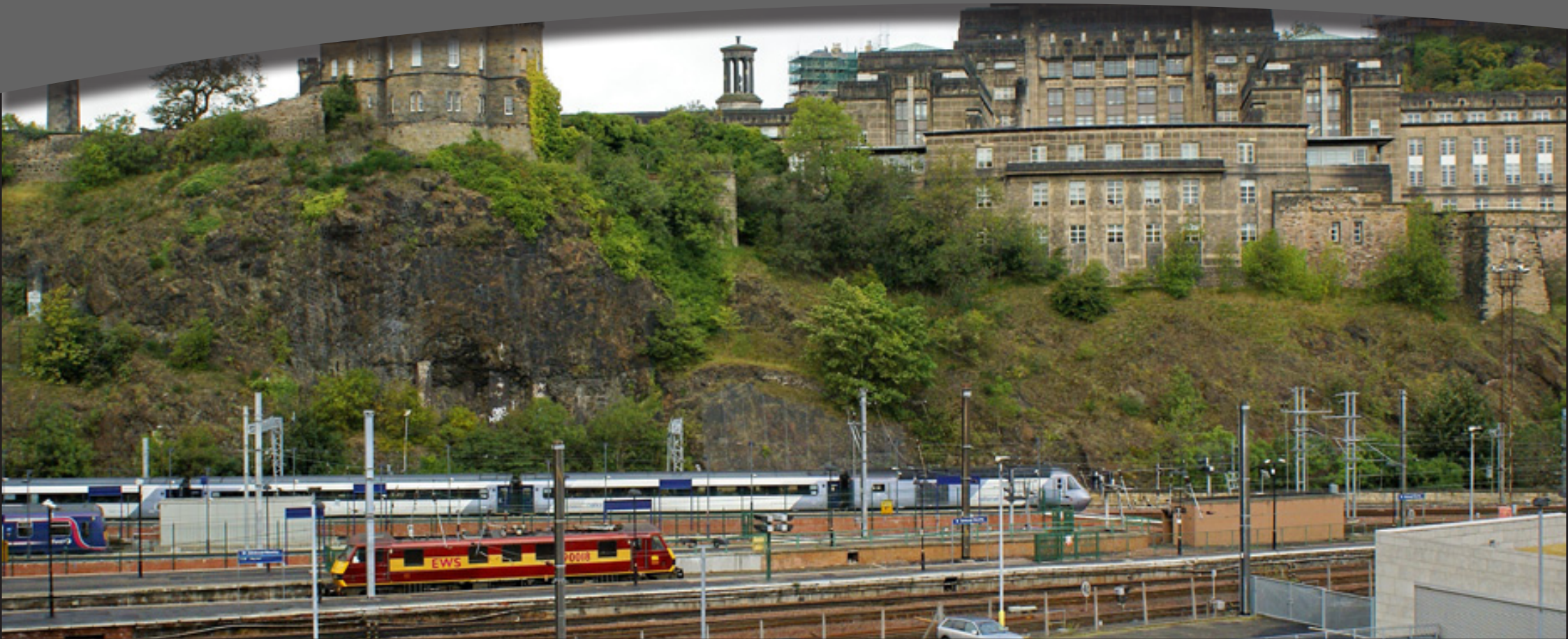
Above: With Edinburgh Observatory as the back drop, a NXEC HST departs Edinburgh Waverley while a DBS Class 90 018 waits in the platform bay, September 25th.