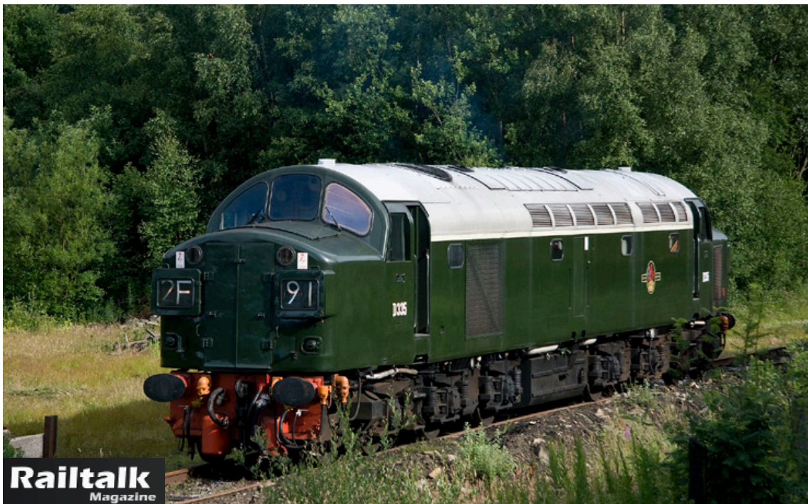
Bottom Left: The CFPS's Class 40 D335 is seen in one of the rare sunny moments. It was noted that for the past three years there has been rain during the event, next year some sun perhaps??.