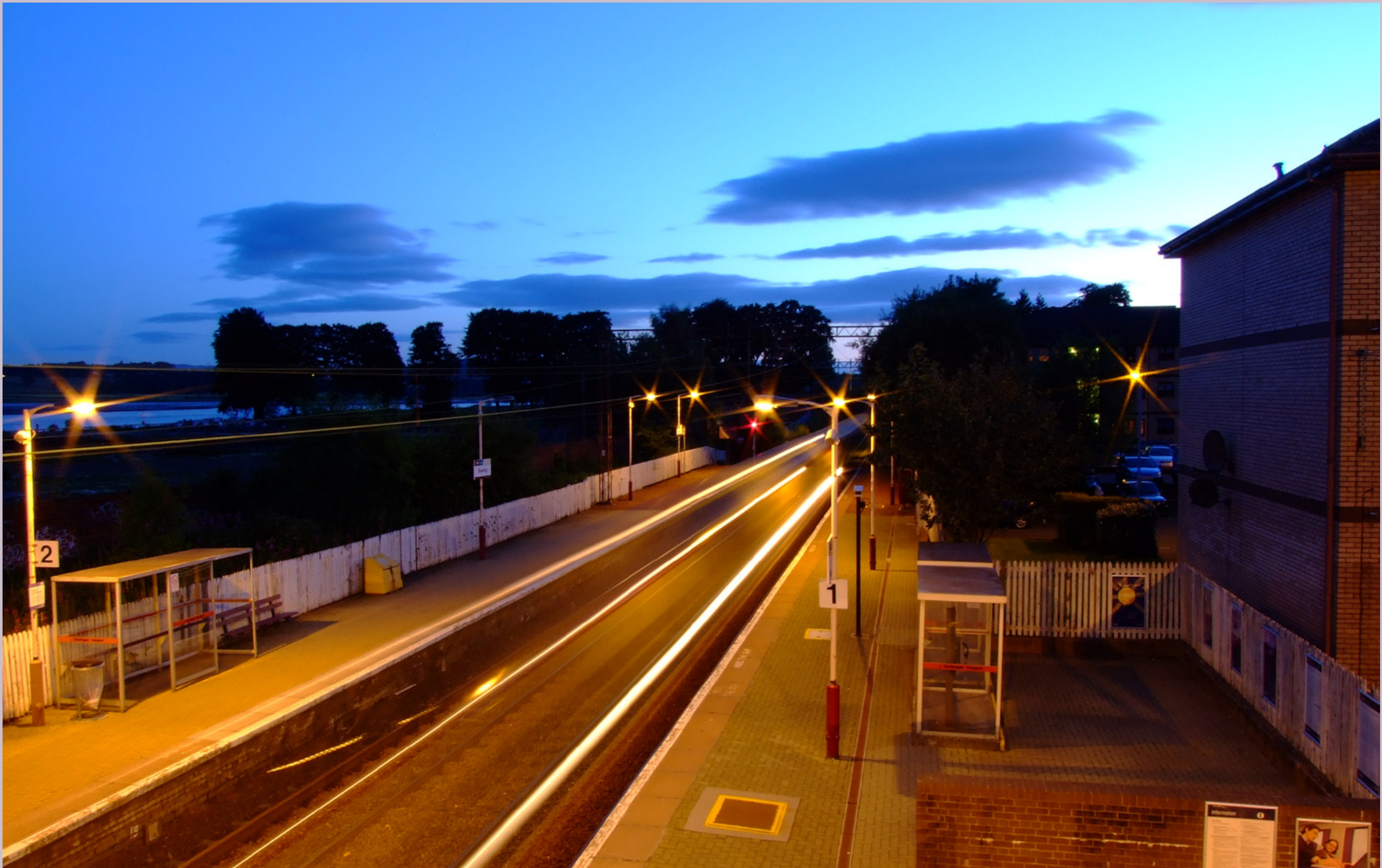
A long exposure photograph of Class 334 023 coming into stop at platform 1 at Bowling station while working the 22.09 2F60 Balloch - Motherwell Sunday service on the 20th July. Jonathan McGurk