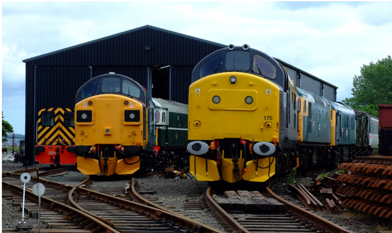
Left: BR Bo-Bo D5341 (27 001) seen outside the diesel shed in the Yard at Bo'ness on the 28th June.