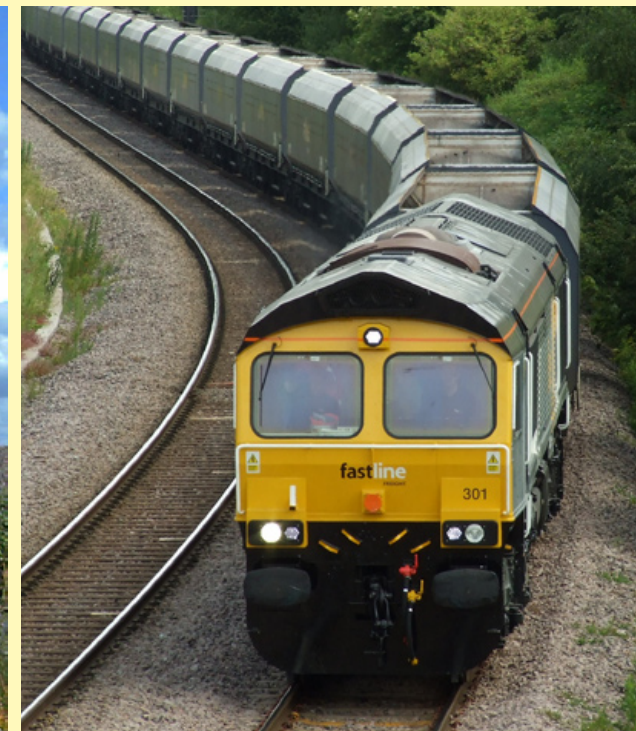
Top Left: Fastline Class 66's are seen shortly after arrival in the UK. This shot was taken at Chaddeston on the 5th July and shows Class 66 305, 66 304 and 66 301.