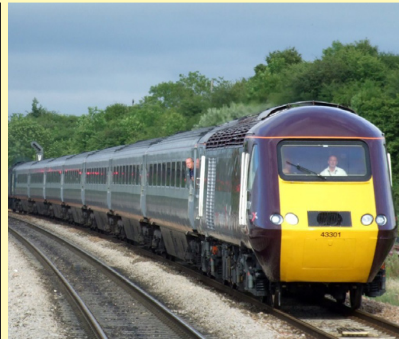
Right: Power Car 43 301, released from Brush two days before, works 9V65 1205 Edinburgh - Plymouth for Cross Country arriving into Bristol Parkway on the 17th July. Liam