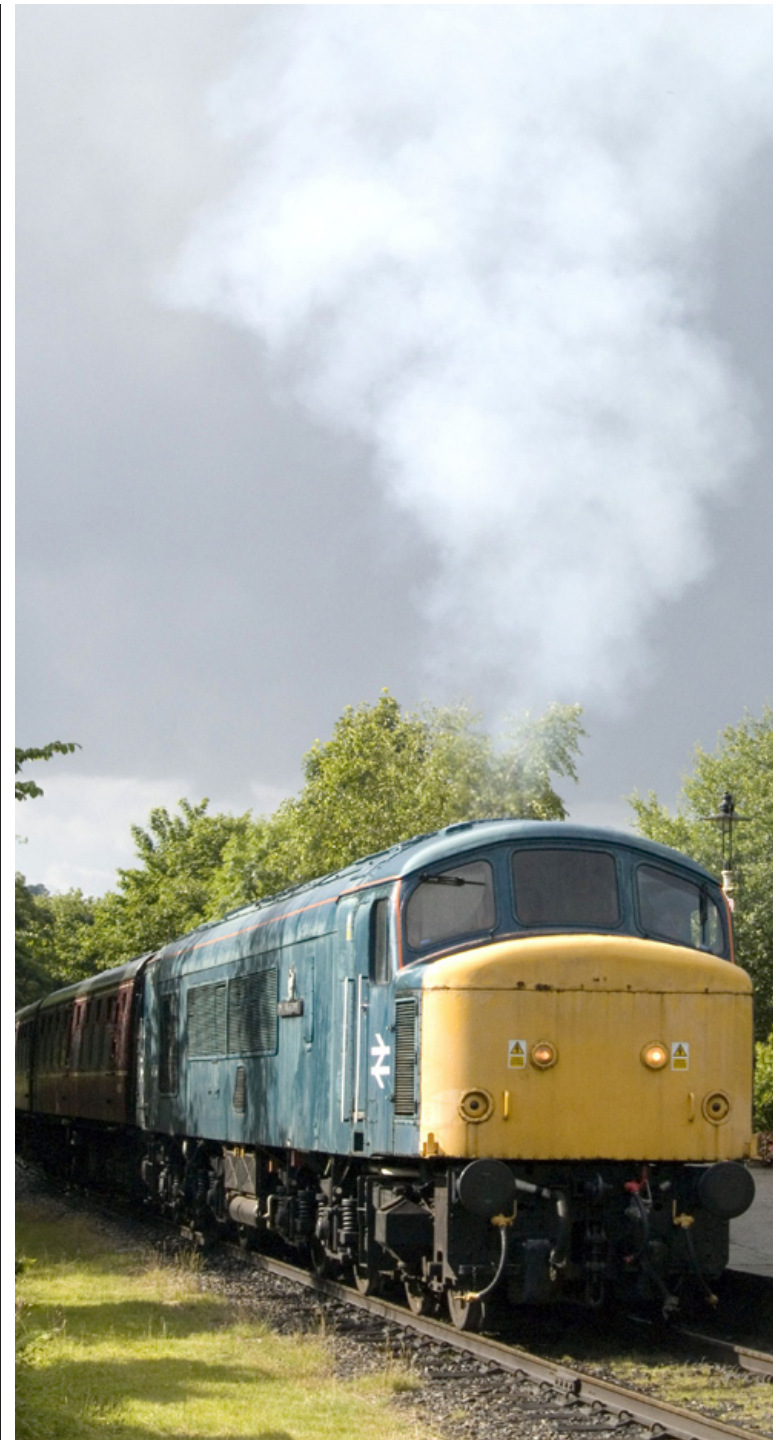
Right: Class 45 041 departs Summerseat on the 5th July.