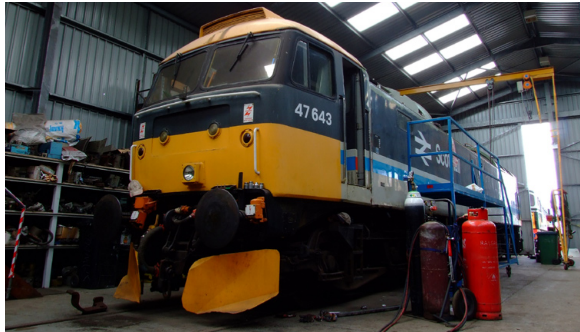
Above: Class 47643 is seen sitting inside the diesel locomotive maintenance shed at Bo’ness receiving roof attention on the 26th June.

It is expected to leave in early August, so “kiss me quick” while the admiral is on the bridge!