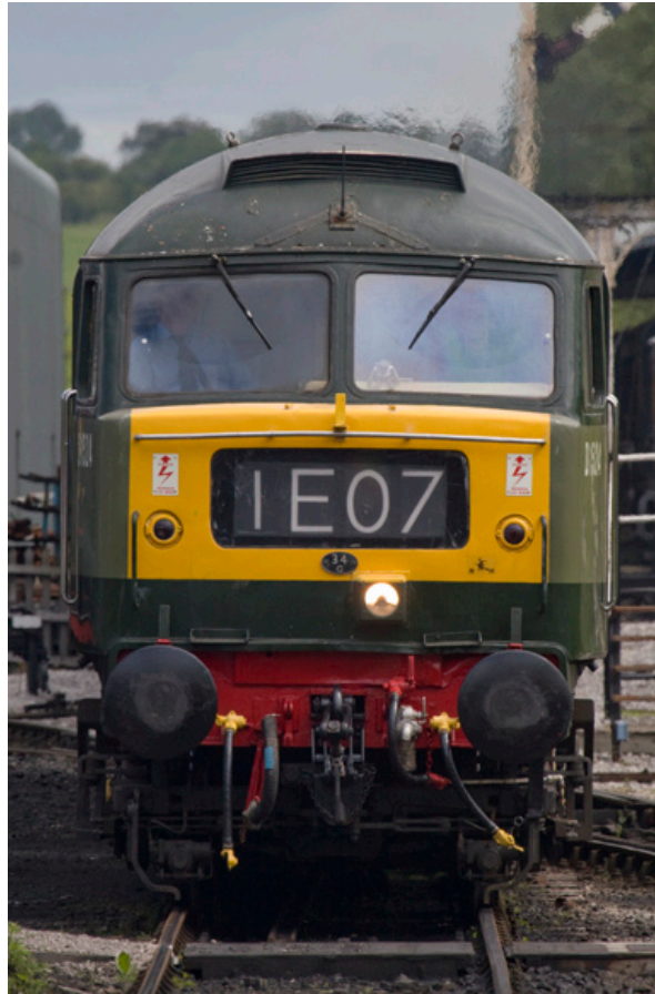
Embassy and Bolton Abbey Railway was another excellent gala in July. Friendly staff and excellent facilities, well worth a visit. Left: Once Old Oak Common's pet loco D1524. Right: Visiting Class 33 109. Below: Ped Power with Class 31 435 and 31 119 arriving at Bolton Abbey Station.