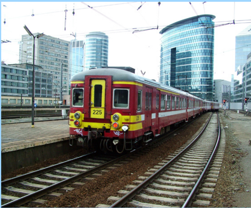
Left: Suburban Unit 225 at Brussels Nord on the 19th June.