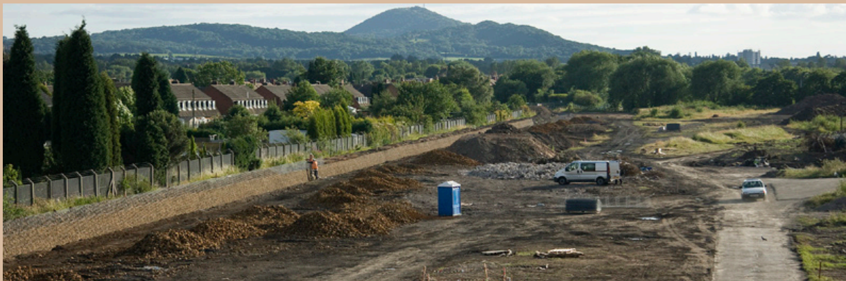
Left: The site of the new Railfreight terminal at Donnington in Shropshire is taking shape. Around 400 local jobs will be created by this project which has regional and national significance. Led by Telford & Wrekin Council a 2.6-mile stretch of railway, closed in 1991, is being reinstated between Donnington and Wellington, allowing freight trains to reach the national network. The £4.2 million development on former military land includes a freight terminal and a major new site of 8.9 hectares (22 acres) capable of taking a warehouse in excess of 37,100 sq m (400,000 sq ft) floor space. Richard Hargreaves

By this time next month, all should be clear. Watch this space...!