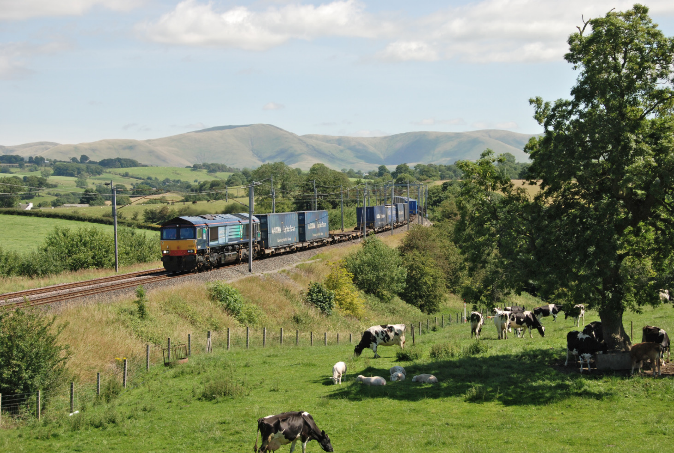
Fantastic picture, Spectacular location, DRS's Class 66 422 passes Docker on the West Coast Main Line on the 21st July. Ian Furness