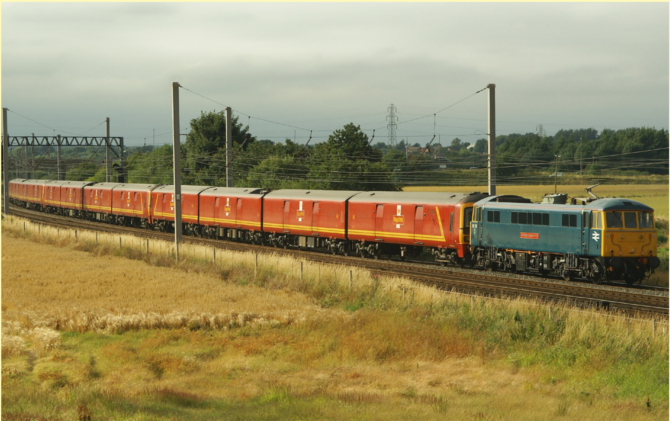
This is the 1M44 Sheildmuir - Warrington RMT with Class 86 101 at the helm. Hired in by GBRf and seen here at Winwick Jct on the 22nd July. The general concensus around here, is that this is the first time 86 101 has been used on this service since its reincarnation earier this year.