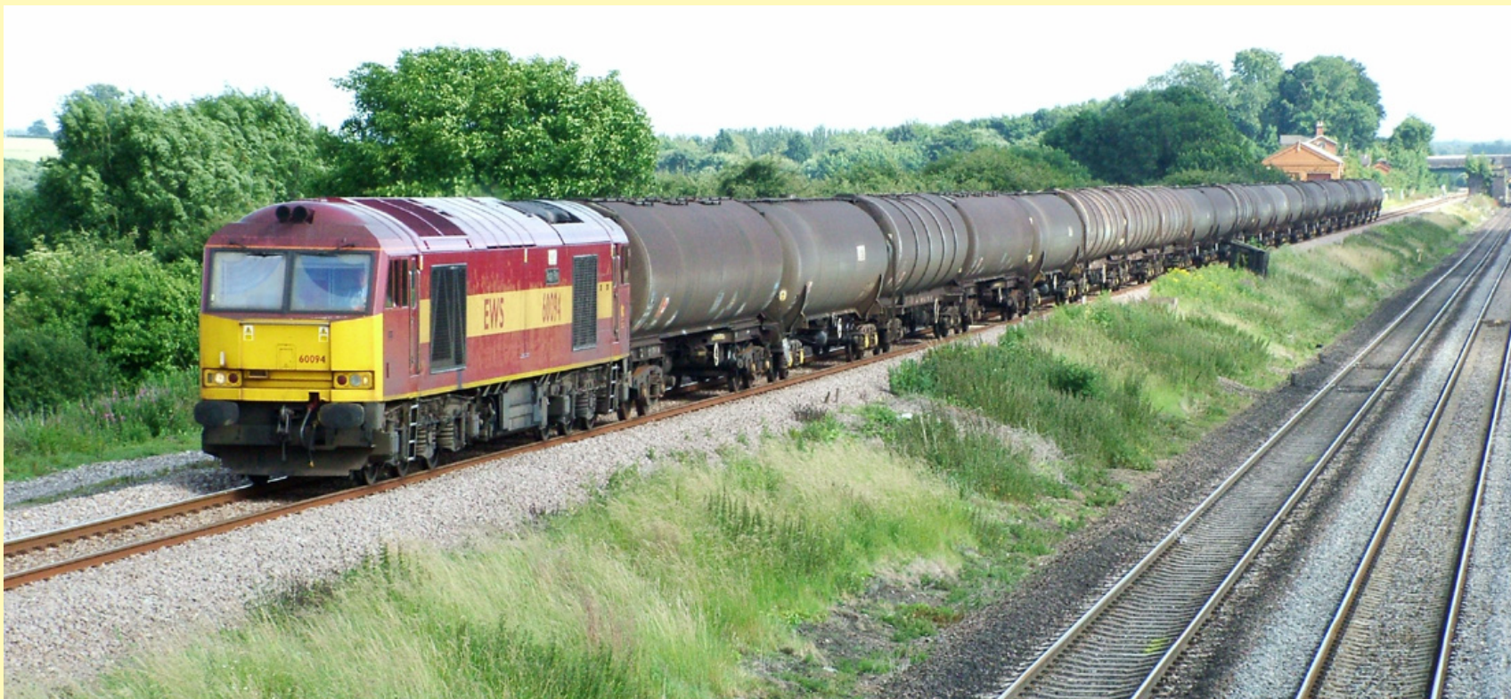
Left: Class 60 094 Rugby Flyer working the 4E38 Colnbrook - Lindsey empty tanks is seen at Irchester on the 30th June.