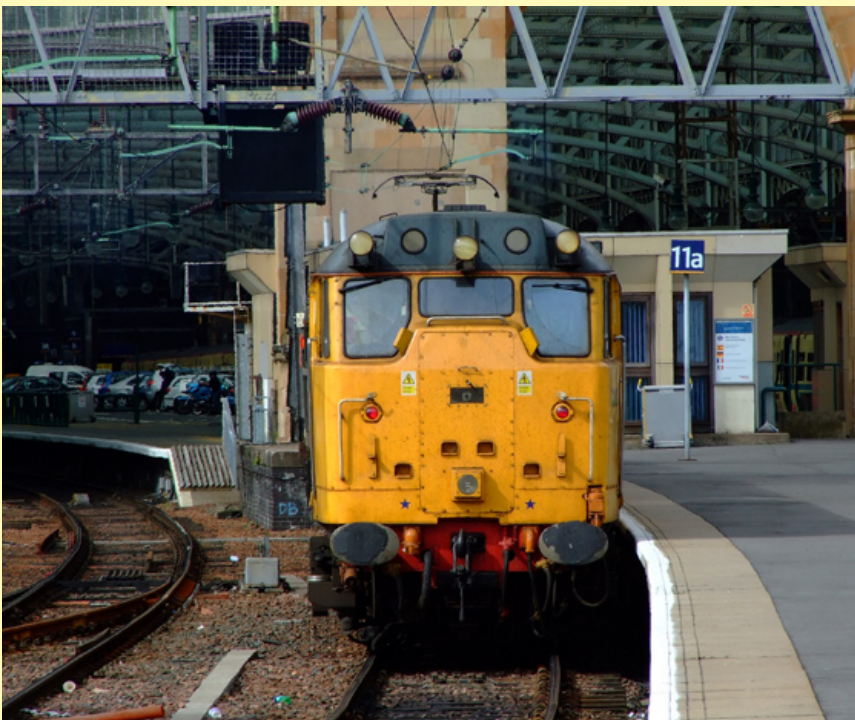
Top Left and Right: Two views of Class 31 602 and 31 190 which were working in and around Glasgow Central with the Network Rail Mentor test train on the 23rd July. Jonathan McGurk