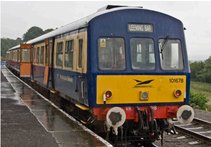
The Wensleydale Railway celebrated its anniversary in July. Unfortunately it was another event where the weather was appalling. Above: Class 101 678 waits at Redmire with the return service to Leeming Bar. Below: One of the many loco's at the site, and like a lot of other stock, it has suffered from graphitti. What does the future hold for Class 31 D5611?