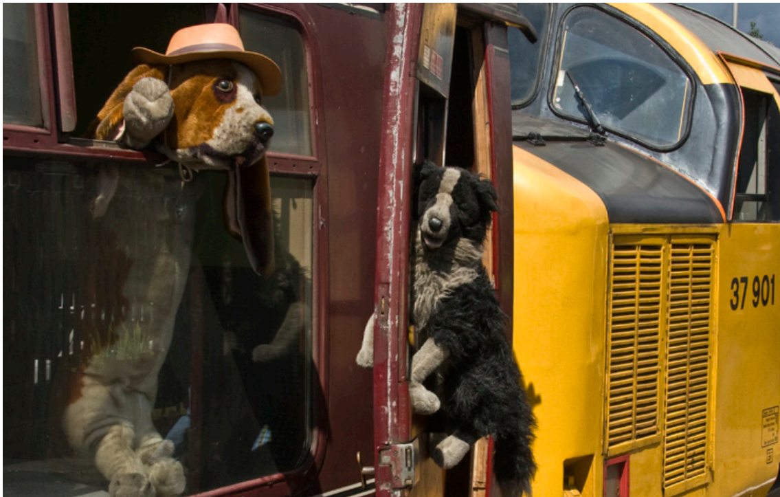
Top Left: Top dogs hanging around, waiting for some Slug thrash. You have to say one thing for this pair, they do know quality! Class47