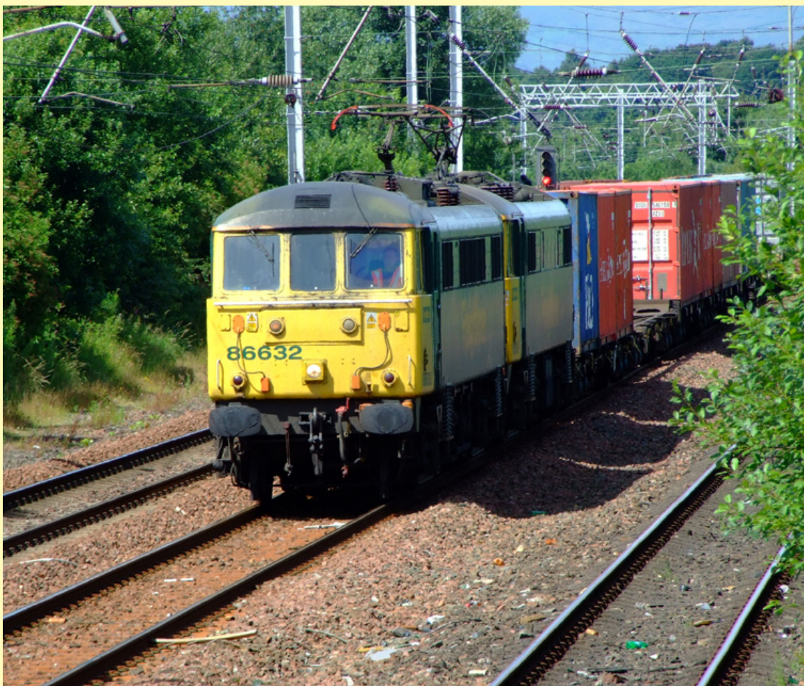
Above: Class 86 632 and 86 639 are seen approaching Coatbridge Central while working the 14.12 4M74 Coatbridge F.L.T. - Crewe Basford Hall Freightliner service on the 21st July.