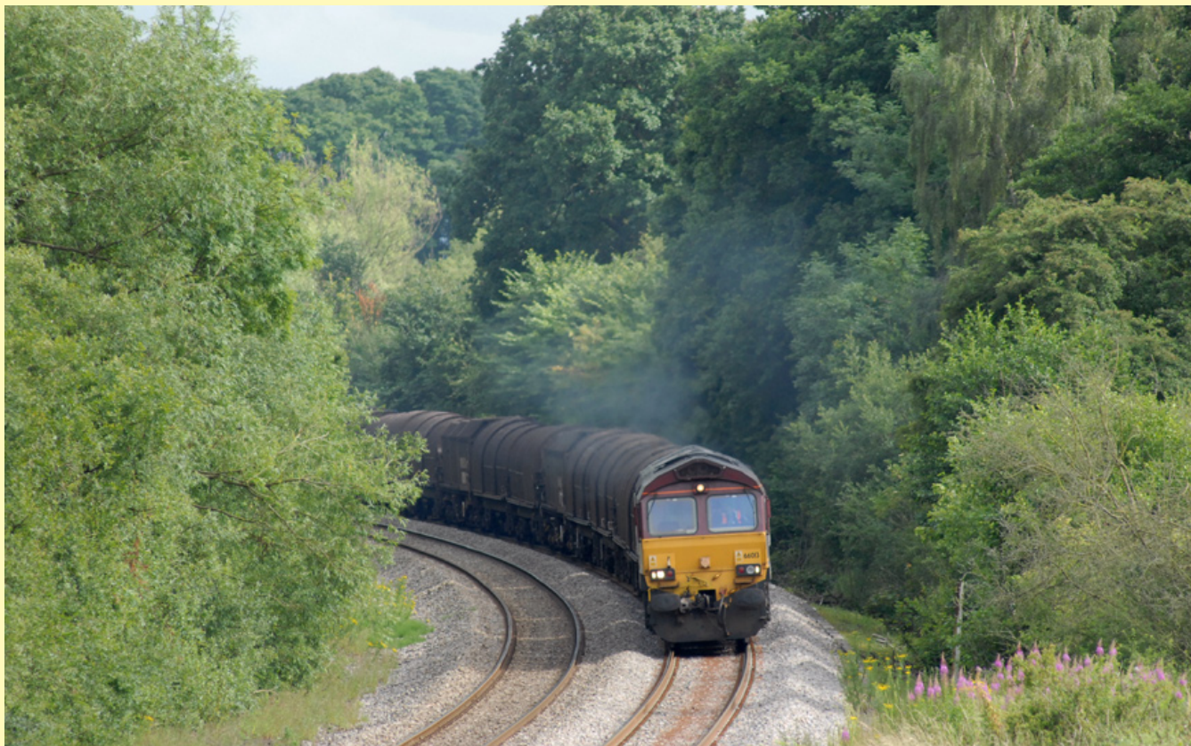
Left: One of Freightliner's latest Class 66's is seen on the East Coast coal circuit on the 9th July.