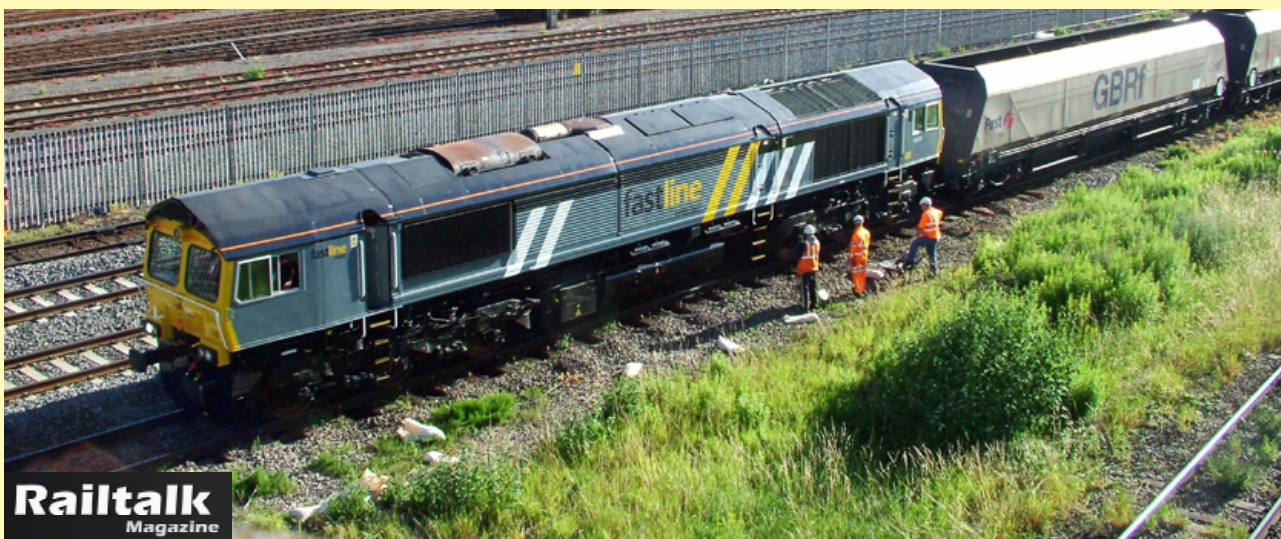
Bottom Right: Taken at Tupton, near Chesterfield Class 66 304 waits for the South ladder junction at Clay Cross North Junction. Gray Wilson