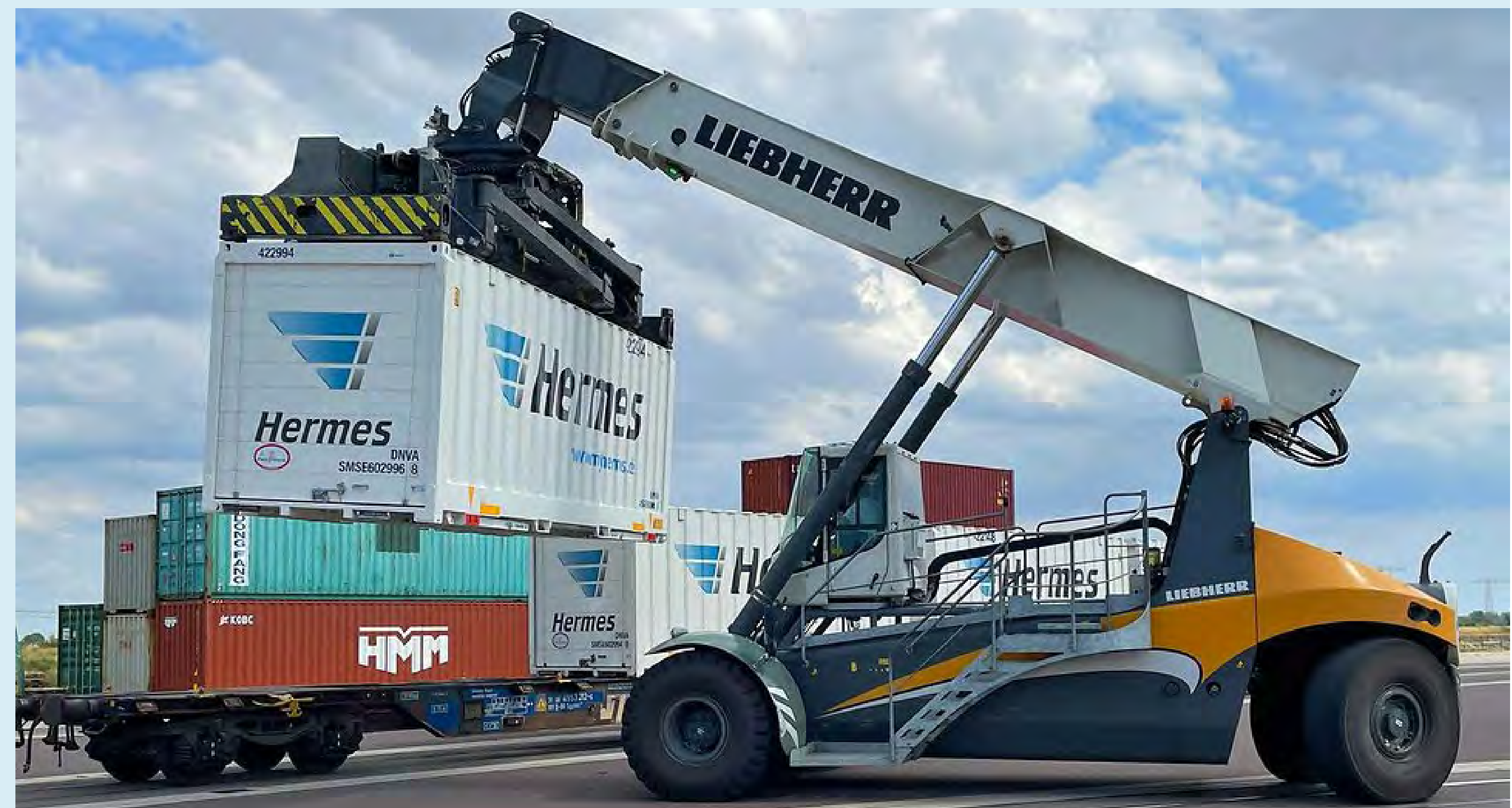
Photo: Hermes Germany aims to transport up to 1.3 million parcels with DB Cargo on the 625-kilometre route.