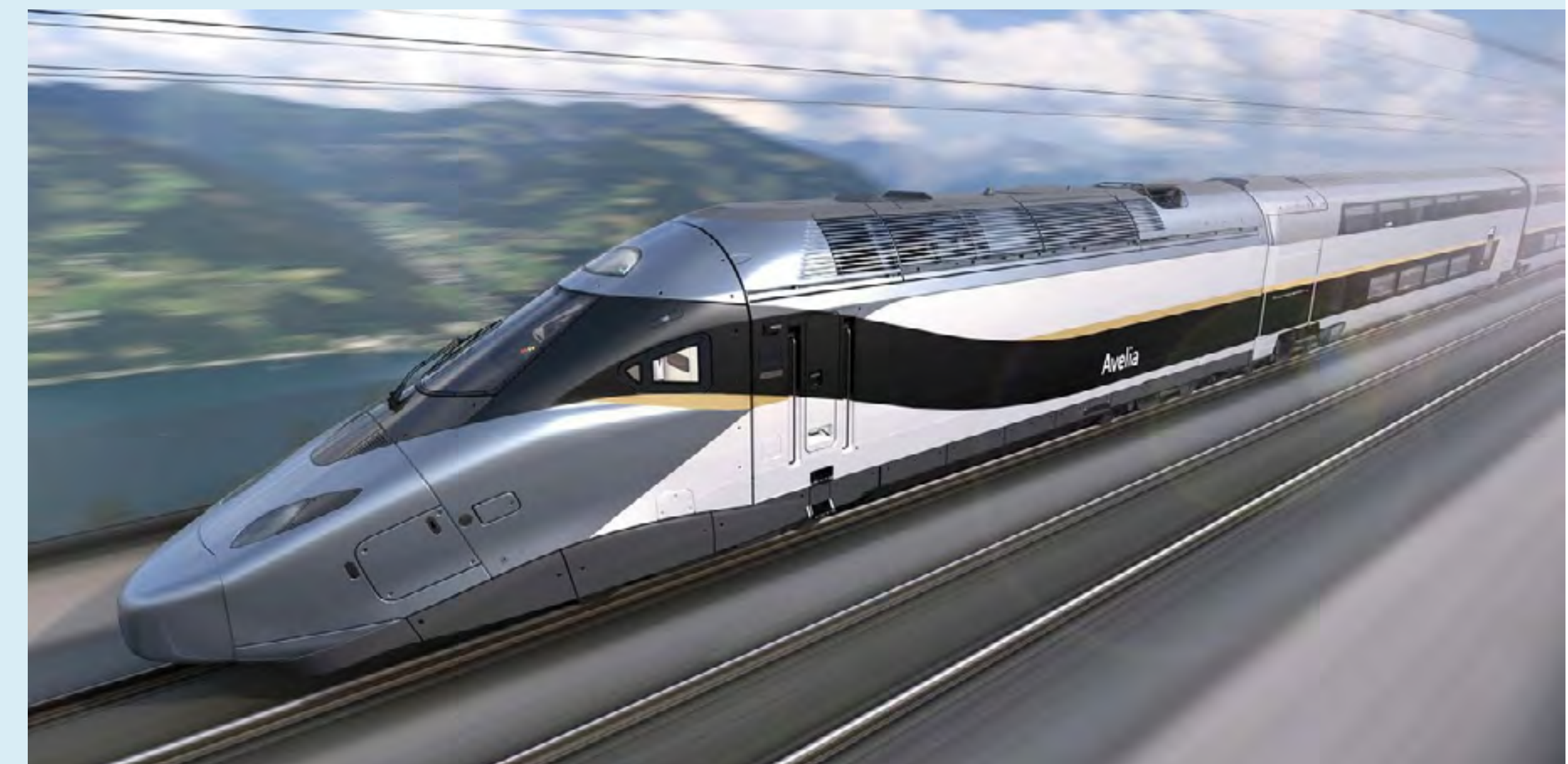
Image: Exterior view of the Avelia Horizon very high-speed train – Non-contractual design for illustration purposes.

[1] French National Railway Company (In French: Société Nationale des Chemins de fer Français)