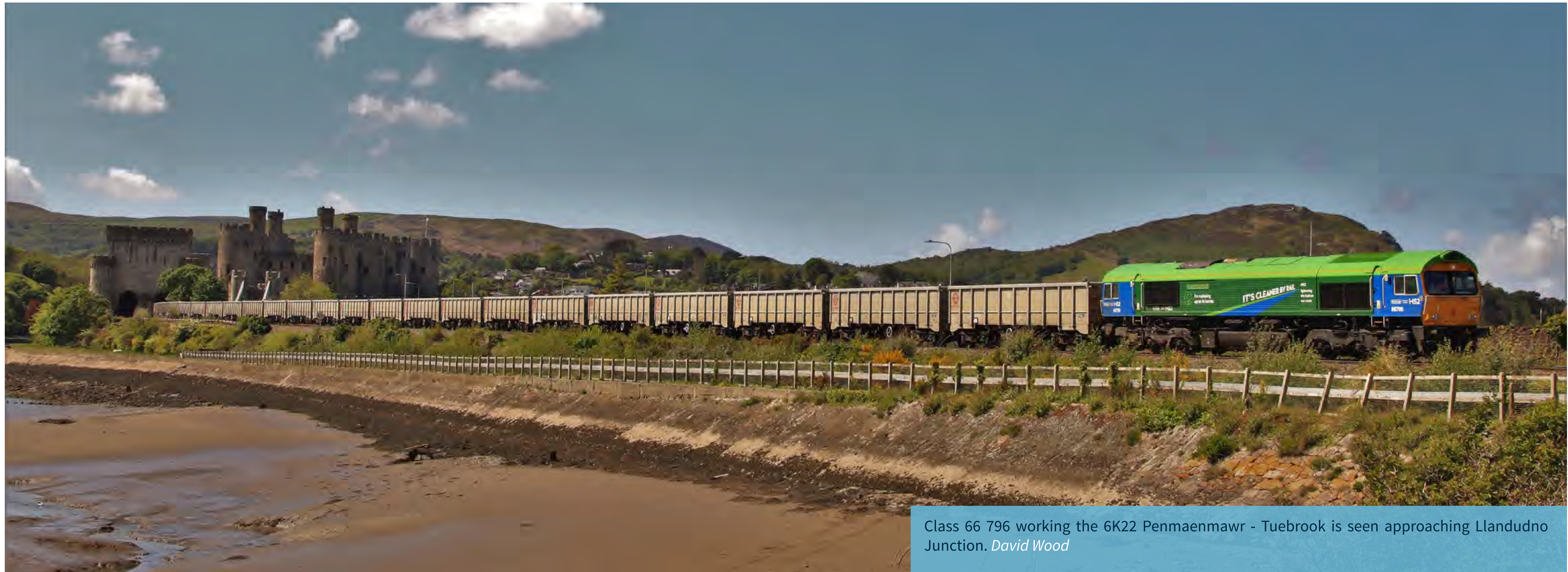
Class 66 796 working the 6K22 Penmaenmawr - Tuebrook is seen approaching Llandudno Junction. David Wood