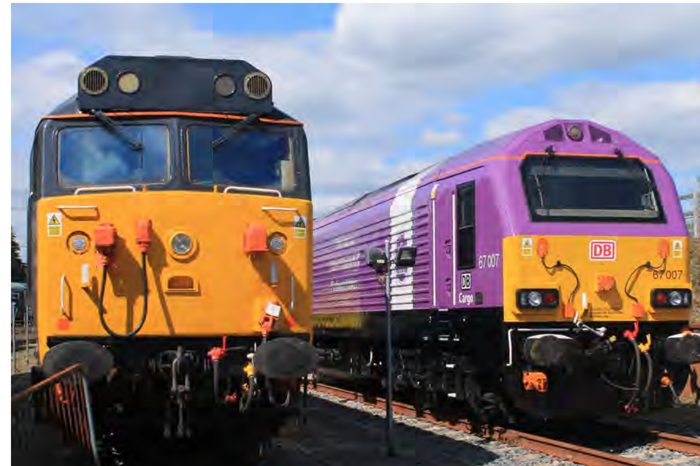
In sunny conditions, Class 50 008 and jubilee liveried 67 007 are seen at Barrow Hill. Lee Stanford