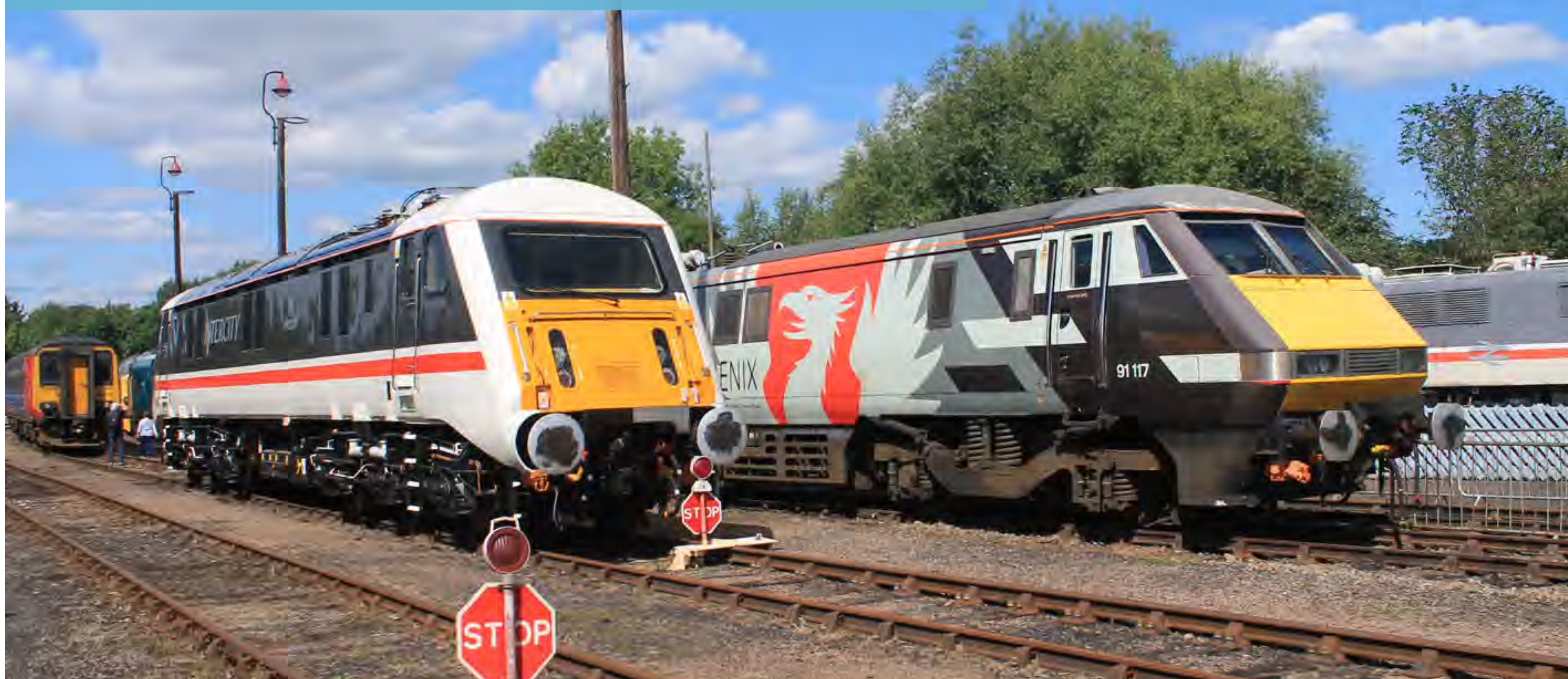
Looking resplendent now it is back in InterCity livery, Class 89 001 'Avocet' shares yard space with 91 117 at Barrow Hill on August 26th. Lee Stanford