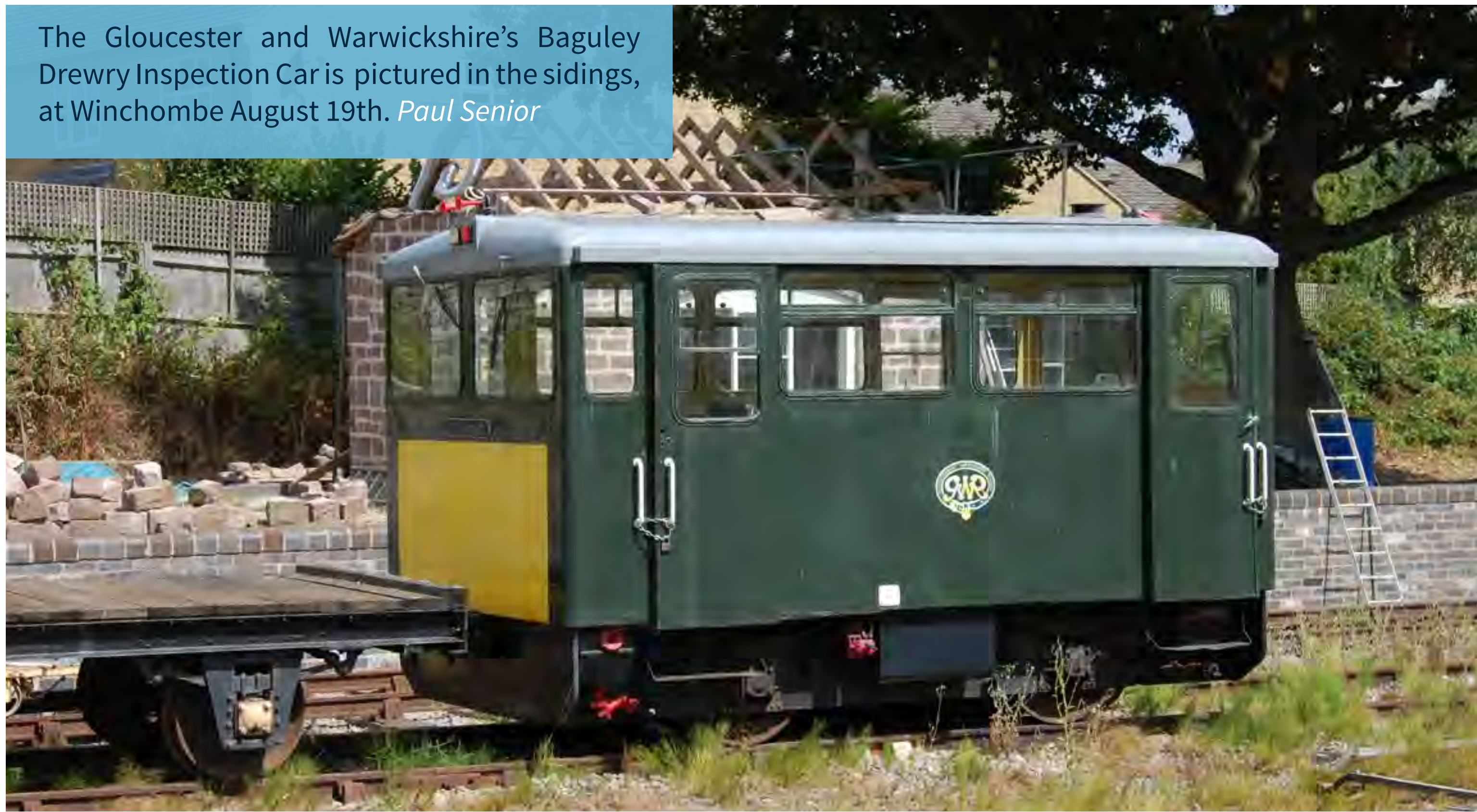
The Gloucester and Warwickshire's Baguley Drewry Inspection Car is pictured in the sidings, at Winchombe August 19th.