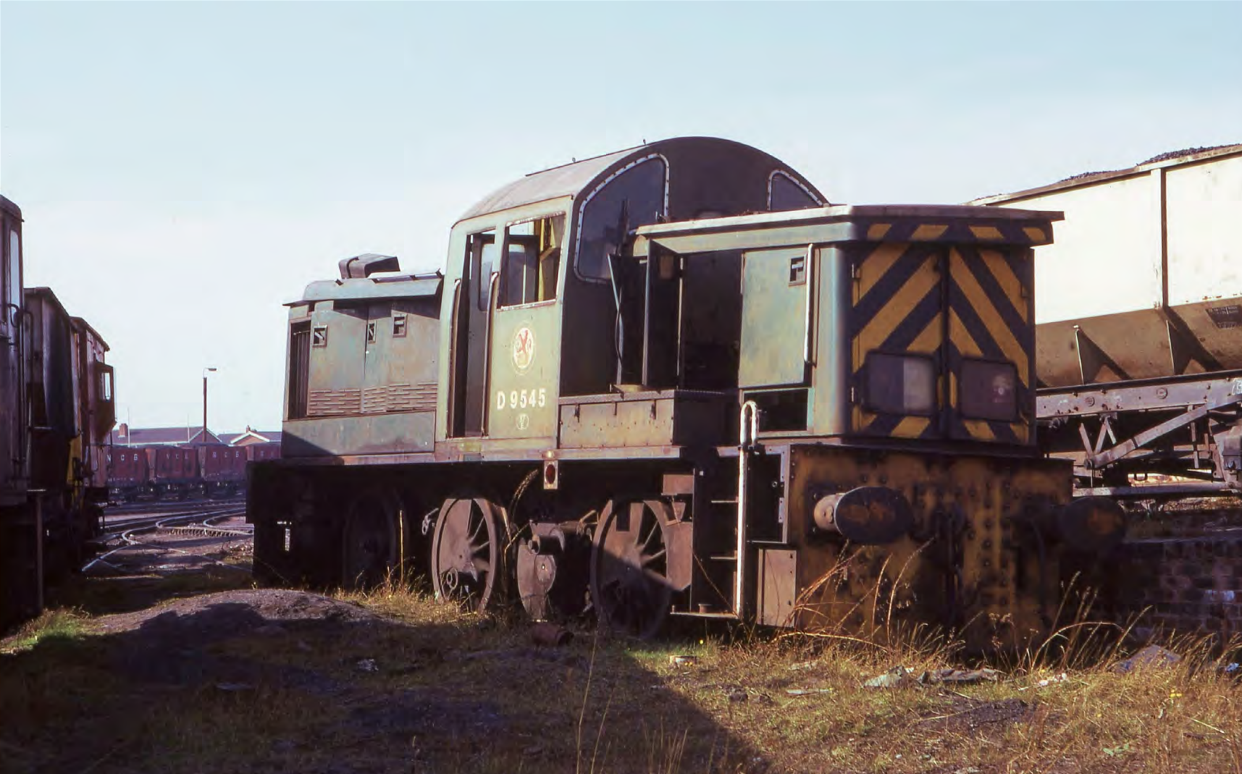
Class 14 No. D9545 (87E) in rather poor condition is seen at NCB Ashington on March 23rd 1973.