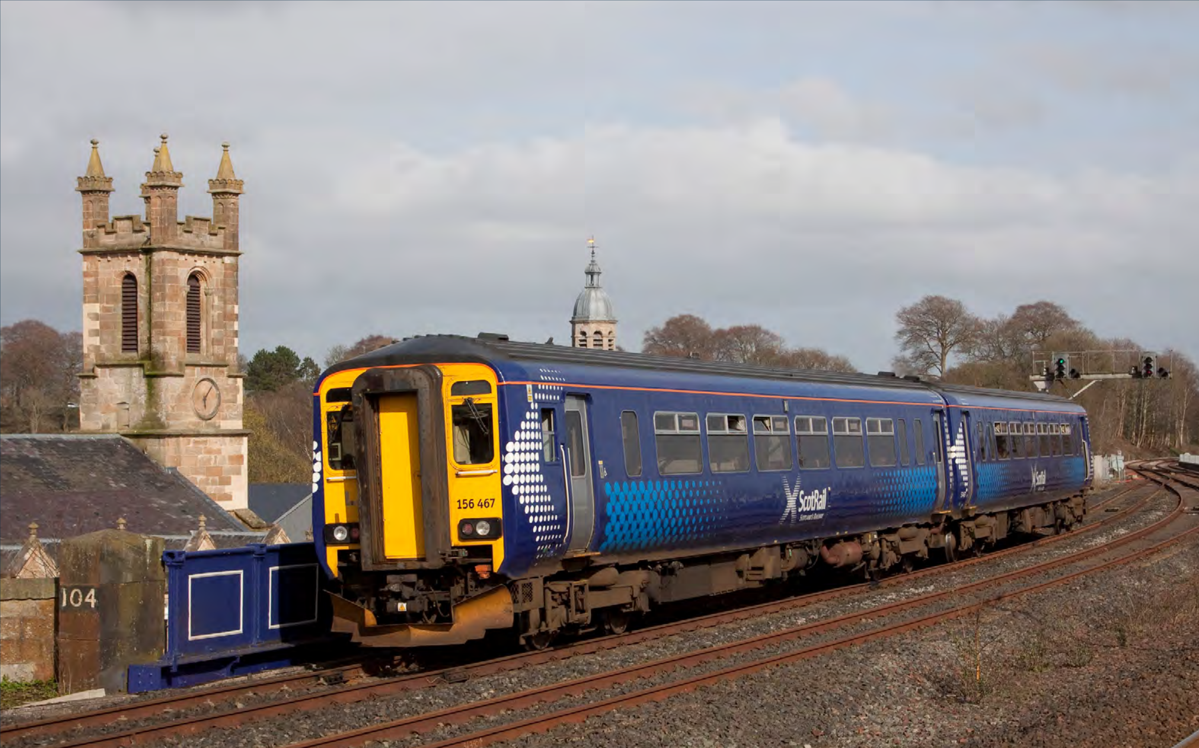
▶ Class 156 467 departs Kilarnock on April 17th.