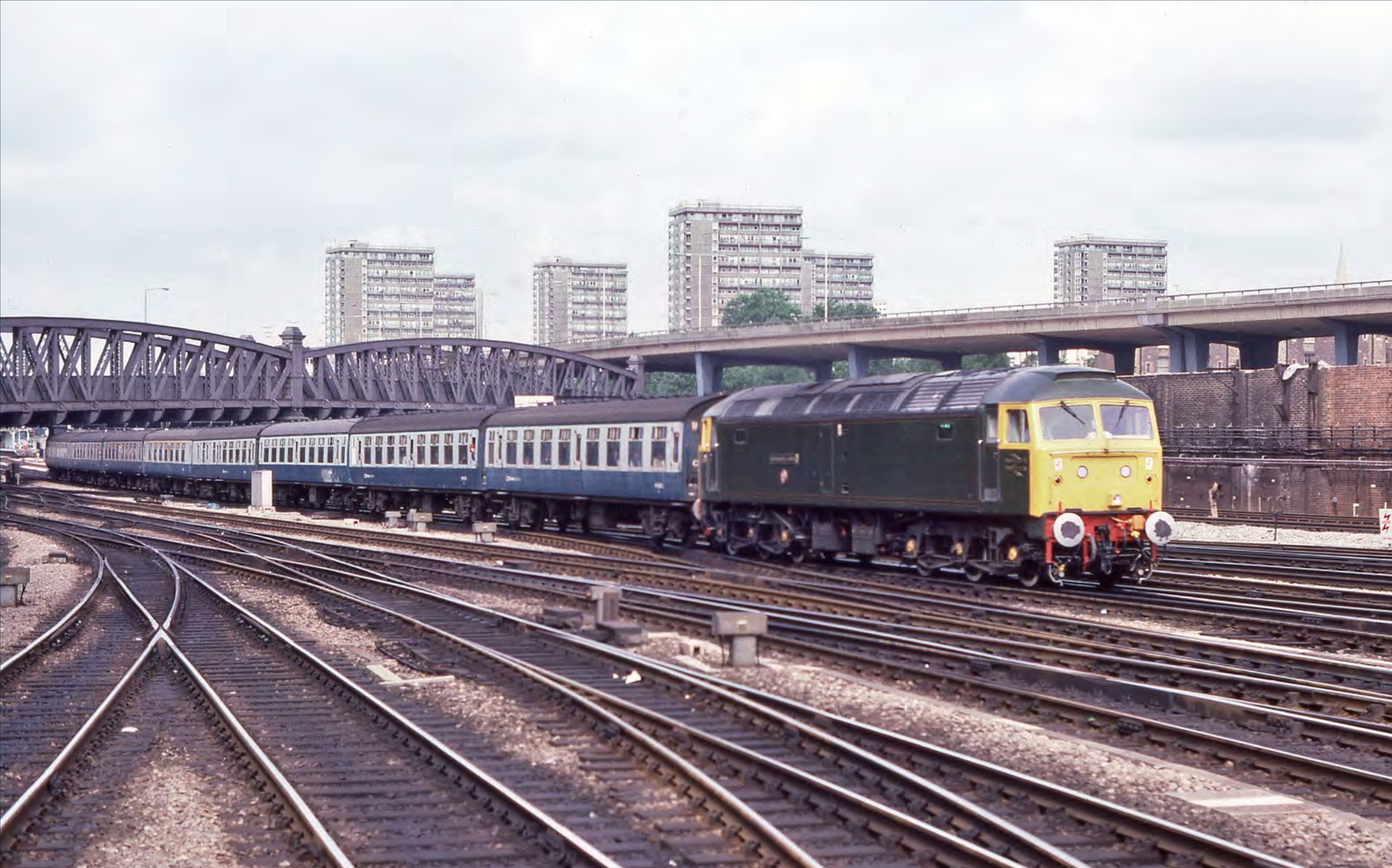
Class 47 628 'Sir Daniel Gooch' approaches London Paddington on July 19th 1986.