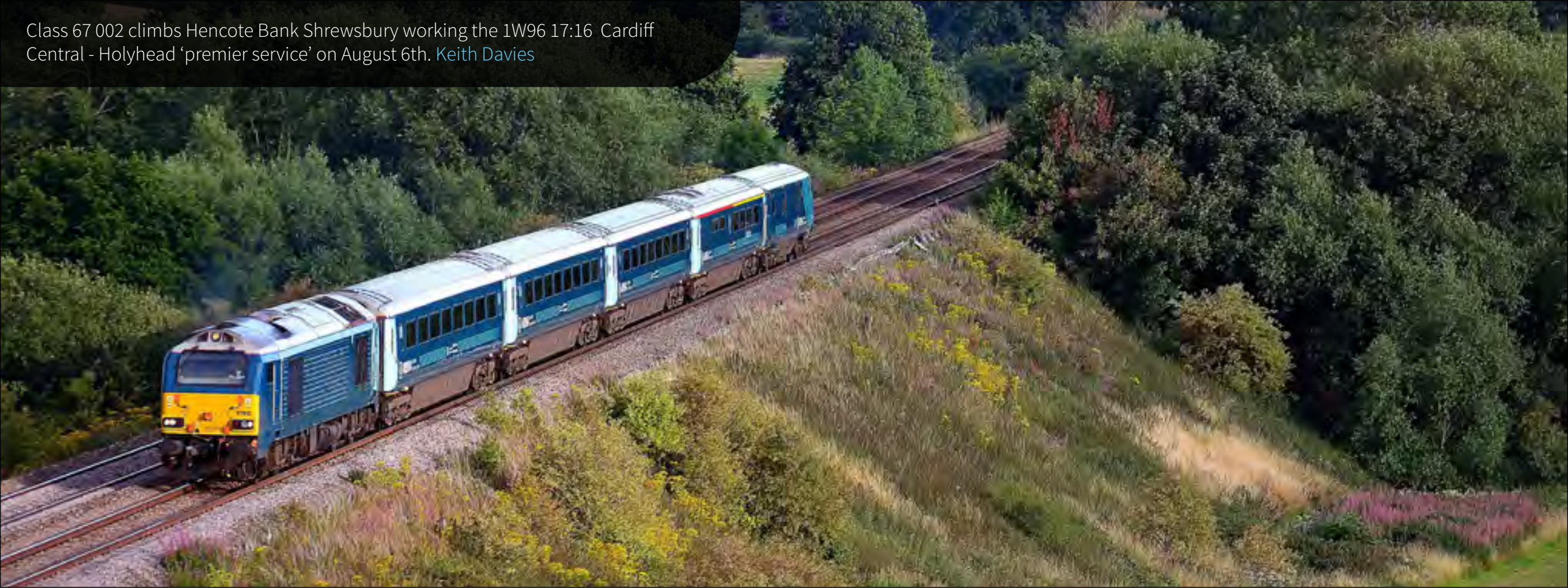
Class 67 002 climbs Hencote Bank Shrewsbury working the 1W96 17:16 Cardiff Central - Holyhead 'premier service' on August 6th.