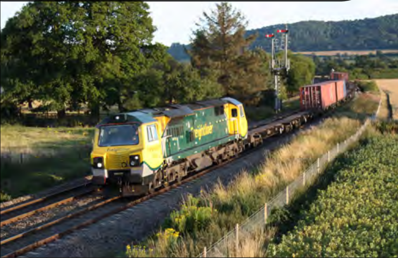
On August 8th, Class 70 016 with the 6M64 Wentloog - Crewe passes Cheney Longville, Craven Arms.