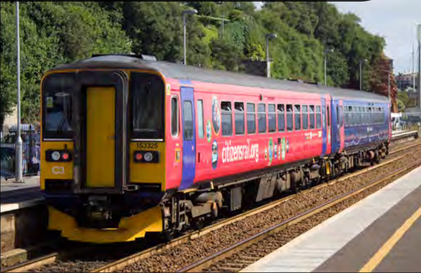
First Great Western's Class 153 325 and 153 373 depart Dawlish with an Exeter bound service on August 4th.