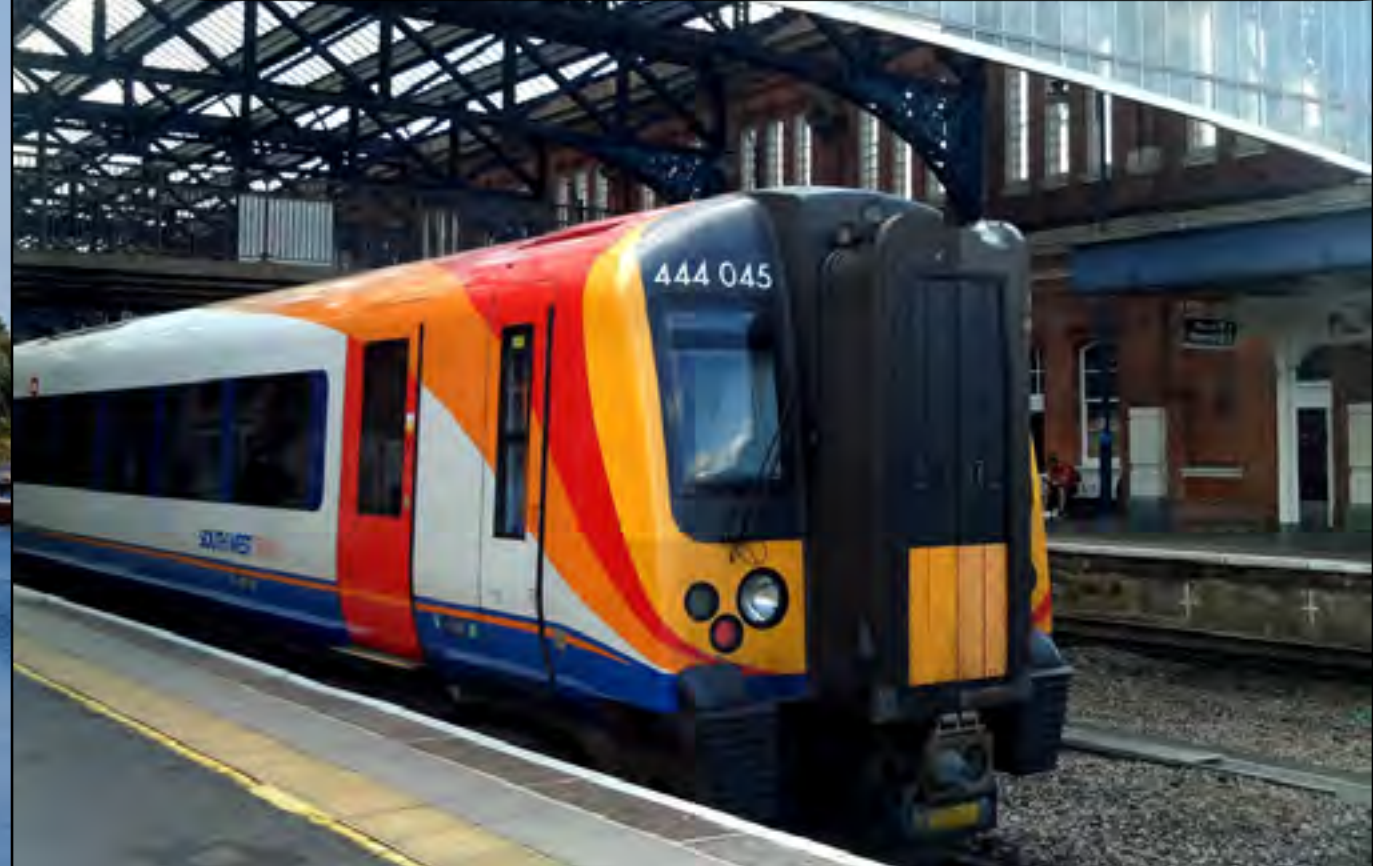
Under the overall roof at Bournemouth Station, South West Trains Class 444 045 pauses on its journey to London Waterloo from Poole, July 25th. Ben Bucki