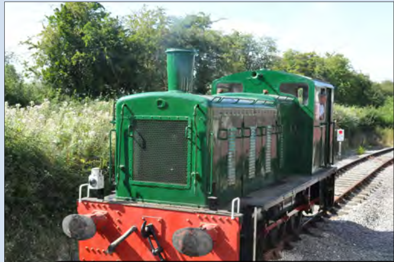
BR Class 03 Diesel Mechanical shunter No. 03 022 is seen working at the Swindon and Cricklade Railway on August 8th. Ken Mumford