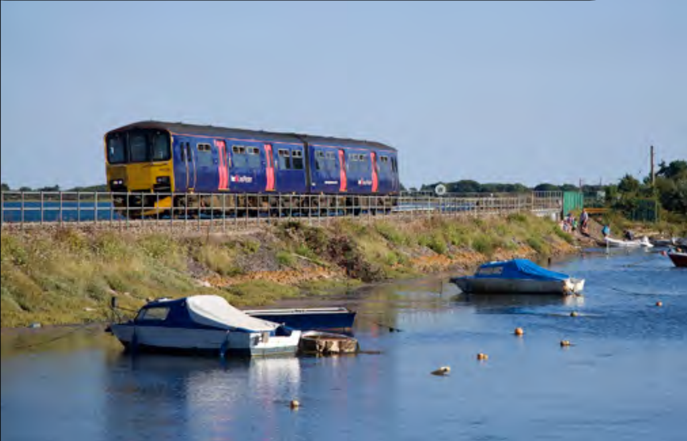
On July 30th, Class 150 122 working a Paignton to Exmouth service, passes Cockwood Harbour.