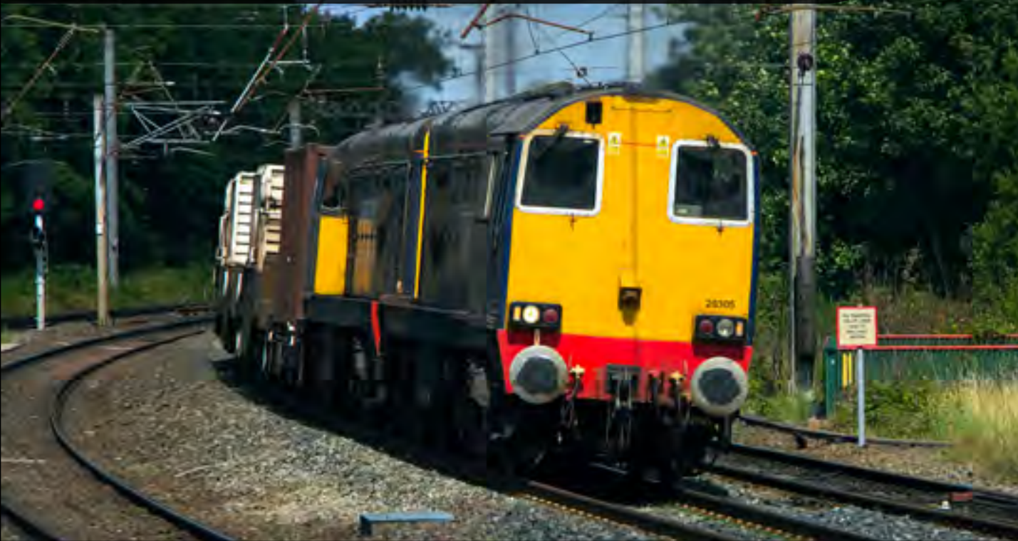
Class 20 305 and 20 308 with the 08:49 Sellafield B.N.F. to Crewe Coal Sidings (DRS) clags through Lancaster on August 1st.