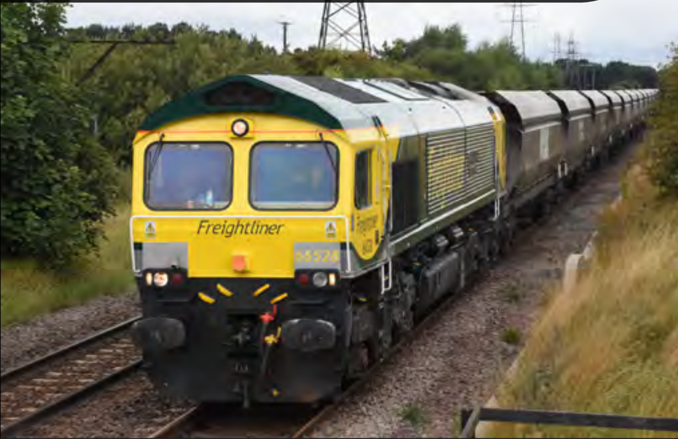
Class 66 528 looks quite smart passing Appleby on August 26th working the 4R14 Ratcliffe - HIT.