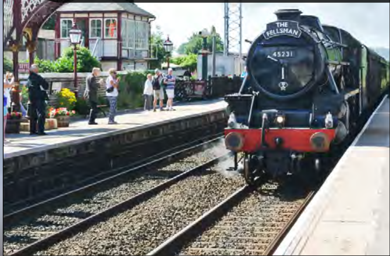
LMS Stanier Black 5 Class No. 45231 'The Sherwood Forester' makes easy work of the climb up the 4 mile long 1 in 82 up the Langho bank hauling the return leg of 1T53 'The Fellsman' from Carlisle to Lancaster on August 12th. Dave Felton