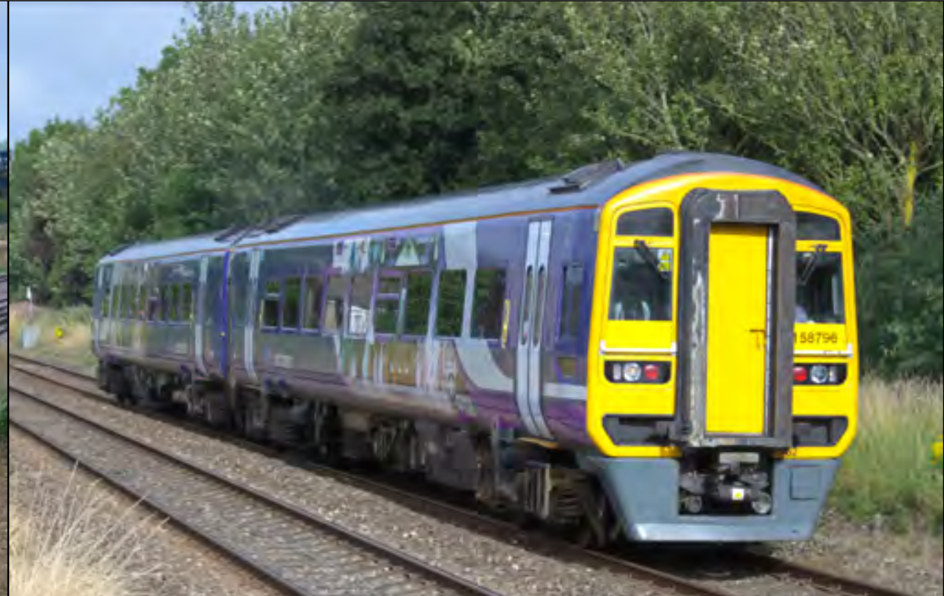
Northern Rail's Class 158 796 heads towards Blackburn with the 1B13 08:11 Blackpool North to York service on August 5th.