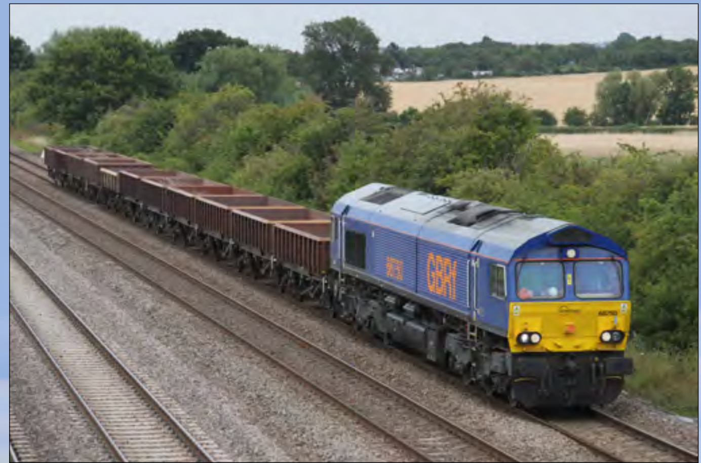
Below: On August 17th, Class 66 731 'Interhub GB' works the 6E81 Portbury - Cottom with empty gypsum wagons passing Nemesis Rail. Stuart Hillis