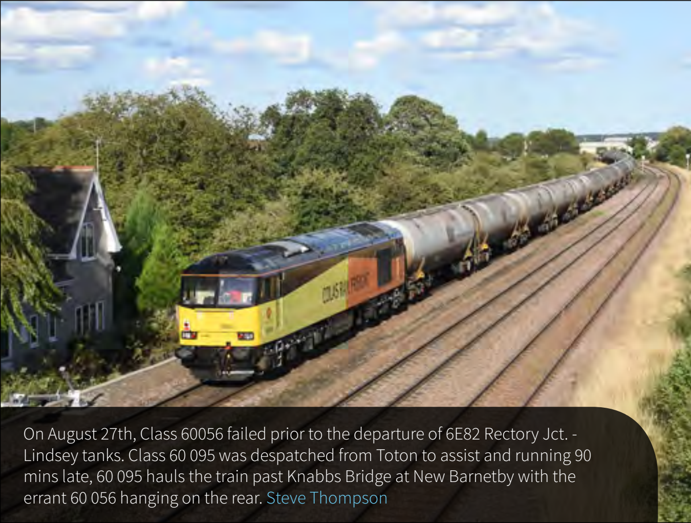
On August 27th, Class 60056 failed prior to the departure of 6E82 Rectory Jct. - Lindsey tanks. Class 60 095 was despatched from Toton to assist and running 90 mins late, 60 095 hauls the train past Knabbs Bridge at New Barnetby with the errant 60 056 hanging on the rear.