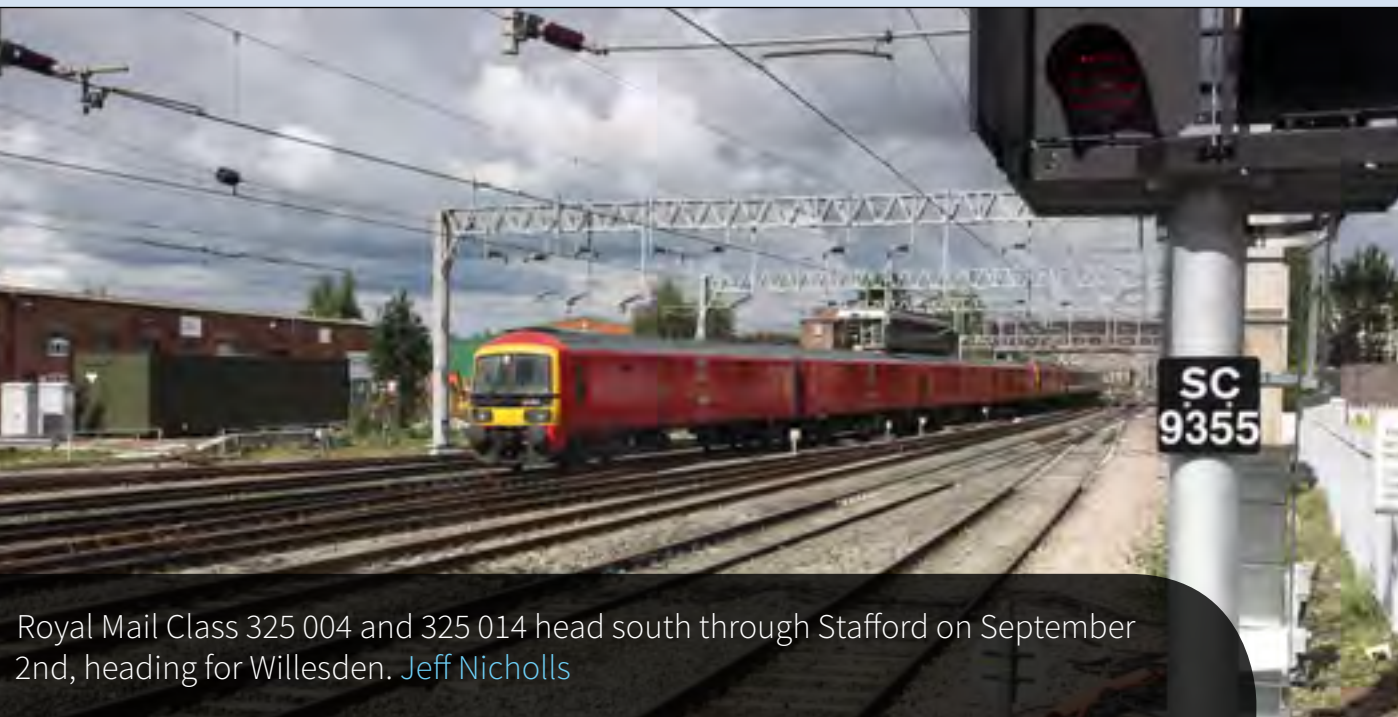
Royal Mail Class 325 004 and 325 014 head south through Stafford on September 2nd, heading for Willesden. Jeff Nicholls