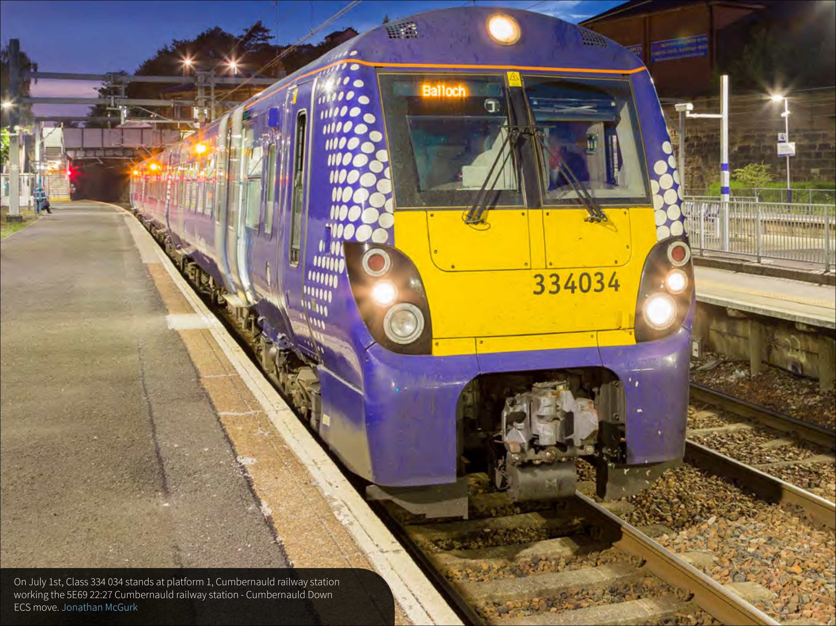
On July 1st, Class 334 034 stands at platform 1, Cumbernauld railway station working the 5E69 22:27 Cumbernauld railway station - Cumbernauld Down ECS move. Jonathan McGurk