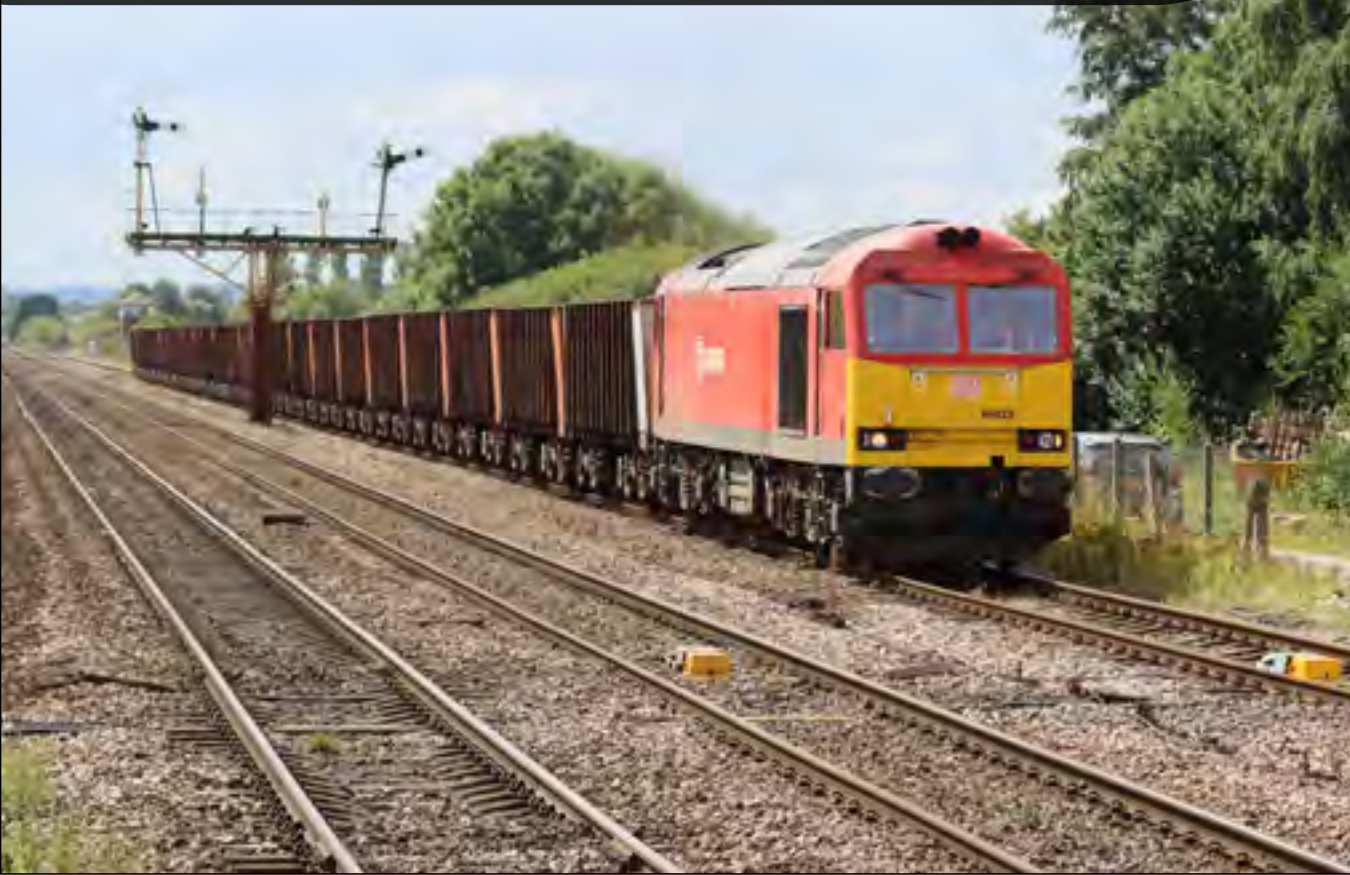
On August 15th, Class 60 010 heads through Barnetby with a Scunthorpe to Immingham empty ore working. Class47