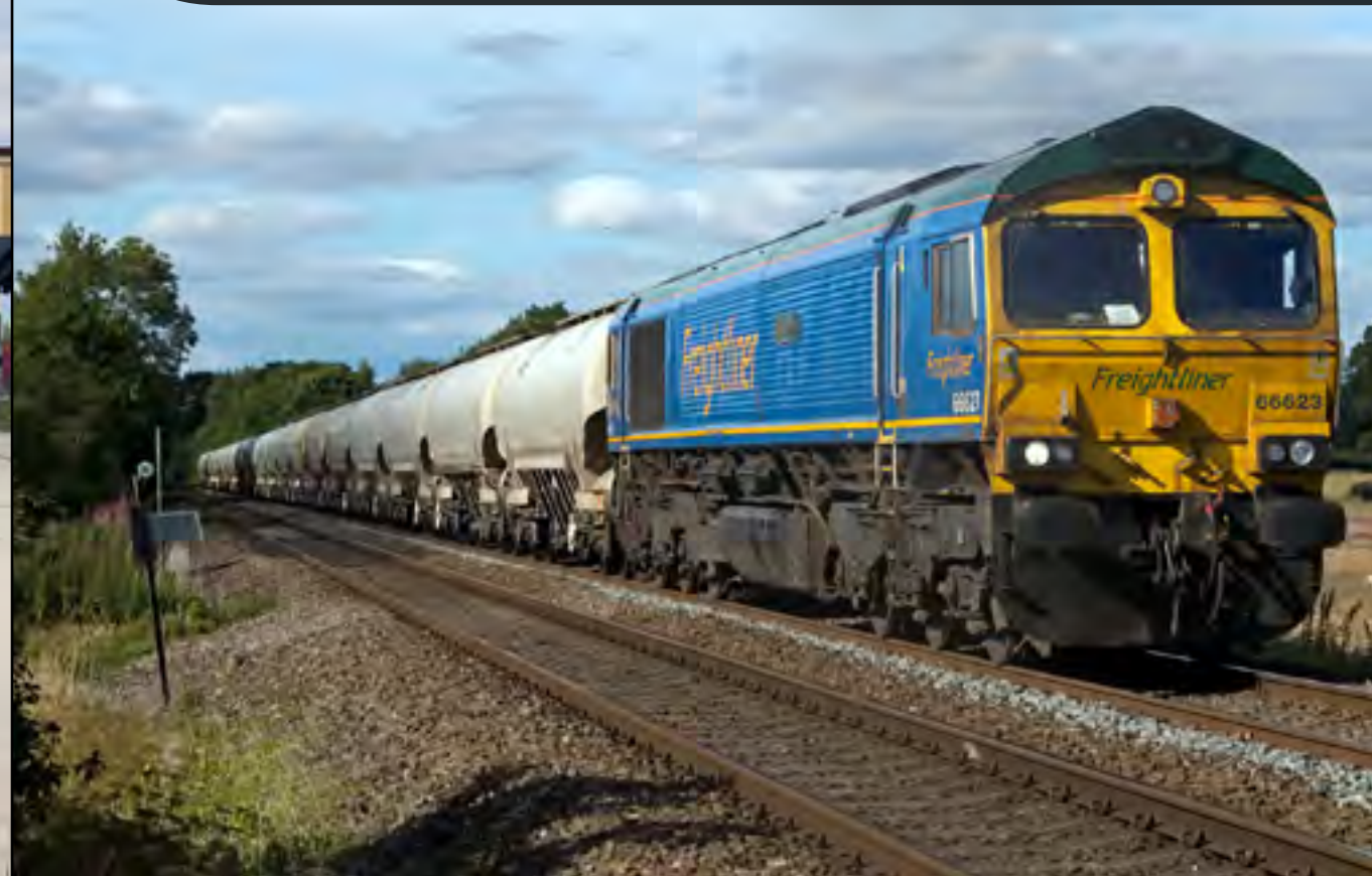
Class 66 623 leads the 6V82 Tunstead - Westbury through All Stretton on July 19th. Carl Grocott