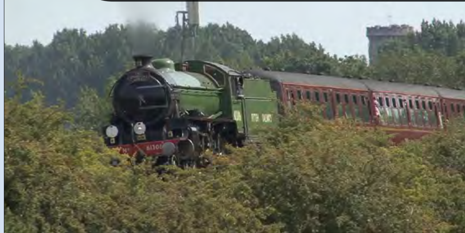
LNER B1 No. 61306 'Mayflower' is seen at Kings Langley working a Southend to Stratford upon Avon charter on August 22nd.

Motorists are advised that nearby level crossings at Tallington and Maxy remain open and are viable routes for those travelling north. Other crossing alternatives include Bainton, Helpston, as well as Uffington and Barnack.