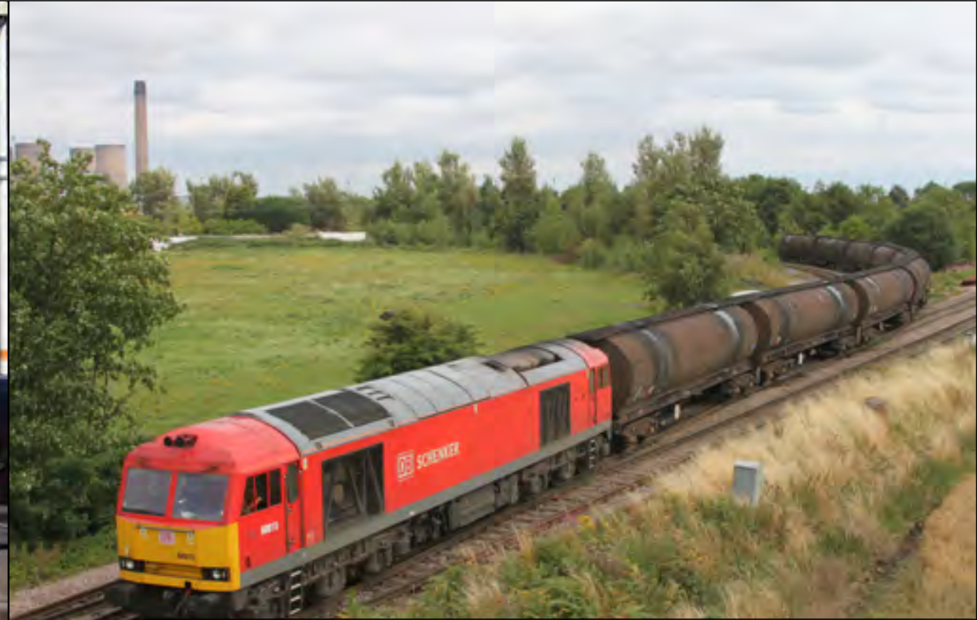
Class 60 015 approaches Whitley Bridge with an Eggborough to Lindsey empty tank train on August 21st. Robert Bates