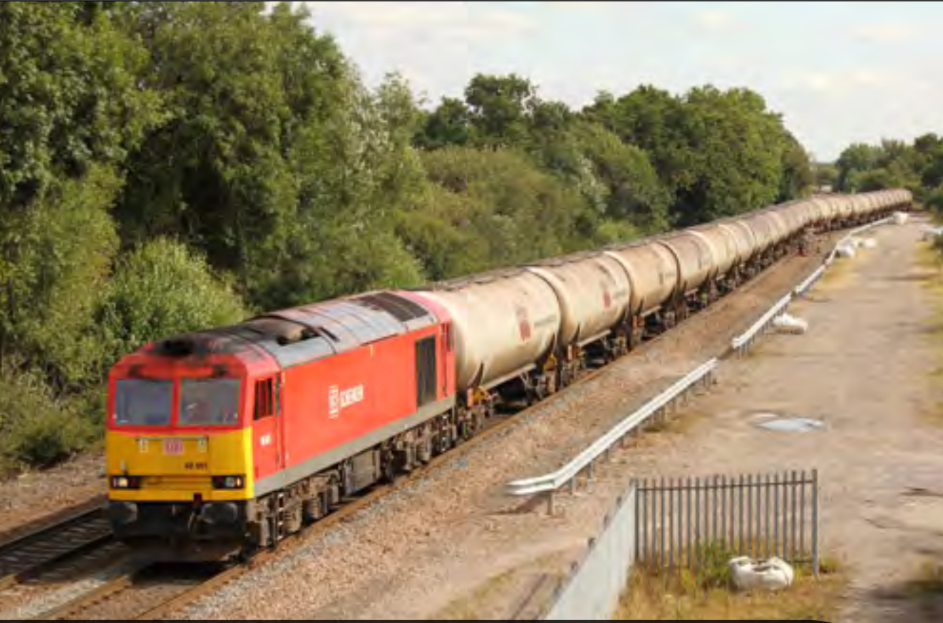
Class 60 001 passes Stenson Junction working the 6M57 Lindsey to Kingsbury loaded tanks on August 19th.