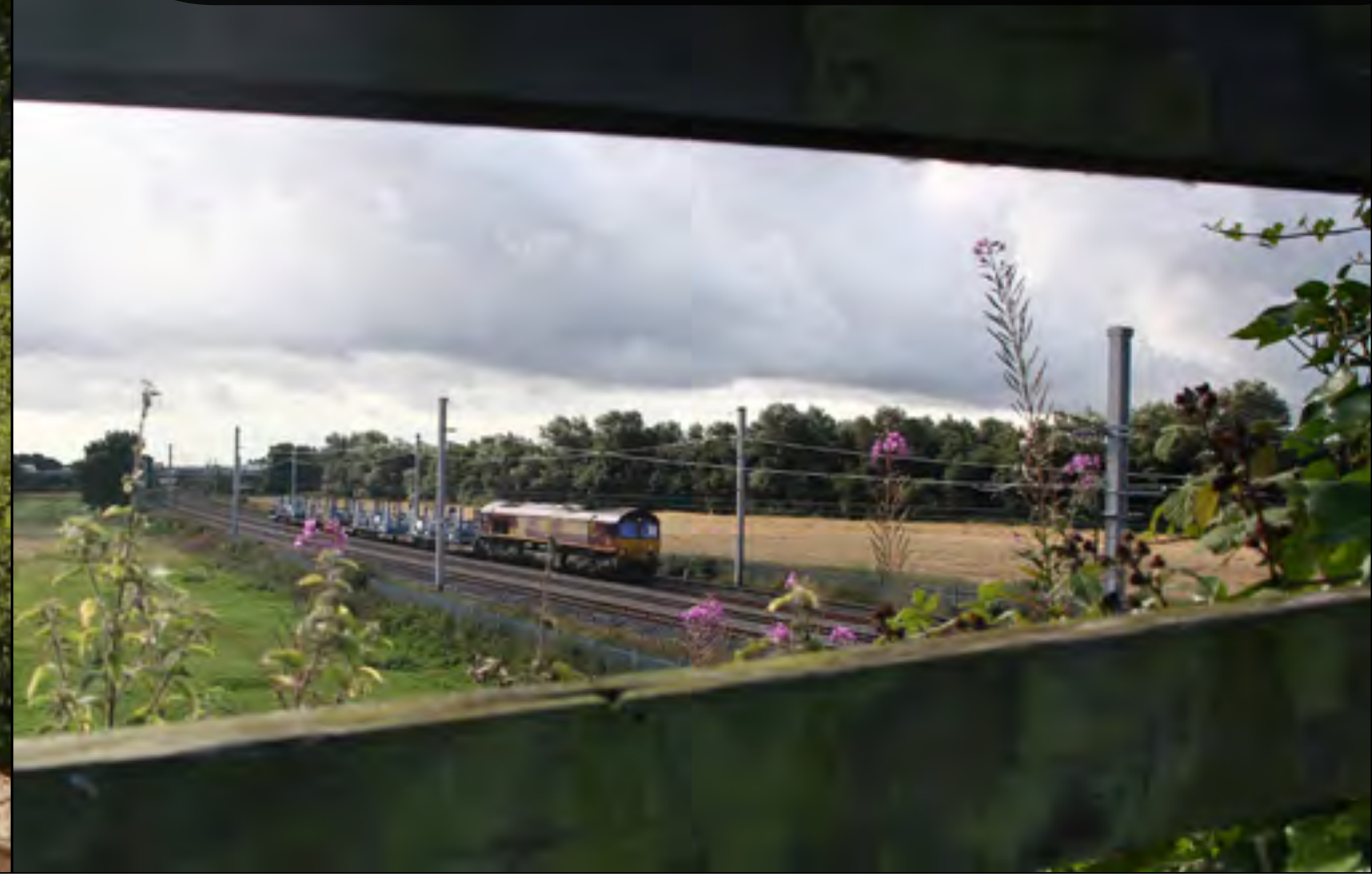
Class 66 113 heads the 6F50 past Winwick on August 26th.