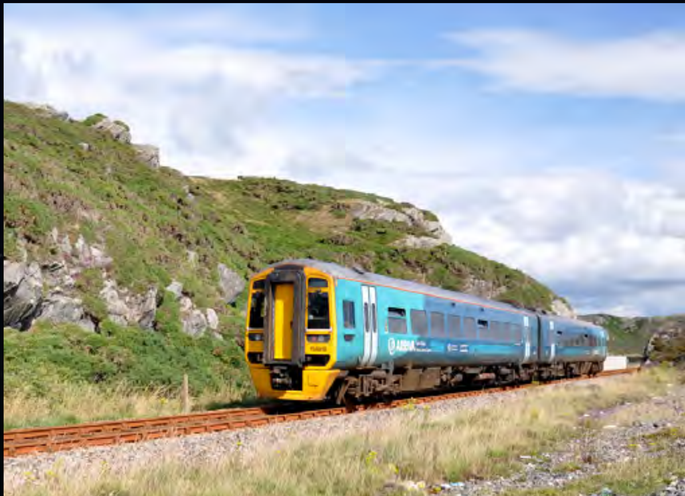
Left: A Birmingham-bound Arriva Trains Wales Class 158 picks up speed as it heads away from Criccieth, on the Cambrian Coast line, July 28th. Ben Bucki