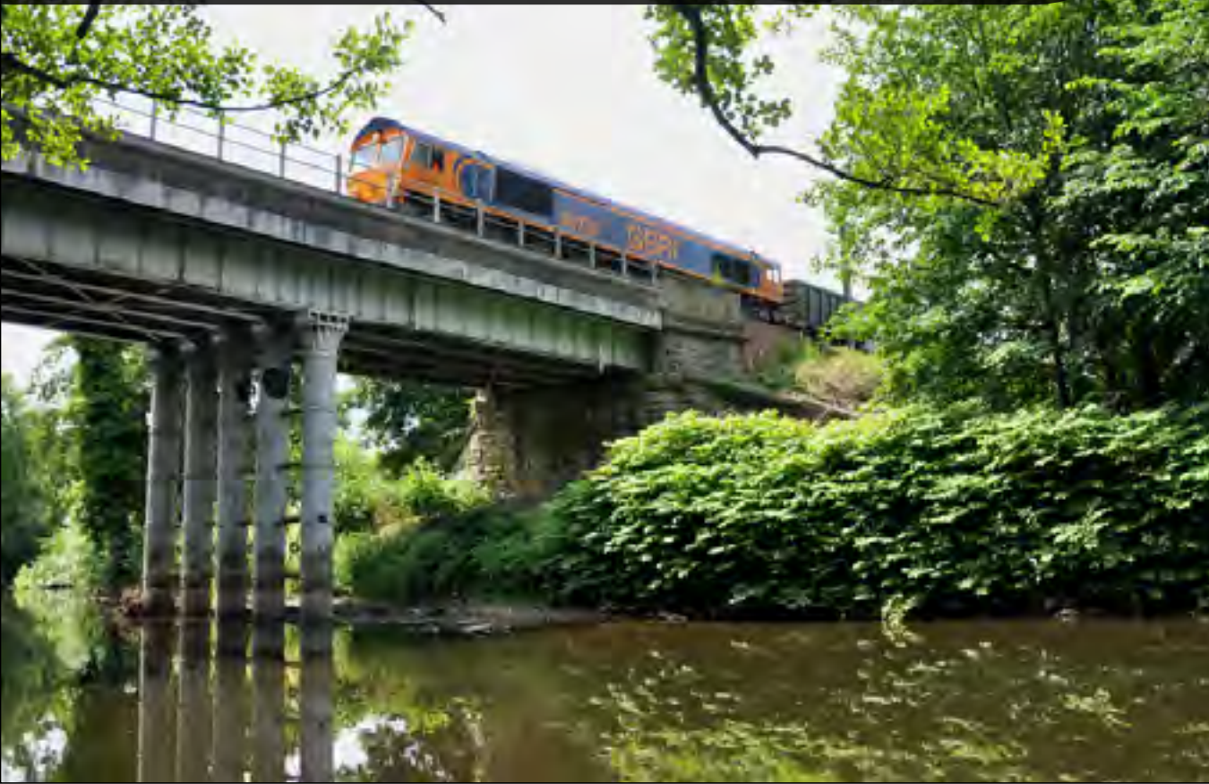
On July 2nd, Class 66 735 powers a southbound freight over the River Aire at Hirst Wood, between Bingley and Saltaire. Ben Bucki