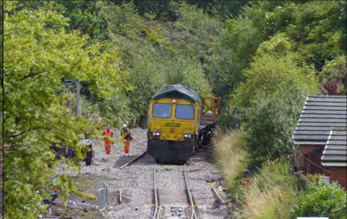
Another engineering possession sees Class 66 597 with a rake of empty wagons at Sough Road, returning to Carlisle on August 9th.