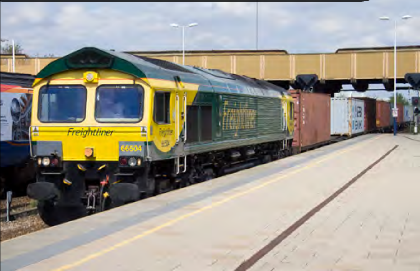
On August 8th, Class 66 504 passes through Leicester with a northbound liner.