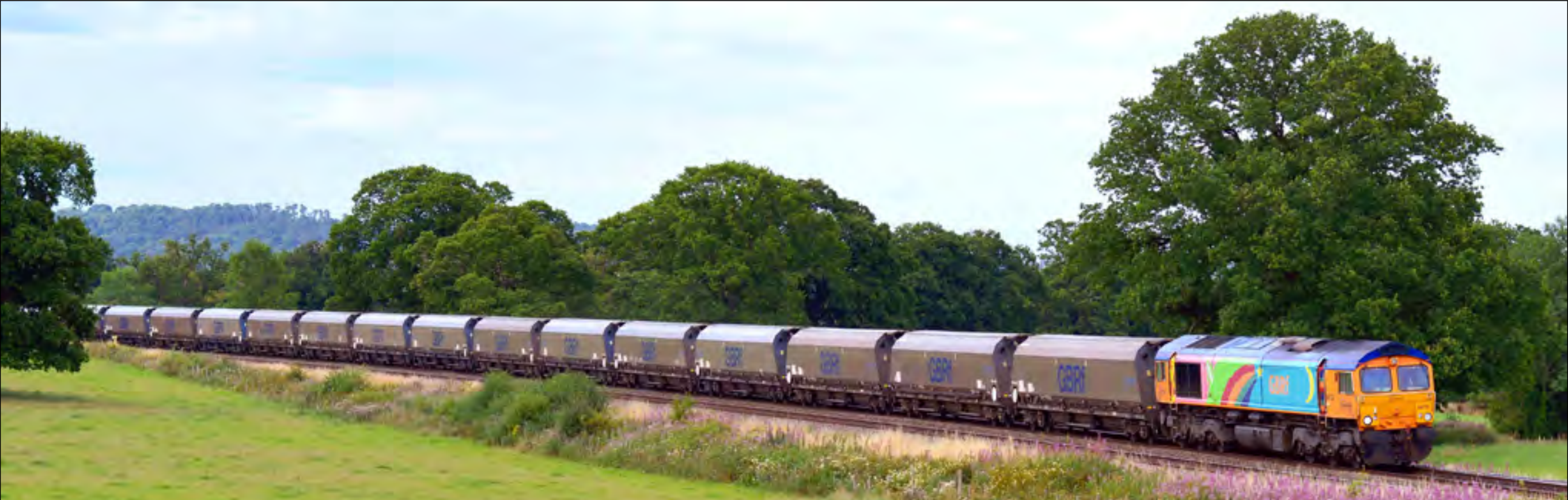
Class 66 720 is seen at Hadnall on August 16th, working the 6G57 15:00 Liverpool Bulk Terminal - Ironbridge power station 'B' Biomass. Keith Davies