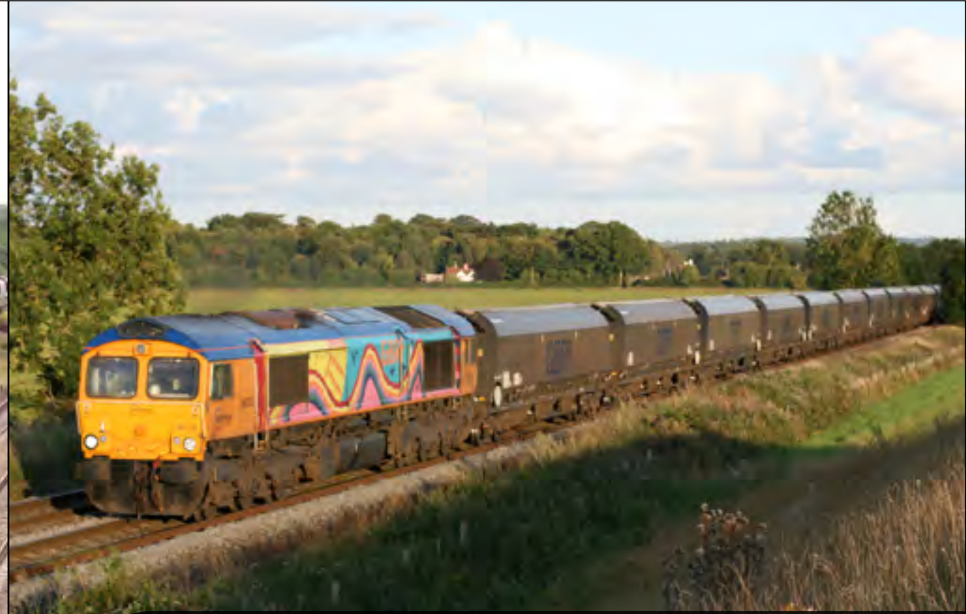
On August 27th, Class 66 720 passes Upton working the 6G60 Liverpool - Ironbridge Biomass.