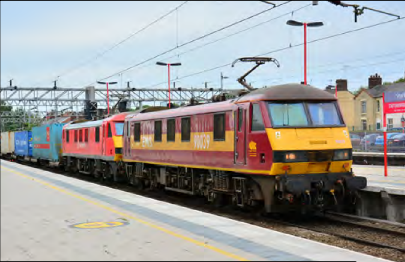
Class 90 039 leads 90 029 through Stafford on August 18th working a Mossend to Daventry Dirft intermodal.