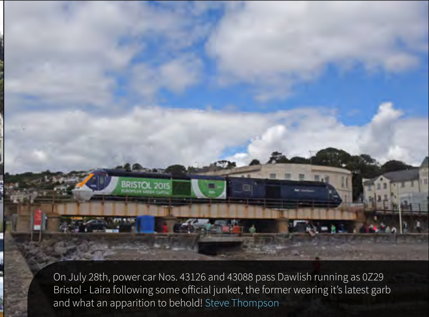
On July 28th, power car Nos. 43126 and 43088 pass Dawlish running as 0Z29 Bristol - Laira following some official junket, the former wearing it's latest garb and what an apparition to behold! Steve Thompson