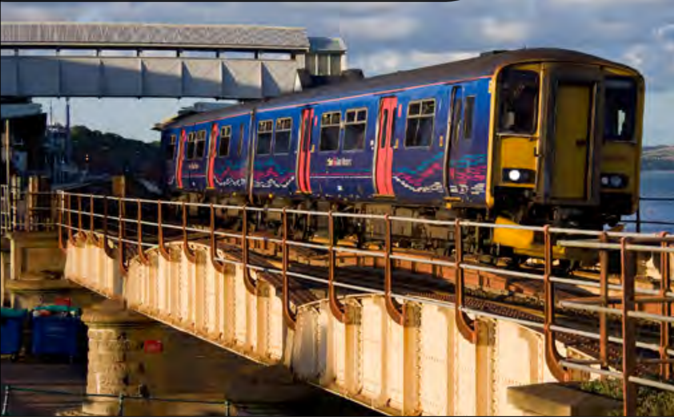
On July 28th, First Great Western's Class 150 243 departs Dawlish working an Exmouth to Paignton service.