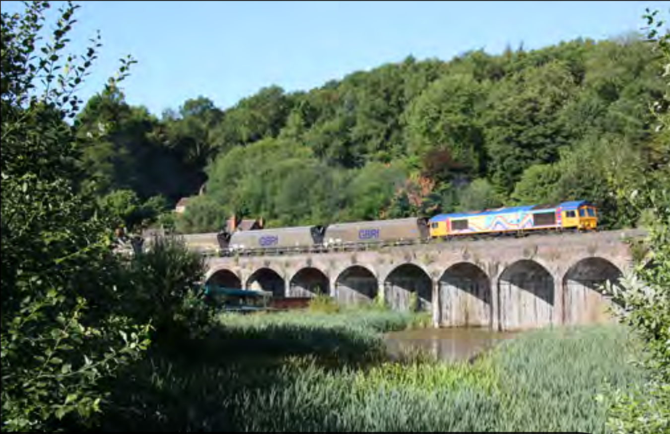
Class 66 720 passes Coalbrookdale working the 4F68 Ironbridge - Liverpool empty Biomass on August 15th.