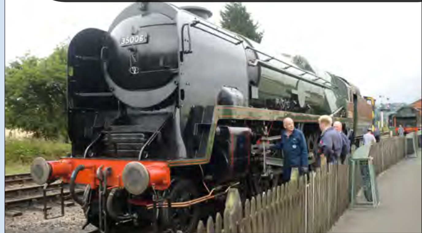
Rebuilt Merchant Navy Class No. 35006 'Peninsular & Oriental S. N. Co' is seen in steam for the first time on August 10th at the GWR Toddington.

The majority of work on the structure will be carried out during night shift between the hours of 20:00 and 06:00. During full closures of the road, motorists should exit the M80 at Haggs divert through Kilsyth and rejoin at Auchenkilins.