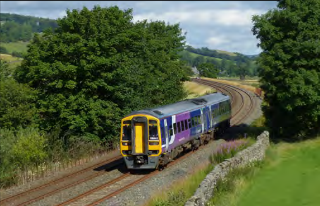
On August 8th, Northern's Class 158 845 passes Helwith Bridge with a Carlisle - Leeds service.