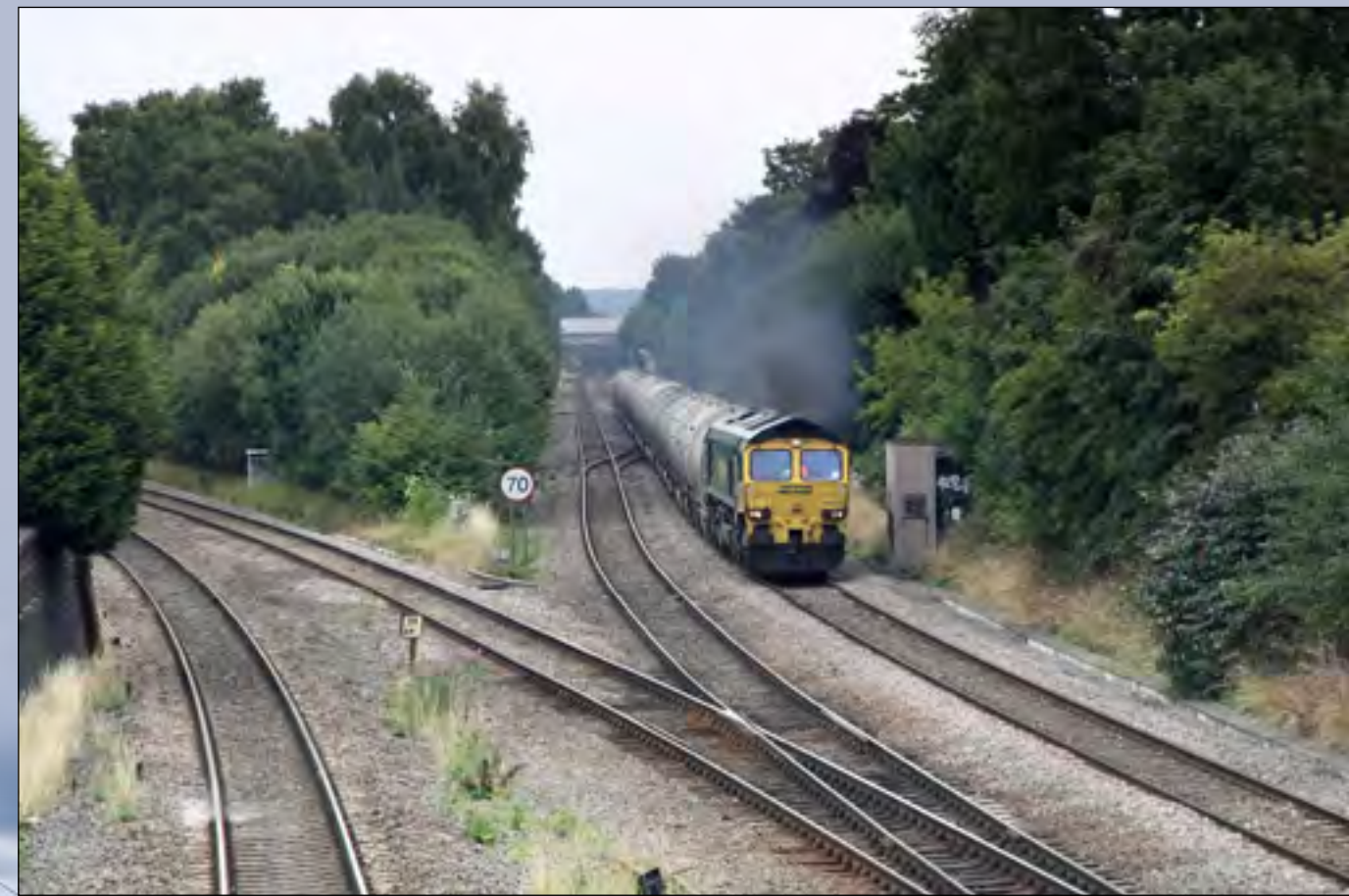
Below: Class 66 566 passes Burn, near Selby, with a Tees to Felixstowe container train on August 10th.