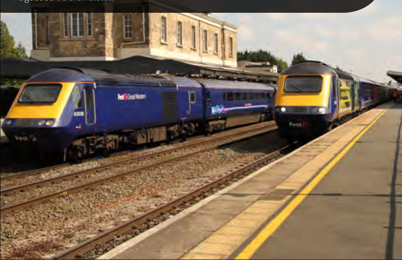
Power car No. 43028 is on the rear of 10:13 Bath to London Paddington whilst 43144 leads the 10:03 London Paddington to Cardiff Central at Swindon on August 8th. Derek Elston