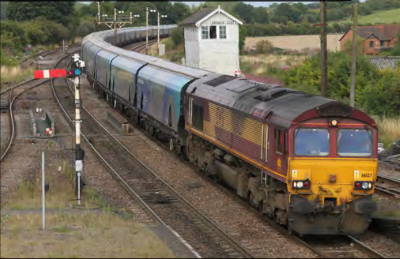
Class 66 127 heads an Immingham to Drax loaded Biomass train through Barnetby station on August 20th. Robert Bates