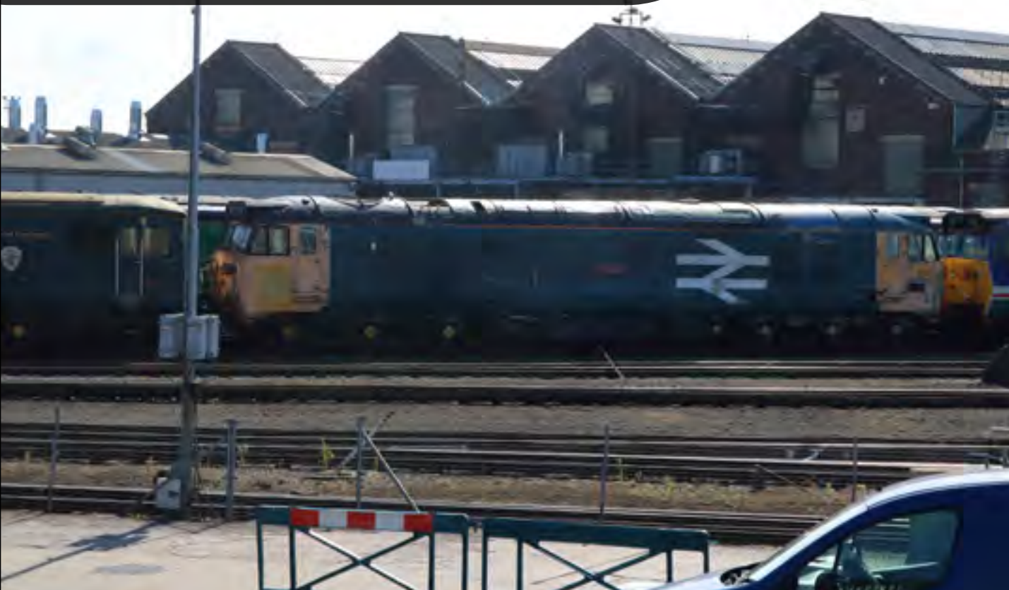
Class 50 021 'Rodney' awaits attention at Eastleigh Works on July 31st. Class47