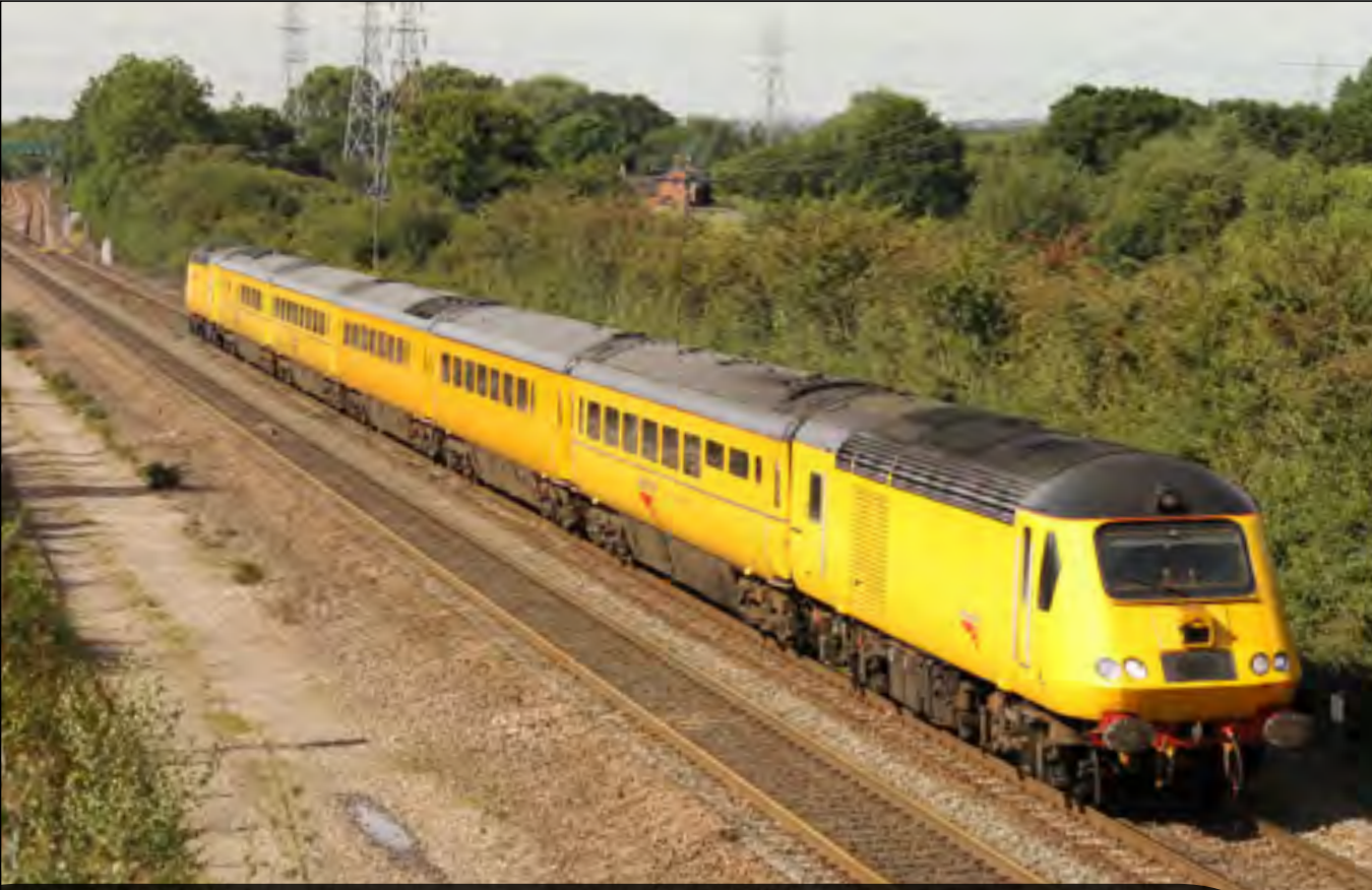
The NMT is seen at Stenson Junction on August 19th working the 04:07 from Falkland S.S. (Ayr) to Derby RTC.