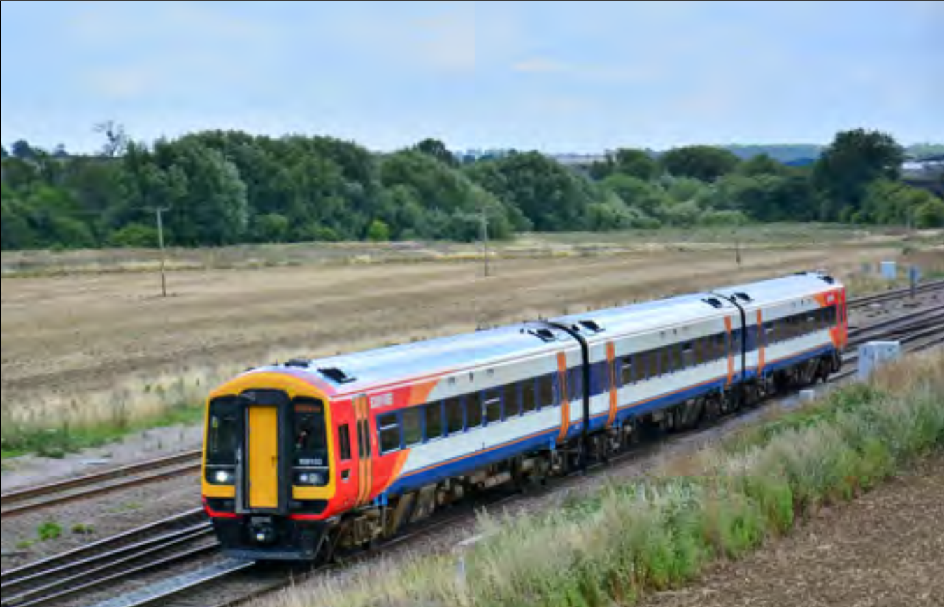
South West Trains' Class 159 102 passes Harrowden Junction, a stranger to the Midlands, on it's way to Brush Works from Salisbury, August 15th.