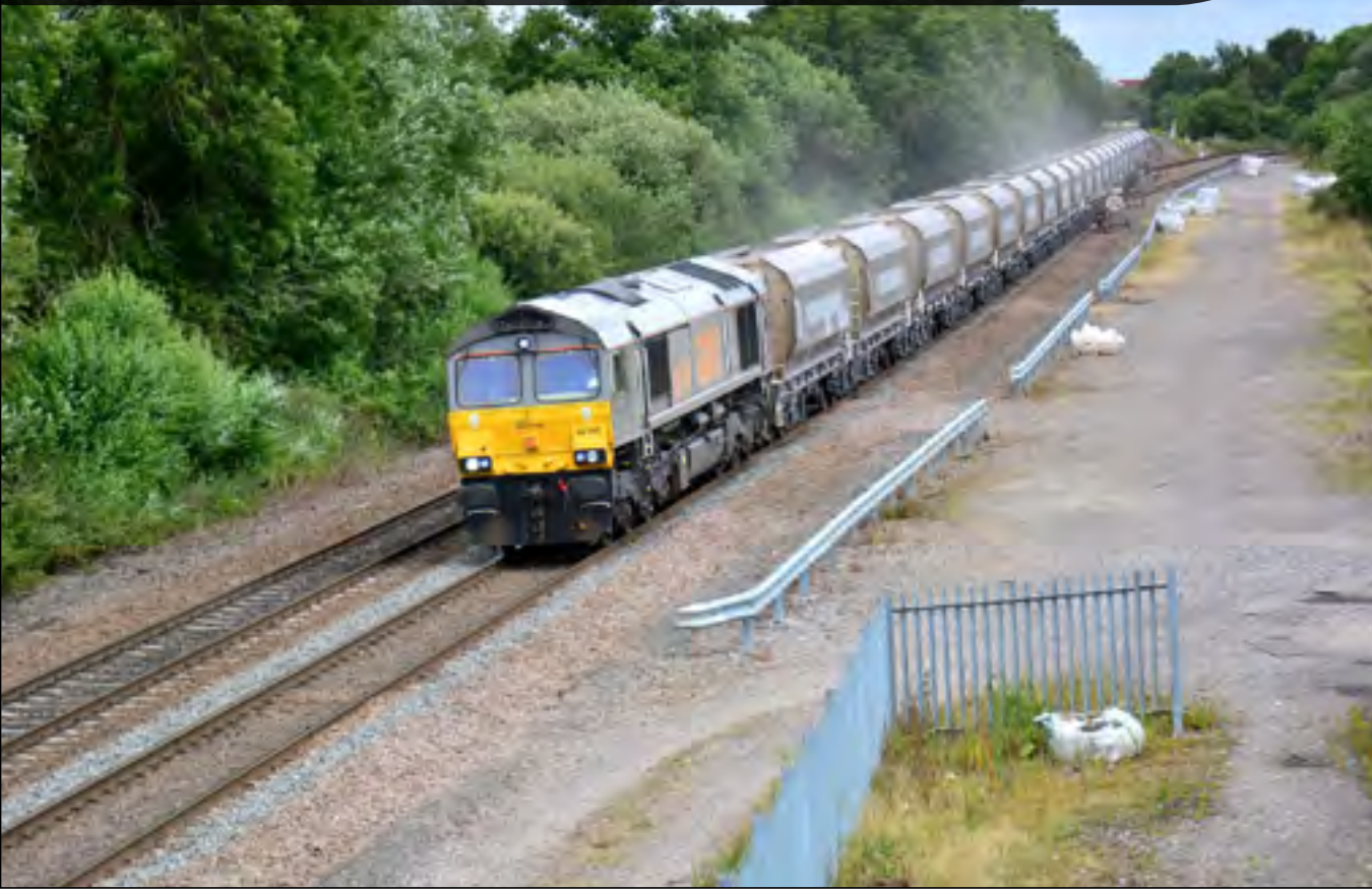
Class 66 749 leads a Tinsley to Bardon Hill working through Stenson Jct. on August 4th.