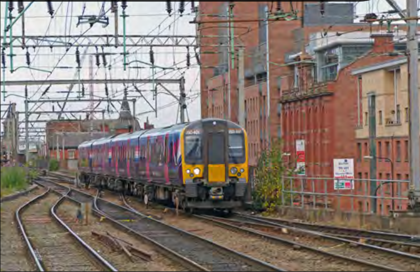
On August 18th, First TransPennine Express' Class 350 401 arrives into Manchester Oxford Road with a service from Glasgow to Manchester Airport.