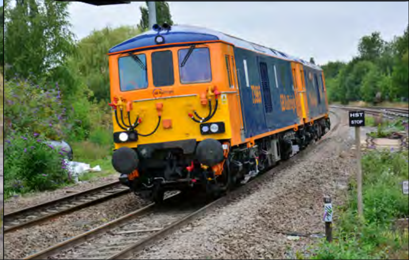
On August 13th, Class 73 965 leads 73 964 speeding through Kettering station working the 0Y73 Brush Works to Tonbridge West Yard.