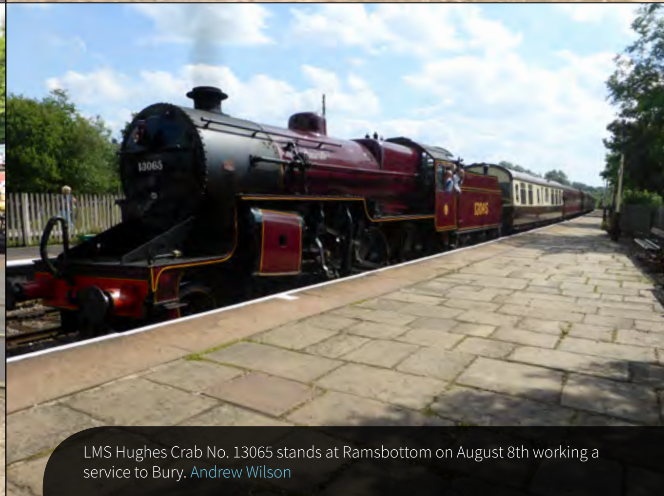
LMS Hughes Crab No. 13065 stands at Ramsbottom on August 8th working a service to Bury.