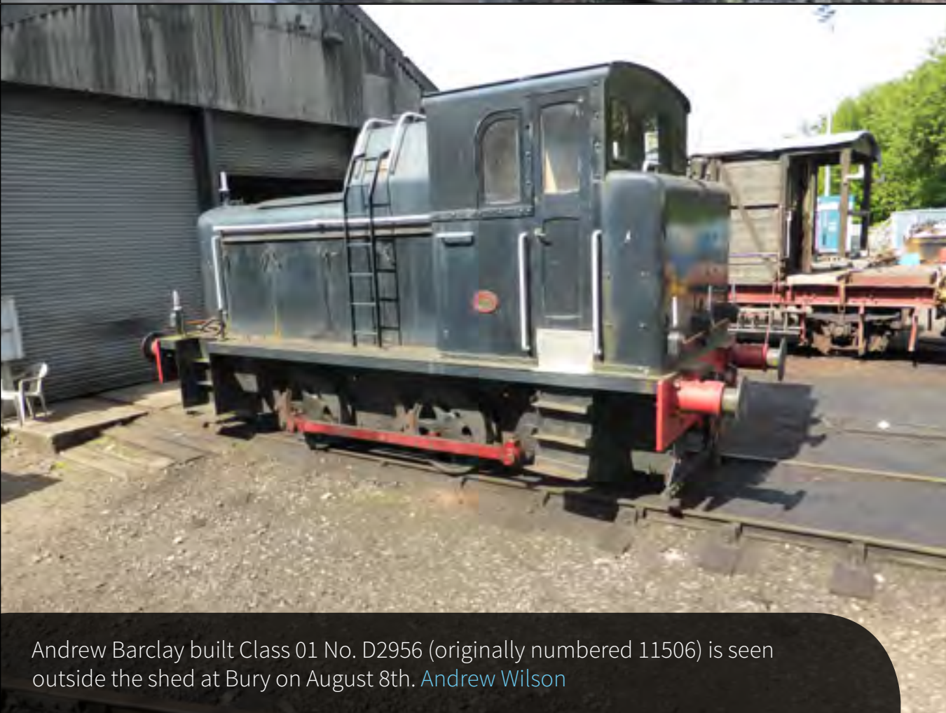
Andrew Barclay built Class 01 No. D2956 (originally numbered 11506) is seen outside the shed at Bury on August 8th.