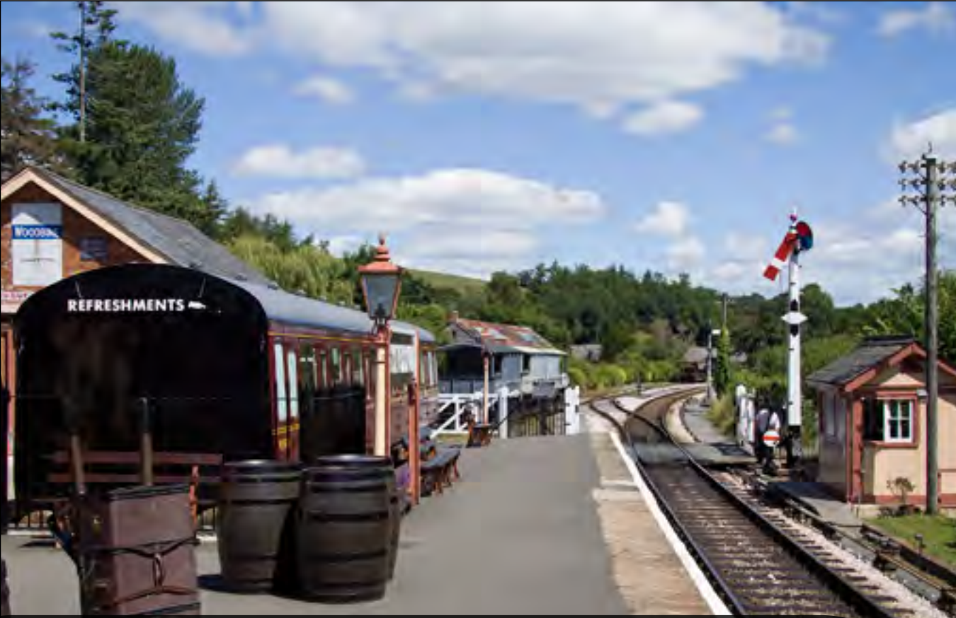
The delightfully restored station at Staverton on the South Devon Railway is seen in lovely summer sunshine on July 30th.