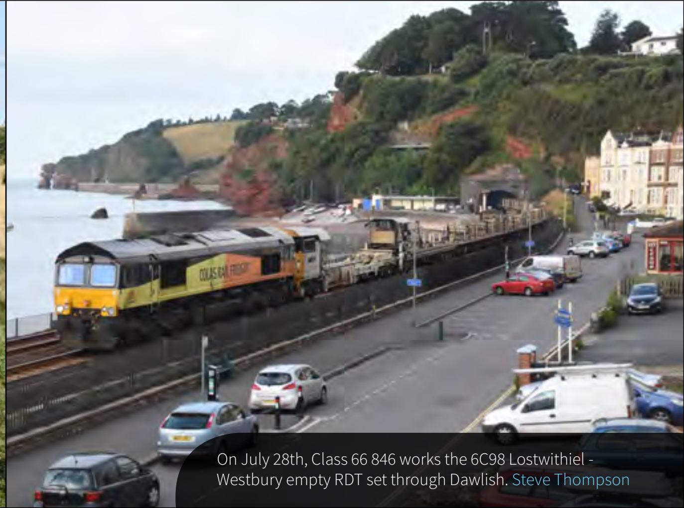
On July 28th, Class 66 846 works the 6C98 Lostwithiel - Westbury empty RDT set through Dawlish.