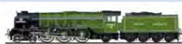
The A1 Steam Locomotive Trust New Steam for the Main Line