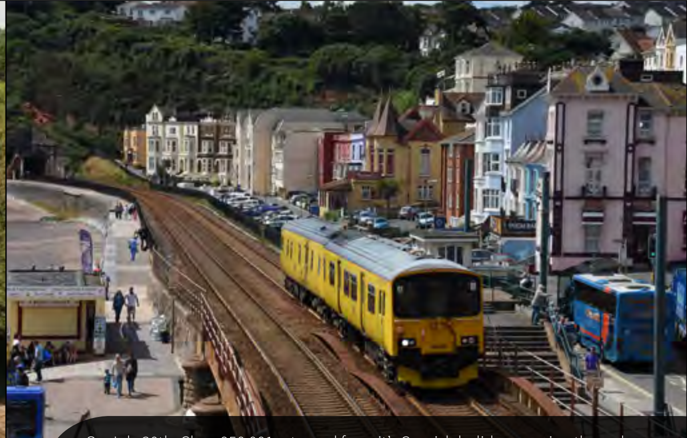
On July 30th, Class 950 001 returned from it's Cornish holiday, passing through Dawlish running a couple of hours early on 2Q08 Penzance - Exeter Riverside.