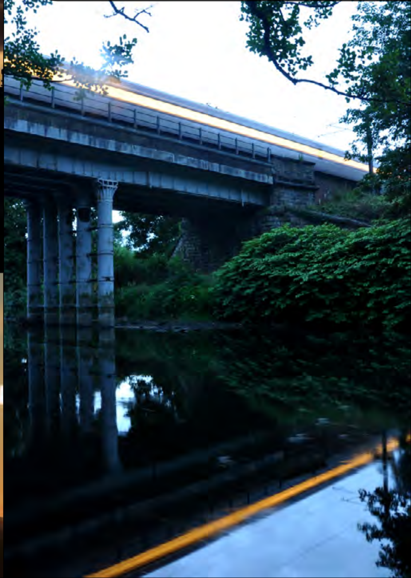
A Class 91 working a Skipton train, speeds past Hirst Wood on July 6th. Ben Bucki