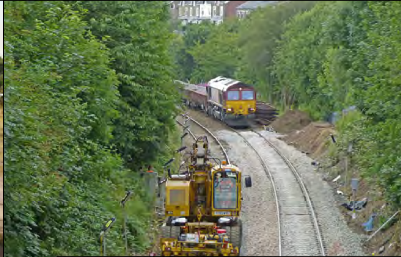
Class 66 089 approaches Sudell Road, Darwen with a ballast train from Carlisle on August 11th.