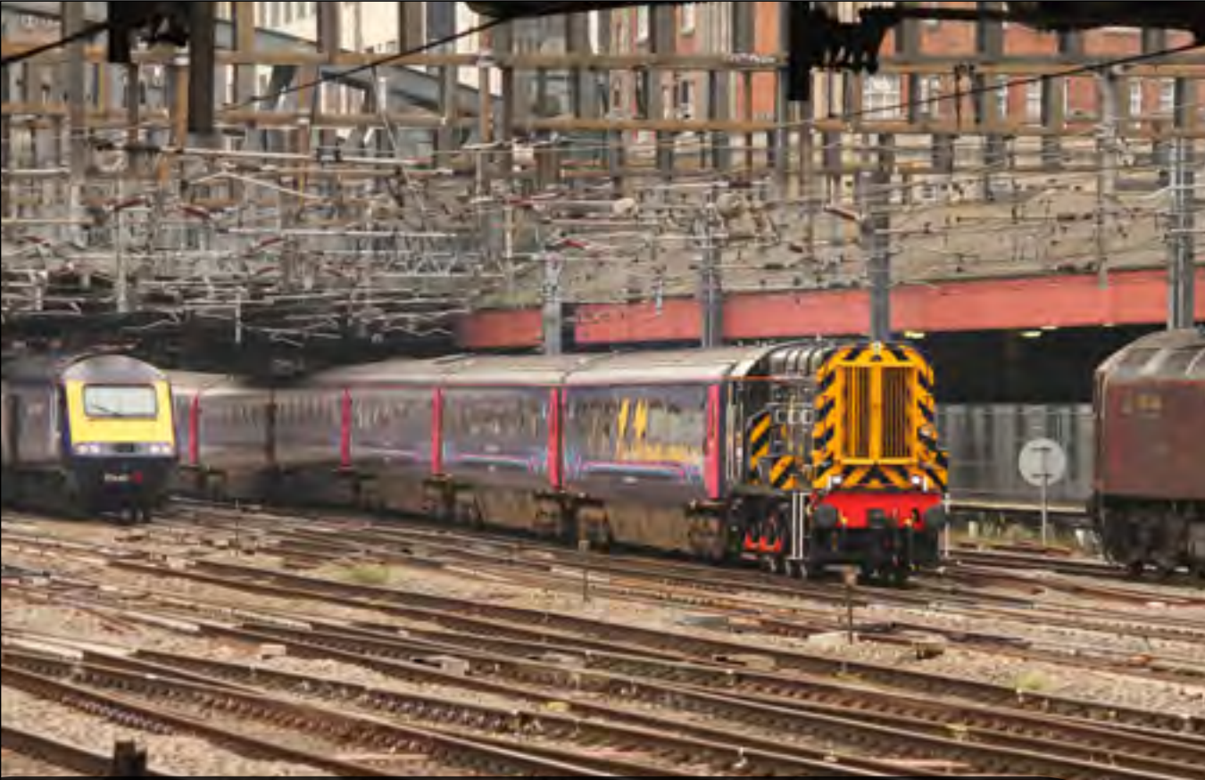
Class 08 483 is seen departing London Paddington for Old Oak Common on August 8th, with the ECS from the Penzance sleeper.