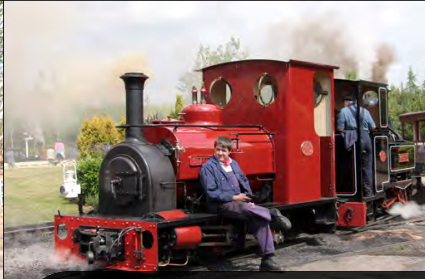
'STATFOLD' (Hunslet No. 3903/2005) and 'MARCHLYN' (Avonside No. 1842/1933) and crew have a well earned rest.