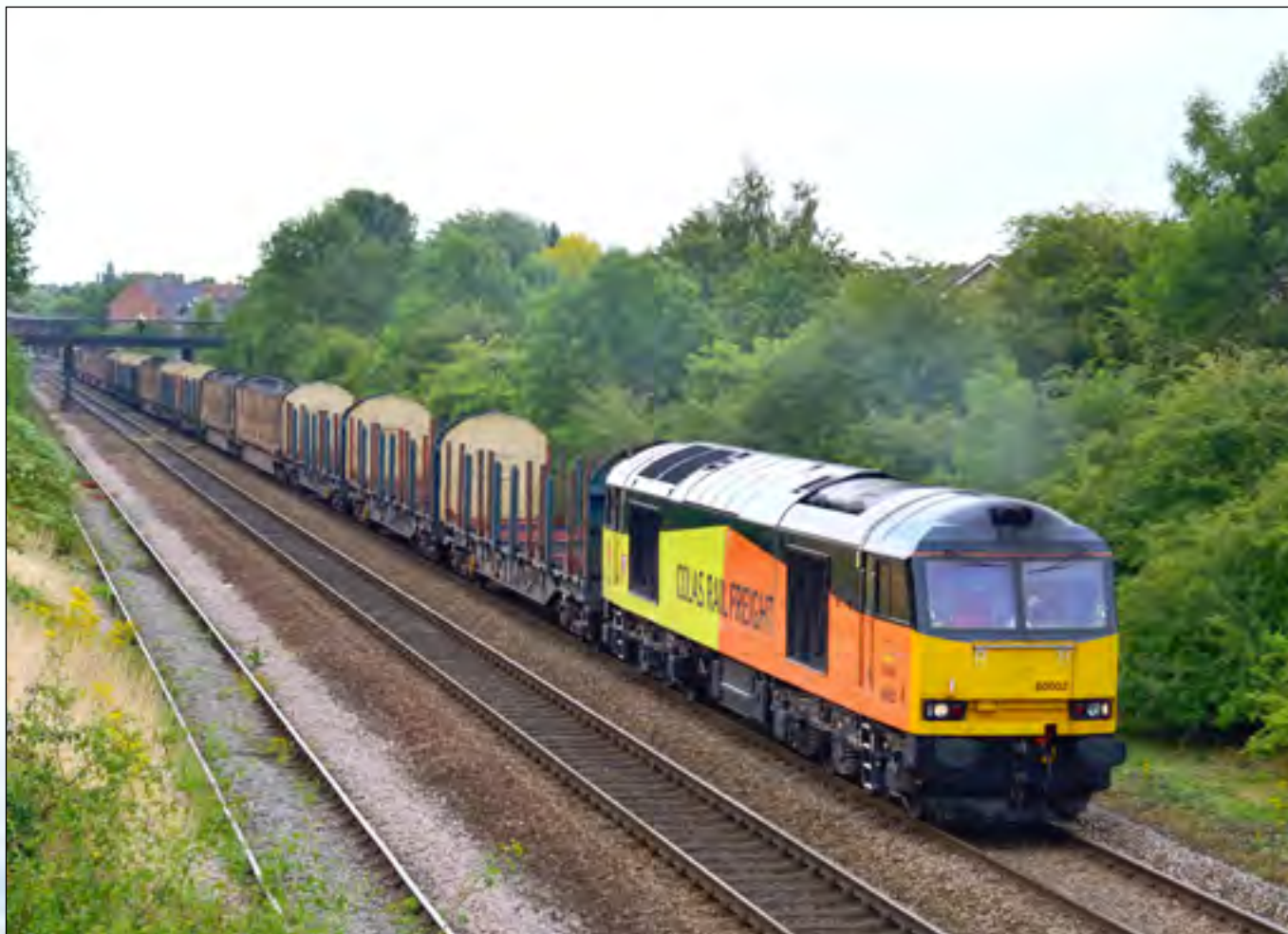
Left: Class 60 002 passes Kempsey Shrewsbury with a re-timed 6V54 13:21 Chirk Kronospan - Baglan Bay empty logs on August 5th. Keith Davies