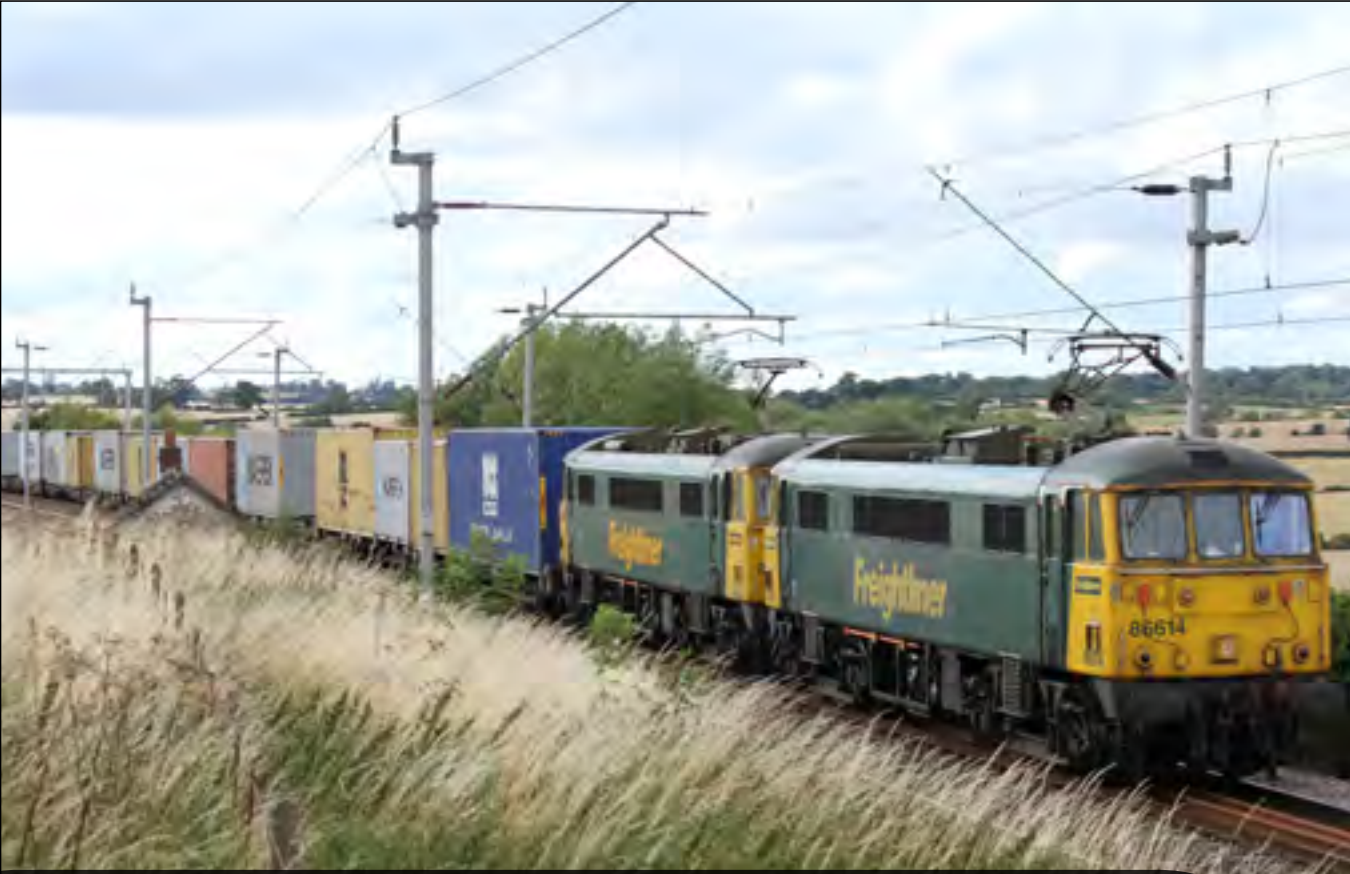
Class 86 614 and 86 628 pass Church Brampton working the 4L92 Ditton to Felixtowe liner on August 10th.