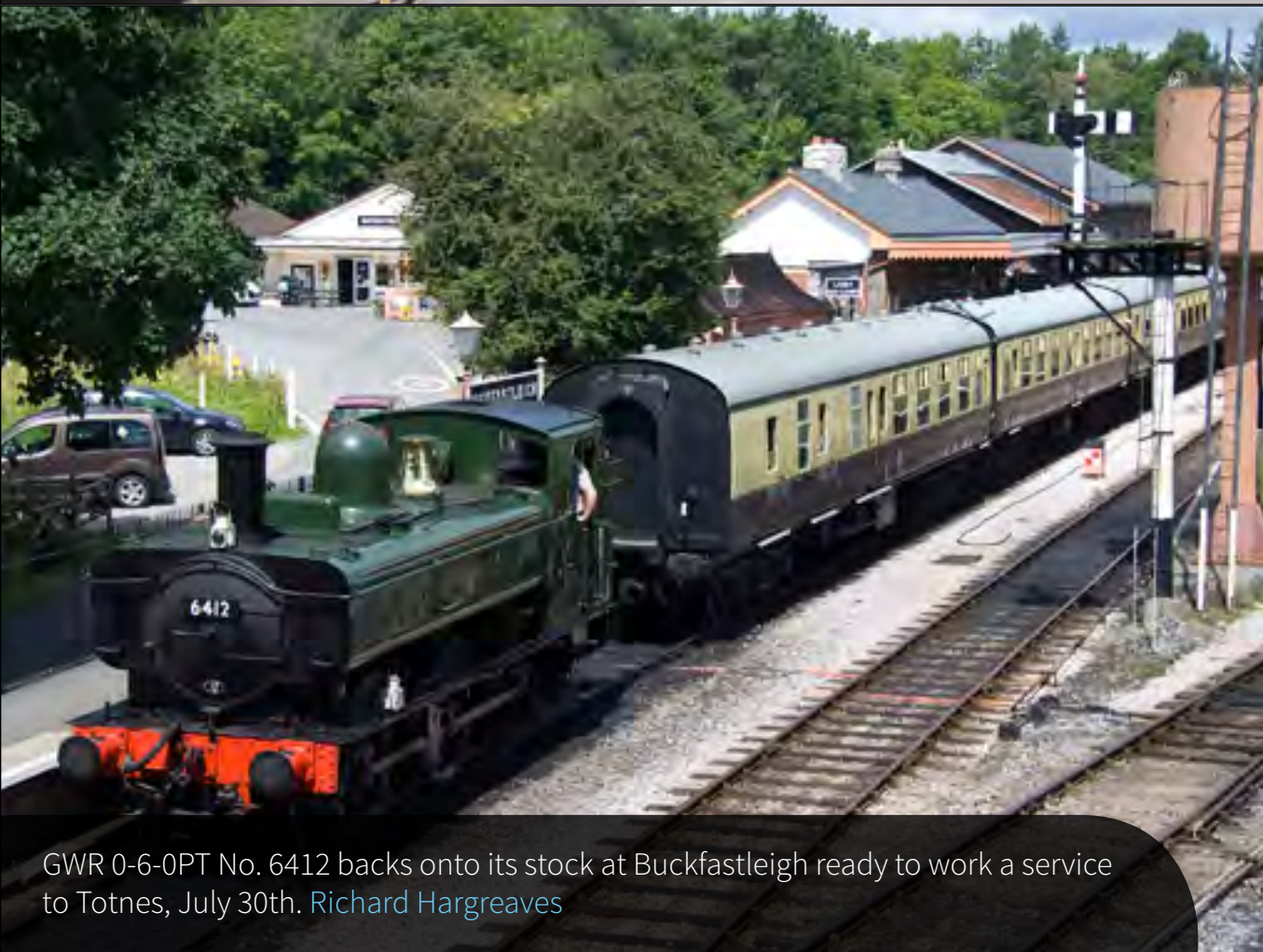
GWR 0-6-0PT No. 6412 backs onto its stock at Buckfastleigh ready to work a service to Totnes, July 30th. Richard Hargreaves