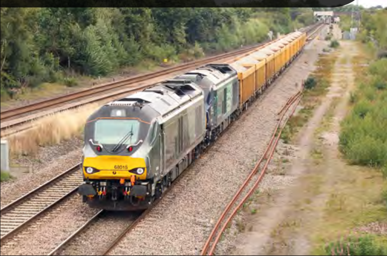
Class 68 015 and 68 004 are seen at the head of 6U77 Mountsorrel to Crewe Basford Hall at North Staffs Junction on August 19th.