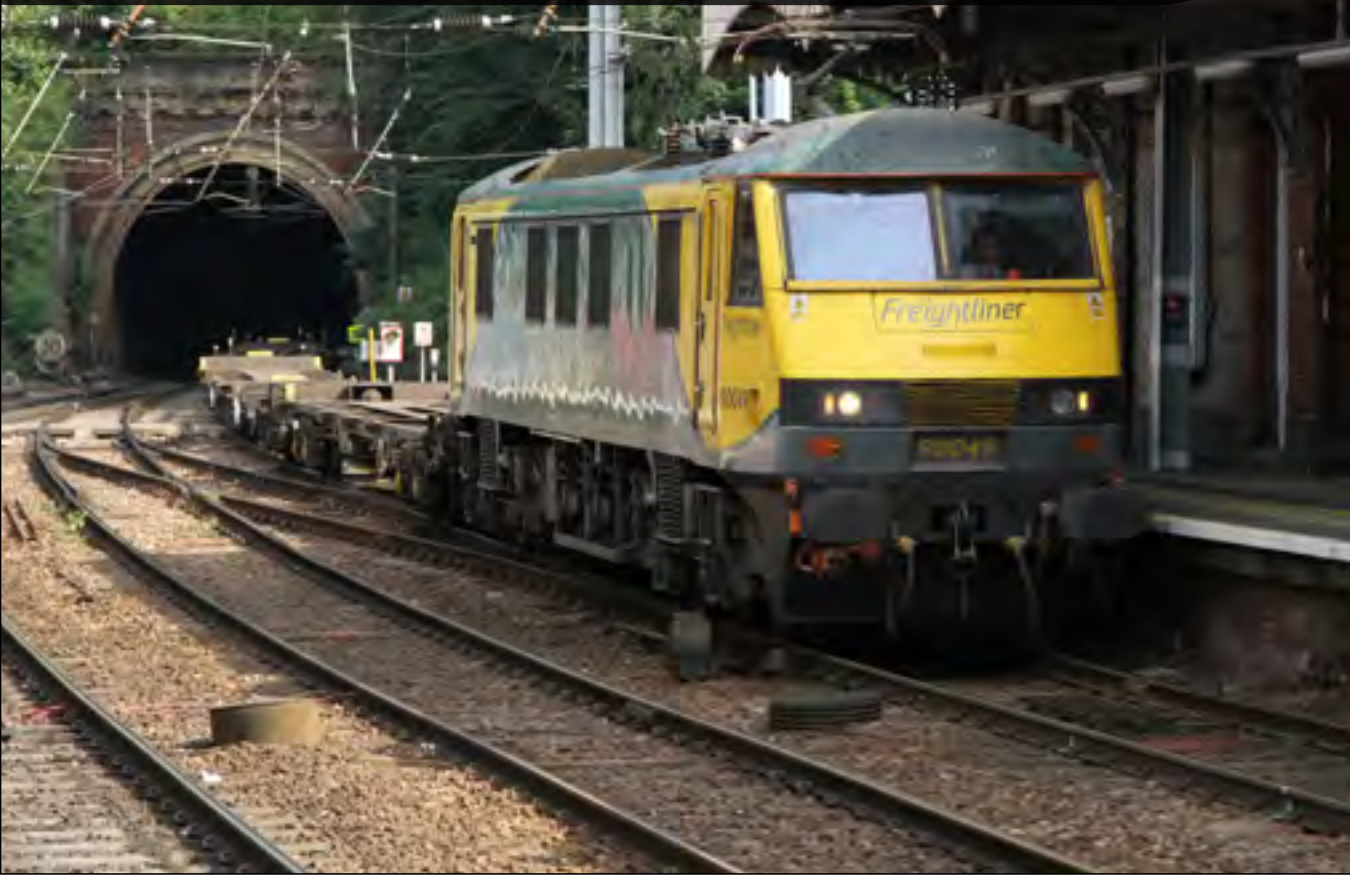
On August 7th, Class 90 049 exits Ipswich Tunnel with a lightly laden 03:10 Garston FLT to Felixtowe North liner.