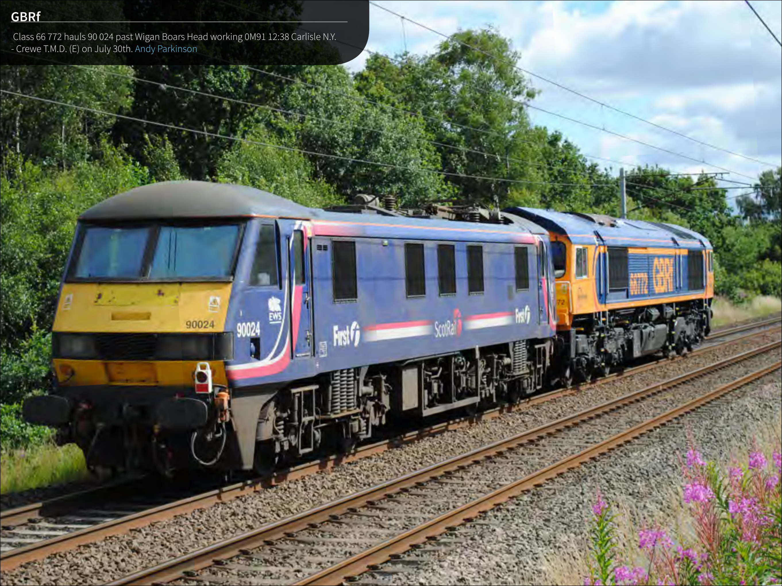
Class 66 772 hauls 90 024 past Wigan Boars Head working 0M91 12:38 Carlisle N.Y. - Crewe T.M.D. (E) on July 30th.