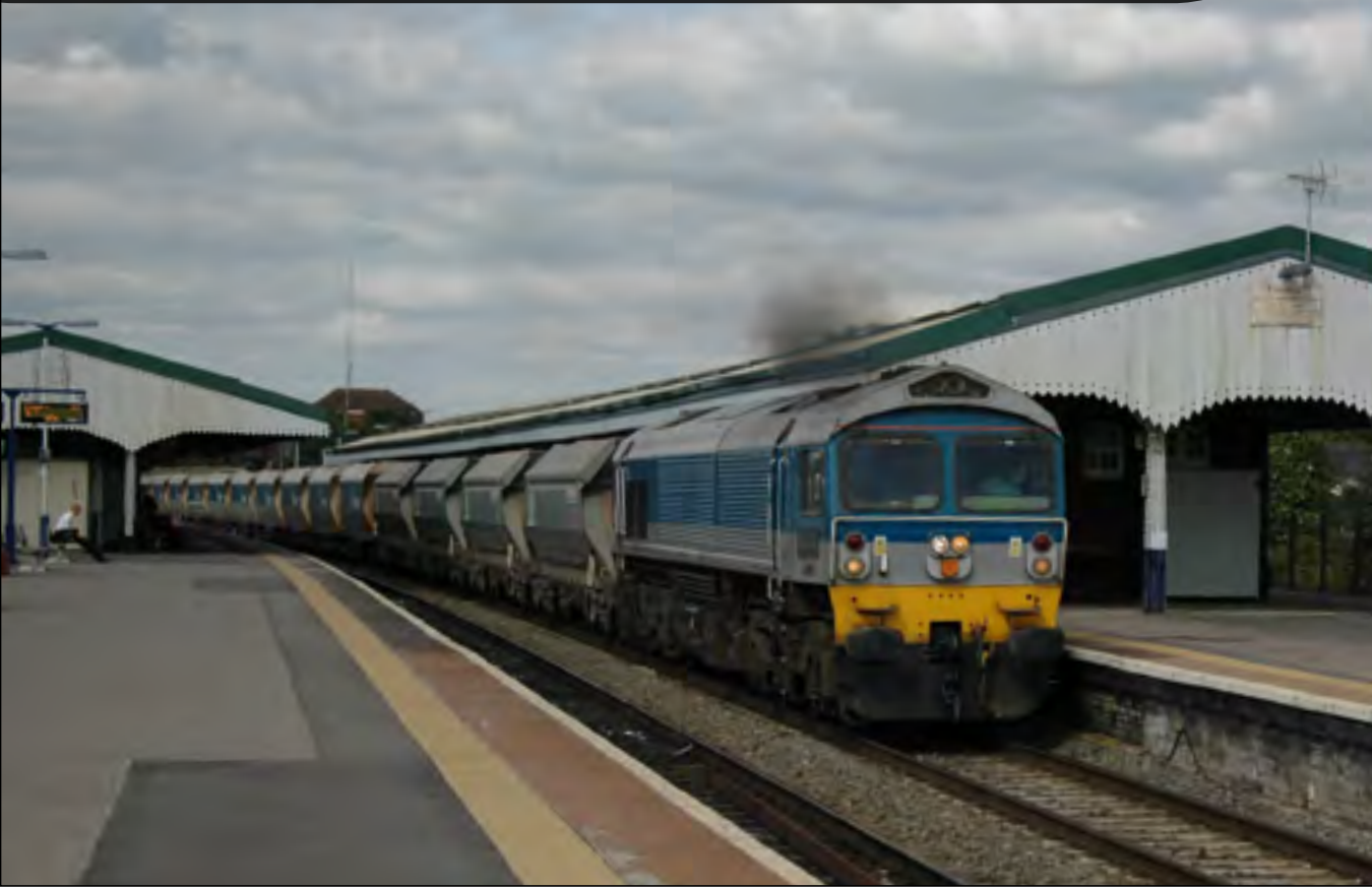
Class 59 004 powers through Westbury on August 6th working the 6C76 from Acton to Whitley Quarry.