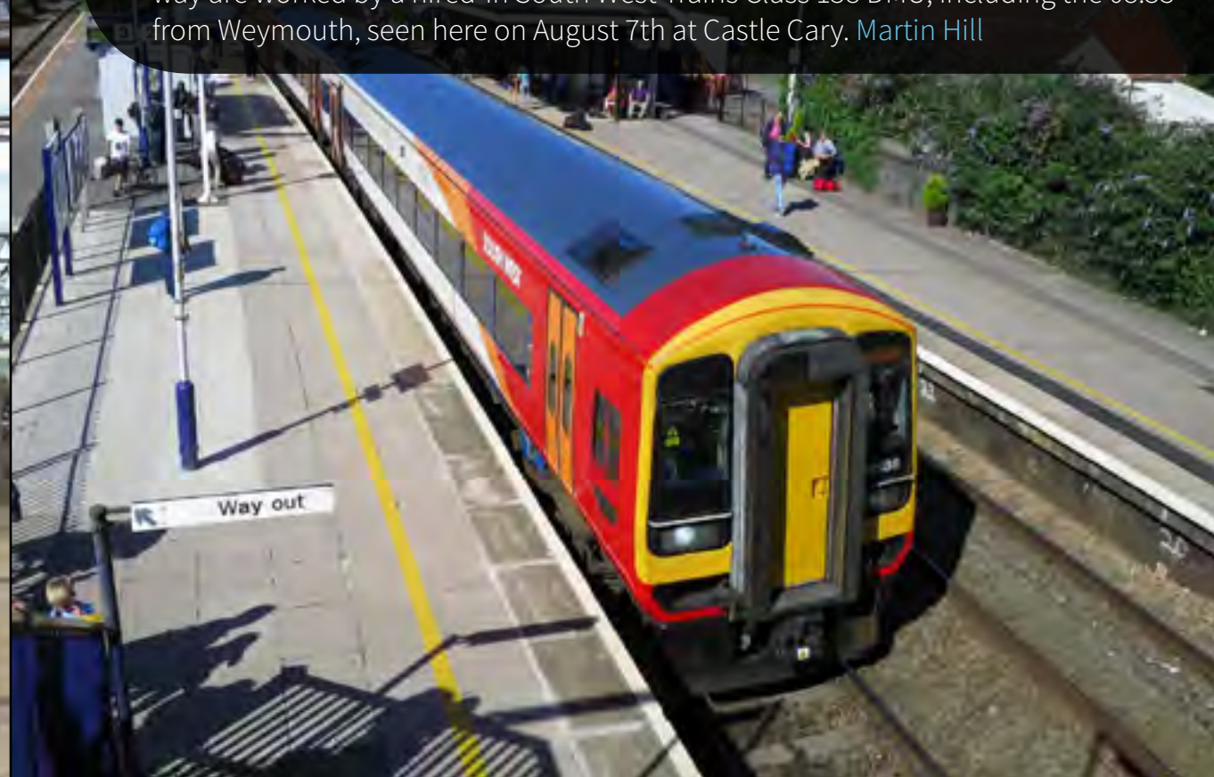
During the electrification work near Bath during August, there are some unusual workings on the Weymouth/Dorchester West - Westbury trains. Three services each way are worked by a hired-in South West Trains Class 158 DMU, including the 08:53 from Weymouth, seen here on August 7th at Castle Cary.