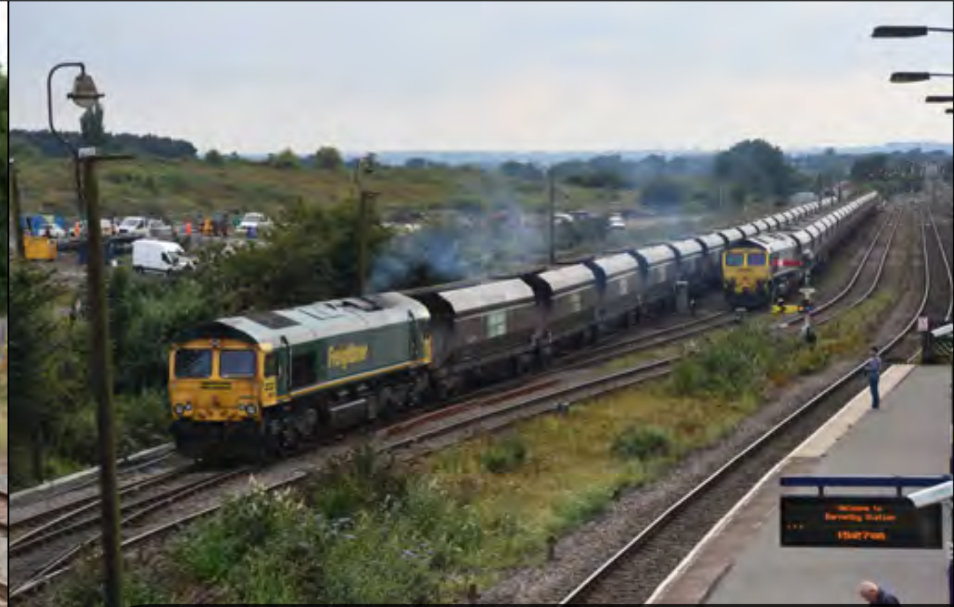
Rush hour at Barnetby Reception Sidings on August 20th as Class 66 620 moves off with 4R18 to HIT, while 66 514 waits it's turn with more empties.