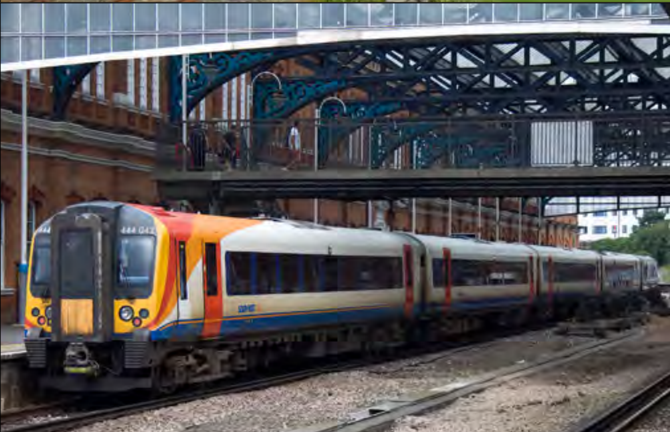
South West Trains' Class 444 042 stands at Bournemouth on August 22nd working a London Waterloo service.