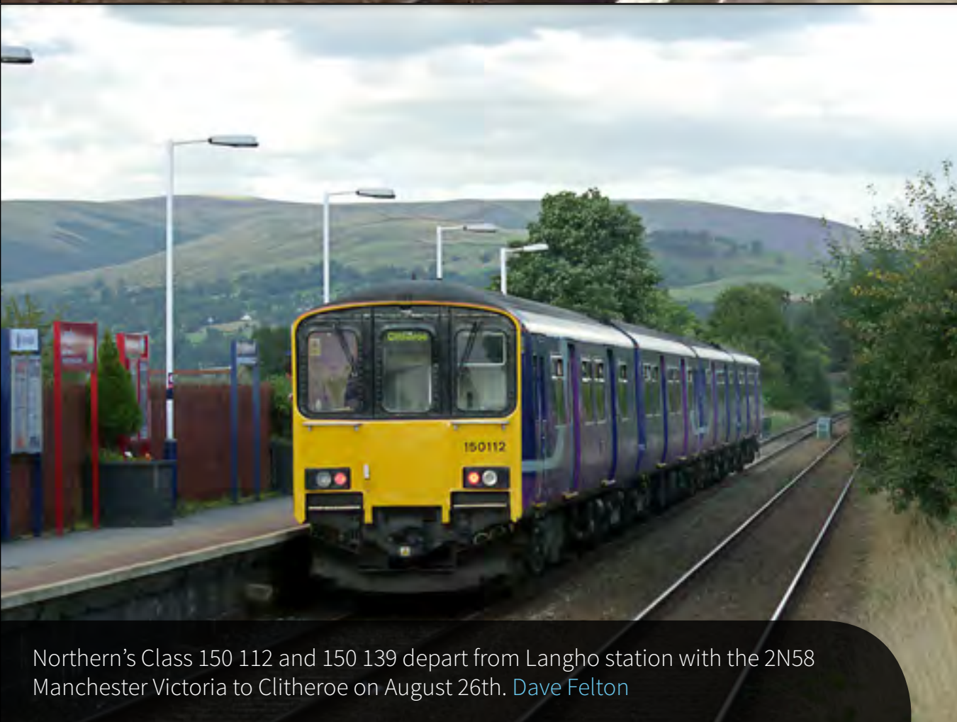
Northern's Class 150 112 and 150 139 depart from Langho station with the 2N58 Manchester Victoria to Clitheroe on August 26th.