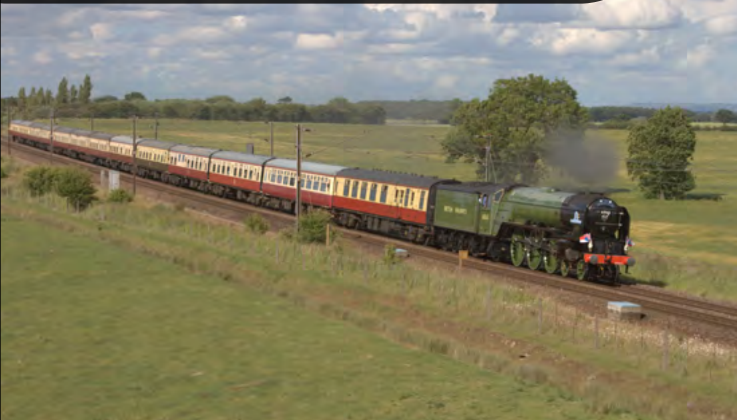
LNER A1 No. 60163 'Tornado' passes Colton Junction with 'The White Rose' excursion from York to Kings Cross on July 7th.