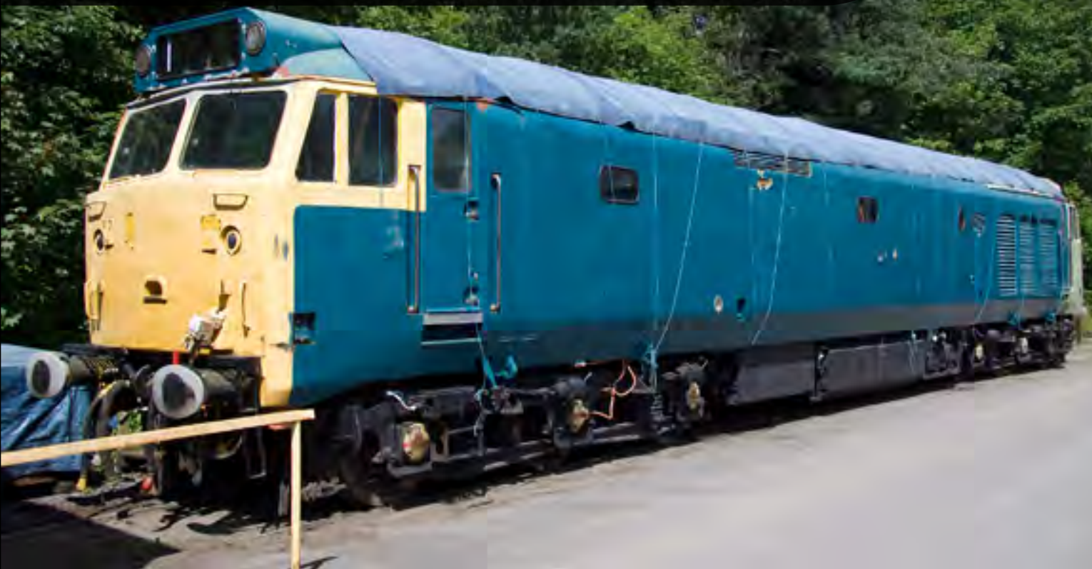
Class 50 No. D402 is seen under restoration at Buckfastleigh on July 30th. Richard Hargreaves