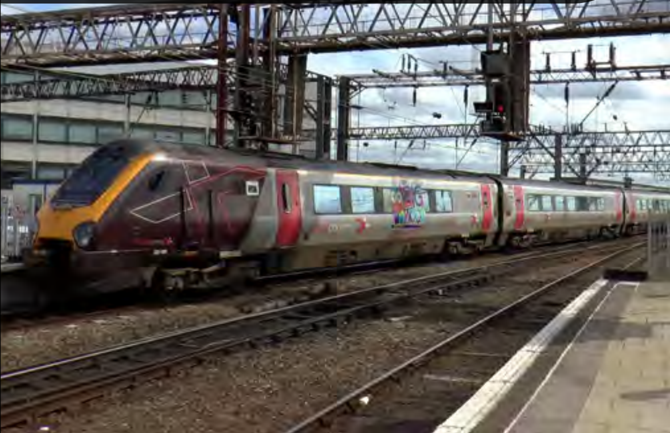
CrossCountry's Class 221 138 with 'The Big Hoot 2015' vinyls applied departs Manchester Piccadilly on an Exeter St. Davids service.