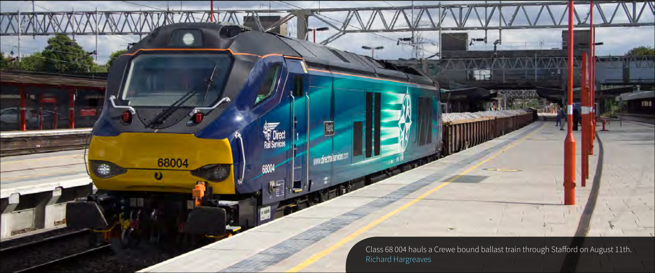
Class 68 004 hauls a Crewe bound ballast train through Stafford on August 11th.