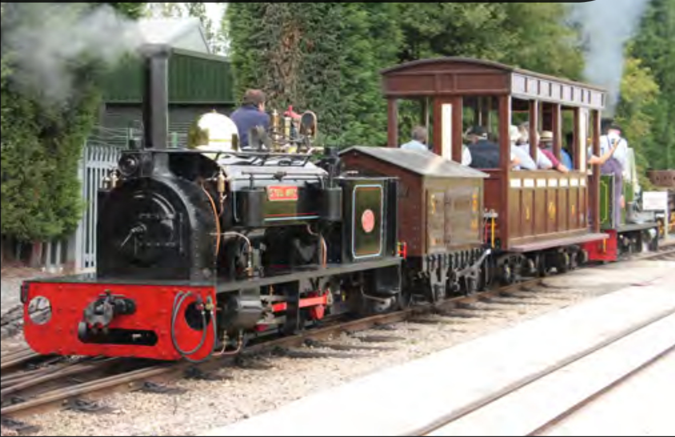
'SYBIL MARY' (Hunslet No. 921/1906) and 'Jack Lane' (Hunslet No. 3904 /2005) await the 'road' at Oak Tree Halt. Stuart Hillis