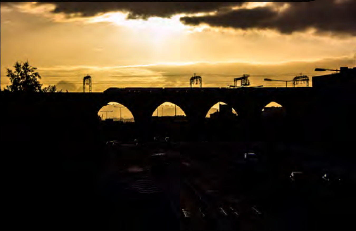
A Virgin Trains Class 390 arrives into Stockport on August 15th working the 1A06 06:35 Manchester Piccadilly to London Euston service.