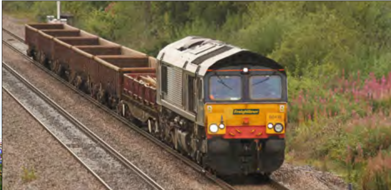
Below: With just load 6, Class 66 419 approaches North Staffs Junction with the 12:21 Crewe Basford Hall S.S.M. to Toton North Yard on August 19th. Derek Elston