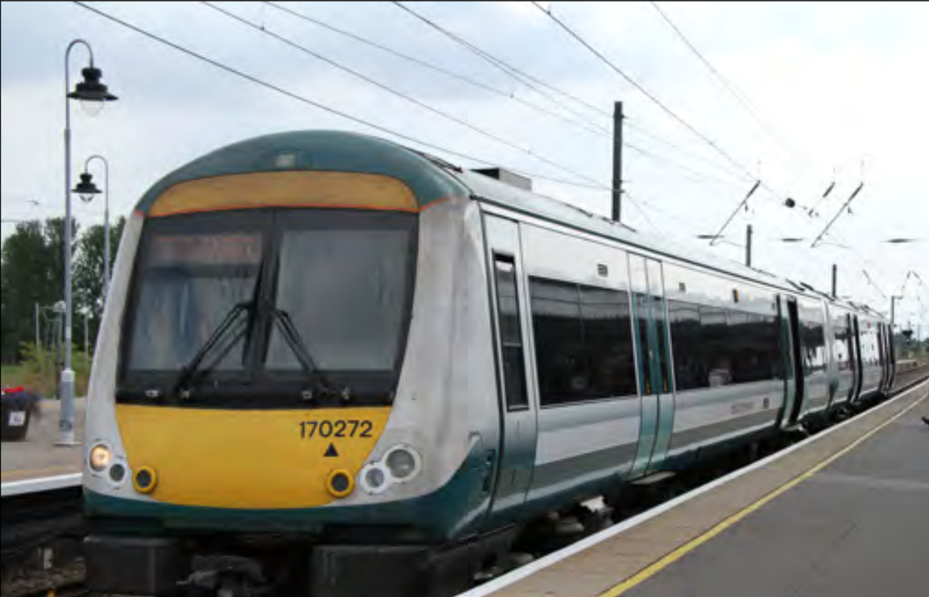
Abellio Greater Anglia's Class 170 272 stands at Ely working the 16:00 Ipswich to Peterborough service on August 7th. Derek Elston