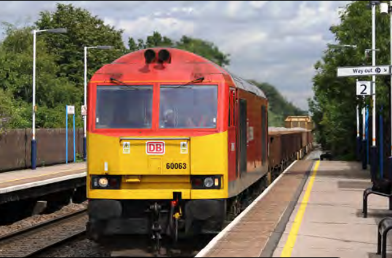
Class 60 063 heads the 14:05 Toton North Yard to Bescot Up Engineers Sidings through Willington on August 1st. Derek Elston