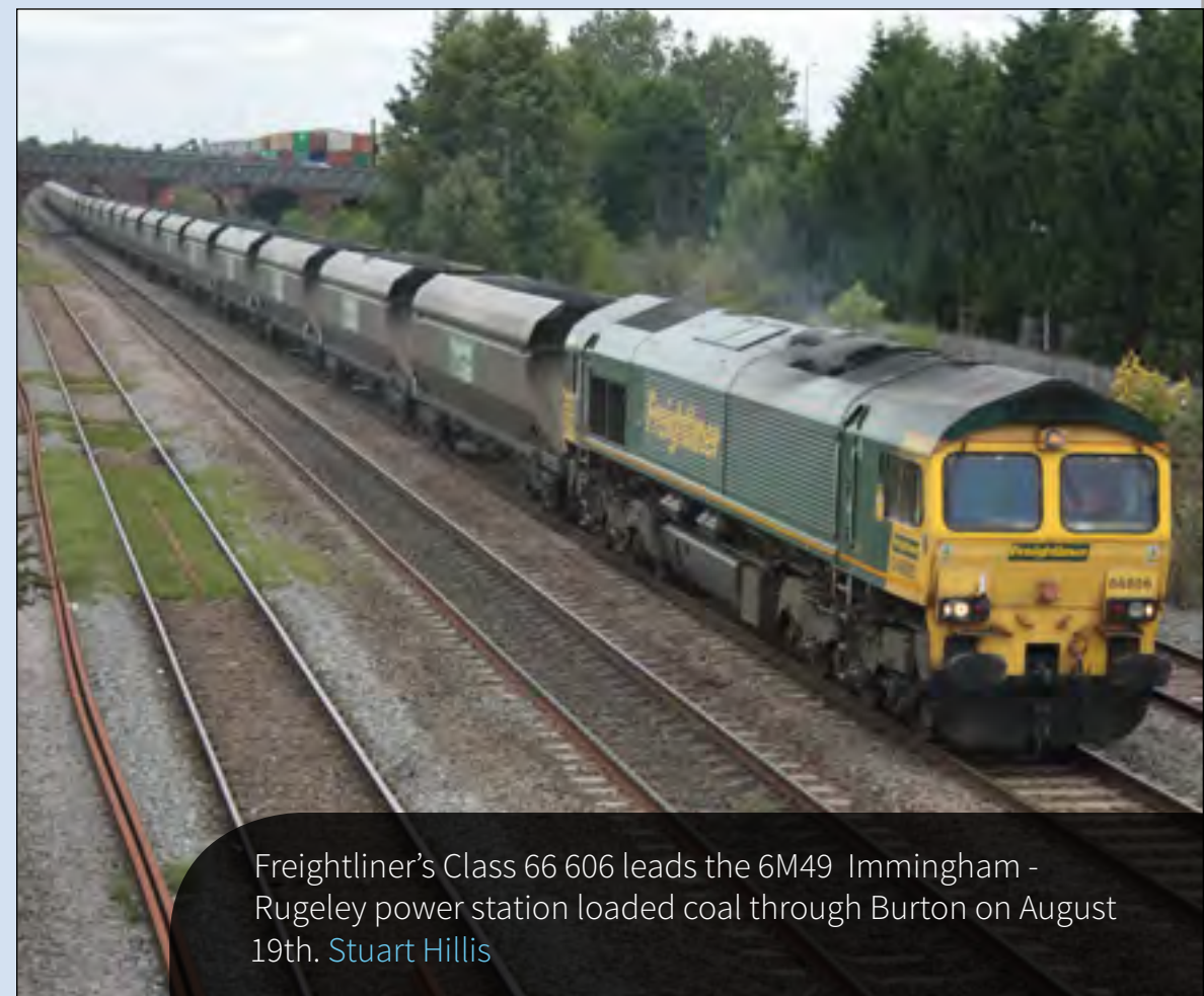
Freightliner's Class 66 606 leads the 6M49 Immingham - Rugeley power station loaded coal through Burton on August 19th.

www.southerncountiesrailwaysociety.co.uk