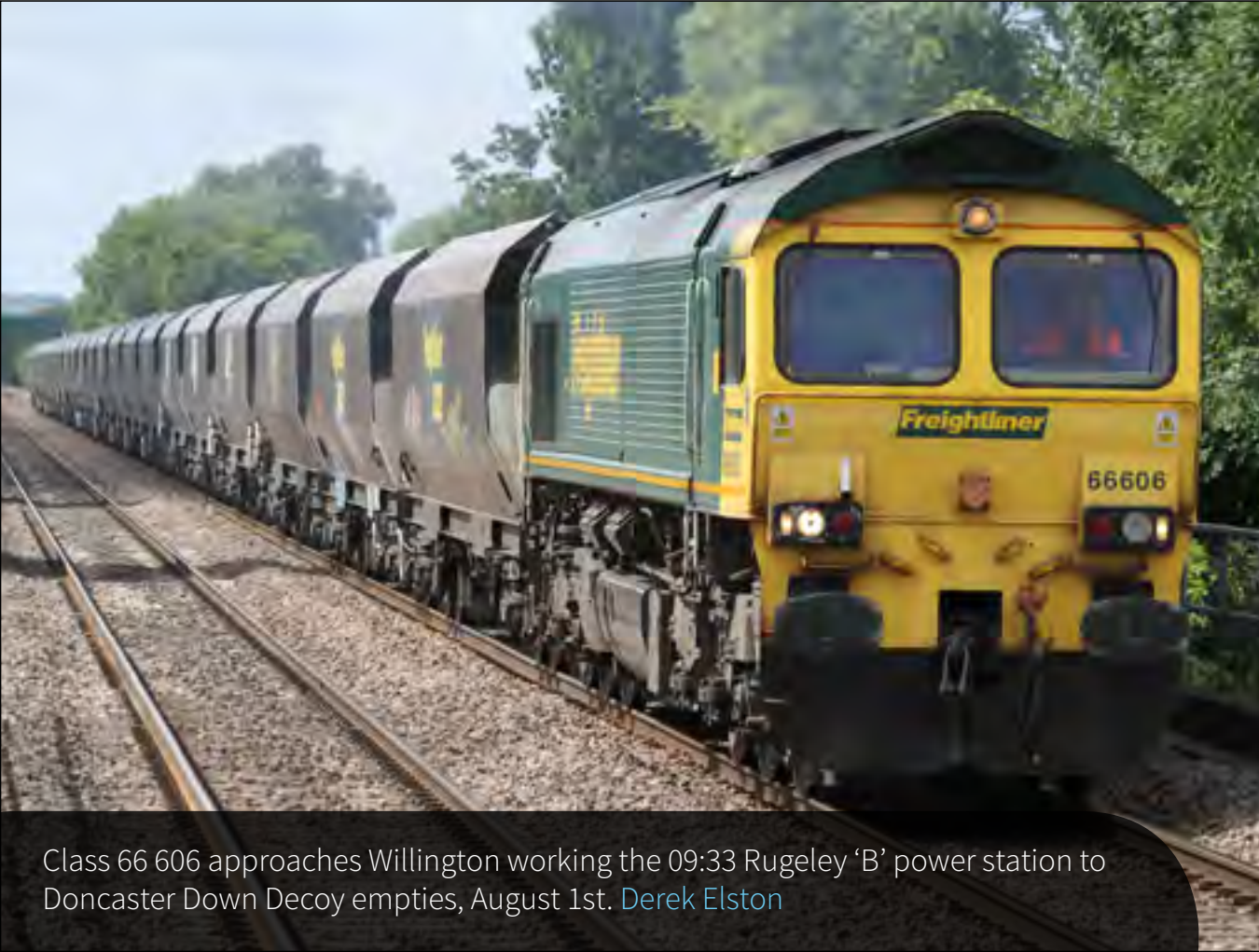
Class 66 606 approaches Willington working the 09:33 Rugeley 'B' power station to Doncaster Down Decoy empties, August 1st.