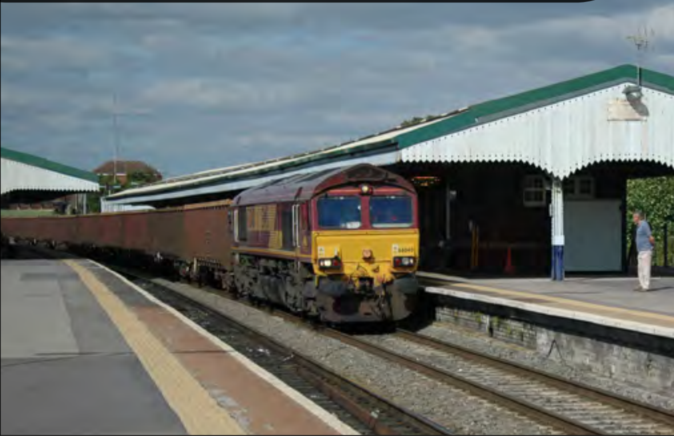
On August 6th, Class 66 200 departs Westbury after a quick crew change whilst working 6M20 from Whatley Quarry to Churchyard Tarmac Sidings.