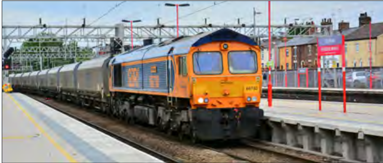
Below: Class 66 730 working a Liverpool Bulk Terminal to Ironbridge power station Biomass service passes through Stafford on August 18th. Geoff Barton