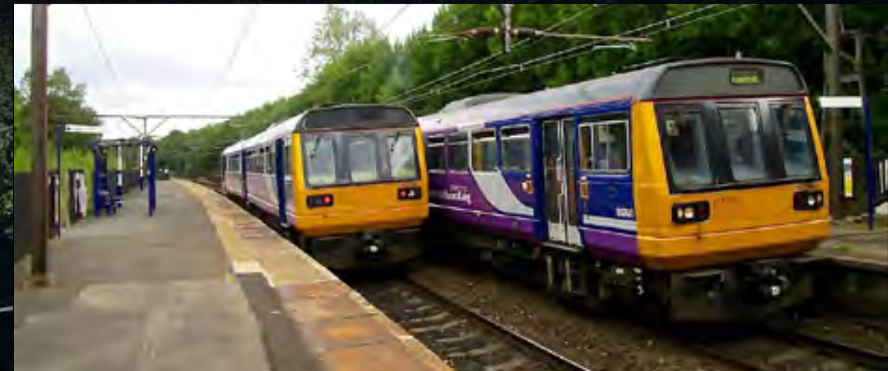
Below: Northern Rail Class 142 Pacer DMUs, both working services between Rose Hill/Marple and Manchester Piccadilly, pass at Fairfield station on August 17th.