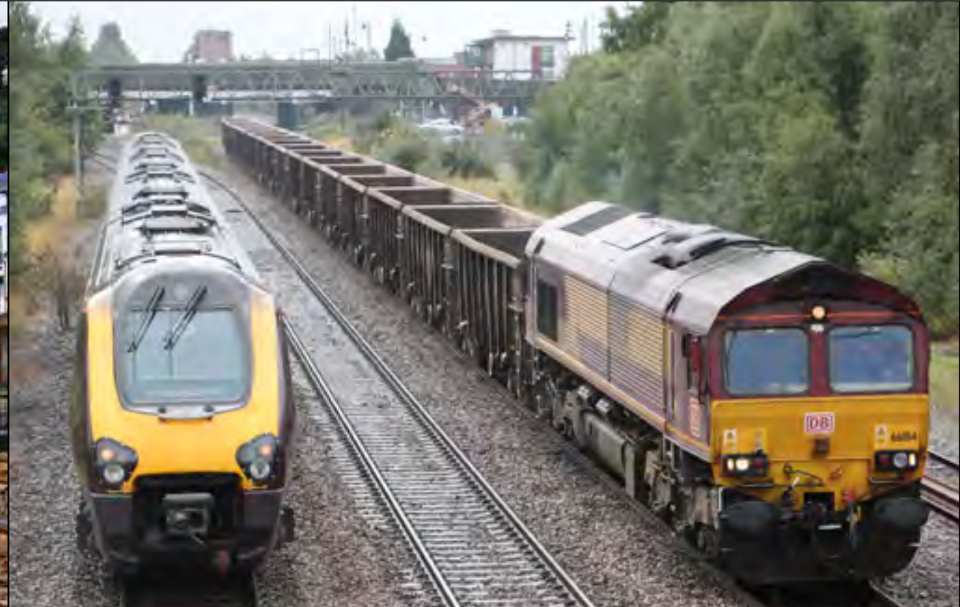
Class 66 184 with 6M82 Walsall - Briggs Siding empty box wagons at Burton on August 5th passes CrossCountry's Class 221 119. Stuart Hillis