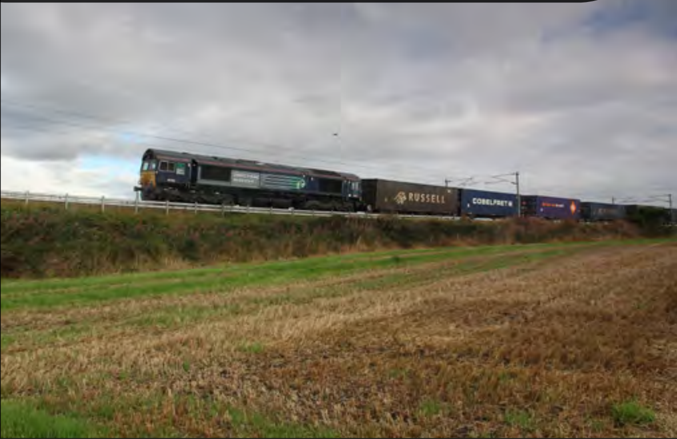
Class 66 303 leads the 4M34 Coatbridge to Daventry through Red Bank on September 2nd.