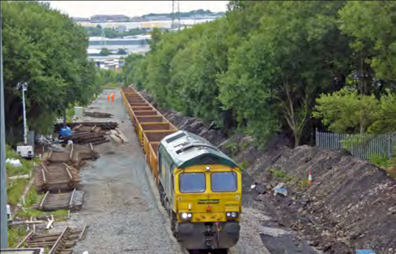
Class 66 956 approaches Goose House Lane, Darwen with a rake of empty wagons from Carlisle, taken on August 2nd during an engineers possession.