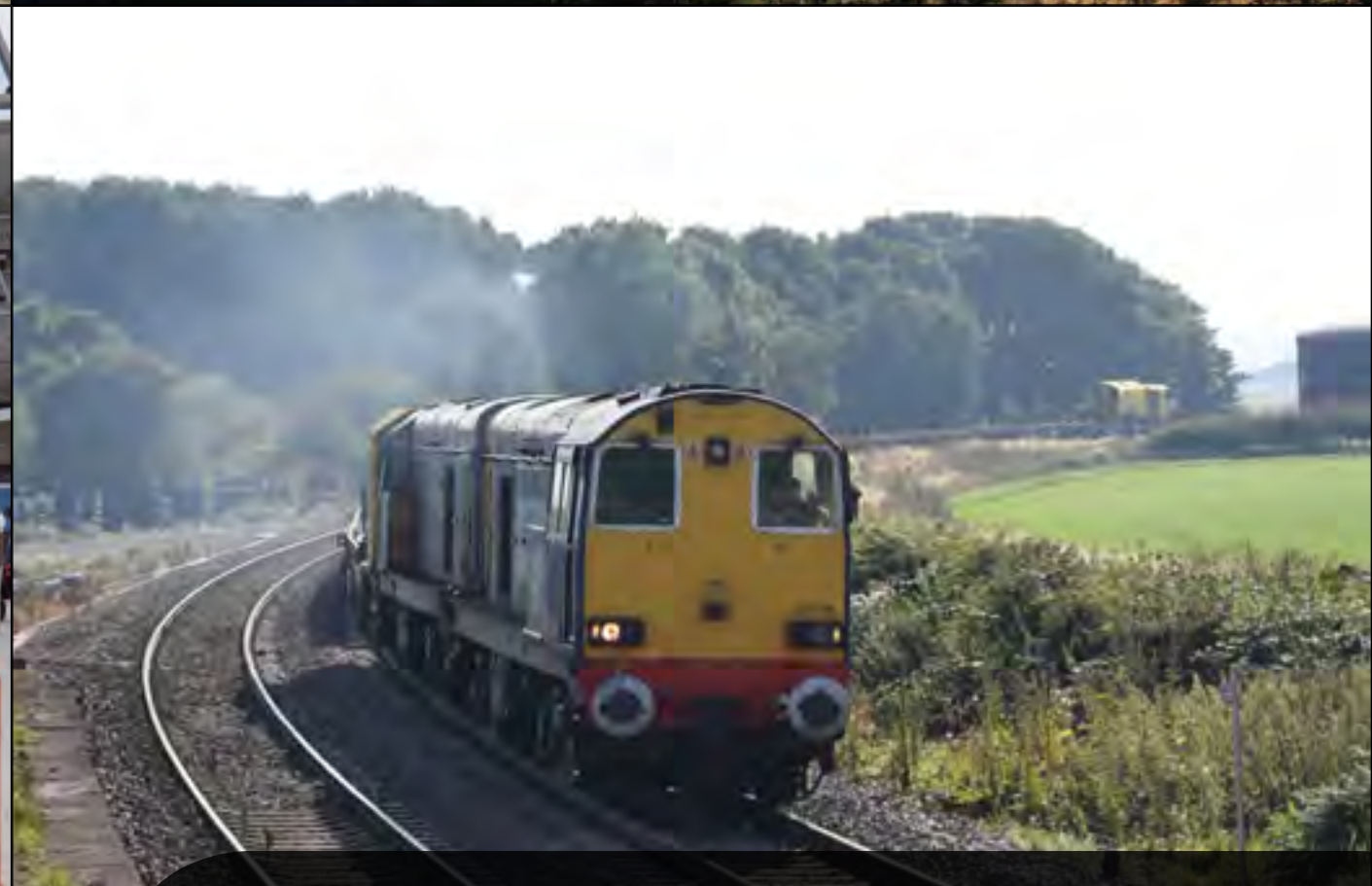
Class 20 308 and 20 305 had worked the 6A04 LWR train from Belmont to Ulceby the previous night in top'n'tail mode. Here they are, now double-headed, on the return empties to Belmont, passing Appleby on August 29th. Steve Thompson