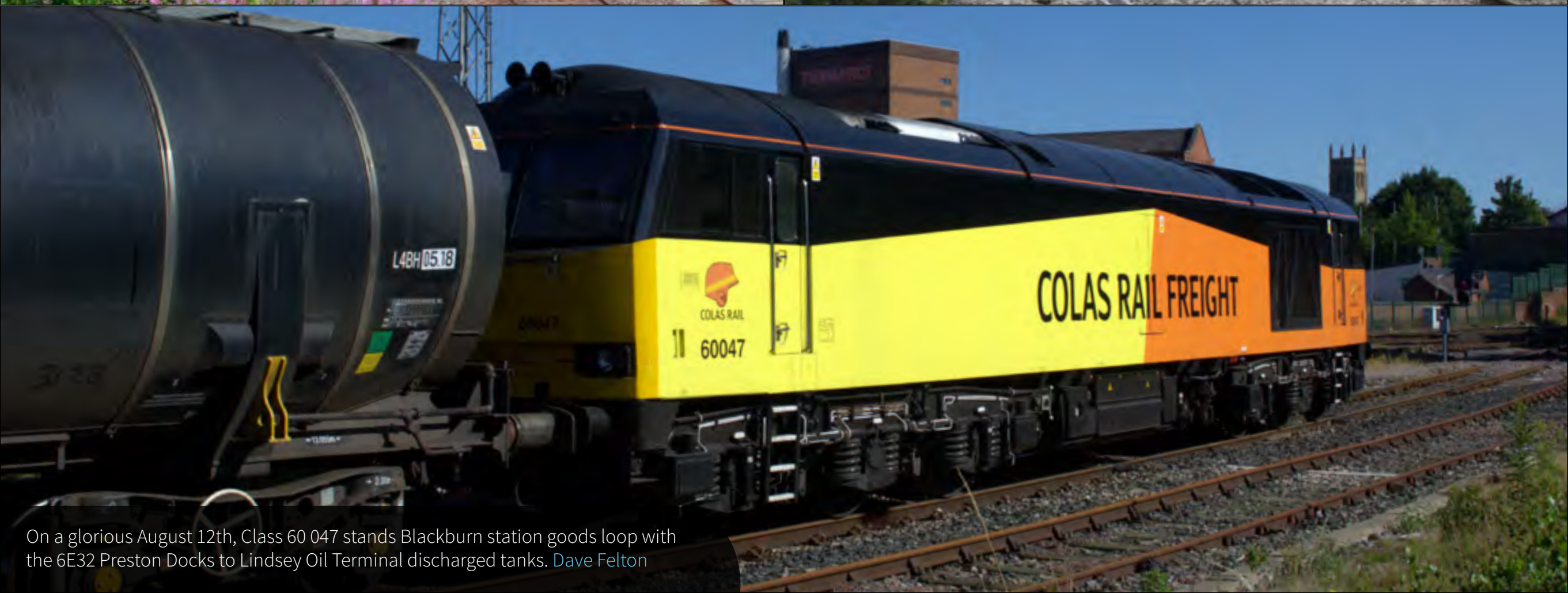
On a glorious August 12th, Class 60 047 stands Blackburn station goods loop with the 6E32 Preston Docks to Lindsey Oil Terminal discharged tanks. Dave Felton