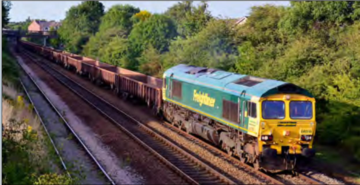
Below: Class 66 518 passes Kempsey Shrewsbury with the 6Y20 18:13 Crewe Basford Hall - Llantrisant engineers on August 8th.