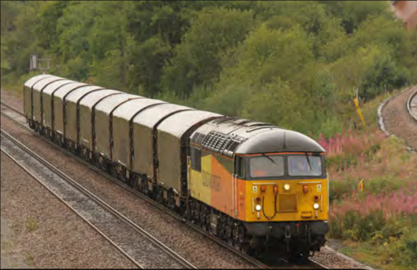
Class 56 078 is seen at a wet North Staffs Junction with the 14:50 Washwood Heath Met Cammell to Boston Docks on August 19th.