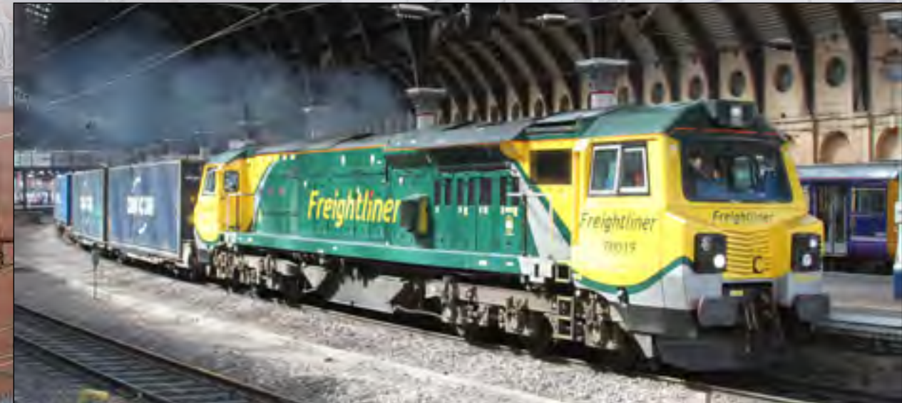
Below: On August 27th, Class 70 019 passes through York station working a Leeds to Tees container train.