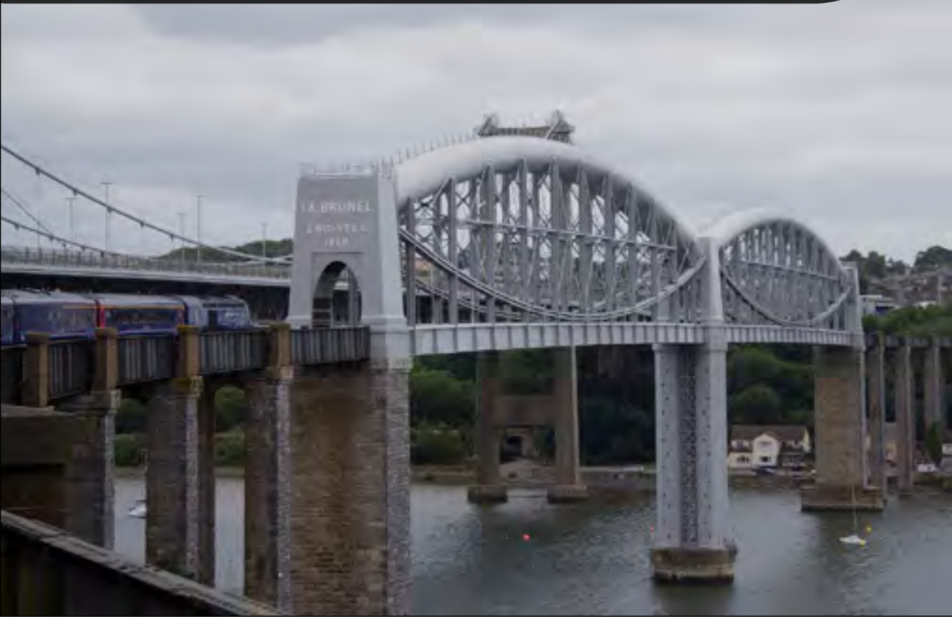
On July 27th, a First Great Western HST is seen crossing the Royal Albert Bridge at Saltash.