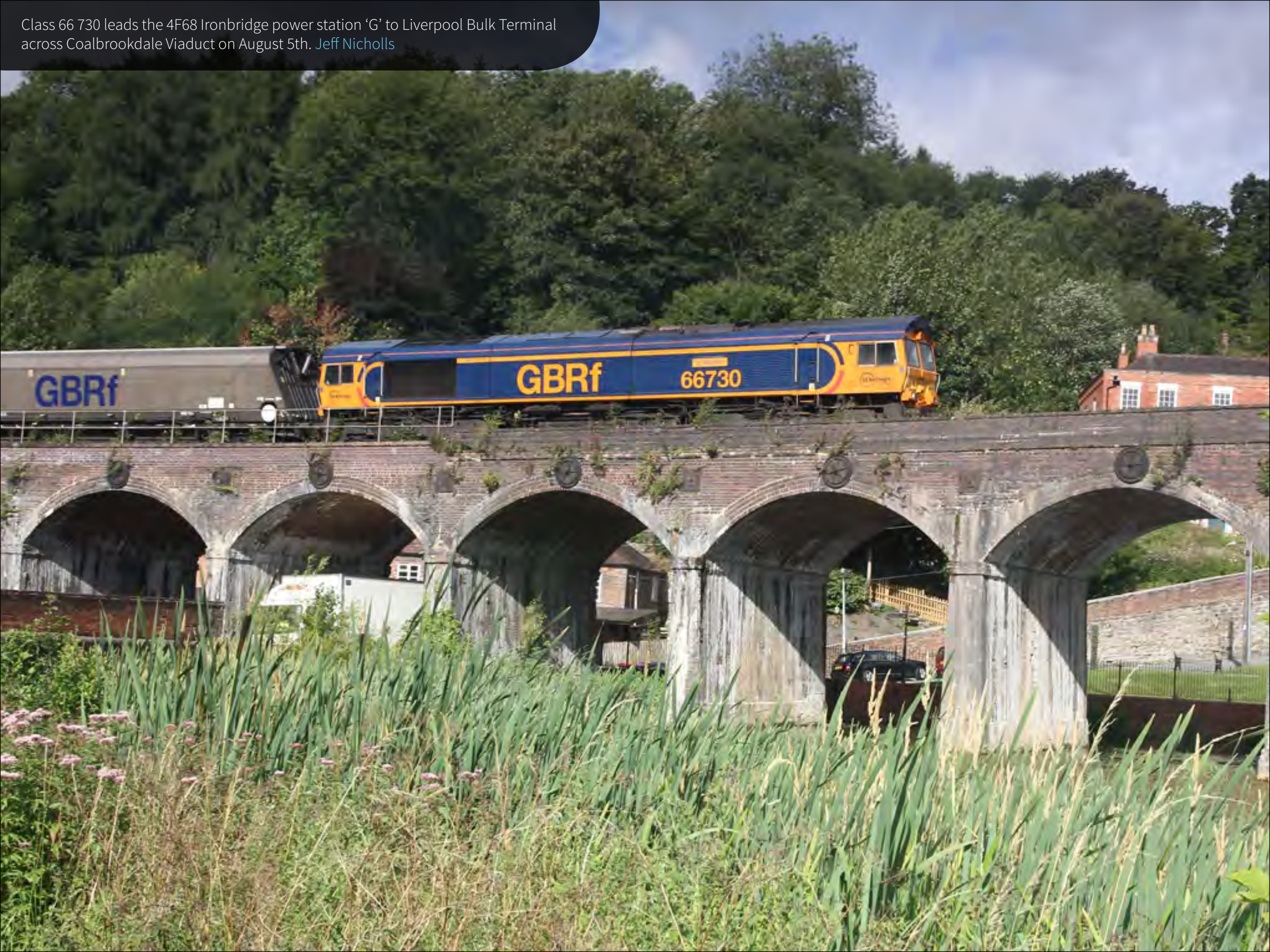
Class 66 730 leads the 4F68 Ironbridge power station 'G' to Liverpool Bulk Terminal across Coalbrookdale Viaduct on August 5th. Jeff Nicholls