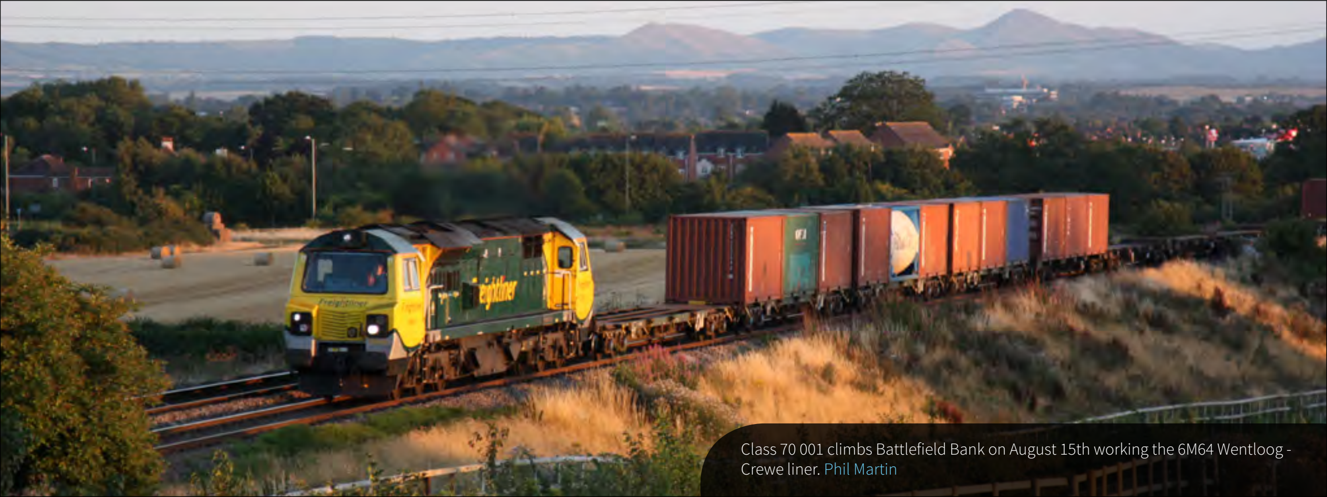
Class 70 001 climbs Battlefield Bank on August 15th working the 6M64 Wentloog - Crewe liner.