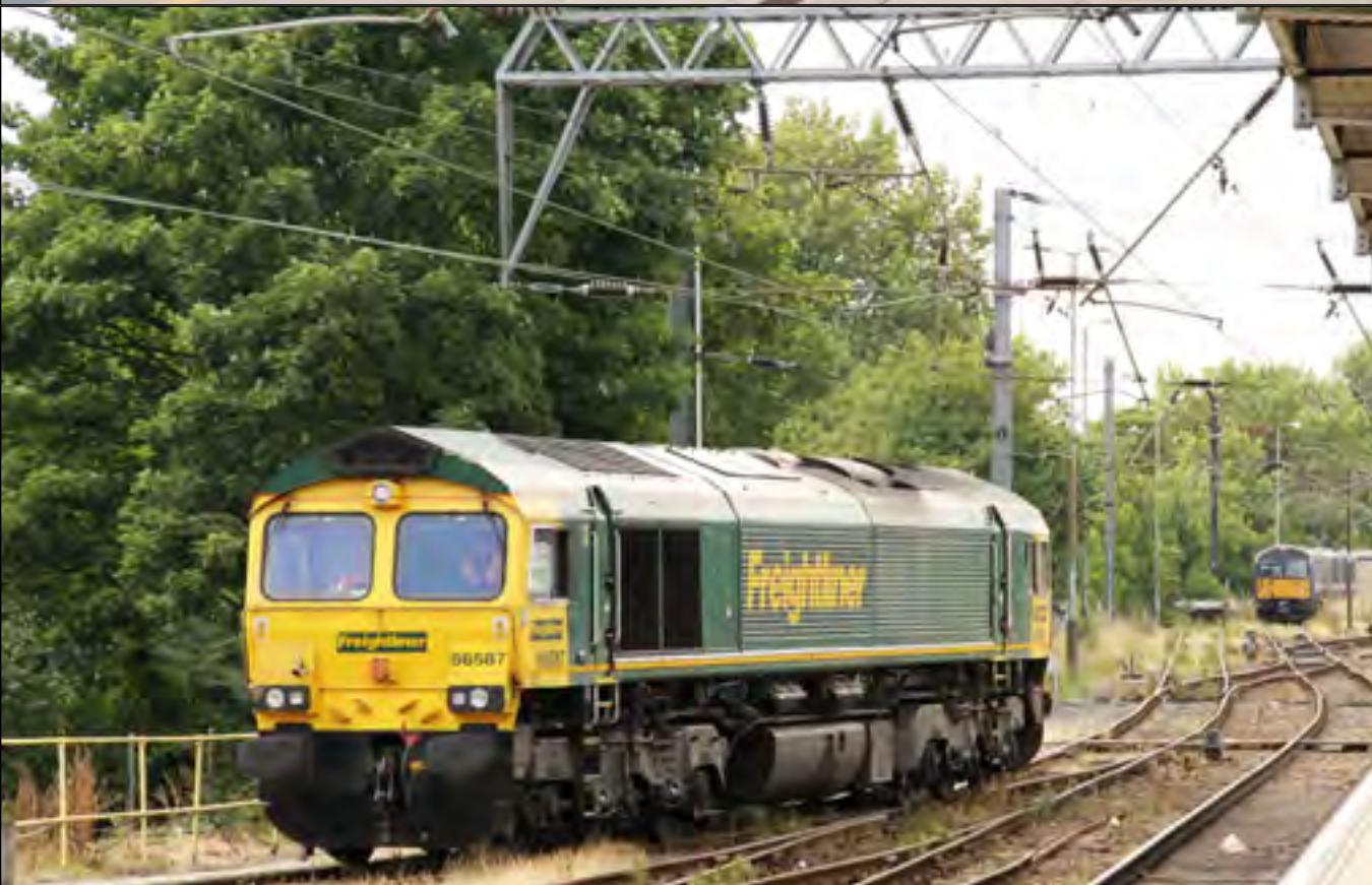
On August 7th, Class 66 587 is seen as it arrives onto Ipswich stabling point from Felixtowe.