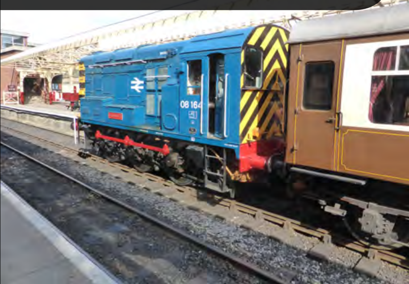
Class 08 164 is seen shunting stock at Bury on August 8th.