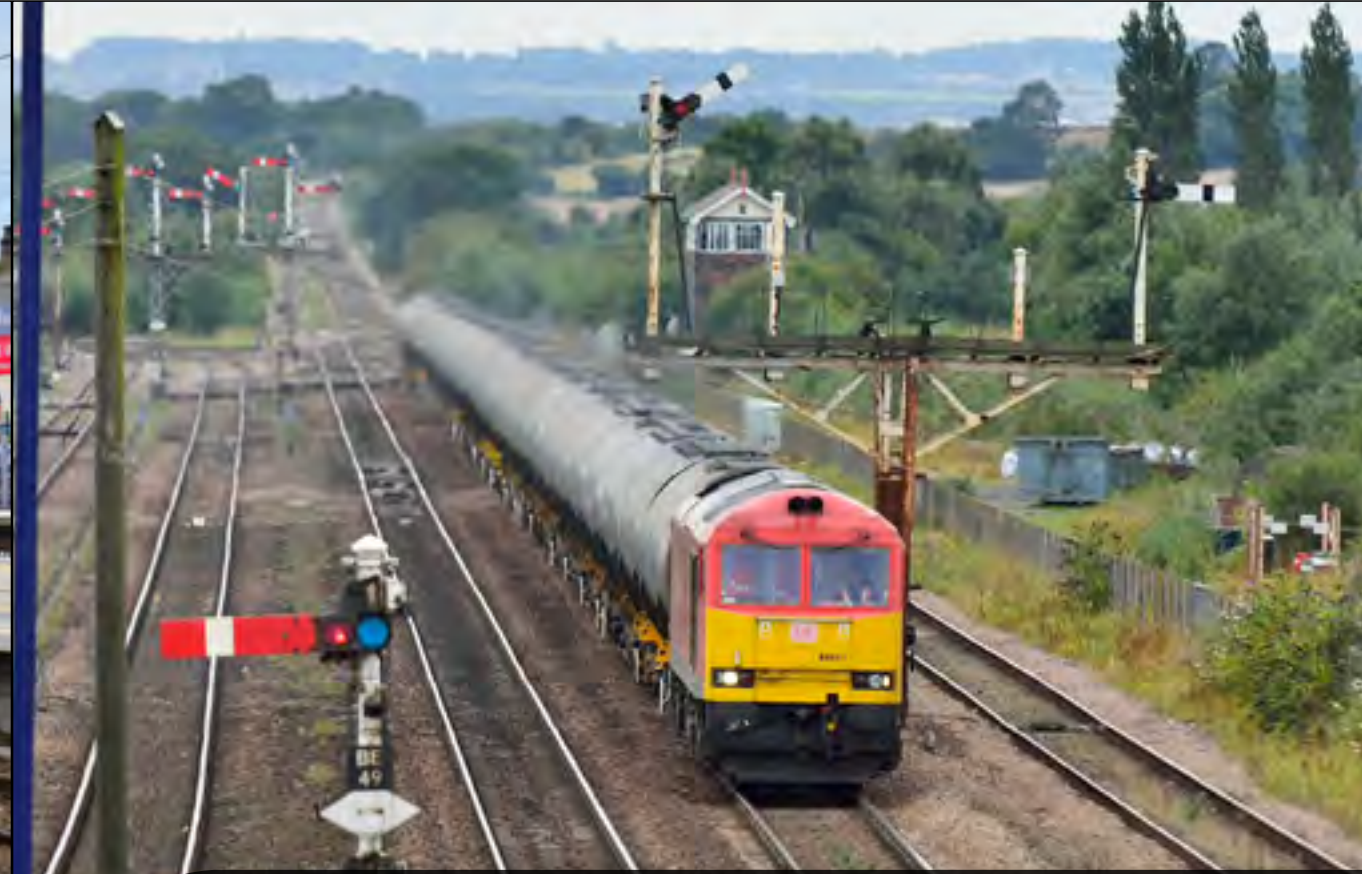
Class 60 017 works a Kingsbury to Humber oil train through Barnetby on August 29th. Class47