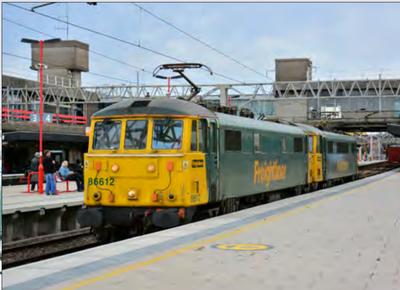
Left: On August 18th, Class 86 612 leads 86 614 through Stafford working a Tilbury to Crewe Basford Hall liner.