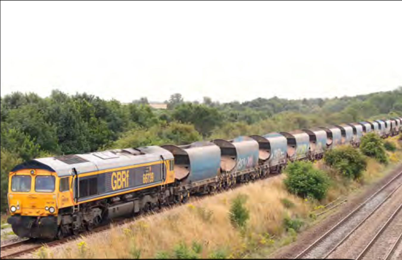
The 11:56 Angerstein Wharf to Bardon Hill is seen at Irchester behind Class 66 739 'Bluebell Railway' on August 6th.