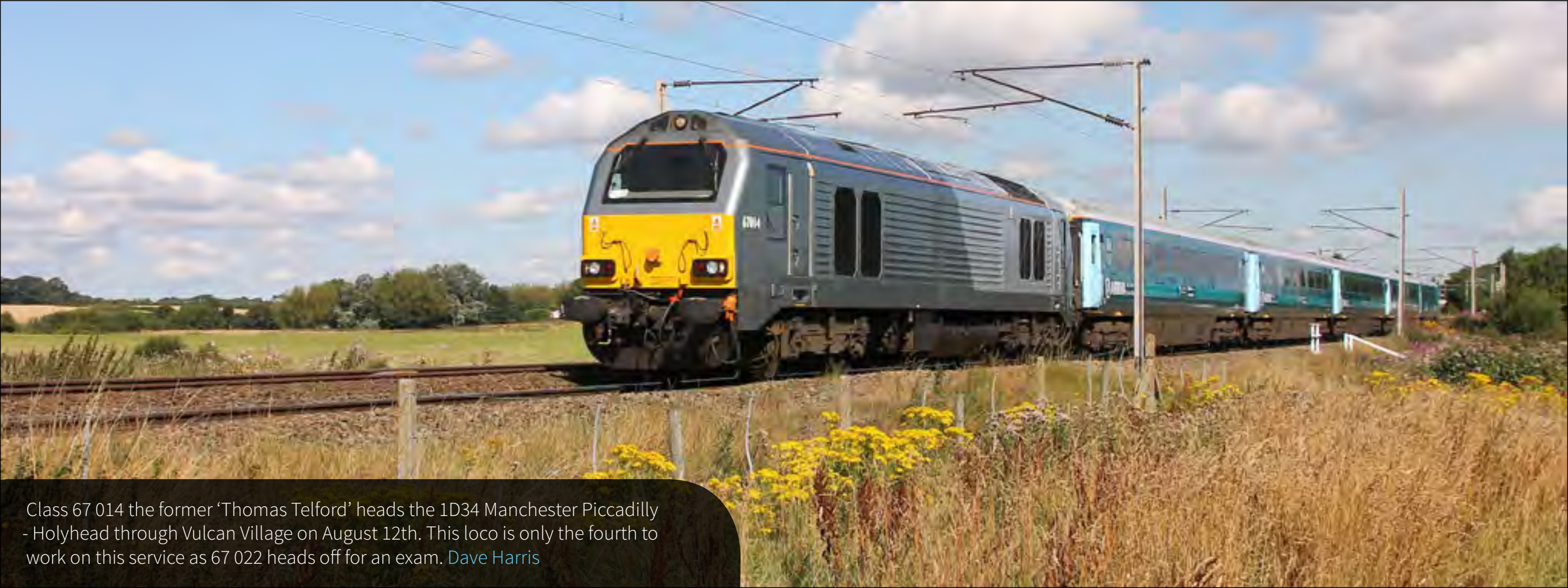
Class 67 014 the former 'Thomas Telford' heads the 1D34 Manchester Piccadilly - Holyhead through Vulcan Village on August 12th. This loco is only the fourth to work on this service as 67 022 heads off for an exam.