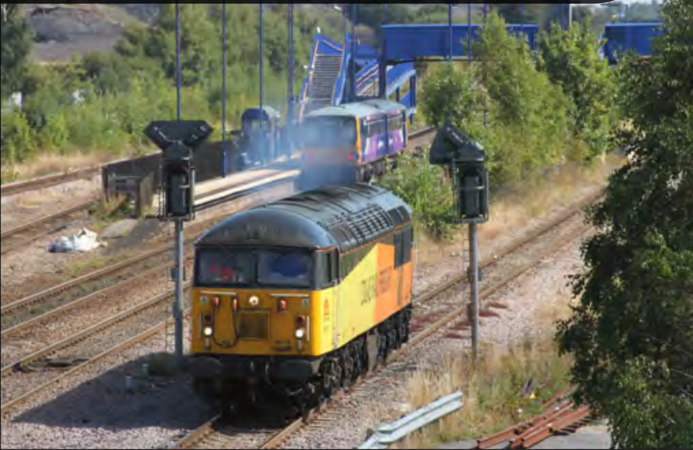
Class 56 113 starts away from Hatfield and Stainforth whilst on a crew training run around Yorkshire on August 19th.