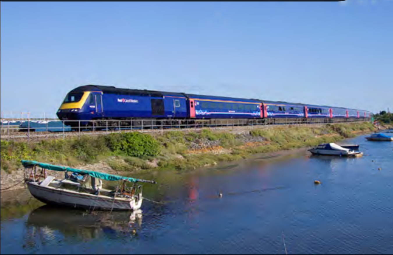
Power car No. 43130 leads a London Paddington bound service through Cockwood Harbour on July 30th. Richard Hargreaves