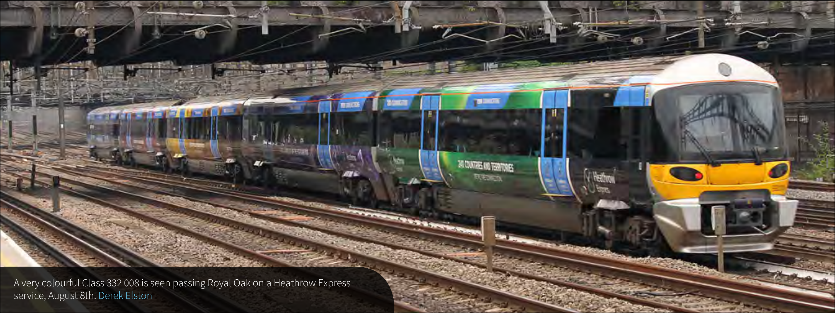
A very colourful Class 332 008 is seen passing Royal Oak on a Heathrow Express service, August 8th. Derek Elston