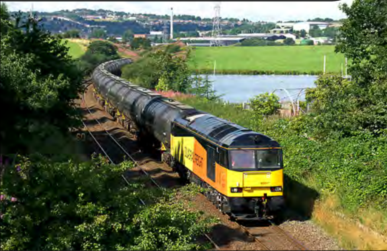
On August 24th, Class 60 047 passes the East Lancashire Sailing Club at Rishton hauling 6E32 Preston Docks to Lindsey Oil Terminal.