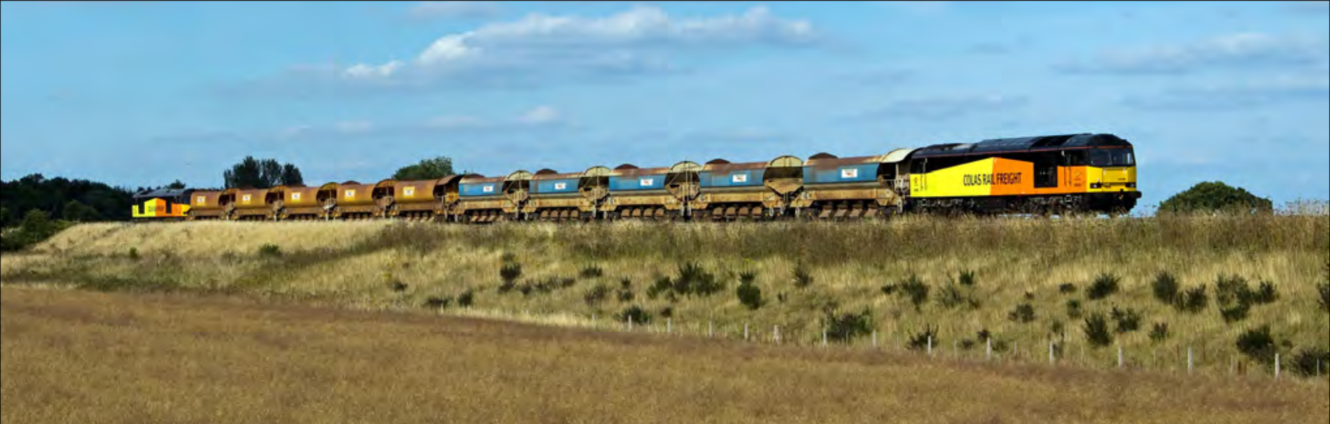
Class 60 096 top'n'tails 60 085 pass Battlefield working the 6C21 Crewe - Miskin ballast on August 8th. Carl Grocott