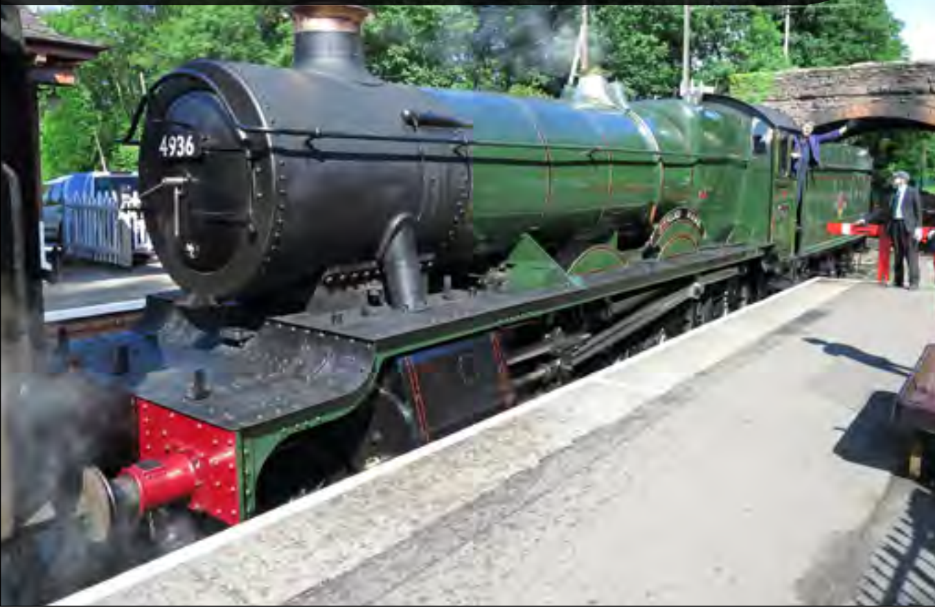
GWR 4-6-0 Hall Class No. 4936 'Kinlet Hall' is seen departing Bishops Lydeard on July 25th.