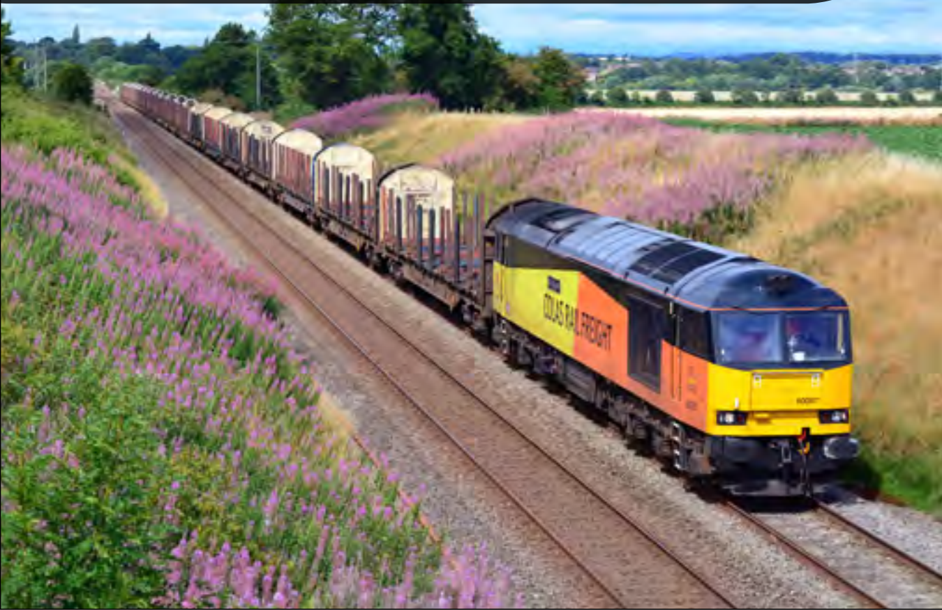
Class 60 087 'Clic Sergeant' is seen at Preston Boats on August 9th working an early running 6C37 10:30 Chirk Kronospan - Carlisle Yard.