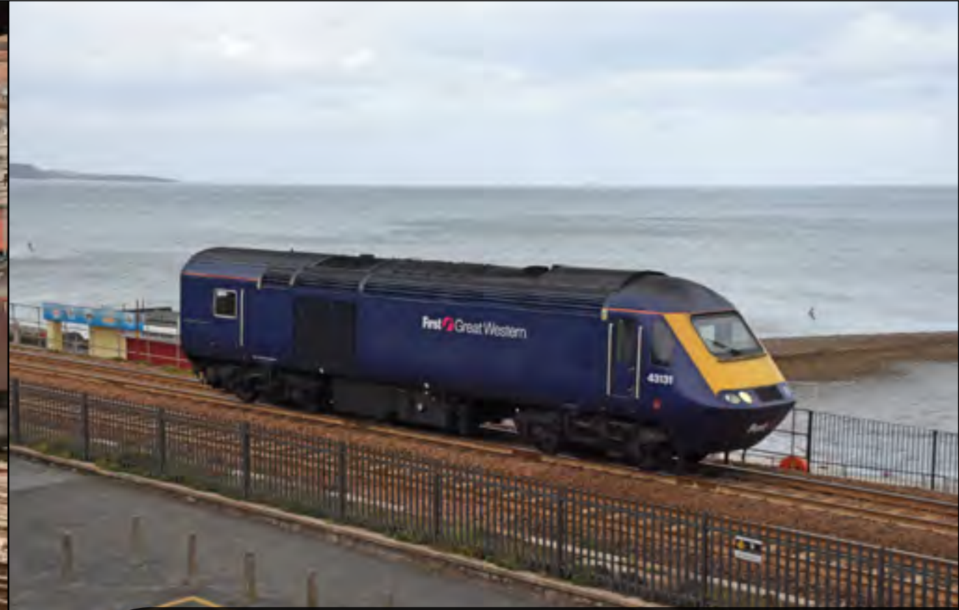
On July 27th, looking very odd on it's own, power car No. 43131 passes Dawlish as 0Z77 running all the way from Old Oak Common to Laira. Steve Thompson