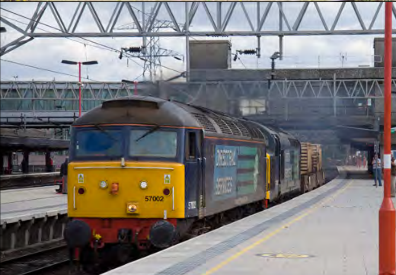
Class 57 002 and 37 259 head a Crewe bound flask working through Stafford on August 11th.