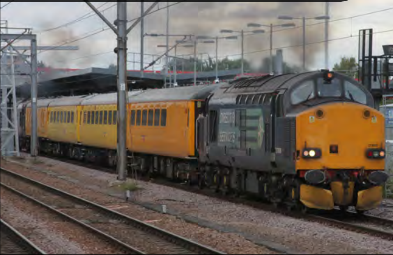
Class 37 608 departs from Cambridge with 37 605 at the rear on a Cambridge - Finsbury Park - Stratford - Cambridge test train on July 28th. Robert Bates