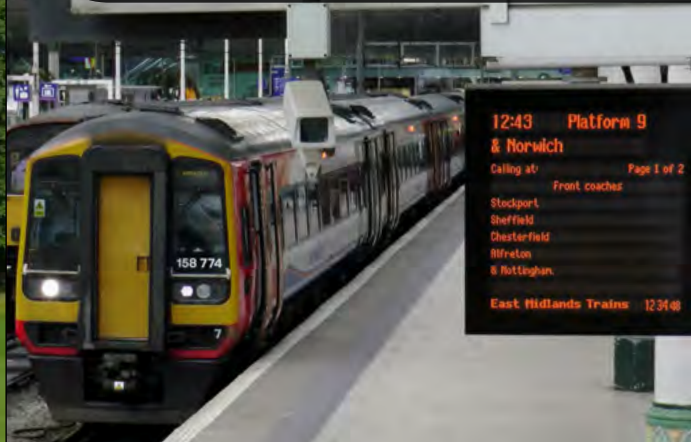
On August 25th, East Midlands Trains' Class 158 774 and 158 812 are seen at Manchester Piccadilly, working a Norwich service.