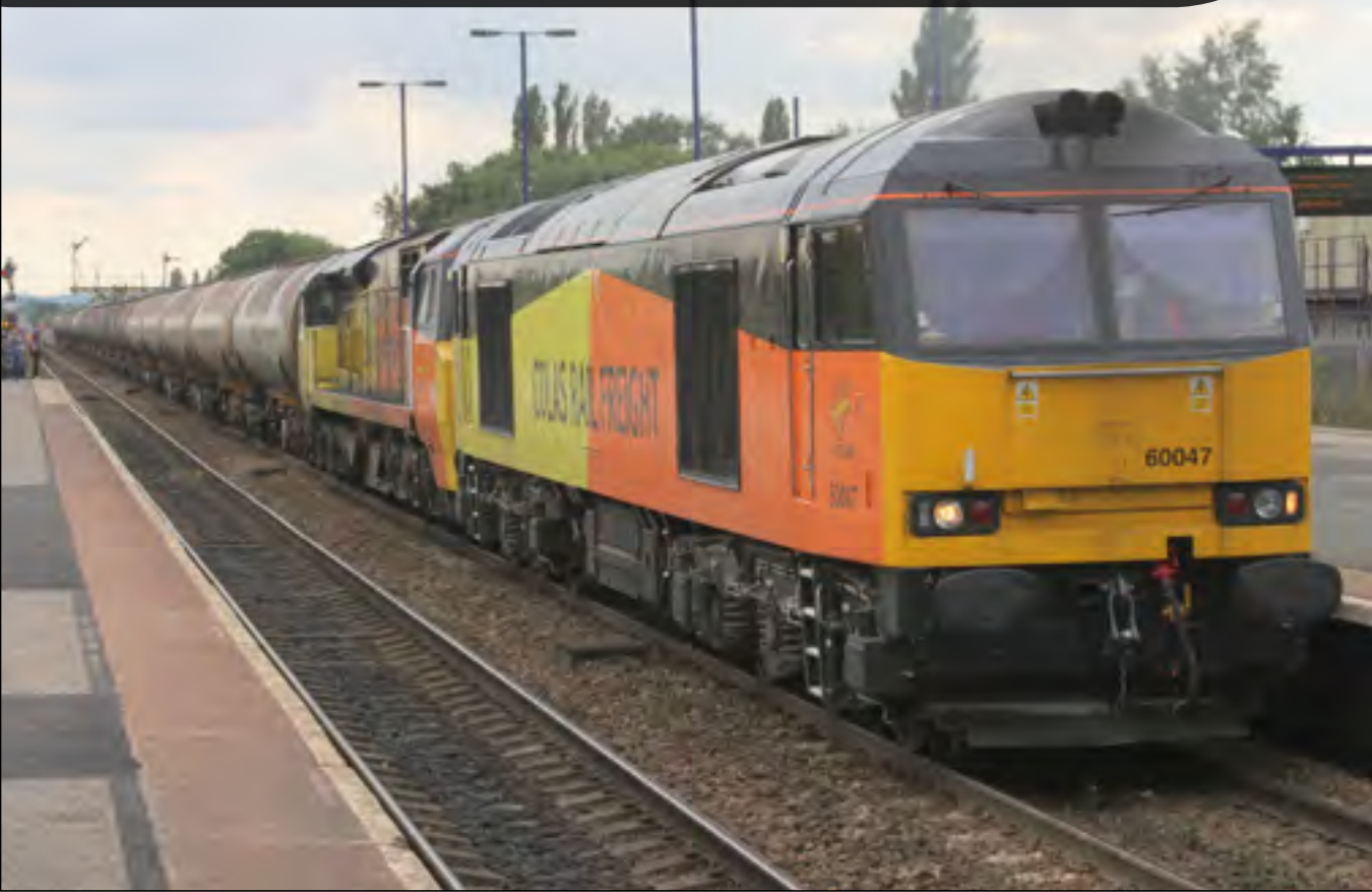
Class 60 047 leads 70 808 with a Rectory to Lindsey tank train through Barnetby station on August 20th.