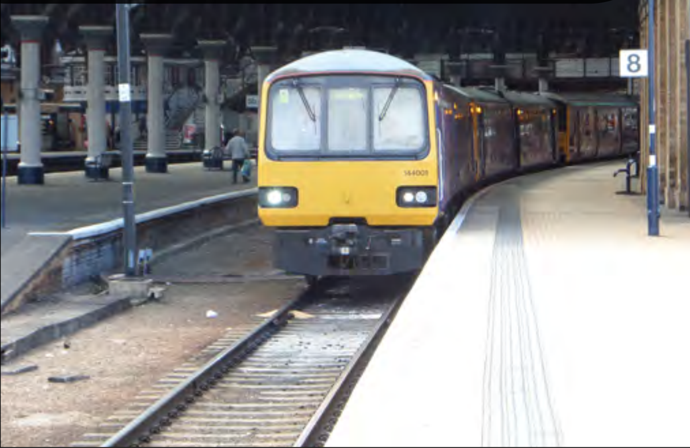
Northern's Class 144 001 and 144 011 are seen ready to depart York station working a service to Harrogate on September 2nd. Eddie Emmott