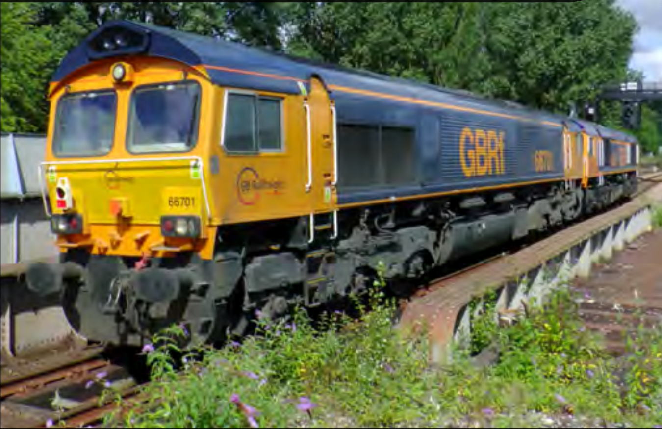
On August 15th, Class 66 701 and 66 772 head through Stalybridge working a Trafford Park to Doncaster light engine move.