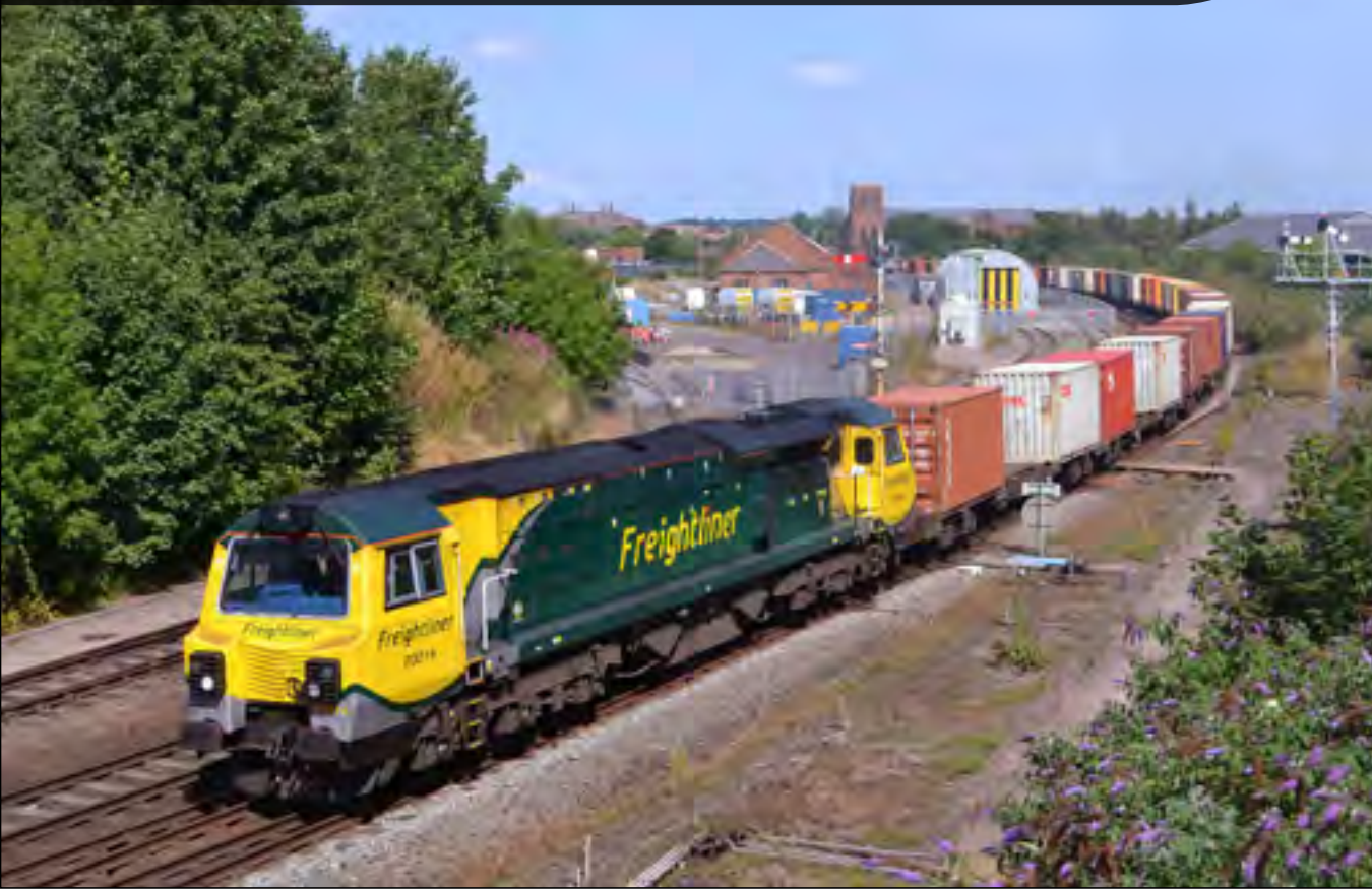
Class 70 016 is seen at Sutton Bridge on August 8th working the 4V64 11:08 Crewe Basford Hall - Wentloog intermodal.