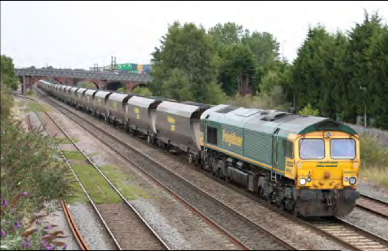
On what is believed to be the first working for a few months, Class 66 614 heads the 6M49 Immingham - Rugeley past Burton on August 5th.