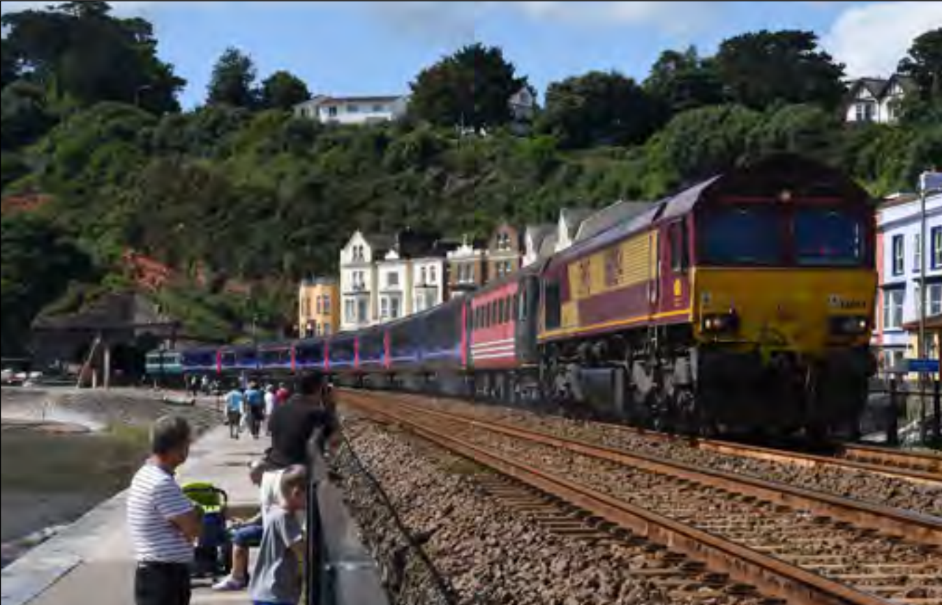
On July 25th, Class 66 054 passes through Dawlish working the 5Z44 Laira - Kilmarnock HST stock move.