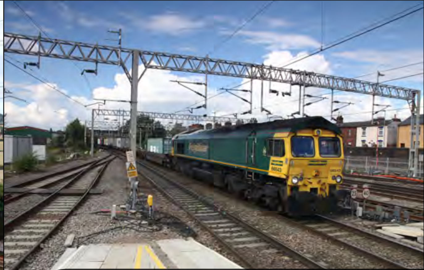
Class 66 543 working the 4L90 Crewe Basford Hall - Felixstowe North passes through Stafford on September 1st. Jeff Nicholls