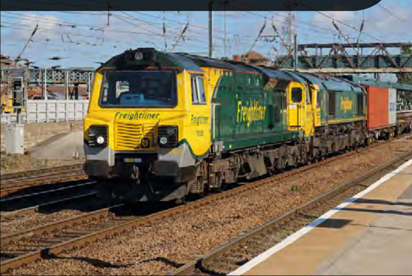
Class 70 008 leads 66 590 through Doncaster on August 15th working a Leeds to Ipswich liner. Class47