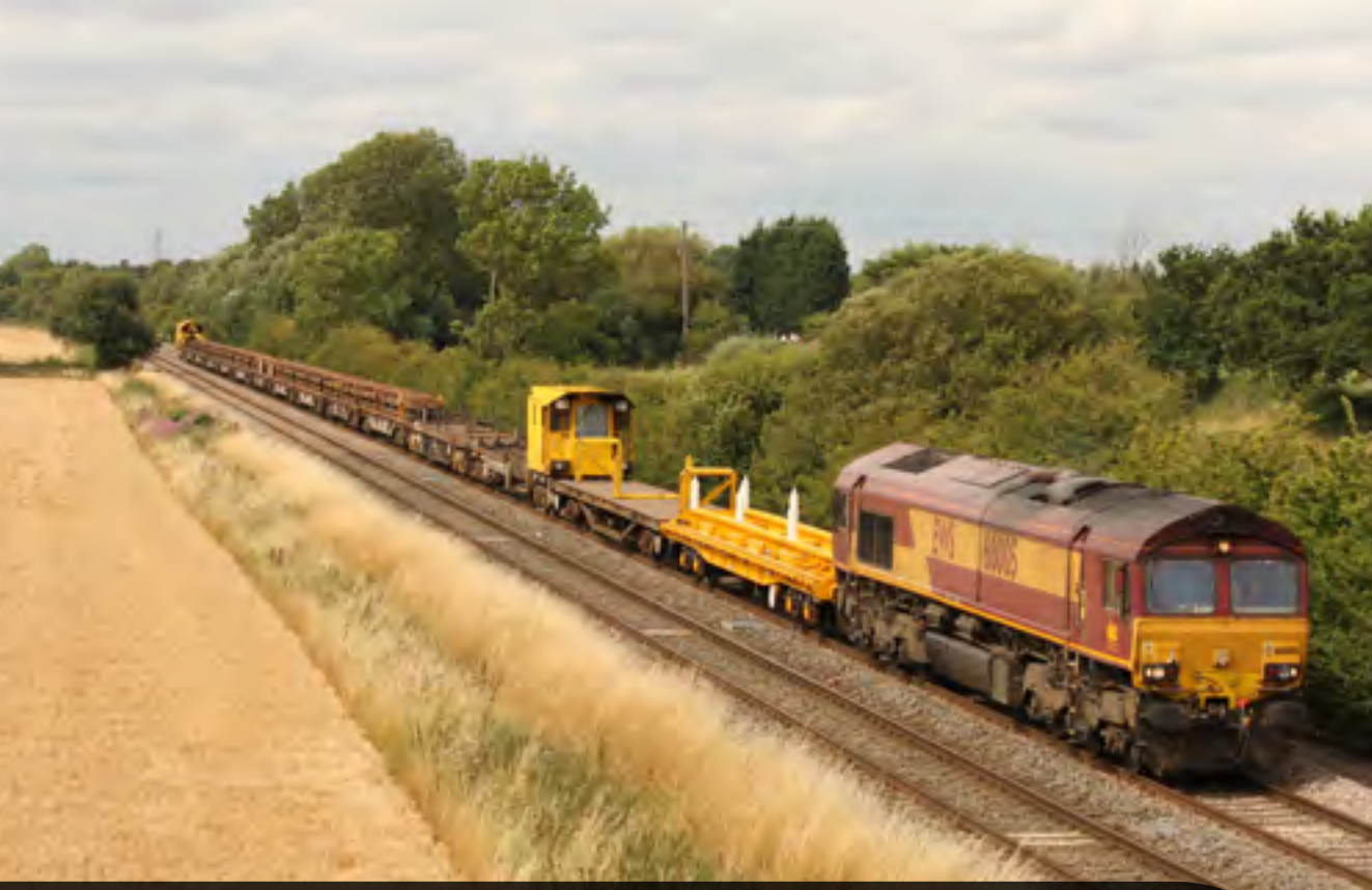
Class 66 005 is seen in charge of the 11:09 Bescot Engineers sidings to Toton North Yard at Barrow on Trent on August 19th.