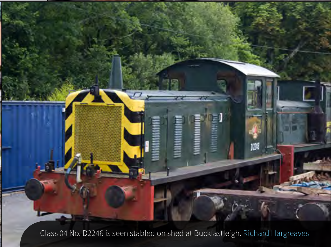
Class 04 No. D2246 is seen stabled on shed at Buckfastleigh. Richard Hargreaves