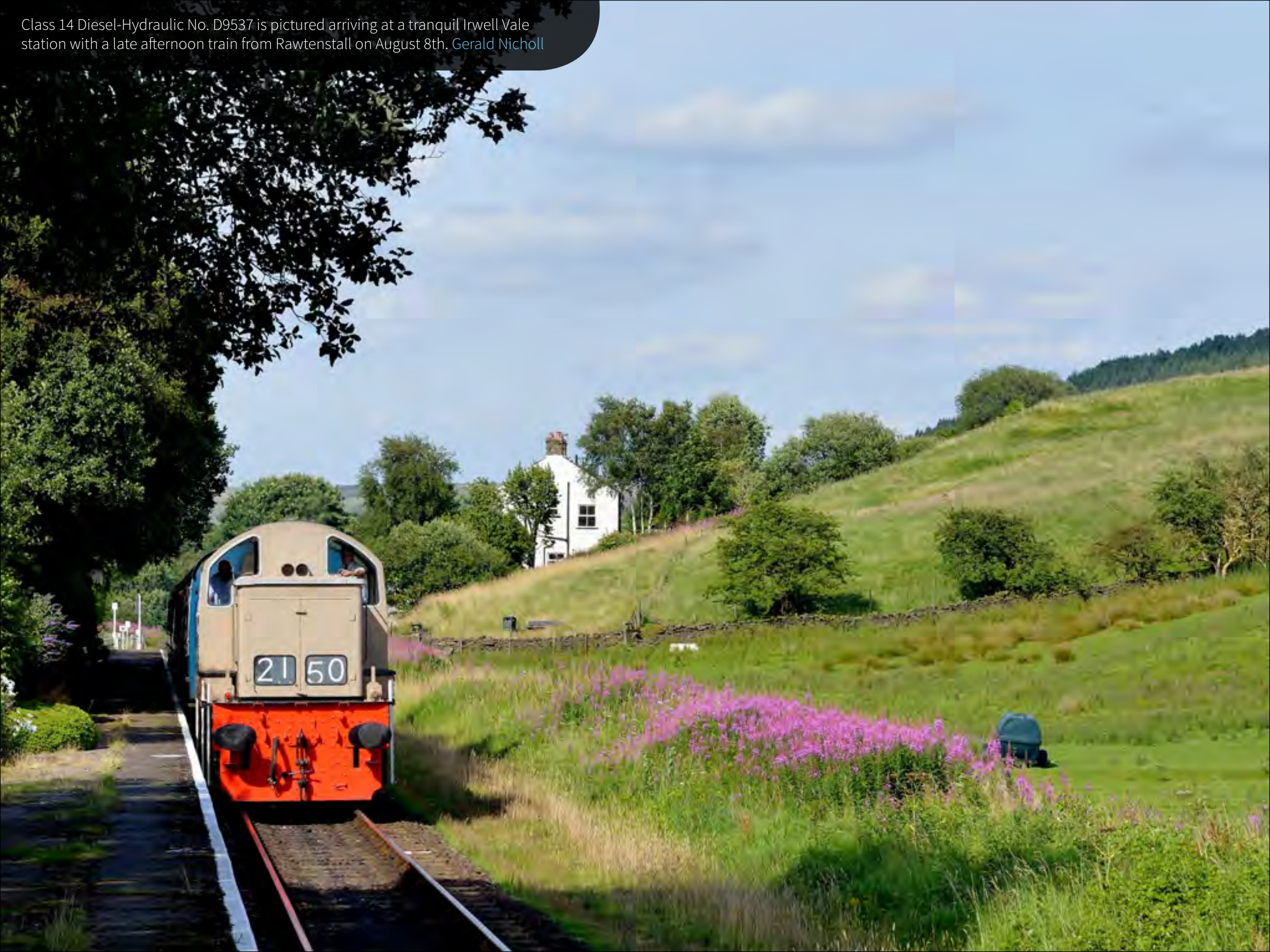
Class 14 Diesel-Hydraulic No. D9537 is pictured arriving at a tranquil Irwell Vale station with a late afternoon train from Rawtenstall on August 8th. Gerald Nicholl