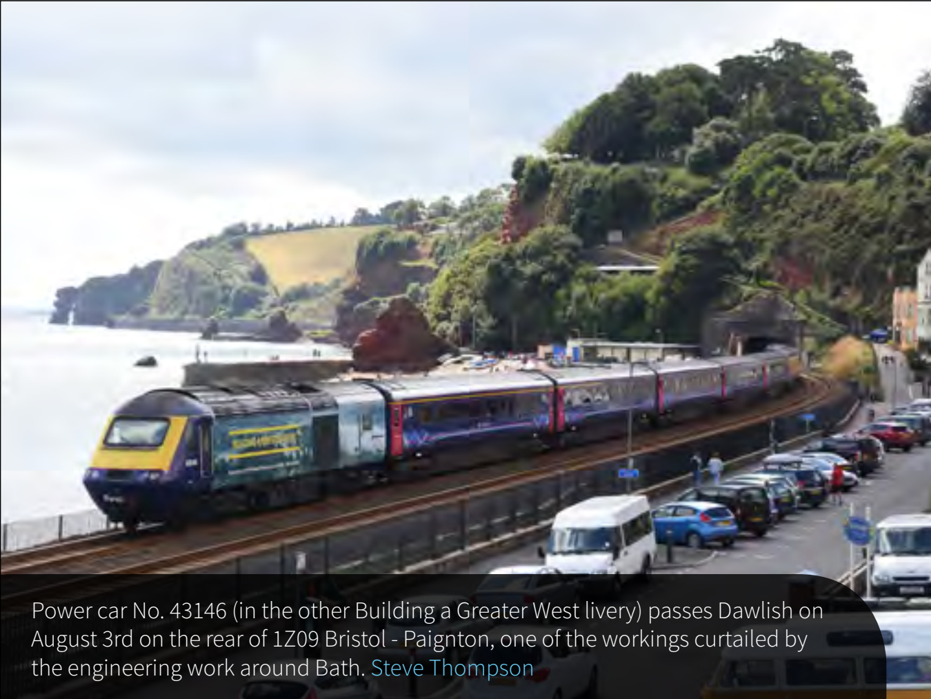
Power car No. 43146 (in the other Building a Greater West livery) passes Dawlish on August 3rd on the rear of 1Z09 Bristol - Paignton, one of the workings curtailed by the engineering work around Bath.