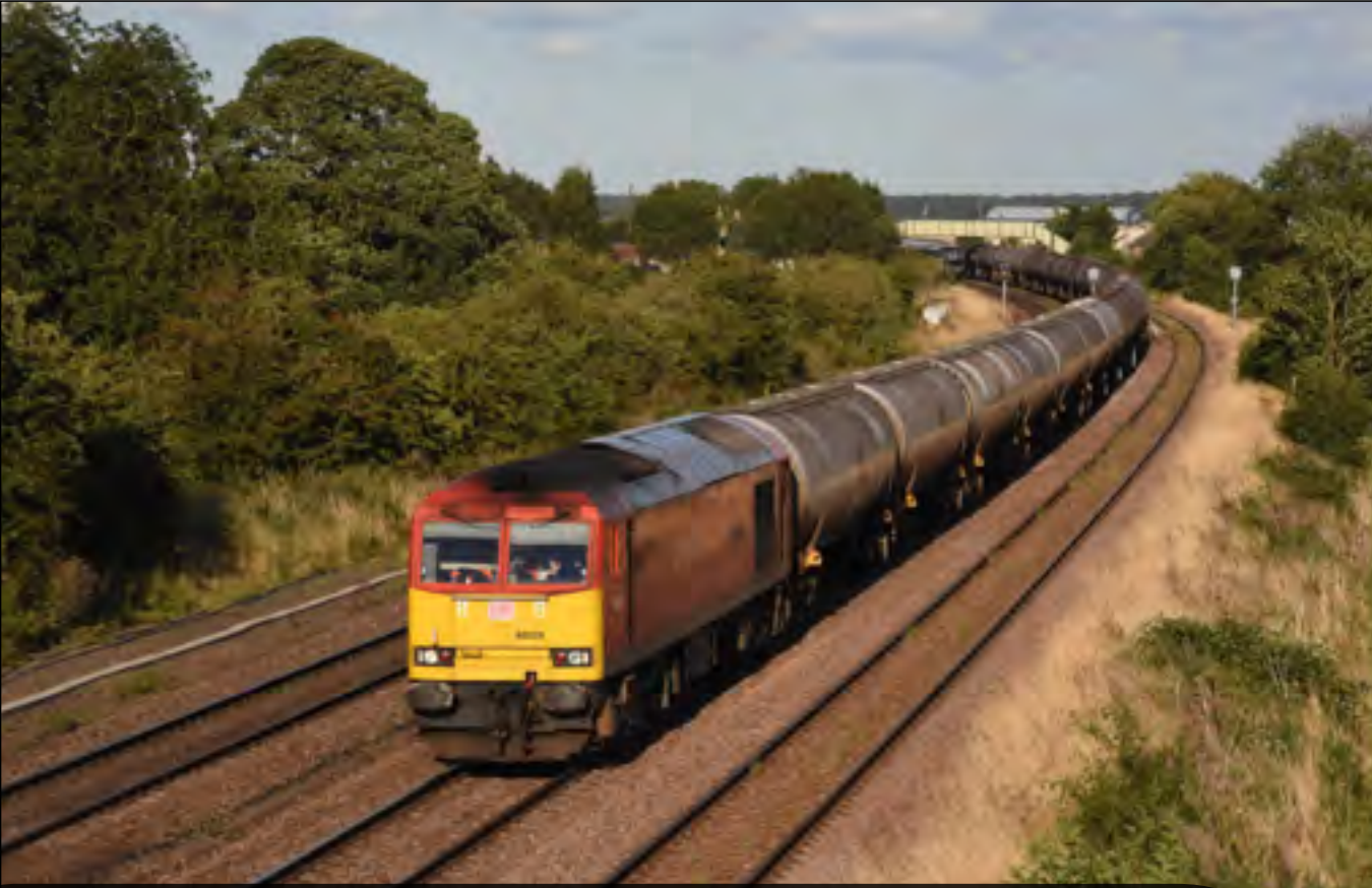
On August 27th, Class 60 059 forges west working the 6M24 Lindsey Oil Refinery - Kingsbury with 32 TEAs in tow.