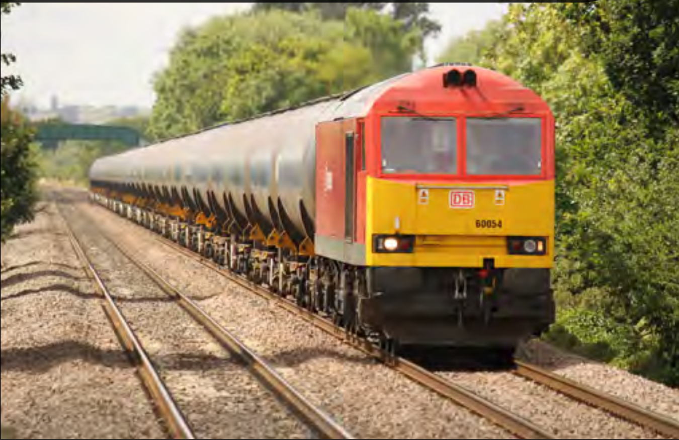
Class 60 054 is seen working the 10:40 Kingsbury oil sidings to Humber empty tanks as it approaches Willington on August 1st. Derek Elston