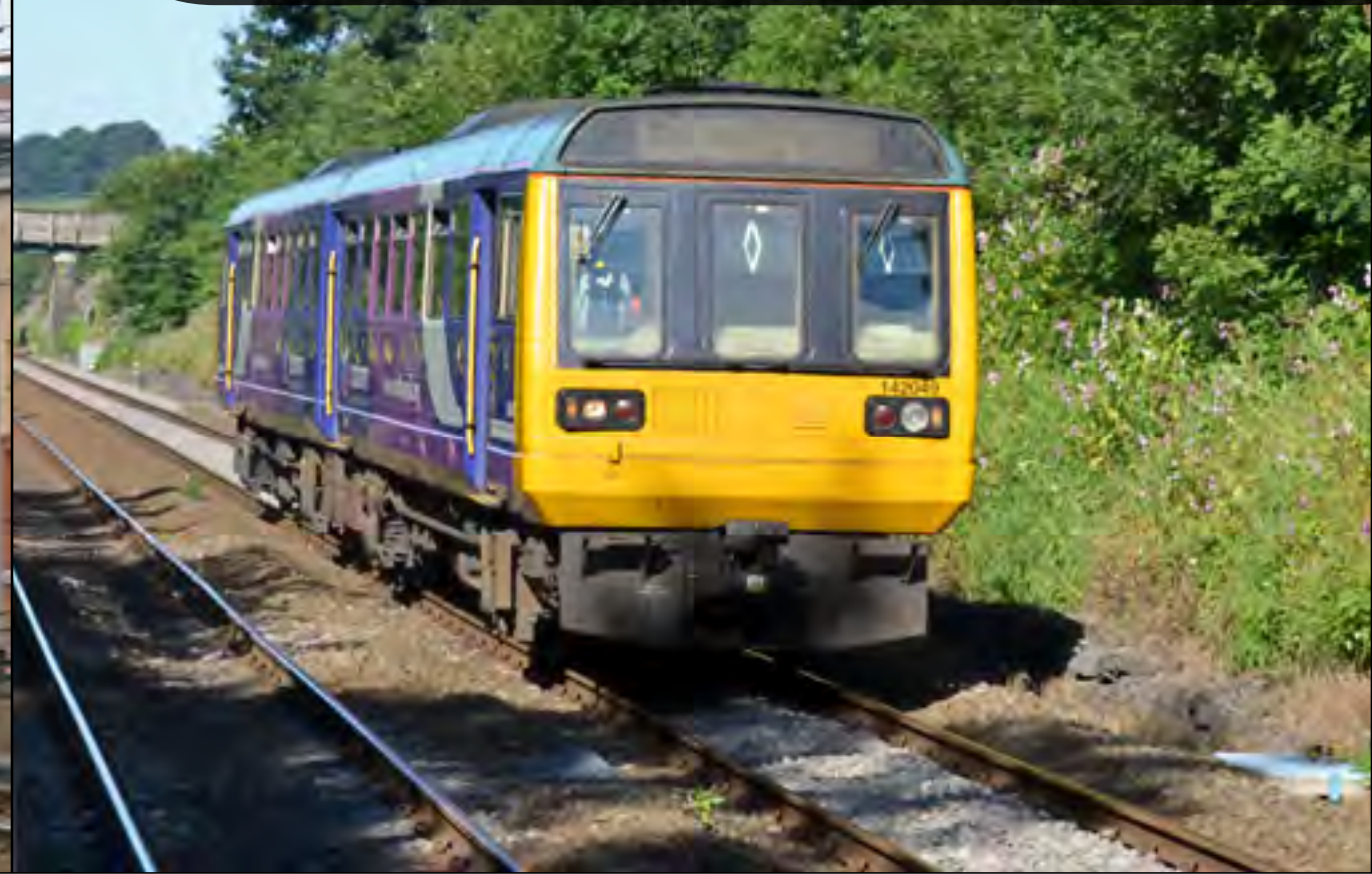
Northern Rail's Class 142 049 approaches Pleasington station on August 12th working the 2N14 08:20 Blackpool South to Colne service. Dave Felton