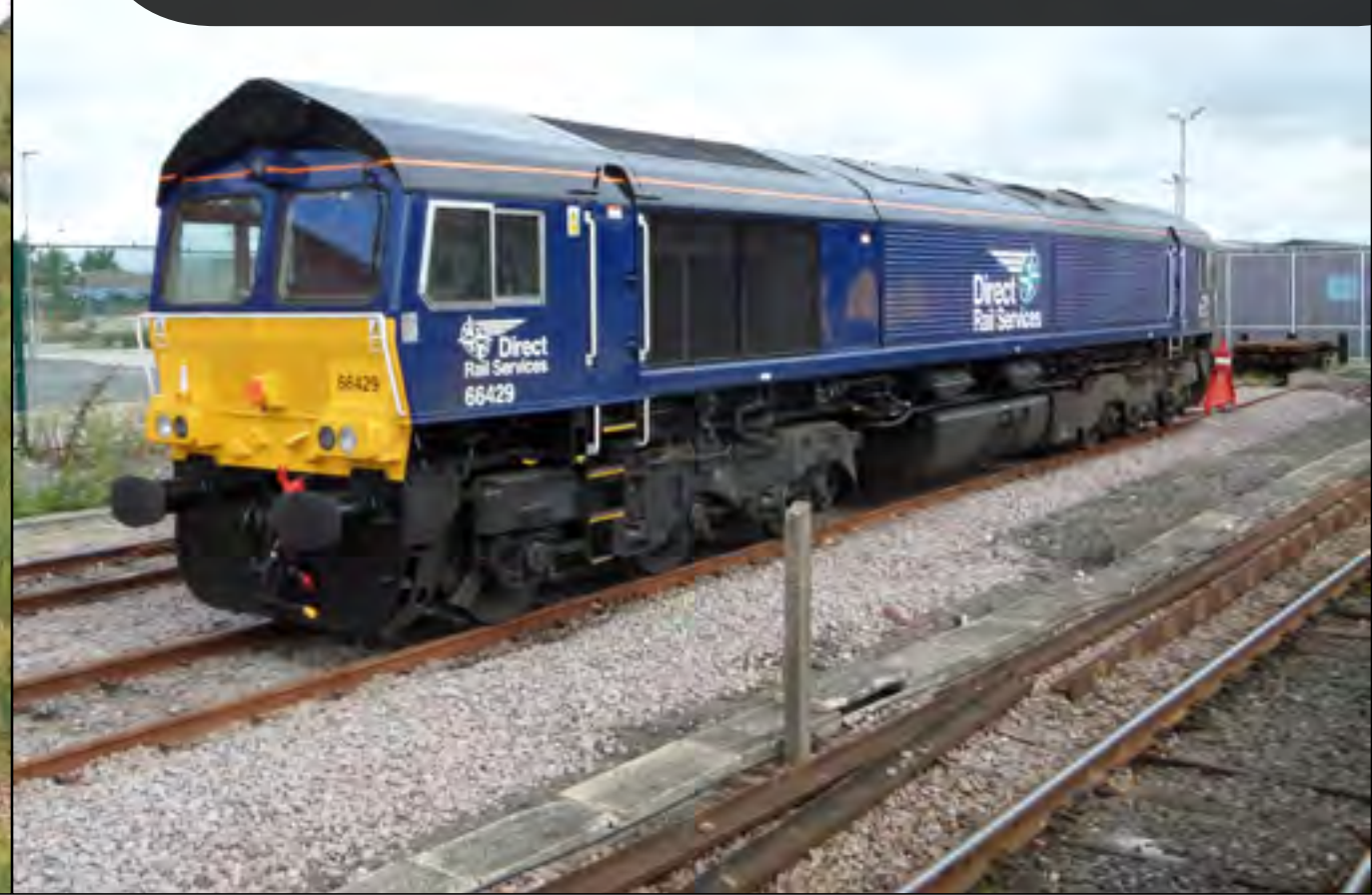
Class 66 429 is seen stabled in the parcels siding at York on September 2nd. Eddie Emmott