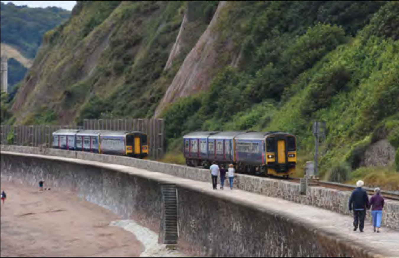
On August 1st, First Great Western Class 150/2 and 153 combinations working services to/from Paignton pass at Dawlish.