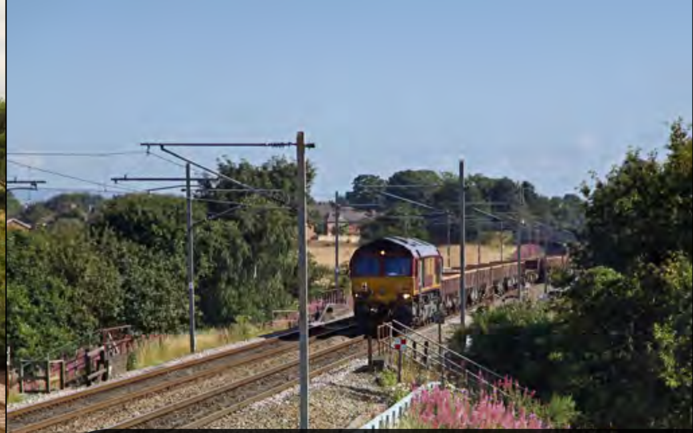
Class 66 059 (with 66 183 on the rear) works the 6L42 ballast through Red Bank on August 16th.