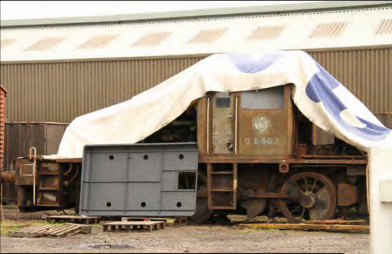
Class 14 No. D9502 is seen sheeted over at Bury on August 15th, but restoration should commence in the coming months. Derek Elston