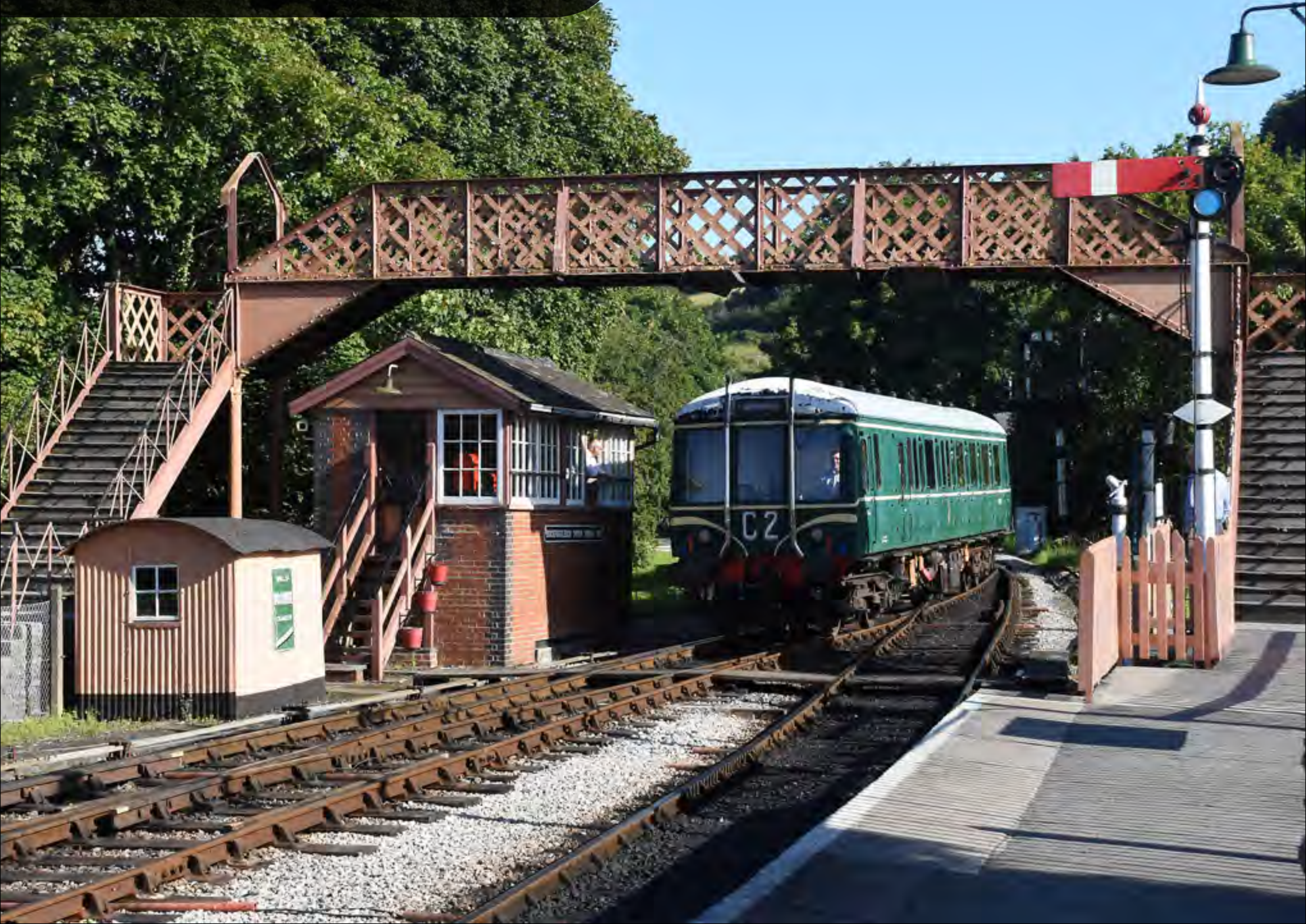
On July 31st, single-car DMU No. W55000 after arriving with the last train of the day from Totnes, shunts into the depot sidings at Buckfastleigh. Steve Thompson