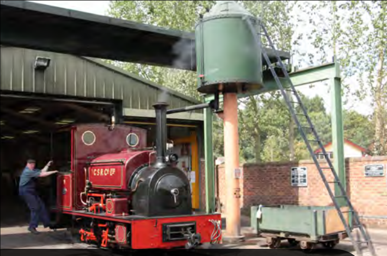
'CSR & Co. Ltd' No. 19 (Hudswell Clarke No. 1056/1914) rests in the shed area waiting for it's next duty. Stuart Hillis