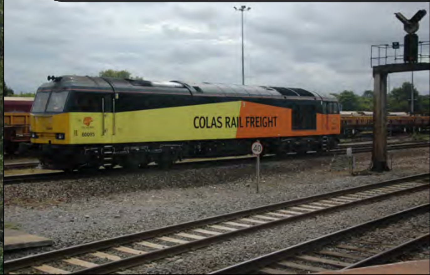
On August 5th, Class 60 095 powers along the relief line at Westbury after dropping off two cranes in the yard that it had brought from Eastleigh. James Passant