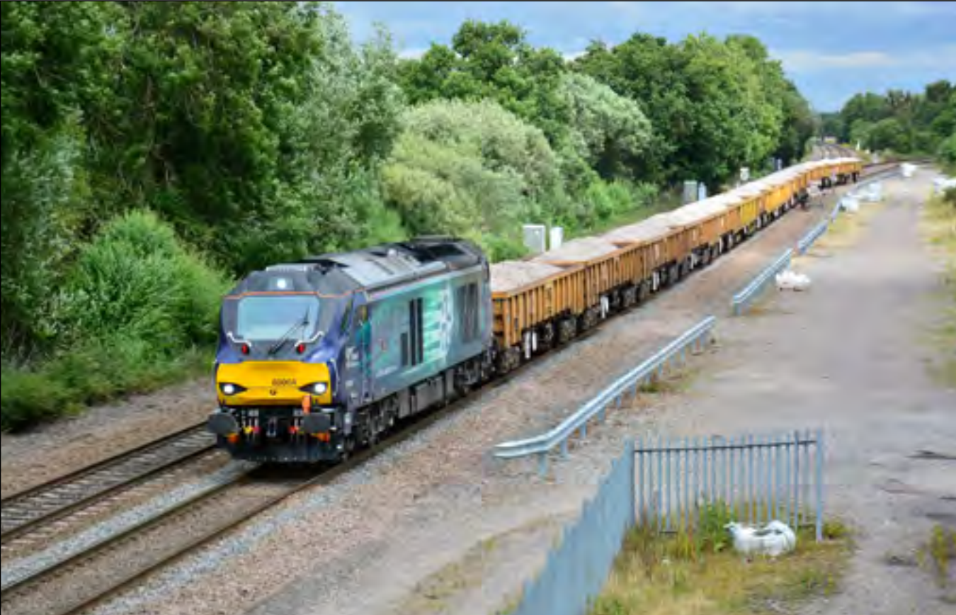
On August 4th, Class 68 004 'Rapid' takes a Mountsorrel to Crewe ballast through Stenson Jct.