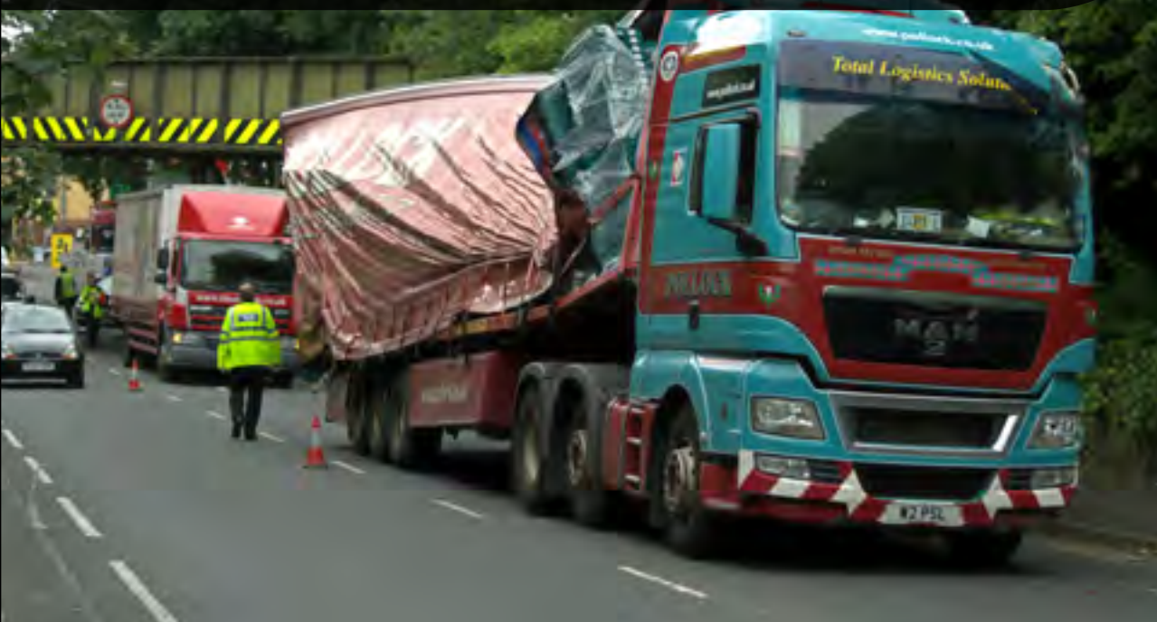
The aftermath of a Bridge Strike at Ewood, Blackburn is seen on August 5th. The driver clearly forgetting that big wagons don't fit under small bridges.