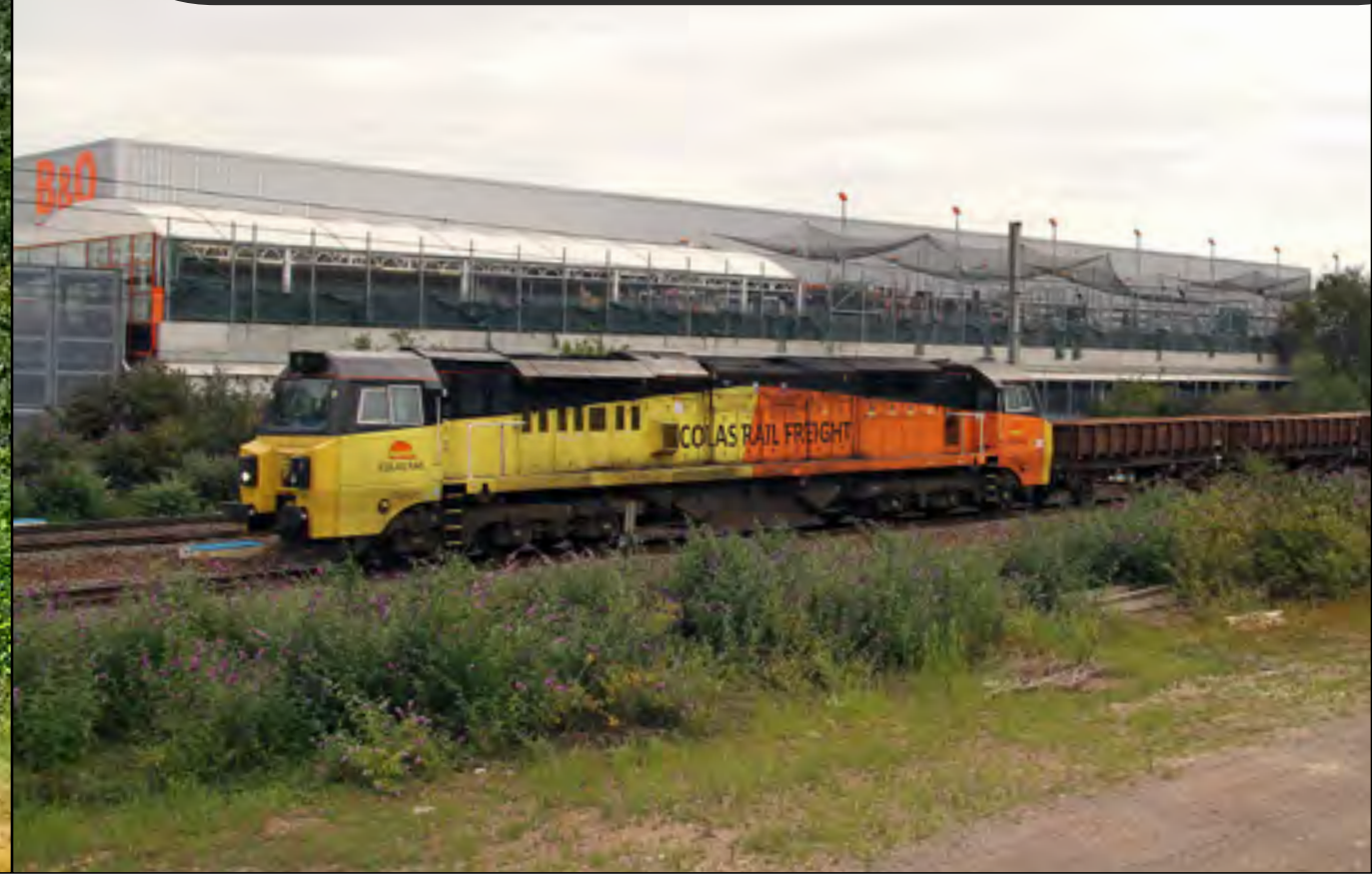
Class 70 805 is seen in charge of the 09:58 Hoo Junction Up Yard to Whitemoor Yard engineers passing Stevenage on August 12th.