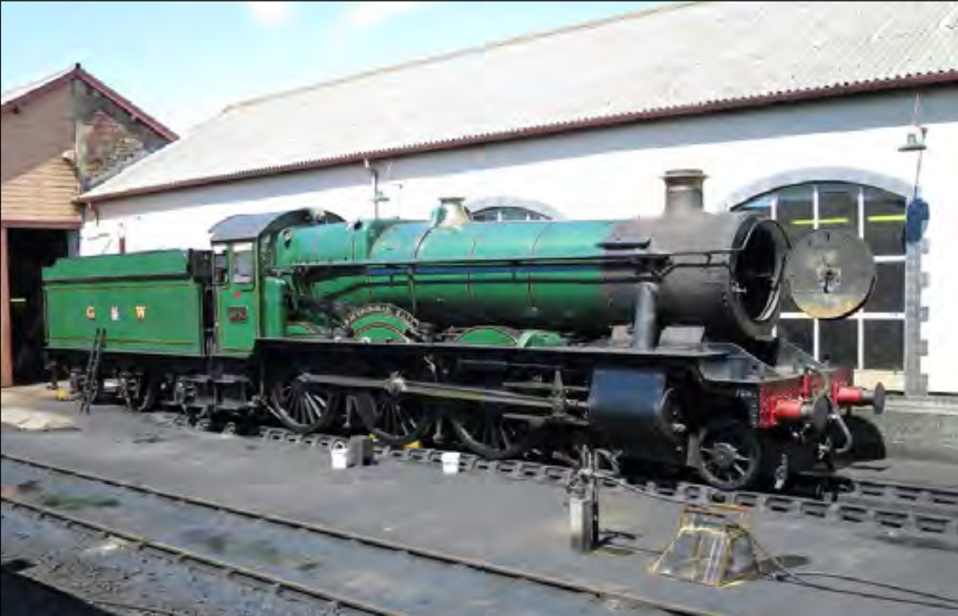
GWR Modified Hall Class No. 6960 'Ravensingham Hall' is pictured at Minehead on July 25th undergoing maintenance.