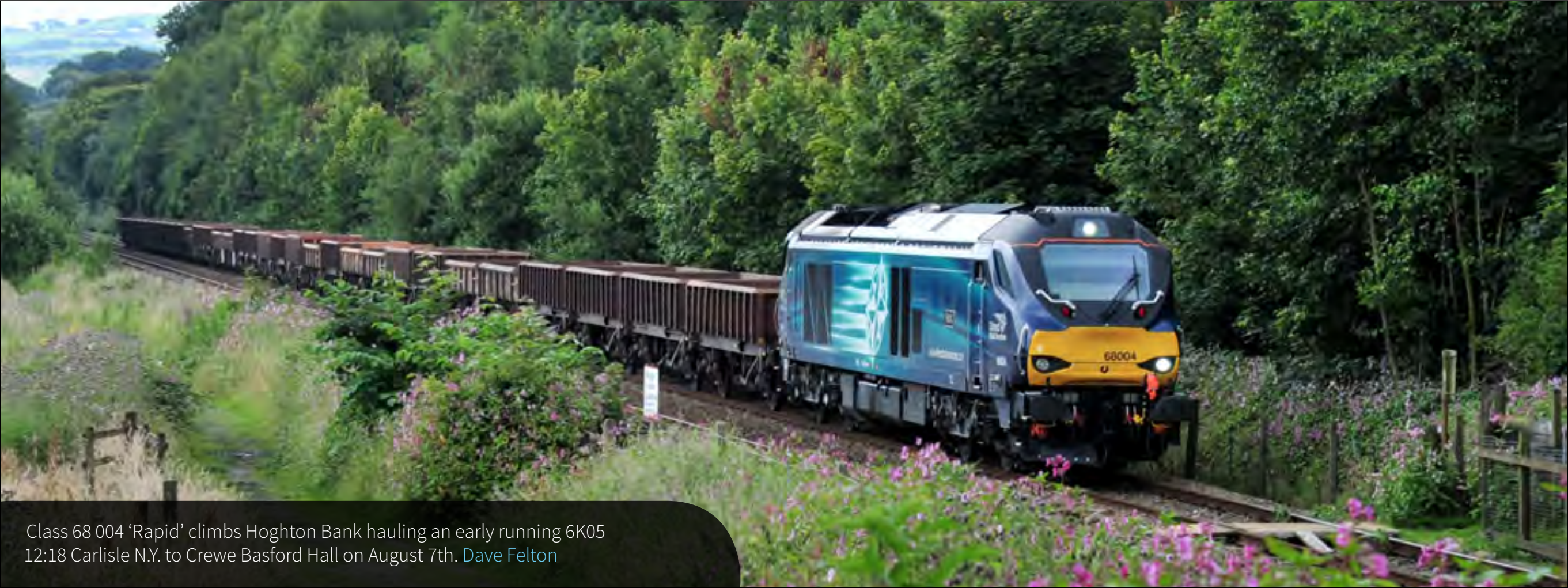
Class 68 004 'Rapid' climbs Hoghton Bank hauling an early running 6K05 12:18 Carlisle N.Y. to Crewe Basford Hall on August 7th.