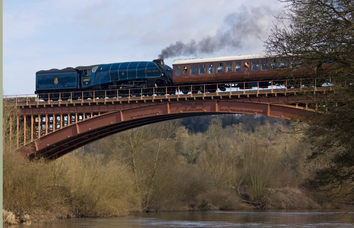
Above: "Sir Nigel" passes over Victoria Bridge on 6th March, working a service from Kidderminster.