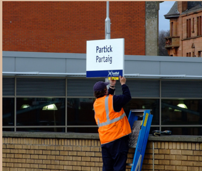
A photograph looking over to platform 1 at Partick station of one of the two workers at Partick station putting the new Transport Scotland blue and white Saltire station signs on the lampposts and throughout the rest of the station. From today, 17th March, the station is now in full Transport Scotland blue and white Saltire branding.