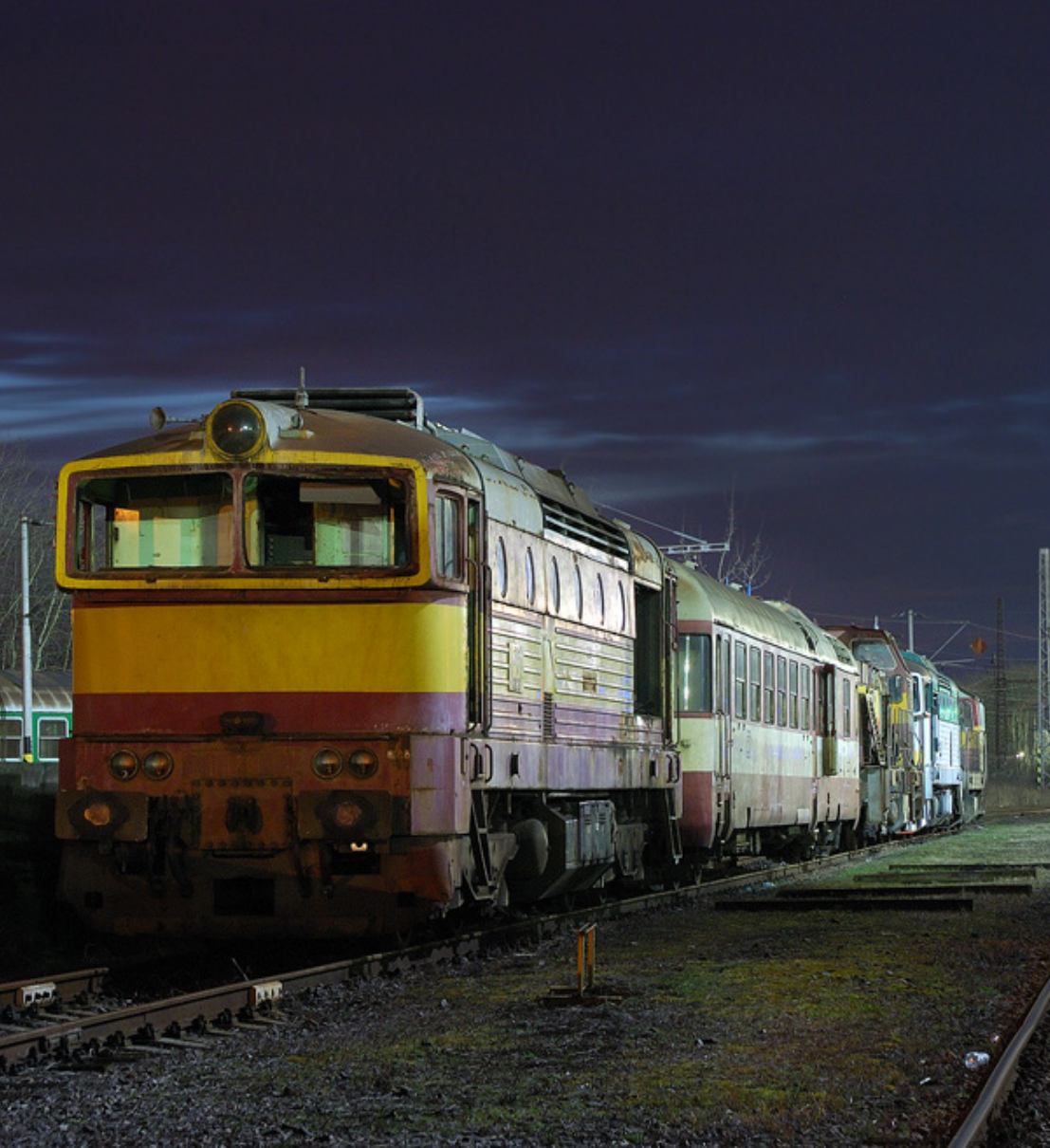
Above: Demic Goggles 750.282-6 is seen on the scrap line at Nymburk hlavní nádraží (Depo) on 11th March.