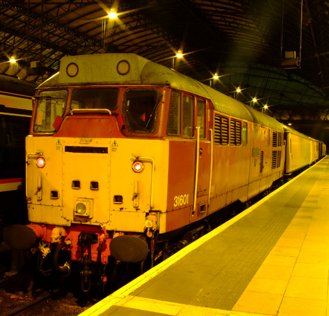
Above: Class 31 601 is seen at Glasgow Queen Street High Level station while working the 18.52 1Q06 Millerhill - Mossend Yard via Edinburgh Waverley, Carstairs and Glasgow Queen Street High Level Network Rail Structure Gauging train, 9th March.