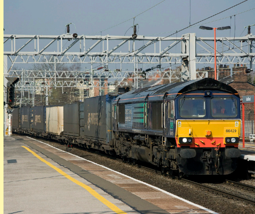
Above: DRS Class 66 429 passes through sunny Stafford on 20th March with the southbound Malcolm service.