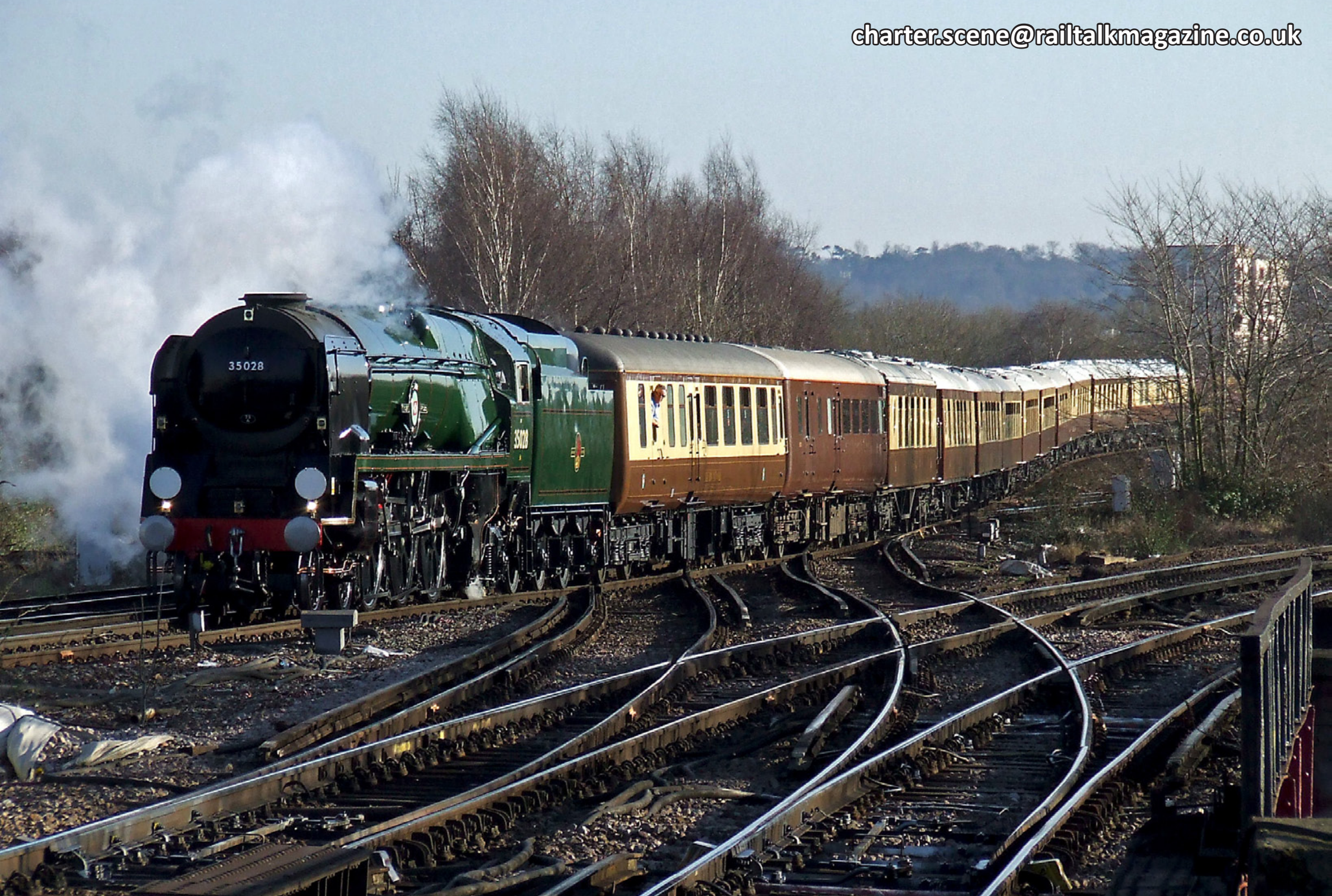
Rebuilt Merchant Navy class No 35028 Clan Line passes Selhurst with a VSOE for London Victoria on 21st February.