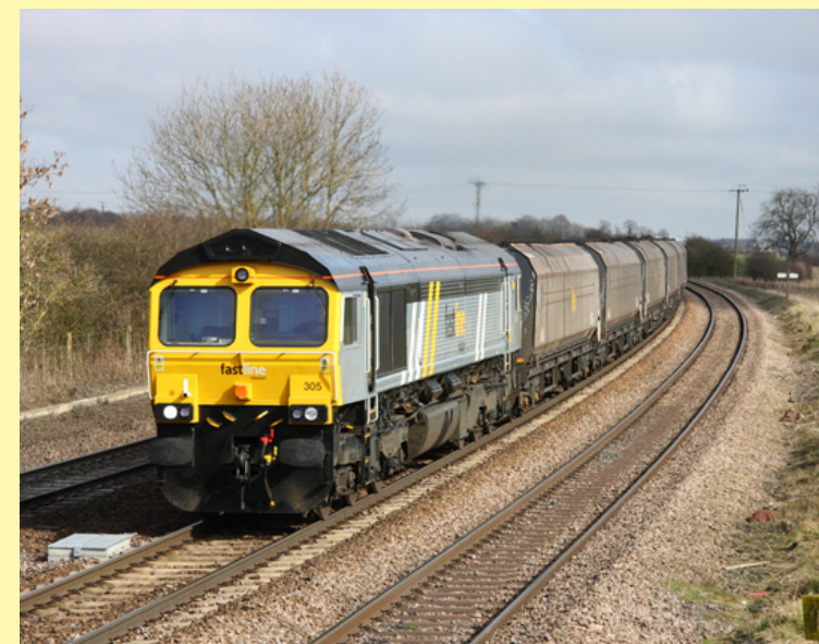
Right: Fastline Class 66 305 working 6Z36 Immingham - Ratcliffe Power Station at New Barnetby on 17th March.