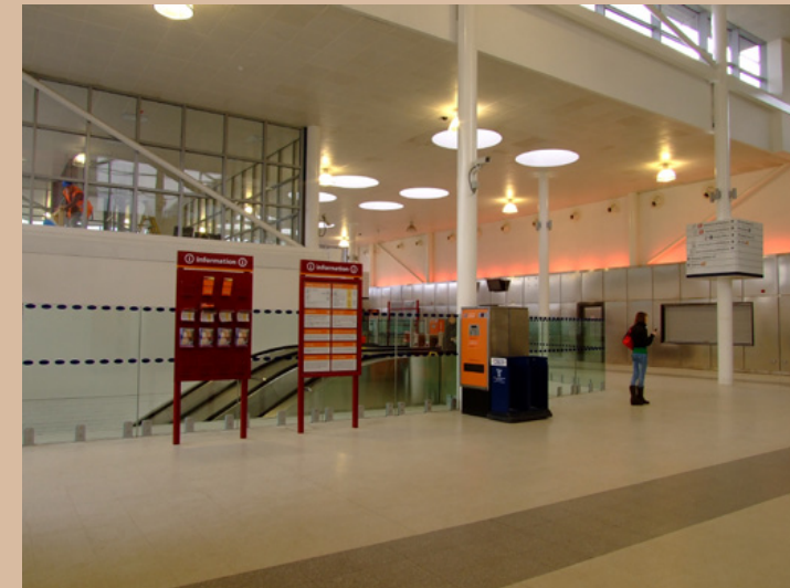
A photograph of inside Partick station showing the station concourse and the station cafeteria being worked on which will be open in time for the station's official opening which is meant to be on Tuesday 31st March 2009.