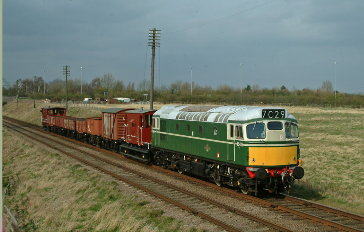
Above: Class 27 D5401 passes Woodthorpe on a freight turn.

Below: 63395 passes Woodthorpe on 22nd March.