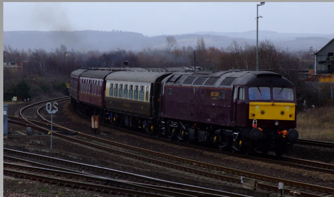
Below: Class 47 787 is seen on the rear of the 1247 Preston - Whitby charter with the roof just visible of 47 798 leading. James Stoker