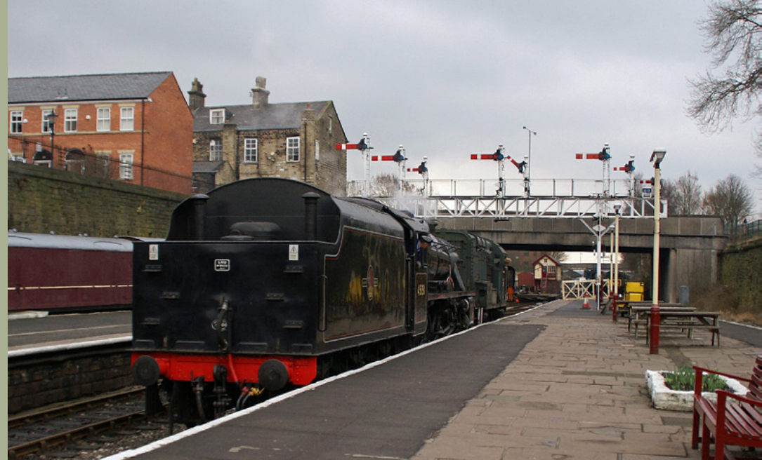
Above: Farewell to 45231 as it gets dragged of the the shed at Bury. Below: Not expecting to be used on the day, but Class 24 D5054, took over 45231's duties for the remainder of the day, seen here with Hymek Class 35 D7076 in the station at Bury.