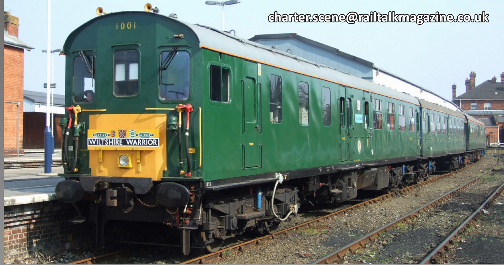
Left: Preserved Hastings Unit No. 1001 stands at Salisbury prior to working the return working of The Wiltshire Warrior Railtour from Salisbury to Hastings via Havant, Guildford, Redhill and Tonbridge on 21st March.