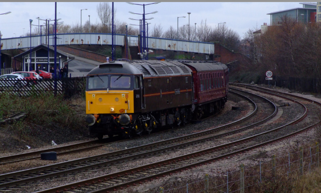
Below: A royal return for Class 47 798, the NRM loco has returned to traffic with West Coast Railways and one of its first outings was on 1247 Preston - Whitby, seen here passing through Thornaby, 7th March.