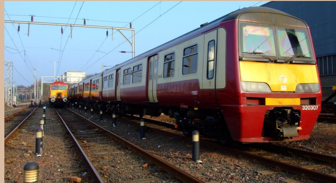
Class 320 307 is seen sitting outside in the yard at Shields T.M.D. having just come out from Glasgow Works, Springburn after going through a C4 overhaul. The unit had just been brought back from Glasgow Works some 3 hours later than planned running as 5D02 by Class 57 307 which is seen sitting next to the unit.