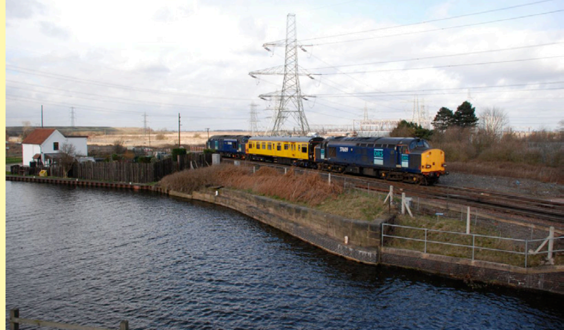
Above: 2nd March saw a 2Q09 Doncaster - Scunthorpe - Doncaster working, featuring QXA DB 999508 being top & tailed by Class 37 609 & 37 605. This is 37 609 leading at Keadby Canal Jcn. Below: Taken in a rain shower on 10th March, Class 66 730 hauls Class 377 501 to Derby Litchurch Lane, seen here passing through Bedford Station.