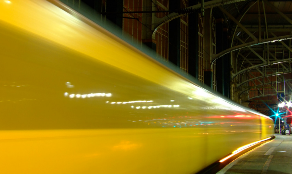
Above: DBSO 9714 and Class 31 105 are seen departing platform 1 at Glasgow Central High Level station while working the 4Q76 Polmadie - Carlisle via Glasgow Central Network Rail Ultrasonic Test Train. Below: Off the track, literally, for this wagon at the Nene Valley. Right: As the light fades, a semaphore signal stands alone at the Nene Valley's Peterborough station.