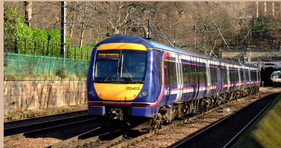
Class 170 402 is seen passing Princes Street Gardens, Edinburgh while working the 11.15 1R42 Glasgow Queen Street High Level - Edinburgh Waverley service, 6th March.