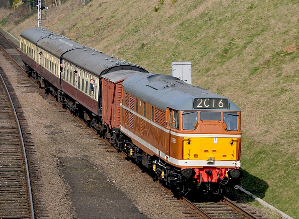
The Great Central had a 1960's gala on the 21st/22nd March. Above: Class 31 D5830 arrives at Rothley on a local service.

Below: 63395 passes Woodthorpe on 22nd March.