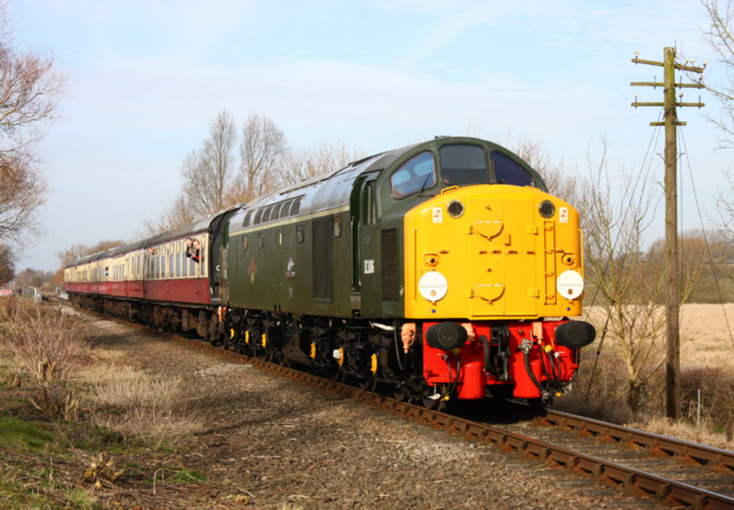
Final three from the Nene Valley gala.

Above: Class 40 D306 'Atlantic Conveyor' works the 09:35 Wansford - Peterborough approaching Lynchs Bridge.