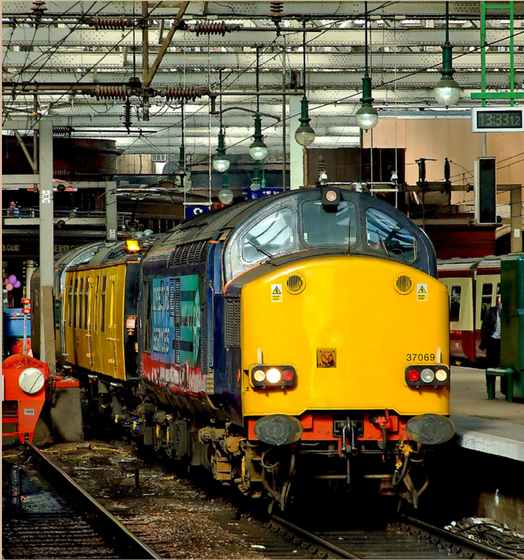
On 17th March, Class 37 069 and 612 are seen at Platform 8, Glasgow Central High Level station getting prepared to work the 13.44 1Q19 Glasgow Central High Level - Mossend via Newton, Queens Park, Glasgow Central High Level, Corkerhill, Hamilton and Motherwell Network Rail Mentor Test Train.