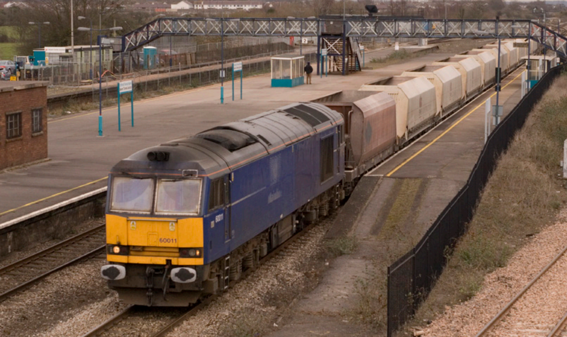
Above: Still carrying a Mainline transfer on one side, Class 60 011 passes through Severn Tunnel Jct. station with a late running 6B35 Hayes to Moreton on Lugg empty hopper train on 2nd March. Gary S. Smith Below: First Great Western Class 142 001 is seen coming into stop just outside Springburn station in order to turn around and head into Glasgow Works. The unit was working the 07.35 5Z56 Crewe Basford Hall - Glasgow Works, 12th March. Jonathan McGurk