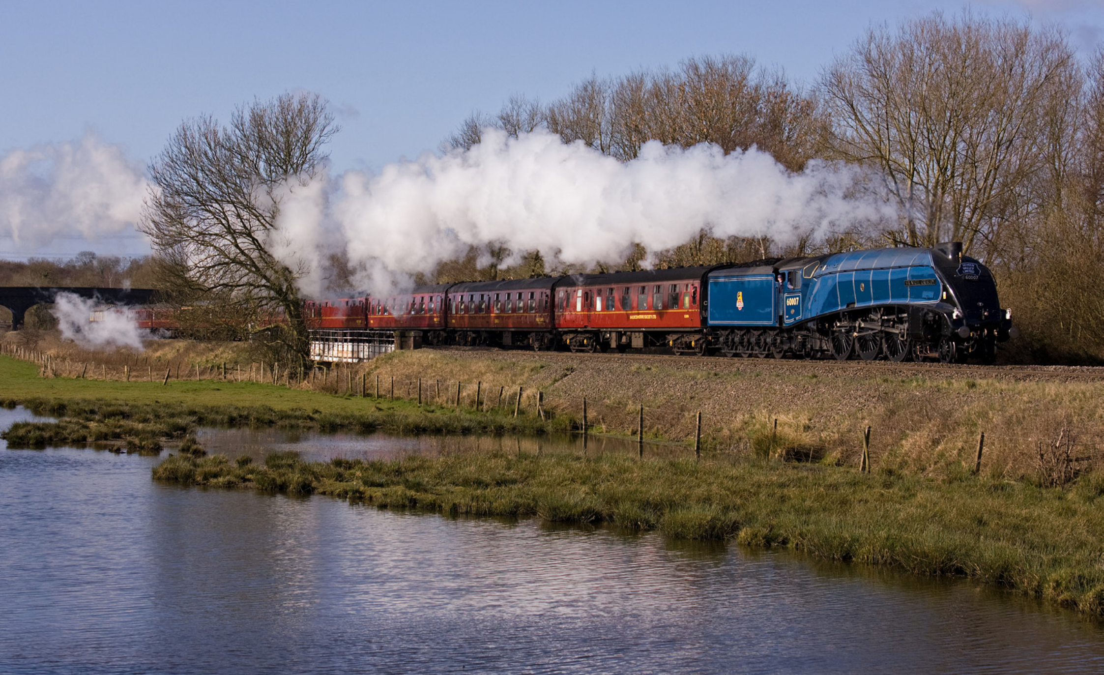
60007, "the kettle version" passes Lea Marston pond working 1Z67 "Severn Valley Limited" Bridgnorth to Lincoln on 14th March.