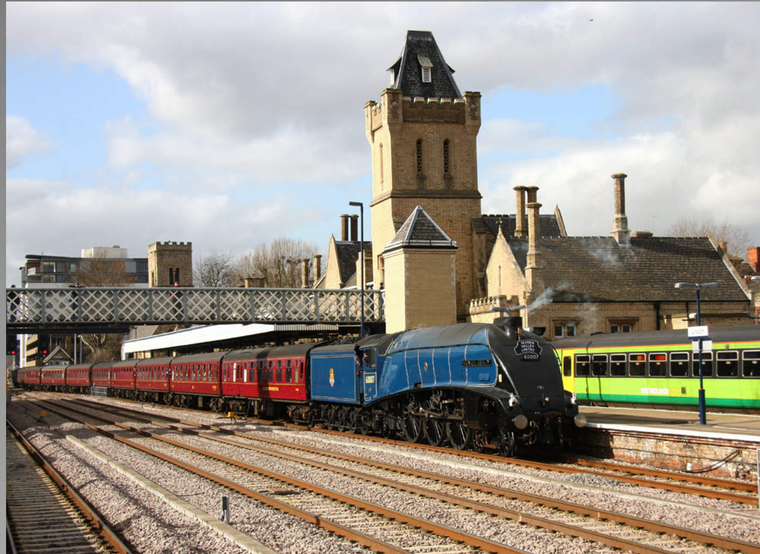
60007 'Sir Nigel Gresley' arrives at Lincoln Central on 14th March, with the 'Seven Valley Limited' railtour, It was running 84 minutes late at this point.

We hope that you will like our selection of shots this month.