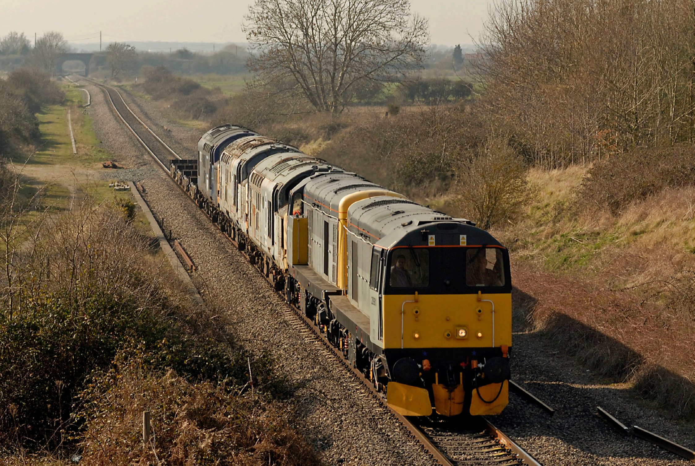
On 20th March, Class 20 901 and 20 905 provided the traction to take redundant Type 3s 37 672, 37 412 and 37 029 from Barrow Hill to Long Marston. The convoy, with the headcode 6Z37 passes the site of the station at Fladbury, between Pershore and Evesham. Gary S. Smith