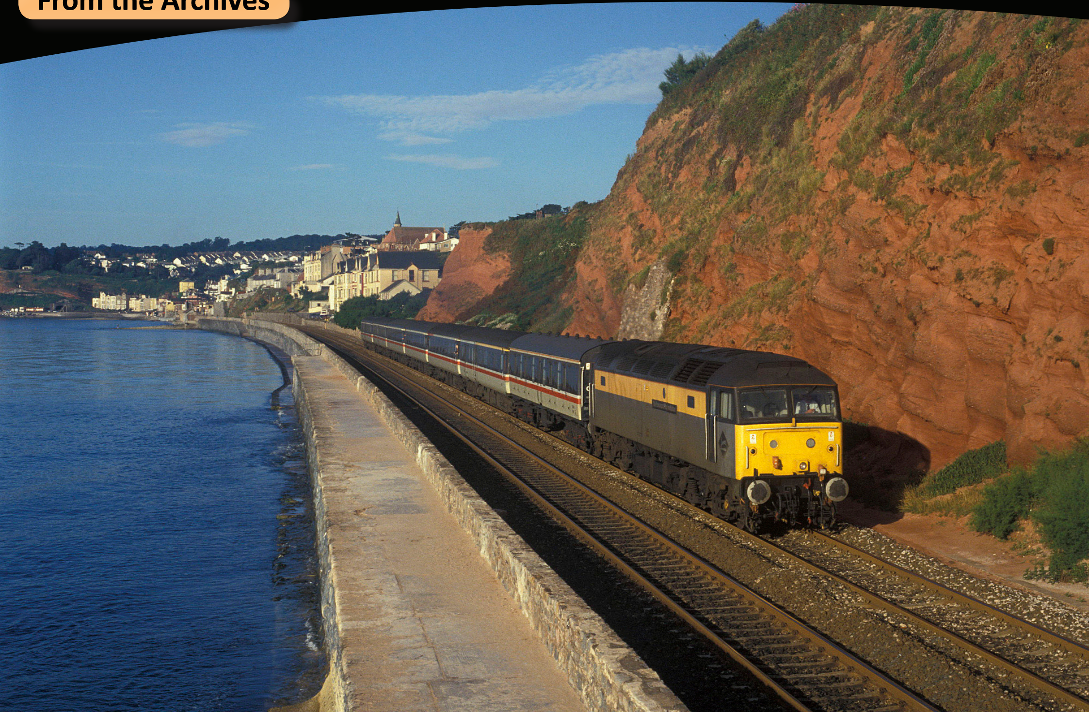
Departmental Class 47 974 is seen working an Inter-City CrossCountry service along the sea wall at Dawlish on 10th August 1991. This loco was also numbered 47 531 and 47 775.