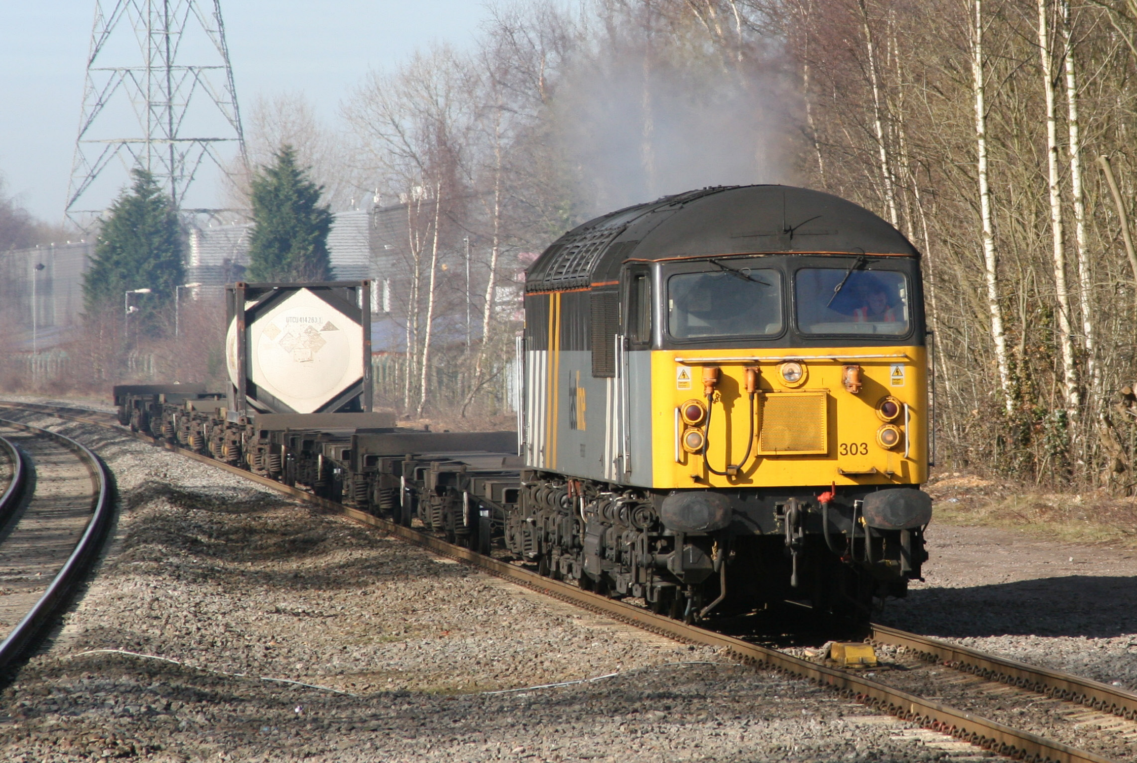
With the withdrawal of the Fastline Intermodal service, here's a last look at Class 56 303 passing Water Orton on Friday 6th March. It was working a lightly loaded 4M60 Grain to Doncaster. The future of the Class 56's is currently uncertain.