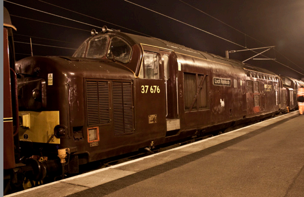
Left: Class 37 706 thunders south on the 5247 Carnforth to Southall empty coaching stock turn.