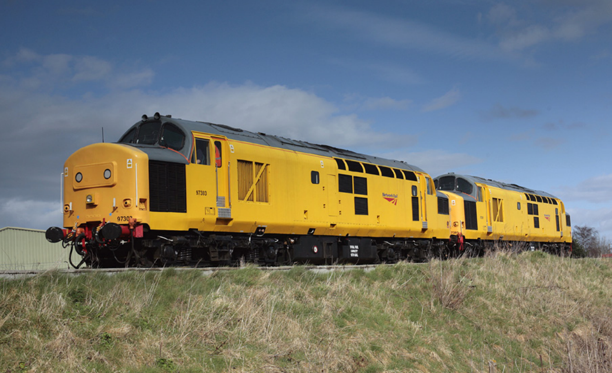
Left: Network Rail's Class 97 303 and 97 301 are seen passing through Cosford on 23rd March.