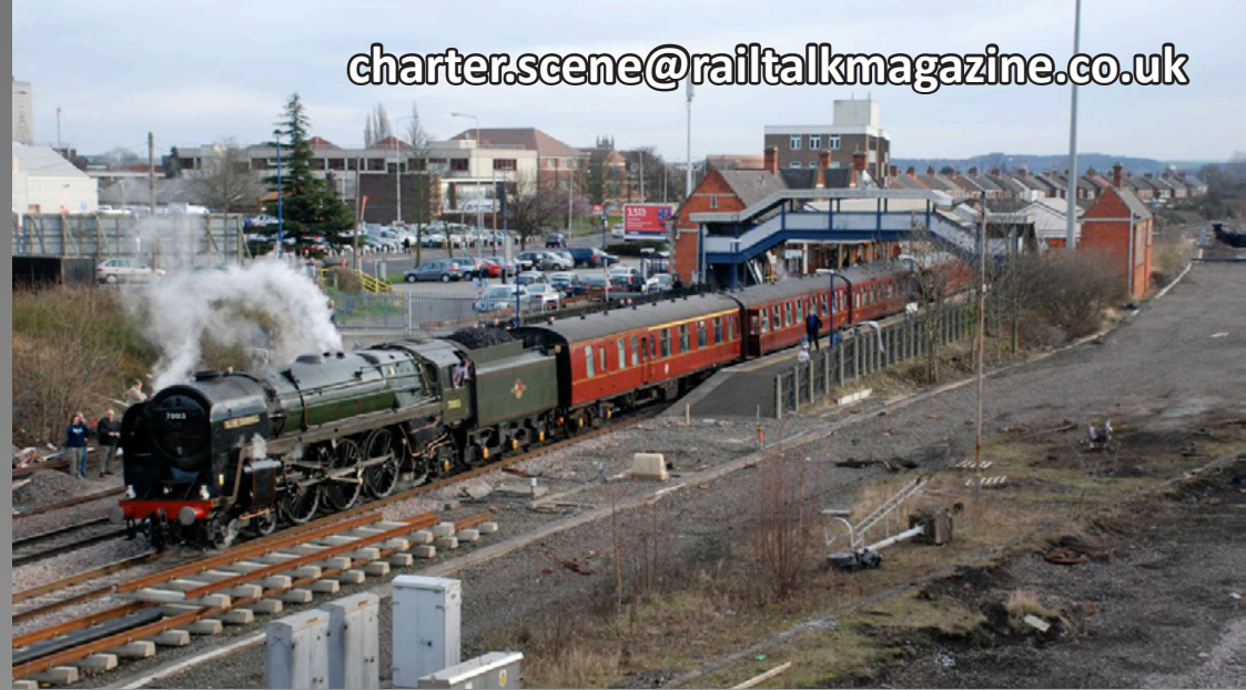
Above: 70013 "OLIVER CROMWELL" is seen waiting to leave Scunthorpe, on 1278 Cleethorpes - Kings Cross, the first "Britannia" to work here for over 45 years.