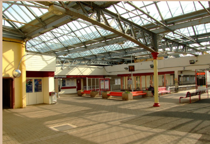
A view of the waiting area at Gourock station.