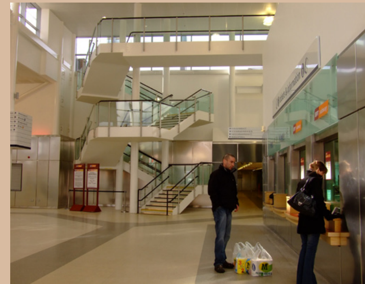
A view of the ticket office for the both First ScotRail and the Glasgow Subway and a view of the station concourse and the modern and smart staircase that takes you up and down to and from platform 1 and the waiting area for the platform.