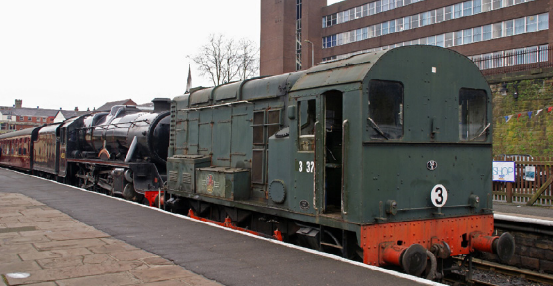
Above: On the East Lancs Railway on 28th February, D3232 is seen removing 45231 from the rear of a service to Rawtenstall. The steam loco had failed at Heywood with leaking boiler tubes, and rescue came in the shape of Class 24 D5054.