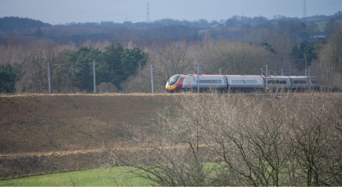
Left: Pendolino 390 051 is seen working 1M11 Glasgow Central to Lockerbie service approaching Camps Viaduct after being diverted via the Hamilton Circle after an emergency engineering possession at Uddingston.