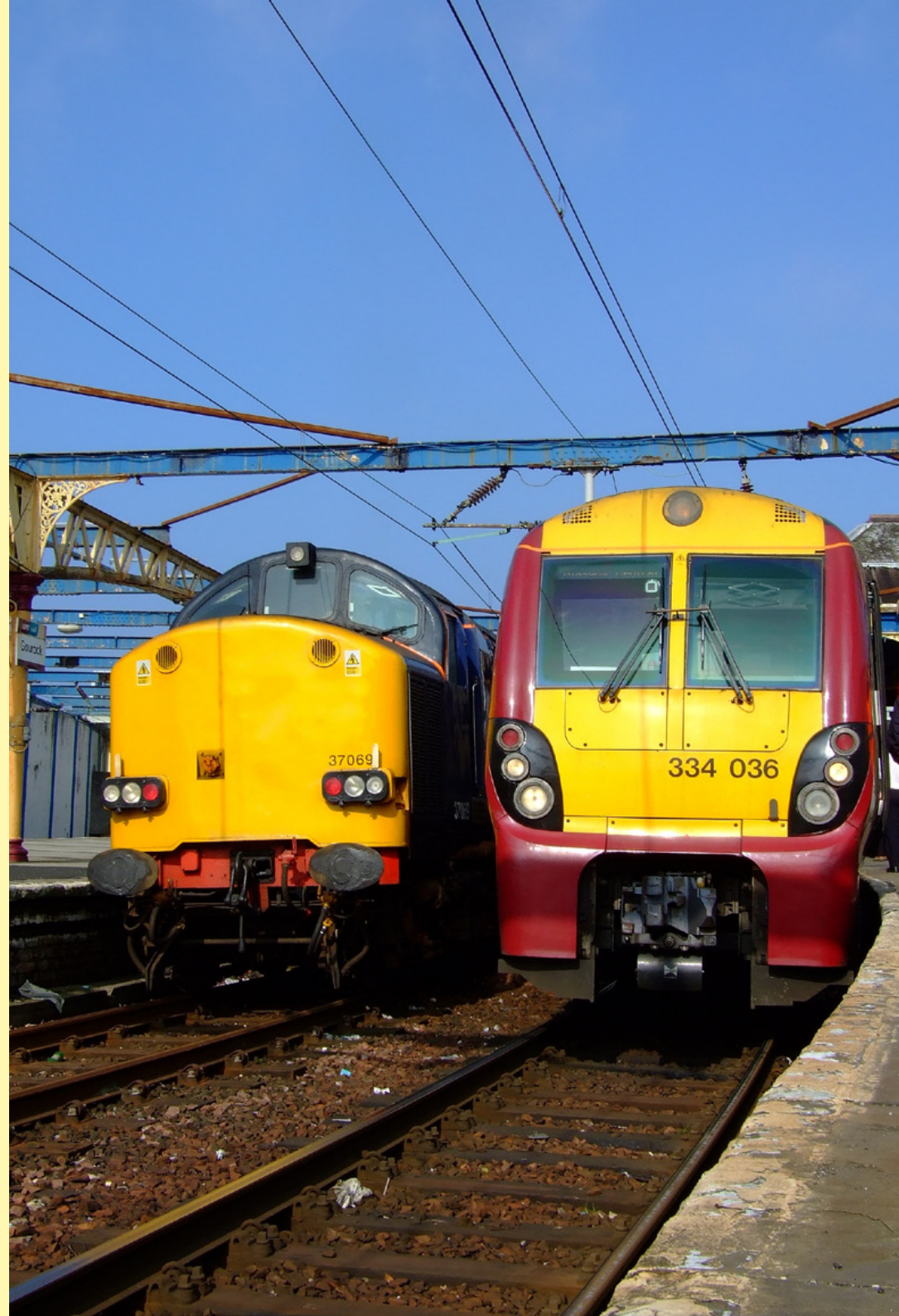
Right: Class 37 069 is seen at Gourock station while working the 08.45 1Q18 Mossend - Mossend via Newton, Glasgow Central High Level twice, Gourock, Wemyss Bay and Lanark Network Rail Mentor Test Train. Class 334 036 was also seen at the station getting prepared to work the 11.36 2G36 Gourock - Glasgow Central High Level service, 18th March.