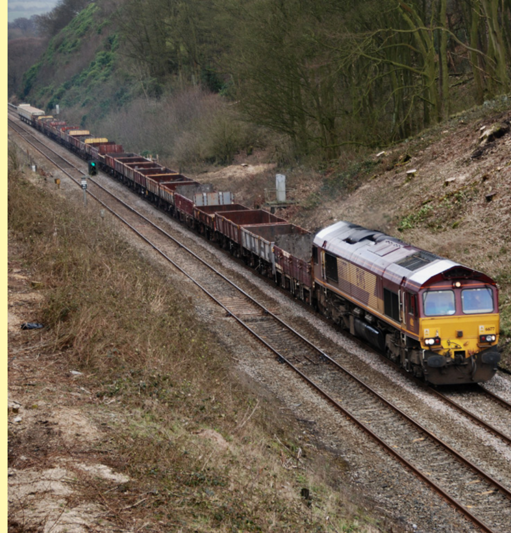
Above: Class 66 157 working 6M86 Immingham to Bescot, snakes through the point work at Pelham Street Junction, Lincoln on 10th March.