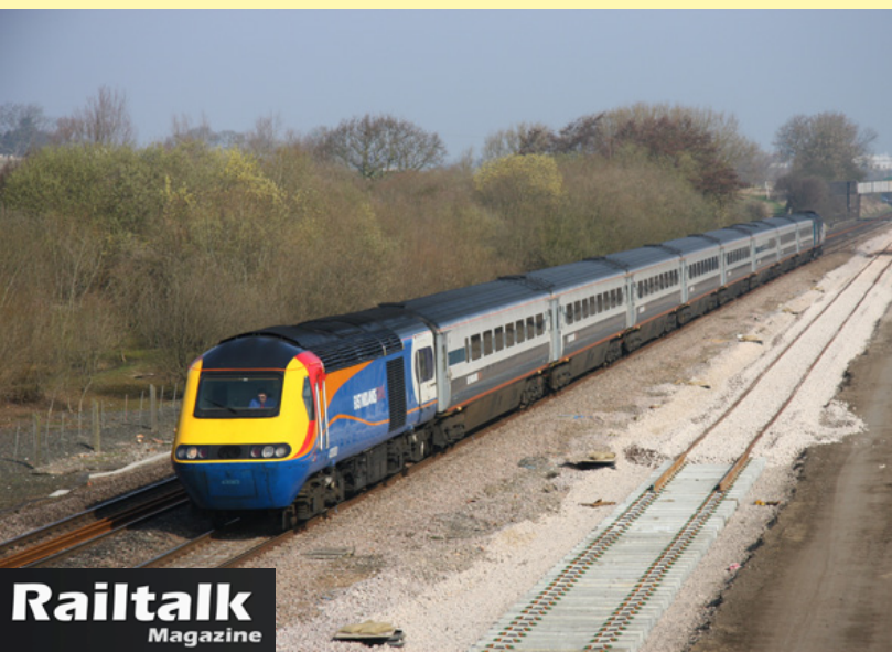
Left: This shot was taken at Finedon, (between Kettering and Wellingborough) on 21st March. 43083 is leading a Nottingham to St Pancras International service.