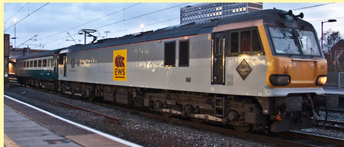
Bottom Right: Class 92 007 is seen hauling coach Mk2 coach M6046 on a Wembley - Crewe Electric Depot move, 21st March.