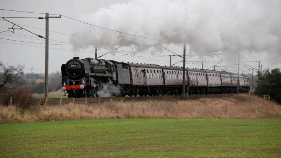
Above: 70013 "OLIVER CROMWELL" is seen storming Gamston Bank, having stopped for water at Retford, working 1278 Cleethorpes - Kings Cross.