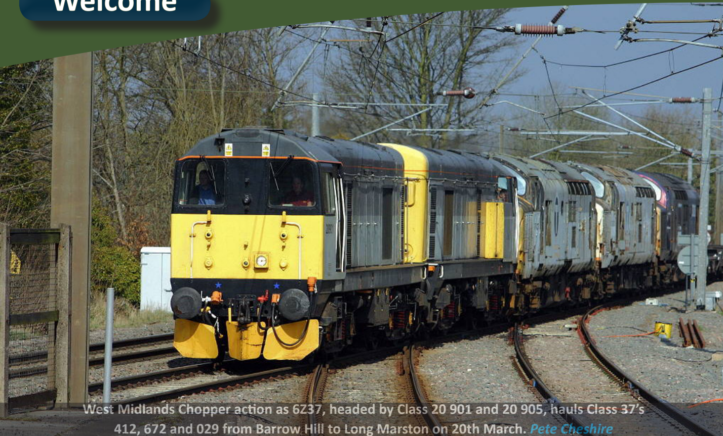
West Midlands Chopper action as 6Z37, headed by Class 20 901 and 20 905, hauls Class 37's 412, 672 and 029 from Barrow Hill to Long Marston on 20th March.