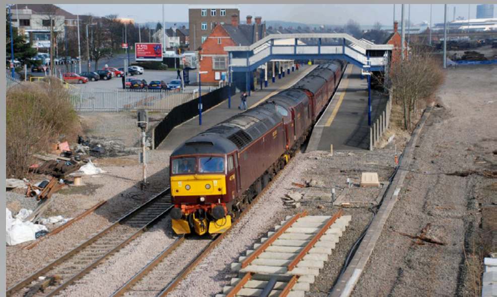
Below: Class 47 760 and 37 676 are seen working 5283 Barnetby - Carnforth, through Scunthorpe on Sunday 1st March.