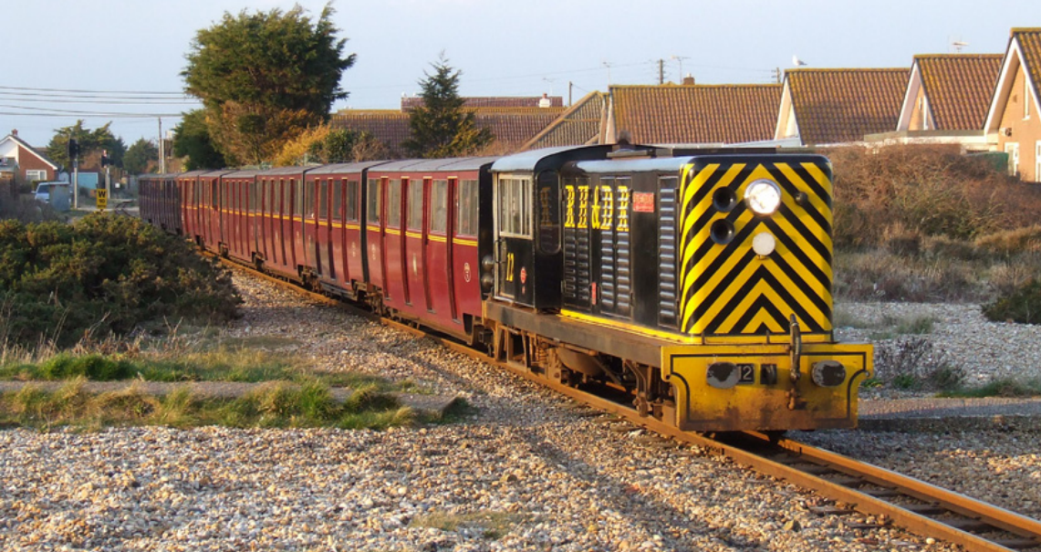
Above: No 12, "John Southland", passes through Lydd, Kent, working the 15:30 Hythe-Dungeness service on the Romney, Hythe & Dymchurch Railway.