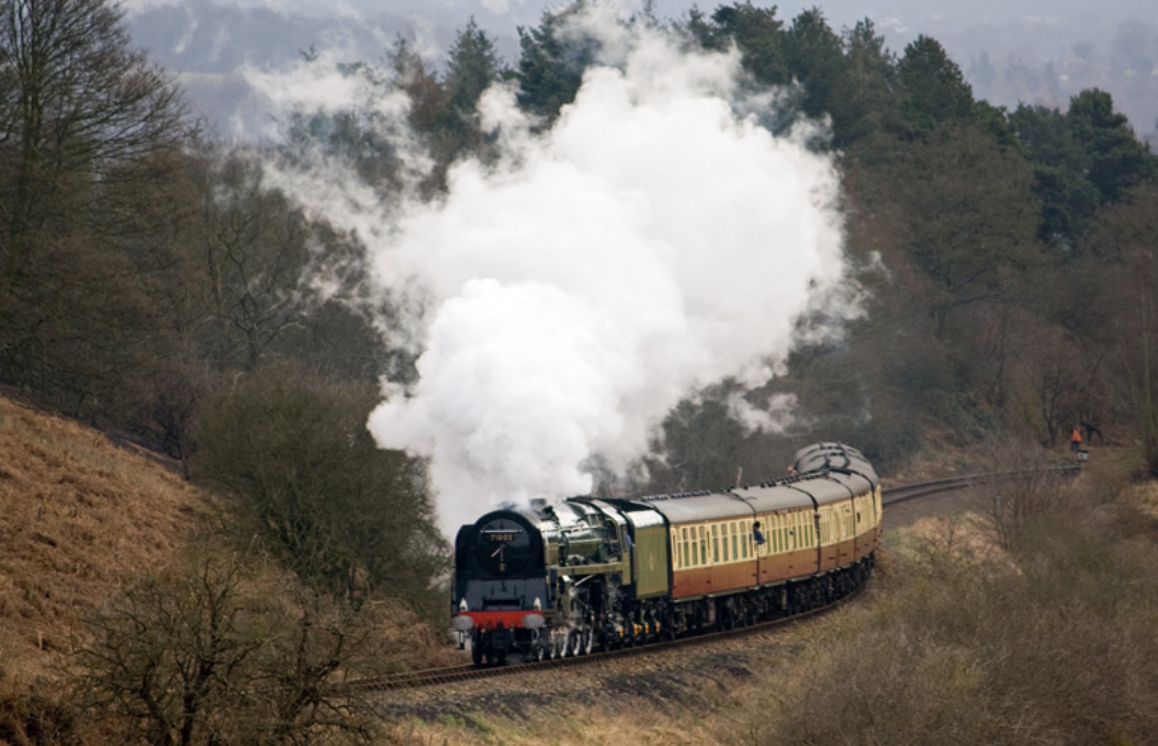
The Severn Valley Steam Gala produced an excellent line up of locos. Above: 71000 "Duke of Gloucester" is seen climbing Eardinton Bank on 6th March with a service for Bridgnorth.