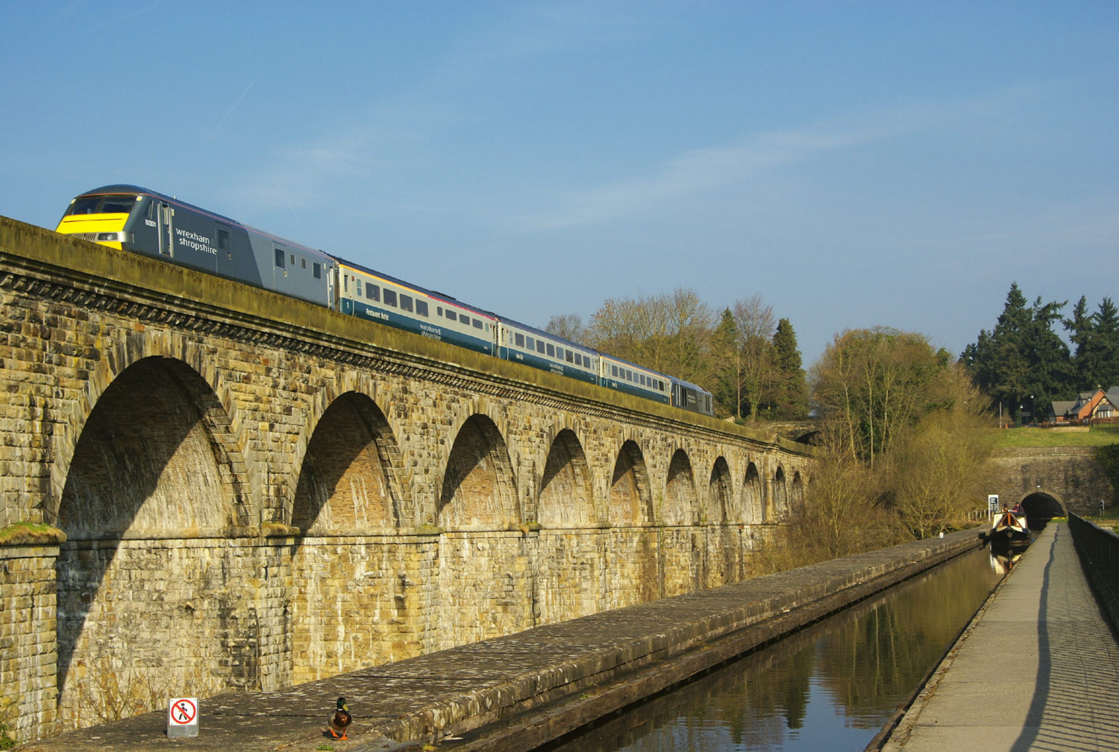
On March 21st, WSMR DVT No 82301 heads the 1P03 to London over Henry Robertson's 1846 viaduct at Chirk with Class 67 No 67 015 "David Lloyd George" powering the train. The viaduct clearly towers over Telford's adjacent 1796 structure.