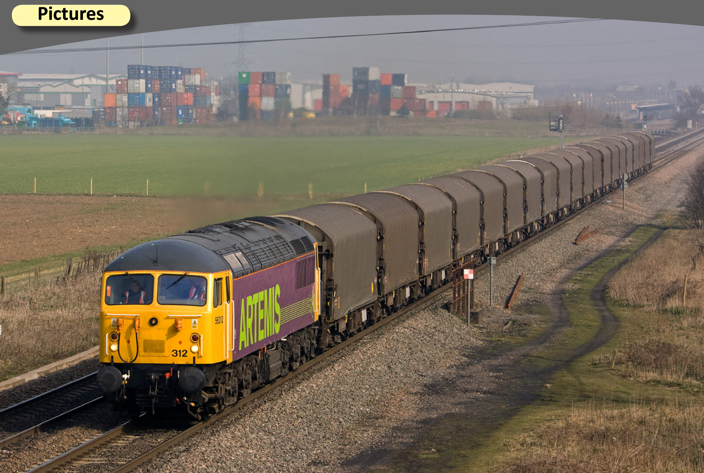
Hanson Class 56 312 works the 6Z57 Boston - Washwood Heath passed Wychnor Jct. on 19th March.