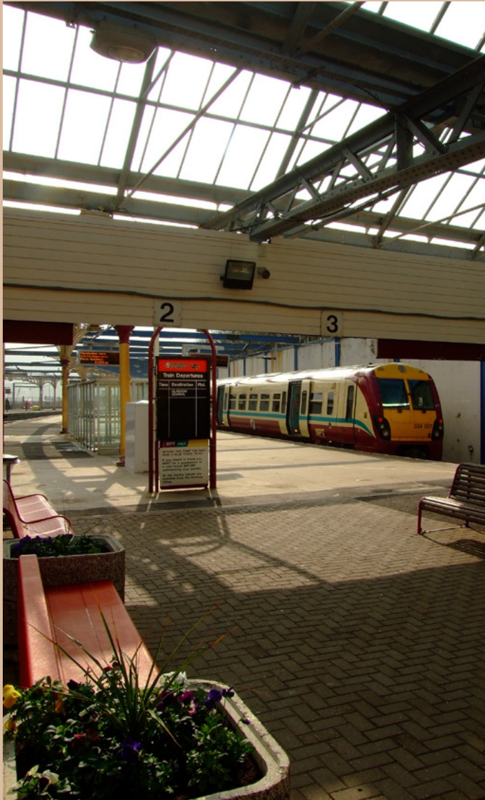
A view of the waiting area looking out onto the platforms at Gourock station. The station is going to be refurbished with work starting in March next year (2010).