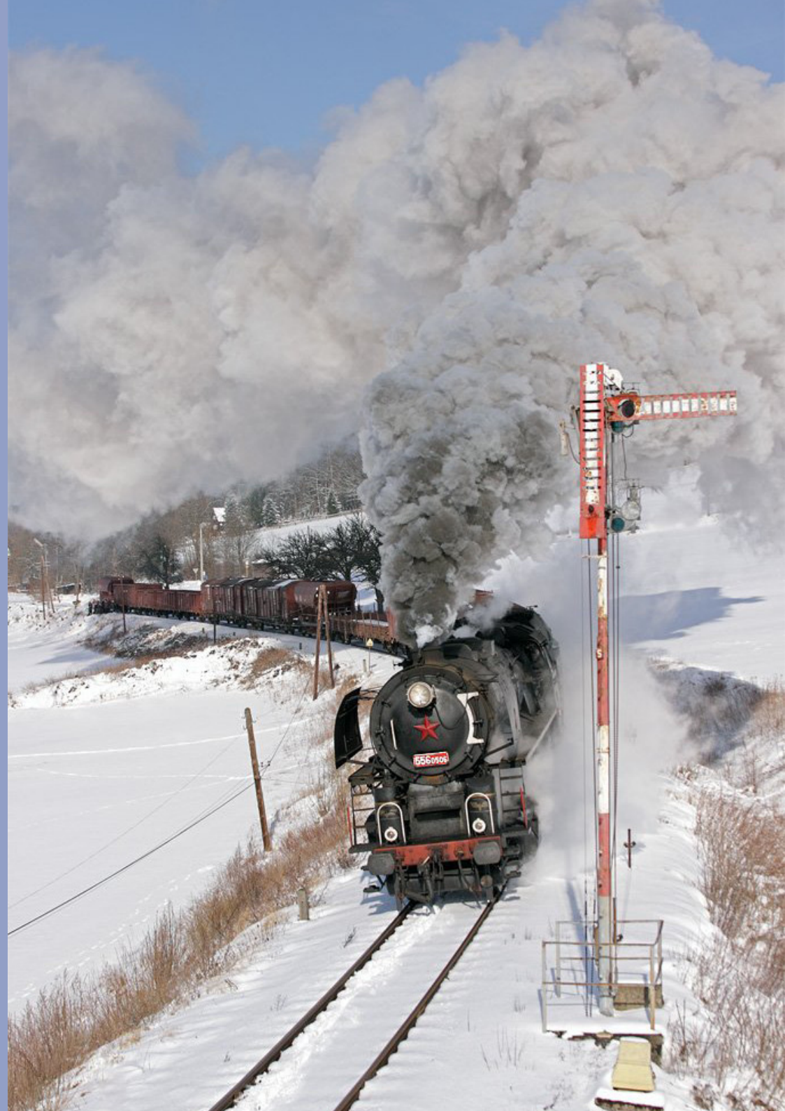
Right: A superb steam shot as 556.0506 storms passed Nemilkov with a goods train on 14th February. Dvorak Jan