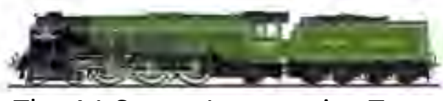
The A1 Steam Locomotive Trust New Steam for the Main Line