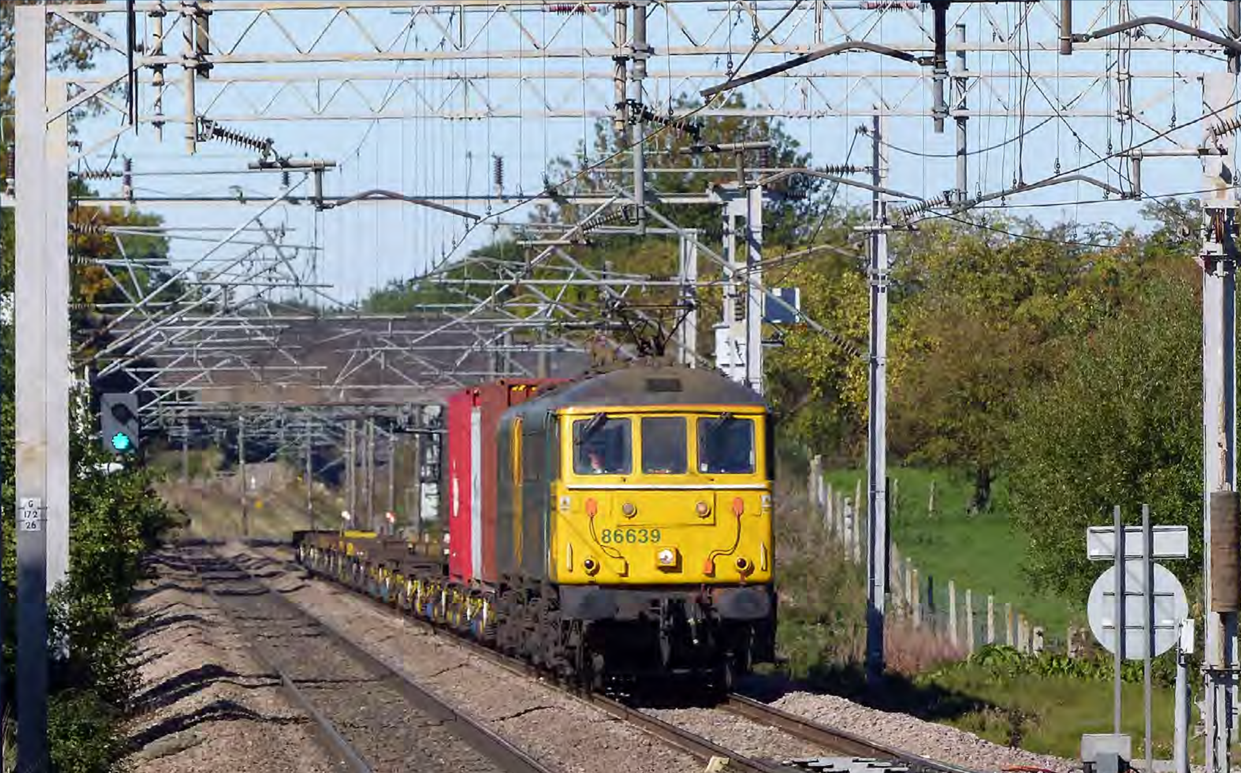
▶ Class 86 639 and 86 637 pass Acton Bridge on September 27th with a Runcorn - Crewe Basford Hall liner. Michael Lynam