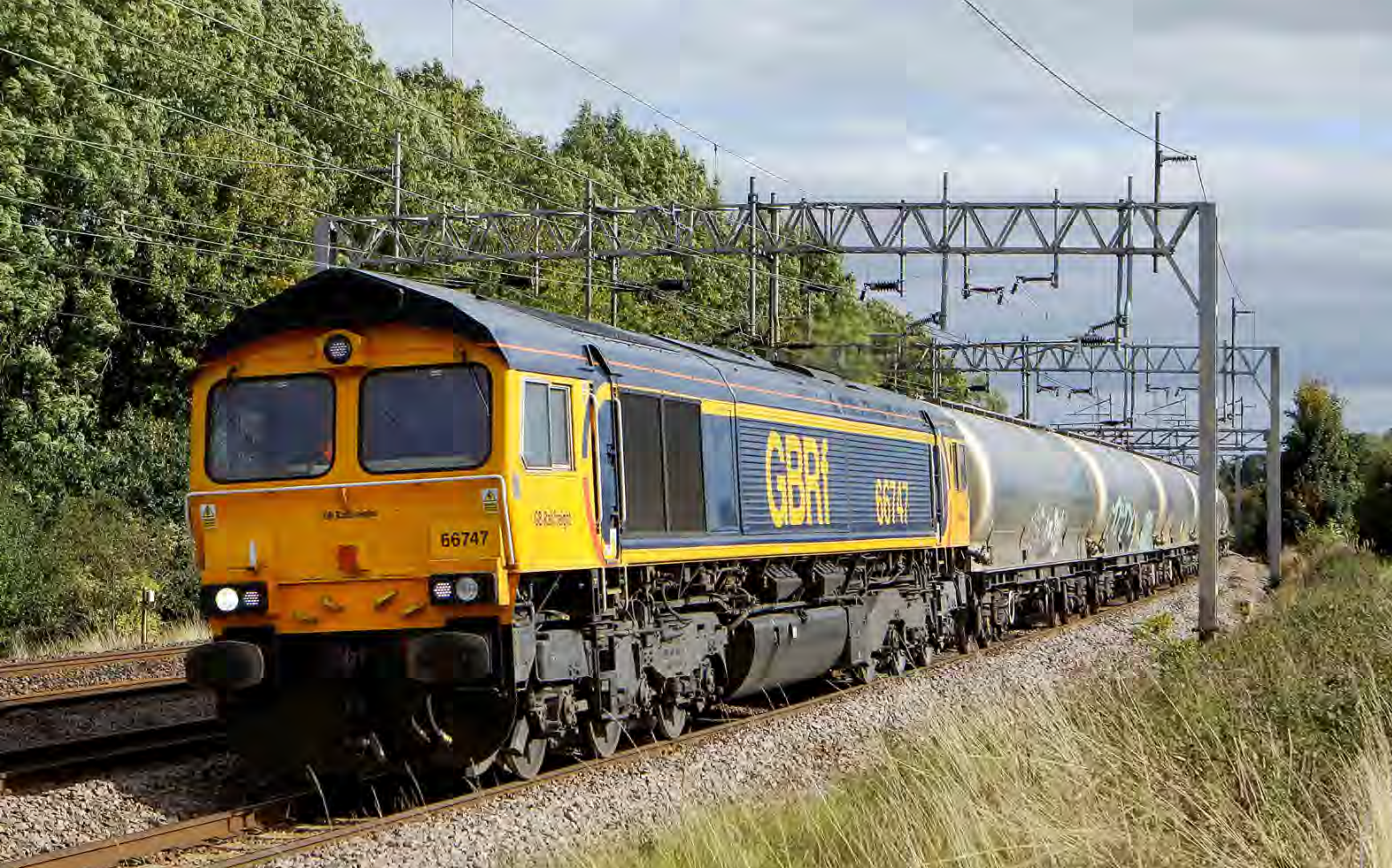
On September 13th, Class 66 747 with 6M35 12:05 Gloucester - Clitheroe Castle Cement passes Heamies. Nick Clemson