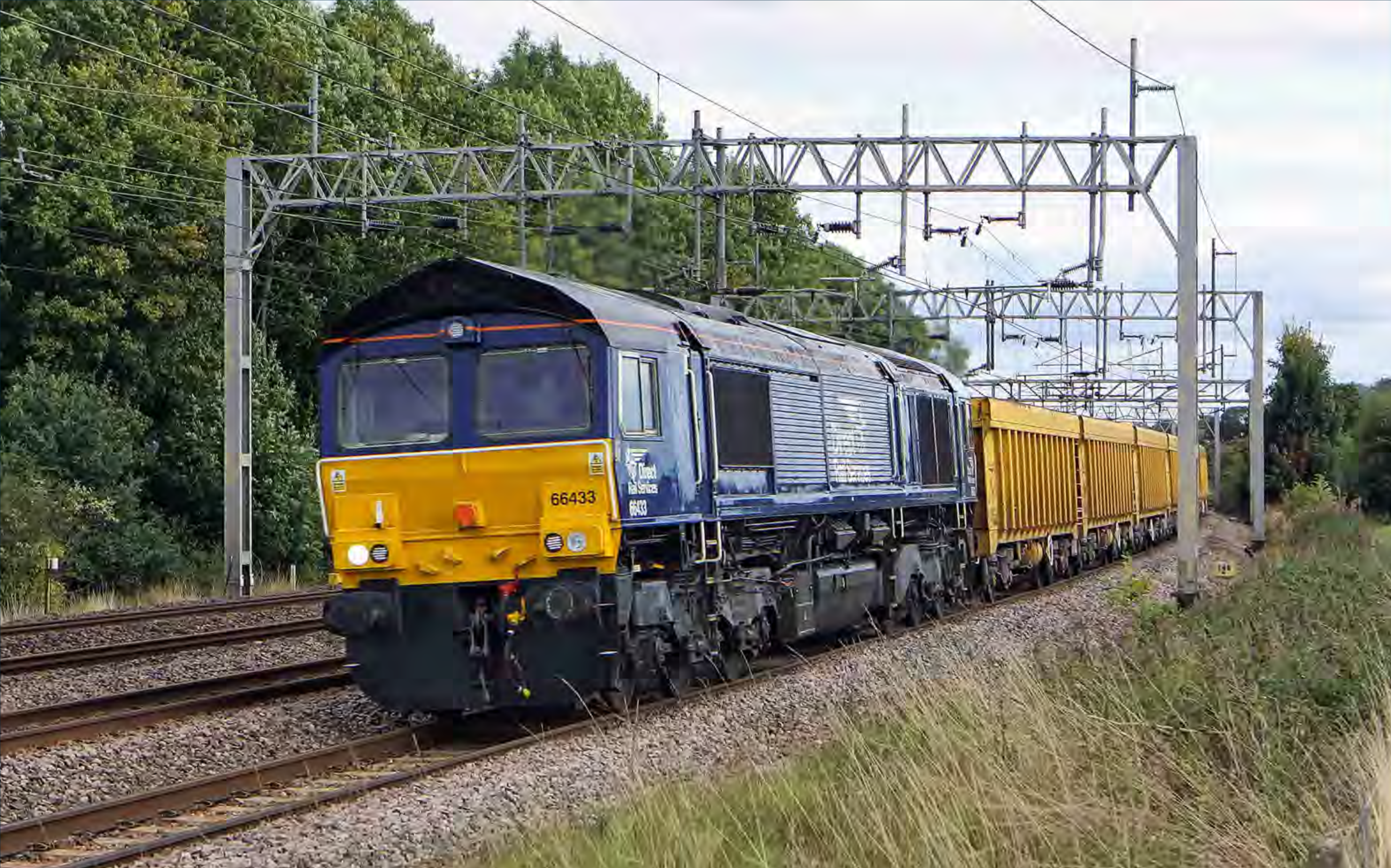
Class 66 433 heads the 6U77 13:58 Mountsorrel Sidings - Crewe Basford Hall past Heamies on September 13th. Nick Clemson