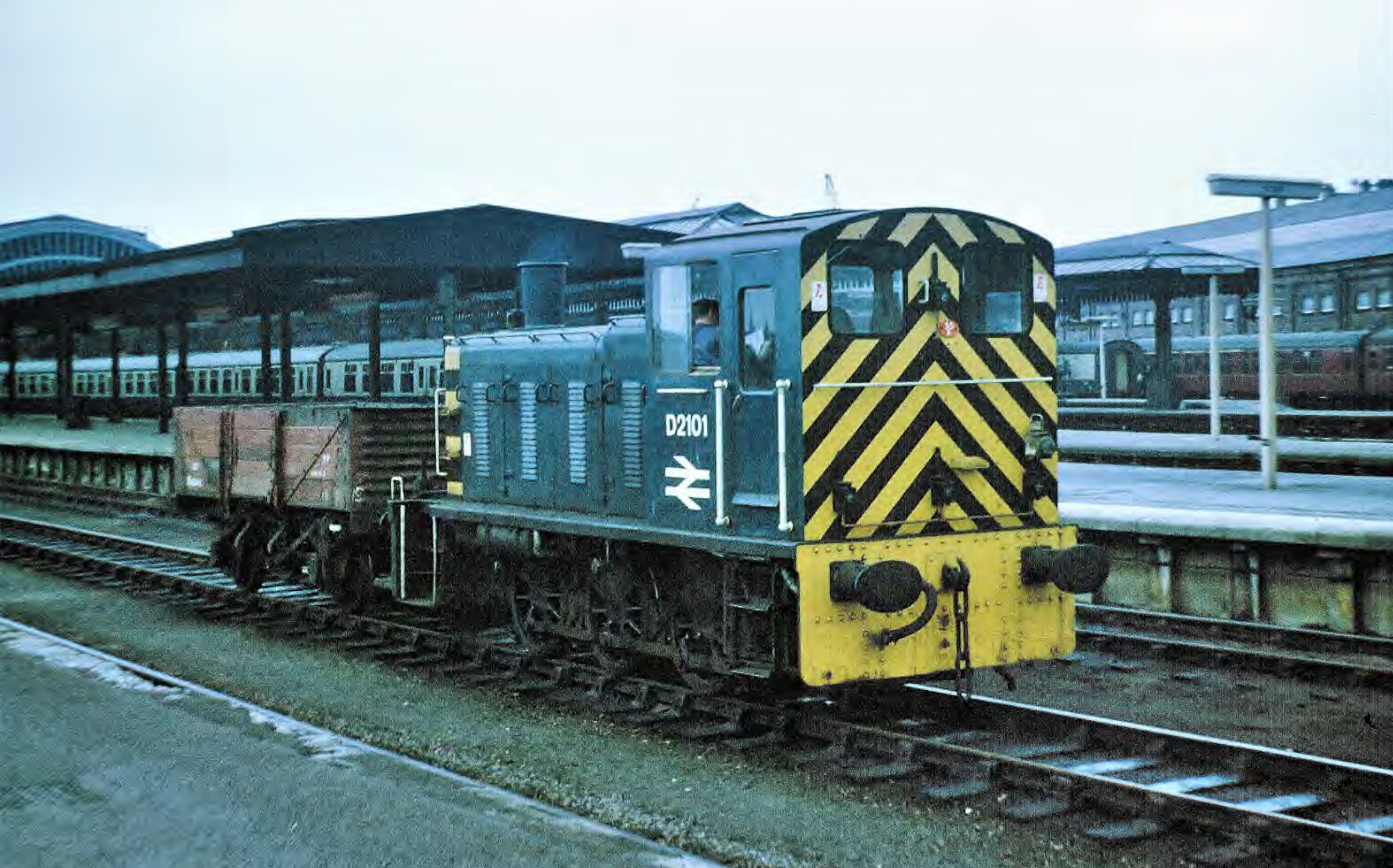
BR Class 03 No. D2101 with a match wagon acts as York station pilot on March 27th 1968.