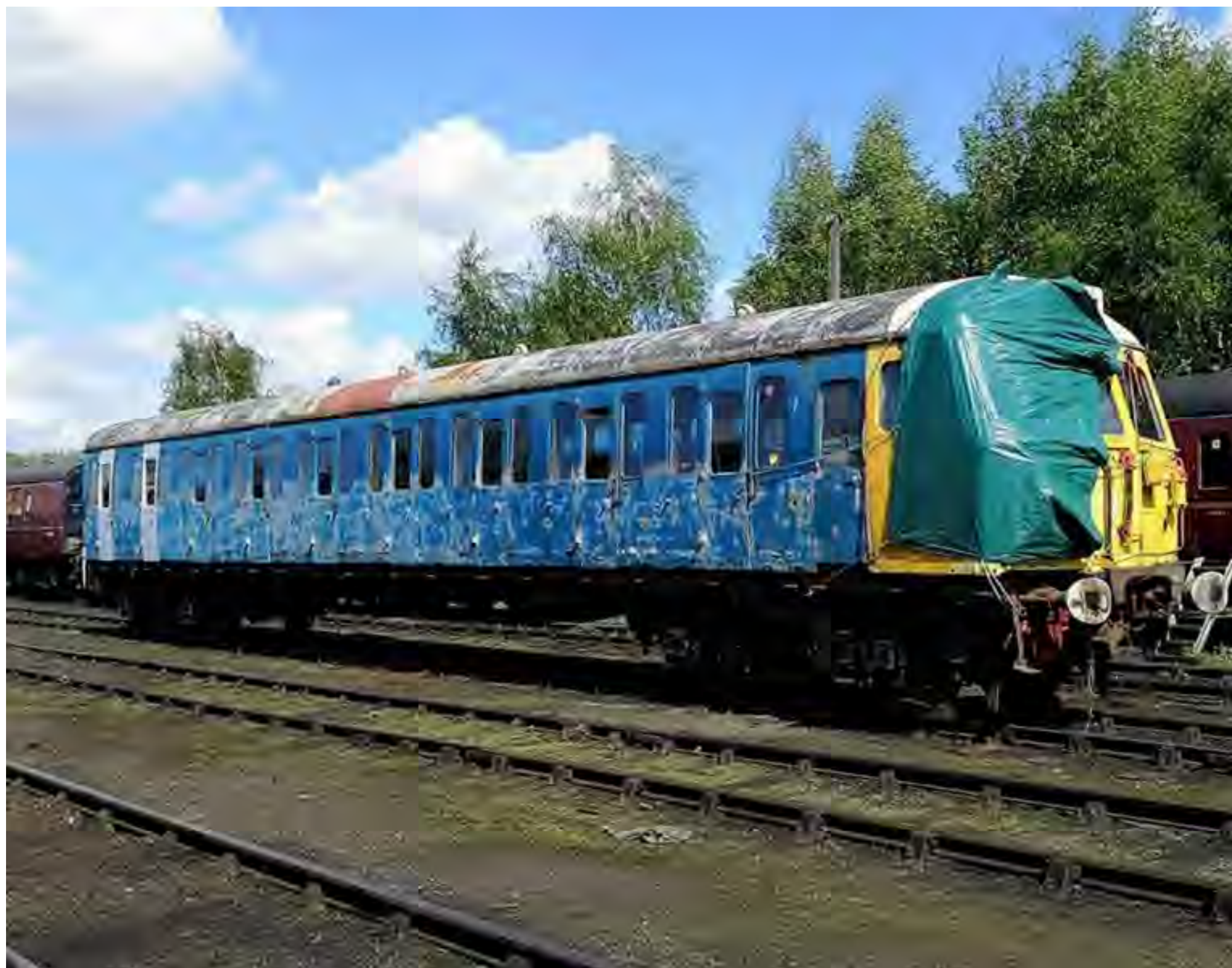
Photo Right: M77172 stands outside its former home depot of Bury TMD. Now the ELR Loco Works after 16 weeks of restoration work by volunteers of the Class 504 Preservation Society on 19th September 2018.

Photo Left: Class 504 DTC M77172 stabled in Baron Street Loco Yard, the units former home of Bury TMD EMU sidings before being shunted inside the former Bury EMU shed for restoration work to begin on 10th May 2018.