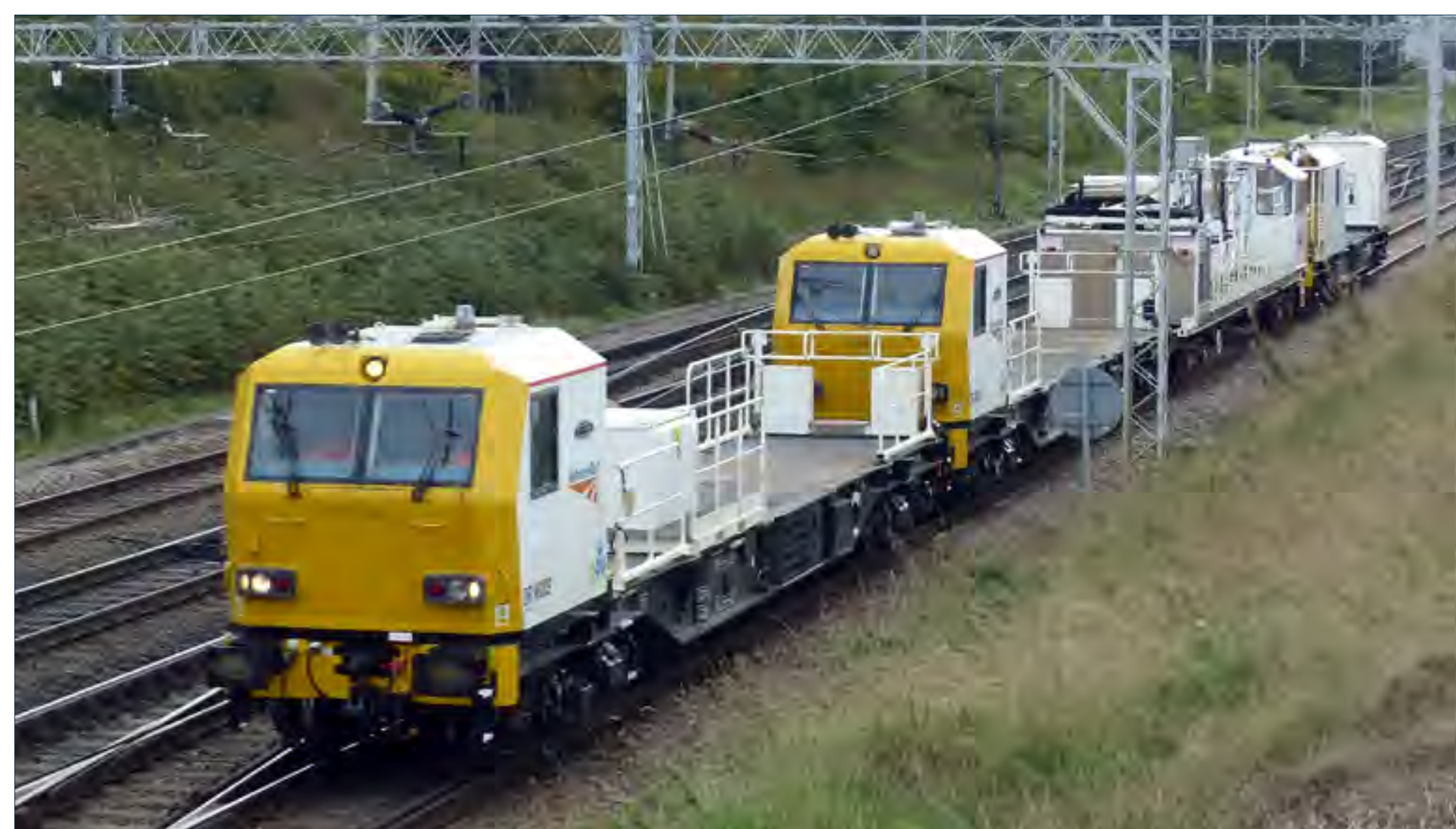
On September 22nd, track repair and maintenance machines Nos. DR 90809, 90812 and 90814 approach Basford Hall Yard working from Bescot - Crewe Electric Depot.