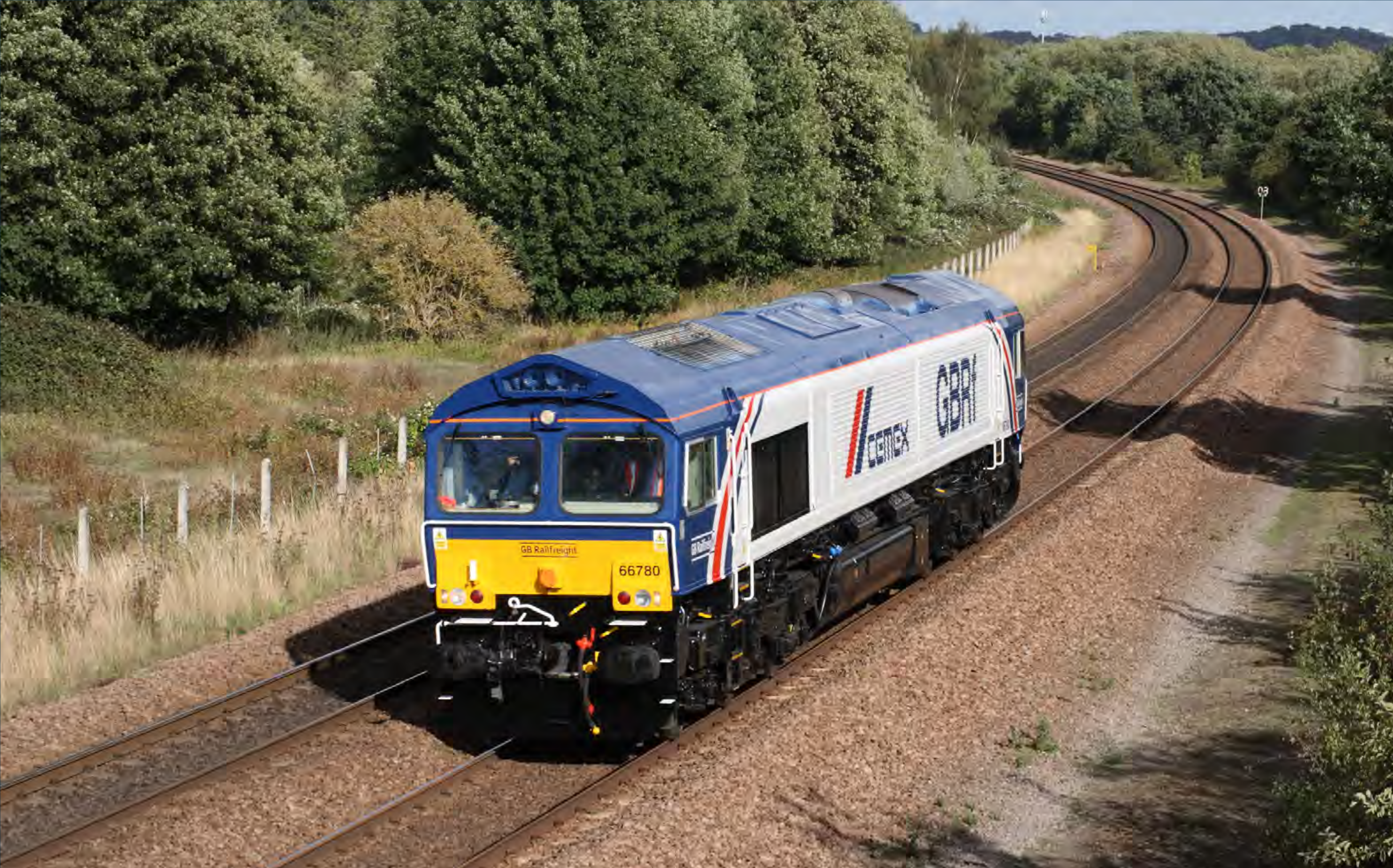
▶ Celebrity Class 66 780 passes Old Denaby on September 18th with a light engine move from Doncaster to Peak Forest. Steve Chapman