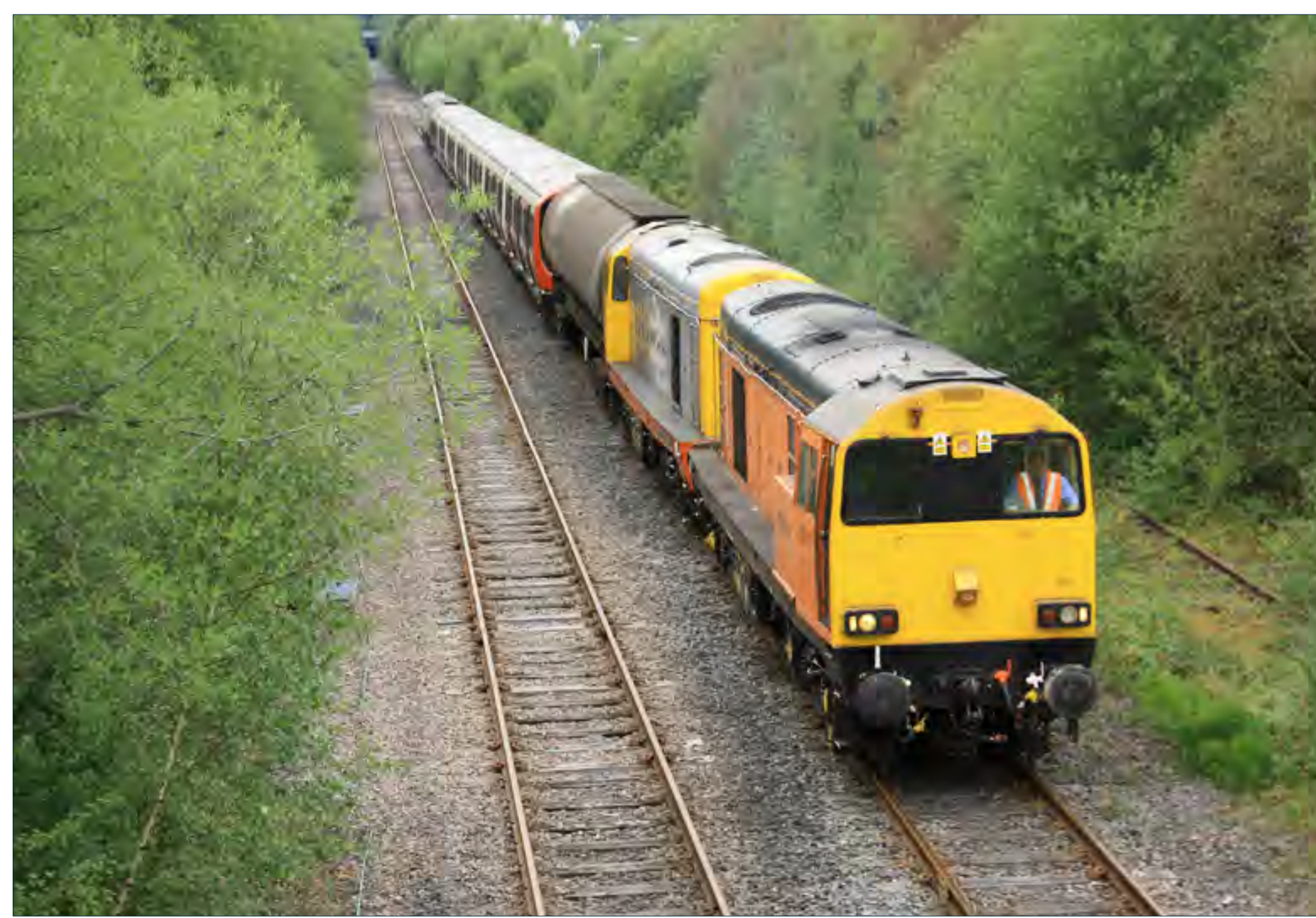
The 7X10 Banbury - Derby Litchurch Lane with Class 20 311 and 20 132 leading, barrier tanks, S7 LUL tube stock and 66 724 'Drax Power Station' on the rear, passes Moira on August 28th. Diverted along the Burton - Leicester freight line due to Derby remodelling. Stuart Hillis