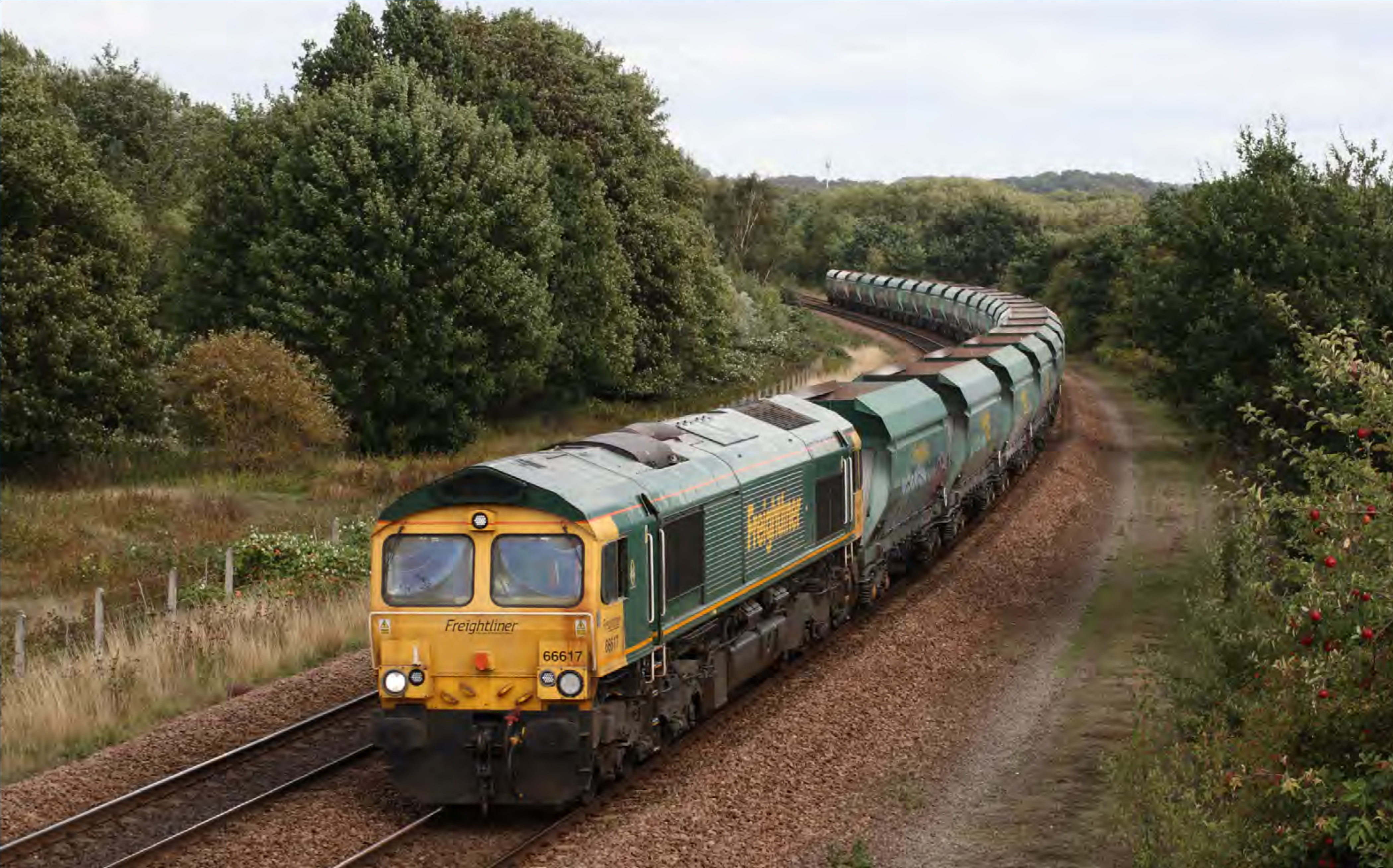
Class 66 617 is seen at Old Denaby on September 18th with 6M56 Drax to Tunstead limestone empties. Steve Chapman