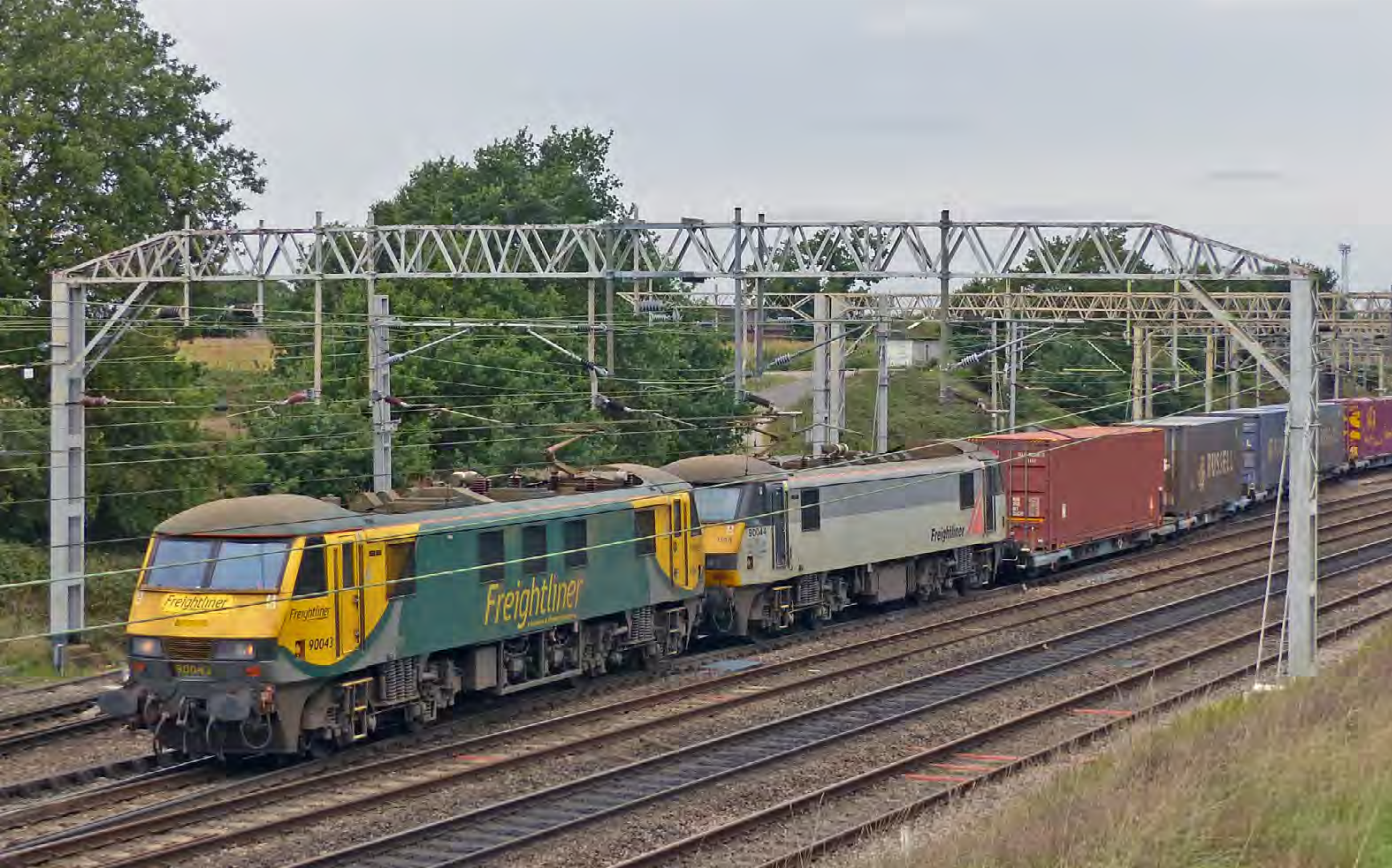
▶ Class 90 043 and 90 044 depart Crewe Basford Hall yard on September 22nd with a Coatbridge - Daventry liner. Michael Lynam