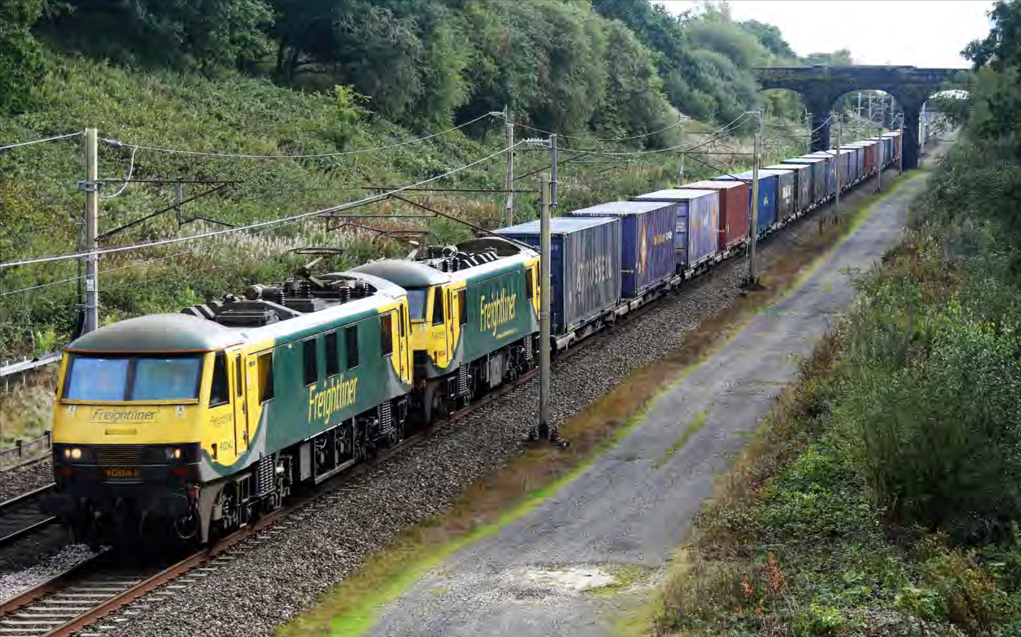
On September 13th, Class 90 042 and 90043 pass Charnock Richard hauling the 4S44 Mossend - Daventry liner.