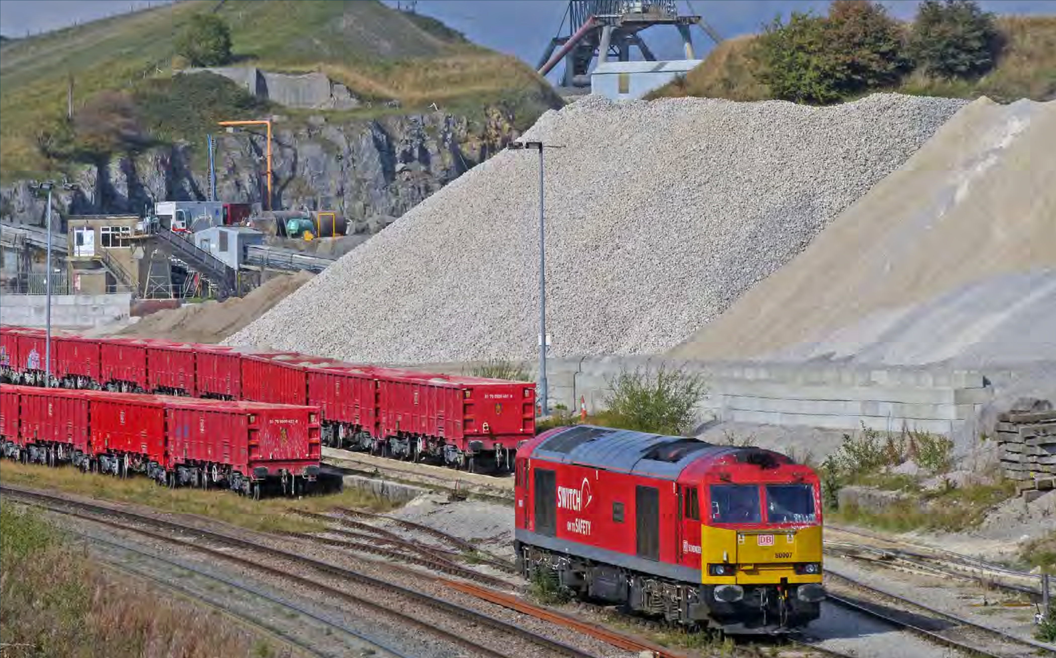
▶ Class 60 007 'The Spirit of Tom Kendell' is pictured stabled at Peak Forest on September 29th. Michael Lynam