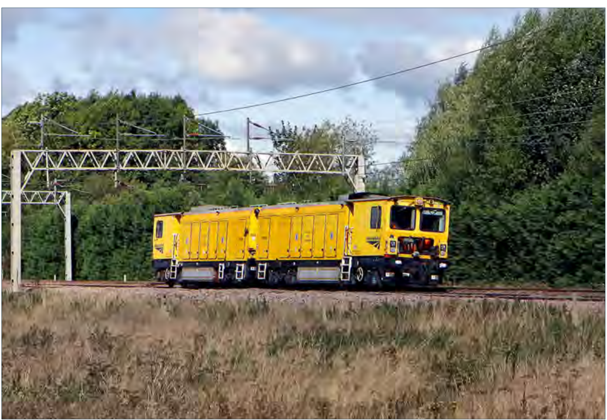
Network Rail Harsco Rail Grinders Nos. DR79262 and DR79272 form the 10:05 Guide Bridge Brookside Sidings - Cosford Tamper Siding passing Heamies on September 13th. Nick Clemson