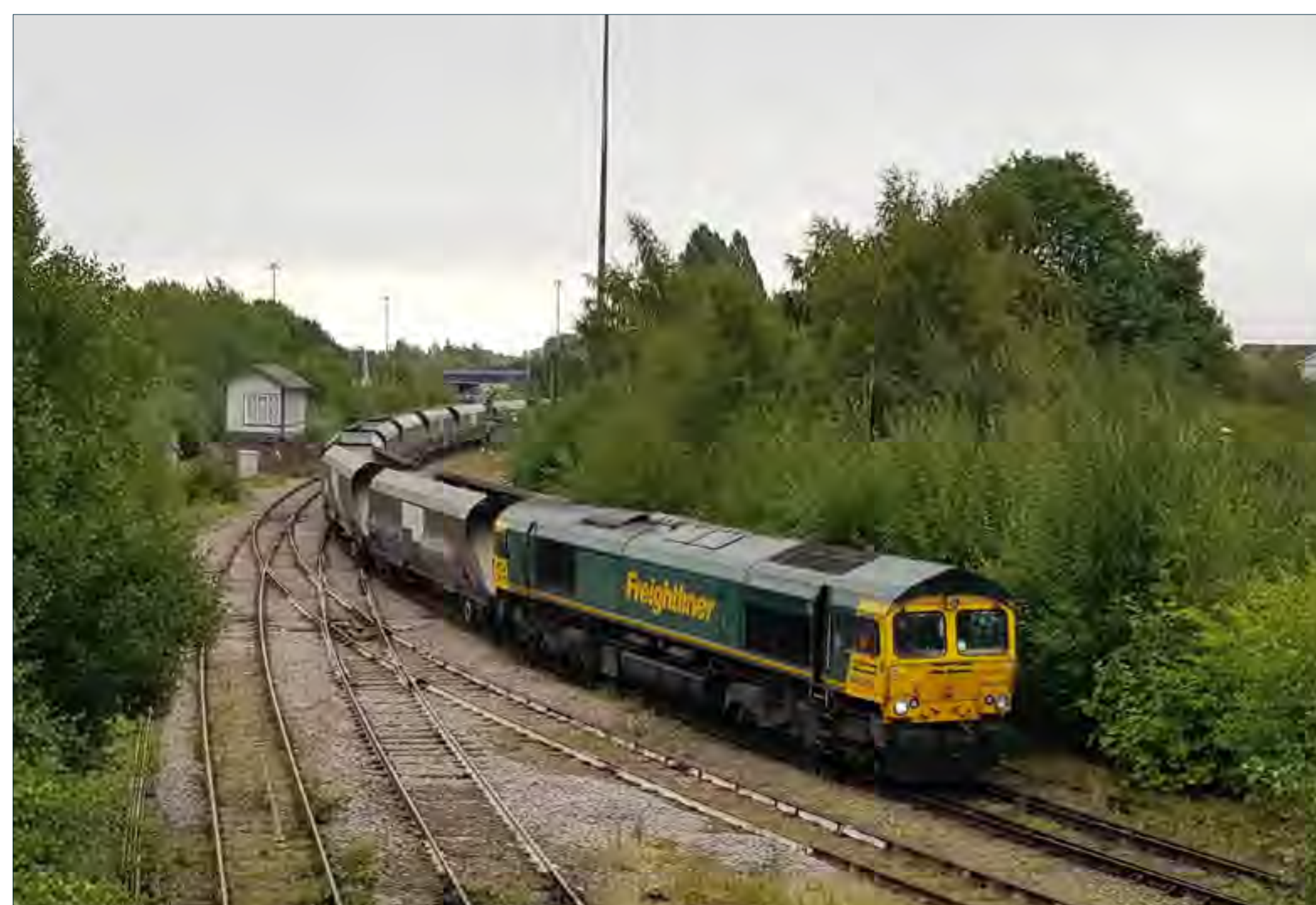
Class 66 546 passes Wistanstow with 4V22 09:30 Fiddlers Ferry power station - East Usk yard on September 27th. Keith Davies