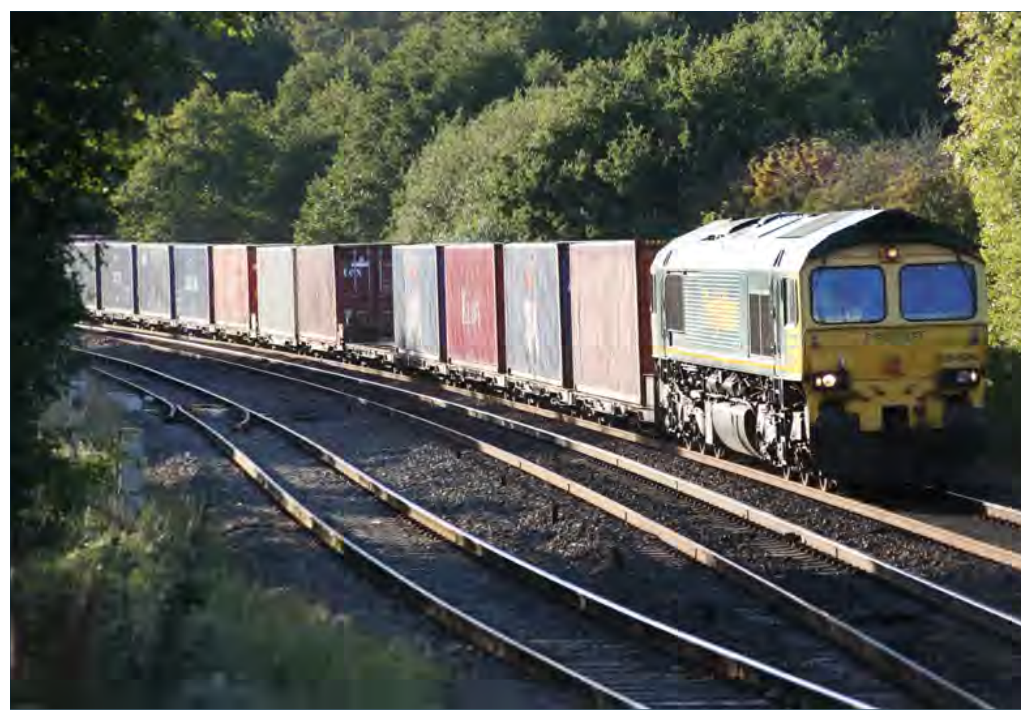
▶ Class 66 536 descends Hatton Bank on September 28th with 4095 Leeds to Southampton liner. Stuart Chapman