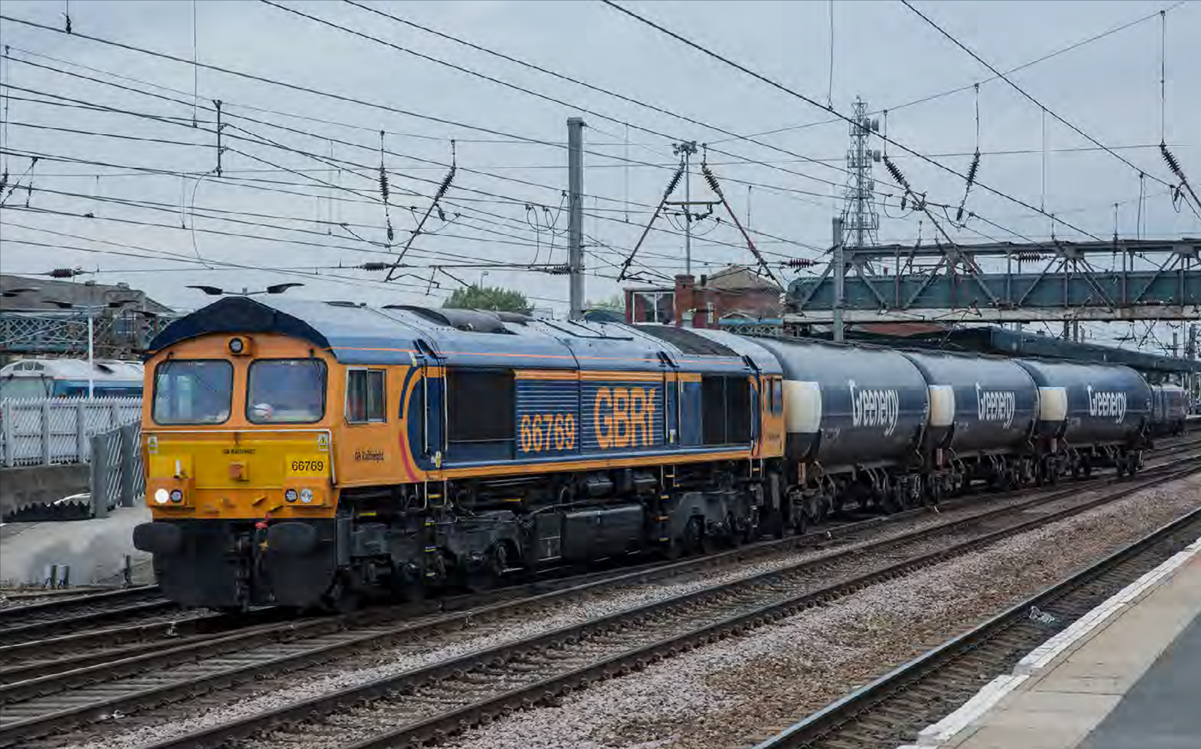
▶ On September 15th, Class 66 769 passes through Doncaster hauling three 'Greenery' tanks.