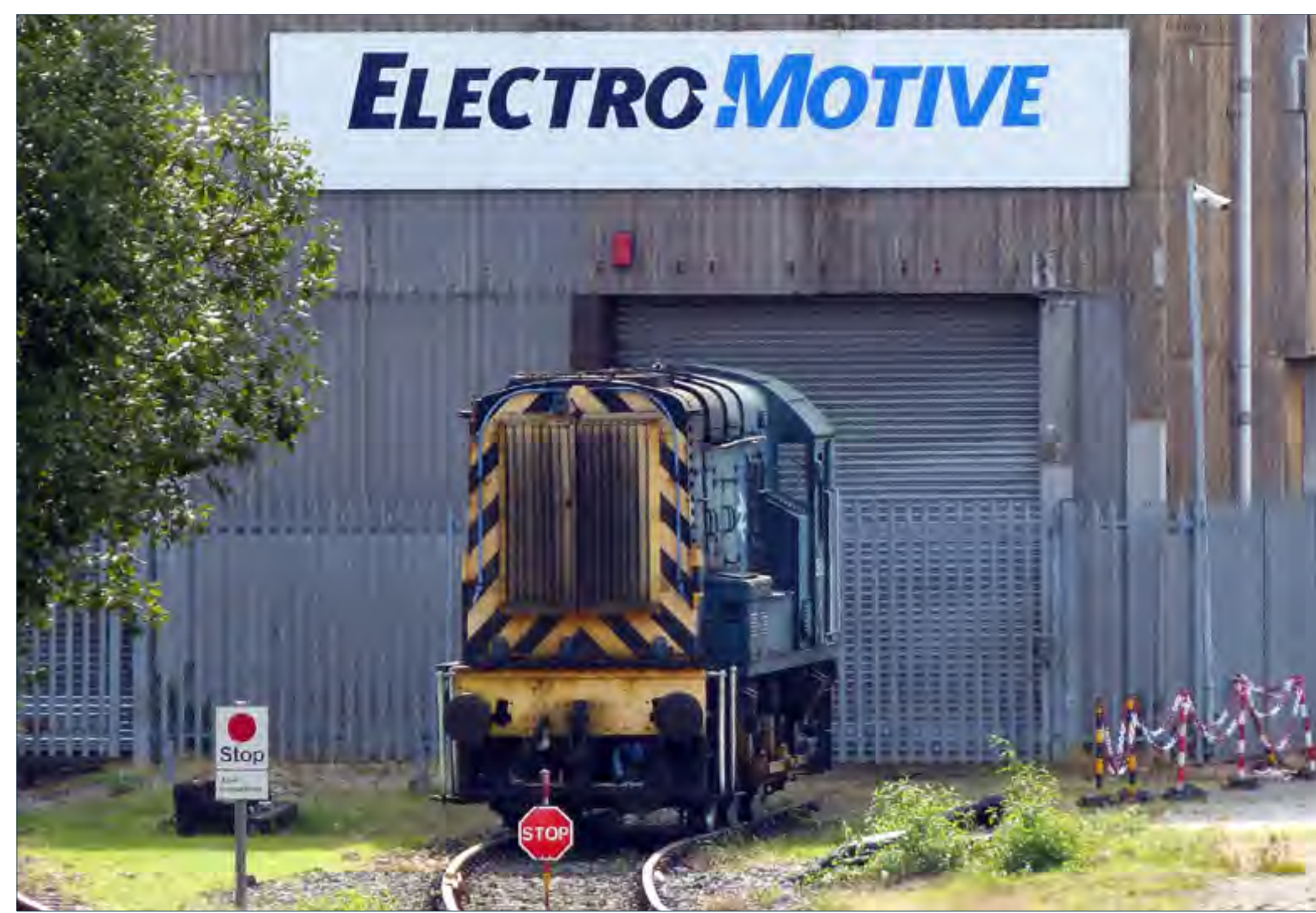
▶ Longport's ElectroMotive resident shunter Class 08 220 is seen outside the main building. Michael Lynam