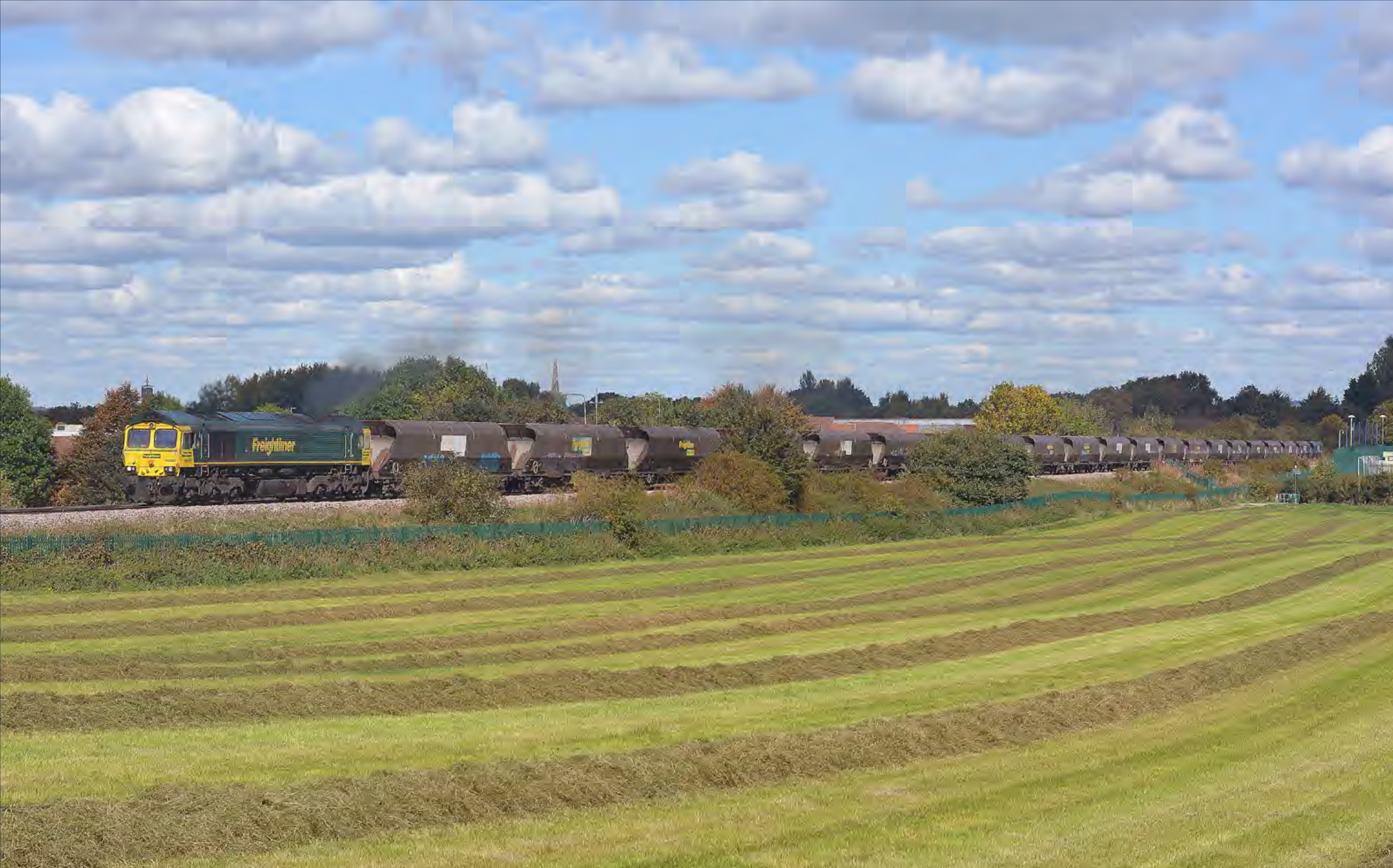
▶ A smoky Class 66 597 powers away from Meole Brace with the 4V20 06:30 Fiddlers Ferry power station - East Usk yard on September 28th. Keith Davies