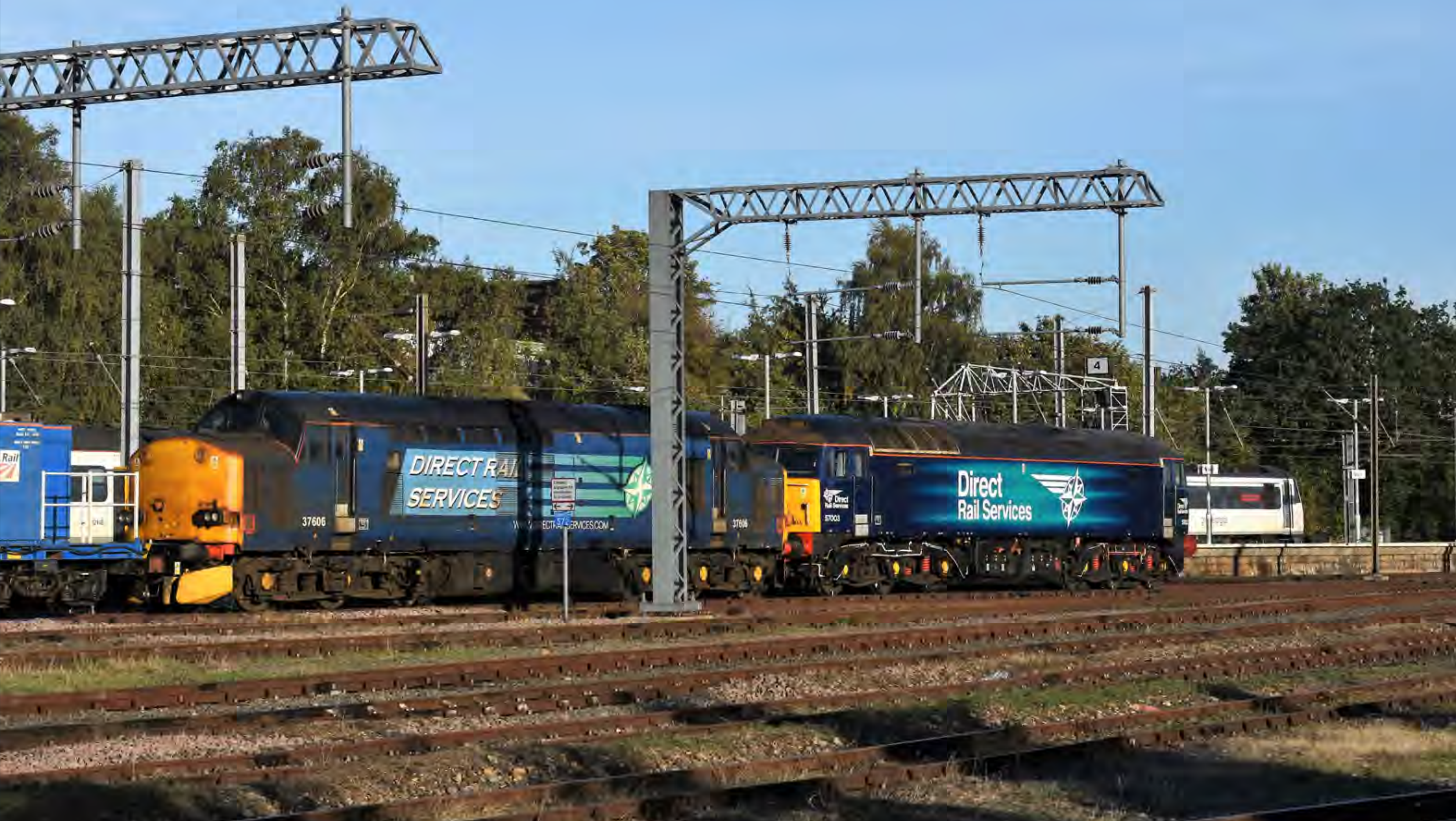
▶ Class 57 003 and 37 606 are seen at the head of a RHTT set at Norwich on September 29th. John Sloane