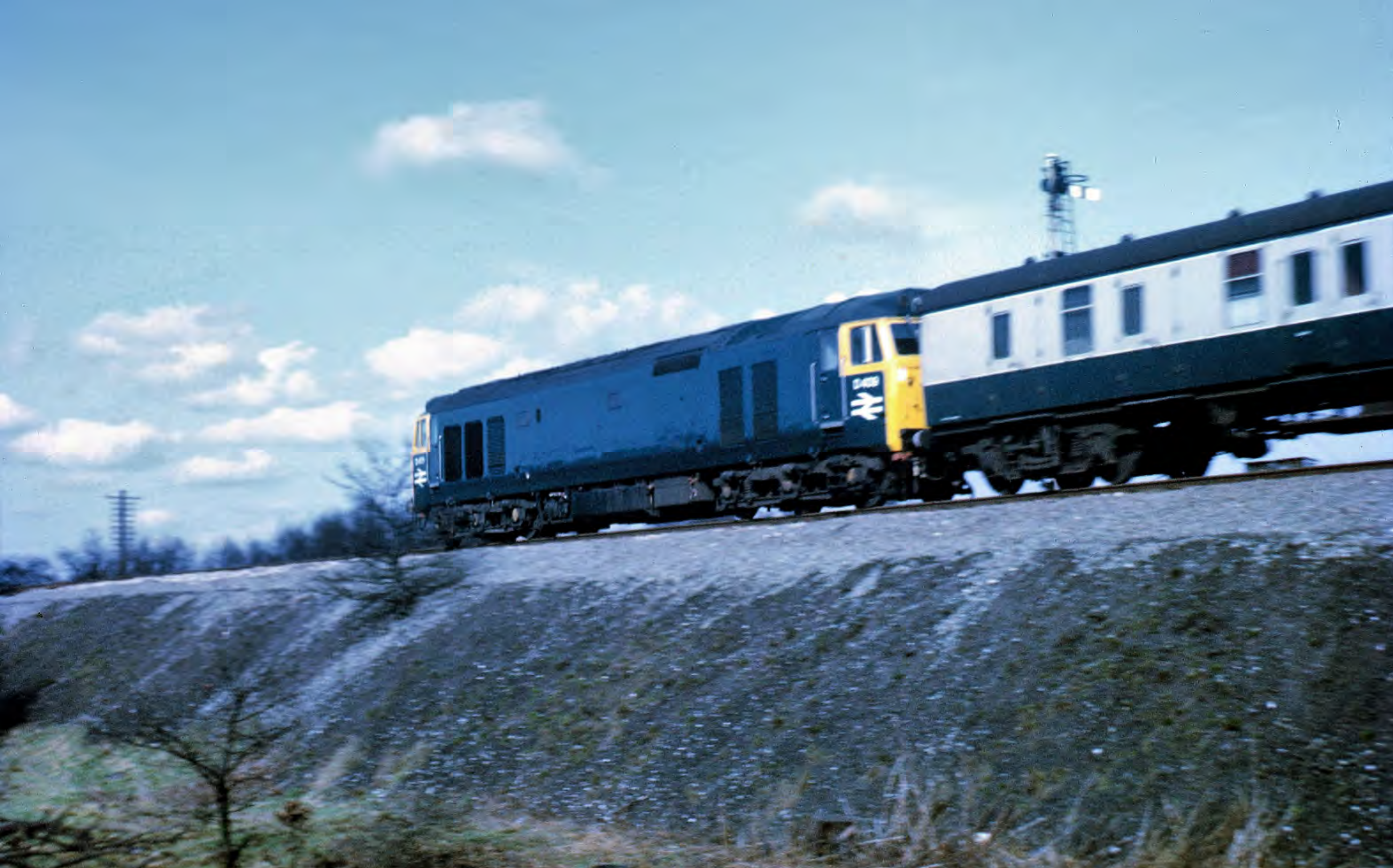
Class 50 No. D409 thunders north past Standish Jct on March 30th 1968.