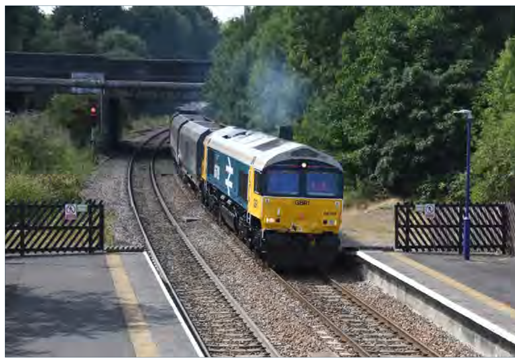
▶ Class 66 787 (the former DB 66 184) with 4M11 Washwood Heath - Peak Forest empty hopper wagons heads through Burton on September 10th. Stuart Hillis