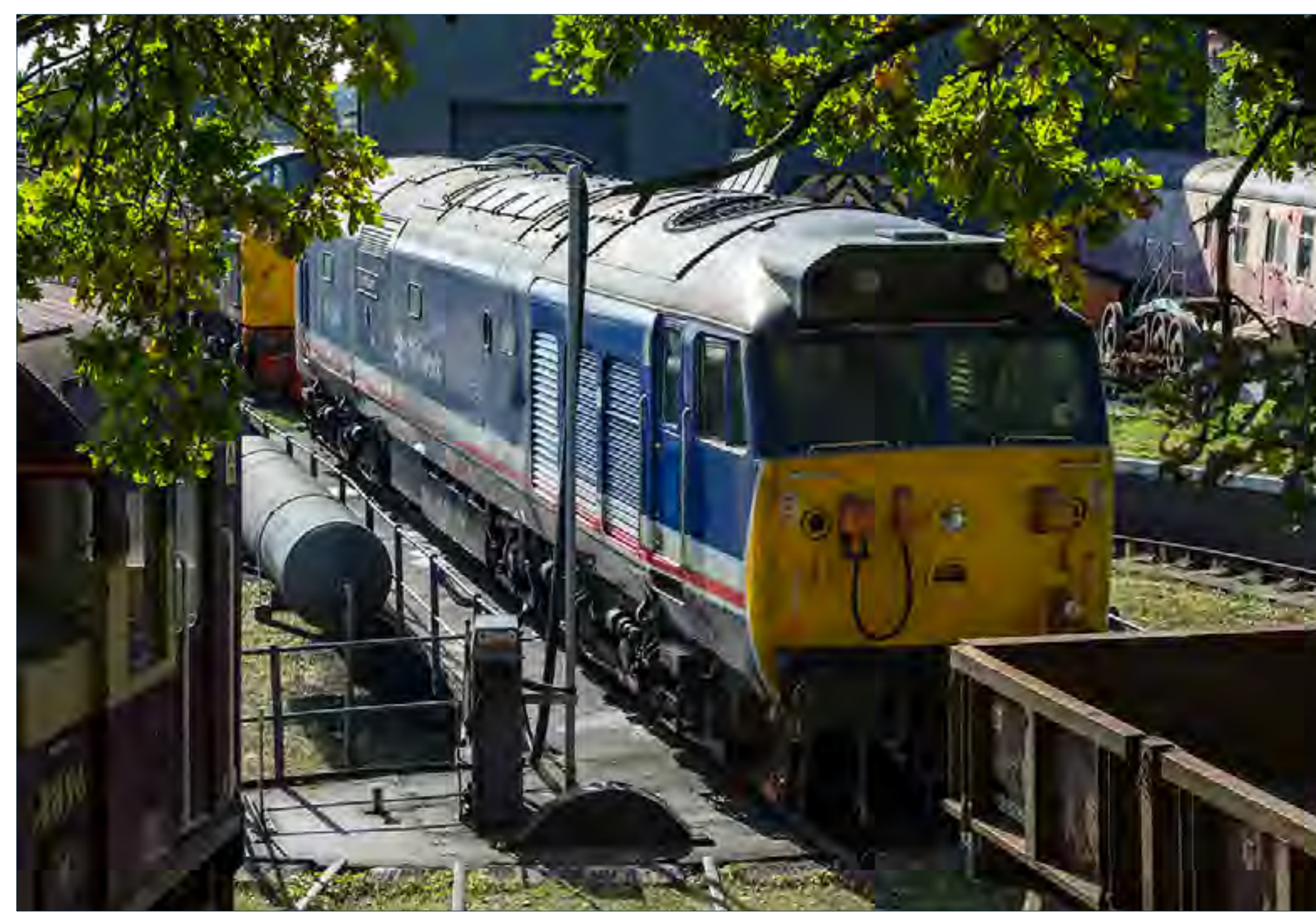
▶ Class 50 026 is seen through the trees on the depot at Kidderminster on September 29th. Richard Hargreaves