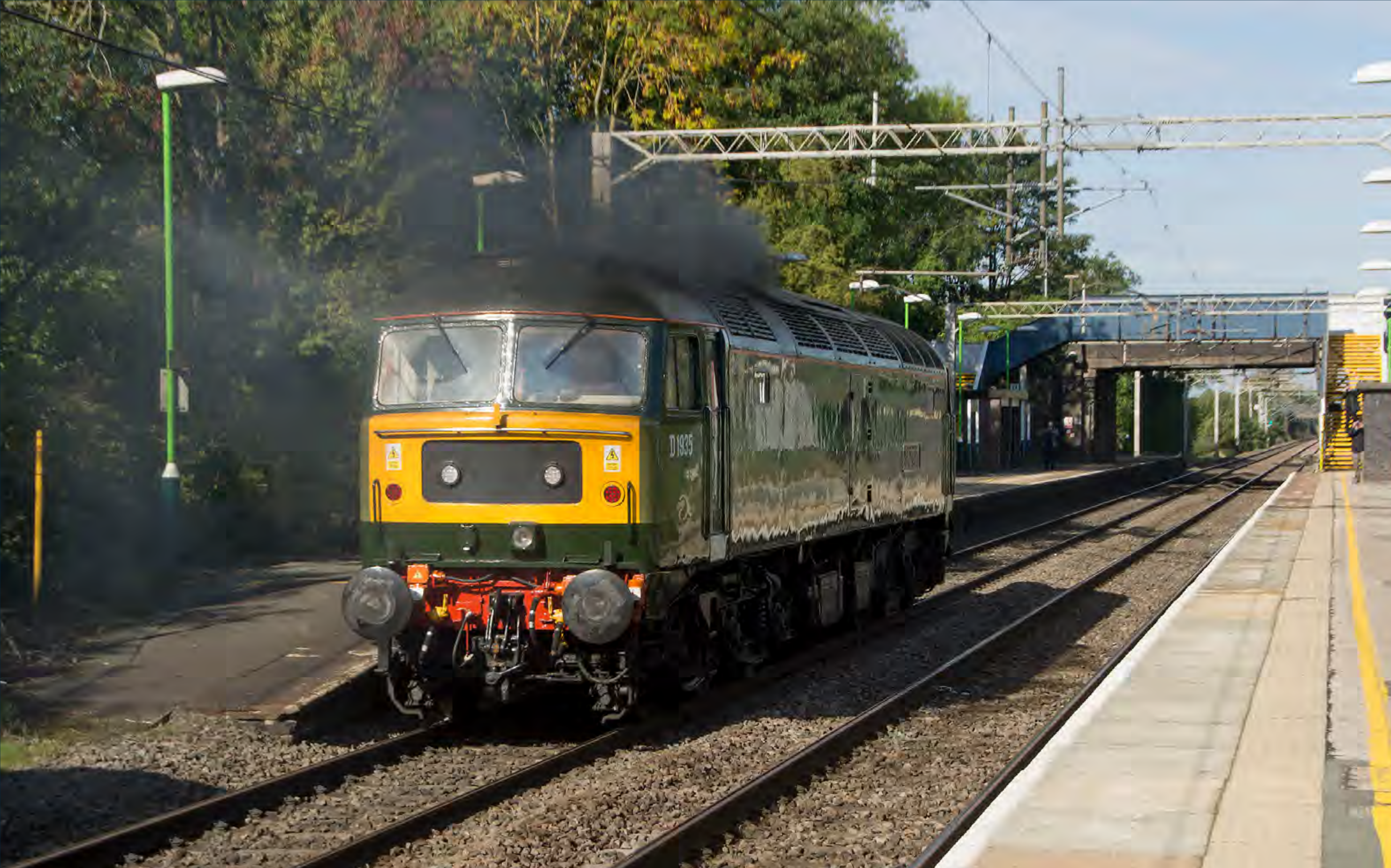
▶ LSL's Class 47 805 speeds north through Acton Bridge on September 25th. Brian Battersby