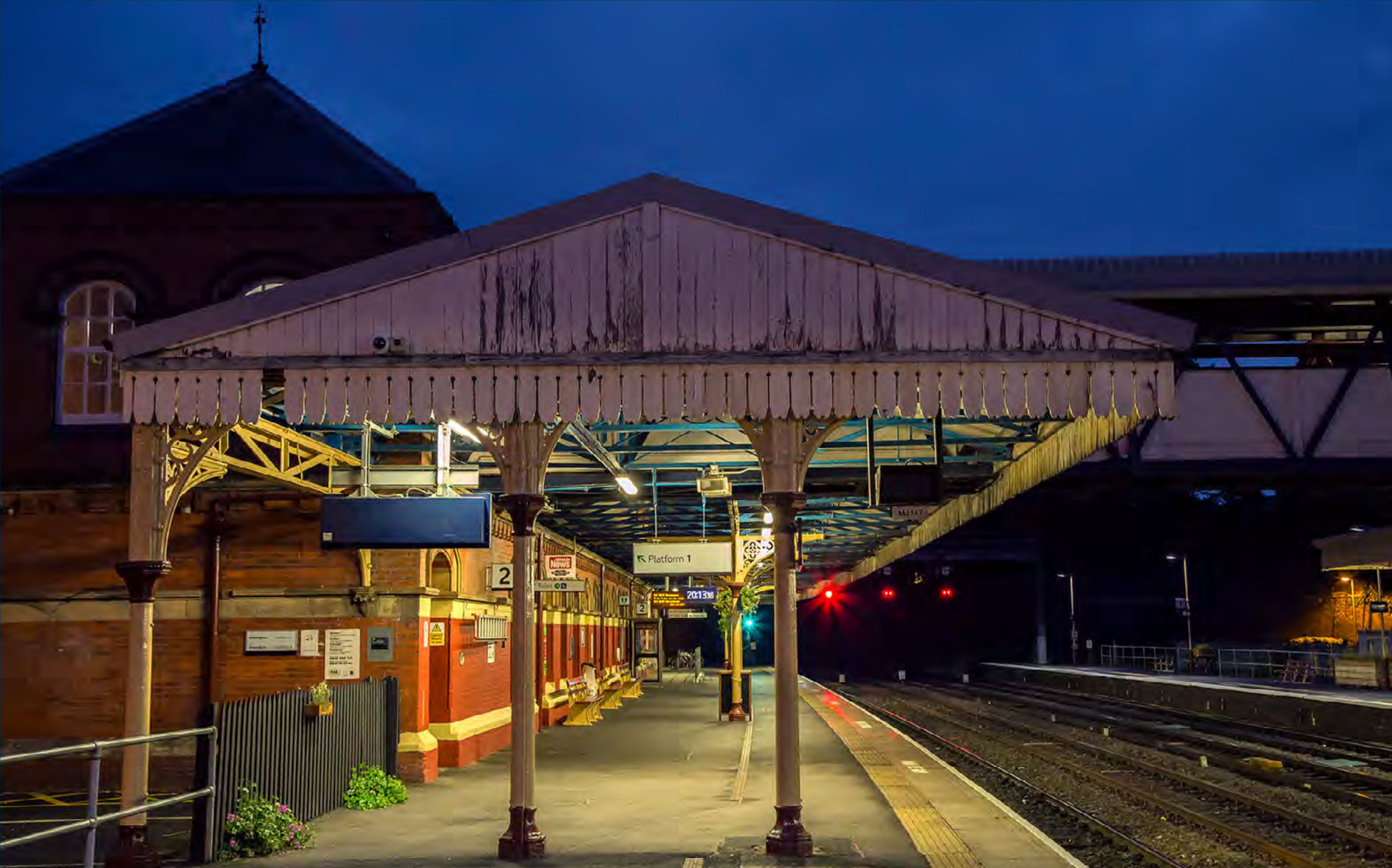
▶ A late evening view of Wellington station on September. Richard Hargreaves