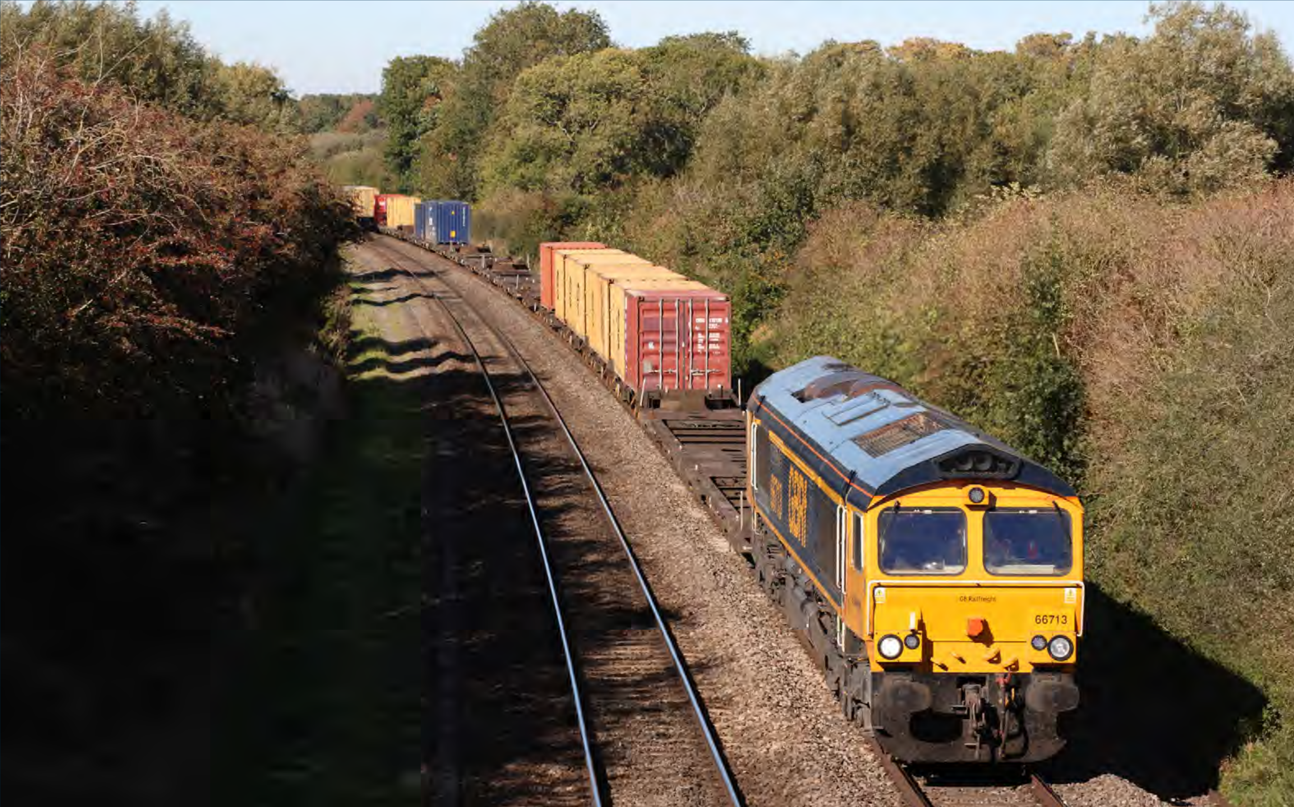
▶ Class 66 713 passes Wharf Farm south of Aynho Junction on September 27th with 4069 Hams Hall to Southampton intermodal. Steve Chapman